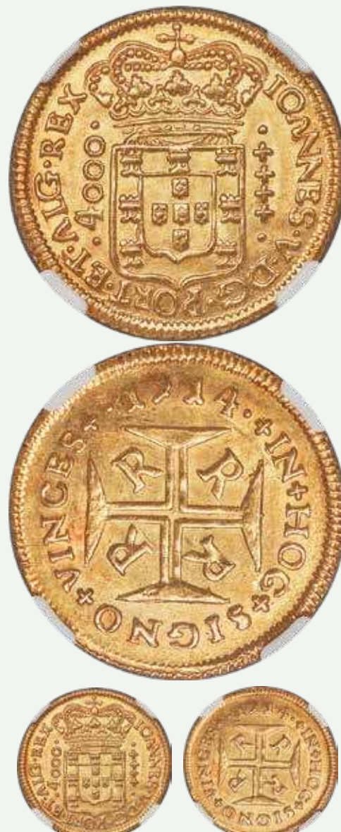
31053 João V gold 4000 Reis 1714-R MS64 NGC, Rio de Janeiro mint, KM102, LMB-166. Sitting at the peak of quality for type, this offering currently holds the highest certification by NGC or PCGS. Certainly worthy of its near gem grade, the surfaces exhibit numerous delicate die-polish lines adding a slight matte texture to their otherwise lustrous sheen, the devices far more bold than is usually encountered; the planchet is primarily a buttercup-yellow in color, hints of sunset-orange tone forming at the peripheries. Starting Bid: $2,500