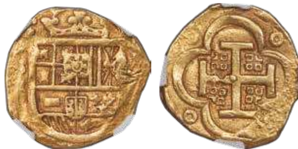
32799 Philip IV gold Cob 4 Escudos ND (1630-1647) S-R XF Details (Obverse Scratched) NGC , Seville mint, KM56.2, Fr-203, Cal-Type 26. 13.15gm. The faint outlines of an "S" and "R" are visible to the left of the obverse shield, with the reverse design serving as further indication of the specimen's production at Seville. A few shallow marks are noted to the rightmost central area of the shield.