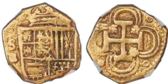
32798 Philip III gold Cob 2 Escudos ND (1598-1621) S-B VF Details (Edge Filing) NGC , Seville mint, Fr-189, Cal-Type 19. 6.72gm. A circulated representative of this popular series showing some edge filing, though with a clear mintmark and good centering on the reverse.