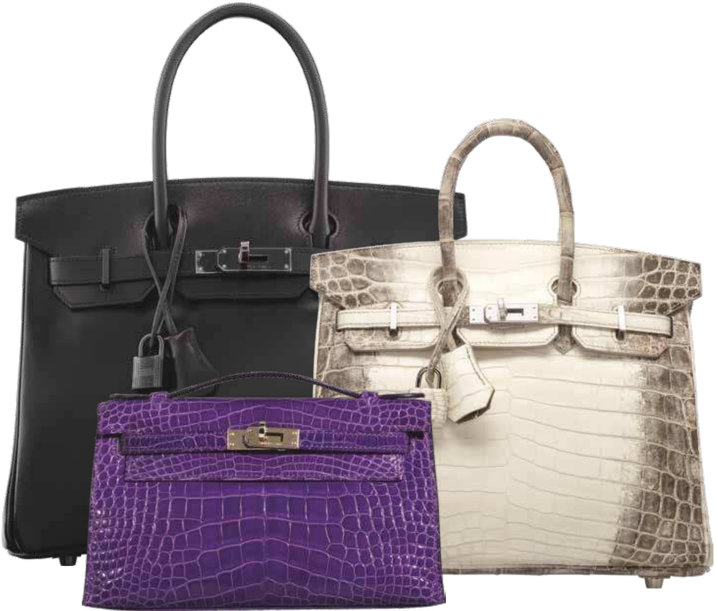
Hermès Limited Edition 30cm So Black Calf Box Leather Birkin Bag with PVD Hardware Price Upon Request