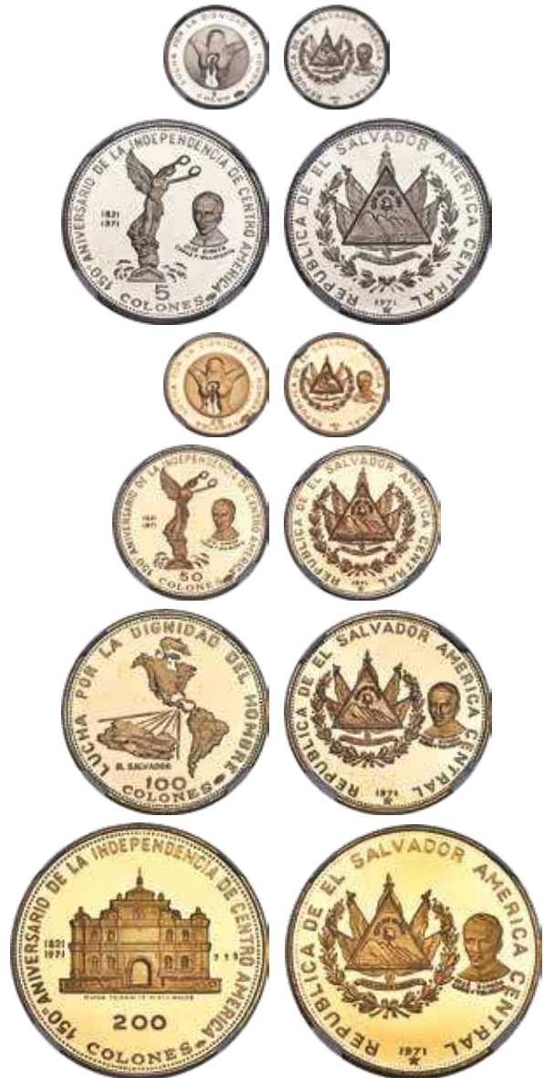
30267 Republic 6-Piece Certified gold & silver “Independence Anniversary” Proof Set 1971 Ultra Cameo NGC, 1) Colon - PR67, KM141 2) 5 Colones - PR65, KM142 3) gold 25 Colones - PR68, KM143 4) gold 50 Colones - PR68, KM144 5) gold 100 Colones - PR67, KM145 6) gold 200 Colones - PR67, KM146

KM-PS4. Commemorating the Sesquicentennial of Independence. The 200 Colones is numbered “715”. AGW 1.2801 oz. (Total: 6 coins) Starting Bid: $850