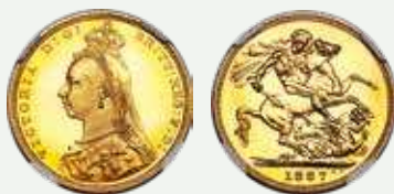
31096 Victoria gold Proof Sovereign 1887 PR64 Cameo NGC, KM767, S-3866B. Especially notable for its portrait of Victoria which retains full unbroken frost, the fields of this choice offering exhibit a scattering of minor marks preventing it from reaching a higher certified grade; it nonetheless boasts far above average preservation for type and an attractive aged-gold color. Starting Bid: $2,000