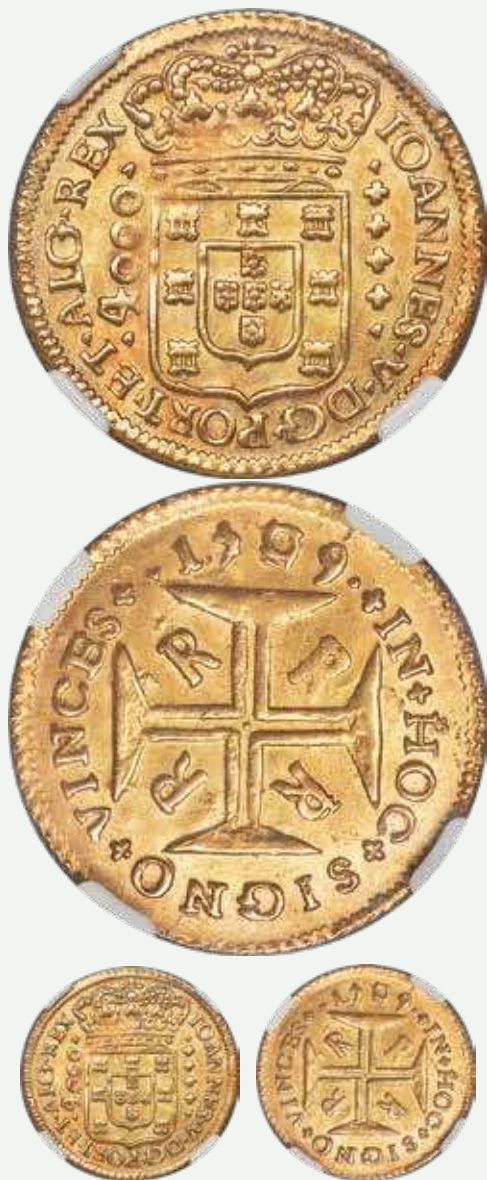
31052 João V gold 4000 Reis 1709-R MS64 NGC, Rio de Janeiro mint, KM102, LMB-176. By far the finer of just two certified examples within NGC's database, none seen by PCGS. The obverse has been marvelously struck with only one small area of weakness where an adjustment mark created a groove; the remainder is absolutely needle-sharp with abundant mint luster. The reverse is somewhat softer with evidence of double striking but nonetheless remains strong for issue. An unbeatable Brazilian near-gem. Starting Bid: $2,500