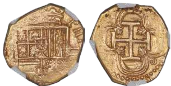
32796 Philip III gold Cob 2 Escudos ND (1598-1621) AU55 NGC , Seville mint, KM7. 6.63gm. Struck without the majority of the legends and other non-central detailing, yet admirably lustrous and offering near-Mint appeal. Though the mintmark is not visible, the reverse features point to production at the mint in Seville.