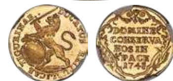
30640 Zurich. Canton gold Ducat 1745 MS66 NGC, KM140, Fr-486a, HMZ-2-1161cc. A deluxe gem offering a simultaneous display of near-pristine fields, lightly speckled by just a hint of die rust, and razor sharp devices contrasting slightly against the surfaces surrounding. Nearly unimprovable, and essentially irreproachable for a coin of its age and type. From the Caranett Collection Starting Bid: $1,500