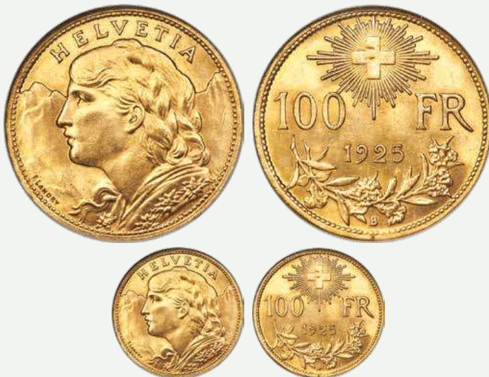
31137 Confederation gold 100 Francs 1925-B MS64 NGC , Bern mint, KM39, HMZ-2-1193a. An avidly collected type, popular for its large size; however, this heft often leads to it bearing numerous marks and hairlines. The present offering is as such highly unusual for its sleek and unmarred surfaces, lightly reflective with a rose tinge to the planchet. Highly sought after in high grades, the last Swiss 100 Francs we offered in this near-gem preservation realized $20,400 at our January 2020 sale. Starting Bid: $5,000