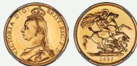
31097 Victoria gold Proof 2 Pounds 1887 PR66 Cameo NGC, KM768, S-3865. An extraordinary piece, the sole example in this grade at NGC and the finest with a Cameo designation by two full grades. Lovely sun-yellow fields are virtually flawless and beautifully mirrored, the portrait nearly fully frosted. Certain to attract much attention from collectors of this highly popular Jubilee type. Starting Bid: $3,000