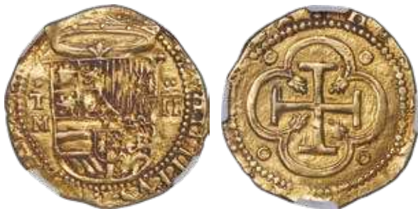
32794 Philip II gold Cob 2 Escudos ND (1556-1598) T-M AU53 NGC , Toledo mint, Fr-170, Cal-88. 6.67gm. Exceptionally well struck, a pleasing and wholesome example of the type.