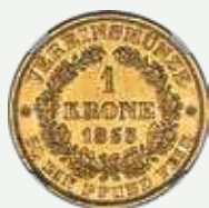
31048 Franz Joseph I gold Krone 1863-A MS61 NGC, Vienna mint, KM2253, J-315. True Mint State yet with decidedly prooflike elements, the fields of this rare offering dazzle the viewer with glossy reflectivity, the planchet a light dandelion-yellow with minimal tone. Almost never encountered at auction and highly desirable thus. Starting Bid: $3,000