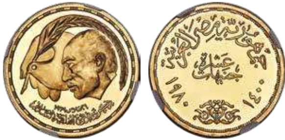
30266 Arab Republic gold Proof “Egyptian-Israeli Peace Treaty” 10 Pounds AH 1400 (1980) PR64 Ultra Cameo NGC, KM519. Mintage: 950. A scarcer commemorative type with a mintage numbering fewer than 1,000 examples. AGW 1.1252 oz. Reserve: $2,200