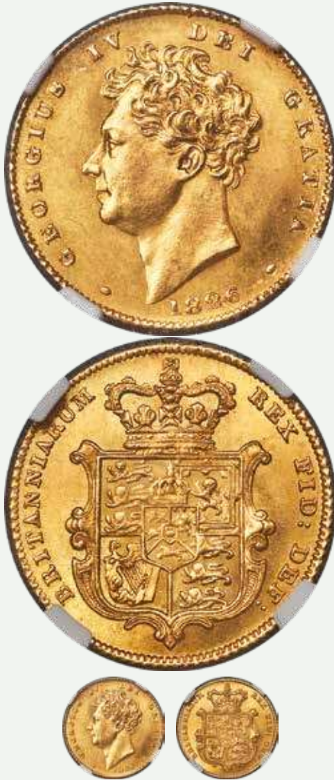
31084 George IV gold 1/2 Sovereign 1826 MS66 NGC, KM700, S-3804. A stunning example of this type, tied with one other specimen for the finest graded by NGC or PCGS. Fully deserving of its premium gem grade, the fields of this delightful offering simply glow with cartwheel luster, not a mark nor a scratch interrupting the sheen, the devices as perfectly crisp as they were when first struck. The planchet carries a pale tiger's eye color without a hint of tone, appearing as if just issued by the mint. An almost unbeatable offering in terms of technical quality. Starting Bid: $2,000