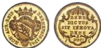
30637 Bern. City gold Ducat 1741 MS66 PCGS, KM103, Fr-172, HMZ-2-215d. An impressive piece in staggering quality given its age, its molten gold surfaces superbly struck and watery in texture. The finest specimen we have yet had the privilege of handling. From the Caranett Collection Starting Bid: $1,500