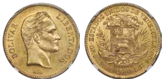
30664 Republic gold 100 Bolivares 1889 AU Details (Reverse Rim Damage) NGC , Caracas mint, KM-Y34, Fr-2. A small bump in the 6 o'clock area of the reverse accounts for the grade. AGW 0.9334 oz. Starting Bid: $750