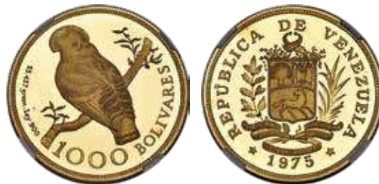
30665 Republic gold Proof "Cock of the Rock" 1000 Bolivares 1975 PR69 Ultra Cameo NGC , British Royal mint, KM-Y48.1, Fr-8. Mintage: 483. Detailed Wings variety. A nearly unhandled example of this popular and low-mintage modern type. Reserve: $2,750