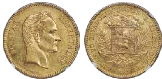
30663 Republic gold 100 Bolivares 1889 AU58 NGC , Caracas mint, KM-Y34, Fr-2. A handsome example of this ever-popular issue, displaying only a touch of wear on the high points. AGW 0.9334 oz. Starting Bid: $750