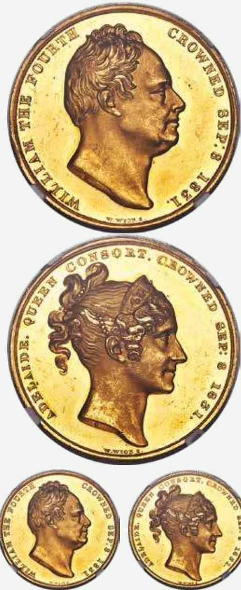
31085 William IV gold Proof "Coronation" Medal 1831 PR61 Cameo NGC, BHM-1475, Eimer-1251. 33mm. By William Wyon. Only 1203 examples of this medal were produced in gold, and of this low mintage 238 were subsequently melted, leaving just 965 remaining. Deeply Prooflike, the fields a smooth sun-yellow with a hint of reddish color, and dotted with light contact marks as typical for the type. Rarely found with a Cameo designation and highly desirable as such. Starting Bid: $2,500