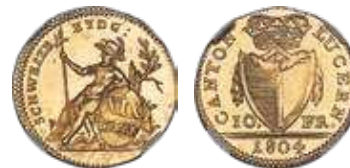
30639 Lucerne. Canton gold 10 Franks 1804 MS63 NGC, KM98, Fr-327. Highly Prooflike, a conservatively graded piece with glossy fields and comparatively frosted devices. Its surfaces bear the adjustment marks commonly found on this issue, but they have been almost completely obscured by the strike and indeed, if anything, provide a pleasant underlying texture. One of the finest of this type we have had the pleasure to offer. Reserve: $2,500