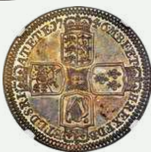
170 Visit HA.com/3083 to read full descriptions, check graded population data and auction comparable results, view enlargeable images, and bid online.