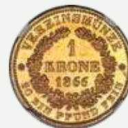
31049 Franz Joseph I gold Krone 1866-A MS61 NGC, Vienna mint, KM2255, J-319. Deeply Prooflike, the strike razor-sharp, the portrait chiseled, and the devices as a whole well-frosted and heavily contrasted to the mirrored fields. A one-year type with a mintage of only 3,000 pieces, representing the first we have seen to date. Starting Bid: $1,500