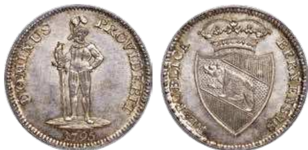
30638 Bern. City Taler 1795 MS64+ PCGS, KM149, Dav-1759. A light silver patina enhances the presentation of this popular taler type revealing underlying luster throughout, the central expanses framed by legends dressed in subtly darkened tones. No Minimum Bid