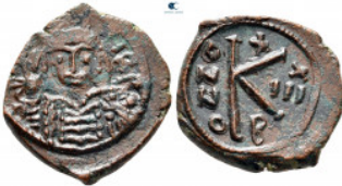
2135 Maurice Tiberius AD 582-602. Byzantine Half Follis or 20 Nummi Æ 22 mm, 5,32 g nearly very fine 10