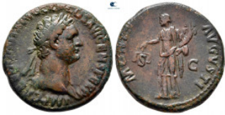
1375 Domitian AD 81-96. Rome As Æ 25 mm, 11,53 g very fine 10