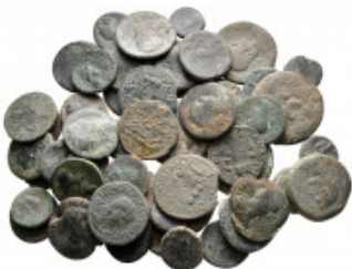
2482 Lot of ca. 55 roman provincial bronze coins / SOLD AS SEEN, NO RETURN! nearly very fine 10