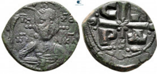
2245 Romanus IV, Diogenes AD 1068-1071. Constantinople Follis or 40 Nummi Æ 26 mm, 5,94 g very fine 10