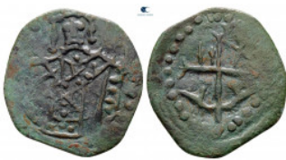
2370 Bulgaria. Second empire. Ivan Aleksandar AD 1331-1371. Trachy AE 21 mm, 1,74 g very fine 10