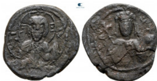
2273 Alexius I Comnenus AD 1081-1118. Thessalonica Tetarteron Æ 22 mm, 3,18 g very fine 10