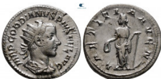
1628 Gordian III AD 238-244. Rome Antoninianus AR 22 mm, 4,59 g very fine 10