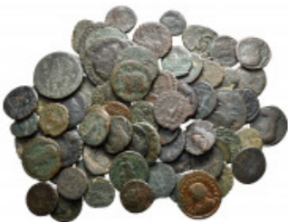
2517 Lot of ca. 70 late roman bronze coins / SOLD AS SEEN, NO RETURN! nearly very fine 10