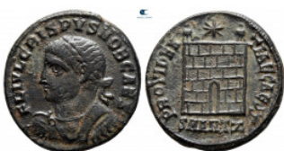
1909 Crispus, as Caesar AD 316-326. Antioch Nummus Æ 19 mm, 3,14 g very fine From the Tareq Hani collection 10