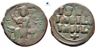
2241 Constantine X Ducas AD 1059-1067. Constantinople Anonymous Follis Æ 25 mm, 6,55 g very fine 10