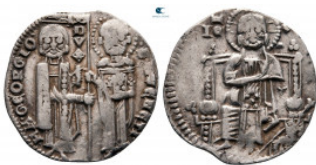
2362 Italy. Venice. Marino Zorzi AD 1311-1312. Grosso AR 18 mm, 2,02 g very fine 10