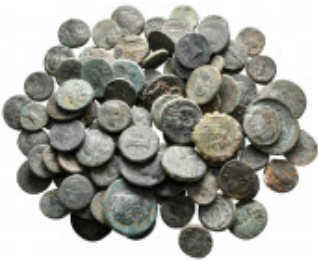
2452 Lot of ca. 100 greek bronze coins / SOLD AS SEEN, NO RETURN! nearly very fine 10