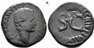
1344 Augustus 27 BC-AD 14. Rome As Æ 25 mm, 10,91 g nearly very fine