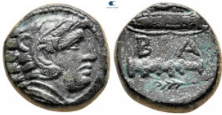
98 Kings of Macedon. Uncertain mint. Alexander III "the Great" 336-323 BC. Bronze Æ 17 mm, 5,93 g very fine 10