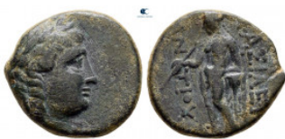
812 Seleukid Kingdom. Sardeis. Antiochos II Theos 261-246 BC. Bronze Æ 17 mm, 3,39 g very fine 10