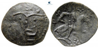
2368 Bulgaria. Veliko Turnovo mint. Theodor Svetoslav AD 1300-1322. Trachy AE 19 mm, 0,88 g very fine 10