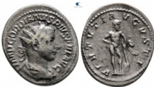
1627 Gordian III AD 238-244. Rome Antoninianus AR 24 mm, 3,96 g very fine 10