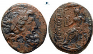
866 Seleucis and Pieria. Antioch circa 100-0 BC. Bronze Æ 26 mm, 12,03 g nearly very fine From the Tareq Hani collection 10