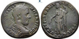
1095 Moesia Inferior. Nikopolis ad Istrum. Macrinus AD 217-218. Bronze Æ 28 mm, 12,21 g very fine 10