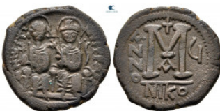
2123 Justin II and Sophia AD 565-578. Nikomedia Follis or 40 Nummi Æ 28 mm, 11,20 g very fine 10