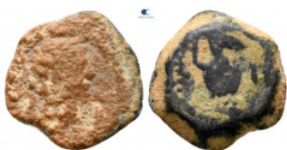
1299 Egypt. Alexandria. Trajan AD 98-117. Dichalkon AE 14 mm, 2,06 g nearly very fine From the Tareq Hani collection 10