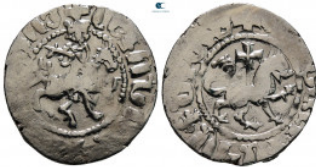
2390 Cilician Armenia. Levon III AD 1301-1307. Takvorin AR 20 mm, 2,25 g nearly very fine 10