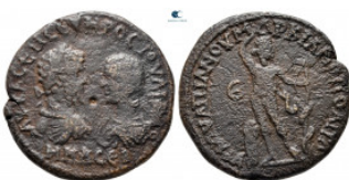
1051 Moesia Inferior. Marcianopolis. Septimius Severus, with Julia Domna AD 193-211. Bronze Æ 28 mm, 10,96 g very fine 10