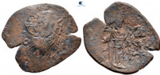
2326 Michael VIII Palaeologus AD 1261-1282. Constantinople Trachy Æ 27 mm, 2,35 g very fine 10