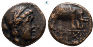
825 Seleukid Kingdom. Antioch. Antiochos III Megas 223-187 BC. Bronze Æ 12 mm, 2,21 g very fine 10