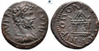
1086 Moesia Inferior. Nikopolis ad Istrum. Septimius Severus AD 193-211. Bronze Æ 17 mm, 2,96 g very fine 10