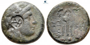
816 Seleukid Kingdom. Sardeis. Antiochos II Theos 261-246 BC. Bronze Æ 17 mm, 4,34 g fine 10