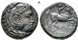
123 Kings of Macedon. Uncertain mint. Kassander 306-297 BC. Bronze Æ 19 mm, 6,75 g very fine 10