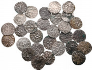
2539 Lot of ca. 30 medieval denier / SOLD AS SEEN, NO RETURN! very fine 10