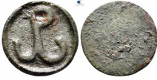
2198 Constantine VII Porphyrogenitus, with Romanus I AD 913-959. Cherson Cast Æ 20 mm, 3,16 g nearly very fine 10