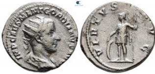
1647 Gordian III AD 238-244. Rome Antoninianus AR 21 mm, 3,39 g very fine 10