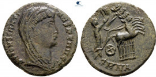
1991 Divus Constantine I AD 337. Nicomedia Follis Æ 16 mm, 1,55 g very fine 10