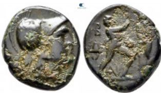
139 Kings of Macedon. Uncertain mint. Antigonos II Gonatas 277-239 BC. Bronze Æ 20 mm, 6,70 g nearly very fine 10