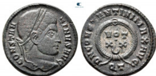
1877 Constantine I the Great AD 306-337. Ticinum Follis Æ 19 mm, 3,29 g very fine 10