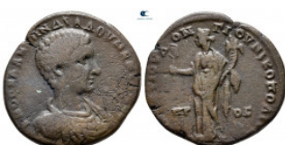
1101 Moesia Inferior. Nikopolis ad Istrum. Diadumenian AD 218-218. Bronze Æ 27 mm, 8,20 g very fine 10