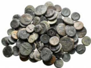
2448 Lot of ca. 100 greek bronze coins / SOLD AS SEEN, NO RETURN! nearly very fine 10