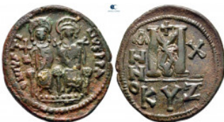
2121 Justin II and Sophia AD 565-578. Cyzicus Follis or 40 Nummi Æ 31 mm, 12,02 g very fine 10