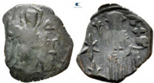
2337 Andronicus II Palaeologus AD 1282-1328. Thessalonica Trachy Æ 18 mm, 1,20 g nearly very fine 10