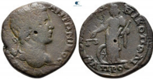
1090 Moesia Inferior. Nikopolis ad Istrum. Caracalla AD 198-217. Bronze Æ 27 mm, 9,33 g nearly very fine 10