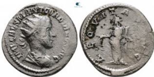
1650 Gordian III AD 238-244. Rome Antoninianus AR 22 mm, 3,19 g nearly very fine 10