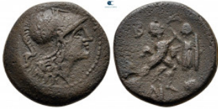
146 Kings of Macedon. Uncertain mint. Antigonos II Gonatas 277-239 BC. Bronze Æ 19 mm, 7,22 g nearly very fine 10