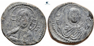
2247 Romanus IV, Diogenes AD 1068-1071. Constantinople Anonymous Follis Æ 27 mm, 8,61 g very fine 10