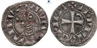
2357 Principality of Antioch. Antioch. Bohemond III AD 1163-1201. Denier AR 18 mm, 0,94 g very fine 10