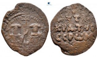
2343 Andronicus II Palaeologus, with Michael IX AD 1282-1328. Constantinople Assarion Æ 24 mm, 1,79 g nearly very fine 10