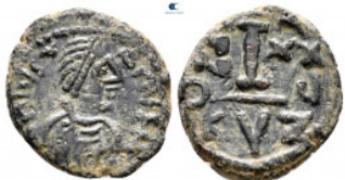
2106 Justinian I AD 527-565. Cyzicus Decanummium Æ 16 mm, 3,78 g very fine 10