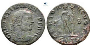
1845 Galerius Maximianus AD 305-311. Thessaloniki Nummus Æ 25 mm, 6,09 g very fine 10