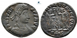
1972 Constans AD 337-350. Siscia Follis Æ 17 mm, 1,21 g very fine 10