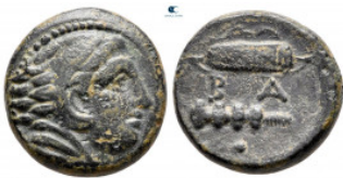
101 Kings of Macedon. Uncertain mint. Alexander III "the Great" 336-323 BC. Bronze Æ 17 mm, 5,62 g very fine 10