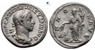
1528 Severus Alexander AD 222-235. Rome Denarius AR 17 mm, 2,74 g very fine 10