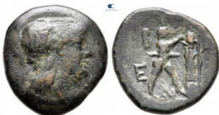
143 Kings of Macedon. Uncertain mint. Antigonos II Gonatas 277-239 BC. Bronze Æ 17 mm, 3,73 g nearly very fine 10