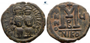
2122 Justin II and Sophia AD 565-578. Nikomedia Follis or 40 Nummi Æ 31 mm, 12,44 g very fine 10