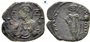
2294 Manuel I Comnenus AD 1143-1180. Thessalonica Half Tetarteron Æ 16 mm, 1,46 g very fine 10