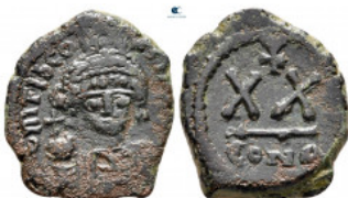
2132 Tiberius II Constantine AD 578-582. Constantinople Half Follis or 20 Nummi Æ 21 mm, 6,39 g nearly very fine 10