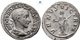
1547 Gordian III AD 238-244. Rome Denarius AR 19 mm, 2,99 g very fine 10