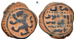
2396 Mamluks. Hama AH 764-778. Fals AE 20 mm, 1,92 g very fine 10