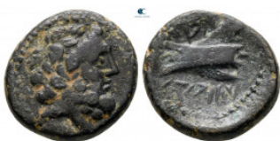
878 Phoenicia. Arados circa 206-52 BC. Bronze Æ 17 mm, 3,75 g very fine From the Tareq Hani collection 10