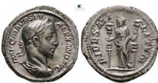
1531 Severus Alexander AD 222-235. Rome Denarius AR 20 mm, 2,82 g very fine 10