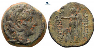
851 Seleukid Kingdom. Antioch on the Orontes. Alexander II Zabinas 128-122 BC. Bronze Æ 21 mm, 8,43 g very fine From the Tareq Hani collection 10