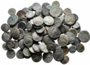
2461 Lot of ca. 100 greek bronze coins / SOLD AS SEEN, NO RETURN! very fine 10