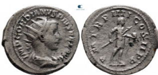
1629 Gordian III AD 238-244. Rome Antoninianus AR 24 mm, 3,68 g nearly very fine 10