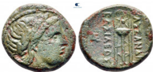
124 Kings of Macedon. Uncertain mint. Kassander 306-297 BC. Bronze Æ 19 mm, 5,81 g very fine 10