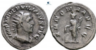
1713 Philip I Arab AD 244-249. Rome Antoninianus AR 23 mm, 3,26 g very fine 10