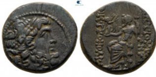
871 Seleucis and Pieria. Antioch circa 100-0 BC. Bronze Æ 20 mm, 7,05 g very fine 10