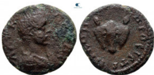
1092 Moesia Inferior. Nikopolis ad Istrum. Geta AD 198-211. Bronze Æ 16 mm, 2,71 g nearly very fine 10