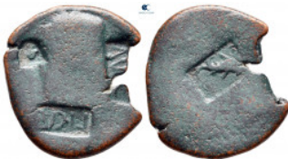
1337 Augustus 27 BC-AD 14. Rome As Æ 25 mm, 7,94 g fine 10