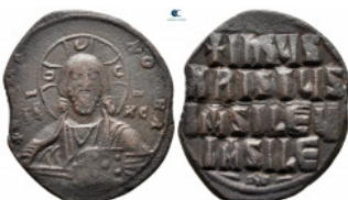
2212 Attributed to Basil II and Constantine VIII AD 976-1028. Constantinople Anonymous Follis Æ 32 mm, 9,20 g very fine 10