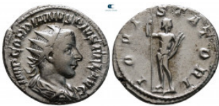
1625 Gordian III AD 238-244. Rome Antoninianus AR 22 mm, 3,58 g very fine 10