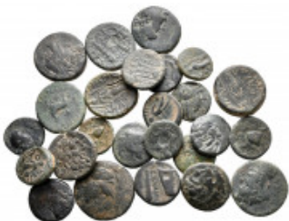
2464 Lot of ca. 25 greek bronze coins / SOLD AS SEEN, NO RETURN! very fine 10