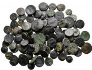
2469 Lot of ca. 100 greek bronze coins / SOLD AS SEEN, NO RETURN very fine 10