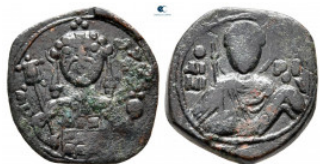
2281 John II Comnenus AD 1118-1143. Thessalonica Half Tetarteron Æ 15 mm, 2,50 g very fine 10