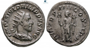
1710 Philip I Arab AD 244-249. Rome Antoninianus AR 22 mm, 4,88 g very fine 10