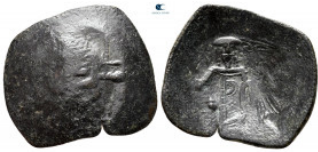
2309 Latin Rulers of Constantinople AD 1204-1261. Constantinople Trachy Æ 23 mm, 3,12 g fine 10