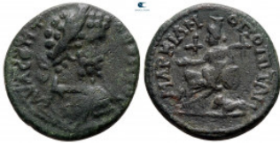
1047 Moesia Inferior. Marcianopolis. Septimius Severus AD 193-211. Bronze Æ 19 mm, 4,02 g very fine 10