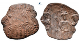
2327 Michael VIII Palaeologus AD 1261-1282. Constantinople Trachy Æ 22 mm, 1,48 g very fine 10