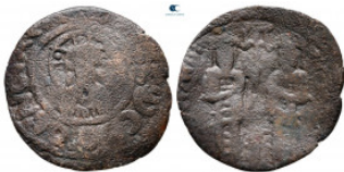
2342 Andronicus II Palaeologus, with Michael IX AD 1282-1328. Constantinople Assarion Æ 21 mm, 1,44 g fine 10