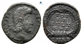
1969 Constans AD 337-350. Cyzicus Follis Æ 13 mm, 1,28 g very fine 10