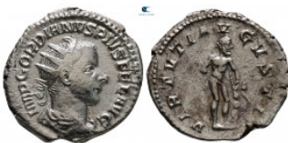
1660 Gordian III AD 238-244. Rome Antoninianus AR 22 mm, 3,57 g good very fine 10