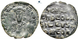
2201 Constantine VII, Porphyrogenitus AD 913-959. Constantinople Follis Æ 25 mm, 4,59 g very fine 10