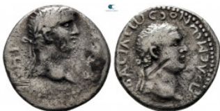
1116 Kings of Pontos. Polemo II, with Nero (or Britannicus) AD 38-64. Dated RY 18 (AD 55/6) Drachm AR 16 mm, 3,18 g nearly very fine 10