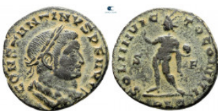
1859 Constantine I the Great AD 306-337. Lugdunum Follis Æ 22 mm, 3,76 g nearly very fine From the Tareq Hani collection 10