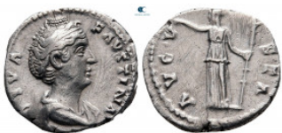
1437 Diva Faustina I AD 140-141. Rome Denarius AR 15 mm, 3,20 g very fine 10