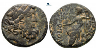
868 Seleucis and Pieria. Antioch circa 100-0 BC. Bronze Æ 19 mm, 5,67 g nearly very fine From the Tareq Hani collection 10