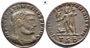
1873 Constantine I the Great AD 306-337. Thessaloniki Follis Æ 24 mm, 3,68 g very fine 10