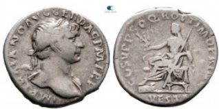
1379 Trajan AD 98-117. Rome Denarius AR 19 mm, 3,17 g nearly very fine 10