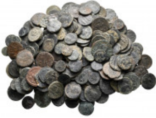
2498 Lot of ca. 200 late roman bronze coins / SOLD AS SEEN, NO RETURN! very fine 10