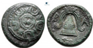
99 Kings of Macedon. Uncertain mint. Alexander III "the Great" 336-323 BC. Bronze Æ 17 mm, 4,12 g very fine 10