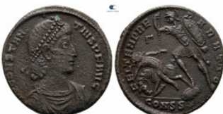
1994 Constantius II AD 347-355. Constantinople Follis Æ 23 mm, 5,37 g very fine 10