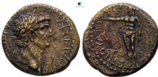
1202 Phrygia. Cotiaeum. Claudius AD 41-54. Bronze Æ 18 mm, 4,70 g very fine 10