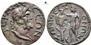
1244 Pisidia. Termessos Major. Pseudo-autonomous issue. Time of Gallienus AD 253-268. Bronze Æ 26 mm, 8,13 g good very fine 10