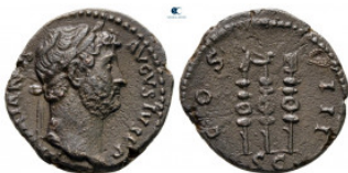
1410 Hadrian AD 117-138. Rome Semis Æ 17 mm, 2,93 g very fine