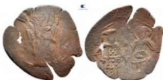
2323 Michael VIII Palaeologus AD 1261-1282. Constantinople Trachy Æ 24 mm, 1,17 g nearly very fine 10