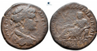
1091 Moesia Inferior. Nikopolis ad Istrum. Caracalla AD 198-217. Bronze Æ 26 mm, 10,20 g nearly very fine 10