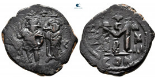
2161 Heraclius, with Heraclius Constantine and Heraclonas AD 610-641. Constantinople Follis or 40 Nummi Æ 27 mm, 6,90 g very fine 10