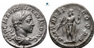
1525 Severus Alexander AD 222-235. Rome Denarius AR 16 mm, 2,17 g very fine 10