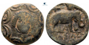
830 Seleukid Kingdom. Uncertain mint. Antiochos III Megas 223-187 BC. Bronze Æ 18 mm, 4,32 g nearly very fine From the Tareq Hani collection 10