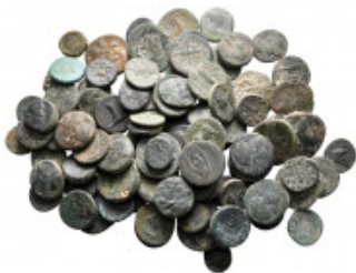
2449 Lot of ca. 100 greek bronze coins / SOLD AS SEEN, NO RETURN! nearly very fine 10