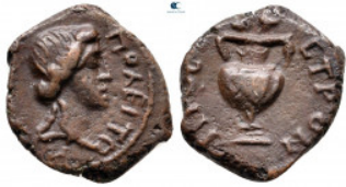
1079 Moesia Inferior. Nikopolis ad Istrum. Pseudo-autonomous issue circa AD 100-250. Bronze Æ 15 mm, 2,29 g very fine 10