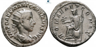
1623 Gordian III AD 238-244. Rome Antoninianus AR 22 mm, 4,51 g very fine 10