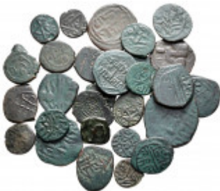
2546 Lot of ca. 28 islamic bronze coins / SOLD AS SEEN, NO RETURN! very fine 10