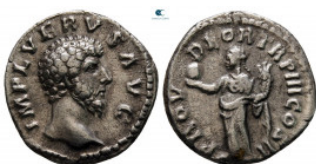
1445 Lucius Verus AD 161-169. Rome Denarius AR 18 mm, 3,16 g very fine 10