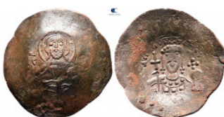
2276 John II Comnenus AD 1118-1143. Constantinople Trachy Æ 28 mm, 3,85 g very fine 10