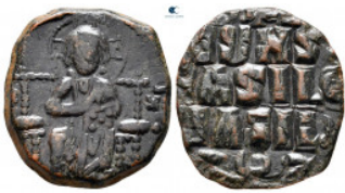
2239 Constantine IX Monomachus AD 1042-1055. Constantinople Anonymous Follis Æ 25 mm, 5,67 g very fine 10