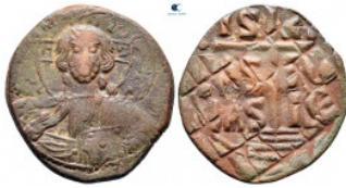
2231 Romanus III Argyrus AD 1028-1034. Constantinople Anonymous Follis Æ 31 mm, 10,41 g very fine 10