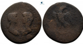
1200 Phrygia. Apameia. Nero with Agrippina Junior AD 54-68. Bronze Æ 26 mm, 8,42 g fine 10