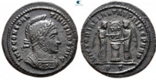
1878 Constantine I the Great AD 306-337. Ticinum Follis Æ 17 mm, 3,50 g very fine 10