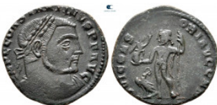
1884 Constantine I the Great AD 306-337. Uncertain mint, probably Thessalonica Follis Æ 23 mm, 3,27 g very fine 10