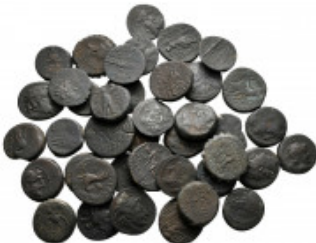
2459 Lot of ca. 40 greek bronze coins / SOLD AS SEEN, NO RETURN! very fine 10