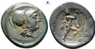
140 Kings of Macedon. Uncertain mint. Antigonos II Gonatas 277-239 BC. Bronze Æ 22 mm, 5,69 g very fine 10