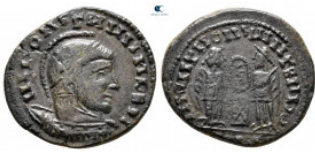
1880 Constantine I the Great AD 306-337. Contemporary imitation. Uncertain mint Nummus Æ 18 mm, 2,80 g very fine 10