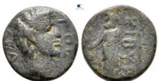
1212 Phrygia. Kibyra. Augustus 27 BC-AD 14. Bronze Æ 16 mm, 3,62 g nearly very fine 10