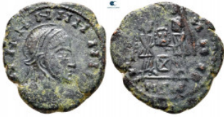
1879 Constantine I the Great AD 306-337. Contemporary imitation. Uncertain mint Nummus Æ 19 mm, 3,06 g very fine 10