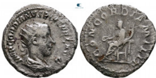
1652 Gordian III AD 238-244. Rome Antoninianus AR 23 mm, 3,51 g nearly very fine 10