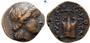
808 Seleukid Kingdom. Sardeis. Antiochos II Theos 261-246 BC. Bronze Æ 13 mm, 1,44 g nearly very fine 10