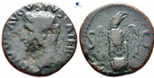
1348 Divus Augustus after AD 14. Rome As Æ 27 mm, 9,34 g fine