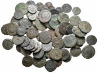
2515 Lot of ca. 70 late roman bronze coins / SOLD AS SEEN, NO RETURN! nearly very fine 10