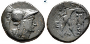
137 Kings of Macedon. Uncertain mint. Antigonos II Gonatas 277-239 BC. Bronze Æ 16 mm, 3,19 g very fine 10