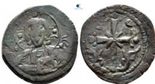
2266 Nicephorus III Botaniates AD 1078-1081. Constantinople Anonymous Follis Æ 25 mm, 5,06 g very fine 10