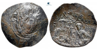
2335 Michael VIII Palaeologus AD 1261-1282. Thessalonica Trachy Æ 24 mm, 1,88 g nearly very fine 10