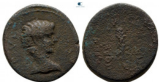
1209 Phrygia. Hierapolis. Gaius Caesar 20 BC-AD 4. Bronze Æ 17 mm, 2,89 g fine 10