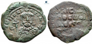
2206 Nicephorus II Phocas AD 963-969. Constantinople Follis or 40 Nummi Æ 25 mm, 8,57 g nearly very fine 10