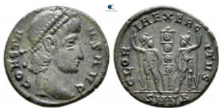
1970 Constans AD 337-350. Nicomedia Follis Æ 16 mm, 2,02 g very fine 10