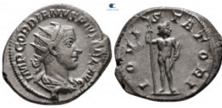
1664 Gordian III AD 238-244. Rome Antoninianus AR 25 mm, 4,99 g good very fine 10