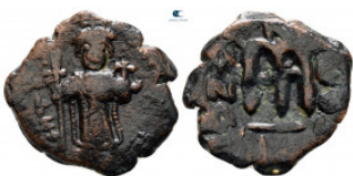
2165 Constans II AD 641-668. Constantinople Follis or 40 Nummi Æ 20 mm, 4,28 g very fine 10