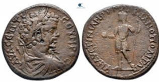
1048 Moesia Inferior. Marcianopolis. Septimius Severus AD 193-211. Bronze Æ 28 mm, 11,60 g very fine 10