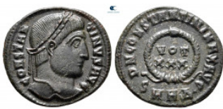
1857 Constantine I the Great AD 306-337. Heraclea Follis Æ 20 mm, 2,33 g very fine 10