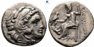
77 Kings of Macedon. Lampsakos. Alexander III "the Great" 336-323 BC. Drachm AR 16 mm, 3,58 g very fine 10