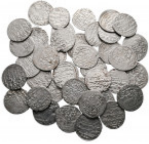
2543 Lot of ca. 40 islamic silver coins / SOLD AS SEEN, NO RETURN very fine 10