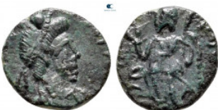
2074 Johannes AD 423-425. Rome Nummus Æ 11 mm, 0,88 g very fine 10