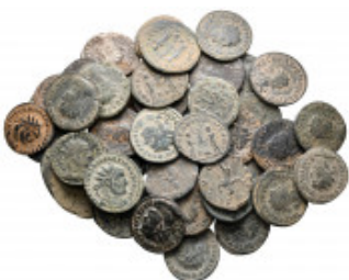
2503 Lot of ca. 50 late roman bronze coins / SOLD AS SEEN, NO RETURN! very fine 10