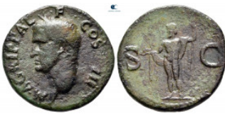
1347 Agrippa 12 BC. Rome As Æ 27 mm, 10,28 g very fine