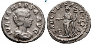
1518 Julia Maesa. Augusta AD 218-224. Rome Denarius AR 18 mm, 2,92 g good very fine 10