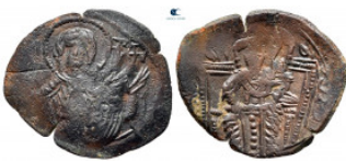
2328 Michael VIII Palaeologus AD 1261-1282. Constantinople Trachy Æ 27 mm, 2,70 g very fine 10