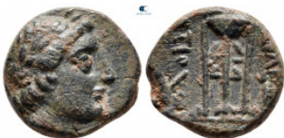
828 Seleukid Kingdom. Sardeis. Antiochos III Megas 223-187 BC. Bronze Æ 18 mm, 6,58 g very fine 10