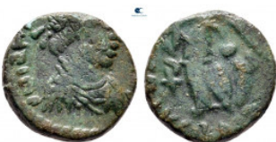
2075 Johannes AD 423-425. Rome Nummus Æ 12 mm, 1,12 g very fine 10