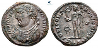
1854 Constantine I the Great AD 306-337. Cyzicus Follis Æ 20 mm, 3,71 g very fine 10