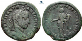
1066 Moesia Inferior. Marcianopolis. Elagabal AD 218-222. Bronze Æ 26 mm, 10,96 g nearly very fine 10