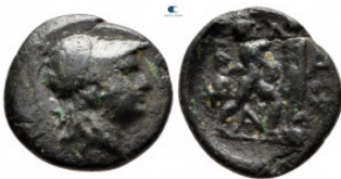
131 Kings of Macedon. Uncertain mint. Antigonos II Gonatas 277-239 BC. Bronze Æ 19 ^ mm, 3,84 g very fine 10