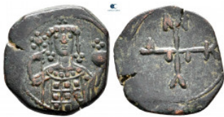
2295 Manuel I Comnenus AD 1143-1180. Thessalonica Half Tetarteron Æ 17 mm, 1,78 g very fine 10