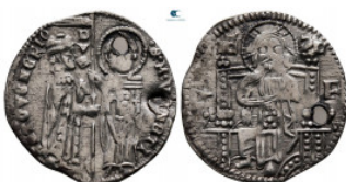
2364 Italy. Venice. Antonio Veniero AD 1382-1400. Grosso AR 22 mm, 1,95 g very fine 10