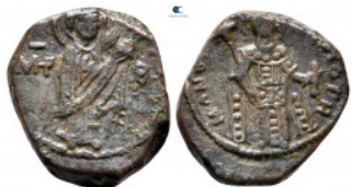
2289 Manuel I Comnenus AD 1143-1180. Constantinople Tetarteron Æ 19 mm, 3,95 g very fine 10