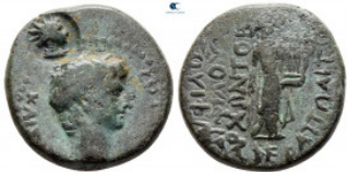
1207 Phrygia. Hierapolis. Augustus 27 BC-AD 14. Diphilus, son of Diphilus, archon for the second time Bronze Æ 18 mm, 4,67 g very fine, countermarked 10