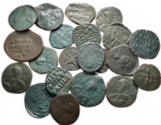
2524 Lot of ca. 22 byzantine bronze coins / SOLD AS SEEN, NO RETURN! nearly very fine 10