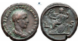
1301 Egypt. Alexandria. Severus Alexander AD 222-235. Billon-Tetradrachm 23 mm, 13,30 g very fine 10