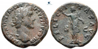
1432 Antoninus Pius AD 138-161. Rome As Æ 25 mm, 8,76 g very fine 10