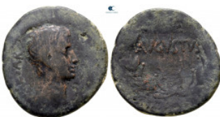
1115 Asia Minor. Uncertain mint. Augustus 27 BC-AD 14. As Æ 28 mm, 8,45 g nearly very fine 10