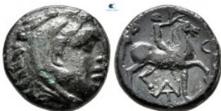
142 Kings of Macedon. Uncertain mint. Antigonos II Gonatas 277-239 BC. Bronze Æ 17 mm, 4,99 g very fine 10