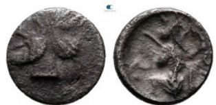
972 Persia. Achaemenid Empire. Uncertain Cilician mint. Time of Artaxerxes III to Darios III 350-333 BC. Hemiobol AR 6 mm, 0,30 g very fine 10