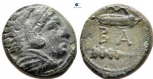
100 Kings of Macedon. Uncertain mint. Alexander III "the Great" 336-323 BC. Bronze Æ 18 mm, 5,97 g very fine 10