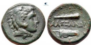
88 Kings of Macedon. Uncertain mint. Alexander III "the Great" 336-323 BC. Bronze Æ 18 mm, 6,67 g very fine 10