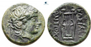
817 Seleukid Kingdom. Sardeis. Antiochos II Theos 261-246 BC. Bronze Æ 12 mm, 1,43 g good very fine 10