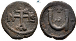
2134 Tiberius II Constantine AD 578-582. Theoupolis (Antioch) Pentanummium Æ 14 mm, 1,49 g very fine 10