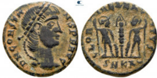
1967 Constans AD 337-350. Cyzicus Follis Æ 15 mm, 1,95 g very fine From the Tareq Hani collection 10