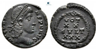
1968 Constans AD 337-350. Cyzicus Follis Æ 13 mm, 1,65 g very fine 10