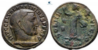
1905 Maximinus II Daia AD 310-313. Nicomedia Follis Æ 21 mm, 3,77 g nearly very fine 10