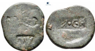
1340 Augustus 27 BC-AD 14. Rome As Æ 23 mm, 6,75 g fine 10