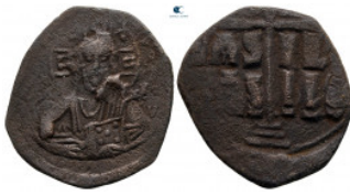
2230 Romanus III Argyrus AD 1028-1034. Constantinople Anonymous Follis Æ 31 mm, 9,06 g nearly very fine 10