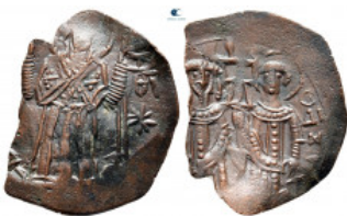
2329 Michael VIII Palaeologus AD 1261-1282. Constantinople Trachy Æ 26 mm, 1,43 g very fine 10