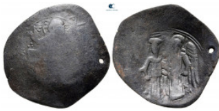
2317 Theodore Comnenus-Ducas AD 1225-1230. Thessalonica Trachy Æ 29 mm, 3,05 g fine 10