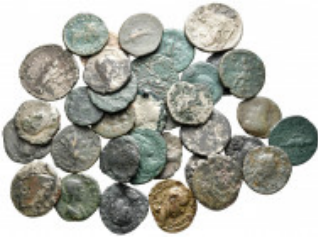
2490 Lot of ca. 34 roman coins / SOLD AS SEEN, NO RETURN! nearly very fine 10