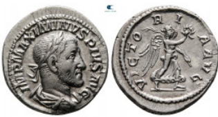
1544 Maximinus I Thrax AD 235-238. Rome Denarius AR 19 mm, 3,20 g nearly extremely fine 10