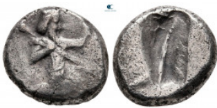
968 Persia. Achaemenid Empire. Sardeis. Time of Darios I to Xerxes II circa 485-420 BC. Siglos AR 14 mm, 5,47 g very fine 10