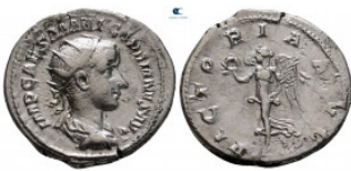
1667 Gordian III AD 238-244. Rome Antoninianus AR 23 mm, 4,10 g very fine 10