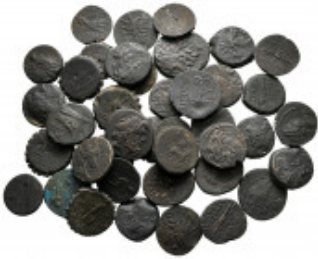
2462 Lot of ca. 40 greek bronze coins / SOLD AS SEEN, NO RETURN! very fine 10