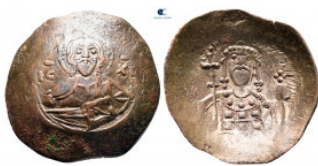
2271 Alexius I Comnenus AD 1081-1118. Constantinople Trachy Æ 29 mm, 2,96 g very fine 10