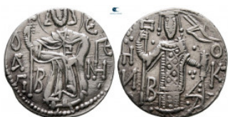
2290 Manuel I Comnenus AD 1143-1180. Constantinople Asper AR 21 mm, 2,81 g good very fine 10