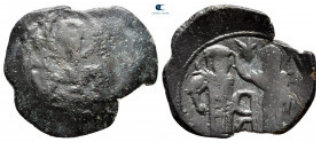
2341 Andronicus II Palaeologus AD 1282-1328. Thessalonica Trachy Æ 20 mm, 1,83 g very fine 10