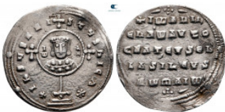
2209 John I Tzimiskes AD 969-976. Constantinople Miliarion AR 21 mm, 2,91 g very fine 10