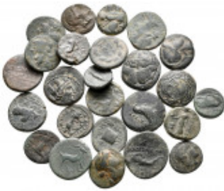
2456 Lot of ca. 25 greek bronze coins / SOLD AS SEEN, NO RETURN! very fine 10