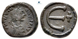
2104 Justinian I AD 527-565. Constantinople Pentanummium Æ 13 mm, 1,91 g very fine 10