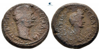
1109 Thessaly. Koinon of Thessaly. Domitian with Domitia AD 81-96. Bronze Æ 17 mm, 7,33 g nearly very fine 10