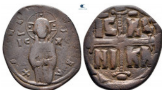
2236 Michael IV AD 1034-1041. Constantinople Anonymous Follis Æ 31 mm, 9,24 g very fine 10