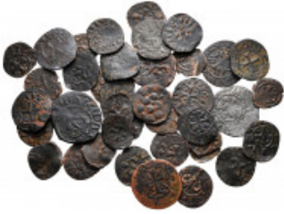
2537 Lot of ca. 40 medieval bronze coins / SOLD AS SEEN, NO RETURN very fine 10