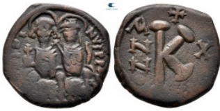
2130 Justin II and Sophia AD 565-578. Uncertain mint Half Follis or 20 Nummi Æ 23 mm, 6,65 g very fine 10