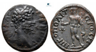
1085 Moesia Inferior. Nikopolis ad Istrum. Septimius Severus AD 193-211. Bronze Æ 18 mm, 3,29 g very fine 10