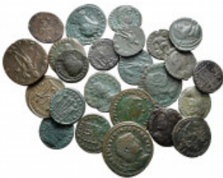
2513 Lot of ca. 24 late roman bronze coins / SOLD AS SEEN, NO RETURN! nearly very fine 10