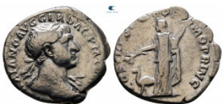
1380 Trajan AD 98-117. Rome Denarius AR 17 mm, 2,85 g very fine 10