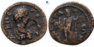
1240 Pisidia. Prostanna. Geta AD 198-211. Bronze Æ 20 mm, 3,76 g nearly very fine 10