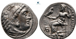
79 Kings of Macedon. Sardeis. Alexander III "the Great" 336-323 BC. Drachm AR 18 mm, 4,25 g very fine 10