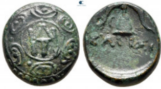
121 Kings of Macedon. Uncertain mint. Demetrios I Poliorketes 306-283 BC. Bronze Æ 15 mm, 4,34 g very fine 10