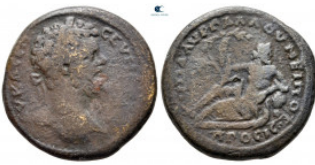
1088 Moesia Inferior. Nikopolis ad Istrum. Septimius Severus AD 193-211. Aurelius Gallus, legatus consularis Pentassarion Æ 28 mm, 12,57 g nearly very fine 10