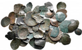
2534 Lot of ca. 53 byzantine scyphate coins / SOLD AS SEEN, NO RETURN! very fine 10