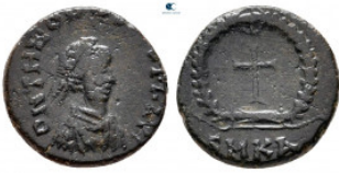
2070 Theodosius II AD 402-450. Cyzicus Nummus Æ 9 mm, 0,91 g nearly very fine 10