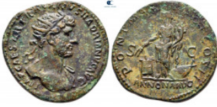
1406 Hadrian AD 117-138. Rome Dupondius Æ 26 mm, 12,19 g very fine