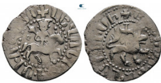
2391 Cilician Armenia. Levon III AD 1301-1307. Takvorin AR 20 mm, 2,07 g very fine 10