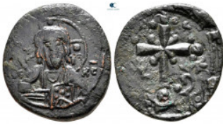
2261 Nicephorus III Botaniates AD 1078-1081. Constantinople Anonymous Follis Æ 22 mm, 4,50 g very fine 10