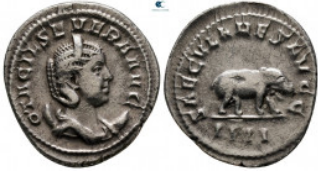
1678 Otacilia Severa AD 244-249. Rome Antoninianus AR 24 mm, 4,01 g very fine 10