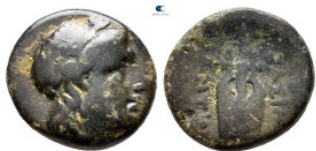
810 Seleukid Kingdom. Sardeis. Antiochos II Theos 261-246 BC. Bronze Æ 13 mm, 1,61 g fine 10