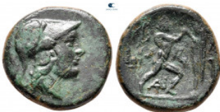
132 Kings of Macedon. Uncertain mint. Antigonos II Gonatas 277-239 BC. Bronze Æ 19 mm, 5,89 g very fine 10