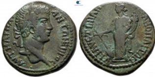
1063 Moesia Inferior. Marcianopolis. Elagabal AD 218-222. Bronze Æ 27 mm, 12,24 g very fine 10