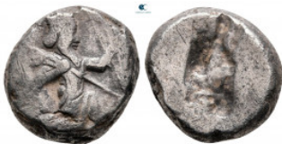
969 Persia. Achaemenid Empire. Sardeis. Time of Darios I to Xerxes II circa 485-420 BC. Siglos AR 14 mm, 5,53 g very fine 10