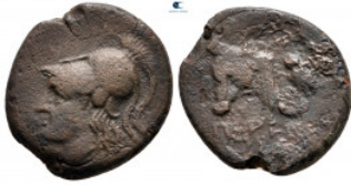
400 Mysia. Pergamon circa 310-282 BC. Bronze Æ 19 mm, 4,96 g nearly very fine 10