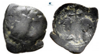
2321 John Comnenus-Ducas AD 1237-1242. Thessalonica Trachy Æ 10 mm, 0,34 g fine 10