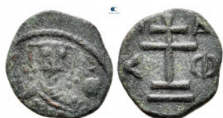
2275 Alexius I Comnenus AD 1081-1118. Uncertain mint Half Tetarteron Æ 15 mm, 1,05 g very fine 10