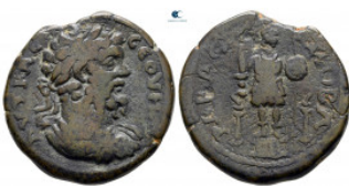
1296 Arabia. Rabbathmoba. Septimius Severus AD 193-211. Bronze Æ 29 mm, 14,62 g nearly very fine From the Tareq Hani collection 10