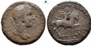
1103 Moesia Inferior. Nikopolis ad Istrum. Elagabal AD 218-222. Bronze Æ 26 mm, 12,67 g very fine 10