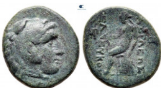
822 Seleukid Kingdom. Sardeis. Seleukos II Kallinikos 246-226 BC. Bronze Æ 17 mm, 3,76 g very fine 10