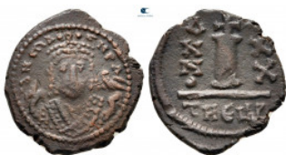
2145 Maurice Tiberius AD 582-602. Theoupolis (Antioch) Decanummium Æ 19 mm, 2,87 g very fine 10