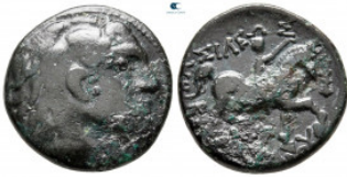
122 Kings of Macedon. Uncertain mint. Kassander 306-297 BC. Bronze Æ 20 mm, 6,02 g very fine 10