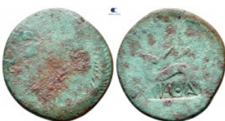
1341 Augustus 27 BC-AD 14. Rome As Æ 23 mm, 6,55 g fine 10