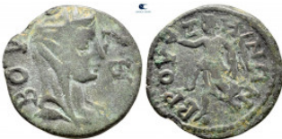
1201 Phrygia. Bruzos. Pseudo-autonomous issue circa AD 200-250. Bronze Æ 22 mm, 4,17 g very fine 10