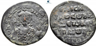
2207 Nicephorus II Phocas AD 963-969. Constantinople Follis Æ 27 mm, 7,27 g very fine 10