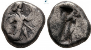
966 Persia. Achaemenid Empire. Sardeis. Time of Darios I to Xerxes I circa 500-485 BC. Siglos AR 14 mm, 5,44 g very fine 10