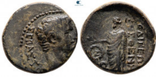
1214 Phrygia. Laodikeia ad Lycum. Augustus 27 BC-AD 14. Bronze Æ 14 mm, 2,96 g very fine 10