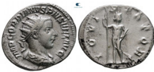
1668 Gordian III AD 238-244. Rome Antoninianus AR 23 mm, 3,87 g very fine 10