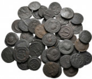
2505 Lot of ca. 50 late roman bronze coins / SOLD AS SEEN, NO RETURN! nearly very fine 10