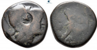
145 Kings of Macedon. Uncertain mint. Antigonos II Gonatas 277-239 BC. Bronze Æ 18 mm, 5,96 g fine 10