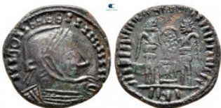
1883 Constantine I the Great AD 306-337. Contemporary imitation. Uncertain mint Nummus Æ 17 mm, 3,05 g very fine 10