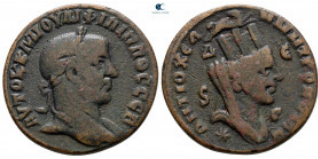
1270 Seleucia and Pieria. Antioch. Philip II AD 247-249. Bronze Æ 27 mm, 14,21 g very fine 10