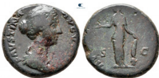
1444 Faustina II AD 147-175. Rome As Æ 25 mm, 10,47 g very fine 10