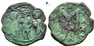
2163 Heraclius, with Martina and Heraclius Constantine AD 610-641. Constantinople Follis or 40 Nummi Æ 24 mm, 3,70 g very fine 10