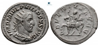
1682 Philip I Arab AD 244-249. Rome Antoninianus AR 22 mm, 3,76 g very fine 10