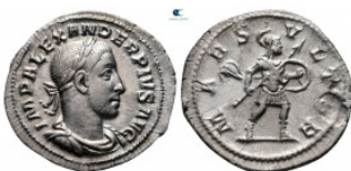
1524 Severus Alexander AD 222-235. Rome Denarius AR 20 mm, 3,04 g very fine 10