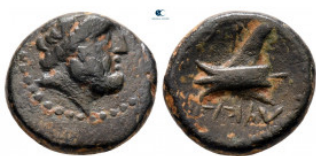
876 Phoenicia. Arados circa 206-52 BC. Bronze Æ 16 mm, 3,49 g nearly very fine From the Tareq Hani collection 10