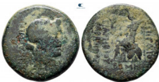
324 Bithynia. Nikaia. C. Papirius Carbo, Procurator 62-59 BC. Bronze Æ 22 mm, 8,00 g very fine 10