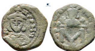
2172 Leo III the "Isaurian", with Constantine V AD 717-741. Constantinople Follis or 40 Nummi Æ 18 mm, 3,38 g fine 10