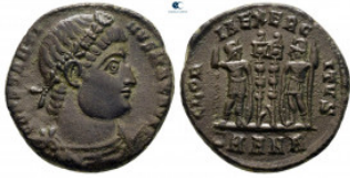
1846 Constantine I the Great AD 306-337. Antioch Follis Æ 17 mm, 3,15 g very fine 10