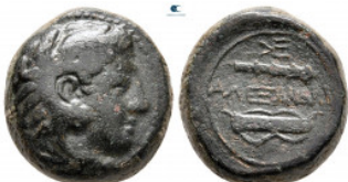
102 Kings of Macedon. Uncertain mint. Alexander III "the Great" 336-323 BC. Bronze Æ 18 mm, 8,74 g very fine 10