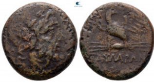
321 Pontos. Taulara circa 100-85 BC. Bronze Æ 24 mm, 17,89 g nearly very fine 10