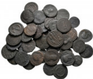
2508 Lot of ca. 40 late roman bronze coins / SOLD AS SEEN, NO RETURN! very fine 10