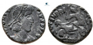
1996 Constantius II AD 347-355. Contemporary barbaric imitation Follis Æ 10 mm, 1,30 g very fine 10