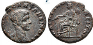
1062 Moesia Inferior. Marcianopolis. Diadumenian AD 218-218. Bronze Æ 19 mm, 4,76 g very fine 10