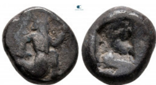
971 Persia. Achaemenid Empire. Sardeis. Time of Artaxerxes II to Artaxerxes III circa 375-340 BC. Siglos AR 14 mm, 5,40 g nearly very fine 10