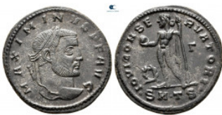
1907 Maximinus II Daia AD 310-313. Thessaloniki Follis Æ 25 mm, 4,98 g very fine 10