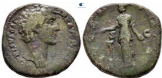
1436 Marcus Aurelius, as Caesar AD 139-161. Rome As Æ 27 mm, 10,75 g very fine 10