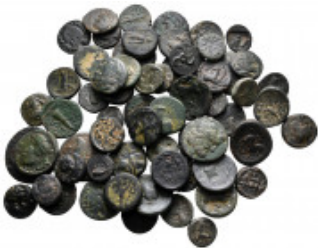
2468 Lot of ca. 60 greek bronze coins / SOLD AS SEEN, NO RETURN very fine 10