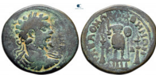
1297 Arabia. Rabbathmoba. Septimius Severus AD 193-211. Bronze Æ 30 mm, 14,12 g nearly very fine From the Tareq Hani collection 10