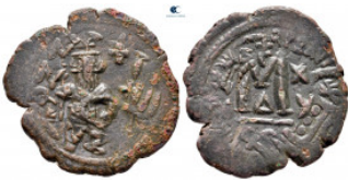
2160 Heraclius, with Heraclius Constantine and Heraclonas AD 610-641. Constantinople Follis or 40 Nummi Æ 33 mm, 11,18 g very fine, over struck 10