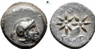
403 Mysia. Pergamon circa 310-284 BC. Bronze Æ 12 mm, 0,96 g very fine 10