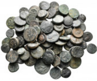
2451 Lot of ca. 100 greek bronze coins / SOLD AS SEEN, NO RETURN! nearly very fine 10