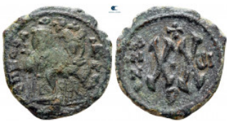
2152 Phocas, with Leontia AD 602-610. Theoupolis (Antioch) Half Follis or 20 Nummi Æ 22 mm, 4,92 g nearly very fine 10