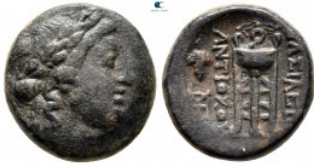
815 Seleukid Kingdom. Sardeis. Antiochos II Theos 261-246 BC. Bronze Æ 17 mm, 4,31 g very fine 10