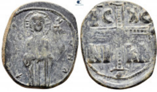
2237 Michael IV AD 1034-1041. Constantinople Anonymous Follis Æ 28 mm, 7,82 g very fine 10