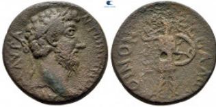
1111 Thessaly. Koinon of Thessaly. Marcus Aurelius AD 161-180. Bronze Æ 23 mm, 11,31 g fine 10