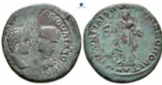
1056 Moesia Inferior. Marcianopolis. Caracalla, with Julia Domna AD 198-217. Bronze Æ 27 mm, 10,95 g nearly very fine 10