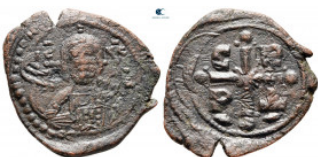
2252 Romanus IV, Diogenes AD 1068-1071. Constantinople Follis Æ 31 mm, 7,49 g very fine 10