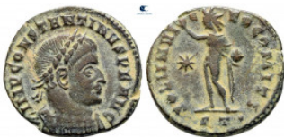
1876 Constantine I the Great AD 306-337. Ticinum Follis Æ 20 mm, 3,47 g nearly very fine From the Tareq Hani collection 10