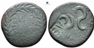
1338 Augustus 27 BC-AD 14. Rome As Æ 23 mm, 7,39 g fine 10