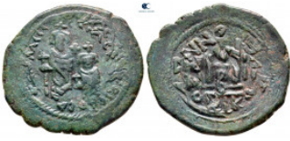
2158 Heraclius with Heraclius Constantine AD 610-641. Nikomedia Follis or 40 Nummi Æ 31 mm, 12,59 g very fine, overstruck 10