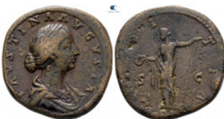
1443 Faustina II AD 147-175. Rome Sestertius Æ 32 mm, 23,45 g very fine 10