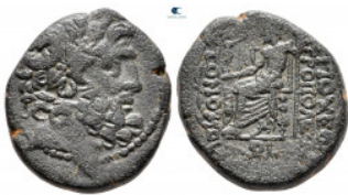
873 Seleucis and Pieria. Antioch circa 100-0 BC. Bronze Æ 20 mm, 7,88 g very fine 10