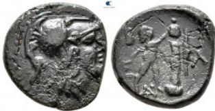
138 Kings of Macedon. Uncertain mint. Antigonos II Gonatas 277-239 BC. Bronze Æ 16 mm, 3,77 g very fine 10