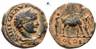
1275 Decapolis. Petra. Elagabal AD 218-222. Bronze Æ 21 mm, 5,23 g very fine From the Tareq Hani collection 10