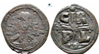
2244 Romanus IV, Diogenes AD 1068-1071. Constantinople Follis or 40 Nummi Æ 30 mm, 7,96 g nearly very fine 10