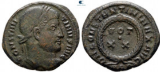
1847 Constantine I the Great AD 306-337. Aquileia Nummus Æ 20 mm, 2,56 g very fine 10