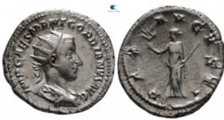
1656 Gordian III AD 238-244. Rome Antoninianus AR 23 mm, 4,67 g very fine 10