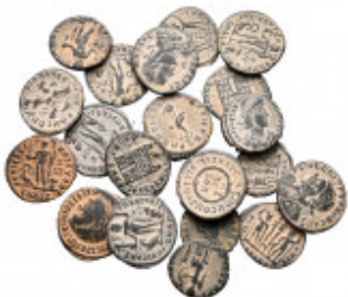
2496 Lot of ca. 20 late roman bronze coins / SOLD AS SEEN, NO RETURN! very fine 10