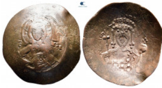
2269 Alexius I Comnenus AD 1081-1118. Constantinople Trachy Æ 30 mm, 3,67 g very fine 10