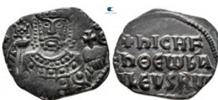
2205 Nicephorus II Phocas AD 963-969. Constantinople Follis or 40 Nummi Æ 22 mm, 4,03 g very fine 10