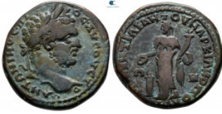
1054 Moesia Inferior. Marcianopolis. Caracalla AD 198-217. Bronze Æ 26 mm, 11,60 g very fine 10