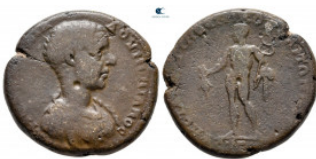
1099 Moesia Inferior. Nikopolis ad Istrum. Diadumenian AD 218-218. Bronze Æ 27 mm, 12,99 g nearly very fine 10