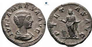
1521 Julia Maesa. Augusta AD 218-224. Rome Denarius AR 19 mm, 2,81 g very fine 10