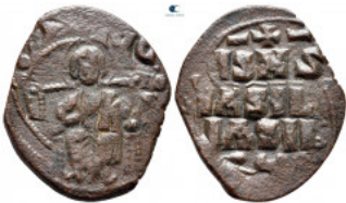
2238 Constantine IX Monomachus AD 1042-1055. Constantinople Anonymous Follis Æ 32 mm, 7,41 g very fine 10