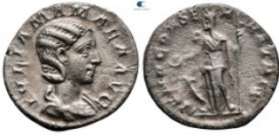
1542 Julia Mamaea. Augusta AD 225-235. Rome Denarius AR 17 mm, 2,09 g nearly very fine 10