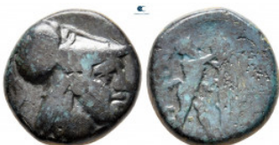
134 Kings of Macedon. Uncertain mint. Antigonos II Gonatas 277-239 BC. Bronze Æ 17 mm, 6,77 g fine 10