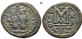
2120 Justin II and Sophia AD 565-578. Cyzicus Follis or 40 Nummi Æ 30 mm, 11,89 g very fine 10