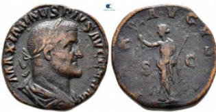
1545 Maximinus I Thrax AD 235-238. Rome Sestertius Æ 27 mm, 17,77 g very fine 10