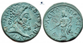
1080 Moesia Inferior. Nikopolis ad Istrum. Commodus AD 180-192. Bronze Æ 22 mm, 6,22 g very fine 10