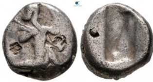
967 Persia. Achaemenid Empire. Sardeis. Time of Darios I to Xerxes II circa 485-420 BC. Siglos AR 13 mm, 5,48 g nearly very fine 10