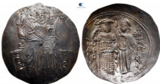
2360 Crusaders. Contemporary imitation AD 1246-1254. Imitating John III Trachy AE 28 mm, 3,32 g very fine 10