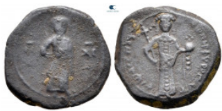
2279 John II Comnenus AD 1118-1143. Thessalonica Tetarteron Æ 20 mm, 3,58 g very fine 10