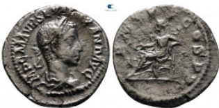
1532 Severus Alexander AD 222-235. Rome Denarius AR 19 mm, 1,49 g nearly very fine 10