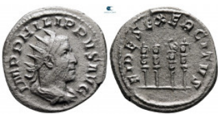
1683 Philip I Arab AD 244-249. Rome Antoninianus AR 22 mm, 3,66 g very fine 10