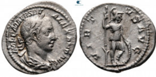
1526 Severus Alexander AD 222-235. Rome Denarius AR 18 mm, 2,73 g very fine 10