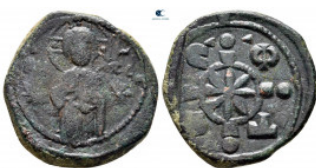
2268 Nicephorus III Botaniates AD 1078-1081. Constantinople Follis Æ 26 mm, 9,65 g very fine 10