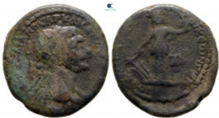
1274 Seleucia and Pieria. Laodicea ad Mare. Trajan AD 98-117. Bronze Æ 22 mm, 5,61 g nearly very fine 10