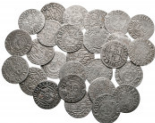
2547 Lot of ca. 27 silver coins / SOLD AS SEEN, NO RETURN very fine 10