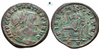
1840 Constantius I Chlorus AD 305-306. Ticinum Follis Æ 28 mm, 9,00 g very fine 10