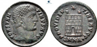
1855 Constantine I the Great AD 306-337. Cyzicus Follis Æ 19 mm, 2,26 g very fine 10