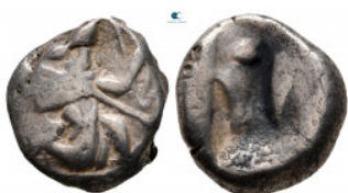
964 Persia. Achaemenid Empire. Sardeis. Time of Darios I to Xerxes I circa 500-485 BC. Siglos AR 13 mm, 5,43 g nearly very fine 10