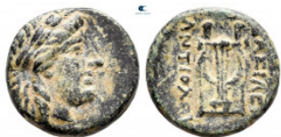
813 Seleukid Kingdom. Sardeis. Antiochos II Theos 261-246 BC. Bronze Æ 13 mm, 1,94 g very fine 10