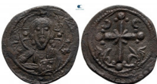
2267 Nicephorus III Botaniates AD 1078-1081. Constantinople Anonymous Follis Æ 26 mm, 3,26 g very fine 10