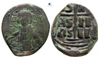
2235 Romanus III Argyrus AD 1028-1034. Constantinople Anonymous Follis Æ 31 mm, 10,79 g very fine 10