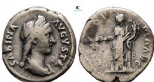
1413 Sabina. Augusta AD 128-137. Rome Denarius AR 17 mm, 3,01 g nearly very fine