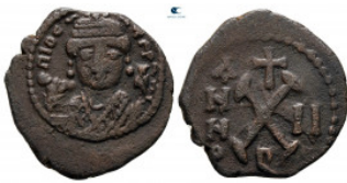
2144 Maurice Tiberius AD 582-602. Theoupolis (Antioch) Decanummium Æ 20 mm, 2,77 g very fine 10