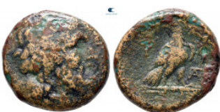
128 Kings of Macedon. Uncertain mint. Ptolemy Keraunos 281-279 BC. Bronze Æ 21 mm, 8,43 g fine 10