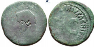
1343 Augustus 27 BC-AD 14. Rome As Æ 22 mm, 11,70 g fine