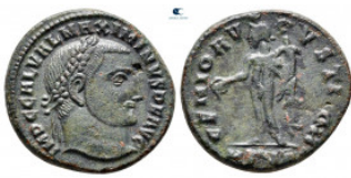
1904 Maximinus II Daia AD 310-313. Nicomedia Follis Æ 31 mm, 5,04 g very fine 10