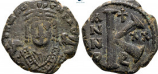
2140 Maurice Tiberius AD 582-602. Theoupolis (Antioch) Half Follis or 20 Nummi Æ 21 mm, 4,81 g very fine 10