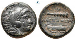
85 Kings of Macedon. Uncertain mint. Alexander III "the Great" 336-323 BC. Bronze Æ 17 mm, 7,19 g very fine 10