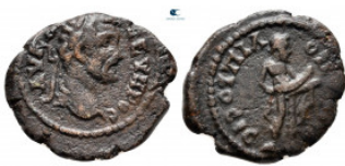
1083 Moesia Inferior. Nikopolis ad Istrum. Septimius Severus AD 193-211. Bronze Æ 20 mm, 3,49 g very fine 10