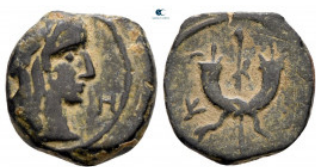
962 Nabataean Kingdom. Petra. Syllaios 9 BC-AD 40. Bronze Æ 14 mm, 2,07 g very fine From the Tareq Hani collection 10