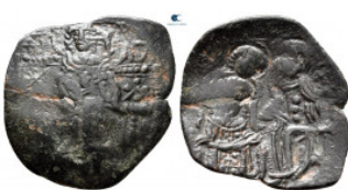
2332 Michael VIII Palaeologus AD 1261-1282. Constantinople Trachy Æ 25 mm, 1,72 g very fine 10