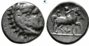
153 Kings of Macedon. Uncertain mint. Philip V 221-179 BC. Bronze Æ 16 mm, 3,82 g very fine 10