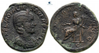
1680 Otacilia Severa AD 244-249. Rome Sestertius Æ 30 mm, 16,51 g nearly very fine 10