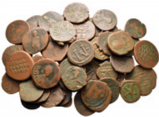
2523 Lot of ca. 50 byzantine bronze coins / SOLD AS SEEN, NO RETURN! nearly very fine 10