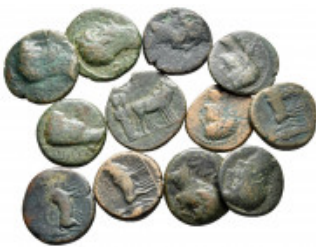
2485 Lot of ca. 12 roman provincial bronze coins / SOLD AS SEEN, NO RETURN! very fine 10