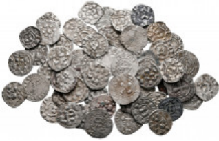
2538 Lot of ca. 60 medieval silver coins / SOLD AS SEEN, NO RETURN very fine 10