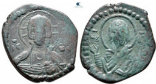
2249 Romanus IV, Diogenes AD 1068-1071. Constantinople Anonymous Follis Æ 25 mm, 5,88 g very fine 10