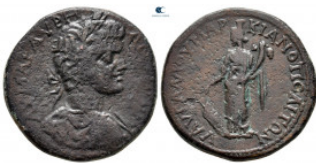
1064 Moesia Inferior. Marcianopolis. Elagabal AD 218-222. Bronze Æ 28 mm, 11,97 g very fine 10