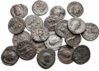
2493 Lot of ca. 20 roman antoniniani / SOLD AS SEEN, NO RETURN! very fine 10