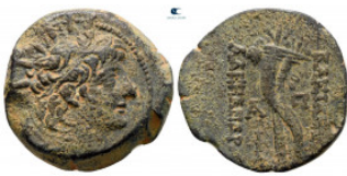
852 Seleukid Kingdom. Antioch on the Orontes. Alexander II Zabinas 128-122 BC. Bronze Æ 22 mm, 8,78 g very fine From the Tareq Hani collection 10