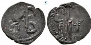
2345 Andronicus II Palaeologus, with Michael IX AD 1282-1328. Constantinople Assarion Æ 20 mm, 1,62 g very fine 10