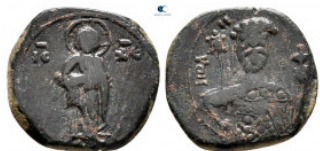
2280 John II Comnenus AD 1118-1143. Thessalonica Half Tetarteron Æ 14 mm, 1,96 g very fine 10