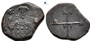
2296 Manuel I Comnenus AD 1143-1180. Uncertain mint Half Tetarteron Æ 19 mm, 1,87 g very fine 10