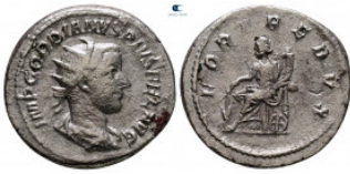
1654 Gordian III AD 238-244. Rome Antoninianus AR 23 mm, 4,74 g very fine 10