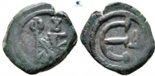
2119 Justin II and Sophia AD 565-578. Constantinople Pentanummium Æ 13 mm, 1,63 g very fine 10