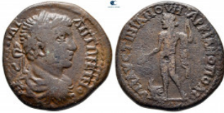
1055 Moesia Inferior. Marcianopolis. Caracalla AD 198-217. Bronze Æ 27 mm, 11,28 g nearly very fine 10