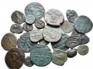
2525 Lot of ca. 24 byzantine bronze coins / SOLD AS SEEN, NO RETURN! very fine 10