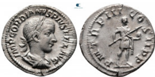
1548 Gordian III AD 238-244. Rome Denarius AR 19 mm, 2,88 g very fine 10