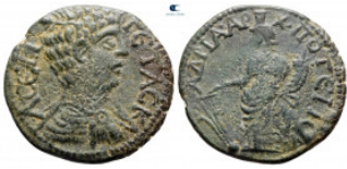
1206 Phrygia. Hadrianopolis. Geta, as Caesar AD 197-209. Bronze Æ 20 mm, 5,54 g very fine 10