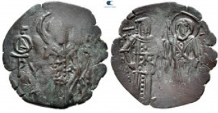
2333 Michael VIII Palaeologus AD 1261-1282. Magnesia Trachy Æ 21 mm, 1,71 g very fine 10