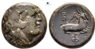
150 Kings of Macedon. Pella or Amphipolis. Philip V 221-179 BC. Bronze Æ 17 mm, 8,08 g nearly very fine 10