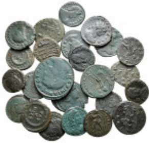
2510 Lot of ca. 24 late roman bronze coins / SOLD AS SEEN, NO RETURN! very fine 10