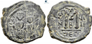
2159 Heraclius with Heraclius Constantine AD 610-641. Thessalonica Follis Æ 33 mm, 11,19 g very fine 10