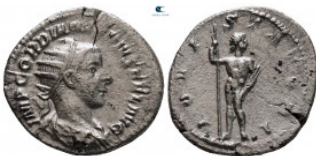
1665 Gordian III AD 238-244. Rome Antoninianus AR 23 mm, 4,19 g very fine 10