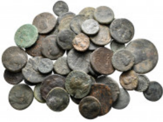
2478 Lot of ca. 50 roman provincial bronze coins / SOLD AS SEEN, NO RETURN! very fine 10