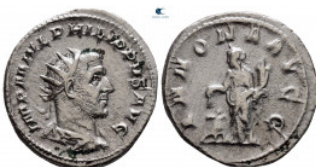
1717 Philip I Arab AD 244-249. Rome Antoninianus AR 23 mm, 3,71 g very fine 10