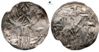
2373 Bulgaria. Second empire. Ivan Aleksandar AD 1331-1371. Groš AR 19 mm, 1,19 g very fine 10