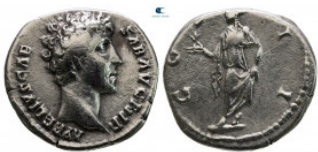
1435 Marcus Aurelius, as Caesar AD 139-161. Rome Denarius AR 18 mm, 3,08 g very fine 10