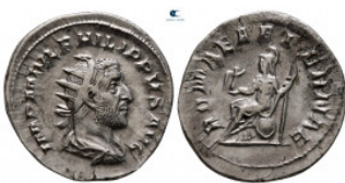
1715 Philip I Arab AD 244-249. Rome Antoninianus AR 23 mm, 3,87 g very fine 10