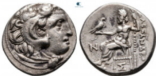
76 Kings of Macedon. Kolophon. Alexander III "the Great" 336-323 BC. Drachm AR 17 mm, 4,25 g very fine 10