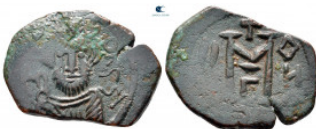
2395 Umayyad Caliphate. Time of 'Abd al-Malik ibn Marwan AH 65-86. Fals AE 25 mm, 4,82 g very fine 10