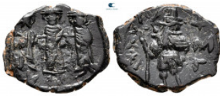
2167 Constans II, with Constantine IV, Heraclius, and Tiberius AD 641-668. Constantinople Follis or 40 Nummi Æ 22 mm, 3,20 g very fine 10