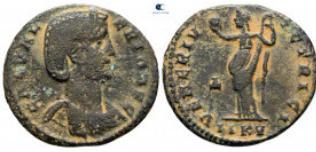
1838 Galeria Valeria AD 293-311. Cyzicus Follis Æ 26 mm, 5,35 g nearly very fine From the Tareq Hani collection 10