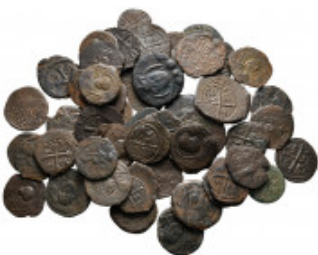
2536 Lot of ca. 50 medieval bronze coins / SOLD AS SEEN, NO RETURN very fine 10