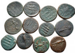
2486 Lot of ca. 12 roman provincial bronze coins / SOLD AS SEEN, NO RETURN! very fine 10