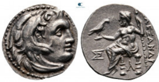
75 Kings of Macedon. Kolophon. Alexander III "the Great" 336-323 BC. Drachm AR 17 mm, 4,32 g good very fine 10