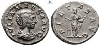
1519 Julia Maesa. Augusta AD 218-224. Rome Denarius AR 18 mm, 3,41 g good very fine 10