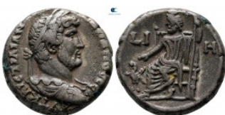
1300 Egypt. Alexandria. Hadrian AD 117-138. Billon-Tetradrachm 24 mm, 13,49 g very fine 10