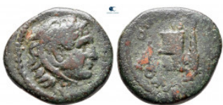
1211 Phrygia. Keretapa. Pseudo-autonomous issue AD 193-235. Bronze Æ 19 mm, 4,84 g nearly very fine 10