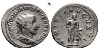
1661 Gordian III AD 238-244. Rome Antoninianus AR 23 mm, 3,68 g very fine 10