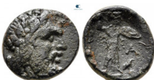
159 Kings of Macedon. Uncertain mint. Philip V 221-179 BC. Bronze Æ 18 mm, 3,82 g very fine 10