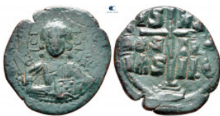
2234 Romanus III Argyrus AD 1028-1034. Constantinople Anonymous Follis Æ 28 mm, 6,48 g very fine 10