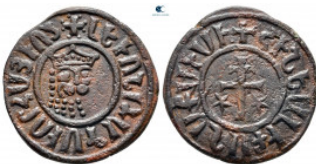
2379 Cilician Armenia. Royal. Levon I AD 1198-1219. Tank Æ 28 mm, 7,25 g very fine 10