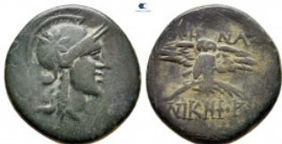
406 Mysia. Pergamon circa 200-133 BC. Bronze Æ 18 mm, 3,37 g very fine 10