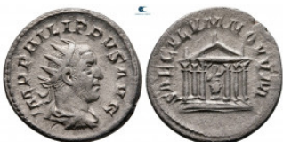
1684 Philip I Arab AD 244-249. Rome Antoninianus AR 20 mm, 3,52 g very fine 10