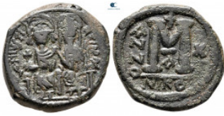
2126 Justin II and Sophia AD 565-578. Nikomedia Follis or 40 Nummi Æ 27 mm, 13,48 g very fine 10