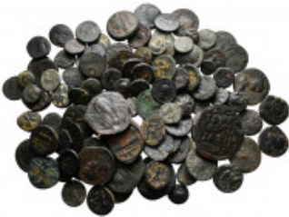
2467 Lot of ca. 122 ancient bronze coins / SOLD AS SEEN, NO RETURN very fine 10