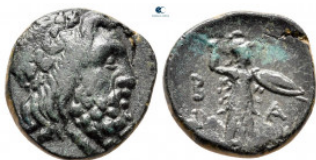
151 Kings of Macedon. Uncertain mint. Philip V 221-179 BC. Bronze Æ 17 mm, 3,54 g very fine 10