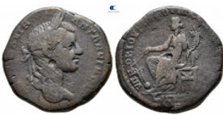
1104 Moesia Inferior. Nikopolis ad Istrum. Elagabal AD 218-222. Bronze Æ 27 mm, 12,97 g nearly very fine 10