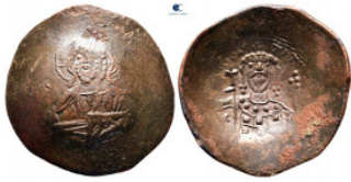
2277 John II Comnenus AD 1118-1143. Constantinople Trachy Æ 27 mm, 4,16 g very fine 10