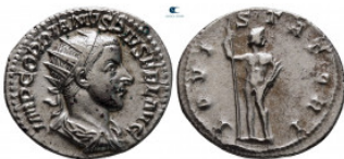
1657 Gordian III AD 238-244. Rome Antoninianus AR 22 mm, 4,04 g very fine 10