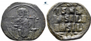
2240 Constantine IX Monomachus AD 1042-1055. Constantinople Anonymous Follis Æ 27 mm, 8,78 g very fine 10