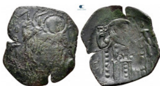
2322 Michael VIII Palaeologus AD 1261-1282. Constantinople Trachy Æ 25 mm, 1,61 g very fine 10