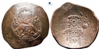
2283 Manuel I Comnenus AD 1143-1180. Constantinople Trachy Æ 30 mm, 5,21 g very fine 10