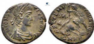
1997 Constantius II AD 347-355. Cyzicus Follis Æ 18 mm, 2,37 g nearly very fine 10