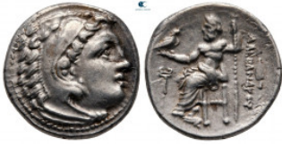
73 Kings of Macedon. Kolophon. Alexander III "the Great" 336-323 BC. Drachm AR 18 mm, 4,34 g very fine 10