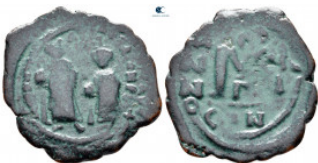
2155 Heraclius with Heraclius Constantine AD 610-641. Constantinople Follis or 40 Nummi Æ 33 mm, 6,92 g nearly very fine 10