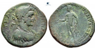
1105 Moesia Inferior. Nikopolis ad Istrum. Elagabal AD 218-222. Bronze Æ 17 mm, 11,16 g nearly very fine 10