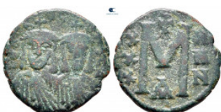
2173 Leo III the "Isaurian", with Constantine V AD 717-741. Constantinople Follis or 40 Nummi Æ 18 mm, 3,82 g fine 10