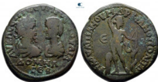
1050 Moesia Inferior. Marcianopolis. Septimius Severus - Julia Domna AD 193-211. Bronze Æ 26 mm, 14,45 g very fine 10