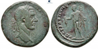
1094 Moesia Inferior. Nikopolis ad Istrum. Macrinus AD 217-218. Statius Longinus, consular legate Bronze Æ 28 mm, 12,05 g nearly very fine 10