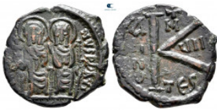
2129 Justin II and Sophia AD 565-578. Thessalonica Half Follis or 20 Nummi Æ 20 mm, 4,42 g very fine 10