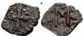
2164 Constans II AD 641-668. Constantinople Follis or 40 Nummi Æ 23 mm, 4,24 g very fine 10