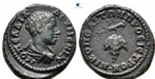
1100 Moesia Inferior. Nikopolis ad Istrum. Diadumenian AD 218-218. Bronze Æ 20 mm, 3,91 g very fine 10