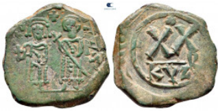
2150 Phocas, with Leontia AD 602-610. Cyzicus Half Follis or 20 Nummi Æ 24 mm, 5,78 g very fine 10