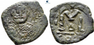
2170 Leontius AD 695-698. Constantinople Follis or 40 Nummi Æ 22 mm, 5,80 g very fine 10