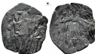
2331 Michael VIII Palaeologus AD 1261-1282. Constantinople Trachy Æ 23 mm, 1,71 g very fine 10