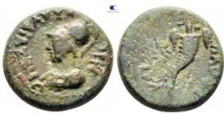
1219 Phrygia. Laodikeia ad Lycum. Pseudo-autonomous issue AD 79-96. Bronze Æ 17 mm, 3,68 g very fine 10