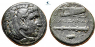
84 Kings of Macedon. Uncertain mint. Alexander III "the Great" 336-323 BC. Bronze Æ 15 mm, 5,04 g very fine 10