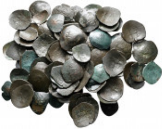
2531 Lot of ca. 100 byzantine scyphate coins / SOLD AS SEEN, NO RETURN! fine 10