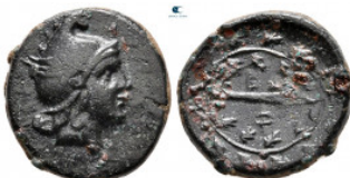
156 Kings of Macedon. Uncertain mint. Philip V 221-179 BC. Bronze Æ 18 mm, 3,98 g very fine 10