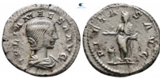
1520 Julia Maesa. Augusta AD 218-224. Rome Denarius AR 20 mm, 2,54 g very fine 10