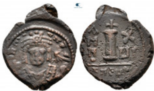
2146 Maurice Tiberius AD 582-602. Theoupolis (Antioch) Decanummium Æ 21 mm, 3,33 g very fine 10