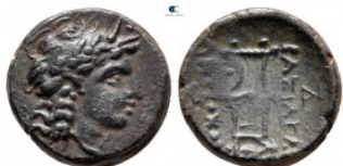
811 Seleukid Kingdom. Sardeis. Antiochos II Theos 261-246 BC. Bronze Æ 12 mm, 2,34 g very fine 10