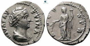
1439 Diva Faustina I AD 140-141. Rome Denarius AR 18 mm, 3,19 g good very fine 10