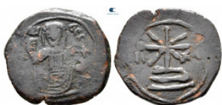
2292 Manuel I Comnenus AD 1143-1180. Thessalonica Tetarteron Æ 22 mm, 2,87 g nearly very fine 10