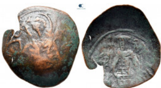
2339 Andronicus II Palaeologus AD 1282-1328. Thessalonica Trachy Æ 24 mm, 1,55 g fine 10