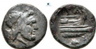
158 Kings of Macedon. Uncertain mint. Philip V 221-179 BC. Bronze Æ 15 mm, 2,95 g very fine 10