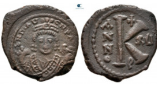
2141 Maurice Tiberius AD 582-602. Theoupolis (Antioch) Half Follis or 20 Nummi Æ 25 mm, 5,15 g very fine 10