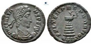
1973 Constans AD 337-350. Siscia Follis Æ 18 mm, 2,48 g very fine 10