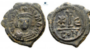
2137 Maurice Tiberius AD 582-602. Constantinople Decanummium Æ 19 mm, 2,64 g very fine 10