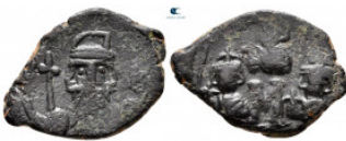
2168 Constans II, with Constantine IV, Heraclius, and Tiberius AD 641-668. Constantinople Follis or 40 Nummi Æ 25 mm, 4,88 g very fine 10