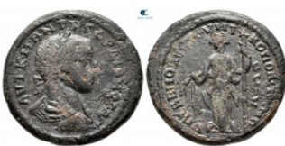
1107 Moesia Inferior. Nikopolis ad Istrum. Gordian III AD 238-244. Bronze Æ 29 mm, 12,78 g nearly very fine 10