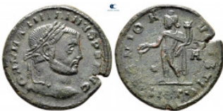
1843 Galerius Maximianus AD 305-311. Thessaloniki Follis Æ 26 mm, 6,81 g very fine 10