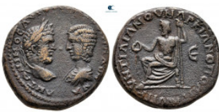
1059 Moesia Inferior. Marcianopolis. Caracalla, with Julia Domna AD 198-217. Bronze Æ 27 mm, 13,91 g very fine 10