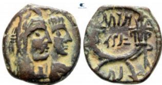
961 Nabataean Kingdom. Petra. Aretas IV, with Shaqilat 9 BC-AD 40. Bronze Æ 19 mm, 4,08 g very fine From the Tareq Hani collection 10