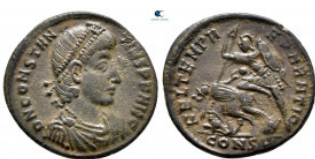
1995 Constantius II AD 347-355. Constantinople Follis Æ 19 mm, 1,82 g very fine 10