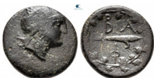
152 Kings of Macedon. Uncertain mint. Philip V 221-179 BC. Bronze Æ 16 mm, 3,75 g very fine 10