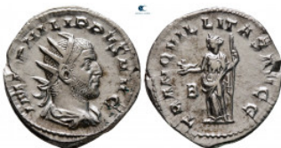
1708 Philip I Arab AD 244-249. Rome Antoninianus AR 23 mm, 3,85 g good very fine 10