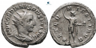
1648 Gordian III AD 238-244. Rome Antoninianus AR 23 mm, 4,82 g very fine 10