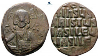
2210 Attributed to Basil II and Constantine VIII AD 976-1028. Constantinople Anonymous Follis Æ 30 mm, 10,16 g very fine 10