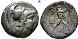
130 Kings of Macedon. Uncertain mint. Antigonos II Gonatas 277-239 BC. Bronze Æ 17 mm, 4,18 g very fine 10