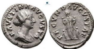
1441 Faustina II AD 147-175. Rome Denarius AR 18 mm, 2,94 g very fine 10