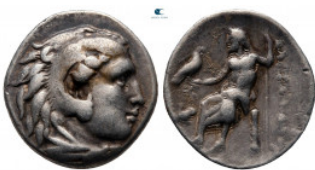
78 Kings of Macedon. Lampsakos. Alexander III "the Great" 336-323 BC. Drachm AR 18 mm, 4,25 g very fine 10