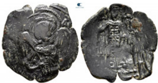
2336 Michael VIII Palaeologus AD 1261-1282. Thessalonica Trachy Æ 24 mm, 2,17 g very fine 10