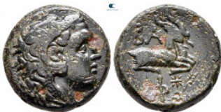
148 Kings of Macedon. Pella or Amphipolis. Philip V 221-179 BC. Bronze Æ 20 mm, 8,91 g very fine 10