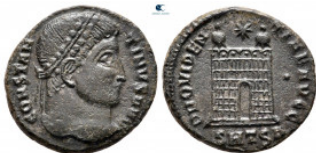
1874 Constantine I the Great AD 306-337. Thessaloniki Follis Æ 17 mm, 3,26 g very fine 10