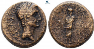
1215 Phrygia. Laodikeia ad Lycum. Augustus 27 BC-AD 14. Bronze Æ 18 mm, 7,02 g fine 10