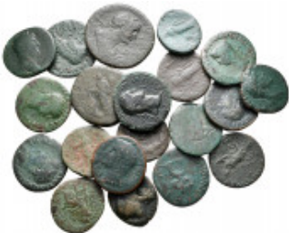
2492 Lot of ca. 20 roman coins / SOLD AS SEEN, NO RETURN! nearly very fine 10