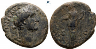
1433 Antoninus Pius AD 138-161. Rome As Æ 25 mm, 9,21 g nearly very fine 10