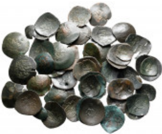
2533 Lot of ca. 58 byzantine scyphate coins / SOLD AS SEEN, NO RETURN! nearly very fine 10