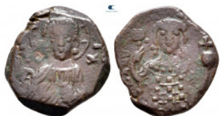
2288 Manuel I Comnenus AD 1143-1180. Constantinople Tetarteron Æ 18 mm, 3,19 g very fine 10