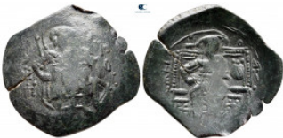
2310 Latin Rulers of Constantinople AD 1204-1261. Constantinople Trachy Æ 28 mm, 3,94 g very fine 10