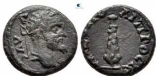
1084 Moesia Inferior. Nikopolis ad Istrum. Septimius Severus AD 193-211. Bronze Æ 16 mm, 2,80 g very fine 10