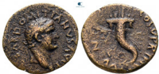
1377 Domitian AD 81-96. Uncertain mint in Asia minor, possibly Ephesos Semis Æ 16 mm, 1,52 g nearly very fine 10