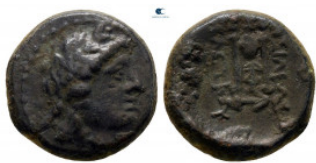
809 Seleukid Kingdom. Sardeis. Antiochos II Theos 261-246 BC. Bronze Æ 13 mm, 2,37 g nearly very fine 10