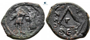
2153 Heraclius AD 610-641. Thessalonica 30 Nummi Æ 26 mm, 6,04 g very fine 10