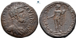
1049 Moesia Inferior. Marcianopolis. Septimius Severus AD 193-211. Bronze Æ 28 mm, 11,02 g nearly very fine 10