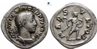
1533 Severus Alexander AD 222-235. Rome Denarius AR 20 mm, 2,54 g very fine 10