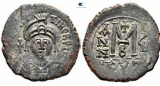
2138 Maurice Tiberius AD 582-602. Cyzicus Follis or 40 Nummi Æ 30 mm, 11,97 g very fine 10