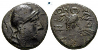
405 Mysia. Pergamon circa 200-133 BC. Bronze Æ 15 mm, 2,71 g very fine 10