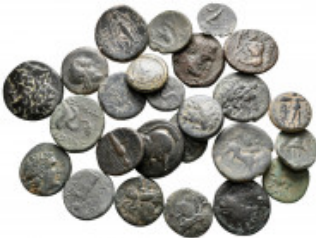
2458 Lot of ca. 25 greek bronze coins / SOLD AS SEEN, NO RETURN! very fine 10