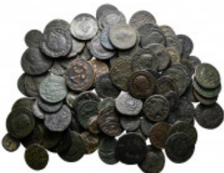
2519 Lot of ca. 105 ancient bronze coins / SOLD AS SEEN, NO RETURN very fine 10