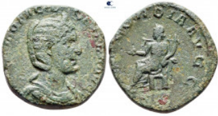
1679 Otacilia Severa AD 244-249. Rome Sestertius Æ 26 mm, 15,74 g nearly very fine 10