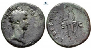
1378 Nerva AD 96-98. Rome As Æ 27 mm, 9,76 g nearly very fine 10