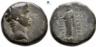
1218 Phrygia. Laodikeia ad Lycum. Tiberius AD 14-37. Dioskourides, magistrate Bronze Æ 20 mm, 5,72 g nearly very fine 10