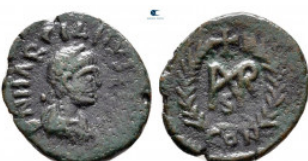
2077 Marcian AD 450-457. Constantinople Nummus Æ 12 mm, 0,76 g very fine 10