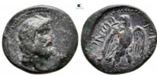
1108 Moesia Inferior. Tomis. Pseudo-autonomous issue circa AD 1-100. Bronze Æ 21 mm, 4,95 g very fine 10