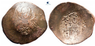
2285 Manuel I Comnenus AD 1143-1180. Constantinople Trachy Æ 28 mm, 3,68 g very fine 10