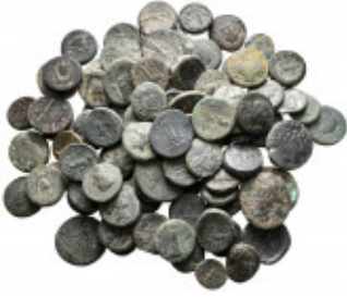
2450 Lot of ca. 100 greek bronze coins / SOLD AS SEEN, NO RETURN! nearly very fine 10