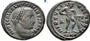
1903 Maximinus II Daia AD 310-313. Cyzicus Nummus Æ 20 mm, 5,68 g very fine 10