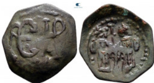
2376 Bulgaria. Veliko Turnovo mint. Second Empire. Ivan Aleksandar AD 1331-1371. Trachy AE 20 mm, 1,10 g nearly very fine 10