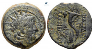
854 Seleukid Kingdom. Antioch on the Orontes. Alexander II Zabinas 128-122 BC. Bronze Æ 21 mm, 7,21 g very fine From the Tareq Hani collection 10