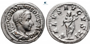
1549 Gordian III AD 238-244. Rome Denarius AR 20 mm, 3,24 g good very fine 10