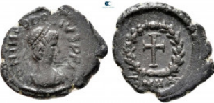
2071 Theodosius II AD 402-450. Heraclea Nummus Æ 16 mm, 1,40 g nearly very fine 10