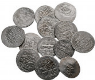
2541 Lot of ca. 13 islamic silver coins / SOLD AS SEEN, NO RETURN! very fine 10