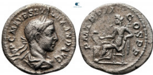
1529 Severus Alexander AD 222-235. Rome Denarius AR 18 mm, 2,23 g very fine 10