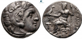
74 Kings of Macedon. Kolophon. Alexander III "the Great" 336-323 BC. Drachm AR 17 mm, 4,51 g very fine 10