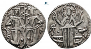
2375 Bulgaria. Second Empire. Ivan Aleksandar AD 1331-1371. Groš AR 18 mm, 1,42 g good very fine 10