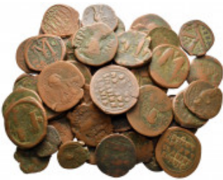
2522 Lot of ca. 50 byzantine bronze coins / SOLD AS SEEN, NO RETURN! nearly very fine 10