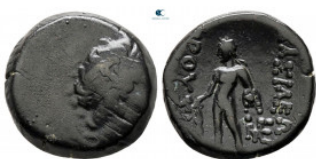
326 Kings of Bithynia. Prusias II Cynegos 182-149 BC. Bronze Æ 14 mm, 3,42 g very fine 10