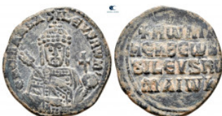
2204 Romanus I Lecapenus AD 920-944. Constantinople Follis Æ 24 mm, 7,02 g very fine 10