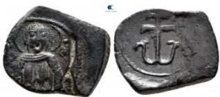
2313 Latin Rulers of Constantinople AD 1204-1261. Thessalonica Half Tetarteron Æ 17 mm, 2,13 g very fine 10