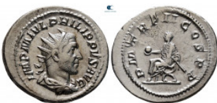
1706 Philip I Arab AD 244-249. Rome Antoninianus AR 25 mm, 4,34 g very fine 10