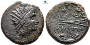
154 Kings of Macedon. Uncertain mint. Philip V 221-179 BC. Bronze Æ 25 mm, 13,21 g very fine 10