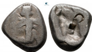
963 Persia. Achaemenid Empire. Sardeis. Time of Darios I to Xerxes I 500-485 BC. Siglos AR 15 mm, 5,37 g fine, countermarked 10