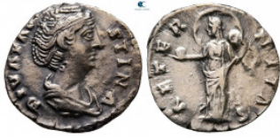
1438 Diva Faustina I AD 140-141. Rome Denarius AR 15 mm, 2,95 g very fine 10