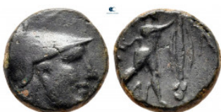
144 Kings of Macedon. Uncertain mint. Antigonos II Gonatas 277-239 BC. Bronze Æ 14 mm, 2,82 g very fine 10