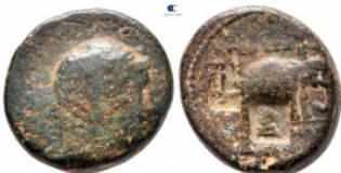
829 Seleukid Kingdom. Uncertain military mint. Antiochos III Megas 223-187 BC. Bronze Æ 21 mm, 9,58 g fine, countermarked 10