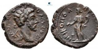
1081 Moesia Inferior. Nikopolis ad Istrum. Commodus AD 180-192. Bronze Æ 19 mm, 3,13 g very fine 10