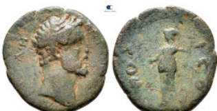
1245 Lykaonia. Iconium. Antoninus Pius AD 138-161. Bronze Æ 18 mm, 2,69 g nearly very fine 10