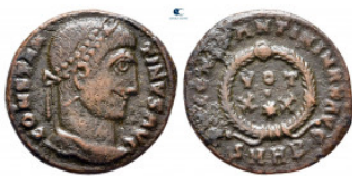
1856 Constantine I the Great AD 306-337. Heraclea Follis Æ 19 mm, 2,57 g very fine 10