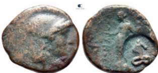
821 Seleukid Kingdom. Sardeis. Seleukos II Kallinikos 246-226 BC. Bronze Æ 19 mm, 3,96 g fine 10