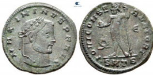
1906 Maximinus II Daia AD 310-313. Thessaloniki Follis Æ 24 mm, 5,00 g very fine 10