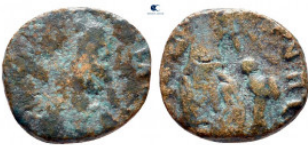
2073 Johannes AD 423-425. Rome Nummus Æ 11 mm, 0,87 g fine 10