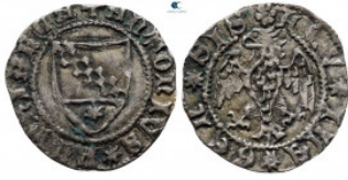
2365 Italy. Aquileia. Antonio II Panciera di Portogruaro AD 1402-1412. Denaro AR 17 mm, 0,61 g very fine 10