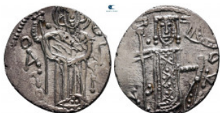
2291 Manuel I Comnenus AD 1143-1180. Constantinople Asper AR 22 mm, 2,94 g very fine 10