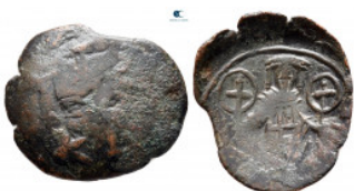
2340 Andronicus II Palaeologus AD 1282-1328. Thessalonica Trachy Æ 20 mm, 1,96 g nearly very fine 10