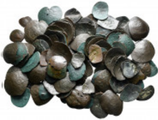
2532 Lot of ca. 124 byzantine scyphate coins / SOLD AS SEEN, NO RETURN! fine 10