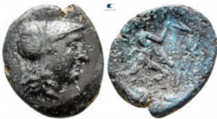
133 Kings of Macedon. Uncertain mint. Antigonos II Gonatas 277-239 BC. Bronze Æ 21 mm, 4,38 g nearly very fine 10