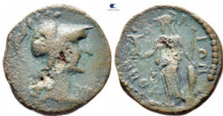
1113 Attica. Athens. Pseudo-autonomous issue circa AD 120-150. Bronze Æ 22 mm, 5,18 g nearly very fine 10