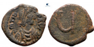
2133 Tiberius II Constantine AD 578-582. Constantinople Pentanummium Æ 18 mm, 1,87 g very fine 10