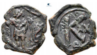
2157 Heraclius with Heraclius Constantine AD 610-641. Constantinople Half Follis or 20 Nummi Æ 22 mm, 5,03 g very fine 10