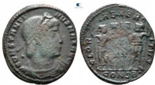
1850 Constantine I the Great AD 306-337. Constantinople Follis Æ 17 mm, 1,55 g nearly very fine 10