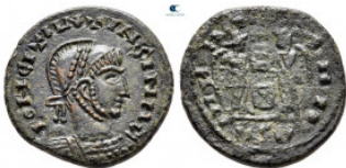
1881 Constantine I the Great AD 306-337. Contemporary imitation. Uncertain mint Nummus Æ 18 mm, 2,87 g very fine 10