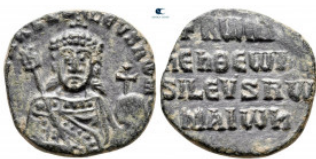
2203 Romanus I Lecapenus AD 920-944. Constantinople Follis Æ 21 mm, 5,81 g very fine 10