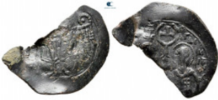
2334 Michael VIII Palaeologus AD 1261-1282. Thessalonica Trachy Æ 29 mm, 1,81 g very fine 10