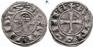
2358 Principality of Antioch. Antioch. Bohemond III AD 1163-1201. Denier AR 20 mm, 0,93 g very fine 10