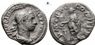
1523 Severus Alexander AD 222-235. Rome Denarius AR 18 mm, 2,54 g nearly very fine 10