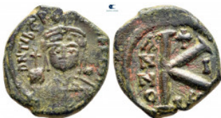
2148 Maurice Tiberius AD 582-602. Thessalonica Half Follis or 20 Nummi Æ 21 mm, 5,63 g very fine 10