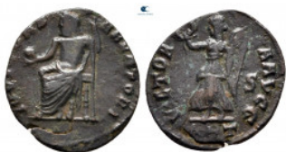
1908 Time of Maximinus II AD 310-313. Antioch Follis Æ, "Persecution" issue 16 mm, 1,02 g nearly very fine 10