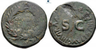
1334 Augustus 27 BC-AD 14. Rome Dupondius Æ 25 mm, 10,15 g nearly very fine 10