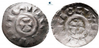
2361 Italy. Venice. Orio Malipiero AD 1178-1192. Piccolo AR 13 mm, 0,34 g nearly very fine 10