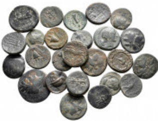
2457 Lot of ca. 25 greek bronze coins / SOLD AS SEEN, NO RETURN! very fine 10