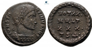
1872 Constantine I the Great AD 306-337. Thessaloniki Follis Æ 18 mm, 3,04 g very fine 10