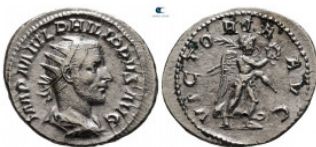
1707 Philip I Arab AD 244-249. Rome Antoninianus AR 24 mm, 3,94 g very fine 10