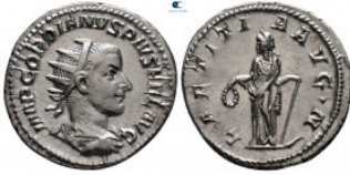
1662 Gordian III AD 238-244. Rome Antoninianus AR 23 mm, 3,85 g good very fine 10