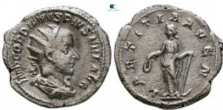
1653 Gordian III AD 238-244. Rome Antoninianus AR 23 mm, 3,74 g very fine 10