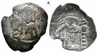
2311 Latin Rulers of Constantinople AD 1204-1261. Constantinople Trachy Æ 25 mm, 1,94 g very fine 10