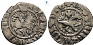
2393 Cilician Armenia. Levon III AD 1301-1307. Takvorin AR 21 mm, 2,38 g very fine 10