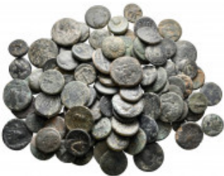
2453 Lot of ca. 100 greek bronze coins / SOLD AS SEEN, NO RETURN! nearly very fine 10