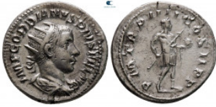
1646 Gordian III AD 238-244. Rome Antoninianus AR 22 mm, 3,56 g very fine 10