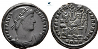
1852 Constantine I the Great AD 306-337. Constantinople Nummus Æ 18 mm, 3,42 g very fine 10