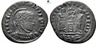
1870 Constantine I the Great AD 306-337. Contemporary imitation. Siscia Nummus Æ 19 mm, 2,75 g very fine 10