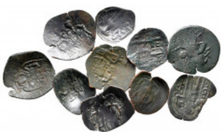
2535 Lot of ca. 10 byzantine scyphate coins / SOLD AS SEEN, NO RETURN! very fine 10