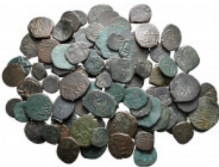
2545 Lot of ca. 90 islamic bronze coins / SOLD AS SEEN, NO RETURN! very fine 10