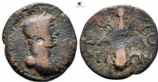
1114 Laconia. Lakedaemon (Sparta). Hadrian AD 117-138. Assarion Æ 19 mm, 3,51 g nearly very fine 10