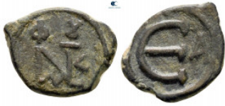
2118 Justin II and Sophia AD 565-578. Constantinople Pentanummium Æ 16 mm, 1,74 g very fine 10