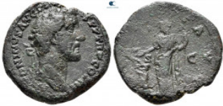
1431 Antoninus Pius AD 138-161. Rome As Æ 26 mm, 10,10 g nearly very fine 10