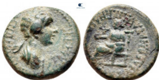
1204 Phrygia. Eumeneia - Fulvia. Agrippina II AD 50-59. Bronze Æ 17 mm, 3,54 g very fine 10