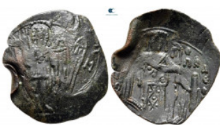
2330 Michael VIII Palaeologus AD 1261-1282. Constantinople Trachy Æ 26 mm, 1,82 g very fine 10