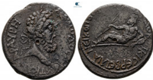
1082 Moesia Inferior. Nikopolis ad Istrum. Commodus AD 180-192. Caecilius Servilianus, legatus augusti pro praetore provinciae Thraciae, circa AD 188-192 Bronze Æ 27 mm, 12,37 g very fine 10