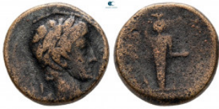
1198 Phrygia. Apameia. Gaius Caesar 20 BC-AD 4. Bronze Æ 13 mm, 3,20 g fine 10