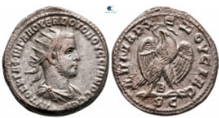
1272 Seleucia and Pieria. Antioch. Volusian AD 251-253. Billon-Tetradrachm 27 mm, 14,00 g very fine 10