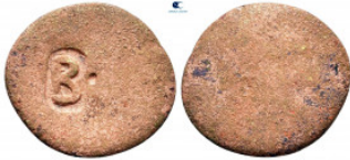
1335 Augustus 27 BC-AD 14. Rome As Æ 20 mm, 2,32 g fine 10