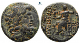
865 Seleucis and Pieria. Antioch circa 100-0 BC. Bronze Æ 23 mm, 11,75 g very fine From the Tareq Hani collection 10