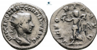
1649 Gordian III AD 238-244. Rome Antoninianus AR 22 mm, 3,95 g nearly very fine 10