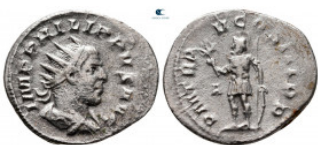
1685 Philip I Arab AD 244-249. Rome Antoninianus AR 24 mm, 4,01 g very fine 10