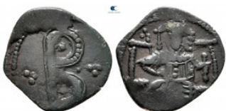
2314 AD 1222-1254. Anonymous, but period of John III Ducas-Vatatzes, emperor of Nicaea. Magnesia Tetarteron Æ 17 mm, 1,61 g very fine 10