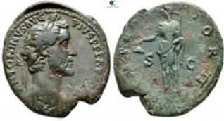
1430 Antoninus Pius AD 138-161. Rome As Æ 27 mm, 8,60 g very fine 10