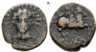
323 Bithynia. Apameia-Myrleia circa 400-200 BC. Bronze Æ 14 mm, 4,11 g nearly very fine 10