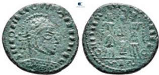
1882 Constantine I the Great AD 306-337. Contemporary imitation. Uncertain mint Nummus Æ 17 mm, 2,59 g nearly very fine 10