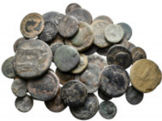
2480 Lot of ca. 50 roman provincial bronze coins / SOLD AS SEEN, NO RETURN! nearly very fine 10