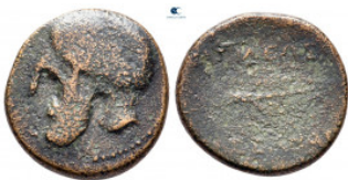
125 Kings of Macedon. Uncertain mint. Kassander 306-297 BC. Bronze Æ 17 mm, 3,56 g fine 10