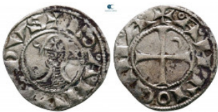
2359 Principality of Antioch. Antioch. Bohemond III AD 1163-1201. Denier AR 17 mm, 0,82 g very fine 10