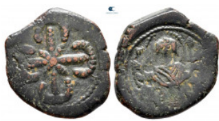
2319 Empire of Nicaea. Anonymous AD 1227-1261. Magnesia Tetarteron Æ 17 mm, 2,44 g very fine 10