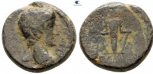
1199 Phrygia. Apameia. Gaius Caesar 20 BC-AD 4. Bronze Æ 16 mm, 4,32 g nearly very fine 10