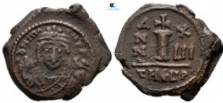
2143 Maurice Tiberius AD 582-602. Theoupolis (Antioch) Decanummium Æ 20 mm, 3,23 g very fine 10