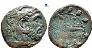
160 Kings of Macedon. Uncertain mint. Philip V 221-179 BC. Bronze Æ 22 mm, 7,64 g nearly very fine 10