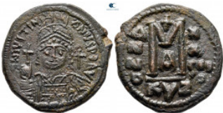
2105 Justinian I AD 527-565. Cyzicus Follis or 40 Nummi Æ 32 mm, 17,38 g very fine 10