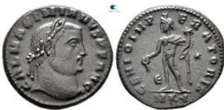
1841 Galerius Maximianus AD 305-311. Cyzicus Follis Æ 26 mm, 7,13 g very fine 10