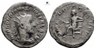
1666 Gordian III AD 238-244. Rome Antoninianus AR 22 mm, 1,76 g nearly very fine 10