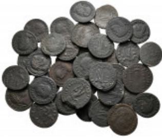
2504 Lot of ca. 40 late roman bronze coins / SOLD AS SEEN, NO RETURN! very fine 10