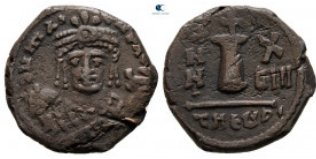
2142 Maurice Tiberius AD 582-602. Theoupolis (Antioch) Decanummium Æ 17 mm, 2,72 g very fine 10