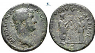
1408 Hadrian AD 117-138. Rome As Æ 25 mm, 11,08 g nearly very fine