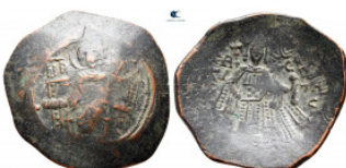
2300 Isaac II Angelos AD 1185-1195. Constantinople Trachy Æ 26 mm, 3,93 g very fine 10