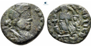
2072 Johannes AD 423-425. Rome Nummus Æ 12 mm, 1,04 g very fine 10