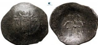
2297 Andronicus I Comnenus AD 1183-1185. Constantinople Billon Trachy 33 mm, 4,45 g good very fine 10