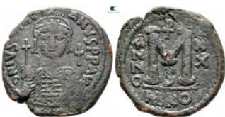
2107 Justinian I AD 527-565. Nikomedia Follis or 40 Nummi Æ 34 mm, 18,73 g very fine 10