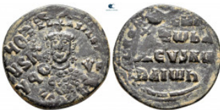
2208 Nicephorus II Phocas AD 963-969. Constantinople Follis Æ 26 mm, 7,65 g very fine 10