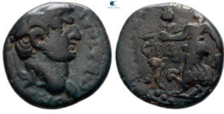
1238 Pamphylia. Side. Domitian as Caesar AD 69-81. Bronze Æ 16 mm, 3,41 g nearly very fine 10