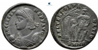
1971 Constans AD 337-350. Nicomedia Follis Æ 18 mm, 4,20 g very fine, tooled 10