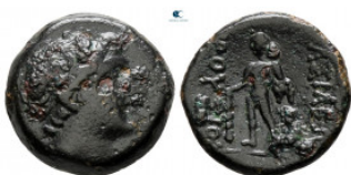
327 Kings of Bithynia. Prusias II Cynegos 182-149 BC. Bronze Æ 14 mm, 3,72 g nearly very fine 10