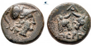
402 Mysia. Pergamon circa 310-282 BC. Bronze Æ 10 mm, 1,15 g very fine 10