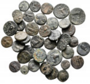
2455 Lot of ca. 40 greek bronze coins / SOLD AS SEEN, NO RETURN! very fine 10