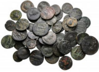
2520 Lot of ca. 48 roman bronze coins / SOLD AS SEEN, NO RETURN very fine 10