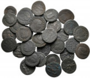
2494 Lot of ca. 40 late roman bronze coins / SOLD AS SEEN, NO RETURN! nearly very fine 10