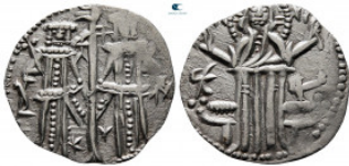
2374 Bulgaria. Second Empire. Ivan Aleksandar AD 1331-1371. Groš AR 18 mm, 1,44 g good very fine 10