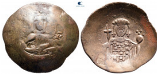
2270 Alexius I Comnenus AD 1081-1118. Constantinople Trachy Æ 30 mm, 3,44 g nearly very fine 10