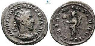
1711 Philip I Arab AD 244-249. Rome Antoninianus AR 24 mm, 4,43 g nearly very fine 10