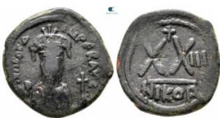
2149 Phocas AD 602-610. Nikomedia Half Follis or 20 Nummi Æ 24 mm, 5,62 g nearly very fine 10