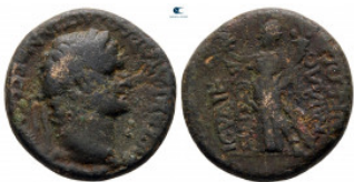
1273 Seleucia and Pieria. Laodicea ad Mare. Domitian AD 81-96. Bronze Æ 18 mm, 6,54 g nearly very fine 10