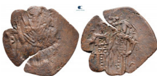
2324 Michael VIII Palaeologus AD 1261-1282. Constantinople Trachy Æ 26 mm, 2,15 g nearly very fine 10