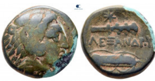
104 Kings of Macedon. Uncertain mint. Alexander III "the Great" 336-323 BC. Bronze Æ 18 mm, 5,07 g nearly very fine 10