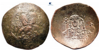
2272 Alexius I Comnenus AD 1081-1118. Constantinople Trachy Æ 29 mm, 4,04 g very fine 10