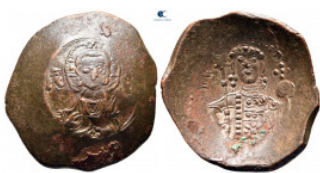
2282 Manuel I Comnenus AD 1143-1180. Constantinople Trachy Æ 30 mm, 5,79 g very fine 10