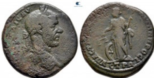
1098 Moesia Inferior. Nikopolis ad Istrum. Macrinus AD 217-218. Bronze Æ 26 mm, 11,31 g nearly very fine 10