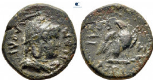
1217 Phrygia. Laodikeia ad Lycum. Pseudo-autonomous issue. Time of Tiberius AD 14-37. Bronze Æ 18 mm, 3,80 g very fine 10