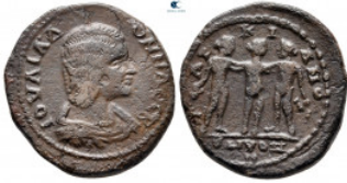
1046 Moesia Inferior. Marcianopolis. Julia Domna. Augusta AD 193-217. Bronze Æ 25 mm, 8,38 g very fine 10