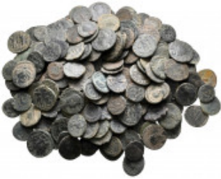
2499 Lot of ca. 200 late roman bronze coins / SOLD AS SEEN, NO RETURN! very fine 10