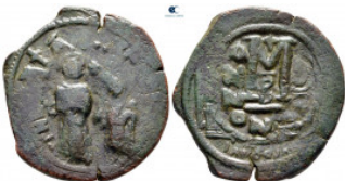
2162 Heraclius, with Heraclius Constantine and Heraclonas AD 610-641. Constantinople Follis or 40 Nummi Æ 31 mm, 12,60 g very fine 10