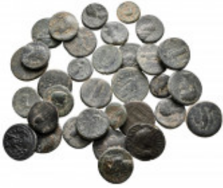
2479 Lot of ca. 32 roman provincial bronze coins / SOLD AS SEEN, NO RETURN! very fine 10