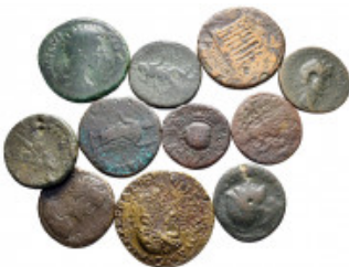
2487 Lot of ca. 12 roman provincial bronze coins / SOLD AS SEEN, NO RETURN! fine 10