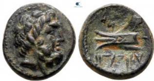
875 Phoenicia. Arados circa 206-52 BC. Bronze Æ 16 mm, 2,98 g very fine From the Tareq Hani collection 10