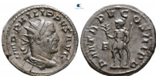
1709 Philip I Arab AD 244-249. Rome Antoninianus AR 23 mm, 4,48 g very fine 10