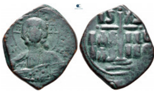
2233 Romanus III Argyrus AD 1028-1034. Constantinople Anonymous Follis Æ 27 mm, 8,32 g very fine 10