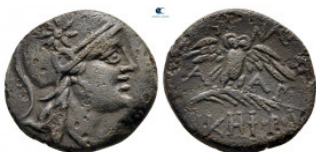
407 Mysia. Pergamon circa 200-133 BC. Bronze Æ 18 mm, 2,95 g very fine 10