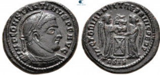
1871 Constantine I the Great AD 306-337. Siscia Nummus Æ 17 mm, 3,25 g very fine 10