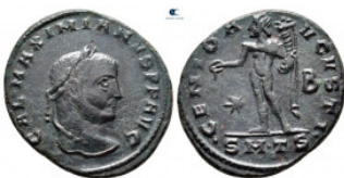
1844 Galerius Maximianus AD 305-311. Thessaloniki Follis Æ 26 mm, 6,41 g very fine 10