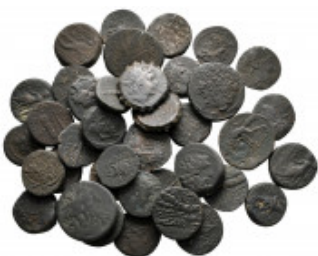
2454 Lot of ca. 40 greek bronze coins / SOLD AS SEEN, NO RETURN! nearly very fine 10