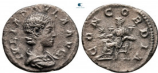
1522 Julia Paula. Augusta AD 219-220. Rome Denarius AR 17 mm, 1,93 g very fine 10