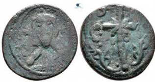
2264 Nicephorus III Botaniates AD 1078-1081. Constantinople Anonymous Follis Æ 21 mm, 4,39 g nearly very fine 10