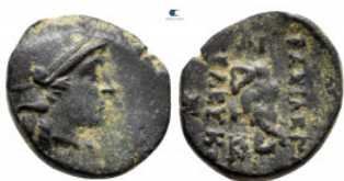
820 Seleukid Kingdom. Sardeis. Seleukos II Kallinikos 246-226 BC. Bronze Æ 13 mm, 1,58 g very fine 10