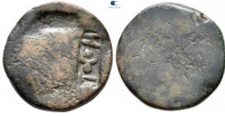
1342 Augustus 27 BC-AD 14. Rome As Æ 21 mm, 5,79 g fine