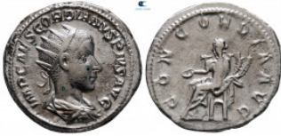
1663 Gordian III AD 238-244. Rome Antoninianus AR 22 mm, 5,04 g very fine 10