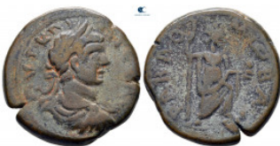
1298 Arabia. Rabbathmoba. Geta AD 198-211. Bronze Æ 29 mm, 17,61 g nearly very fine From the Tareq Hani collection 10