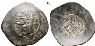
2299 Isaac II Angelos AD 1185-1195. Constantinople Trachy Æ 30 mm, 3,88 g very fine 10