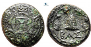
127 Kings of Macedon. Uncertain mint. Pyrrhos (of Epiros) 287-285 BC. Bronze Æ 16 mm, 4,06 g very fine 10