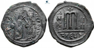
2151 Phocas, with Leontia AD 602-610. Theoupolis (Antioch) Follis or 40 Nummi Æ 28 mm, 9,37 g very fine 10