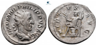
1681 Philip I Arab AD 244-249. Rome Antoninianus AR 23 mm, 4,72 g very fine 10