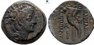
848 Seleukid Kingdom. Antioch. Alexander II Zabinas 128-122 BC. Bronze Æ 22 mm, 6,30 g very fine From the Tareq Hani collection 10