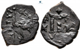
2166 Constans II AD 641-668. Constantinople Follis or 40 Nummi Æ 23 mm, 4,11 g very fine 10