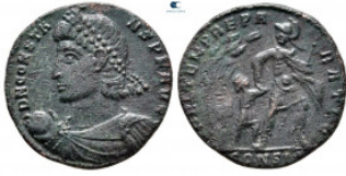
1966 Constans AD 337-350. Constantinople Follis Æ 21 mm, 3,50 g very fine 10