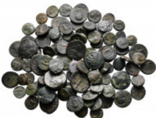
2470 Lot of ca. 96 greek bronze coins / SOLD AS SEEN, NO RETURN very fine 10