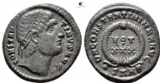
1858 Constantine I the Great AD 306-337. Heraclea Follis Æ 20 mm, 3,02 g very fine 10