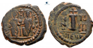
2128 Justin II and Sophia AD 565-578. Theoupolis (Antioch) Decanummium Æ 19 mm, 3,08 g very fine 10