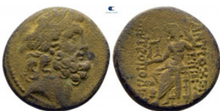
869 Seleucis and Pieria. Antioch circa 100-0 BC. Bronze Æ 22 mm, 7,93 g very fine From the Tareq Hani collection 10