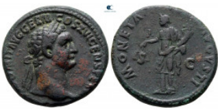
1376 Domitian AD 81-96. Rome As Æ 27 mm, 13,25 g very fine 10