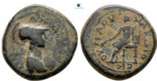
1220 Phrygia. Laodikeia ad Lycum. Pseudo-autonomous issue. Time of Titus and Domitian AD 79-96. Bronze Æ 17 mm, 4,61 g nearly very fine 10