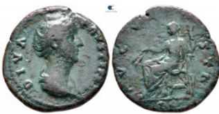
1440 Diva Faustina I AD 140-141. Rome As Æ 26 mm, 8,15 g nearly very fine 10