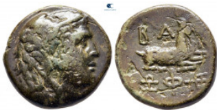
149 Kings of Macedon. Pella or Amphipolis. Philip V 221-179 BC. Bronze Æ 21 mm, 8,13 g very fine 10