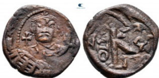
2171 Leontius AD 695-698. Constantinople Half Follis or 20 Nummi Æ 21 mm, 4,30 g very fine 10