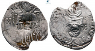
2366 Serbia. Uncertain mint. Stefan Uroš IV Dušan AD 1345-1355. Dinar AR 19 mm, 0,79 g nearly very fine 10