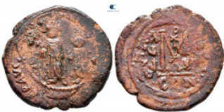
2154 Heraclius with Heraclius Constantine AD 610-641. Constantinople Follis or 40 Nummi Æ 32 mm, 12,40 g nearly very fine 10