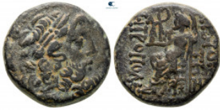
864 Seleucis and Pieria. Antioch circa 100-0 BC. Bronze Æ 19 mm, 7,72 g very fine From the Tareq Hani collection 10