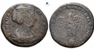
1093 Moesia Inferior. Nikopolis ad Istrum. Plautilla. Augusta AD 202-205. Bronze Æ 27 mm, 10,88 g nearly very fine 10