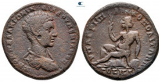
1102 Moesia Inferior. Nikopolis ad Istrum. Diadumenian AD 218-218. Bronze Æ 27 mm, 12,87 g very fine 10