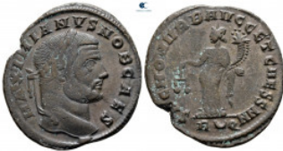
1839 Galerius Maximianus, as Caesar AD 293-305. Rome Follis Æ 27 mm, 8,91 g very fine 10