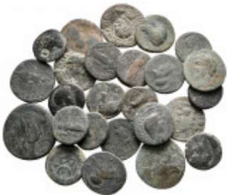
2481 Lot of ca. 25 roman provincial bronze coins / SOLD AS SEEN, NO RETURN! very fine 10