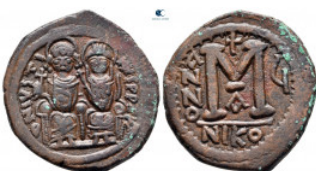
2124 Justin II and Sophia AD 565-578. Nikomedia Follis or 40 Nummi Æ 32 mm, 14,00 g good very fine 10