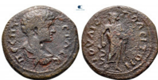
1117 Bithynia. Iuliopolis. Geta, as Caesar AD 197-209. Bronze Æ 27 mm, 10,50 g nearly very fine 10