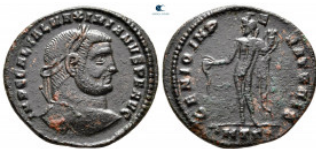
1842 Galerius Maximianus AD 305-311. Heraclea Follis Æ 27 mm, 4,70 g very fine 10