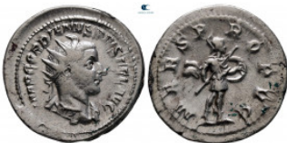
1658 Gordian III AD 238-244. Rome Antoninianus AR 25 mm, 4,71 g very fine 10