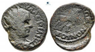
1112 Thessaly. Koinon of Thessaly. Valerian I AD 253-260. Bronze Æ 19 mm, 7,04 g nearly very fine 10