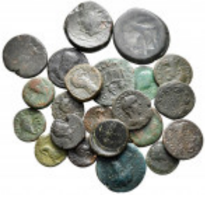
2488 Lot of ca. 22 roman provincial bronze coins / SOLD AS SEEN, NO RETURN! nearly very fine 10