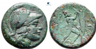
141 Kings of Macedon. Uncertain mint. Antigonos II Gonatas 277-239 BC. Bronze Æ 18 mm, 5,58 g very fine 10