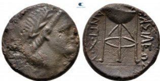
826 Seleukid Kingdom. Sardeis. Antiochos III Megas 223-187 BC. Bronze Æ 19 mm, 4,91 g very fine 10