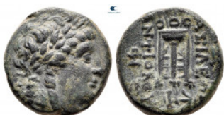
814 Seleukid Kingdom. Sardeis. Antiochos II Theos 261-246 BC. Bronze Æ 16 mm, 4,41 g very fine 10