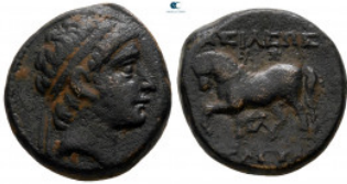
823 Seleukid Kingdom. ΔΕΛ mint. Seleukos II Kallinikos 246-226 BC. Bronze Æ 17 mm, 3,94 g very fine 10