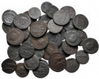
2500 Lot of ca. 40 late roman bronze coins / SOLD AS SEEN, NO RETURN! very fine 10