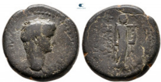
1208 Phrygia. Hierapolis. Augustus 27 BC-AD 14. Bronze Æ 20 mm, 6,32 g nearly very fine 10