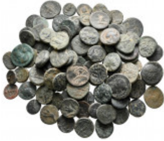
2445 Lot of ca. 100 greek bronze coins / SOLD AS SEEN, NO RETURN! nearly very fine 10