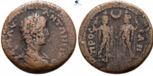
1239 Pisidia. Prostanna. Caracalla AD 198-217. Bronze Æ 23 mm, 8,44 g nearly very fine 10