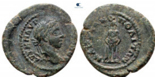
1069 Moesia Inferior. Marcianopolis. Elagabal AD 218-222. Bronze Æ 18 mm, 2,64 g very fine 10