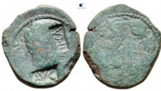
1336 Augustus 27 BC-AD 14. Rome As Æ 24 mm, 6,55 g fine 10