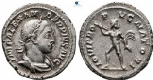
1530 Severus Alexander AD 222-235. Rome Denarius AR 18 mm, 3,41 g very fine 10