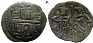
2369 Bulgaria. Second empire. Ivan Aleksandar AD 1331-1371. Trachy AE 18 mm, 0,99 g very fine 10