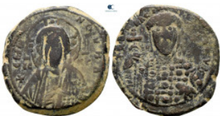
2242 Constantine X Ducas AD 1059-1067. Constantinople Follis Æ 27 mm, 10,47 g nearly very fine 10