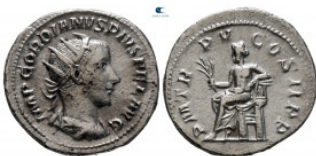
1659 Gordian III AD 238-244. Rome Antoninianus AR 23 mm, 4,54 g very fine 10