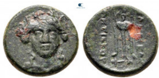
818 Seleukid Kingdom. Sardeis. Antiochos II Theos 261-246 BC. Bronze Æ 11 mm, 1,27 g nearly very fine 10