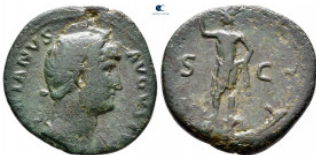
1409 Hadrian AD 117-138. Rome As Æ 25 mm, 7,89 g nearly very fine