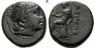
824 Seleukid Kingdom. Antioch on the Orontes. Seleukos III Keraunos 226-223 BC. Bronze Æ 12 mm, 2,52 g very fine 10