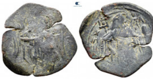
2325 Michael VIII Palaeologus AD 1261-1282. Constantinople Trachy Æ 25 mm, 2,61 g very fine 10