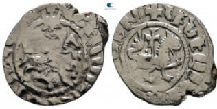
2389 Cilician Armenia. Levon III AD 1301-1307. Takvorin AR 22 mm, 2,32 g nearly very fine 10