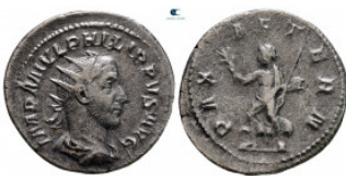
1712 Philip I Arab AD 244-249. Rome Antoninianus AR 23 mm, 4,27 g very fine 10