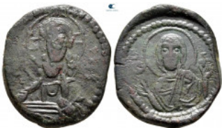
2248 Romanus IV, Diogenes AD 1068-1071. Constantinople Anonymous Follis Æ 30 mm, 9,62 g nearly very fine 10