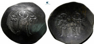
2298 Andronicus I Comnenus AD 1183-1185. Constantinople Trachy Æ 28 mm, 4,72 g very fine 10