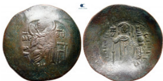
2284 Manuel I Comnenus AD 1143-1180. Constantinople Trachy Æ 29 mm, 3,76 g very fine 10