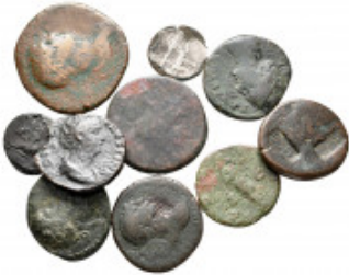
2491 Lot of ca. 10 roman coins / SOLD AS SEEN, NO RETURN! fine 10