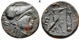
129 Kings of Macedon. Contemporary barbaric imitation. Antigonos II Gonatas 277-239 BC. Bronze Æ 15 mm, 3,14 g very fine 10