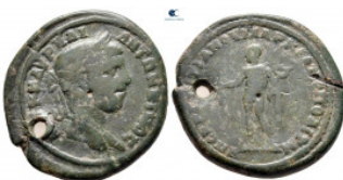
1067 Moesia Inferior. Marcianopolis. Elagabal AD 218-222. Bronze Æ 29 mm, 11,28 g very fine 10