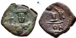
2169 Constantine IV Pogonatus AD 668-685. Constantinople Decanummium Æ 21 mm, 4,94 g very fine 10