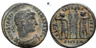
1875 Constantine I the Great AD 306-337. Thessaloniki Nummus Æ 20 mm, 2,68 g nearly very fine From the Tareq Hani collection 10