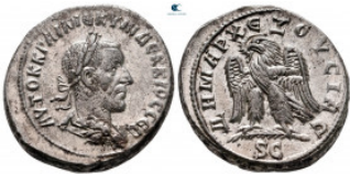
1271 Seleucia and Pieria. Antioch. Trajan Decius AD 249-251. Billon-Tetradrachm 29 mm, 13,22 g very fine 10