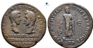
1061 Moesia Inferior. Marcianopolis. Macrinus with Diadumenian as Caesar AD 217-218. Pentassarion Æ 27 mm, 10,75 g very fine 10