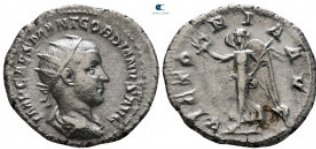
1626 Gordian III AD 238-244. Rome Antoninianus AR 23 mm, 3,84 g very fine 10