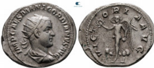
1546 Gordian III AD 238-244. Antioch Antoninianus AR 24 mm, 5,07 g good very fine 10