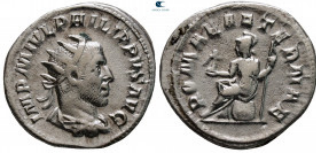
1702 Philip I Arab AD 244-249. Rome Antoninianus AR 22 mm, 4,19 g very fine 10