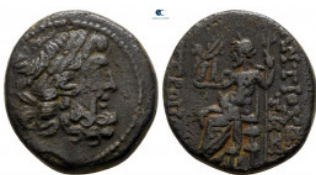
867 Seleucis and Pieria. Antioch circa 100-0 BC. Bronze Æ 21 mm, 6,88 g very fine From the Tareq Hani collection 10