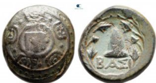
126 Kings of Macedon. Uncertain mint. Pyrrhos (of Epiros) 287-285 BC. Bronze Æ 17 mm, 4,75 g very fine 10