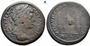
1089 Moesia Inferior. Nikopolis ad Istrum. Caracalla AD 198-217. Aurelius Gallus, legatus consularis Bronze Æ 27 mm, 12,13 g nearly very fine 10