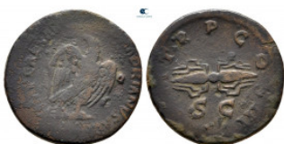
1412 Hadrian AD 117-138. Rome Semis Æ 19 mm, 3,45 g very fine