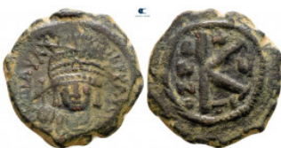
2147 Maurice Tiberius AD 582-602. Thessalonica Half Follis or 20 Nummi Æ 22 mm, 5,36 g very fine 10