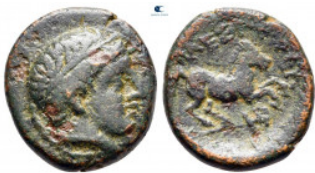
83 Kings of Macedon. Uncertain mint. Alexander III "the Great" 336-323 BC. Bronze Æ 17 mm, 3,88 g fine 10