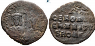
2199 Constantine VII Porphyrogenitus, with Romanus I AD 913-959. Constantinople Follis Æ 27 mm, 8,02 g nearly very fine 10