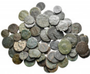
2511 Lot of ca. 70 late roman bronze coins / SOLD AS SEEN, NO RETURN! nearly very fine 10