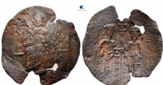
2316 John III Ducas (Vatatzes), emperor of Nicaea AD 1222-1254. Thessalonica Trachy Æ 29 mm, 2,26 g very fine 10