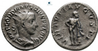
1624 Gordian III AD 238-244. Rome Antoninianus AR 22 mm, 3,77 g nearly very fine 10