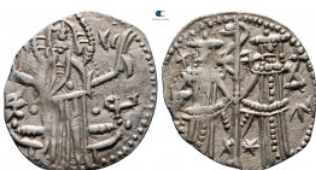
2372 Bulgaria. Second empire. Ivan Aleksandar AD 1331-1371. Groš AR 19 mm, 1,64 g very fine 10