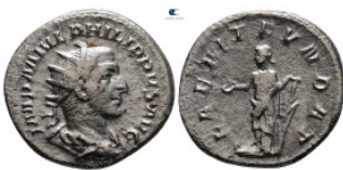
1704 Philip I Arab AD 244-249. Rome Antoninianus AR 23 mm, 4,04 g very fine 10