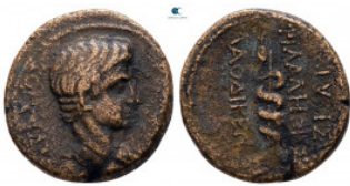
1216 Phrygia. Laodikeia ad Lycum. Augustus 27 BC-AD 14. Bronze Æ 17 mm, 3,16 g very fine 10