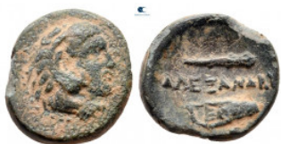
86 Kings of Macedon. Uncertain mint. Alexander III "the Great" 336-323 BC. Bronze Æ 13 mm, 1,23 g nearly very fine 10