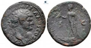
1374 Domitian AD 81-96. Rome As Æ 28 mm, 10,16 g nearly very fine 10