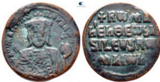
2202 Romanus I Lecapenus AD 920-944. Constantinople Follis or 40 Nummi Æ 25 mm, 9,47 g nearly very fine 10