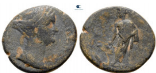
1213 Phrygia. Kibyra. Sabina. Augusta AD 128-137. Bronze Æ 19 mm, 3,77 g nearly very fine 10