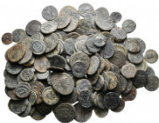
2506 Lot of ca. 200 late roman bronze coins / SOLD AS SEEN, NO RETURN! very fine 10