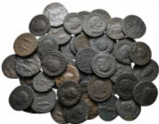
2497 Lot of ca. 50 late roman bronze coins / SOLD AS SEEN, NO RETURN! nearly very fine 10