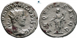
1714 Philip I Arab AD 244-249. Rome Antoninianus AR 22 mm, 3,66 g nearly very fine 10