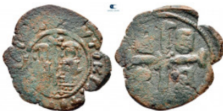
2344 Andronicus II Palaeologus, with Michael IX AD 1282-1328. Constantinople Assarion Æ 22 mm, 1,86 g very fine 10