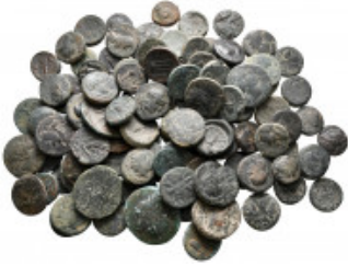
2460 Lot of ca. 100 greek bronze coins / SOLD AS SEEN, NO RETURN! very fine 10