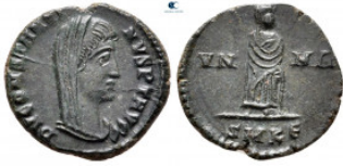
1990 Divus Constantine I AD 337. Cyzicus Follis Æ 16 mm, 1,67 g very fine 10