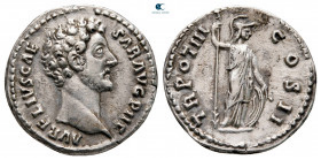
1434 Marcus Aurelius, as Caesar AD 139-161. Rome Denarius AR 18 mm, 3,16 g very fine 10