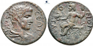
1241 Pisidia. Termessos Major. Pseudo-autonomous issue circa AD 180-230. Bronze Æ 26 mm, 9,50 g very fine 10