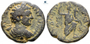
1295 Arabia. Medaba. Caracalla AD 198-217. Bronze Æ 26 mm, 9,61 g nearly very fine From the Tareq Hani collection 10