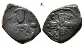
2274 Alexius I Comnenus AD 1081-1118. Thessalonica Tetarteron Æ 20 mm, 3,16 g very fine 10