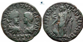
1052 Moesia Inferior. Marcianopolis. Septimius Severus, with Julia Domna AD 193-211. Pentassarion Æ 28 mm, 11,42 g very fine 10