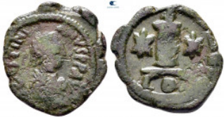
2103 Justinian I AD 527-565. Constantinople Decanummium Æ 19 mm, 3,28 g nearly very fine 10