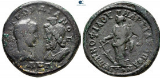
1078 Moesia Inferior. Marcianopolis. Gordian III AD 238-244. Bronze Æ 28 mm, 12,71 g very fine 10