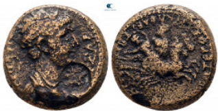
1210 Phrygia. Hierapolis. Nero AD 54-68. Bronze Æ 17 mm, 5,90 g nearly very fine, countermarked 10