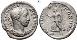
1527 Severus Alexander AD 222-235. Rome Denarius AR 17 mm, 2,47 g very fine 10