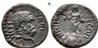
1205 Phrygia. Grymenothyrai. Pseudo-autonomous issue. Time of Trajan AD 98-117. Bronze Æ 14 mm, 2,40 g very fine 10