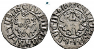
2378 Cilician Armenia. Levon I AD 1198-1219. Tram AR 22 mm, 2,84 g very fine 10