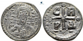
2251 Romanus IV, Diogenes AD 1068-1071. Constantinople Follis Æ 26 mm, 7,01 g very fine 10