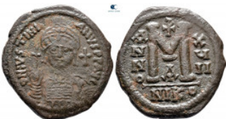
2108 Justinian I AD 527-565. Nikomedia Follis or 40 Nummi Æ 34 mm, 18,39 g very fine 10