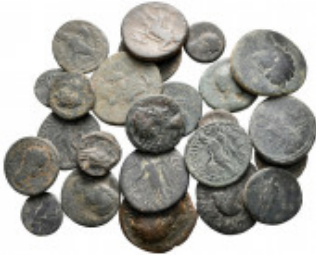
2484 Lot of ca. 25 roman provincial bronze coins / SOLD AS SEEN, NO RETURN! nearly very fine 10