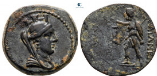
874 Seleucis and Pieria. Apameia circa 150-49 BC. Bronze Æ 17 mm, 3,47 g very fine From the Tareq Hani collection 10