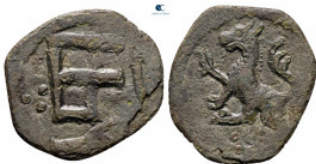
2377 Bulgaria. Veliko Turnovo mint. Ivan Šišman. Second Empire AD 1371-1395. Trachy AE 17 mm, 1,24 g very fine 10