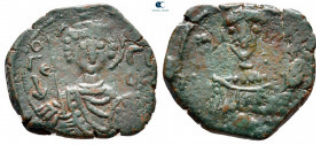
2293 Manuel I Comnenus AD 1143-1180. Thessalonica Tetarteron Æ 15 mm, 1,89 g nearly very fine 10