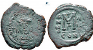
2136 Maurice Tiberius AD 582-602. Constantinople Follis or 40 Nummi Æ 29 mm, 10,90 g nearly very fine 10