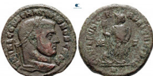
1885 Constantine I the Great, as Caesar AD 306-307. Carthage Nummus Æ 24 mm, 9,49 g nearly very fine 10