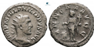
1705 Philip I Arab AD 244-249. Rome Antoninianus AR 22 mm, 3,76 g nearly very fine 10