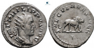
1716 Philip I Arab AD 244-249. Rome Antoninianus AR 22 mm, 3,67 g very fine 10