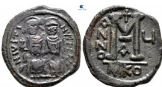
2125 Justin II and Sophia AD 565-578. Nikomedia Follis or 40 Nummi Æ 28 mm, 11,92 g good very fine 10