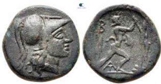
147 Kings of Macedon. Uncertain mint in Macedon. Antigonos II Gonatas 277-239 BC. Bronze Æ 18 mm, 4,80 g very fine 10