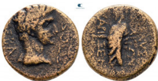
1203 Phrygia. Dionysopolis. Tiberius AD 14-37. Bronze Æ 15 mm, 4,83 g nearly very fine 10