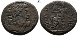
872 Seleucis and Pieria. Antioch circa 100-0 BC. Bronze Æ 21 mm, 7,85 g very fine 10