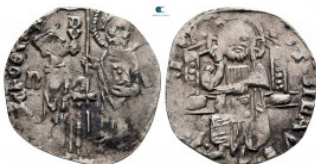
2363 Italy. Venice AD 1350-1450. Grosso AR 20 mm, 1,59 g very fine 10