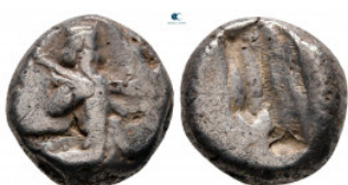
965 Persia. Achaemenid Empire. Sardeis. Time of Darios I to Xerxes I circa 500-485 BC. Siglos AR 13 mm, 5,52 g nearly very fine 10