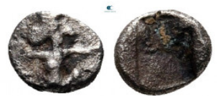
970 Persia. Achaemenid Empire. Sardeis. Time of Xerxes II to Artaxerxes II 420-375 BC. 1/32 Siglos AR 5 mm, 0,15 g very fine 10