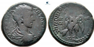
1106 Moesia Inferior. Nikopolis ad Istrum. Elagabal AD 218-222. Bronze Æ 27 mm, 12,66 g very fine 10