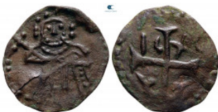
2371 Bulgaria. Second empire. Ivan Aleksandar AD 1331-1371. Trachy AE 20 mm, 1,04 g very fine 10