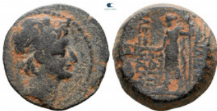
850 Seleukid Kingdom. Antioch. Alexander II Zabinas 128-122 BC. Bronze Æ 20 mm, 6,91 g nearly very fine From the Tareq Hani collection 10