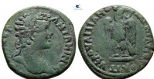
1053 Moesia Inferior. Marcianopolis. Caracalla AD 198-217. Bronze Æ 26 mm, 10,21 g very fine 10