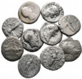
2489 Lot of ca. 10 roman denarii / SOLD AS SEEN, NO RETURN! nearly very fine 10