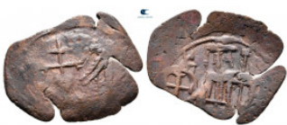
2338 Andronicus II Palaeologus AD 1282-1328. Thessalonica Trachy Æ 22 mm, 1,16 g very fine 10