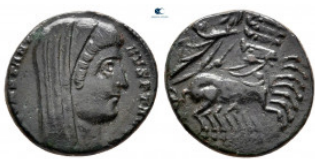
1992 Divus Constantine I AD 337. Uncertain mint Nummus Æ 15 mm, 1,57 g very fine 10