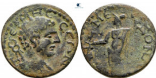
1243 Pisidia. Termessos Major. Pseudo-autonomous issue circa AD 200-250. Bronze Æ 26 mm, 8,34 g very fine 10