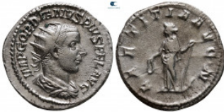
1655 Gordian III AD 238-244. Rome Antoninianus AR 22 mm, 4,15 g very fine 10