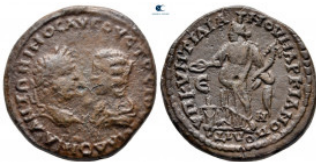
1057 Moesia Inferior. Marcianopolis. Caracalla, with Julia Domna AD 198-217. Bronze Æ 27 mm, 10,44 g very fine 10