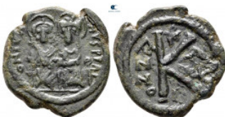
2131 Justin II and Sophia AD 565-578. Uncertain mint, possibly Theoupolis Half Follis or 20 Nummi Æ 23 mm, 6,87 g nearly very fine 10