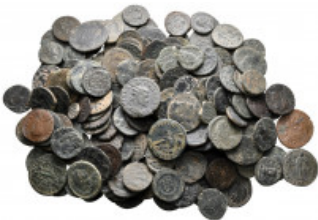
2501 Lot of ca. 200 late roman bronze coins / SOLD AS SEEN, NO RETURN! very fine 10