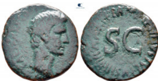
1339 Augustus 27 BC-AD 14. Rome As Æ 24 mm, 8,20 g fine 10