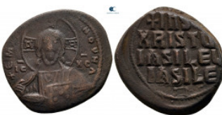
2211 Attributed to Basil II and Constantine VIII AD 976-1028. Constantinople Anonymous Follis Æ 30 mm, 12,88 g very fine 10