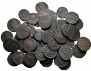
2495 Lot of ca. 50 late roman bronze coins / SOLD AS SEEN, NO RETURN! very fine 10