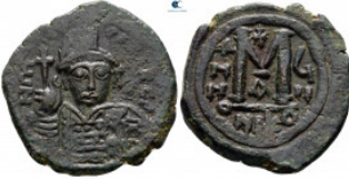
2139 Maurice Tiberius AD 582-602. Nikomedia Follis or 40 Nummi Æ 30 mm, 12,35 g very fine 10