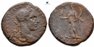
1096 Moesia Inferior. Nikopolis ad Istrum. Macrinus AD 217-218. Bronze Æ 27 mm, 13,22 g nearly very fine 10