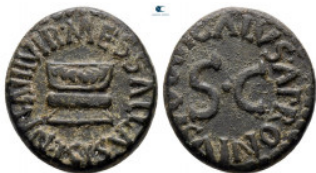
1345 Augustus 27 BC-AD 14. Apronius, Galus, Messalla, and Sisena, moneyers. Rome Quadrans Æ 17 mm, 3,12 g very fine