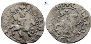
2392 Cilician Armenia. Levon III AD 1301-1307. Takvorin AR 21 mm, 2,19 g nearly very fine 10