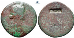
1349 Livia, wife of Augustus AD 14-29. Rome As Æ 28 mm, 11,57 g fine