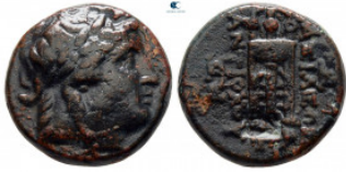
807 Seleukid Kingdom. Sardeis. Antiochos II Theos 261-246 BC. Bronze Æ 15 mm, 4,91 g nearly very fine 10