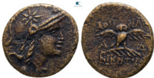
404 Mysia. Pergamon circa 200-0 BC. Bronze Æ 17 mm, 2,52 g very fine 10