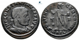
1848 Constantine I the Great AD 306-337. Arelate Nummus Æ 20 mm, 3,20 g nearly very fine From the Tareq Hani collection 10