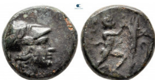
136 Kings of Macedon. Uncertain mint. Antigonos II Gonatas 277-239 BC. Bronze Æ 18 mm, 6,10 g very fine 10