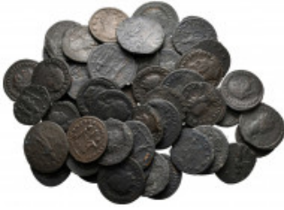
2509 Lot of ca. 50 late roman bronze coins / SOLD AS SEEN, NO RETURN! very fine 10