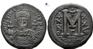
2109 Justinian I AD 527-565. Theoupolis (Antioch) Follis or 40 Nummi Æ 36 mm, 19,50 g very fine 10