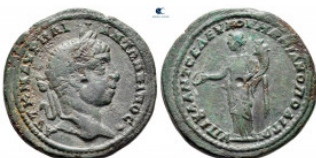
1068 Moesia Inferior. Marcianopolis. Elagabal AD 218-222. Bronze Æ 28 mm, 10,42 g very fine 10