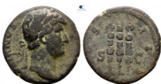
1411 Hadrian AD 117-138. Rome Semis Æ 17 mm, 2,27 g nearly very fine