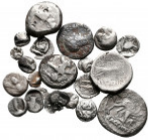
2465 Lot of ca. 21 greek silver coins / SOLD AS SEEN, NO RETURN! nearly very fine 10