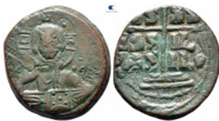
2232 Romanus III Argyrus AD 1028-1034. Constantinople Anonymous Follis Æ 30 mm, 12,91 g very fine 10