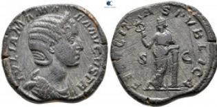
1543 Julia Mamaea. Augusta AD 225-235. Rome Sestertius Æ 29 mm, 20,84 g nearly very fine 10