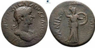
1110 Thessaly. Koinon of Thessaly. Hadrian AD 117-138. Oul. Nikomachos, strategos Bronze Æ 22 mm, 3,89 g very fine 10