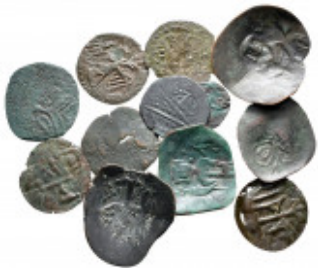
2540 Lot of ca. 12 medieval bronze coins / SOLD AS SEEN, NO RETURN! nearly very fine 10