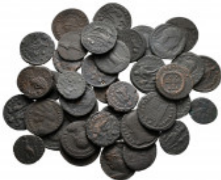
2507 Lot of ca. 40 late roman bronze coins / SOLD AS SEEN, NO RETURN! very fine 10