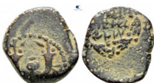
894 Judaea. Jerusalem. Uncertain Judaeian King circa 135-40 BC. Prutah Æ 14 mm, 1,90 g nearly very fine From the Tareq Hani collection 10