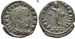
1902 Licinius I AD 308-324. Ticinum Follis Æ 18 mm, 2,31 g very fine 10