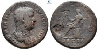
1407 Hadrian AD 117-138. Rome As Æ 26 mm, 13,06 g nearly very fine