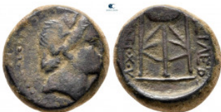
827 Seleukid Kingdom. Sardeis. Antiochos III Megas 223-187 BC. Bronze Æ 18 mm, 7,38 g very fine 10