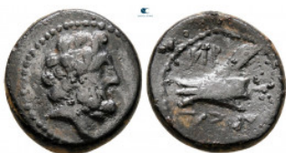
877 Phoenicia. Arados circa 206-52 BC. Bronze Æ 17 mm, 3,82 g very fine From the Tareq Hani collection 10