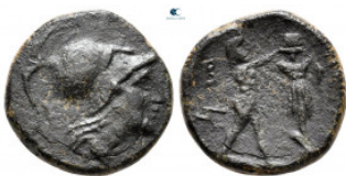
135 Kings of Macedon. Uncertain mint. Antigonos II Gonatas 277-239 BC. Bronze Æ 16 mm, 2,96 g very fine 10