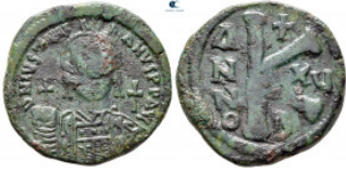
2102 Justinian I AD 527-565. Constantinople Half Follis or 20 Nummi Æ 29 mm, 10,60 g nearly very fine 10