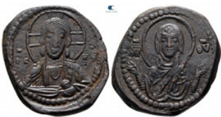
2250 Romanus IV, Diogenes AD 1068-1071. Constantinople Anonymous Follis Æ 29 mm, 9,98 g good very fine 10