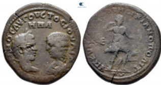
1058 Moesia Inferior. Marcianopolis. Caracalla, with Julia Domna AD 198-217. Bronze Æ 28 mm, 11,86 g very fine 10