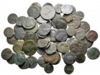
2518 Lot of ca. 70 late roman bronze coins / SOLD AS SEEN, NO RETURN! fine 10