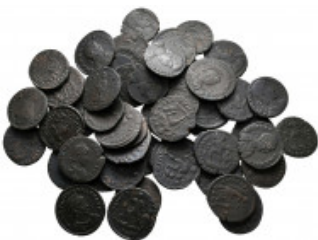
2502 Lot of ca. 50 late roman bronze coins / SOLD AS SEEN, NO RETURN! very fine 10