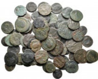
2512 Lot of ca. 100 late roman bronze coins / SOLD AS SEEN, NO RETURN! nearly very fine 10