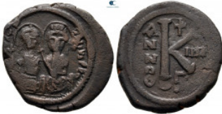
2127 Justin II and Sophia AD 565-578. Theoupolis (Antioch) Half Follis or 20 Nummi Æ 25 mm, 6,93 g very fine 10