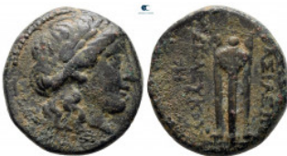
819 Seleukid Kingdom. Antioch on the Orontes. Seleukos II Kallinikos 246-226 BC. Bronze Æ 20 mm, 6,89 g very fine From the Tareq Hani collection 10