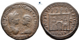
1060 Moesia Inferior. Marcianopolis. Caracalla, with Julia Domna AD 198-217. Bronze Æ 28 mm, 12,31 g nearly very fine 10