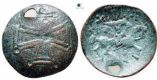
2367 Bulgaria. Second Empire. Todor Svetoslav AD 1300-1322. Trachy AE 20 mm, 1,36 g nearly very fine, holed 10