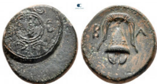
87 Kings of Macedon. Uncertain mint. Alexander III "the Great" 336-323 BC. Bronze Æ 17 mm, 3,81 g very fine 10