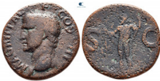
1346 Agrippa 12 BC. Rome As Æ 25 mm, 10,39 g nearly very fine