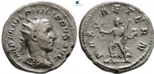
1703 Philip I Arab AD 244-249. Rome Antoninianus AR 23 mm, 3,26 g nearly very fine 10