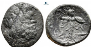
157 Kings of Macedon. Uncertain mint. Philip V 221-179 BC. Bronze Æ 18 mm, 3,19 g nearly very fine 10