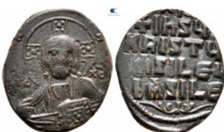
2213 Attributed to Basil II and Constantine VIII AD 976-1028. Constantinople Anonymous Follis Æ 29 mm, 7,85 g very fine 10