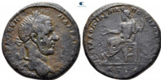
1097 Moesia Inferior. Nikopolis ad Istrum. Macrinus AD 217-218. Statius Longinus, consular legate Bronze Æ 27 mm, 12,24 g nearly very fine 10