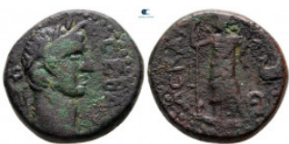
1277 Judaea. Ascalon. Domitian AD 81-96. Bronze Æ 23 mm, 13,53 g nearly very fine 10