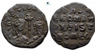
2200 Constantine VII Porphyrogenitus, with Romanus I AD 913-959. Constantinople Follis Æ 25 mm, 6,48 g very fine 10