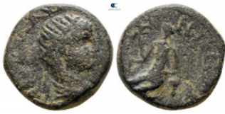
1294 Mesopotamia. Rhesaena. Elagabal AD 218-222. Bronze Æ 18 mm, 6,22 g fine 10