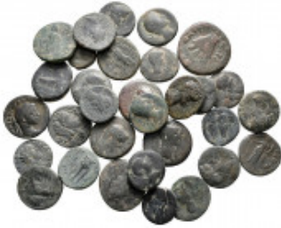
2483 Lot of ca. 32 roman provincial bronze coins / SOLD AS SEEN, NO RETURN! very fine 10