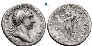
1381 Trajan AD 98-117. Rome Denarius AR 16 mm, 3,06 g nearly very fine 10