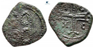
2318 Empire of Nicaea. Anonymous AD 1227-1261. Magnesia Tetarteron Æ 14 mm, 1,32 g nearly very fine 10