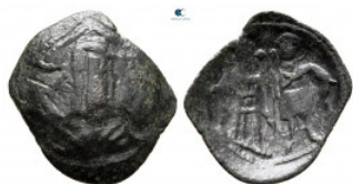
2320 John Comnenus-Ducas AD 1237-1242. Thessalonica Trachy Æ 13 mm, 0,47 g very fine 10