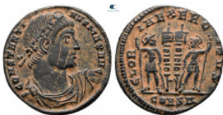
1849 Constantine I the Great AD 306-337. Constantinople Follis Æ 18 mm, 2,10 g very fine From the Tareq Hani collection 10