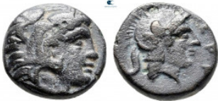
401 Mysia. Pergamon circa 310-282 BC. Bronze Æ 8 mm, 0,98 g very fine 10