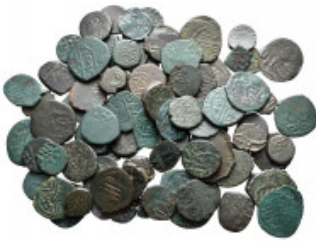
2544 Lot of ca. 90 islamic bronze coins / SOLD AS SEEN, NO RETURN! very fine 10