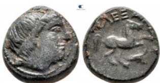
103 Kings of Macedon. Uncertain mint. Alexander III "the Great" 336-323 BC. Bronze Æ 15 mm, 4,22 g nearly very fine 10