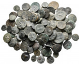
2447 Lot of ca. 100 greek bronze coins / SOLD AS SEEN, NO RETURN! nearly very fine 10