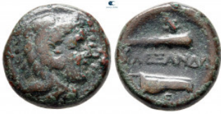
97 Kings of Macedon. Uncertain mint. Alexander III "the Great" 336-323 BC. Bronze Æ 18 mm, 7,01 g nearly very fine 10