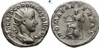
1622 Gordian III AD 238-244. Rome Antoninianus AR 22 mm, 4,29 g very fine 10