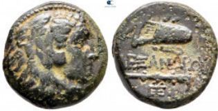
82 Kings of Macedon. Uncertain mint. Alexander III "the Great" 336-323 BC. Bronze Æ 18 mm, 5,61 g nearly very fine 10