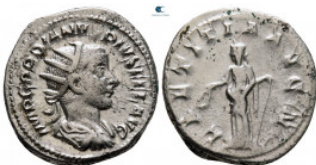
1669 Gordian III AD 238-244. Rome Antoninianus AR 23 mm, 4,69 g very fine 10