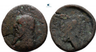
973 Kings of Parthia. Ekbatana. Mithradates I 150-100 BC. Bronze Æ 15 mm, 1,76 g fine 10