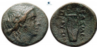
325 Kings of Bithynia. Prusias I Cholos 228-182 BC. Bronze Æ 18 mm, 5,09 g nearly very fine 10