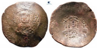
2286 Manuel I Comnenus AD 1143-1180. Constantinople Trachy Æ 27 mm, 4,91 g very fine 10