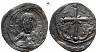
2263 Nicephorus III Botaniates AD 1078-1081. Constantinople Anonymous Follis Æ 23 mm, 2,33 g very fine 10