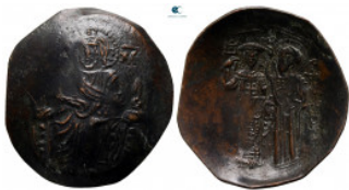
2287 Manuel I Comnenus AD 1143-1180. Constantinople Trachy Æ 29 mm, 2,72 g very fine 10