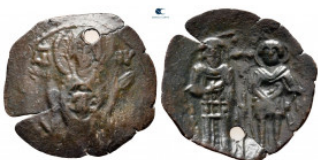
2315 Empire of Nicaea. John III Ducas (Vatatzes) AD 1222-1254. Magnesia Trachy Æ 23 mm, 1,48 g very fine 10