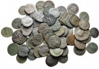
2514 Lot of ca. 70 late roman bronze coins / SOLD AS SEEN, NO RETURN! nearly very fine 10