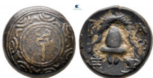
80 Kings of Macedon. Sardeis. Alexander III "the Great" 336-323 BC. Bronze Æ 14 mm, 4,45 g very fine 10