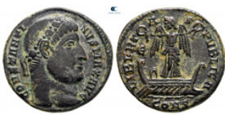
1851 Constantine I the Great AD 306-337. Constantinople Follis Æ 18 mm, 2,91 g very fine 10