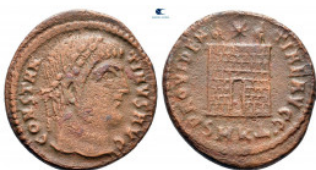
1853 Constantine I the Great AD 306-337. Cyzicus Follis Æ 20 mm, 2,99 g fine 10