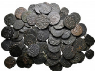
2542 Lot of ca. 70 islamic bronze coins / SOLD AS SEEN, NO RETURN very fine 10