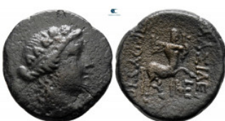
328 Kings of Bithynia. Prusias II Cynegos 182-149 BC. Bronze Æ 18 mm, 3,72 g very fine 10