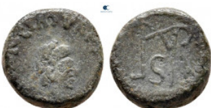
2076 Marcian AD 450-457. Constantinople Nummus Æ 10 mm, 1,25 g very fine 10