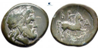
155 Kings of Macedon. Uncertain mint. Philip V 221-179 BC. Bronze Æ 23 mm, 6,65 g very fine 10