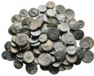
2446 Lot of ca. 100 greek bronze coins / SOLD AS SEEN, NO RETURN! nearly very fine 10