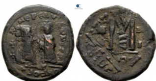
2156 Heraclius with Heraclius Constantine AD 610-641. Constantinople Follis or 40 Nummi Æ 28 mm, 10,75 g nearly very fine, overstruck on a Follis of Phocas 10