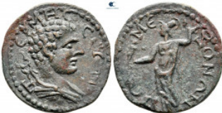
1242 Pisidia. Termessos Major. Pseudo-autonomous issue circa AD 200-250. Bronze Æ 28 mm, 8,47 g very fine 10