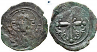
2262 Nicephorus III Botaniates AD 1078-1081. Constantinople Anonymous Follis Æ 25 mm, 4,07 g very fine 10