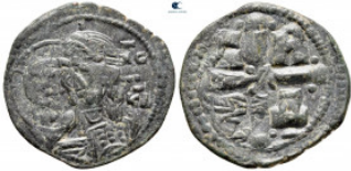
2246 Romanus IV, Diogenes AD 1068-1071. Constantinople Anonymous Follis Æ 27 mm, 5,12 g nearly very fine 10