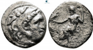
81 Kings of Macedon. Uncertain mint. Alexander III "the Great" 336-323 BC. Drachm AR 16 mm, 3,72 g fine 10