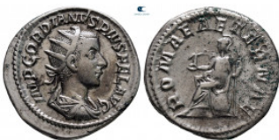
1651 Gordian III AD 238-244. Rome Antoninianus AR 22 mm, 3,92 g very fine 10