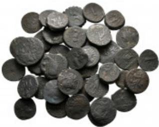
2463 Lot of ca. 40 greek bronze coins / SOLD AS SEEN, NO RETURN! very fine 10