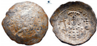
2278 John II Comnenus AD 1118-1143. Thessalonica Trachy Æ 25 mm, 3,37 g nearly very fine 10