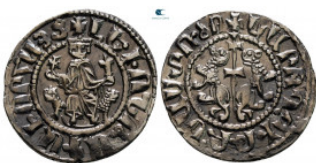
2380 Cilician Armenia. Sis. Levon I AD 1198-1219. Tram AR 23 mm, 2,98 g very fine 10