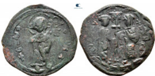
2243 Constantine X Ducas and Eudocia AD 1059-1067. Constantinople Follis Æ 30 mm, 6,95 g very fine 10