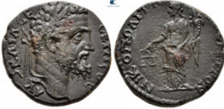
1087 Moesia Inferior. Nikopolis ad Istrum. Septimius Severus AD 193-211. Bronze Æ 26 mm, 10,61 g very fine 10