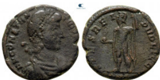
1993 Constantius II AD 347-355. Constantinople Follis Æ 17 mm, 2,20 g nearly very fine 10