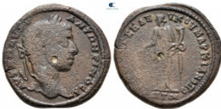
1065 Moesia Inferior. Marcianopolis. Elagabal AD 218-222. Bronze Æ 26 mm, 10,08 g nearly very fine 10