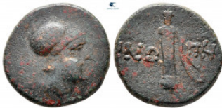
322 Paphlagonia. Sinope. Time of Mithradates VI Eupator 120-63 BC. Bronze Æ 20 mm, 6,86 g fine 10