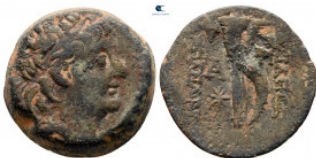
853 Seleukid Kingdom. Antioch on the Orontes. Alexander II Zabinas 128-122 BC. Bronze Æ 21 mm, 7,86 g very fine From the Tareq Hani collection 10