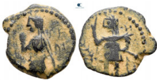
960 Nabataean Kingdom. Petra. Aretas IV, with Shaqilat 9 BC-AD 40. Bronze Æ 16 mm, 2,18 g very fine From the Tareq Hani collection 10