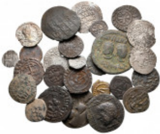
2521 Lot of ca. 26 mixed coins / SOLD AS SEEN, NO RETURN! very fine 10