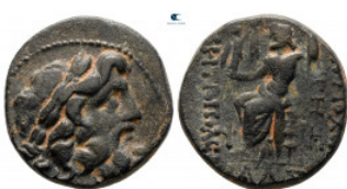
870 Seleucis and Pieria. Antioch circa 100-0 BC. Bronze Æ 20 mm, 7,39 g very fine From the Tareq Hani collection 10