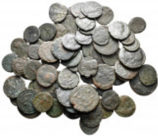
2516 Lot of ca. 70 late roman bronze coins / SOLD AS SEEN, NO RETURN! nearly very fine 10