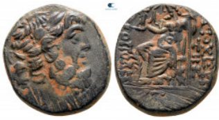
863 Seleucis and Pieria. Antioch circa 100-0 BC. Bronze Æ 20 mm, 7,73 g very fine From the Tareq Hani collection 10