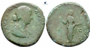
1442 Faustina II AD 147-175. Rome Sestertius Æ 32 mm, 23,09 g nearly very fine 10