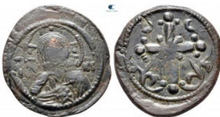
2265 Nicephorus III Botaniates AD 1078-1081. Constantinople Anonymous Follis Æ 24 mm, 4,63 g very fine 10