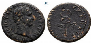
707 Seleucia and Pieria. Antioch. Trajan AD 98-117. Bronze Æ 16 mm, 2,46 g very fine From the Tareq Hani collection 10