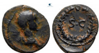
710 Seleucia and Pieria. Antioch. Trajan AD 98-117. Bronze Æ 10 mm, 0,92 g very fine From the Tareq Hani collection 10