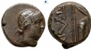
138 Cimmerian Bosphoros. Pantikapaion circa 275-245 BC. Bronze Æ 12 mm, 1,93 g very fine 10