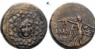
145 Pontos. Amisos. Time of Mithradates VI Eupator 120-63 BC. Bronze Æ 18 mm, 7,93 g very fine 10