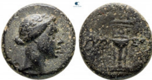
141 Pontos. Amisos circa 125-100 BC. Bronze Æ 14 mm, 2,60 g very fine 10