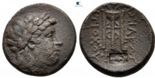
323 Seleukid Kingdom. Sardeis. Antiochos II Theos 261-246 BC. Bronze Æ 17 mm, 4,01 g very fine 10