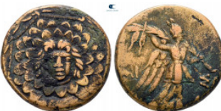
144 Pontos. Amisos. Time of Mithradates VI Eupator circa 120-63 BC. Bronze Æ 20 mm, 7,10 g very fine 10