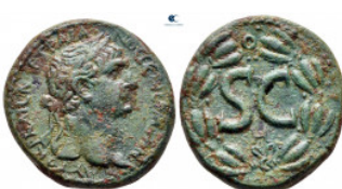
711 Seleucia and Pieria. Antioch. Trajan AD 98-117. Bronze Æ 28 mm, 17,16 g very fine From the Tareq Hani collection 10