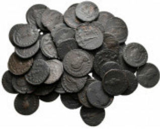
1901 Lot of ca. 50 roman bronze coins / SOLD AS SEEN, NO RETURN! very fine 10