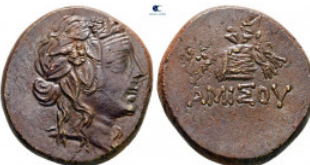
143 Pontos. Amisos. Time of Mithradates VI Eupator circa 120-63 BC. Bronze Æ 22 mm, 9,14 g very fine 10