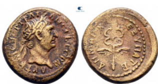
709 Seleucia and Pieria. Antioch. Trajan AD 98-117. Bronze Æ 15 mm, 4,17 g very fine From the Tareq Hani collection 10