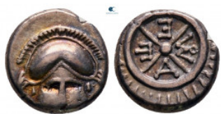
78 Thrace. Mesembria circa 420-320 BC. Diobol AR 10 mm, 1,32 g good very fine 10