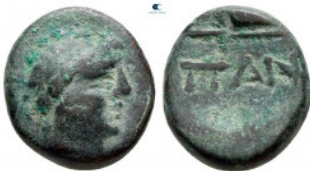
139 Cimmerian Bosphoros. Pantikapaion circa 275-245 BC. Bronze Æ 10 mm, 1,87 g very fine 10