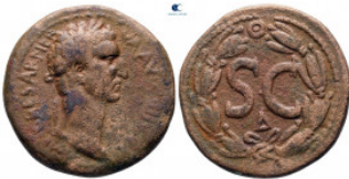
705 Seleucia and Pieria. Antioch. Nerva AD 96-98. Bronze Æ 30 mm, 14,58 g very fine From the Tareq Hani collection 10