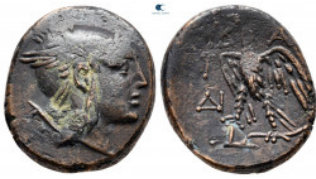
73 Kings of Macedon. Uncertain mint. Perseus 179-168 BC. Bronze Æ 22 mm, 8,55 g very fine 10