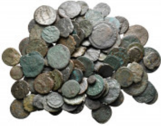
1900 Lot of ca. 100 late roman bronze coins / SOLD AS SEEN, NO RETURN! fine 10