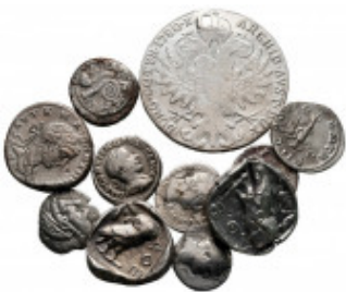
1904 Lot of ca. 10 mixed coins / SOLD AS SEEN, NO RETURN! very fine 10