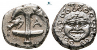
76 Thrace. Apollonia Pontica circa 480-450 BC. Drachm AR 14 mm, 3,42 g very fine 10