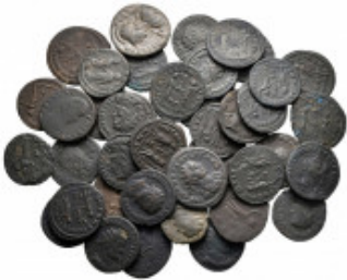
1902 Lot of ca. 40 roman bronze coins / SOLD AS SEEN, NO RETURN! very fine 10