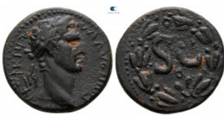
706 Seleucia and Pieria. Antioch. Nerva AD 96-98. Bronze Æ 22 mm, 6,88 g very fine From the Tareq Hani collection 10