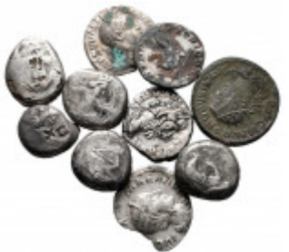
1903 Lot of ca. 11 ancient coins / SOLD AS SEEN, NO RETURN! nearly very fine 10