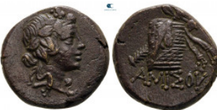
142 Pontos. Amisos. Time of Mithradates VI Eupator 120-63 BC. Bronze Æ 20 mm, 8,01 g very fine 10