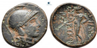
326 Seleukid Kingdom. Sardeis. Seleukos II Kallinikos 246-226 BC. Bronze Æ 17 mm, 3,36 g nearly very fine 10