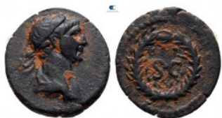
708 Seleucia and Pieria. Antioch. Trajan AD 98-117. Bronze Æ 10 mm, 0,75 g very fine From the Tareq Hani collection 10