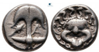
75 Thrace. Apollonia Pontica circa 480-450 BC. Drachm AR 13 mm, 2,95 g very fine 10