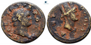
704 Seleucia and Pieria. Antioch. Titus AD 79-81. Bronze Æ 20 mm, 4,33 g very fine From the Tareq Hani collection 10