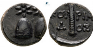
140 Colchis. Dioskourias circa 105-90 BC. Bronze Æ 16 mm, 4,52 g very fine 10