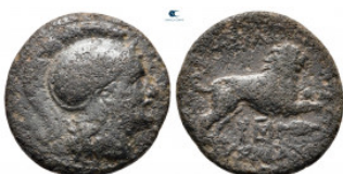
80 Kings of Thrace. Lysimacheia. Macedonian. Lysimachos 305-281 BC. Bronze Æ 20 mm, 4,64 g fine 10