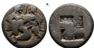
79 Islands off Thrace. Thasos circa 500-480 BC. Drachm AR 15 mm, 3,71 g very fine 10