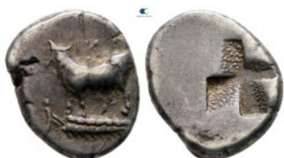
77 Thrace. Byzantion circa 387-340 BC. 1/2 Siglos AR 13 mm, 2,28 g very fine 10