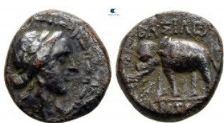
327 Seleukid Kingdom. Antioch. Antiochos III Megas 223-187 BC. Bronze Æ 14 mm, 2,45 g nearly very fine 10