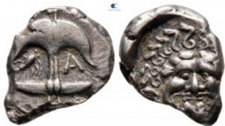
74 Thrace. Apollonia Pontica circa 480-450 BC. Drachm AR 17 mm, 3,24 g very fine 10