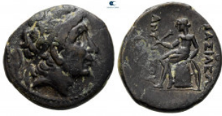
322 Seleukid Kingdom. Antioch on the Orontes. Antiochos I Soter 281-261 BC. Bronze Æ 17 mm, 3,65 g very fine 10