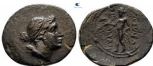
325 Seleukid Kingdom. Magnesia on the Maeander. Seleukos II Kallinikos 246-226 BC. Bronze Æ 20 mm, 3,34 g very fine 10