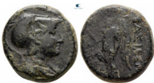
324 Seleukid Kingdom. Antioch. Seleukos II Kallinikos 246-226 BC. Bronze Æ 18 mm, 9,38 g nearly very fine 10