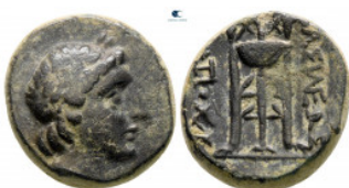
328 Seleukid Kingdom. Sardeis. Antiochos III Megas 223-187 BC. Bronze Æ 20 mm, 8,60 g very fine 10