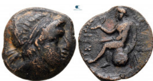
329 Seleukid Kingdom. Uncertain eastern mint. Antiochos III Megas 223-187 BC. Bronze Æ 21 mm, 5,95 g very fine From the Tareq Hani collection 10