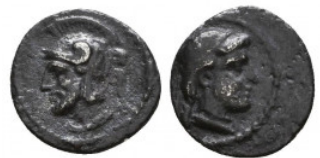
60 Greek Obol, Ca. 350-300 BC. AR. Reference: Condition: Very Fine Weight: 0.6 gr Diameter: 9 mm 1