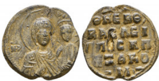
882 Byzantine Lead Seals, 7th - 13th Centuries Reference: Condition: Very Fine Weight: 6.0 gr Diameter: 23 mm 1