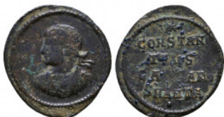
793 Constantine I. A.D. 307/10-337. AE follis Reference: Condition: Very Fine Weight: 1.7 gr Diameter: 19 mm 1