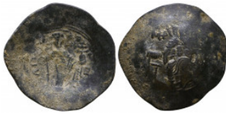
1005 Byzantine Coins , Ae Reference: Condition: Very Fine Weight: 3.0 gr Diameter: 29 mm 1