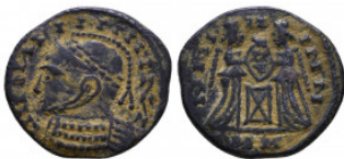
862 Vandal Constantine II. Æ Follis Reference: Condition: Very Fine Weight: 2.8 gr Diameter: 16 mm 1