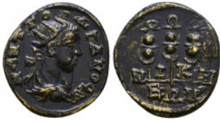
427 Roman Provincial, Ae Reference: Condition: Very Fine Weight: 4.3 gr Diameter: 19 mm 1