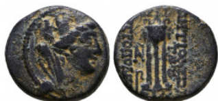
341 SELEUKID KINGDOM. 2nd - 1st Century BC . Ae Reference: Condition: Very Fine Weight: 4.2 gr Diameter: 16mm 1