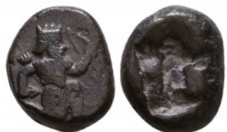
146 PERSIA, Achaemenid Empire. Time of Xerxes II to Artaxerxes II. Circa 455-420 B.C. AR Siglos. Reference: Condition: Very Fine Weight: 5.3 gr Diameter: 14 mm 1