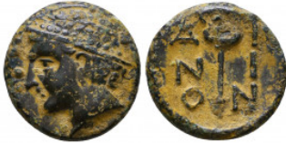
164 Greek Coins, Ae. (359-336 BC), Æ Reference: Condition: Very Fine Weight: 4.6 gr Diameter: 16 mm 1