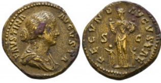
635 Faustina Junior (Augusta, 147-175). Æ Sestertius Reference: Condition: Very Fine Weight: 12.5 gr Diameter: 26 mm 1