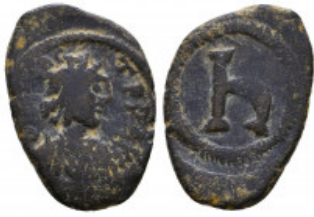
951 Justinian I. AD 527-565. Ae Reference: Condition: Very Fine Weight: 2.5 gr Diameter: 20 mm 1