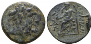
297 Cilicia, Anazarbos. Tarkondimotos I Philantonios. King of Upper Cilicia. 39-31 B.C. AE Reference: Condition: Very Fine Weight: 6.0 gr Diameter: 21 mm 1