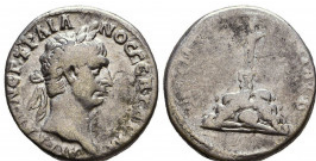
481 Trajan (98-117), Didrachm, Cappadocia: Caesarea, c. 112-117 AD; AR Reference: Condition: Very Fine Weight: 6.45 gr Diameter: 21 mm 1