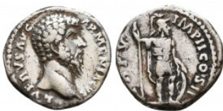
681 Lucius Verus AD 161-169. Ar. Denarius. Reference: Condition: Very Fine Weight: 3.3 gr Diameter: 17 mm 1