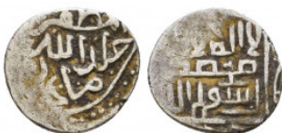
1247 Abbasid , Anonymous Condition: Very Fine Weight: 0.9 gr Diameter: 11 mm 1