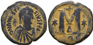
932 Anastasius I AD 491-518. Follis Æ Reference: Condition: Very Fine Weight: 17.6 gr Diameter: 32 mm 1