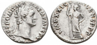
692 Domitian. A.D. 81-96. AR denarius Reference: Condition: Very Fine Weight: 3.5 gr Diameter: 18 mm 1