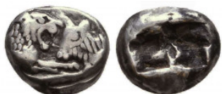
15 KINGS OF LYDIA. Kroisos (Croesus). Circa 564/3 - 550/39. AR Reference: Condition: Very Fine Weight: 1.8 gr Diameter: 9 mm 1