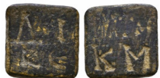
1011 Byzantine Jewelry Weights, Ae Reference: Condition: Very Fine Weight: 1.4 gr Diameter: 10 mm 1