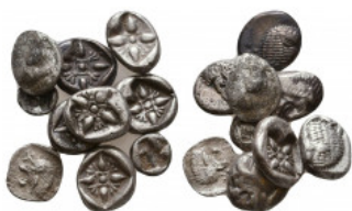
138 Lot of 10 Greek Obols, Ca. 350-300 BC. AR. Reference: Condition: Very Fine Weight: lot gr Diameter: mm 1