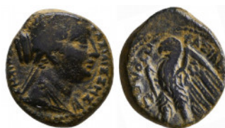
344 Ptolemaic Kings of Egypt. Berenike II, wife of Ptolemy III. AE Reference: Condition: Very Fine Weight: 4.1 gr Diameter: 15 mm 1