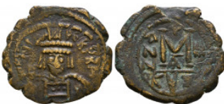
964 Tiberius II Constantine. 578-582. AE Reference: Condition: Very Fine Weight: 11.3 gr Diameter: 32 mm 1