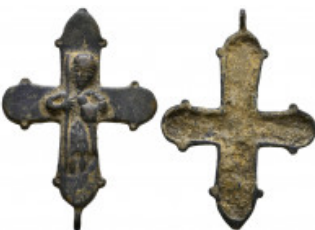
1355 Byzantine Cross Pendant, Ae Bronze, 7th - 13th century AD. Reference: Condit on: Very Fine Weight: 19.8 gr Diameter: 66 mm 1