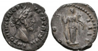
674 Antoninus Pius. Denarius AR. 138-161 AD Reference: Condition: Very Fine Weight: 3.1 gr Diameter: 18 mm 1