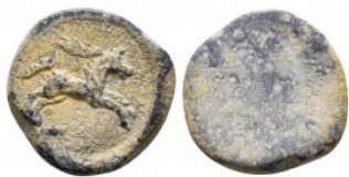
893 Byzantine Lead Seals, 7th - 13th Centuries Reference: Condition: Very Fine Weight: 2.9 gr Diameter: 14 mm 1