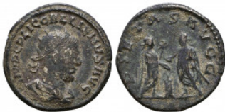
759 GALLIENUS, 254-268 AD. Ar Antoninianus Reference: Condition: Very Fine Weight: 3.5 gr Diameter: 21 mm 1