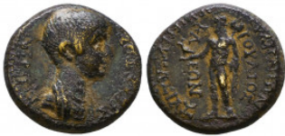
428 Roman Provincial, Ae Reference: Condition: Very Fine Weight: 4.7 gr Diameter: 17 mm 1