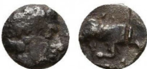
109 Greek Obol, Ca. 350-300 BC. AR. Reference: Condition: Very Fine Weight: 0.1 gr Diameter: 4 mm 1