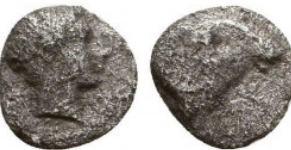
108 Greek Obol, Ca. 350-300 BC. AR. Reference: Condition: Very Fine Weight: 0.3 gr Diameter: 7 mm 1