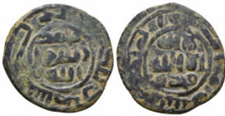
1150 Umayyad: Anonymous, AE fals Condition: Very Fine Weight: 4.1 gr Diameter: 24 mm 1