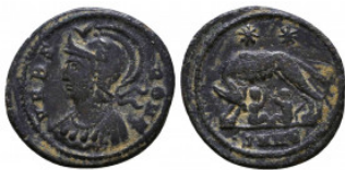
809 Constantine I. A.D. 307/10-337. AE. VRBS ROMA, City Commemorative for Rome. Reference: Condition: Very Fine Weight: 2.7 gr Diameter: 19+ mm 1