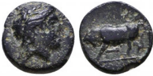
187 IONIA. Magnesia ad Maeandrum. Ae (2nd-1st centuries BC). Reference: Condition: Very Fine Weight: 1.0 gr Diameter: 10 mm 1