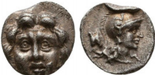
77 Greek Obol, Ca. 350-300 BC. AR. Reference: Condition: Very Fine Weight: 0.9 gr Diameter: 11 mm 1