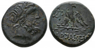
277 PONTUS, Chabakta . Circa 100-85 BC. Æ Reference: Condition: Very Fine Weight: 9.2 gr Diameter: 19 mm 1