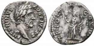
675 Antoninus Pius. Denarius AR. 138-161 AD Reference: Condition: Very Fine Weight: 3.2 gr Diameter: 17 mm 1