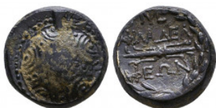
201 LYDIA. Philadelphia. Ae (Circa 100-14 BC). Reference: Condition: Very Fine Weight: 5.8 gr Diameter: 15 mm 1