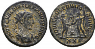
755 Diocletian. A.D. 284-305. Æ antoninianus Reference: Condition: Very Fine Weight: 3.8 gr Diameter: 20 mm 1