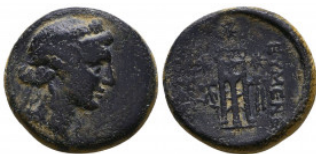
337 SELEUKID KINGDOM. 2nd - 1st Century BC . Ae Reference: Condition: Very Fine Weight: 10.0 gr Diameter: 23 mm 1