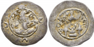
1274 Sasanian Kings, (591-628), Drachm, Reference: Condition: Very Fine Weight: 4.0 gr Diameter: 31 mm 1