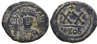
968 Maurice Tiberius. 582-602. AE Reference: Condition: Very Fine Weight: 5.4 gr Diameter: 25 mm 1