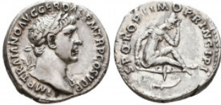
652 Trajan (AD 98-117). AR denarius. Reference: Condition: Very Fine Weight: 3.4 gr Diameter: 17 mm 1