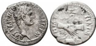
662 Trajan (AD 98-117). AR denarius. Reference: Condition: Very Fine Weight: 3.1 gr Diameter: 18 mm 1