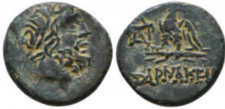
291 Pharnakia, Pontos. c. 180-85 BC. Reference: Condition: Very Fine Weight: 7.3 gr Diameter: 20 mm 1