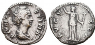
705 Diva Faustina I. Died A.D. 140/1. AR denarius Reference: Condition: Very Fine Weight: 3.3 gr Diameter: 17 mm 1