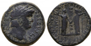
408 Roman Provincial, Ae Reference: Condition: Very Fine Weight: 10.4 gr Diameter: 24mm 1