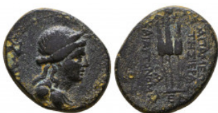
338 SELEUKID KINGDOM. 2nd - 1st Century BC . Ae Reference: Condition: Very Fine Weight: 7.3 gr Diameter: 18 mm 1