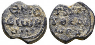
895 Byzantine Lead Seals, 7th - 13th Centuries Reference: Condition: Very Fine Weight: 6.0 gr Diameter: 18 mm 1