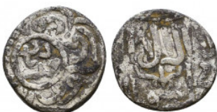
1248 Mamluk AR dirham Ebul Ferec Condition: Very Fine Weight: 0.8 gr Diameter: 12 mm 1