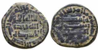
1153 Umayyad: Anonymous, AE fals Condition: Very Fine Weight: 5.6 gr Diameter: 19 mm 1