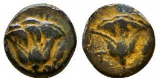
168 ISLANDS off CARIA. Rhodes. Circa 230-205 BC. Æ Reference: Condition: Very Fine Weight: 0.9 gr Diameter: 9 mm 1