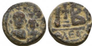
1008 Heraclius. 610-641. AE dodecanummium Reference: Condition: Very Fine Weight: 5.6 gr Diameter: 17 mm 1