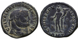
781 Maximianus. A.D. 286-305. Æ Follis. Reference: Condition: Very Fine Weight: 8.7 gr Diameter: 24 mm 1