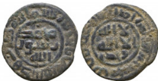
1144 Umayyad: Anonymous, AE fals Condition: Very Fine Weight: 2.1 gr Diameter: 20 mm 1