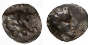
107 Greek Obol, Ca. 350-300 BC. AR. Reference: Condition: Very Fine Weight: 0.1 gr Diameter: 5 mm 1