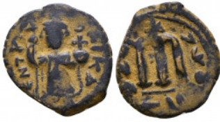
1053 Arab - Byzantine Coins, Ae Reference: Condition: Very Fine Weight: 4.7 gr Diameter: 22 mm 1