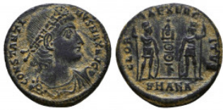
805 Constantine I. A.D. 307/10-337. AE follis Reference: Condition: Very Fine Weight: 1.7 gr Diameter: 16 mm 1