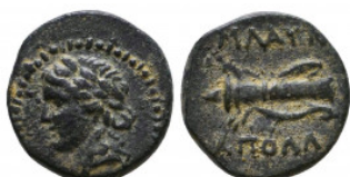
202 Lydia. Blaundos circa 200-100 BC. Reference: Condition: Very Fine Weight: 2.6 gr Diameter: 14 mm 1