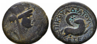
340 SELEUKID KINGDOM. 2nd - 1st Century BC . Ae Reference: Condition: Very Fine Weight: 5.4 gr Diameter: 19 mm 1