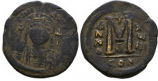
944 Justinian I. AD 527-565. Ae Reference: Condition: Very Fine Weight: 20.2 gr Diameter: 34 mm 1