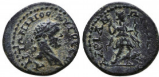
414 Caracalla, 198-217. AD. Ae Reference: Condition: Very Fine Weight: 3.3 gr Diameter: 18 mm 1