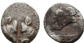
118 Greek Obol, Ca. 350-300 BC. AR. Reference: Condition: Very Fine Weight: 0.3 gr Diameter: 7 mm 1