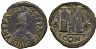
930 Anastasius I AD 491-518. Follis Æ Reference: Condition: Very Fine Weight: 17.3 gr Diameter: 31 mm 1