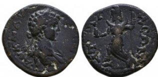
440 Roman Provincial, Ae Reference: Condition: Very Fine Weight: 7.2 gr Diameter: 23 mm 1