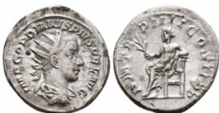
722 Gordian III. A.D. 238-244. AR antoninianus Reference: Condition: Very Fine Weig ht: 4.2 gr Diameter: 22 mm 1