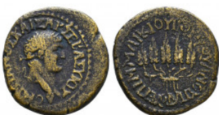
432 Roman Provincial, Ae Reference: Condition: Very Fine Weight: 5.1 gr Diameter: 20 mm 1