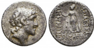
315 Kings of Cappadocia. Ariarathes (333-322 BC). AR Drachm Reference: Condition: Very Fine Weight: 3.9 gr Diameter: 16 mm 1