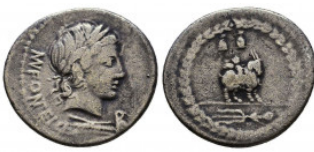
624 Republic Rome Denarius AR Reference: Condition: Very Fine Weight: 3.8 gr Diameter: 19 mm 1