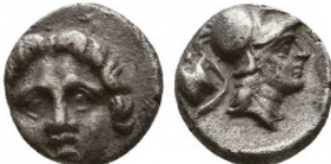
93 Greek Obol, Ca. 350-300 BC. AR. Reference: Condition: Very Fine Weight: 0.9 gr Diameter: 9 mm 1