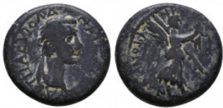
423 Roman Provincial, Ae Reference: Condition: Very Fine Weight: 3.0 gr Diameter: 16 mm 1