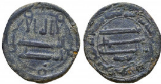
1141 Islamic - Abbasid Ae Fals Condition: Very Fine Weight: 3.2 gr Diameter: 20 mm 1