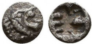
128 Greek Obol, Ca. 350-300 BC. AR. Reference: Condition: Very Fine Weight: 0.2 gr Diameter: 5 mm 1