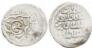
1199 Eretna Beylik, AR Dirhem, Alaeddind Eretna, 747AH Condition: Very Fine Weight: 1.8 gr Diameter: 18 mm 1