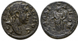
411 Pseudo-autonomous (2nd century). Ae. Reference: Condition: Very Fine Weight: 3.8 gr Diameter: 17 mm 1