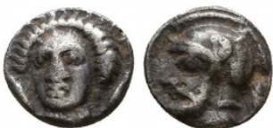
79 Greek Obol, Ca. 350-300 BC. AR. Reference: Condition: Very Fine Weight: 0.7 gr Diameter: 7 mm 1