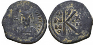
967 Tiberius II Constantine. 578-582. Æ Reference: Condition: Very Fine Weight: 5.0 gr Diameter: 22 mm 1