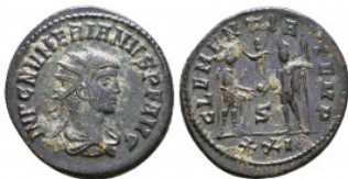
737 Numerian. As Caesar, A.D. 282-283. AE antoninianus Reference: Condition: Very Fine Weight: 3.9 gr Diameter: 21 mm 1