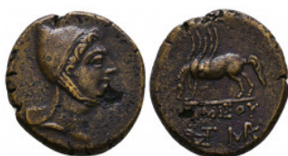
264 PONTOS, Amisos. Circa 109-89 BC. Æ Reference: Condition: Very Fine Weight: 10.3 gr Diameter: 23mm 1