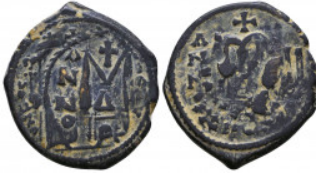
958 Justin II and Sophia. 565-578. AE Reference: Condition: Very Fine Weight: 10.5 gr Diameter: 27 mm 1