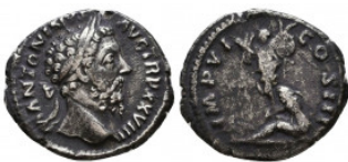
680 Marcus Aurelius , as Caesar (139-161 AD). AR Denarius Reference: Condition: Very Fine Weight: 3.1 gr Diameter: 19 mm 1