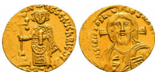
912 Justinian II AV Solidus. First reign. Constantinople, AD 692-695. Obv. IHS CRISTOS REX REX NANTIM, facing bust of Christ Pantokrator / D IHS IINI-AN-YS SCR4 CHRISI, Justinian standing facing, holding cross potent on steps in right hand, Reference: CONOP. DOC 7c.2; MIB 8a; Sear 1248. Condition: Very Fine Weight: 4.4 gr Diameter: 19 mm 1