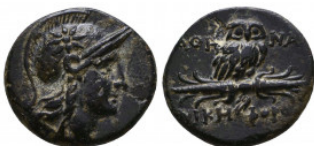
209 MYSIA. Pergamon. Ae (Circa 200-133 BC). Reference: Condition: Very Fine Weight: 3.4 gr Diameter: 16 mm 1