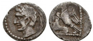
63 Greek Obol, Ca. 350-300 BC. AR. Reference: Condition: Very Fine Weight: 0.7 gr Diameter: 10 mm 1