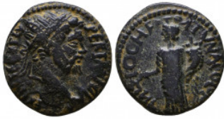
435 Roman Provincial, Ae Reference: Condition: Very Fine Weight: 6.1 gr Diameter: 22 mm 1