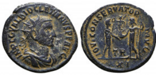
757 Diocletian. A.D. 284-305. Æ antoninianus Reference: Condition: Very Fine Weight: 3.3 gr Diameter: 21 mm 1