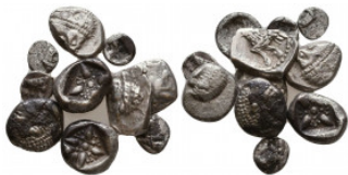
142 Lot of 10 Greek Obols, Ca. 350-300 BC. AR. Reference: Condition: Very Fine Weight: lot gr Diameter: mm 1