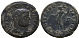
758 Diocletian. A.D. 284-305. Æ Follis Reference: Condition: Very Fine Weight: 8.0 gr Diameter: 27 mm 1