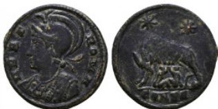
807 Constantine I. A.D. 307/10-337. AE. VRBS ROMA, City Commemorative for Rome. Reference: Condition: Very Fine Weight: 2.5 gr Diameter: 18 mm 1