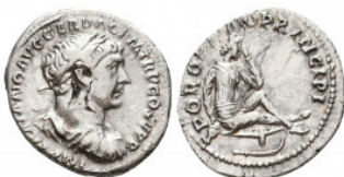
657 Trajan (AD 98-117). AR denarius. Reference: Condition: Very Fine Weight: 3.2 gr Diameter: 19 mm 1