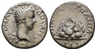
478 CAPPADOCIA, Caesarea. Commodus, as Caesar. 175-177 AD. AR Reference: Condition: Very Fine Weight: 4.3 gr Diameter: 19 mm 1