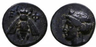
169 IONIA. Ephesus. AE, ca. 305-288 B.C. Reference: Condition: Very Fine Weight: 1.3 gr Diameter: 11 mm 1