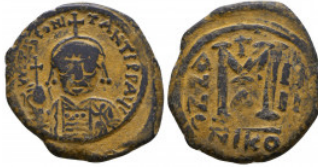
966 Tiberius II Constantine. 578-582. Æ Reference: Condition: Very Fine Weight: 13.8 gr Diameter: 29 mm 1