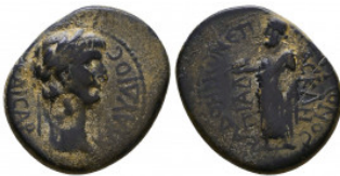
405 Roman Provincial, Ae Reference: Condition: Very Fine Weight: 4.5 gr Diameter: 22 mm 1