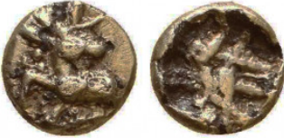
10 IONIA, Ephesos. Before 600 BC. EL . Reference: Condition: Very Fine Weight: 0.3 gr Diameter: 6 mm 1