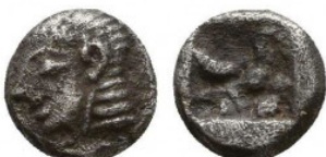
132 Greek Obol, Ca. 350-300 BC. AR. Reference: Condition: Very Fine Weight: 0.4 gr Diameter: 6 mm 1