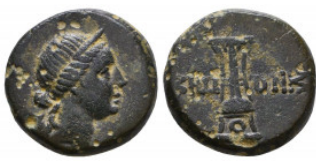
290 Paphlagonia, Sinope. 120-63 B.C. Æ Reference: Condition: Very Fine Weight: 8.2 gr Diameter: 19 mm 1