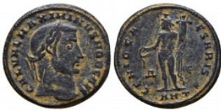
782 Maximianus. A.D. 286-305. Æ Follis. Reference: Condition: Very Fine Weight: 6.1 gr Diameter: 23 mm 1