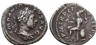
698 ELAGABALUS, 218-222 AD. AR Denarius Reference: Condition: Very Fine Weight: 2.8 gr Diameter: 18 mm 1