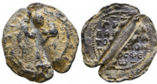
877 Byzantine Lead Seals, 7th - 13th Centuries Reference: Condition: Very Fine Weight: 9.9 gr Diameter: 26 mm 1