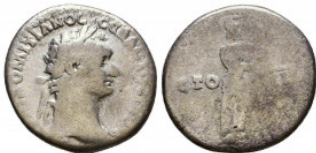
479 CAPPADOCIA, Caesarea. Domitian. 81-96. AR Didrachm Reference: Condition: Very Fine Weight: 6.3 gr Diameter: 20 mm 1