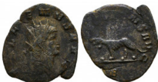
768 GALLIENUS, 254-268 AD. AE Antoninianus Reference: Condition: Very Fine Weight: 2.2 gr Diameter: 20 mm 1