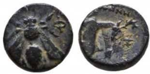
173 IONIA. Ephesus. AE, ca. 305-288 B.C. Reference: Condition: Very Fine Weight: 0.8 gr Diameter: 9 mm 1