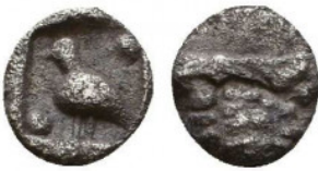
103 Greek Obol, Ca. 350-300 BC. AR. Reference: Condition: Very Fine Weight: 0.2 gr Diameter: 5 mm 1