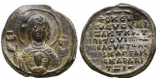
865 Byzantine Lead Seals, 7th - 13th Centuries Reference: Condition: Very Fine Weight: 10.9 gr Diameter: 27 mm 1