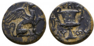
165 IONIA, Teos. Circa 370-300 BC. Æ Hemichalkon Reference: Condition: Very Fine Weight: 1.4 gr Diameter: 11 mm 1