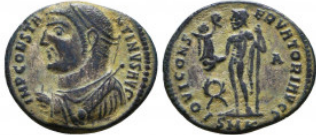
804 Constantine I. A.D. 307/10-337. AE follis Reference: Condition: Very Fine Weight: 2.9 gr Diameter: 19 mm 1