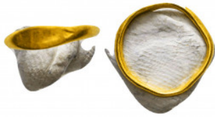
1287 Ancient Roman Very Special and elegant Solid Gold Ring . 1st - 3rd century AD Reference: Condition: Very Fine Weight: 0.7 gr Diameter: 13 mm 1