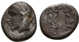
135 Greek Obol, Ca. 350-300 BC. AR. Reference: Condition: Very Fine Weight: 8.8 gr Diameter: 9 mm 1