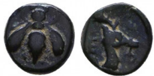
174 IONIA. Ephesus. AE, ca. 305-288 B.C. Reference: Condition: Very Fine Weight: 0.6 gr Diameter: 8 mm 1