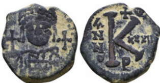
955 Justinian I. AD 527-565. Ae Reference: Condition: Very Fine Weight: 8.5 gr Diameter: 23 mm 1