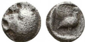
122 Greek Obol, Ca. 350-300 BC. AR. Reference: Condition: Very Fine Weight: 0.2 gr Diameter: 5 mm 1