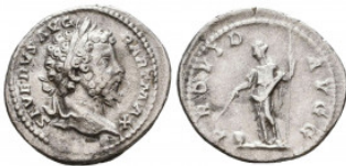
665 Septimius Severus. A.D. 193-211. AR denarius Reference: Condition: Very Fine Weight: 3.2 gr Diameter: 20 mm 1