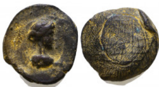
1278 Ancient Roman Terracotta Theater Ticket Reference: Condition: Very Fine Weight: 1.7 gr Diameter: 17 mm 1