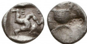
86 Greek Obol, Ca. 350-300 BC. AR. Reference: Condition: Very Fine Weight: 1.0 gr Diameter: 10 mm 1