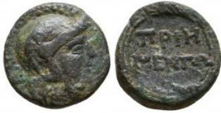
203 IONIA. Priene. Ae (Circa 334-320 BC). Reference: Condition: Very Fine Weight: 2.9 gr Diameter: 15 mm 1