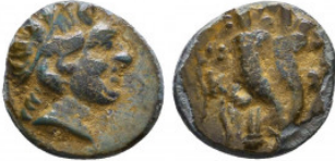
188 CARIA. Kaunos. Ae (Circa 191-166 BC). Reference: Condition: Very Fine Weight: 1.3 gr Diameter: 11 mm 1