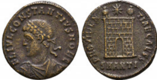
820 Constantine II. As Caesar, A.D. 317-337. Æ Follis Reference: Condition: Very Fine Weight: 3.3 gr Diameter: 18mm 1