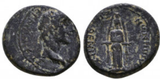
424 Roman Provincial, Ae Reference: Condition: Very Fine Weight: 3.2 gr Diameter: 15 mm 1