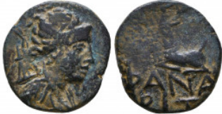
244 CIMMERIAN BOSPOROS. Phanagoria. Ae Tetrachalkon (Circa 105-90 or 95-86 B C). Struck under Mithradates VI Eupator. Obv: Bust of Artemis right, with bow and quiver over shoulder. Rev: ΦΑΝΑΓΟΠΙΤΩΝ. Stag reclining left. Rare Reference: MacDonald 166/1; HGC 7, 166. Condition: Very Fine Weight: 4.1 gr Diameter: 19 mm 1