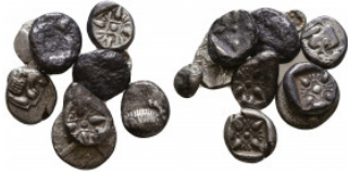
141 Lot of 10 Greek Obols, Ca. 350-300 BC. AR. Reference: Condition: Very Fine Weight: lot gr Diameter: mm 1