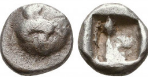
113 Greek Obol, Ca. 350-300 BC. AR. Reference: Condition: Very Fine Weight: 1.4 gr Diameter: 10 mm 1