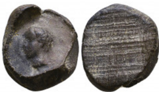
1275 Ancient Roman Terracotta Theater Ticket Reference: Condition: Very Fine Weight: 3.0 gr Diameter: 22 mm 1