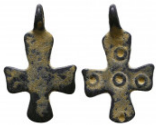
1352 Byzantine Cross Pendant, Ae Bronze, 7th - 13th century AD. Reference: Condit on: Very Fine Weight: 1.4 gr Diameter: 25 mm 1