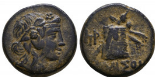
272 PONTOS, Amisos. Circa 109-89 BC. Æ Reference: Condition: Very Fine Weight: 7.8 gr Diameter: 20 mm 1