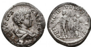
697 Geta, Caesar. A.D. 198-209. AR denarius Reference: Condition: Very Fine Weight: 3.3 gr Diameter: 18 mm 1