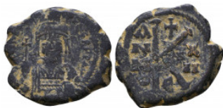
972 Maurice Tiberius. 582-602. AE Reference: Condition: Very Fine Weight: 6.1 gr Diameter: 21 mm 1