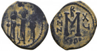
1054 Arab - Byzantine Coins, Ae Reference: Condition: Very Fine Weight: 5.8 gr Diameter: 22 mm 1