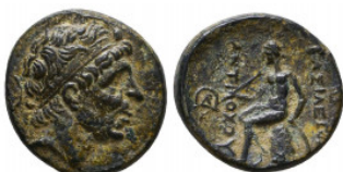
322 SELEUKID KINGDOM. 2nd - 1st Century BC . Ae Reference: Condition: Very Fine Weight: 3.5 gr Diameter: 15 mm 1