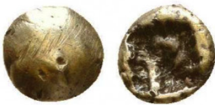
11 IONIA, Uncertain. Circa 625-600 BC. EL Reference: Condition: Very Fine Weight: 0.2 gr Diameter: 4 mm 1