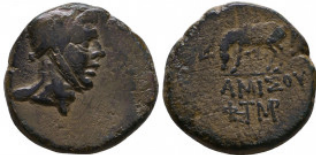
268 PONTOS, Amisos. Circa 109-89 BC. Æ Reference: Condition: Very Fine Weight: 12.45 gr Diameter: 23 mm 1