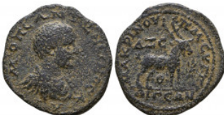
463 CILICIA, Aegeae. Diadumenian, as Caesar. 217-218 AD. Æ . Dated year 264 (21 7/8 AD). Bare-headed, draped, and cuirassed bust right / Goat standing right with torch es tied to horns; palm below, date above. SNG Levante 1751 Condition: Very Fine Weig ht: 10.2 gr Diameter: 27mm 1