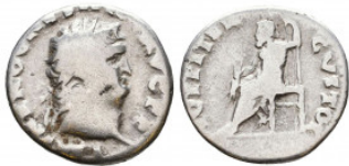
639 Nero. Denarius. 54-68 AD. Denarius, Reference: Condition: Very Fine Weight: 3.0 gr Diameter: 16 mm 1