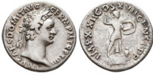
691 Domitian. A.D. 81-96. AR denarius Reference: Condition: Very Fine Weight: 3.5 gr Diameter: 18 mm 1