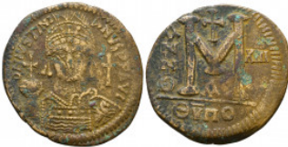
940 Justinian I. AD 527-565. Ae Reference: Condition: Very Fine Weight: 20.8 gr Diameter: 37 mm 1