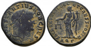
788 CONSTANTIUS I, 296-305 AD. Silvered AE Follis Reference: Condition: Very Fine Weight: 9.1 gr Diameter: 26 mm 1