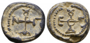
902 Byzantine Lead Seals, 7th - 13th Centuries Reference: Condition: Very Fine Weight: 10.6 gr Diameter: 20mm 1