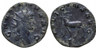
765 GALLIENUS, 254-268 AD. AE Antoninianus Reference: Condition: Very Fine Weight: 2.8 gr Diameter: 20 mm 1