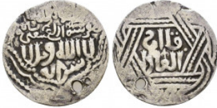
1139 Islamic, Mongols. Ilkhanids. Anonym Tiflis AR Dirhem. Condition: Very Fine Weight: 2.44 gr Diameter: 20 mm 1