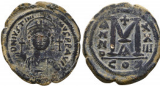
952 Justinian I. AD 527-565. Ae Reference: Condition: Very Fine Weight: 19.0 gr Diameter: 36mm 1