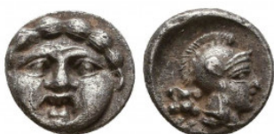
72 Greek Obol, Ca. 350-300 BC. AR. Reference: Condition: Very Fine Weight: 1.0 gr Diameter: 10 mm 1