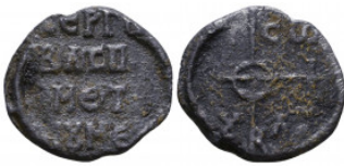
894 Byzantine Lead Seals, 7th - 13th Centuries Reference: Condition: Very Fine Weight: 7.7 gr Diameter: 25 mm 1