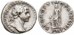
659 Trajan (AD 98-117). AR denarius. Reference: Condition: Very Fine Weight: 3.4 gr Diameter: 18 mm 1