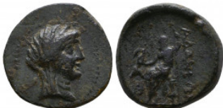
295 Cilicia, Adana. Ca. 164-27 B.C. AE Reference: Condition: Very Fine Weight: 6.9 gr Diameter: 20 mm 1