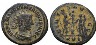
738 Numerian. As Caesar, A.D. 282-283. AE antoninianus Reference: Condition: Very Fine Weight: 3.3 gr Diameter: 19 mm 1