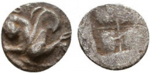
121 Greek Obol, Ca. 350-300 BC. AR. Reference: Condition: Very Fine Weight: 0.3 gr Diameter: 8 mm 1