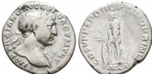
663 Trajan (AD 98-117). AR denarius. Reference: Condition: Very Fine Weight: 3.0 gr Diameter: 18 mm 1