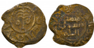
1159 Umayyad: Anonymous, AE fals Condition: Very Fine Weight: 2.8 gr Diameter: 20 mm 1