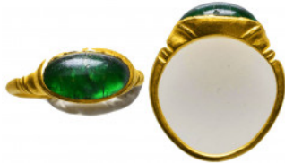
1282 Ancient Roman Very Special and elegant Solid Gold Ring precious stone inlaid on bezel . 1st - 3rd century AD Reference: Condition: Very Fine Weight: 3.7 gr Diameter: 22 mm 1