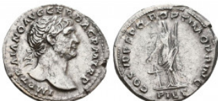
656 Trajan (AD 98-117). AR denarius. Reference: Condition: Very Fine Weight: 3.3 gr Diameter: 19 mm 1