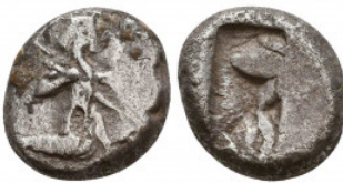
150 PERSIA, Achaemenid Empire. Time of Xerxes II to Artaxerxes II. Circa 455-420 B C. AR Siglos. Reference: Condition: Very Fine Weight: 5.4 gr Diameter: 15 mm 1