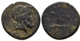
261 PAPHLAGONIA, Amastris. Circa 105-85 BC. Æ Reference: Condition: Very Fine Weight: 19.9 gr Diameter: 28mm 1