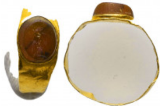
1283 Ancient Roman Very Special and elegant Solid Gold Ring precious stone inlaid on bezel . 1st - 3rd century AD Reference: Condition: Very Fine Weight: 0.9 gr Diameter: 16 mm 1