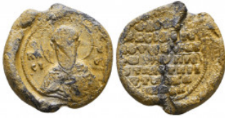
875 Byzantine Lead Seals, 7th - 13th Centuries Reference: Condition: Very Fine Weight: 9.9 gr Diameter: 23 mm 1