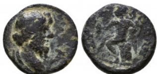
447 Roman Provincial, Ae Reference: Condition: Very Fine Weight: 2.4 gr Diameter: 14 mm 1