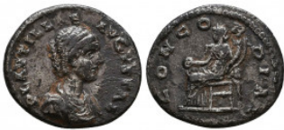
703 Plautilla. Augusta, A.D. 202-205. AR denarius Reference: Condition: Very Fine Weight: 3.1 gr Diameter: 19 mm 1