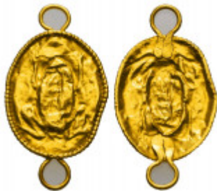
1291 Ancient Roman Very Special and elegant Solid Gold Pendant end with frog relief on . 1st - 3rd century AD Reference: Condition: Very Fine Weight: 0.6 gr Diameter: 23 mm 1