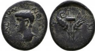
404 Roman Provincial, Ae Reference: Condition: Very Fine Weight: 5.3 gr Diameter: 20 mm 1