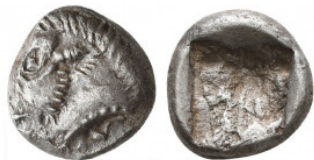
13 ASIA MINOR, Uncertain mint. 5th century BC. AR Reference: Condition: Very Fine Weight: 3.2 gr Diameter: 12 mm 1