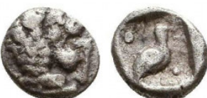
110 Greek Obol, Ca. 350-300 BC. AR. Reference: Condition: Very Fine Weight: 0.2 gr Diameter: 5 mm 1