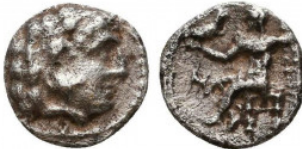
82 Greek Obol, Ca. 350-300 BC. AR. Reference: Condition: Very Fine Weight: 0.6 gr Diameter: 8 mm 1