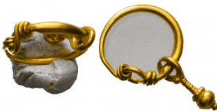
1297 Ancient Roman Very Special and elegant Solid Gold Earring . 1st - 3rd century A D Reference: Condition: Very Fine Weight: 2.4 gr Diameter: 15 mm 1