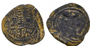
1161 Sasaniden Condition: Very Fine Weight: 1.1 gr Diameter: 16 mm 1