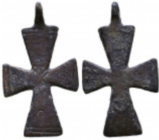
1351 Byzantine Cross Pendant, Ae Bronze, 7th - 13th century AD. Reference: Condit on: Very Fine Weight: 4.7 gr Diameter: 41 mm 1