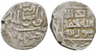
1241 Islamic Coins, Reference: Condition: Very Fine Weight: 1.5 gr Diameter: 13 mm 1