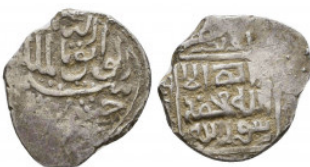
1245 Islamic Coins, Reference: Condition: Very Fine Weight: 1.4 gr Diameter: 15 mm 1