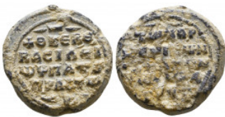
878 Byzantine Lead Seals, 7th - 13th Centuries Reference: Condition: Very Fine Weight: 16.0 gr Diameter: 24mm 1