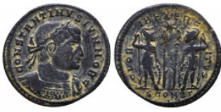
821 Constantine II. As Caesar, A.D. 317-337. Æ Follis Reference: Condition: Very Fine Weight: 2.0 gr Diameter: 18 mm 1