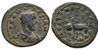
461 Valerianus I (253-260 AD). AE, Anazarbos, Cilicia Reference: Condition: Very Fine Weight: 7.9 gr Diameter: 23 mm 1