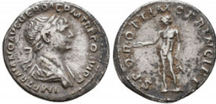
660 Trajan (AD 98-117). AR denarius. Reference: Condition: Very Fine Weight: 3.2 gr Diameter: 19 mm 1