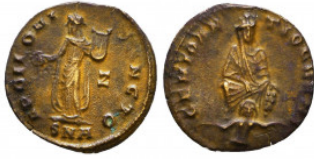
859 Anonymous Pagan Issues. Ca. A.D. 305-313. AE quarter follis Reference: Condition: Very Fine Weight: 1.6 gr Diameter: 16 mm 1