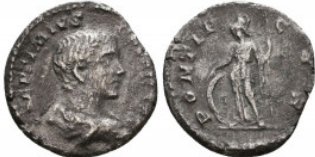
700 ELAGABALUS, 218-222 AD. AR Denarius Reference: Condition: Very Fine Weight: 2.1 gr Diameter: 17 mm 1