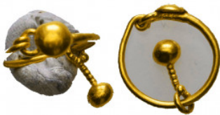
1296 Ancient Roman Very Special and elegant Solid Gold Earring . 1st - 3rd century A D Reference: Condition: Very Fine Weight: 1.4 gr Diameter: 15 mm 1