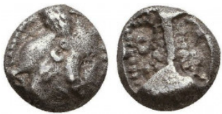
59 Greek Obol, Ca. 350-300 BC. AR. Reference: Condition: Very Fine Weight: 0.8 gr Diameter: 7 mm 1