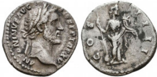
676 Antoninus Pius. Denarius AR. 138-161 AD Reference: Condition: Very Fine Weight: 3.2 gr Diameter: 17 mm 1