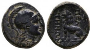
293 Greek Coins, Ae. (359-336 BC), Æ Reference: Condition: Very Fine Weight: 6.2 gr Diameter: 19 mm 1