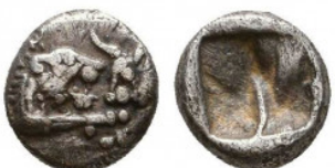
124 Greek Obol, Ca. 350-300 BC. AR. Reference: Condition: Very Fine Weight: 0.3 gr Diameter: 6 mm 1