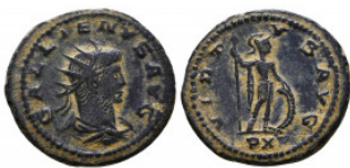
760 GALLIENUS, 254-268 AD. AE Antoninianus Reference: Condition: Very Fine Weight: 4.5 gr Diameter: 21 mm 1