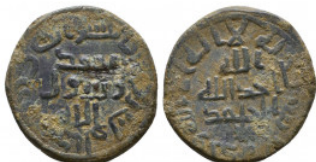
1152 Umayyad: Anonymous, AE fals Condition: Very Fine Weight: 3.8 gr Diameter: 19 mm 1