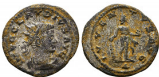
769 Claudius II Gothicus. A.D. 268-270. AE antoninianus Reference: Condition: Very Fine Weight: 3.4 gr Diameter: 22 mm 1