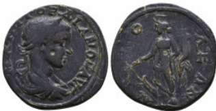
638 GORDIAN III. 238-244 AD. Ae. Reference: Condition: Very Fine Weight: 11.8 gr Diameter: 27mm 1