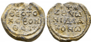
873 Byzantine Lead Seals, 7th - 13th Centuries Reference: Condition: Very Fine Weight: 12.8 gr Diameter: 23 mm 1