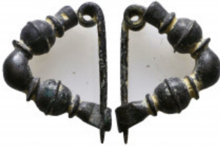
1357 Description will be added Reference: Condition: Very Fine Weight: 32.0 gr Diameter: 45 mm 1