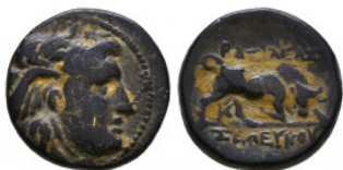
321 SELEUKID KINGDOM. 2nd - 1st Century BC . Ae Reference: Condition: Very Fine Weight: 2.7 gr Diameter: 13 mm 1