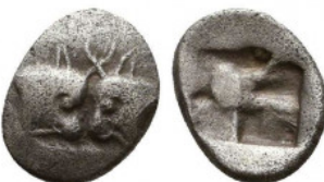
117 Greek Obol, Ca. 350-300 BC. AR. Reference: Condition: Very Fine Weight: 0.4 gr Diameter: 9 mm 1