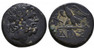
288 BITHYNIA DIAS . Circa 100-85 BC. Æ Reference: Condition: Very Fine Weight: 8.5 gr Diameter: 19 mm 1