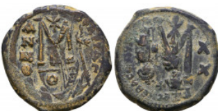
957 Justin II and Sophia. 565-578. AE Reference: Condition: Very Fine Weight: 13.4 gr Diameter: 29 mm 1