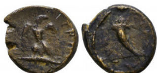
343 Uncertain in Asia, Uncertain. Trajan. A.D. 98-117. AE Reference: Condition: Very Fine Weight: 3.9 gr Diameter: 15 mm 1