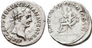
651 Trajan (AD 98-117). AR denarius. Reference: Condition: Very Fine Weight: 3.2 gr Diameter: 18 mm 1