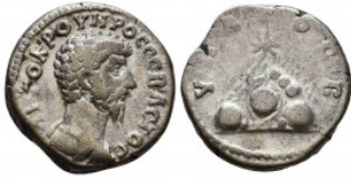
475 CAPPADOCIA, Caesarea-Eusebia. Lucius Verus, 161-169. Didrachm Reference: Condition: Very Fine Weight: 6.5 gr Diameter: 19 mm 1