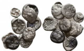
137 Lot of 10 Greek Obols, Ca. 350-300 BC. AR. Reference: Condition: Very Fine Weight: lot gr Diameter: mm 1