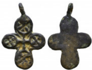
1354 Byzantine Cross Pendant, Ae Bronze, 7th - 13th century AD. Reference: Condit on: Very Fine Weight: 4.3 gr Diameter: 32 mm 1