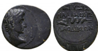
416 Phrygia. Laodikeia . Augustus 27 BC-14 AD. Bronze Æ . Bare head right / ZEYΞΙΣ ΦΙΛΑΛΗΘΗΣ ΛΑΟΔΙΚΕΩΝ, snake entwined around torch. Reference: Condition: Very Fine Weight: 2.0 gr Diameter: 17 mm 1