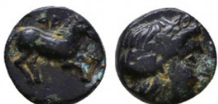
193 Gargara , Troas. AE, c. late 3rd to early 2nd Century BC. Reference: Condition: Very Fine Weight: 0.6 gr Diameter: 7 mm 1