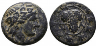
246 AEOLIS. Temnos. 3rd century BC. AE. Head of Dionysos to right, wearing wreath of ivy and fruit. Rev. TA Grape bunch on vine with tendrils. Babelon, Waddington, 1346. BMC -. SNG Copenhagen -. SNG München -. SNG von Aulock Reference: Condition: Very Fine Weight: 3.9 gr Diameter: 18 mm 1