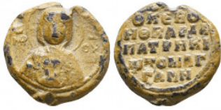
891 Byzantine Lead Seals, 7th - 13th Centuries Reference: Condition: Very Fine Weight: 5.7 gr Diameter: 17 mm 1