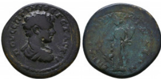
430 Roman Provincial, Ae Reference: Condition: Very Fine Weight: 9.1 gr Diameter: 24 mm 1