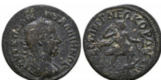
442 Roman Provincial, Ae Reference: Condition: Very Fine Weight: 10.4 gr Diameter: 27mm 1