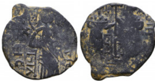
1057 Arab - Byzantine Coins, Ae Reference: Condition: Very Fine Weight: 4.2 gr Diameter: 24 mm 1