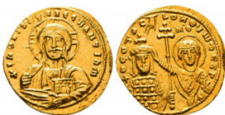
913 JOHN I TZIMISCES (969-976 AD). AV Solidus, Constantinopolis. Obv. +IHSXISREX REX NANTIM, Nimbate bust of Christ facing, raising hand in benediction and holding book of Gospels. Rev. ΘΕΟΤΟC-ΒΟΗΘ'ΙΩΔΕSP, Facing bust of John on left, holding patriarchal cross, manus Dei above his head, crowned by bust of Virgin facing on right. Condition: Excellent! Reference: Sear 1785. Weight: 4.4 gr Diameter: 21 mm 1