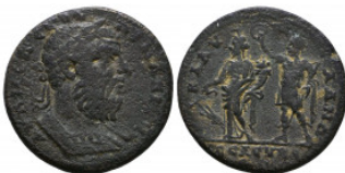
466 CILICIA. Seleucia ad Calycadnum. Macrinus (217-218). Ae. Obv: AV K M OΠ CЄ OVHP MAKΠINO. Laureate and cuirassed bust right; c/m: Annulet within triangle. Rev: CЄΛЄVKEQN / KAAVKAΔNΩ. Tyche standing left, holding rudder and cornucopia; to ri ght, Macrinus standing left, holding sceptre and wreath. Ziegler 447 Condition: Very Fin e Weight: 12.6 gr Diameter: 29 mm 1