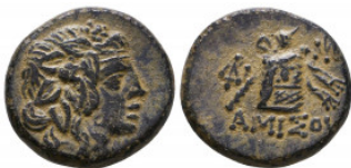
271 PONTOS, Amisos. Circa 109-89 BC. Æ Reference: Condition: Very Fine Weight: 8.4 gr Diameter: 21 mm 1