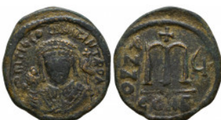
965 Tiberius II Constantine. 578-582. AE Reference: Condition: Very Fine Weight: 12.7 gr Diameter: 29 mm 1