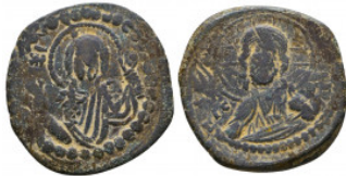
993 Byzantine Coins Ae, Anonymous, Bust of Jesus, 7th - 13th Centuries Reference: Condition: Very Fine Weight: 7.7 gr Diameter: 26 mm 1