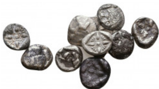
139 Lot of 10 Greek Obols, Ca. 350-300 BC. AR. Reference: Condition: Very Fine Weight: lot gr Diameter: mm 1