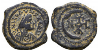
947 Justinian I. AD 527-565. Ae Reference: Condition: Very Fine Weight: 2.7 gr Diameter: 16 mm 1