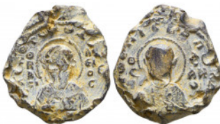
869 Byzantine Lead Seals, 7th - 13th Centuries Reference: Condition: Very Fine Weight: 19.0 gr Diameter: 27mm 1