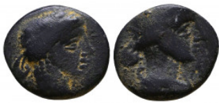
445 Roman Provincial, Ae Reference: Condition: Very Fine Weight: 3.0 gr Diameter: 16 mm 1