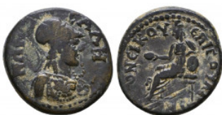
410 Pseudo-autonomous (2nd century). Ae. Reference: Condition: Very Fine Weight: 4.0 gr Diameter: 18 mm 1