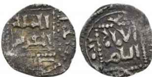
1253 Ayyubid AR dirham, AL - Melik Al-Nasir RR Condition: Very Fine Weight: 0.9 gr Diameter: 13 mm 1