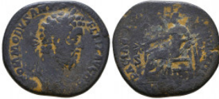
636 COMMODUS. 177-192 AD. Æ Sestertius Reference: Condition: Very Fine Weight: 20.4 gr Diameter: 31mm 1