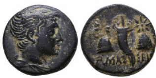
281 PAPHLAGONIA, Amastris. Circa 105-85 BC. Æ Reference: Condition: Very Fine Weight: 4.0 gr Diameter: 15 mm 1