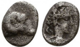
91 Greek Obol, Ca. 350-300 BC. AR. Reference: Condition: Very Fine Weight: 0.5 gr Diameter: 8 mm 1