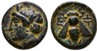
171 IONIA. Ephesus. AE, ca. 305-288 B.C. Reference: Condition: Very Fine Weight: 1.3 gr Diameter: 11 mm 1