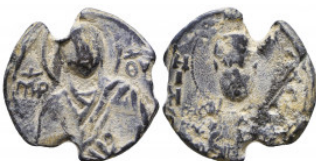
906 Byzantine Lead Seals, 7th - 13th Centuries Reference: Condition: Very Fine Weight: 9.4 gr Diameter: 28 mm 1