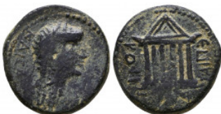
441 Roman Provincial, Ae Reference: Condition: Very Fine Weight: 8.0 gr Diameter: 23 mm 1