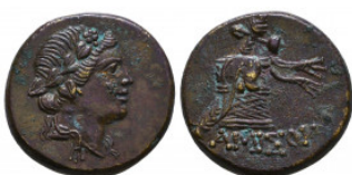
274 PONTOS, Amisos. Circa 109-89 BC. Æ Reference: Condition: Very Fine Weight: 8.2 gr Diameter: 22 mm 1