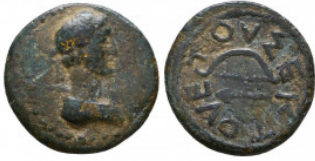
419 Roman Provincial, Ae Reference: Condition: Very Fine Weight: 3.3 gr Diameter: 18 mm 1