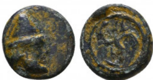
192 TROAS. Biryti. Ae (Circa 350-300 BC). Reference: Condition: Very Fine Weight: 0.9 gr Diameter: 9 mm 1