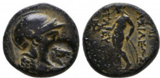
336 SELEUKID KINGDOM. 2nd - 1st Century BC . Ae Reference: Condition: Very Fine Weight: 5.0 gr Diameter: 15 mm 1