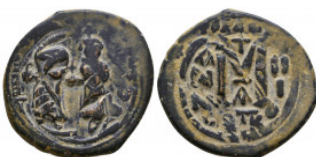
963 Justin II and Sophia. 565-578. AE Reference: Condition: Very Fine Weight: 11.8 gr Diameter: 28 mm 1