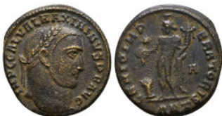
785 Maximinus II Daza. A.D. 309-313. AE follis Reference: Condition: Very Fine Weight: 6.0 gr Diameter: 21 mm 1