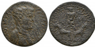
462 CILICIA. Gallienus (253-268). Ae. Reference: Condition: Very Fine Weight: 20.7 gr Diameter: 28mm 1