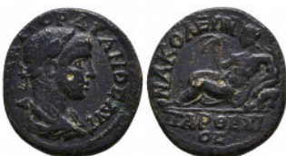
433 Roman Provincial, Ae Reference: Condition: Very Fine Weight: 5.9 gr Diameter: 23 mm 1