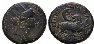
339 SELEUKID KINGDOM. 2nd - 1st Century BC . Ae Reference: Condition: Very Fine Weight: 5.5 gr Diameter: 17 mm 1