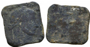
792 Constantine I. A.D. 307/10-337. AE follis Reference: Condition: Very Fine Weight: 4.2 gr Diameter: 21 mm 1