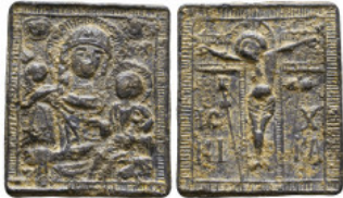
908 Very Beautiful Byzantine Lead Amulet, 7th - 13th Centuries Reference: Condition: Very Fine Weight: 5.2 gr Diameter: 27 mm 1