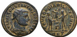
790 CONSTANTIUS I, 296-305 AD. Silvered AE antoninianus Reference: Condition: Very Fine Weight: 2.8 gr Diameter: 20 mm 1