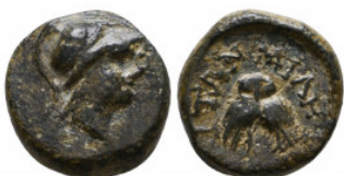
250 Mysia, Miletopolis, c. 4th century BC. Æ Reference: Condition: Very Fine Weight: 4.6 gr Diameter: 14 mm 1