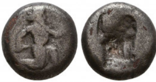
149 PERSIA, Achaemenid Empire. Time of Xerxes II to Artaxerxes II. Circa 455-420 B C. AR Siglos. Reference: Condition: Very Fine Weight: 4.4 gr Diameter: 14 mm 1