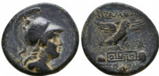
247 PHRYGIA. Apameia. Ae (Circa 88-40 BC). Reference: Condition: Very Fine Weight: 8.3 gr Diameter: 23 mm 1