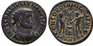
756 Diocletian. A.D. 284-305. Æ antoninianus Reference: Condition: Very Fine Weight: 3.2 gr Diameter: 18 mm 1