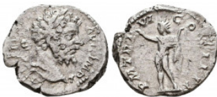
666 Septimius Severus. A.D. 193-211. AR denarius Reference: Condition: Very Fine Weight: 3.4 gr Diameter: 18 mm 1