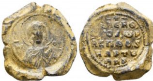
886 Byzantine Lead Seals, 7th - 13th Centuries Reference: Condition: Very Fine Weight: 16.5 gr Diameter: 29mm 1