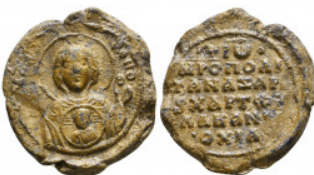
866 Byzantine Lead Seals, 7th - 13th Centuries Reference: Condition: Very Fine Weight: 14.0gr Diameter: 28mm 1