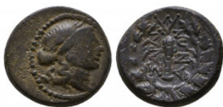
199 LYDIA. Sardes. Ae (Circa 133 BC-14 AD). Ae Reference: Condition: Very Fine Weight: 3.8 gr Diameter: 15 mm 1