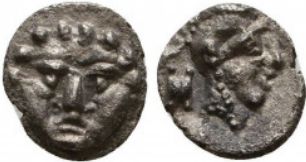
74 Greek Obol, Ca. 350-300 BC. AR. Reference: Condition: Very Fine Weight: 0.8 gr Diameter: 9 mm 1