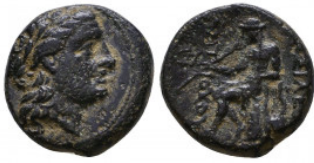
323 SELEUKID KINGDOM. 2nd - 1st Century BC . Ae Reference: Condition: Very Fine Weight: 4.8 gr Diameter: 17 mm 1