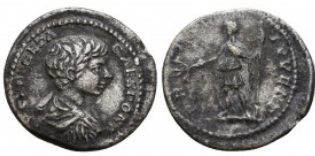
701 Geta, Caesar. A.D. 198-209. AR denarius Reference: Condition: Very Fine Weight: 3.0 gr Diameter: 19 mm 1