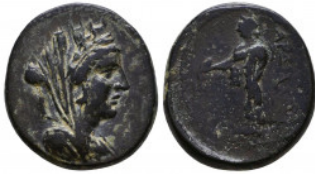
195 LYDIA. Sardes. Ae (Circa 133 BC-14 AD). Ae Reference: Condition: Very Fine Weight: 7.6 gr Diameter: 22 mm 1