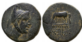
266 PONTOS, Amisos. Circa 109-89 BC. Æ Reference: Condition: Very Fine Weight: 13.2 gr Diameter: 24 mm 1