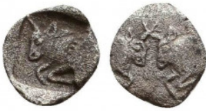
111 Greek Obol, Ca. 350-300 BC. AR. Reference: Condition: Very Fine Weight: 0.1 gr Diameter: 5 mm 1