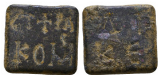
1010 Byzantine Jewelry Weights, Ae Reference: Condition: Very Fine Weight: 3.5 gr Diameter: 14 mm 1