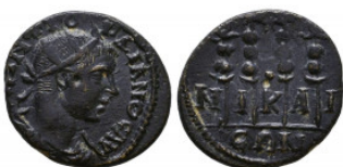
426 Roman Provincial, Ae Reference: Condition: Very Fine Weight: 3.4 gr Diameter: 18 mm 1