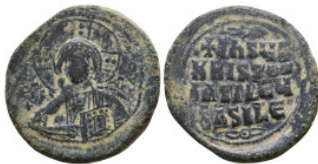
992 Byzantine Coins Ae, Anonymous, Bust of Jesus, 7th - 13th Centuries Reference: Condition: Very Fine Weight: 13.1 gr Diameter: 29 mm 1