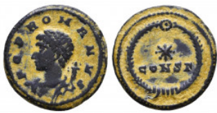
861 Populus Romanus, Commemorative Series. A.D. 330-354. Æ Reference: Condition: Extremely Fine Weight: 1.3 gr Diameter: 14 mm 1