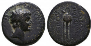
439 Roman Provincial, Ae Reference: Condition: Very Fine Weight: 4.5 gr Diameter: 16 mm 1