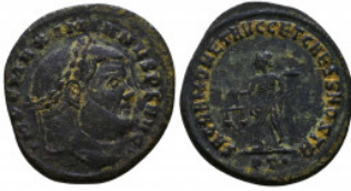
787 Maximinus II Daza. A.D. 309-313. AE follis Reference: Condition: Very Fine Weight: 8.6 gr Diameter: 27 mm 1