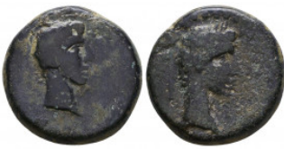
429 Roman Provincial, Ae Reference: Condition: Very Fine Weight: 13.1 gr Diameter: 23 mm 1