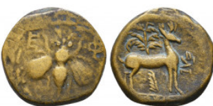
178 IONIA. Ephesus. AE, ca. 305-288 B.C. Reference: Condition: Very Fine Weight: 4.4 gr Diameter: 18 mm 1