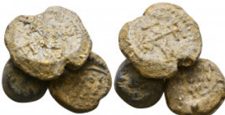
911 Lot of Byzantine Lead Seals, 7th - 13th Centuries Reference: Condition: Very Fine Weight: lot gr Diameter: mm 1