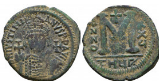
943 Justinian I. AD 527-565. Ae Reference: Condition: Very Fine Weight: 19.0 gr Diameter: 35mm 1