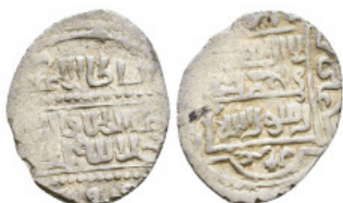
1200 Eretna Beylik, AR Dirhem, Alaeddind Eretna, Sivas, 747AH Condition: Very Fine Weight: 1.1 gr Diameter: 18 mm 1