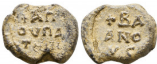
903 Byzantine Lead Seals, 7th - 13th Centuries Reference: Condition: Very Fine Weight: 8.9 gr Diameter: 21 mm 1