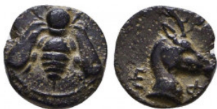
176 IONIA. Ephesus. AE, ca. 305-288 B.C. Reference: Condition: Very Fine Weight: 1.3 gr Diameter: 10 mm 1