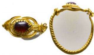
1281 Ancient Roman Very Special and elegant Solid Gold Ring precious stone inlaid on bezel . 1st - 3rd century AD Reference: Condition: Very Fine Weight: 1.8 gr Diameter: 19 mm 1