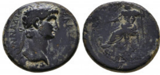
443 Roman Provincial, Ae Reference: Condition: Very Fine Weight: 4.8 gr Diameter: 20 mm 1