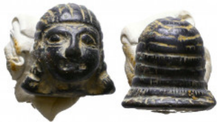
1358 Description will be added Reference: Condition: Very Fine Weight: 22.1 gr Diameter: 19 mm 1