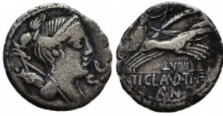
619 Republic Rome Denarius AR Reference: Condition: Very Fine Weight: 3.2 gr Diameter: 17 mm 1