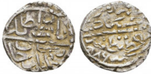
1250 Ottoman Aqche II. Mehmed ( fatih ) Condition: Very Fine Weight: 0.7 gr Diameter: 10 mm 1