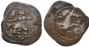
66 Greek Obol, Ca. 350-300 BC. AR. Reference: Condition: Very Fine Weight: 0.5 gr Diameter: 13 mm 1