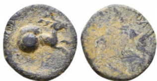
909 Roman Lead Seals, 1st - 3rd Centuries Reference: Condition: Very Fine Weight: 2.4 gr Diameter: 14 mm 1