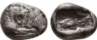
16 KINGS OF LYDIA. Kroisos (Croesus). Circa 564/3 - 550/39. AR Reference: Condition: Very Fine Weight: 1.7 gr Diameter: 11 mm 1