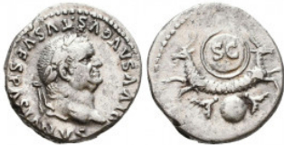
684 Vespasian. A.D. 69-79. AR denarius Reference: Condition: Very Fine Weight: 3.6 gr Diameter: 17 mm 1