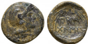
190 IONIA. Priene. Ae (Circa 334-320 BC). Reference: Condition: Very Fine Weight: 0.8 gr Diameter: 10 mm 1