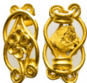
1279 Ancient Roman Very Special an elegant Gold Brooch . 1st - 3rd century AD Reference: Condition: Very Fine Weight: 1.5 gr Diameter: 16 mm 1