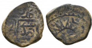
1197 Ottoman Manghir , Mardin Condition: Very Fine Weight: 3.1 gr Diameter: 16 mm 1