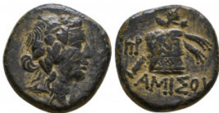
269 PONTOS, Amisos. Circa 109-89 BC. Æ Reference: Condition: Very Fine Weight: 8.4 gr Diameter: 21 mm 1