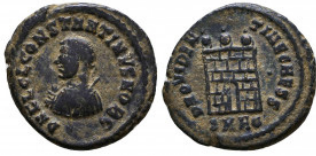
803 Constantine I. A.D. 307/10-337. AE follis Reference: Condition: Very Fine Weight: 3.2 gr Diameter: 19 mm 1