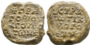
871 Byzantine Lead Seals, 7th - 13th Centuries Reference: Condition: Very Fine Weight: 11.9 gr Diameter: 21mm 1