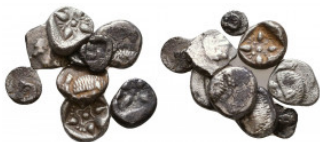
143 Lot of 10 Greek Obols, Ca. 350-300 BC. AR. Reference: Condition: Very Fine Weight: lot gr Diameter: mm 1