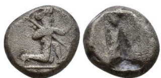
147 PERSIA, Achaemenid Empire. Time of Xerxes II to Artaxerxes II. Circa 455-420 B.C. AR Siglos. Reference: Condition: Very Fine Weight: 5.3 gr Diameter: 15 mm 1