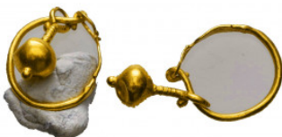
1300 Ancient Roman Very Special and elegant Solid Gold Earring . 1st - 3rd century A D Reference: Condition: Very Fine Weight: 1.2 gr Diameter: 13 mm 1