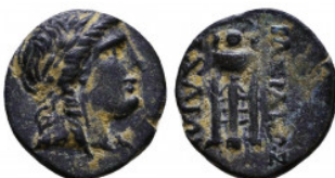
154 Greek Coins, Ae. 261-246 BC. Æ Reference: Condition: Very Fine Weight: 1.5 gr Diameter: 13 mm 1