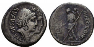
622 ROMAN REPUBLIC. Mn. Cordius Rufus. Denarius 46 BC, Rome. RRC 463/1a. Reference: Condition: Very Fine Weight: 3.6 gr Diameter: 17 mm 1