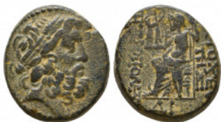
333 SELEUKID KINGDOM. 2nd - 1st Century BC . Ae Reference: Condition: Very Fine Weight: 8.1 gr Diameter: 18 mm 1