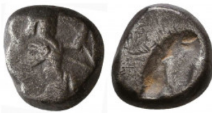
151 PERSIA, Achaemenid Empire. Time of Xerxes II to Artaxerxes II. Circa 455-420 B C. AR Siglos. Reference: Condition: Very Fine Weight: 5.2 gr Diameter: 13 mm 1