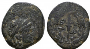
208 Elaia, Aeolis. Ae c. mid 4th to mid 3rd Century BC. Reference: Condition: Very Fine Weight: 3.0 gr Diameter: 16 mm 1