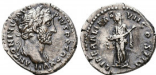
672 Antoninus Pius. Denarius AR. 138-161 AD Reference: Condition: Very Fine Weight: 3.4 gr Diameter: 17 mm 1