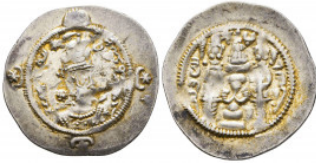
1273 Sasanian Kings, (591-628), Drachm, Reference: Condition: Very Fine Weight: 4.1 gr Diameter: 30 mm 1