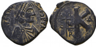
936 Justinus I., 518-527. Æ Half Follis Reference: Condition: Very Fine Weight: 6.7 gr Diameter: 25 mm 1