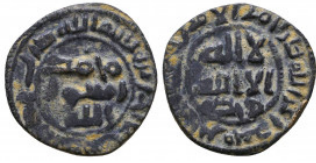
1146 Umayyad: Anonymous, AE fals Condition: Very Fine Weight: 2.1 gr Diameter: 18 mm 1