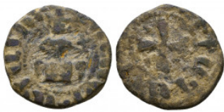
938 Armenian Coins , Ae Reference: Condition: Very Fine Weight: 2.7 gr Diameter: 17 mm 1