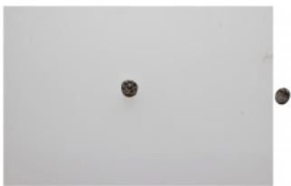
105 Greek Obol, Ca. 350-300 BC. AR. Reference: Condition: Very Fine Weight: 0.2 gr Diameter: 5 mm 1