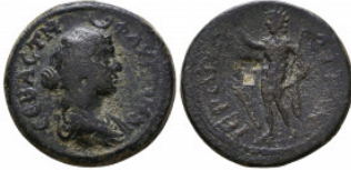
436 Roman Provincial, Ae Reference: Condition: Very Fine Weight: 10.3 gr Diameter: 28mm 1