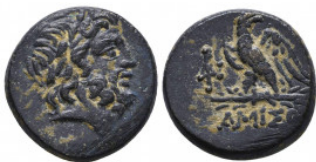
286 PONTOS, Amisos. Circa 109-89 BC. Æ Reference: Condition: Very Fine Weight: 7.4 gr Diameter: 19 mm 1