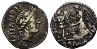
623 Republic Rome Denarius AR Reference: Condition: Very Fine Weight: 1.8 gr Diameter: 15 mm 1