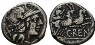
625 Republic Rome Denarius AR Reference: Condition: Very Fine Weight: 3.6 gr Diameter: 15 mm 1