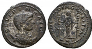
733 Severina. Augusta, A.D. 270-275. AE antoninianus Reference: Condition: Very Fine Weight: 3.6 gr Diameter: 21 mm 1