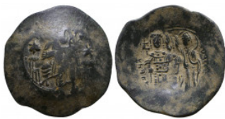
1007 Byzantine Coins , Ae Reference: Condition: Very Fine Weight: 5.1 gr Diameter: 28 mm 1