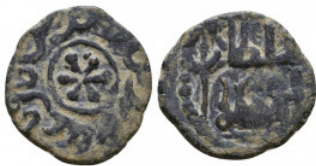
1196 SELJUQ OF RUM: Mas'ud III, Condition: Very Fine Weight: 2.4 gr Diameter: 19 mm 1