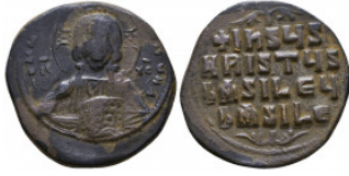
989 Byzantine Coins Ae, Anonymous, Bust of Jesus, 7th - 13th Centuries Reference: Condition: Very Fine Weight: 13.6 gr Diameter: 31 mm 1