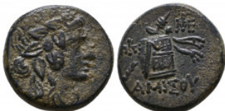
270 PONTOS, Amisos. Circa 109-89 BC. Æ Reference: Condition: Very Fine Weight: 8.0 gr Diameter: 20 mm 1