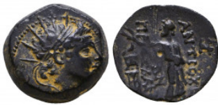
328 SELEUKID KINGDOM. 2nd - 1st Century BC . Ae Reference: Condition: Very Fine Weight: 3.9 gr Diameter: 15 mm 1