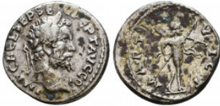
668 Septimius Severus. A.D. 193-211. AR denarius Reference: Condition: Very Fine Weight: 2.8 gr Diameter: 17 mm 1