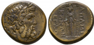
294 Phrygia, Apameia. Pseudo-autonomous civic issue. mid 2nd century A.D. AE Reference: Condition: Very Fine Weight: 7.7 gr Diameter: 19 mm 1