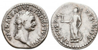
693 Domitian. A.D. 81-96. AR denarius Reference: Condition: Very Fine Weight: 3.2 gr Diameter: 18 mm 1