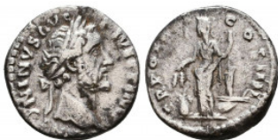
677 Antoninus Pius. Denarius AR. 138-161 AD Reference: Condition: Very Fine Weight: 3.3 gr Diameter: 16 mm 1