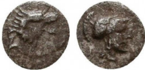
120 Greek Obol, Ca. 350-300 BC. AR. Reference: Condition: Very Fine Weight: 0.1 gr Diameter: 5 mm 1