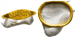
1288 Ancient Roman Very Special and elegant Solid Gold Ring with an inscription on bezel. 1st - 3rd century AD Reference: Condition: Very Fine Weight: 0.9 gr Diameter: 14 mm 1