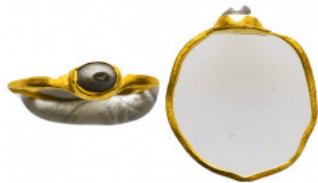
1285 Ancient Roman Very Special and elegant Solid Gold Ring precious stone inlaid on bezel . 1st - 3rd century AD Reference: Condition: Very Fine Weight: 0.7 gr Diameter: 15 mm 1