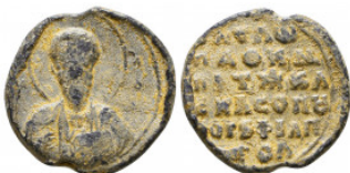
874 Byzantine Lead Seals, 7th - 13th Centuries Reference: Condition: Very Fine Weight: 7.6 gr Diameter: 22 mm 1