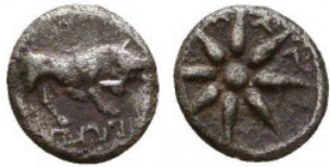
90 Greek Obol, Ca. 350-300 BC. AR. Reference: Condition: Very Fine Weight: 0.3 gr Diameter: 6 mm 1