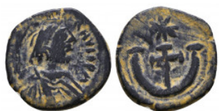
949 Justinian I. AD 527-565. Ae Reference: Condition: Very Fine Weight: 2.2 gr Diameter: 15 mm 1