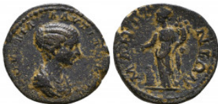
438 Roman Provincial, Ae Reference: Condition: Very Fine Weight: 4.9 gr Diameter: 21 mm 1