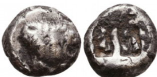
14 LYCIA, Uncertain. Circa 520-470/60 BC. AR Stater Reference: Condition: Very Fine Weight: 9.8 gr Diameter: 18 mm 1