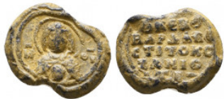
887 Byzantine Lead Seals, 7th - 13th Centuries Reference: Condition: Very Fine Weight: 2.6 gr Diameter: 14 mm 1