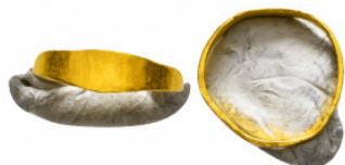
1286 Ancient Roman Very Special and elegant Solid Gold Ring . 1st - 3rd century AD Reference: Condition: Very Fine Weight: 0.6 gr Diameter: 12 mm 1