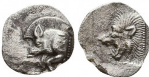
85 Greek Obol, Ca. 350-300 BC. AR. Reference: Condition: Very Fine Weight: 0.8 gr Diameter: 12 mm 1