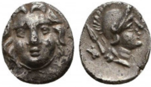
73 Greek Obol, Ca. 350-300 BC. AR. Reference: Condition: Very Fine Weight: 0.6 gr Diameter: 10 mm 1