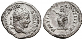
695 Caracalla. A.D. 198-217. AR denarius Reference: Condition: Very Fine Weight: 2.6 gr Diameter: 17 mm 1