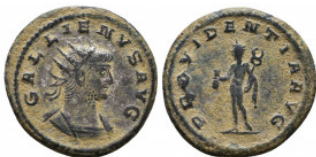
761 GALLIENUS, 254-268 AD. AE Antoninianus Reference: Condition: Very Fine Weight: 3.6 gr Diameter: 21 mm 1