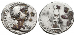
664 Trajan (AD 98-117). AR denarius. Reference: Condition: Very Fine Weight: 3.1 gr Diameter: 18 mm 1