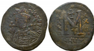
941 Justinian I. AD 527-565. Ae Reference: Condition: Very Fine Weight: 17.8 gr Diameter: 37mm 1