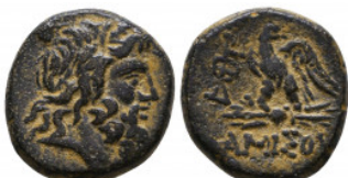
273 PONTOS, Amisos. Circa 109-89 BC. Æ Reference: Condition: Very Fine Weight: 8.7 gr Diameter: 19 mm 1