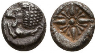
96 Greek Obol, Ca. 350-300 BC. AR. Reference: Condition: Very Fine Weight: 1.1 gr Diameter: 9 mm 1