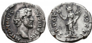
673 Antoninus Pius. Denarius AR. 138-161 AD Reference: Condition: Very Fine Weight: 3.1 gr Diameter: 18 mm 1