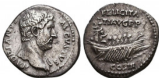
641 Hadrian. AD 117-138. AR Denarius. Rome mint. Struck circa AD 132-135. HADRIANVS AVGVSTVS, bareheaded bust right, slight drapery / FELICITA/TI AVG P P in two lines above, COS III, galley rowed right by five oarsmen: hortator and Triton at stern. Reference: RIC II -; RSC 701a. Condition: Very Fine Weight: 2.8 gr Diameter: 18 mm 1