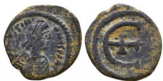
948 Justinian I. AD 527-565. Ae Reference: Condition: Very Fine Weight: 1.9 gr Diameter: 17 mm 1