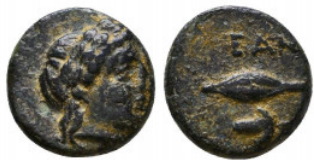
207 Troas, Neandria, 4th century BC. Æ Reference: Condition: Very Fine Weight: 1.4 gr Diameter: 10 mm 1