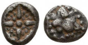
130 Greek Obol, Ca. 350-300 BC. AR. Reference: Condition: Very Fine Weight: 0.4 gr Diameter: 5 mm 1