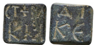
1012 Byzantine Jewelry Weights, Ae Reference: Condition: Very Fine Weight: 1.3 gr Diameter: 11mm 1