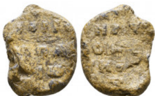
904 Byzantine Lead Seals, 7th - 13th Centuries Reference: Condition: Very Fine Weight: 5.2 gr Diameter: 18 mm 1