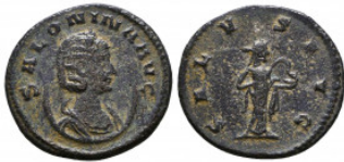
734 Salonina. Augusta, A.D. 254-268. AR antoninianus Reference: Condition: Very Fine Weight: 3.4 gr Diameter: 20 mm 1