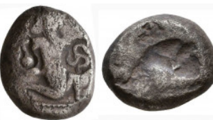
153 PERSIA, Achaemenid Empire. Time of Xerxes II to Artaxerxes II. Circa 455-420 B C. AR Siglos. Reference: Condition: Very Fine Weight: 5.4 gr Diameter: 15 mm 1