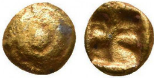
9 IONIA, Uncertain. Circa 625-600 BC. EL Reference: Condition: Very Fine Weight: 0.2 gr Diameter: 5 mm 1