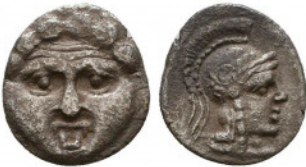
75 Greek Obol, Ca. 350-300 BC. AR. Reference: Condition: Very Fine Weight: 0.8 gr Diameter: 10 mm 1