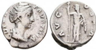
704 Diva Faustina I. Died A.D. 140/1. AR denarius Reference: Condition: Very Fine Weight: 3.2 gr Diameter: 16 mm 1