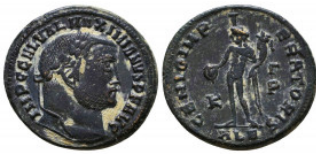
784 Maximianus. A.D. 286-305. Æ Follis. Reference: Condition: Very Fine Weight: 6.7 gr Diameter: 25 mm 1