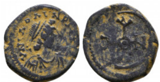
950 Justinian I. AD 527-565. Ae Reference: Condition: Very Fine Weight: 2.0 gr Diameter: 15 mm 1