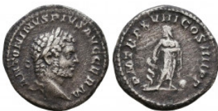
694 Caracalla. A.D. 198-217. AR denarius Reference: Condition: Very Fine Weight: 3.0 gr Diameter: 19 mm 1