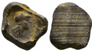
1276 Ancient Roman Terracotta Theater Ticket Reference: Condition: Very Fine Weight: 2.2 gr Diameter: 21 mm 1