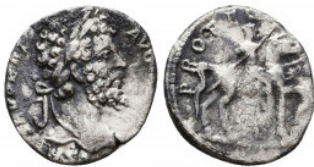
670 Septimius Severus. A.D. 193-211. AR denarius Reference: Condition: Very Fine Weight: 2.4 gr Diameter: 16 mm 1