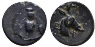
172 IONIA. Ephesus. AE, ca. 305-288 B.C. Reference: Condition: Very Fine Weight: 0.6 gr Diameter: 8 mm 1