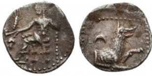
65 Greek Obol, Ca. 350-300 BC. AR. Reference: Condition: Very Fine Weight: 0.6 gr Diameter: 10 mm 1