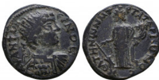
418 Roman Provincial, Ae Reference: Condition: Very Fine Weight: 5.5 gr Diameter: 21 mm 1