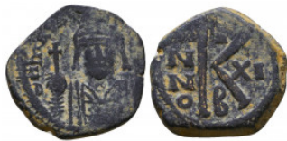
970 Maurice Tiberius. 582-602. AE Reference: Condition: Very Fine Weight: 4.9 gr Diameter: 20 mm 1