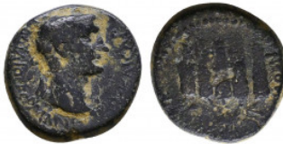
406 Roman Provincial, Ae Reference: Condition: Very Fine Weight: 4.6 gr Diameter: 17 mm 1