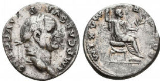
687 Vespasian. A.D. 69-79. AR denarius Reference: Condition: Very Fine Weight: 3.5 gr Diameter: 17 mm 1