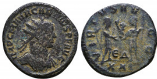
735 CARINUS, 283-285 AD. AE Antoninianus Reference: Condition: Very Fine Weight: 3.3 gr Diameter: 20 mm 1