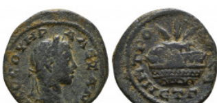
450 Roman Provincial, Ae Reference: Condition: Very Fine Weight: 6.5 gr Diameter: 21 mm 1