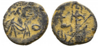
1006 Leo I. A.D. 457-474. AE Reference: Condition: Very Fine Weight: 1.1 gr Diameter: 11 mm 1