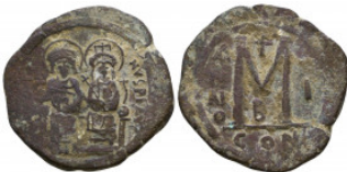
962 Justin II and Sophia. 565-578. AE Reference: Condition: Very Fine Weight: 13.7 gr Diameter: 28 mm 1