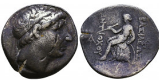
320 SELEUCID KINGDOM. Antiochus I Soter (281-261 BC). AR drachm Reference: Condition: Very Fine Weight: 16.3 gr Diameter: 27mm 1