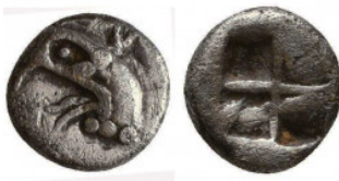
84 Greek Obol, Ca. 350-300 BC. AR. Reference: Condition: Very Fine Weight: 0.8 gr Diameter: 8 mm 1