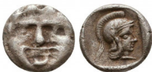
70 Greek Obol, Ca. 350-300 BC. AR. Reference: Condition: Very Fine Weight: 1.0 gr Diameter: 10 mm 1