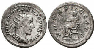
717 Philip I. A.D. 244-249. AR antoninianus Reference: Condition: Very Fine Weight: 4.1 gr Diameter: 22 mm 1