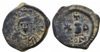
971 Maurice Tiberius. 582-602. AE Reference: Condition: Very Fine Weight: 1.6 gr Diameter: 16 mm 1