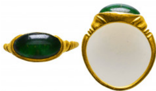
1284 Ancient Roman Very Special and elegant Solid Gold Ring precious stone inlaid on bezel . 1st - 3rd century AD Reference: Condition: Very Fine Weight: 2.2 gr Diameter: 15 mm 1