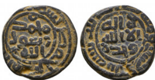
1145 Umayyad: Anonymous, AE fals Condition: Very Fine Weight: 4.4gr Diameter: 19 mm 1