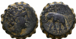
329 SELEUKID KINGDOM. 2nd - 1st Century BC . Ae Reference: Condition: Very Fine Weight: 8.4 gr Diameter: 19 mm 1