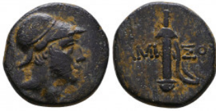
283 PONTOS, Amisos. Circa 109-89 BC. Æ Reference: Condition: Very Fine Weight: 7.8 gr Diameter: 20 mm 1