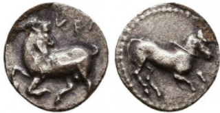
58 Greek Obol, Ca. 350-300 BC. AR. Reference: Condition: Very Fine Weight: 0.6 gr Diameter: 10 mm 1