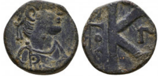
945 Justinian I. AD 527-565. Ae Reference: Condition: Very Fine Weight: 4.1 gr Diameter: 17 mm 1