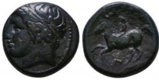
163 Kingdom of Macedonia, Philip II (359-336 BC), Æ Reference: Condition: Very Fine Weight: 6.1 gr Diameter: 17 mm 1