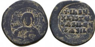
990 Byzantine Coins Ae, Anonymous, Bust of Jesus, 7th - 13th Centuries Reference: Condition: Very Fine Weight: 23.3 gr Diameter: 33mm 1