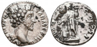
679 Marcus Aurelius , as Caesar (139-161 AD). AR Denarius Reference: Condition: Very Fine Weight: 3.1 gr Diameter: 17 mm 1