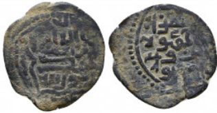
1155 Islamic, Mongols. Ilkhanids. Gazan Mahmud. AE Fals Condition: Very Fine Weight: 1.5 gr Diameter: 19 mm 1