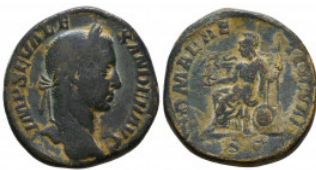
637 Severus Alexander (222-235 AD). Æ Sestertius Reference: Condition: Very Fine Weight: 21.0 gr Diameter: 29 mm 1