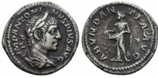
699 ELAGABALUS, 218-222 AD. AR Denarius Reference: Condition: Very Fine Weight: 2.9 gr Diameter: 19 mm 1