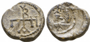
901 Byzantine Lead Seals, 7th - 13th Centuries Reference: Condition: Very Fine Weight: 11.4 gr Diameter: 22 mm 1