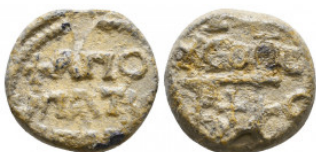
890 Byzantine Lead Seals, 7th - 13th Centuries Reference: Condition: Very Fine Weight: 8.2 gr Diameter: 18 mm 1