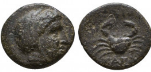
189 CARIA. Kos. Ae (Circa 300-200 BC). Reference: Condition: Very Fine Weight: 1.7 gr Diameter: 12 mm 1