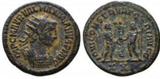
779 Maximianus. A.D. 286-305. Æ antoninianus Reference: Condition: Very Fine Weight: 3.8 gr Diameter: 21 mm 1