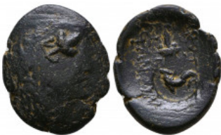
245 Greek Coins, Ae. (359-336 BC), Æ Reference: Condition: Very Fine Weight: 7.4 gr Diameter: 24 mm 1