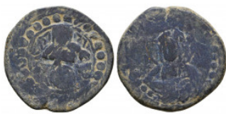
994 Byzantine Coins Ae, Anonymous, Bust of Jesus, 7th - 13th Centuries Reference: Condition: Very Fine Weight: 6.6 gr Diameter: 26 mm 1