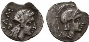
78 Greek Obol, Ca. 350-300 BC. AR. Reference: Condition: Very Fine Weight: 0.4 gr Diameter: 10 mm 1