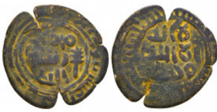
1151 Umayyad: Tabariye PHILISTIN AE fals Condition: Very Fine Weight: 2.2gr Diameter: 24mm 1