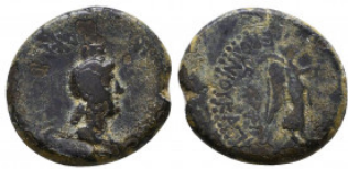
437 Roman Provincial, Ae Reference: Condition: Very Fine Weight: 2.6 gr Diameter: 16 mm 1