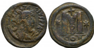
933 Anastasius I AD 491-518. Follis Æ Reference: Condition: Very Fine Weight: 18.4 gr Diameter: 33 mm 1