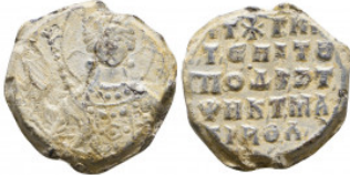
892 Byzantine Lead Seals, 7th - 13th Centuries Reference: Condition: Very Fine Weight: 13.1 gr Diameter: 24 mm 1