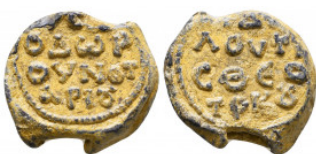
872 Byzantine Lead Seals, 7th - 13th Centuries Reference: Condition: Very Fine Weight: 11.2 gr Diameter: 21 mm 1