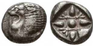
133 Greek Obol, Ca. 350-300 BC. AR. Reference: Condition: Very Fine Weight: 1.1 gr Diameter: 8 mm 1