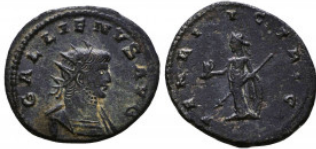
764 GALLIENUS, 254-268 AD. AE Antoninianus Reference: Condition: Very Fine Weight: 3.0 gr Diameter: 20mm 1