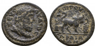
425 Roman Provincial, Ae Reference: Condition: Very Fine Weight: 2.2 gr Diameter: 15 mm 1