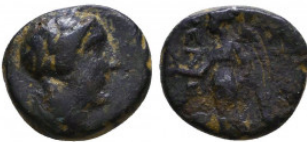
191 Greek Coins, Ae. (359-336 BC), Æ Reference: Condition: Very Fine Weight: 1.6 gr Diameter: 11 mm 1