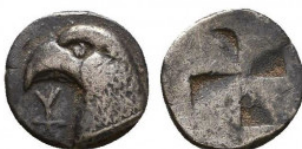
87 Greek Obol, Ca. 350-300 BC. AR. Reference: Condition: Very Fine Weight: 0.4 gr Diameter: 8 mm 1