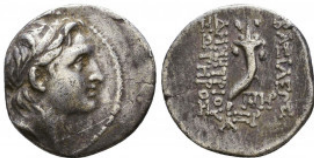
319 Seleucid Kings, Demetrius I Soter, 162 – 150. Drachm, Reference: Condition: Very Fine Weight: 4.0 gr Diameter: 18 mm 1