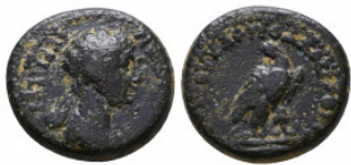
446 Roman Provincial, Ae Reference: Condition: Very Fine Weight: 3.8 gr Diameter: 15 mm 1