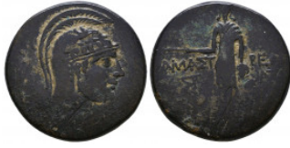
259 PAPHLAGONIA, Amastris. Circa 105-85 BC. Æ Reference: Condition: Very Fine Weight: 19.0 gr Diameter: 29mm 1