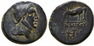
267 PONTOS, Amisos. Circa 109-89 BC. Æ Reference: Condition: Very Fine Weight: 12,9 gr Diameter: 23 mm 1