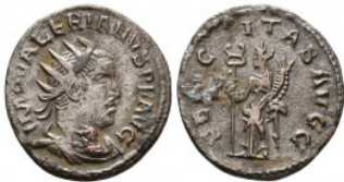
719 Valerian I. A.D. 253-260. AR antoninianus Reference: Condition: Very Fine Weigh t: 2.8 gr Diameter: 20 mm 1