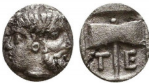
83 Greek Obol, Ca. 350-300 BC. AR. Reference: Condition: Very Fine Weight: 0.6 gr Diameter: 8 mm 1