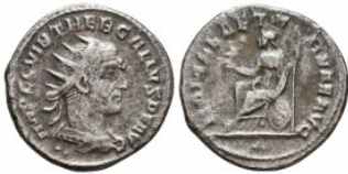
718 TREBONIANUS GALLUS, 251-253 AD. AR Antoninianus Reference: Condition: V ery Fine Weight: 4.2 gr Diameter: 21 mm 1