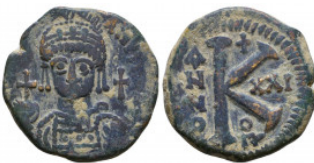
954 Justinian I. AD 527-565. Ae Reference: Condition: Very Fine Weight: 10.0 gr Diameter: 26 mm 1