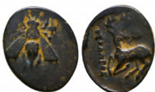
170 IONIA. Ephesus. AE, ca. 305-288 B.C. Reference: Condition: Very Fine Weight: 1.8 gr Diameter: 16 mm 1