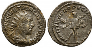
731 Trebonianus Gallus. A.D. 251-253. AR antoninianus Reference: Condition: Very Fine Weight: 3.4 gr Diameter: 21 mm 1