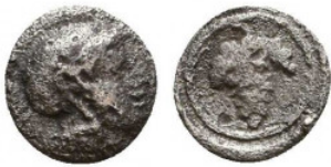
127 Greek Obol, Ca. 350-300 BC. AR. Reference: Condition: Very Fine Weight: 0.2 gr Diameter: 6 mm 1