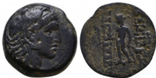
335 SELEUKID KINGDOM. 2nd - 1st Century BC . Ae Reference: Condition: Very Fine Weight: 6.0 gr Diameter: 16 mm 1