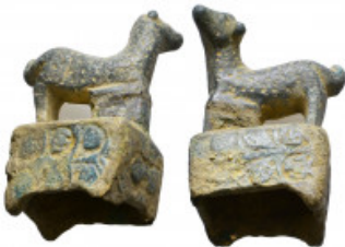
1359 Description will be added Reference: Condition: Very Fine Weight: 46.4 gr Diameter: 47 mm 1