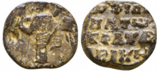
884 Byzantine Lead Seals, 7th - 13th Centuries Reference: Condition: Very Fine Weight: 3.4 gr Diameter: 15 mm 1