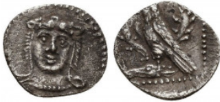
57 Greek Obol, Ca. 350-300 BC. AR. Reference: Condition: Very Fine Weight: 0.7 gr Diameter: 11 mm 1