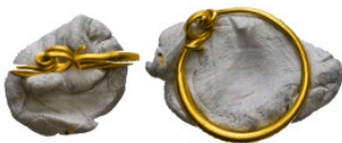
1299 Ancient Roman Very Special and elegant Solid Gold Earring . 1st - 3rd century A D Reference: Condition: Very Fine Weight: 0.6 gr Diameter: 16 mm 1