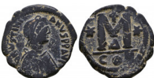
934 Justinus I., 518-527. Æ Follis Reference: Condition: Very Fine Weight: 17.2 gr Diameter: 32 mm 1