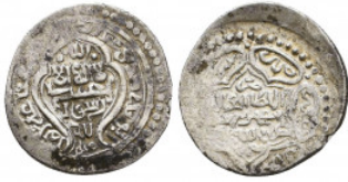
1138 Islamic, Mongols. Ilkhanids. AR Dirhem. Condition: Very Fine Weight: 1.3gr Diameter: 16mm 1