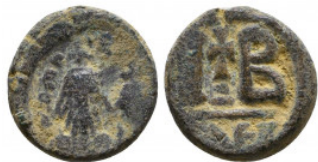
1009 Heraclius. 610-641. AE dodecanummium Reference: Condition: Very Fine Weight: 4.6 gr Diameter: 16 mm 1