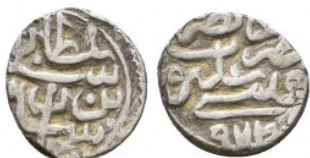
1244 Ottoman Aqche , Selim I, Condition: Very Fine Weight: 0.4 gr Diameter: 8 mm 1