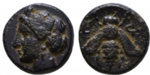
175 IONIA. Ephesus. AE, ca. 305-288 B.C. Reference: Condition: Very Fine Weight: 1.4 gr Diameter: 10 mm 1