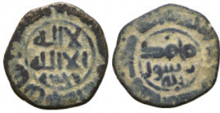
1154 Umayyad: Anonymous, AE fals Condition: Very Fine Weight: 2.7 gr Diameter: 18 mm 1