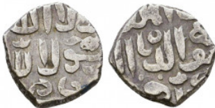
1252 Mamluk AR Anonymous Condition: Very Fine Weight: 1.7 gr Diameter: 12 mm 1