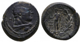
196 LYDIA. Sardes. Ae (Circa 133 BC-14 AD). Ae Reference: Condition: Very Fine Weight: 6.2 gr Diameter: 16 mm 1