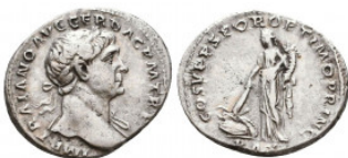
658 Trajan (AD 98-117). AR denarius. Reference: Condition: Very Fine Weight: 3.2 gr Diameter: 18 mm 1