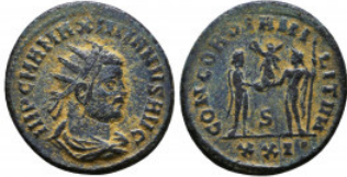
780 Maximianus. A.D. 286-305. Æ antoninianus Reference: Condition: Very Fine Weight: 4.0 gr Diameter: 21 mm 1