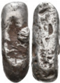
12 Archaic very large Silver Fragment. Circa 525-480 BC. Reference: Condition: Very Fine Weight: 20.7 gr Diameter: 34 mm 1