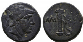
280 PONTOS, Amisos. Circa 109-89 BC. Æ Reference: Condition: Very Fine Weight: 7.6 gr Diameter: 18 mm 1