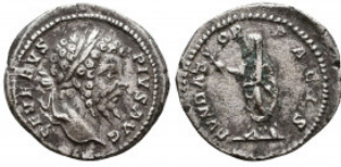
667 Septimius Severus. A.D. 193-211. AR denarius Reference: Condition: Very Fine Weight: 2.9 gr Diameter: 19 mm 1