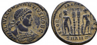
822 Constantine II. As Caesar, A.D. 317-337. Æ Follis Reference: Condition: Very Fine Weight: 2.2 gr Diameter: 17 mm 1