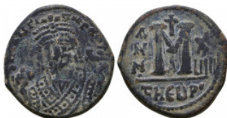
973 Maurice Tiberius. 582-602. AE Reference: Condition: Very Fine Weight: 11.3 gr Diameter: 27mm 1