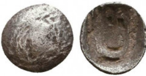
112 Greek Obol, Ca. 350-300 BC. AR. Reference: Condition: Very Fine Weight: 0.1 gr Diameter: 7 mm 1