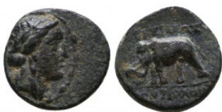
330 SELEUKID KINGDOM. 2nd - 1st Century BC . Ae Reference: Condition: Very Fine Weight: 2.6 gr Diameter: 14 mm 1