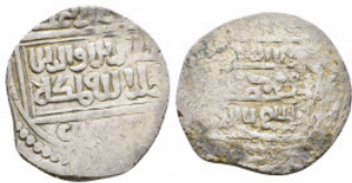
1198 Eretna Beylik, AR Dirhem, Alaeddind Eretna Condition: Very Fine Weight: 1.2 gr Diameter: 17 mm 1