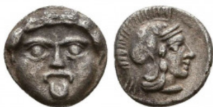
69 Greek Obol, Ca. 350-300 BC. AR. Reference: Condition: Very Fine Weight: 1.0 gr Diameter: 10 mm 1