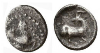
62 Greek Obol, Ca. 350-300 BC. AR. Reference: Condition: Very Fine Weight: 0.4 gr Diameter: 8 mm 1