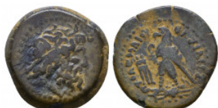
345 Ptolemaic Egypt. , 246-221 B.C. AE Reference: Condition: Very Fine Weight: 3.1 gr Diameter: 17 mm 1