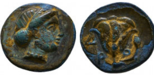
167 ISLANDS off CARIA. Rhodes. Circa 230-205 BC. Æ Reference: Condition: Very Fine Weight: 1.3 gr Diameter: 10 mm 1