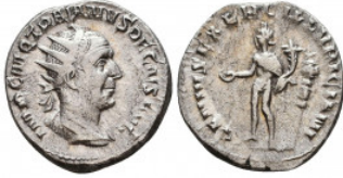
716 TRAJAN DECIUS, 249-251 AD. AR Antoninianus Reference: Condition: Very Fine Weight: 5.2 gr Diameter: 21 mm 1