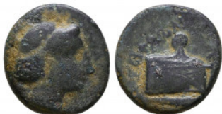
205 Greek Coins, Ae. (359-336 BC), Æ Reference: Condition: Very Fine Weight: 2.9 gr Diameter: 14 mm 1