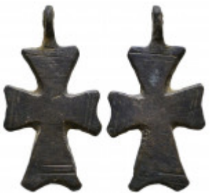
1353 Byzantine Cross Pendant, Ae Bronze, 7th - 13th century AD. Reference: Condit on: Very Fine Weight: 7.3 gr Diameter: 40 mm 1