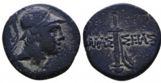
285 PONTOS. Amaseia. Ae (Circa 120-100 BC). Reference: Condition: Very Fine Weight: 7.2 gr Diameter: 20 mm 1