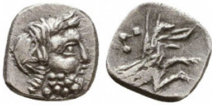
119 Greek Obol, Ca. 350-300 BC. AR. Reference: Condition: Very Fine Weight: 0.5gr Diameter: 8mm 1