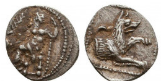
64 Greek Obol, Ca. 350-300 BC. AR. Reference: Condition: Very Fine Weight: 0.6 gr Diameter: 10 mm 1