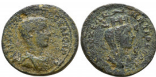
465 Philip I Assaria of Antioch, Seleucis and Pieria. AD 244-249. Ae Reference: Condi tion: Very Fine Weight: 19.8 gr Diameter: 31mm 1