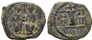
961 Justin II and Sophia. 565-578. AE Reference: Condition: Very Fine Weight: 3.5 gr Diameter: 19 mm 1