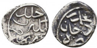
1242 Ottoman Aqche II. Mehmed ( fatih ) Serez Condition: Very Fine Weight: 0.9 gr Diameter: 9 mm 1