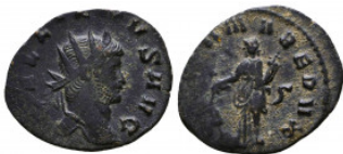
767 GALLIENUS, 254-268 AD. AE Antoninianus Reference: Condition: Very Fine Weight: 2.0 gr Diameter: 20 mm 1