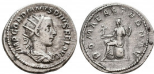
720 Gordian III. A.D. 238-244. AR antoninianus Reference: Condition: Very Fine Weig ht: 4.6 gr Diameter: 22 mm 1