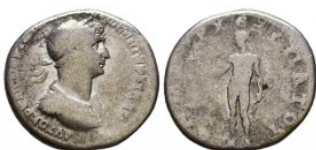
482 Trajan (98-117), Didrachm, Cappadocia: Caesarea, c. 112-117 AD; AR Reference: Condition: Very Fine Weight: 6.0 gr Diameter: 21 mm 1