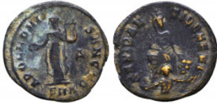
860 Anonymous Pagan Issues. Ca. A.D. 305-313. AE quarter follis Reference: Condition: Very Fine Weight: 1.1 gr Diameter: 15 mm 1