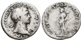
661 Trajan (AD 98-117). AR denarius. Reference: Condition: Very Fine Weight: 2.8 gr Diameter: 18 mm 1