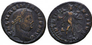
783 Maximianus. A.D. 286-305. Æ Follis. Reference: Condition: Very Fine Weight: 7.5 gr Diameter: 27 mm 1