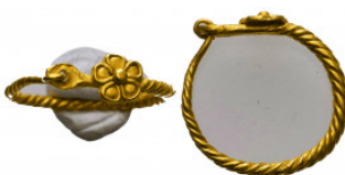
1293 Ancient Roman Very Special and elegant Solid Gold Earring . 1st - 3rd century AD Reference: Condition: Very Fine Weight: 1.8 gr Diameter: 21 mm 1