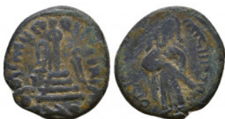
1060 Arab - Byzantine Coins, Ae Reference: Condition: Very Fine Weight: 5.1 gr Diameter: 21 mm 1