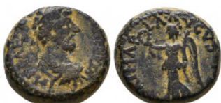
449 Roman Provincial, Ae Reference: Condition: Very Fine Weight: 10.0 gr Diameter: 18 mm 1