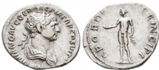
654 Trajan (AD 98-117). AR denarius. Reference: Condition: Very Fine Weight: 3.3 gr Diameter: 17 mm 1