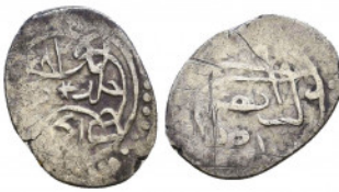
1251 ( JANDAR) Candar Beylik, AR Akce, Süleyman II Bey Condition: Very Fine Weight: 0.7 gr Diameter: 14 mm 1