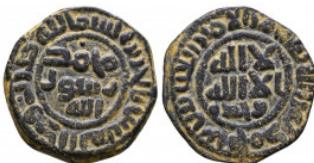
1143 Umayyad: Anonymous, AE fals Condition: Very Fine Weight: 3.8 gr Diameter: 21 mm 1