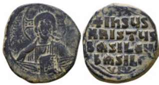
991 Byzantine Coins Ae, Anonymous, Bust of Jesus, 7th - 13th Centuries Reference: Condition: Very Fine Weight: 14.3 gr Diameter: 28 mm 1