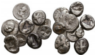
136 Lot of 10 Greek Obols, Ca. 350-300 BC. AR. Reference: Condition: Very Fine Weight: lot gr Diameter: mm 1