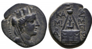
296 Cilicia, Tarsos. after 164 B.C. Æ Reference: Condition: Very Fine Weight: 6.5 gr Diameter: 21 mm 1