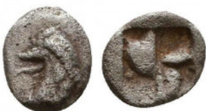
131 Greek Obol, Ca. 350-300 BC. AR. Reference: Condition: Very Fine Weight: 0.2 gr Diameter: 6 mm 1