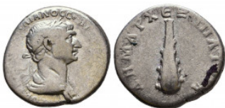
480 Trajan (98-117), Didrachm, Cappadocia: Caesarea, c. 112-117 AD; AR Reference: Condition: Very Fine Weight: 6.2 gr Diameter: 20 mm 1