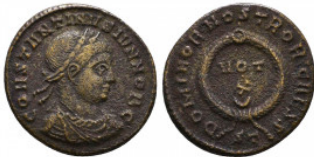
823 Constantine II. As Caesar, A.D. 317-337. Æ Follis Reference: Condition: Very Fine Weight: 3.1 gr Diameter: 17 mm 1