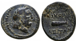
249 Greek Coins, Ae. (359-336 BC), Æ Reference: Condition: Very Fine Weight: 5.8 gr Diameter: 21 mm 1