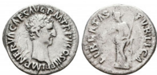
640 Nerva; 96-98 AD, Rome, Denarius, Reference: Condition: Very Fine Weight: 2.8 gr Diameter: 18 mm 1