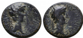
417 Roman Provincial, Ae Reference: Condition: Very Fine Weight: 4.2 gr Diameter: 18 mm 1