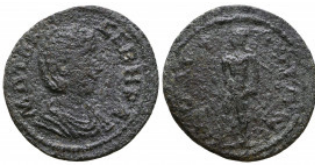
413 Otacilia Severa (+249) - AE Reference: Condition: Very Fine Weight: 8.0 gr Diameter: 29 mm 1