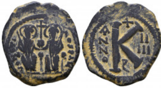
959 Justin II and Sophia. 565-578. AE Reference: Condition: Very Fine Weight: 6.9 gr Diameter: 25 mm 1