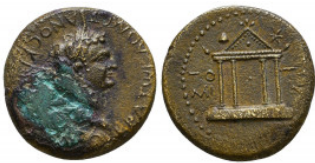
421 Roman Provincial, Ae Reference: Condition: Very Fine Weight: 4.4 gr Diameter: 19 mm 1