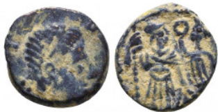
863 Vandal Honorius. Æ Follis Reference: Condition: Very Fine Weight: 1.6 gr Diameter: 13 mm 1