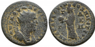
460 Valerianus I (253-260 AD). AE, Anazarbos, Cilicia Reference: Condition: Very Fine Weight: 10.4 gr Diameter: 24 mm 1