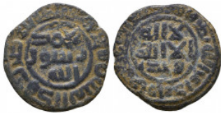
1149 Umayyad: Anonymous, AE fals Condition: Very Fine Weight: 3.5 gr Diameter: 19 mm 1