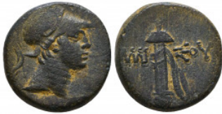
284 PONTOS, Amisos. Circa 109-89 BC. Æ Reference: Condition: Very Fine Weight: 7.5 gr Diameter: 20 mm 1