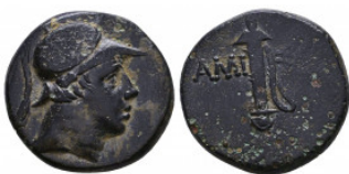
282 PONTOS, Amisos. Circa 109-89 BC. Æ Reference: Condition: Very Fine Weight: 8.4 gr Diameter: 21 mm 1