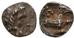
67 Greek Obol, Ca. 350-300 BC. AR. Reference: Condition: Very Fine Weight: 0.5 gr Diameter: 8 mm 1