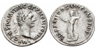
690 Domitian. A.D. 81-96. AR denarius Reference: Condition: Very Fine Weight: 3.5 gr Diameter: 18 mm 1