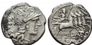
626 Republic Rome Denarius AR Reference: Condition: Very Fine Weight: 3.5 gr Diameter: 19 mm 1