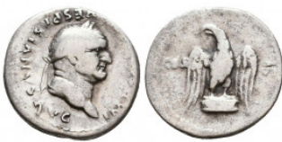
688 Vespasian. A.D. 69-79. AR denarius Reference: Condition: Very Fine Weight: 3.3 gr Diameter: 18 mm 1