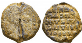
888 Byzantine Lead Seals, 7th - 13th Centuries Reference: Condition: Very Fine Weight: 12.0 gr Diameter: 22mm 1