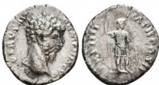
682 Lucius Verus AD 161-169. Ar. Denarius. Reference: Condition: Very Fine Weight: 2.8 gr Diameter: 17 mm 1