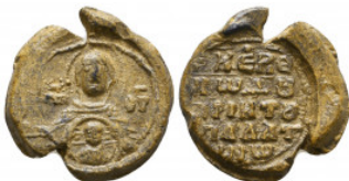
881 Byzantine Lead Seals, 7th - 13th Centuries Reference: Condition: Very Fine Weight: 8.0 gr Diameter: 20 mm 1