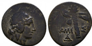
279 PONTOS, Amisos. Circa 109-89 BC. Æ Reference: Condition: Very Fine Weight: 3.6 gr Diameter: 18 mm 1