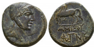
265 PONTOS, Amisos. Circa 109-89 BC. Æ Reference: Condition: Very Fine Weight: 13.0 gr Diameter: 23mm 1