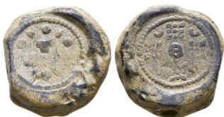
905 Byzantine Lead Seals, 7th - 13th Centuries Reference: Condition: Very Fine Weight: 13.0 gr Diameter: 18mm 1