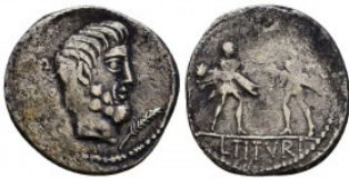
621 Republic Rome Denarius AR Reference: Condition: Very Fine Weight: 3.3 gr Diameter: 18 mm 1