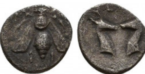
116 Greek Obol, Ca. 350-300 BC. AR. Reference: Condition: Very Fine Weight: 0.9 gr Diameter: 9 mm 1