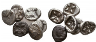
145 Lot of 6 Greek Obols, Ca. 350-300 BC. AR. Reference: Condition: Very Fine Weight: lot gr Diameter: mm 1