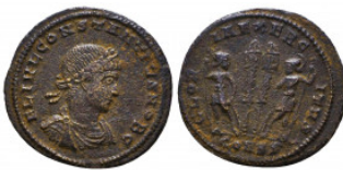
824 Constantine II. As Caesar, A.D. 317-337. Æ Follis Reference: Condition: Very Fine Weight: 2.2 gr Diameter: 20 mm 1