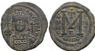
942 Justinian I. AD 527-565. Ae Reference: Condition: Very Fine Weight: 21.7 gr Diameter: 38 mm 1