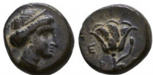
166 ISLANDS off CARIA. Rhodes. Circa 230-205 BC. Æ Reference: Condition: Very Fine Weight: 1.6 gr Diameter: 11 mm 1