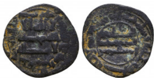
1160 Umayyad: Anonymous, AE fals Condition: Very Fine Weight: 1.0 gr Diameter: 16 mm 1