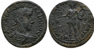
412 Gallienus (253-268 AD). AE Reference: Condition: Very Fine Weight: 6.7 gr Diameter: 25 mm 1