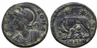
810 Constantine I. A.D. 307/10-337. AE. VRBS ROMA, City Commemorative for Rome. Reference: Condition: Very Fine Weight: 2.5 gr Diameter: 17 mm 1