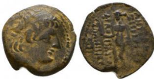
325 SELEUKID KINGDOM. 2nd - 1st Century BC . Ae Reference: Condition: Very Fine Weight: 2.9 gr Diameter: 17 mm 1