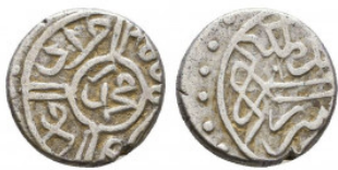
1243 Ottoman Aqche II. Mehmed ( fatih ) Serez Condition: Very Fine Weight: 1.0 gr Diameter: 10 mm 1