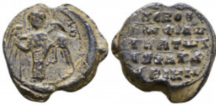
868 Byzantine Lead Seals, 7th - 13th Centuries Reference: Condition: Very Fine Weight: 9.0 gr Diameter: 22 mm 1