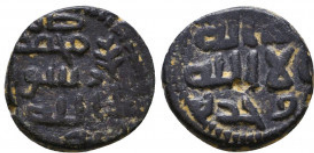
1142 Umayyad: Anonymous, AE fals Condition: Very Fine Weight: 2.5 gr Diameter: 15 mm 1