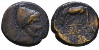
287 PONTUS, Chabakta . Circa 100-85 BC. Æ Reference: Condition: Very Fine Weight: 13.6 gr Diameter: 22mm 1