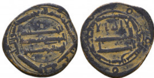
1157 Abbasid: Anonymous, AE fals Condition: Very Fine Weight: 2.7 gr Diameter: 18 mm 1