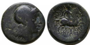
206 IONIA. Magnesia ad Maeandrum. Ae (2nd-1st centuries BC). Reference: Condition: Very Fine Weight: 9.5 gr Diameter: 19 mm 1