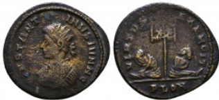
806 Constantine II. As Caesar, A.D. 317-337. Æ Follis Reference: Condition: Very Fine Weight: 2.6 gr Diameter: 20 mm 1