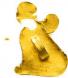
1280 Ancient Roman Very Beautiful Gold Sphinx . 1st - 3rd century AD Reference: Condition: Very Fine Weight: 0.6 gr Diameter: 10 mm 1