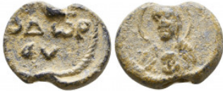
900 Byzantine Lead Seals, 7th - 13th Centuries Reference: Condition: Very Fine Weight: 7.3 gr Diameter: 20 mm 1