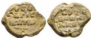
896 Byzantine Lead Seals, 7th - 13th Centuries Reference: Condition: Very Fine Weight: 5.9 gr Diameter: 20 mm 1