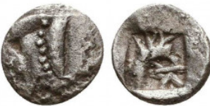
114 Greek Obol, Ca. 350-300 BC. AR. Reference: Condition: Very Fine Weight: 0.4 gr Diameter: 8 mm 1