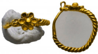
1294 Ancient Roman Very Special and elegant Solid Gold Earring . 1st - 3rd century A D Reference: Condition: Very Fine Weight: 1.0 gr Diameter: 14 mm 1