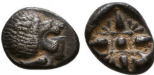
97 Greek Obol, Ca. 350-300 BC. AR. Reference: Condition: Very Fine Weight: 1.0 gr Diameter: 10 mm 1