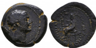
326 SELEUKID KINGDOM. 2nd - 1st Century BC . Ae Reference: Condition: Very Fine Weight: 5.8 gr Diameter: 21 mm 1