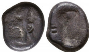
152 PERSIA, Achaemenid Empire. Time of Xerxes II to Artaxerxes II. Circa 455-420 B C. AR Siglos. Reference: Condition: Very Fine Weight: 5.4 gr Diameter: 16 mm 1