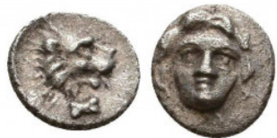
68 Greek Obol, Ca. 350-300 BC. AR. Reference: Condition: Very Fine Weight: 0.4 gr Diameter: 7 mm 1