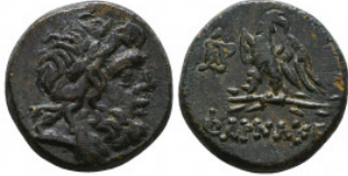
276 PONTUS, Chabakta . Circa 100-85 BC. Æ Reference: Condition: Very Fine Weight: 8.2 gr Diameter: 19 mm 1