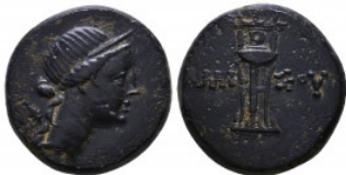
278 PONTOS, Amisos. Circa 109-89 BC. Æ Reference: Condition: Very Fine Weight: 8.2 gr Diameter: 19 mm 1