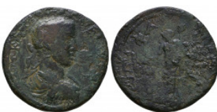
464 Severus Alexander. 222-235 AD. Æ Reference: Condition: Very Fine Weight: 22.1 gr Diameter: 33mm 1