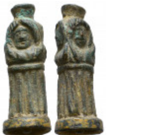
1361 Description will be added Reference: Condition: Very Fine Weight: 26.5 gr Diameter: 43 mm 1