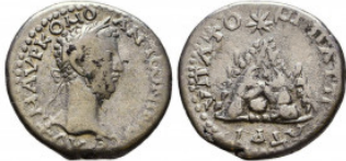
476 CAPPADOCIA, Caesarea. Commodus, as Caesar. 175-177 AD. AR Reference: Condition: Very Fine Weight: 4,2 gr Diameter: 19 mm 1