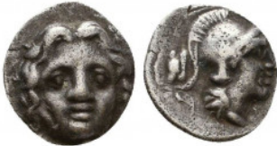
134 Greek Obol, Ca. 350-300 BC. AR. Reference: Condition: Very Fine Weight: 0.9 gr Diameter: 10 mm 1