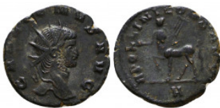
766 GALLIENUS, 254-268 AD. AE Antoninianus Reference: Condition: Very Fine Weight: 3.4 gr Diameter: 20 mm 1