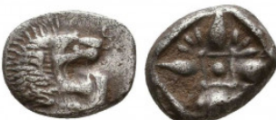
95 Greek Obol, Ca. 350-300 BC. AR. Reference: Condition: Very Fine Weight: 1.1 gr Diameter: 9 mm 1