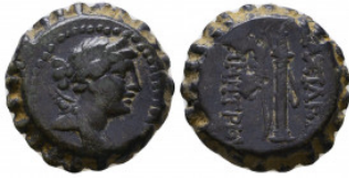
331 SELEUKID KINGDOM. 2nd - 1st Century BC . Ae Reference: Condition: Very Fine Weight: 8.3 gr Diameter: 21 mm 1