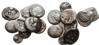
144 Lot of 10 Greek Obols, Ca. 350-300 BC. AR. Reference: Condition: Very Fine Weight: lot gr Diameter: mm 1