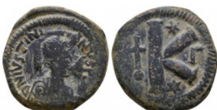
935 Justinus I., 518-527. Æ Half Follis Reference: Condition: Very Fine Weight: 10.4 gr Diameter: 24 mm 1