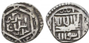
1254 : Germiyanoglu, Sulayman Shah RR Condition: Very Fine Weight: 0.9 gr Diameter: 12 mm 1