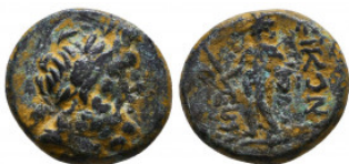
210 LYCAONIA. Eikonion. Ae (circa 1st cent. BC). Reference: Condition: Very Fine Weight: 3.9 gr Diameter: 16 mm 1