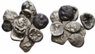
140 Lot of 10 Greek Obols, Ca. 350-300 BC. AR. Reference: Condition: Very Fine Weight: lot gr Diameter: mm 1