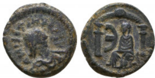
953 Justinian I. AD 527-565. Ae Reference: Condition: Very Fine Weight: 2.1 gr Diameter: 13 mm 1