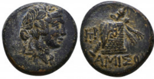
275 PONTOS, Amisos. Circa 109-89 BC. Æ Reference: Condition: Very Fine Weight: 8.2 gr Diameter: 21 mm 1