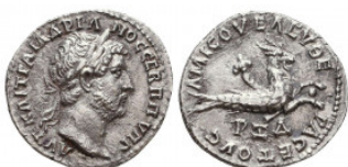
642 Hadrianus (117-138 AD). AR Drachm, Amisos, Pontos. Reference: Condition: Very Fine Weight: 2.4 gr Diameter: 19 mm 1