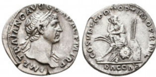
653 Trajan (AD 98-117). AR denarius. Reference: Condition: Very Fine Weight: 3.3 gr Diameter: 17 mm 1