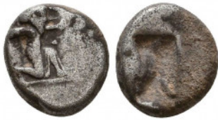
148 PERSIA, Achaemenid Empire. Time of Xerxes II to Artaxerxes II. Circa 455-420 B C. AR Siglos. Reference: Condition: Very Fine Weight: 1.8 gr Diameter: 11 mm 1