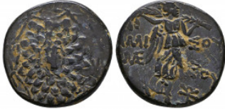
292 PONTOS, Amisos. Circa 109-89 BC. Æ Reference: Condition: Very Fine Weight: 7.6 gr Diameter: 22 mm 1