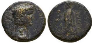
444 Roman Provincial, Ae Reference: Condition: Very Fine Weight: 4.0 gr Diameter: 17 mm 1