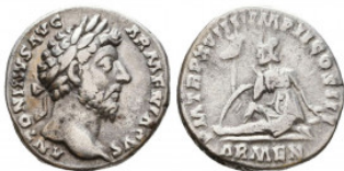
678 Marcus Aurelius , as Caesar (139-161 AD). AR Denarius Reference: Condition: Very Fine Weight: 3.2 gr Diameter: 16 mm 1