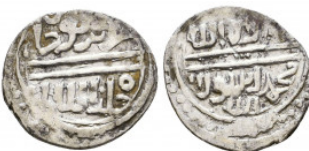
1255 Ottoman AR Aqche, Orhan Ghazi RR Condition: Very Fine Weight: 1.2 gr Diameter: 17 mm 1