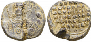
876 Byzantine Lead Seals, 7th - 13th Centuries Reference: Condition: Very Fine Weight: 24.7 gr Diameter: 33 mm 1