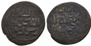
1158 Early Medieval & Islamic Islamic, Mongols. Ilkhanids.. AE Fals Condition: Very Fine Weight: 1.5 gr Diameter: 19 mm 1