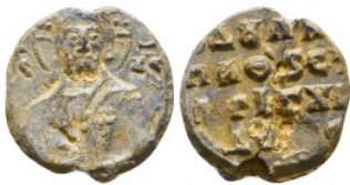
880 Byzantine Lead Seals, 7th - 13th Centuries Reference: Condition: Very Fine Weight: 3.5 gr Diameter: 19 mm 1