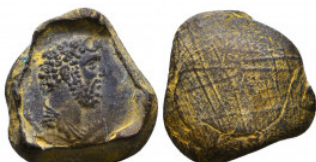
1277 Ancient Roman Terracotta Theater Ticket Reference: Condition: Very Fine Weight: 2.0 gr Diameter: 19 mm 1