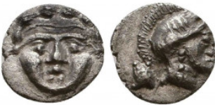
76 Greek Obol, Ca. 350-300 BC. AR. Reference: Condition: Very Fine Weight: 0.9 gr Diameter: 10 mm 1