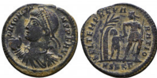
826 Constans. A.D. 337-350. AE centenionalis Reference: Condition: Very Fine Weight: 4.0 gr Diameter: 22 mm 1