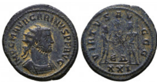
736 CARINUS, 283-285 AD. AE Antoninianus Reference: Condition: Very Fine Weight: 3.4 gr Diameter: 18 mm 1