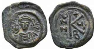
969 Maurice Tiberius. 582-602. AE Reference: Condition: Very Fine Weight: 5.2 gr Diameter: 24 mm 1