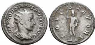
721 Gordian III. A.D. 238-244. AR antoninianus Reference: Condition: Very Fine Weig ht: 4.8 gr Diameter: 22 mm 1