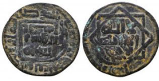
1148 Umayyad: Emir el Velid bin Talid, AE fals Condition: Very Fine Weight: 2.9 gr Diameter: 22 mm 1