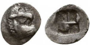
123 Greek Obol, Ca. 350-300 BC. AR. Reference: Condition: Very Fine Weight: 0.1 gr Diameter: 7 mm 1