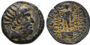
324 SELEUKID KINGDOM. 2nd - 1st Century BC . Ae Reference: Condition: Very Fine Weight: 3.7 gr Diameter: 17 mm 1