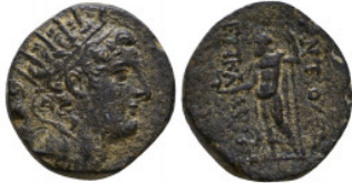
332 SELEUKID KINGDOM. 2nd - 1st Century BC . Ae Reference: Condition: Very Fine Weight: 5.9 gr Diameter: 17 mm 1