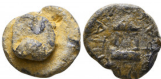
898 Byzantine Lead Seals, 7th - 13th Centuries Reference: Condition: Very Fine Weight: 12.6 gr Diameter: 21 mm 1