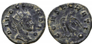
770 Claudius II Gothicus. A.D. 268-270. AE antoninianus Reference: Condition: Very Fine Weight: 3.3 gr Diameter: 20 mm 1