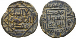
1147 Umayyad: Emir el Velid bin Talid, AE fals Condition: Very Fine Weight: 2.9 gr Diameter: 21 mm 1