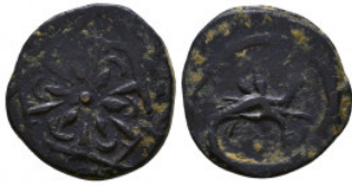
1194 Saruhanoglu AE manghir Condition: Very Fine Weight: 3.1 gr Diameter: 18 mm 1