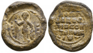
867 Byzantine Lead Seals, 7th - 13th Centuries Reference: Condition: Very Fine Weight: 9.4 gr Diameter: 21 mm 1