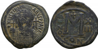
937 Justinian I. AD 527-565. Ae Reference: Condition: Very Fine Weight: 22.5 gr Diameter: 38 mm 1