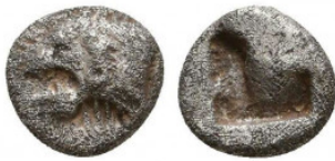
81 Greek Obol, Ca. 350-300 BC. AR. Reference: Condition: Very Fine Weight: 0.6 gr Diameter: 7 mm 1