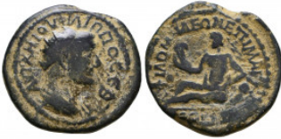
420 Roman Provincial, Ae Reference: Condition: Very Fine Weight: 9.5 gr Diameter: 26 mm 1