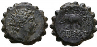
318 SELEUKID KINGDOM. Antiochos VI Dionysos (144-142 BC). Serrate Ae. Antioch on the Orontes. Obv: Radiate and diademed head right. Rev: ΒΑΣΙΛΕΩΣ ΑΝΤΙΟΧΟΥ / ΕΠΙΦΑΝΟΥΣ ΔΙΟΝΥΣΟΥ. Elephant advancing left, holding torch in trunk. Controls: To right, ΣΤΑ above star. Reference: SC 2006; HGC 9, 1043. Condition: Very Fine Weight: 7.5 gr Diameter: 22 mm 1