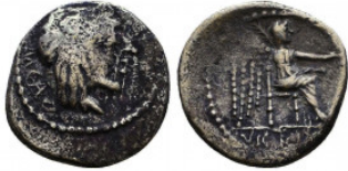
620 L. Tituri L. f. Sabinus AR Denarius, 89 BC Reference: Condition: Very Fine Weight: 2.0 gr Diameter: 14 mm 1