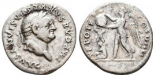
686 Vespasian. A.D. 69-79. AR denarius Reference: Condition: Very Fine Weight: 3.2 gr Diameter: 18 mm 1