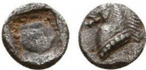
104 Greek Obol, Ca. 350-300 BC. AR. Reference: Condition: Very Fine Weight: 0.1 gr Diameter: 4 mm 1