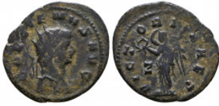
763 GALLIENUS, 254-268 AD. AE Antoninianus Reference: Condition: Very Fine Weight: 3.4 gr Diameter: 23 mm 1