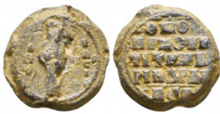
885 Byzantine Lead Seals, 7th - 13th Centuries Reference: Condition: Very Fine Weight: 7.1 gr Diameter: 19 mm 1