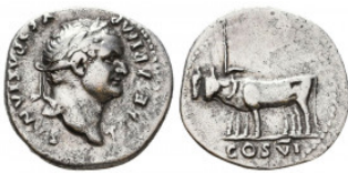
685 Vespasian. A.D. 69-79. AR denarius Reference: Condition: Very Fine Weight: 3.4 gr Diameter: 18 mm 1