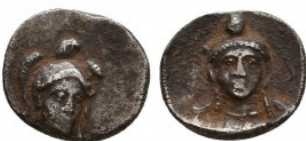
80 Greek Obol, Ca. 350-300 BC. AR. Reference: Condition: Very Fine Weight: 0.8 gr Diameter: 9 mm 1