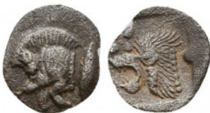
101 Greek Obol, Ca. 350-300 BC. AR. Reference: Condition: Very Fine Weight: 0.3 gr Diameter: 8 mm 1