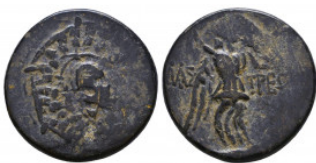
289 Paphlagonia, Amastris. Ca. 85-65 B.C. AE Reference: Condition: Very Fine Weight: 7.8 gr Diameter: 22 mm 1