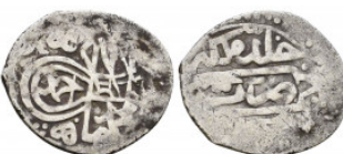
1256 Ottoman ,AR aqçe,Ahmed II Qustantîniyyah / Qostantîniye Condition: Very Fine Weight: 2.2 gr Diameter: 21 mm 1