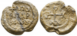
899 Byzantine Lead Seals, 7th - 13th Centuries Reference: Condition: Very Fine Weight: 8.4 gr Diameter: 23 mm 1