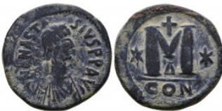
931 Anastasius I AD 491-518. Follis Æ Reference: Condition: Very Fine Weight: 16.0 gr Diameter: 32mm 1