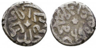
1249 Ottoman Aqche II. Mehmed ( fatih ) Serez Condition: Very Fine Weight: 0.9 gr Diameter: 10 mm 1