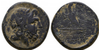
263 PAPHLAGONIA, Sinope. Circa 85-65 BC. Æ Reference: Condition: Very Fine Weight: 20.4 gr Diameter: 27, mm 1