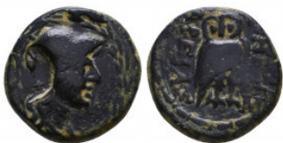
248 MYSIA. Pergamon. Ae (Circa 133-27 BC). Reference: Condition: Very Fine Weight: 4.7 gr Diameter: 15 mm 1