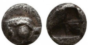
125 Greek Obol, Ca. 350-300 BC. AR. Reference: Condition: Very Fine Weight: 0.4 gr Diameter: 6 mm 1