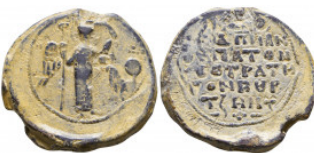
864 Byzantine Lead Seals, 7th - 13th Centuries Reference: Condition: Very Fine Weight: 38.0 gr Diameter: 38 mm 1