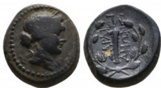
198 LYDIA. Sardes. Ae (Circa 133 BC-14 AD). Ae Reference: Condition: Very Fine Weight: 4.9 gr Diameter: 15 mm 1