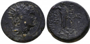
327 SELEUKID KINGDOM. 2nd - 1st Century BC . Ae Reference: Condition: Very Fine Weight: 7.8 gr Diameter: 21 mm 1