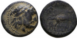
243 Greek Coins, Ae. (359-336 BC), Æ Reference: Condition: Very Fine Weight: 4.5 gr Diameter: 18 mm 1