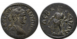
434 Roman Provincial, Ae Reference: Condition: Very Fine Weight: 5.5 gr Diameter: 22 mm 1