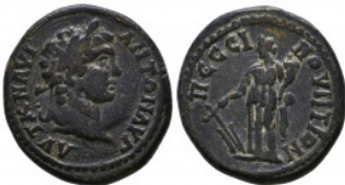
431 Roman Provincial, Ae Reference: Condition: Very Fine Weight: 9.5 gr Diameter: 24 mm 1