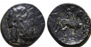
194 Greek Coins, Ae. (359-336 BC), Æ Reference: Condition: Very Fine Weight: 5.9 gr Diameter: 17 mm 1