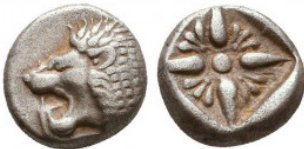
99 Greek Obol, Ca. 350-300 BC. AR. Reference: Condition: Very Fine Weight: 1.1 gr Diameter: 8 mm 1