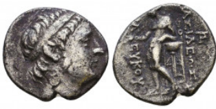
317 SELEUKID KINGS of SYRIA. Seleukos II Kallinikos. 246-226 BC. AR Drachm Reference: Condition: Very Fine Weight: 3.8 gr Diameter: 17 mm 1