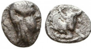
89 Greek Obol, Ca. 350-300 BC. AR. Reference: Condition: Very Fine Weight: 0.7 gr Diameter: 8 mm 1