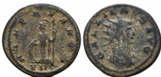
762 GALLIENUS, 254-268 AD. AE Antoninianus Reference: Condition: Very Fine Weight: 3.3 gr Diameter: 21 mm 1