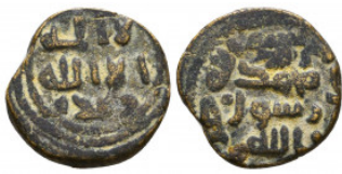
1156 Umayyad: Anonymous, AE fals Condition: Very Fine Weight: 3.6 gr Diameter: 17 mm 1