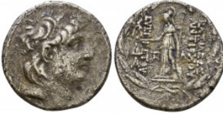
316 Seleukid Kings of Syria. Antiochos VII Euergetes (Sidetes) AR Tetradrachm. Cappadocian mint, 138-129 BC. Reference: Condition: Very Fine Weight: 16.3 gr Diameter: 27mm 1