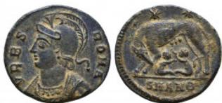
808 Constantine I. A.D. 307/10-337. AE. VRBS ROMA, City Commemorative for Rome. Reference: Condition: Very Fine Weight: 2.3 gr Diameter: 16 mm 1