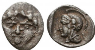
71 Greek Obol, Ca. 350-300 BC. AR. Reference: Condition: Very Fine Weight: 1.0 gr Diameter: 11 mm 1