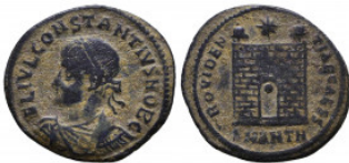
825 Constantine II. As Caesar, A.D. 317-337. Æ Follis Reference: Condition: Very Fine Weight: 2.5 gr Diameter: 20 mm 1