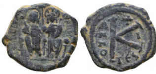
960 Justin II and Sophia. 565-578. AE Reference: Condition: Very Fine Weight: 5.7 gr Diameter: 21 mm 1