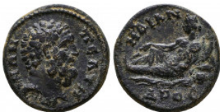
409 Pseudo-autonomous (2nd century). Ae. Reference: Condition: Very Fine Weight: 4.6 gr Diameter: 19 mm 1