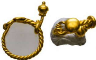
1295 Ancient Roman Very Special and elegant Solid Gold Earring . 1st - 3rd century A D Reference: Condition: Very Fine Weight: 2.2 gr Diameter: 15 mm 1