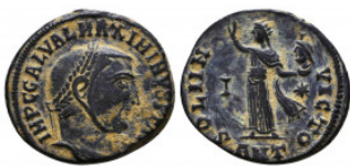
786 Maximinus II Daza. A.D. 309-313. AE follis Reference: Condition: Very Fine Weight: 4.4 gr Diameter: 19 mm 1