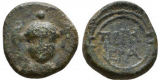
204 IONIA. Priene. Ae (Circa 334-320 BC). Reference: Condition: Very Fine Weight: 2.8 gr Diameter: 14 mm 1