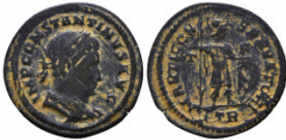
791 Constantine I. A.D. 307/10-337. AE follis Reference: Condition: Very Fine Weight: 3.7 gr Diameter: 24 mm 1