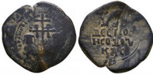
929 Theodore Comnenus-Ducas. Empire of Thessalonica, 1225-1230. AE tetarteron, 24mm. Thessalonica mint. QEO DOPOC ΔΕCΠOTHC O DOVKAC, legend in five lines / QEODWROC DOKAC OAGIOC DHMITR, Cross potent on globe (halfway down the shaft) on three steps between facing half-length figures of Theodore, wearing loros and holding akakia on left, and St. Demetrius, in military attire and holding sword and shield, on right. Reference:DOC 12; SB 2170. Condition: Very Fine Weight: 3.6 gr Diameter: 23 mm 1