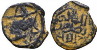
1195 ISLAMIC, Ayyubids. El- Malik AE Fals Condition: Very Fine Weight: 1.3 gr Diameter: 18 mm 1