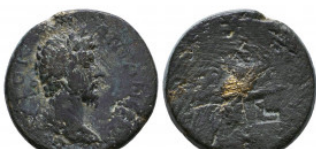
448 Roman Provincial, Ae Reference: Condition: Very Fine Weight: 7.2 gr Diameter: 21 mm 1