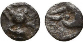
106 Greek Obol, Ca. 350-300 BC. AR. Reference: Condition: Very Fine Weight: 0.1 gr Diameter: 5 mm 1