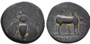
177 IONIA. Ephesus. AE, ca. 305-288 B.C. Reference: Condition: Very Fine Weight: 2.9 gr Diameter: 17 mm 1