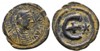
946 Justinian I. AD 527-565. Ae Reference: Condition: Very Fine Weight: 1.8 gr Diameter: 17 mm 1