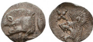
102 Greek Obol, Ca. 350-300 BC. AR. Reference: Condition: Very Fine Weight: 0.3 gr Diameter: 9 mm 1