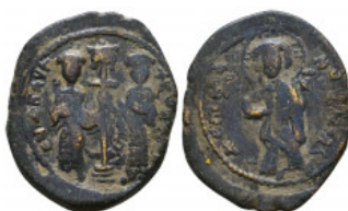
996 Byzantine Coins Ae, Anonymous, Bust of Jesus, 7th - 13th Centuries Reference: Condition: Very Fine Weight: 9.8 gr Diameter: 26 mm 1