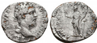
671 Septimius Severus. A.D. 193-211. AR denarius Reference: Condition: Very Fine Weight: 3.3 gr Diameter: 18 mm 1