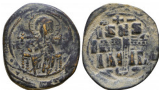
995 Byzantine Coins Ae, Anonymous, Bust of Jesus, 7th - 13th Centuries Reference: Condition: Very Fine Weight: 9.0 gr Diameter: 33 mm 1