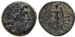
334 SELEUKID KINGDOM. 2nd - 1st Century BC . Ae Reference: Condition: Very Fine Weight: 5.5 gr Diameter: 16 mm 1