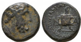
298 Cilicia. Mopsus 39-31 B.C. AE Reference: Condition: Very Fine Weight: 6.3 gr Diameter: 16 mm 1