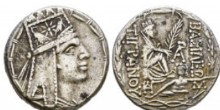
346 Artaxiad Kingdom. Tigranes II 'the Great'. Silver Tetradrachm. 95-56 BC. Reference: Condition: Very Fine Weight: 16.0 gr Diameter: 27mm 1