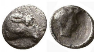
92 Greek Obol, Ca. 350-300 BC. AR. Reference: Condition: Very Fine Weight: 0.3 gr Diameter: 5 mm 1