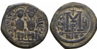
956 Justin II and Sophia. 565-578. AE Reference: Condition: Very Fine Weight: 11.6 gr Diameter: 27 mm 1