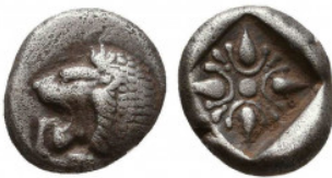
98 Greek Obol, Ca. 350-300 BC. AR. Reference: Condition: Very Fine Weight: 1.0 gr Diameter: 9 mm 1