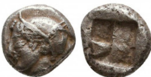
94 Greek Obol, Ca. 350-300 BC. AR. Reference: Condition: Very Fine Weight: 1.4 gr Diameter: 9 mm 1