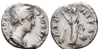
706 Diva Faustina I. Died A.D. 140/1. AR denarius Reference: Condition: Very Fine Weight: 3.2 gr Diameter: 17 mm 1