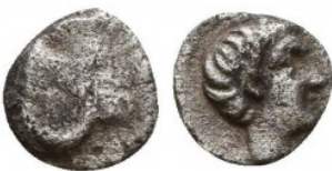
129 Greek Obol, Ca. 350-300 BC. AR. Reference: Condition: Very Fine Weight: 0.2 gr Diameter: 6 mm 1