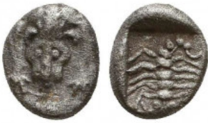
126 Greek Obol, Ca. 350-300 BC. AR. Reference: Condition: Very Fine Weight: 0.5 gr Diameter: 7 mm 1