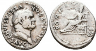
683 Vespasian. A.D. 69-79. AR denarius Reference: Condition: Very Fine Weight: 3.4 gr Diameter: 18 mm 1