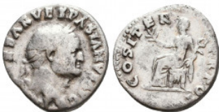
689 Vespasian. A.D. 69-79. AR denarius Reference: Condition: Very Fine Weight: 3.3 gr Diameter: 18 mm 1