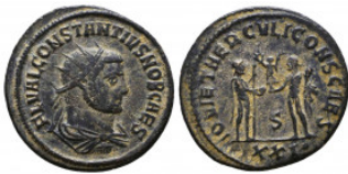
789 CONSTANTIUS I, 296-305 AD. Silvered AE antoninianus Reference: Condition: Very Fine Weight: 4.4 gr Diameter: 23 mm 1