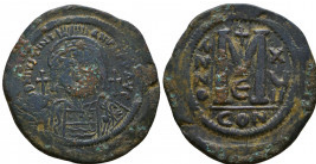
939 Justinian I. AD 527-565. Ae Reference: Condition: Very Fine Weight: 19.0 gr Diameter: 36mm 1