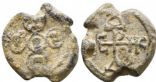
889 Byzantine Lead Seals, 7th - 13th Centuries Reference: Condition: Very Fine Weight: 11.4 gr Diameter: 24mm 1