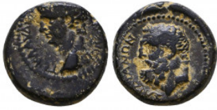
403 Roman Provincial, Ae Reference: Condition: Very Fine Weight: 3.6 gr Diameter: 16 mm 1