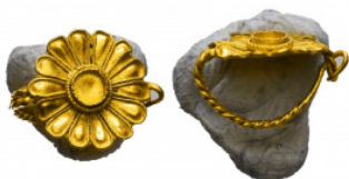
1301 Ancient Roman Very Special and elegant Solid Gold Earring . 1st - 3rd century A D Reference: Condition: Very Fine Weight: 0.5 gr Diameter: 11 mm 1