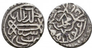
1246 Ottoman Aqche II. Mehmed ( fatih ) Serez Condition: Very Fine Weight: 0.9 gr Diameter: 11 mm 1