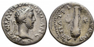
477 CAPPADOCIA, Caesarea. Commodus, as Caesar. 175-177 AD. AR Reference: Condition: Very Fine Weight: 3.7 gr Diameter: 19 mm 1