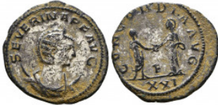
732 Severina. Augusta, A.D. 270-275. AE antoninianus Reference: Condition: Very Fine Weight: 3.8 gr Diameter: 23 mm 1