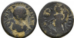
422 Roman Provincial, Ae Reference: Condition: Very Fine Weight: 5.4 gr Diameter: 18 mm 1