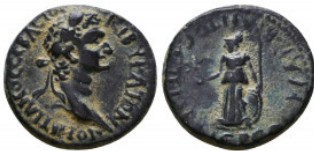
407 PHRYGIA. Kibyra . Domitian (AD 81-96) Ae. Reference: Condition: Very Fine Weight: 3.9 gr Diameter: 18mm 1