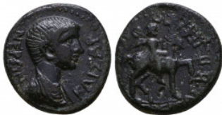
415 Nero (54-68). Phrygia, Julia. Æ Reference: Condition: Very Fine Weight: 4.5 gr Diameter: 19 mm 1