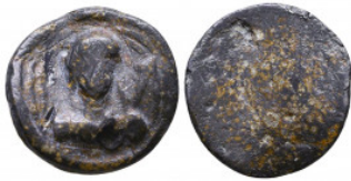
907 Byzantine Lead Seals, 7th - 13th Centuries Reference: Condition: Very Fine Weight: 4.8 gr Diameter: 19 mm 1