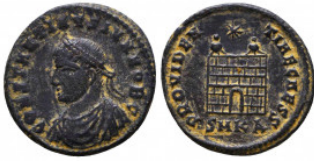
819 Constantine II. As Caesar, A.D. 317-337. Æ Follis Reference: Condition: Very Fine Weight: 2.5 gr Diameter: 19 mm 1