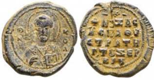
883 Byzantine Lead Seals, 7th - 13th Centuries Reference: Condition: Very Fine Weight: 14.8 gr Diameter: 27 mm 1