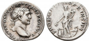
655 Trajan (AD 98-117). AR denarius. Reference: Condition: Very Fine Weight: 3.3 gr Diameter: 18 mm 1