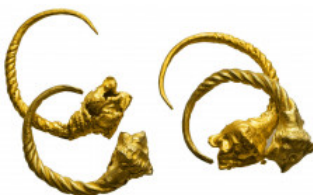
1292 Ancient Roman Very Special and elegant a pair of Gold Earrings with a lion motif . 1st - 3rd century AD Reference: Condition: Very Fine Weight: lot gr Diameter: mm 1