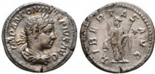
702 ELAGABALUS, 218-222 AD. AR Denarius Reference: Condition: Very Fine Weight: 3.0 gr Diameter: 19 mm 1