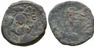
928 Byzantine Coins, Countermark, (A.D. 610-641), AE follis, Reference: Condition: Very Fine Weight: 8.0 gr Diameter: 27 mm 1