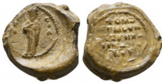
879 Byzantine Lead Seals, 7th - 13th Centuries Reference: Condition: Very Fine Weight: 10.0 gr Diameter: 20mm 1