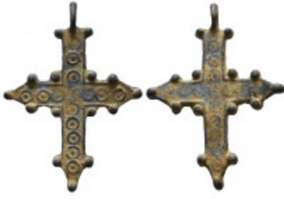
1356 Byzantine Cross Pendant, Ae Bronze, 7th - 13th century AD. Reference: Condition: Very Fine Weight: 5.6 gr Diameter: 47 mm 1