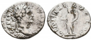
669 Septimius Severus. A.D. 193-211. AR denarius Reference: Condition: Very Fine Weight: 2.9 gr Diameter: 18 mm 1