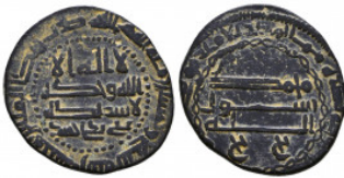
1140 Islamic - Abbasid Ebu Abdullah Muhammed el Mehdi H. 158/169 AE fals Condition: Very Fine Weight: 5.1 gr Diameter: 23 mm 1