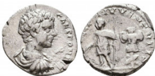
696 Caracalla. A.D. 198-217. AR denarius Reference: Condition: Very Fine Weight: 2.4 gr Diameter: 15 mm 1