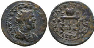
459 Valerianus I (253-260 AD). AE, Anazarbos, Cilicia Reference: Condition: Very Fine Weight: 12.3 gr Diameter: 26mm 1