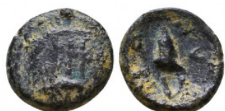
342 SELEUKID KINGDOM. 2nd - 1st Century BC . Ae Reference: Condition: Very Fine Weight: 2.1 gr Diameter: 17 mm 1