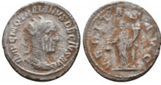
715 TRAJAN DECIUS, 249-251 AD. AR Antoninianus Reference: Condition: Very Fine Weight: 3.3 gr Diameter: 21 mm 1