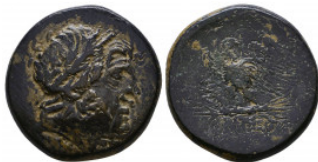
262 PONTOS, Amisos. Circa 109-89 BC. Æ Reference: Condition: Very Fine Weight: 21.0 gr Diameter: 28mm 1