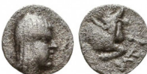
88 Greek Obol, Ca. 350-300 BC. AR. Reference: Condition: Very Fine Weight: 0.6 gr Diameter: 9 mm 1