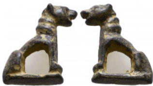
1360 Description will be added Reference: Condition: Very Fine Weight: 18.0 gr Diameter: 35 mm 1