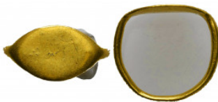
1290 Ancient Roman Very Special and elegant Solid Gold Ring . 1st - 3rd century AD Reference: Condition: Very Fine Weight: 3.3 gr Diameter: 18 mm 1