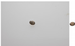
100 Greek Obol, Ca. 350-300 BC. AR. Reference: Condition: Very Fine Weight: 0.2 gr Diameter: 7 mm 1