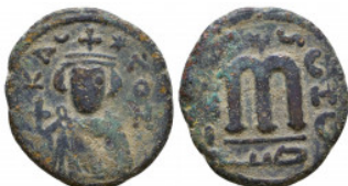
1058 Arab - Byzantine Coins, Ae Reference: Condition: Very Fine Weight: 4.2 gr Diameter: 20 mm 1