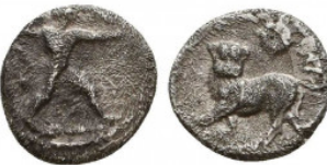
115 Greek Obol, Ca. 350-300 BC. AR. Reference: Condition: Very Fine Weight: 0.7 gr Diameter: 9 mm 1