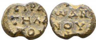
897 Byzantine Lead Seals, 7th - 13th Centuries Reference: Condition: Very Fine Weight: 7.7 gr Diameter: 20 mm 1