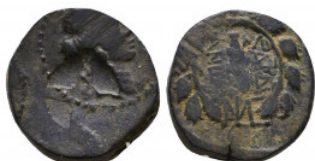
200 LYDIA. Sardes. Ae (Circa 133 BC-14 AD). Ae Reference: Condition: Very Fine Weight: 3.7 gr Diameter: 14 mm 1