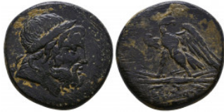
260 PONTOS, Amisos. Circa 109-89 BC. Æ Reference: Condition: Very Fine Weight: 20.3 gr Diameter: 29mm 1