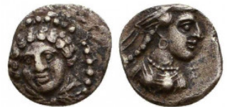
61 Greek Obol, Ca. 350-300 BC. AR. Reference: Condition: Very Fine Weight: 0.8 gr Diameter: 8 mm 1