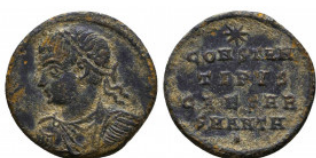
794 Constantine I. A.D. 307/10-337. AE follis Reference: Condition: Very Fine Weight: 2.0 gr Diameter: 17 mm 1