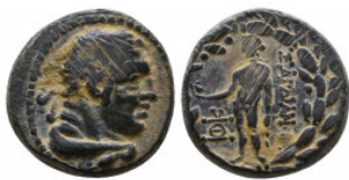
197 LYDIA. Sardes. Ae (Circa 133 BC-14 AD). Ae Reference: Condition: Very Fine Weight: 6.0 gr Diameter: 16 mm 1