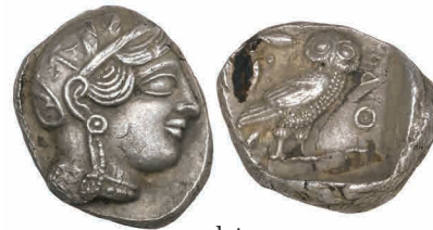
ex lot 70