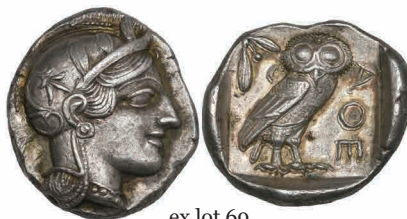
ex lot 69