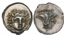
ex lot 123