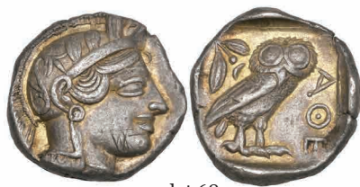
ex lot 68