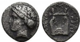
210 Ionia, Kolophon AR Diobol, c. 375-360 BC Kolophon, Ionia. AR Diobol (11 mm, 1.00 g), c. 375-360 BC. Obv. Laureate head of Apollo left. Rev: ΚΟΛΟΦΩ ΠΟΣΙΣ, lyre. 1