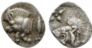
98 Mysia. Kyzikos circa 480 BC. Hemiobol AR (9.5mm, 0.3g) Forepart of boar to left, tunny fish swimming upwards / Head of lion to left within incuse square, star to upper left. 1