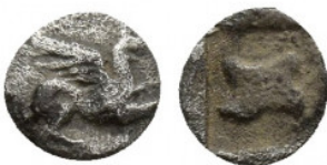
209 IONIA, Teos. Circa 425-400 BC. AR Tetartemorion (5.7mm, 0.1 g). Griffin seated right, forepaw raised / Astragalos within incuse square. 1