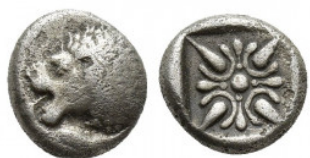
212 Miletos AR Obol, c. 525-475 BC Miletos, Ionia. AR Obol (8 mm, 1.2 g), c. 525-475 BC. Obv. Forepart of lion left. Rev. Stellate pattern in incuse square. 1