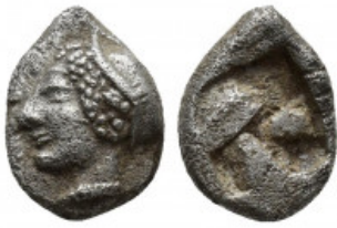
96 IONIA, Phokaia. Circa 521-478 BC. AR Hemihekte (8.9mm, 1.2 g). Phokaic standard. Female head left, wearing helmet or close fitting cap / Quadripartite incuse square. 1