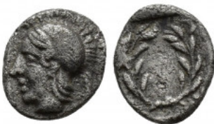
99 AEOLIS. Elaia. Diobol (Circa 450-400 BC). (10.3mm, 1.3g) Obv: Helmeted head of Athena left. Rev: ΕΛΑΙ. Laurel wreath within incuse square. 1