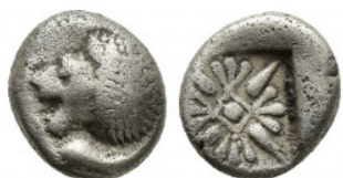
211 Miletos AR Obol, c. 525-475 BC Miletos, Ionia. AR Obol (9 mm, 1.2 g), c. 525-475 BC. Obv. Forepart of lion left. Rev. Stellate pattern in incuse square. 1