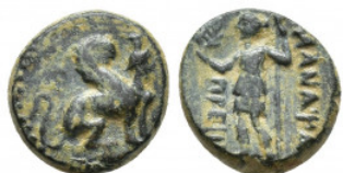
102 PAMPHYLIA. Perge. Ae (Circa 260-230 BC). (1.7mm, 2.4g) Obv: Sphinx seated right. Rev: ΙΑΝΑΨΑΣ / ΠΡΕΙΙΑΣ. Artemis standing left, holding wreath and scepter. 1