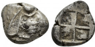
207 Ionia, Ephesos, c. 500-420 BC. AR Drachm (13mm, 3.2g). Bee with curved wings. R/ Quadripartite incuse square. 1