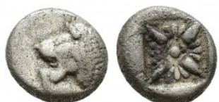
213 Miletos AR Obol, c. 525-475 BC Miletos, Ionia. AR Obol (8 mm, 1.2 g), c. 525-475 BC. Obv. Forepart of lion left. Rev. Stellate pattern in incuse square. 1