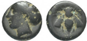
97 IONIA. Ephesos. Ae (Circa 387-295 BC). (8.8mm, 1.3 g), Obv: Female head left. Rev: ΕΦ. Bee. 1