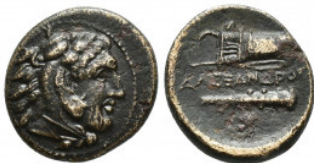
100 KINGS OF MACEDON. Alexander III 'the Great' (336-323 BC). Ae Unit. (18.9mm, 5.1g) Uncertain mint in Western Asia Minor. Obv: Head of Herakles right, wearing lion's skin. Rev: ΑΛΕΞΑΝΔΡΟΥ. Bow in quiver left; below, club right. 1