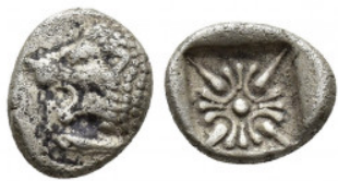
208 Miletos AR Obol, c. 525-475 BC Miletos, Ionia. AR Obol (8.8 mm, 1.00 g), c. 525-475 BC. Obv. Forepart of lion left. Rev. Stellate pattern in incuse square. 1