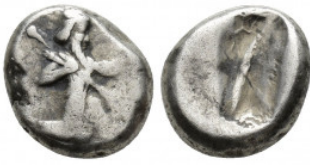
206 Asia Minor - Lydia - AR Siglos (Period of Artaxerxes-Darius III ca. 450-330 BC) - (15mm, 5.6g) Archer kneeling right holding spear and bow / Oblong punch 1