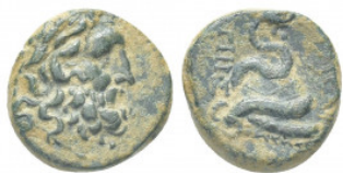
101 Mysia, Pergamon. Æ (17.5mm, 7.00g), mid-late 2nd century BC. Laureate head of Asklepios right. Reverse: [ΑΣ]ΚΛΗΠΙΟΥ [Σ]ΩΤΗΡΟΣ, serpent coiled around omphalos. 1