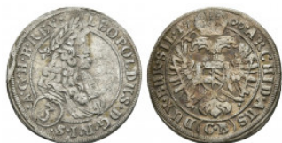
559 Leopold I, House of Habsburg 3 Kreuzer 1700 (19.9mm, 1.47 g)