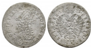
554 Leopold I, House of Habsburg 3 Kreuzer 1695 (21mm, 1.4g)