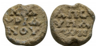
543 Unidentified Byzantine lead seal, 17.8 mm, 10.3 gr.