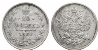
557 Russia, Empire. Alexander II Nikolaevich (1855-1881) AR 20 Kopecks. Saint Petersburg ФБ, 1860. (22mm, 3.9 g) Crowned double-headed imperial eagle facing with wings displayed, holding sceptre and orb; shield of St. George on breast with eight provincial coats-of-arms on wings / Date and value in Cyrillic within olive and oak wreath; imperial crown above.