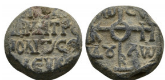
542 Unidentified Byzantine lead seal, 20.5 mm, 16.6 gr.