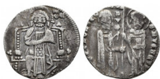
558 ITALY, Venezia (Venice). AR Grosso (18.6mm, 1.9 g.). Doge and S. Marco standing facing, holding banner between them / Christ Pantokrator enthroned facing; small pellet to right of Christ's waist.