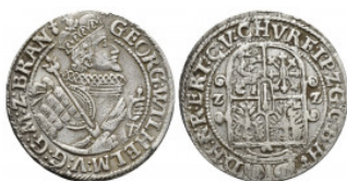
556 GERMANY. Brandenburg-Prussia. Georg Wilhelm (1619-1640). Ort (1622). (29mm, 6.2 g) Königsberg. Obv: GEORG WILHELM V G G M Z BRAN . Crowned bust right with sword and sceptre. Rev: D H R R E R T C V CHVRF I P Z G C B H. Crowned coat of arms flanked by date.