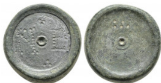
560 Byzantine AE Weight above ME (23mm, 22 g).SOLD AS SEEN NO RETURNS.