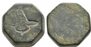
561 ISLAMIC WEIGHTS Ottoman Empire. Weight of 10 dirhems (Bronze, 20.8x11mm, 31.7 g), an octangular commercial-weight. Tuğra. Rev. Plain.