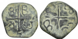
555 CRUSADERS. Lords of Rhodes. Time of Michael VIII Palaeologus -Andronikos II Palaeologus, circa 1250-1309. (20 mm, 2.00 g ), c. 1259-1309 but probably 1261-1275. Plain cross with B in each quarter (coat of arms of the Palaeologos family). Rev. Plain cross with B in each quarter (coat of arms of the Palaeologos family).