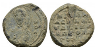
541 Unidentified Byzantine lead seal, 20.6 mm, 10.38 gr.