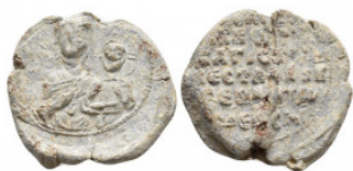
538 Unidentified Byzantine lead seal, 29 mm, 13.4 gr.