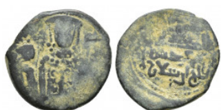
545 Seljuks. Rum. Rukn al-Din Mas'ud I, AH 510-551 / AD 1116-1156. Fals (Bronze, 21 mm, 4.9 g ). Half-length facing bust of a Byzantine emperor, wearing loros, holding labrum and globus cruciger. Rev. Name and titles of Ghiyath al-Din Kay Khusraw I in four lines.