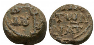
544 Unidentified Byzantine lead seal, 18.1 mm, 11.7 gr.