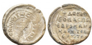
540 Unidentified Byzantine lead seal, 21 mm, 7.6 gr.