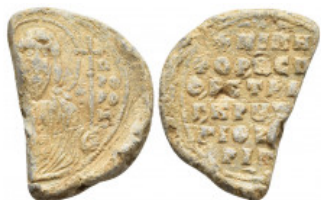
539 Unidentified Byzantine lead seal, 28 mm, 13.4 gr.