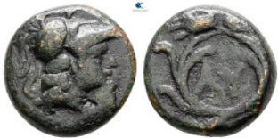
98 The Thracian Chersonese. Lysimacheia circa 196-190 BC. Bronze Æ 10 mm, 1,64 g very fine 10