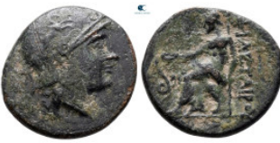
259 Kings of Pergamon. Pergamon. Philetairos 282-263 BC. Bronze Æ 18 mm, 3,73 g very fine 10