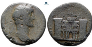
677 Thrace. Bizya. Antoninus Pius AD 138-161. Bronze Æ 27 mm, 14,27 g nearly very fine 10