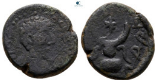
956 Mesopotamia. Carrhae. Septimius Severus AD 193-211. Bronze Æ 15 mm, 2,64 g nearly very fine 10