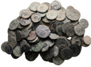
1840 Lot of ca. 120 roman bronze coins / SOLD AS SEEN, NO RETURN! nearly very fine 10