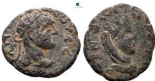
958 Mesopotamia. Carrhae. Caracalla AD 198-217. Bronze Æ 18 mm, 2,50 g very fine 10