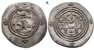
584 Sasanian Kingdom. Husrav (Khosrau) II AD 591-628. Drachm AR 28 mm, 4,16 g extremely fine 10