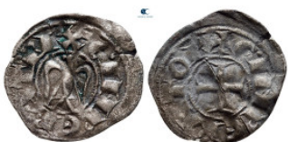
1630 Italy. Kingdom of Sicily. Messina . Enrico VI and Costanza AD 1194-1196. Denaro BI 17 mm, 0,51 g very fine 10