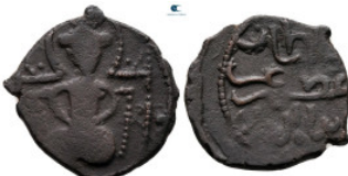
1717 Seljuks. Rum. Izz al-Din Kay Ka'us II AH 643-647. Fals Æ 19 mm, 3,54 g very fine 10