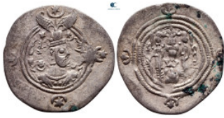
600 Sasanian Kingdom. Husrav (Khosrau) II AD 591-628. Drachm AR 30 mm, 4,03 g extremely fine 10