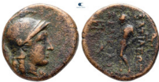
469 Seleukid Kingdom. Seleukos II Kallinikos 246-226 BC. Bronze Æ 18 mm, 3,89 g very fine 10