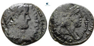
957 Mesopotamia. Carrhae. Caracalla AD 198-217. Bronze Æ 19 mm, 3,33 g nearly v ery fine 10