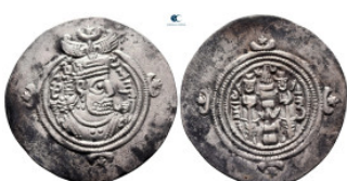
591 Sasanian Kingdom. Husrav (Khosrau) II AD 591-628. Drachm AR 32 mm, 3,70 g extremely fine 10