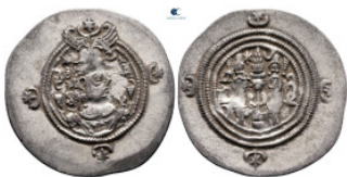
603 Sasanian Kingdom. Husrav (Khosrau) II AD 591-628. Drachm AR 31 mm, 4,10 g extremely fine 10