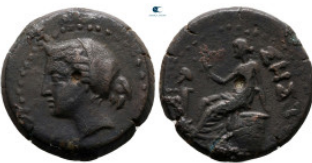
99 The Thracian Chersonese. Sestos circa 300 BC. Bronze Æ 20 mm, 5,88 g very fine 10