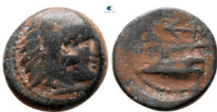
471 Seleukid Kingdom. Arados. Seleukos II Kallinikos 246-226 BC. Bronze Æ 16 mm, 3,86 g nearly very fine 10