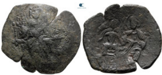
1627 Michael VIII Palaeologus AD 1261-1282. Constantinople Trachy Æ 28 mm, 3,91 g nearly very fine 10