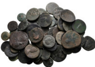
1844 Lot of ca. 63 ancient bronze coins / SOLD AS SEEN, NO RETURN! fine 10