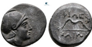
264 Kings of Pergamon. Pergamon. Philetairos 282-263 BC. Bronze Æ 14 mm, 1,88 g very fine 10