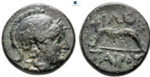
258 Kings of Pergamon. Pergamon. Philetairos 282-263 BC. Bronze Æ 12 mm, 1,83 g very fine 10