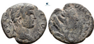
959 Mesopotamia. Carrhae. Caracalla AD 198-217. Bronze Æ 19 mm, 3,30 g very fine 10