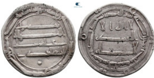
1714 Abbasid Governors. . Dirham AR 23 mm, 2,80 g very fine 10