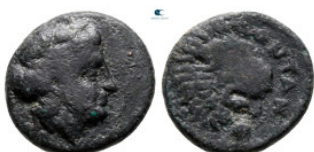
272 Troas. Antandros circa 400-300 BC. Bronze Æ 13 mm, 1,68 g nearly very fine 10