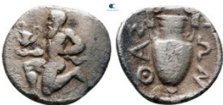
100 Islands off Thrace. Thasos circa 412-404 BC. Trihemiobol AR 12 mm, 0,84 g very fine 10