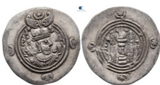
605 Sasanian Kingdom. Husrav (Khosrau) II AD 591-628. Drachm AR 32 mm, 4,11 g extremely fine 10