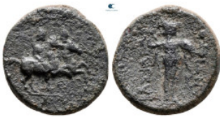
468 Seleukid Kingdom. Tarsos. Antiochos II Theos 261-246 BC. Bronze Æ 17 mm, 4,02 g nearly very fine 10