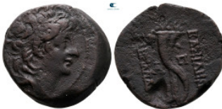
490 Seleukid Kingdom. Antioch on the Orontes. Alexander II Zabinas 128-122 BC. Bronze Æ 21 mm, 7,66 g very fine 10