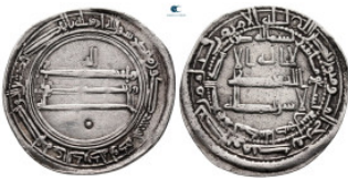
1713 Abbasid Governors. . Dirham AR 25 mm, 2,79 g very fine 10