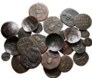
1845 Lot of ca. 25 byzantine bronze coins / SOLD AS SEEN, NO RETURN! very fine 10