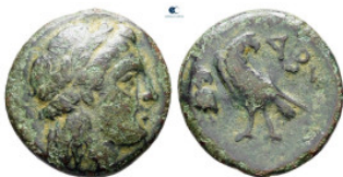
269 Troas. Abydos circa 400-300 BC. Bronze Æ 14 mm, 1,64 g very fine 10