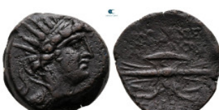
494 Seleukid Kingdom. Antioch. Antiochos VIII Epiphanes Grypos 121-97 BC. Bronze Æ 19 mm, 6,50 g very fine 10