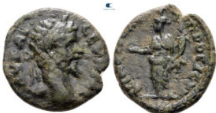
716 Moesia Inferior. Nikopolis ad Istrum. Septimius Severus AD 193-211. Bronze Æ 17 mm, 2,49 g nearly very fine 10