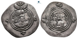
601 Sasanian Kingdom. Husrav (Khosrau) II AD 591-628. Drachm AR 34 mm, 4,09 g very fine 10