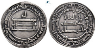
1715 Abbasid Governors. . Dirham AR 26 mm, 2,88 g very fine 10