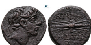
495 Seleukid Kingdom. Antioch. Antiochos IX Philopator (Kyzikenos) 114-95 BC. Bronze Æ 18 mm, 5,45 g very fine 10