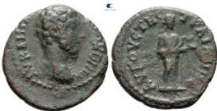
675 Thrace. Augusta Traiana. Marcus Aurelius AD 161-180. Bronze Æ 19 mm, 3,58 g nearly very fine 10