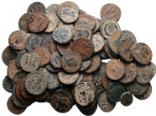
1841 Lot of ca. 100 roman bronze coins / SOLD AS SEEN, NO RETURN! very fine 10