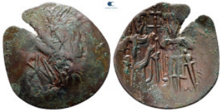
1624 Manuel Comnenus-Ducas, despot of Thessalonica AD 1230-1237. Thessalonica Trachy Æ 20 mm, 0,92 g very fine 10