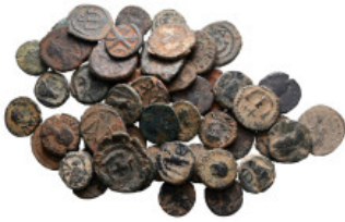
1847 Lot of ca. 50 byzantine bronze coins / SOLD AS SEEN, NO RETURN! very fine 10