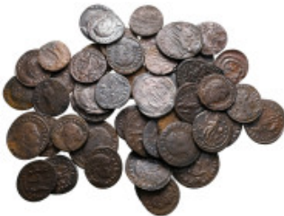
1843 Lot of ca. 50 roman bronze coins / SOLD AS SEEN, NO RETURN! very fine 10