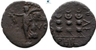
672 Macedon. Philippi. Pseudo-autonomous issue. Time of Claudius to Nero AD 41-68. Bronze Æ 18 mm, 1,94 g very fine 10