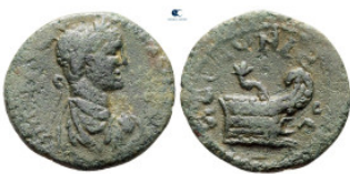
679 Thrace. Coela. Caracalla AD 198-217. Bronze Æ 18 mm, 2,88 g very fine 10