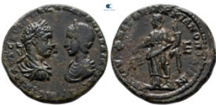
714 Moesia Inferior. Marcianopolis. Elagabalus, with Julia Maesa AD 218-222. Bronze Æ 26 mm, 9,33 g very fine 10