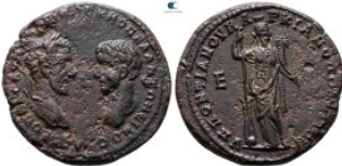
713 Moesia Inferior. Marcianopolis. Macrinus and Diadumenian AD 217-218. Bronze Æ 28 mm, 10,46 g very fine 10