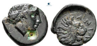
271 Troas. Antandros circa 400-200 BC. Bronze Æ 10 mm, 0,58 g very fine 10