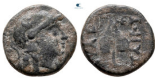
267 Kings of Pergamon. Pergamon. Philetairos 282-263 BC. Bronze Æ 13 mm, 1,54 g nearly very fine 10