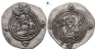
604 Sasanian Kingdom. Husrav (Khosrau) II AD 591-628. Drachm AR 30 mm, 4,16 g extremely fine 10