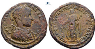
715 Moesia Inferior. Marcianopolis. Severus Alexander AD 222-235. Bronze Æ 27 mm, 8,96 g very fine 10