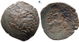
1623 John III Ducas (Vatatzes), emperor of Nicaea AD 1222-1254. Magnesia Trachy Æ 25 mm, 2,95 g nearly very fine 10