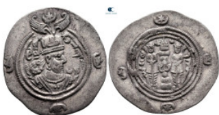
607 Sasanian Kingdom. Husrav (Khosrau) II AD 591-628. Drachm AR 31 mm, 4,16 g extremely fine 10