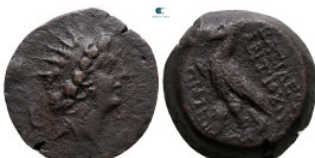
493 Seleukid Kingdom. Antioch. Antiochos VIII Epiphanes Grypos 121-97 BC. Bronze Æ 20 mm, 7,15 g very fine 10