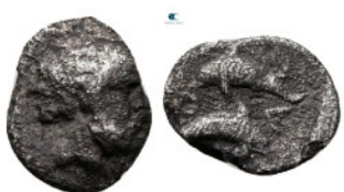
102 Islands off Thrace. Thasos circa 412-404 BC. Hemiobol AR 9 mm, 0,29 g nearly very fine 10