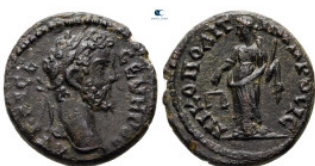
717 Moesia Inferior. Nikopolis ad Istrum. Septimius Severus AD 193-211. Bronze Æ 17 mm, 3,52 g very fine 10