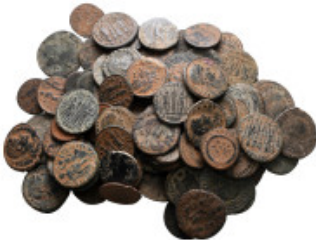
1842 Lot of ca. 100 roman bronze coins / SOLD AS SEEN, NO RETURN! very fine 10