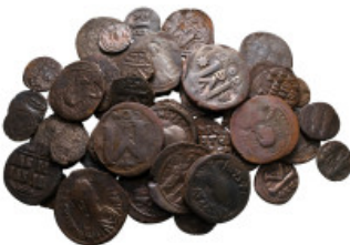
1851 Lot of ca. 50 byzantine bronze coins / SOLD AS SEEN, NO RETURN! very fine 10