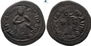
1712 Umayyad Caliphate. Time of 'Abd al-Malik ibn Marwan AH 65-86. Fals Æ 23 mm, 4,16 g very fine 10