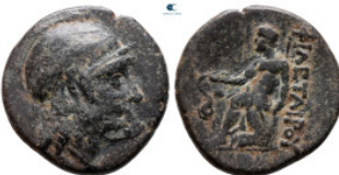
261 Kings of Pergamon. Pergamon. Philetairos 282-263 BC. Bronze Æ 18 mm, 3,23 g very fine 10