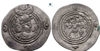
606 Sasanian Kingdom. Husrav (Khosrau) II AD 591-628. Drachm AR 31 mm, 4,13 g extremely fine 10