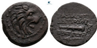
489 Seleukid Kingdom. Antioch on the Orontes. Antiochos VII Euergetes 138-129 BC. Bronze Æ 16 mm, 2,99 g very fine 10