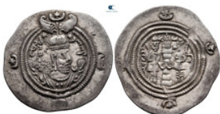
587 Sasanian Kingdom. Husrav (Khosrau) II AD 591-628. Drachm AR 31 mm, 4,15 g extremely fine 10