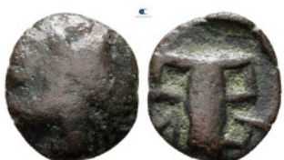
103 Kings of Thrace. Odrysian regal coinage circa 400-300 BC. Bronze Æ 9 mm, 0,54 g fine 10