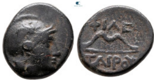
266 Kings of Pergamon. Pergamon. Philetairos 282-263 BC. Bronze Æ 13 mm, 1,80 g very fine 10