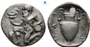
101 Islands off Thrace. Thasos circa 412-404 BC. Trihemiobol AR 12 mm, 0,90 g very fine 10