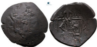
1629 Michael VIII Palaeologus AD 1261-1282. Constantinople Trachy Æ 25 mm, 2,47 g very fine 10