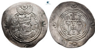
585 Sasanian Kingdom. Husrav (Khosrau) II AD 591-628. Drachm AR 32 mm, 4,15 g extremely fine 10