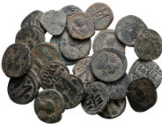
1849 Lot of ca. 50 byzantine bronze coins / SOLD AS SEEN, NO RETURN! very fine 10