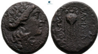
470 Seleukid Kingdom. Antioch on the Orontes. Seleukos II Kallinikos 246-226 BC. Bronze Æ 20 mm, 8,46 g nearly very fine 10