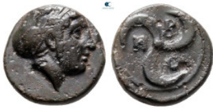
257 Mysia. Thebe (or Hypoplakia) circa 300-200 BC. Bronze Æ 10 mm, 1,07 g very fine 10