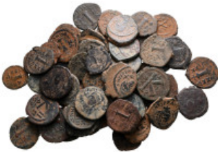
1848 Lot of ca. 60 byzantine bronze coins / SOLD AS SEEN, NO RETURN! very fine 10