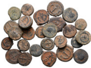
1846 Lot of ca. 25 byzantine bronze coins / SOLD AS SEEN, NO RETURN! nearly very fine 10