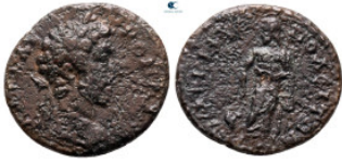
712 Moesia Inferior. Marcianopolis. Commodus AD 180-192. Bronze Æ 17 mm, 2,50 g very fine 10