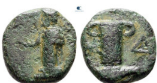
104 Kings of Thrace. Odrysian regal coinage circa 400-300 BC. Bronze Æ 10 mm, 0,90 g very fine 10