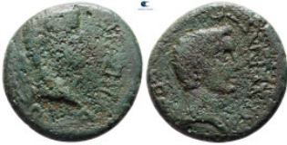
673 Macedon. Thessalonica. Augustus with Tiberius 27 BC-AD 14. Bronze Æ 20 mm, 5,77 g fine 10