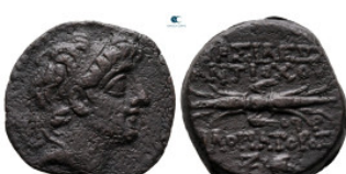
496 Seleukid Kingdom. Antioch on the Orontes. Antiochos IX Philopator (Kyzikenos) 114-95 BC. Bronze Æ 19 mm, 5,10 g very fine 10