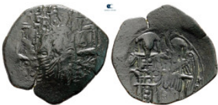
1626 Michael VIII Palaeologus AD 1261-1282. Constantinople Trachy Æ 24 mm, 2,47 g very fine 10