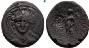
466 Seleukid Kingdom. Antioch or Sardeis. Antiochos I Soter 281-261 BC. Bronze Æ 15 mm, 3,12 g nearly very fine 10