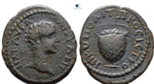
718 Moesia Inferior. Nikopolis ad Istrum. Caracalla AD 198-217. Bronze Æ 18 mm, 2,19 g nearly very fine 10