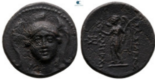
465 Seleukid Kingdom. Antioch or Sardeis. Antiochos I Soter 281-261 BC. Bronze Æ 14 mm, 2,24 g very fine 10