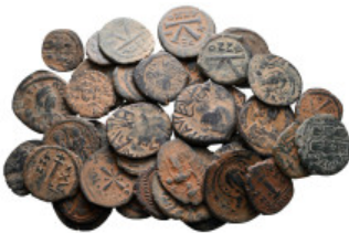
1850 Lot of ca. 40 byzantine bronze coins / SOLD AS SEEN, NO RETURN! very fine 10