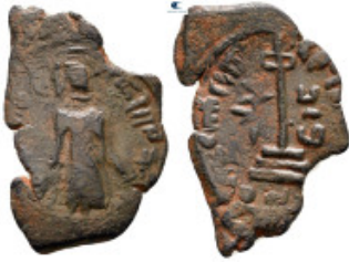
1711 Umayyad Caliphate. Time of 'Abd al-Malik ibn Marwan AH 65-86. Fals Æ 26 mm, 2,20 g very fine 10