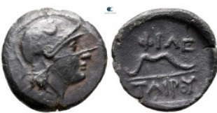
262 Kings of Pergamon. Pergamon. Philetairos 282-263 BC. Bronze Æ 14 mm, 1,46 g very fine 10