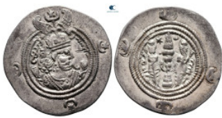
602 Sasanian Kingdom. Husrav (Khosrau) II AD 591-628. Drachm AR 30 mm, 4,13 g extremely fine 10