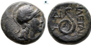
260 Kings of Pergamon. Pergamon. Philetairos 282-263 BC. Bronze Æ 15 mm, 5,30 g very fine 10