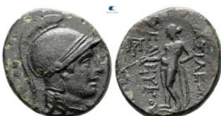
472 Seleukid Kingdom. Sardeis. Seleukos II Kallinikos 246-226 BC. Bronze Æ 18 mm, 3,80 g very fine 10