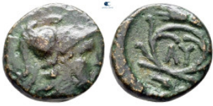
97 The Thracian Chersonese. Lysimacheia circa 196-190 BC. Bronze Æ 11 mm, 1,32 g very fine 10