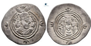
588 Sasanian Kingdom. Husrav (Khosrau) II AD 591-628. Drachm AR 32 mm, 4,12 g extremely fine 10