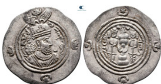
590 Sasanian Kingdom. Husrav (Khosrau) II AD 591-628. Drachm AR 31 mm, 4,13 g extremely fine 10