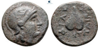
265 Kings of Pergamon. Pergamon. Philetairos 282-263 BC. Bronze Æ 13 mm, 1,84 g very fine 10