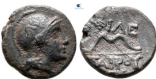
263 Kings of Pergamon. Pergamon. Philetairos 282-263 BC. Bronze Æ 13 mm, 1,78 g very fine 10