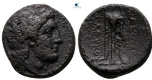
467 Seleukid Kingdom. Antioch on the Orontes. Antiochos II Theos 261-246 BC. Bronze Æ 15 mm, 3,17 g nearly very fine 10