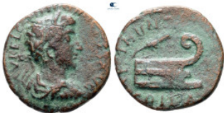
678 Thrace. Coela. Marcus Aurelius AD 161-180. Bronze Æ 17 mm, 2,92 g nearly very fine 10