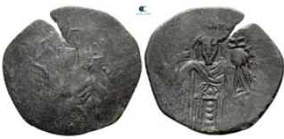
1625 Michael VIII Palaeologus AD 1261-1282. Constantinople Trachy Æ 28 mm, 3,70 g very fine 10