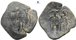
1628 Michael VIII Palaeologus AD 1261-1282. Constantinople Trachy Æ 27 mm, 2,79 g very fine 10