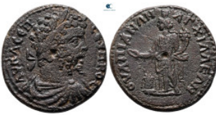
674 Thrace. Anchialos. Septimius Severus AD 193-211. Bronze Æ 28 mm, 12,76 g very fine 10