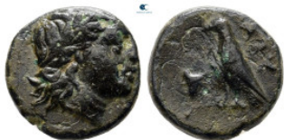
268 Troas. Abydos circa 400-300 BC. Bronze Æ 11 mm, 1,43 g very fine 10