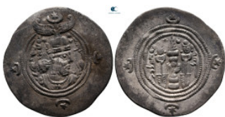
589 Sasanian Kingdom. Husrav (Khosrau) II AD 591-628. Drachm AR 32 mm, 4,20 g extremely fine 10