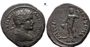
719 Moesia Inferior. Tomis. Caracalla AD 198-217. Bronze Æ 28 mm, 9,50 g very fine 10