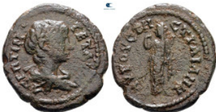
676 Thrace. Augusta Traiana. Geta AD 198-211. Bronze Æ 21 mm, 3,81 g very fine 10