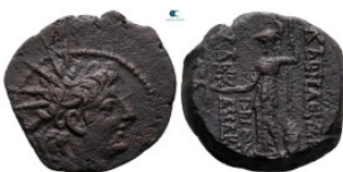
491 Seleukid Kingdom. Antioch on the Orontes. Alexander II Zabinas 128-122 BC. Bronze Æ 21 mm, 7,26 g very fine 10