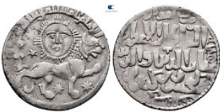
1716 Seljuks. Rum. Ghiyath al-Din Kay Khusraw II bin Kay Qubadh AH 634-644. Dirham AR 22 mm, 2,88 g very fine 10