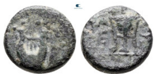
270 Troas. Alexandria circa 95-85 BC. Bronze Æ 9 mm, 0,80 g very fine 10