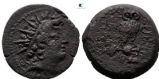
492 Seleukid Kingdom. Antioch. Cleopatra Thea and Antiochos VIII Epiphanes (Grypos) 125-121 BC. Bronze Æ 19 mm, 5,23 g very fine 10