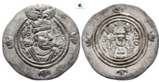
586 Sasanian Kingdom. Husrav (Khosrau) II AD 591-628. Drachm AR 30 mm, 4,14 g extremely fine 10