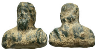
855 Bust of Zeus 30mm, 46 g