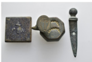
858 Mixed lot 4 pieces SOLD AS SEEN NO RETURNS.