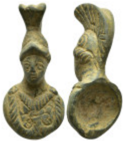
854 Appliqué of helmeted Athena? bust 46mm, 30.8 g