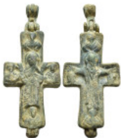
851 Byzantine Reliquary Cross Pendant. 90mm, 57.4 g