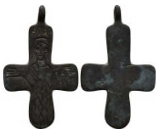
848 Byzantine Cross Pendant. (44mm, 5.3 g)