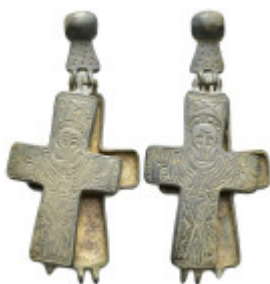
850 Byzantine Reliquary Cross Pendant. 103mm, 55.4 g