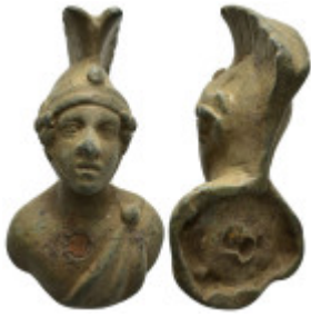
853 Roman Appliqué of helmeted male bust 52mm, 53.8 g