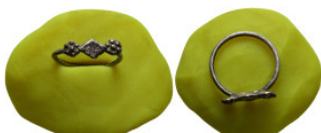
849 Silver ring (15mm, 1.7 g)