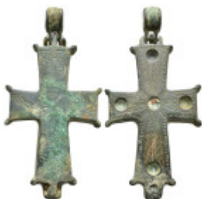
852 Byzantine Reliquary Cross Pendant. 92mm, 65.4 g