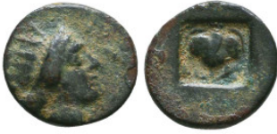
156 Greek Coins. 4th - 3rd century B.C. AE Reference: Condition: Very Fine Weight: 1.8 gr Diameter: 13.7 mm 1