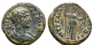
370 Roman Provincial Coins, Ae Reference: Condition: Very Fine Weight: 3 gr Diameter: 15.2 mm 1