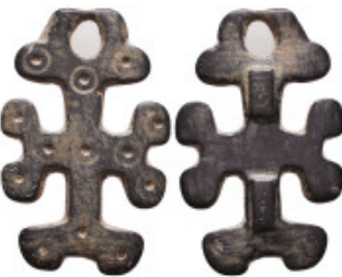
1023 Ancient Objects, Reference: Condition: Very Fine Weight: 13.7 gr Diameter: 40 mm 1