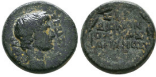
364 Roman Provincial Coins, Ae Reference: Condition: Very Fine Weight: 7.6 gr Diameter: 18.7 mm 1