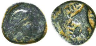
133 Greek Coins. 4th - 3rd century B.C. AE Reference: Condition: Very Fine Weight: 1.5 gr Diameter: 11.5 mm 1