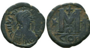
867 Byzantine Coins AE, 7th - 13th Centuries Reference: Condition: Very Fine Weight: 16 gr Diameter: 31 mm 1