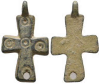
1024 Ancient Objects, Reference: Condition: Very Fine Weight: 4.8 gr Diameter: 35.2 mm 1