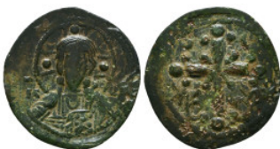
875 Byzantine Coins AE, 7th - 13th Centuries Reference: Condition: Very Fine Weight: 2.3 gr Diameter: 23.6 mm 1