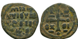
877 Byzantine Coins AE, 7th - 13th Centuries Reference: Condition: Very Fine Weight: 5.4 gr Diameter: 25.9 mm 1