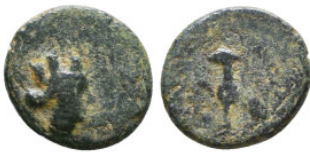
158 Greek Coins. 4th - 3rd century B.C. AE Reference: Condition: Very Fine Weight: 1.4 gr Diameter: 12.7 mm 1