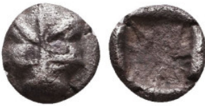
65 Greek Obol, Ca. 350-300 BC. AR. Reference: Condition: Very Fine Weight: 0.5 gr Diameter: 6.9 mm 1