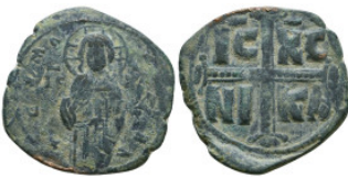
864 Byzantine Coins AE, 7th - 13th Centuries Reference: Condition: Very Fine Weight: 8.4 gr Diameter: 30.3 mm 1