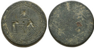
1138 Ancient Objects, Reference: Condition: Very Fine Weight: 27.2 gr Diameter: 24.8 mm 1