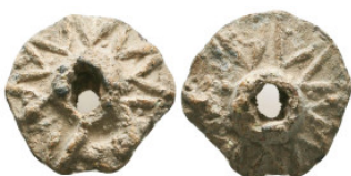
1158 Ancient Objects, Reference: Condition: Very Fine Weight: 8.8 gr Diameter: 19.5 mm 1