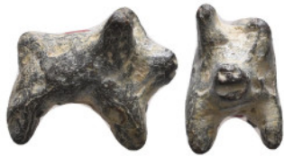
1207 Ancient Objects, Reference: Condition: Very Fine Weight: 10.9 gr Diameter: 17.8 mm 1