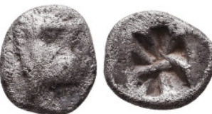
68 Greek Obol, Ca. 350-300 BC. AR. Reference: Condition: Very Fine Weight: 1.4 gr Diameter: 10.6 mm 1