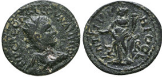
365 Roman Provincial Coins, Ae Reference: Condition: Very Fine Weight: 5.4 gr Diameter: 20.7 mm 1