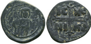
863 Byzantine Coins AE, 7th - 13th Centuries Reference: Condition: Very Fine Weight: 8.3 gr Diameter: 29.5 mm 1