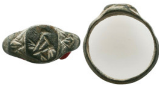
1099 Ancient Objects, Reference: Condition: Very Fine Weight: 4 gr Diameter: 22.6 mm 1