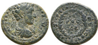
425 Roman Provincial Coins, Ae Reference: Condition: Very Fine Weight: 6.8 gr Diameter: 21 mm 1