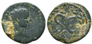
481 Roman Provincial Coins, Ae Reference: Condition: Very Fine Weight: 3.7 gr Diameter: 18 mm 1