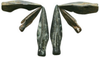
1062 Ancient Objects, Reference: Condition: Very Fine Weight: 5.3 gr Diameter: 34.5 mm 1