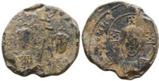
766 Byzantine Lead Seals, 7th - 13th Centuries Reference: Condition: Very Fine Weight: 16.9 gr Diameter: 30 mm 1