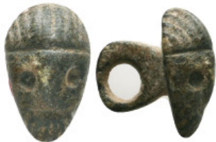
1163 Ancient Objects, Reference: Condition: Very Fine Weight: 4.4 gr Diameter: 14.7 mm 1