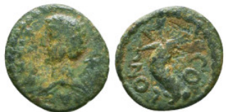
482 Roman Provincial Coins, Ae Reference: Condition: Very Fine Weight: 1.2 gr Diameter: 13.3 mm 1