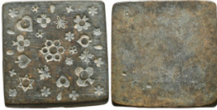
1139 Ancient Objects, Reference: Condition: Very Fine Weight: 65 gr Diameter: 33 mm 1