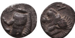
71 Greek Obol, Ca. 350-300 BC. AR. Reference: Condition: Very Fine Weight: 0.3 gr Diameter: 7.2 mm 1