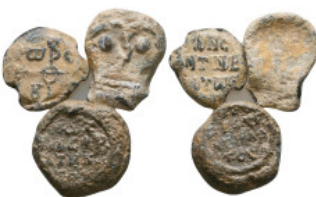
787 Byzantine Lead Seals, 7th - 13th Centuries Reference: Condition: Very Fine Weight: 38 gr Diameter: lot 1