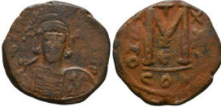
813 Byzantine Coins AE, 7th - 13th Centuries Reference: Condition: Very Fine Weight: 17.6 gr Diameter: 33.5 mm 1