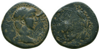
479 Roman Provincial Coins, Ae Reference: Condition: Very Fine Weight: 13.6 gr Diameter: 26 mm 1