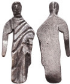
1014 Ancient Objects, Reference: Condition: Very Fine Weight: 2.4 gr Diameter: 28.5 mm 1