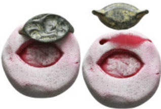
1105 Ancient Objects, Reference: Condition: Very Fine Weight: 12 gr Diameter: 22 mm 1