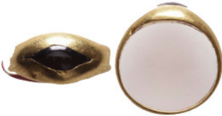
1021 Ancient Objects, Reference: Condition: Very Fine Weight: 2.4 gr Diameter: 17 mm 1