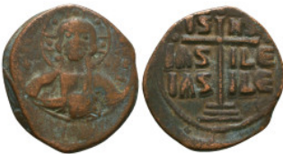
866 Byzantine Coins AE, 7th - 13th Centuries Reference: Condition: Very Fine Weight: 7.5 gr Diameter: 27.4 mm 1