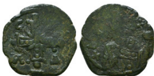
876 Byzantine Coins AE, 7th - 13th Centuries Reference: Condition: Very Fine Weight: 2.2 gr Diameter: 19.7 mm 1