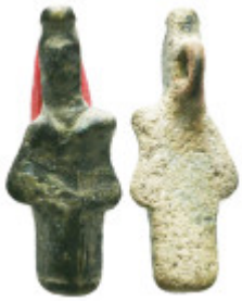
1108 Ancient Objects, Reference: Condition: Very Fine Weight: 2.6 gr Diameter: 23.2 mm 1