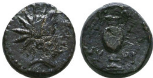
160 Greek Coins. 4th - 3rd century B.C. AE Reference: Condition: Very Fine Weight: 1.9 gr Diameter: 11.5 mm 1