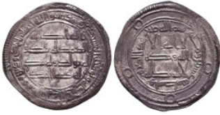
1011 Islamic Coins. Reference: Condition: Very Fine Weight: 2.9 gr Diameter: 27.6 mm 1