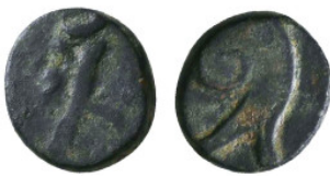
134 Greek Coins. 4th - 3rd century B.C. AE Reference: Condition: Very Fine Weight: 1 gr Diameter: 10 mm 1