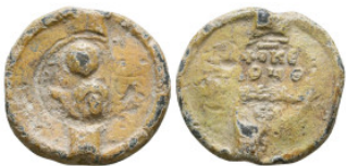
770 Byzantine Lead Seals, 7th - 13th Centuries Reference: Condition: Very Fine Weight: 7 gr Diameter: 21.3 mm 1