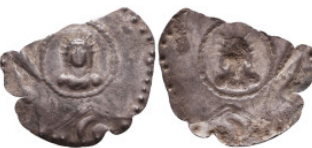
1022 Ancient Objects, Reference: Condition: Very Fine Weight: 1.3 gr Diameter: 37 mm 1