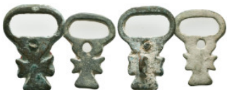
1069 Ancient Objects, Reference: Condition: Very Fine Weight: 11.6 gr Diameter: 30.5 mm 1