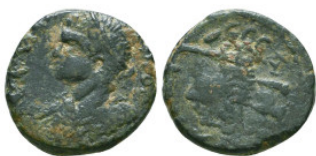
467 Roman Provincial Coins, Ae Reference: Condition: Very Fine Weight: 4 gr Diameter: 17.5 mm 1