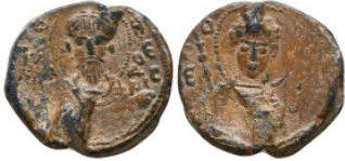
765 Byzantine Lead Seals, 7th - 13th Centuries Reference: Condition: Very Fine Weight: 7.7 gr Diameter: 22.7 mm 1