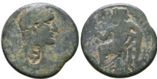
424 Roman Provincial Coins, Ae Reference: Condition: Very Fine Weight: 12.7 gr Diameter: 27.5 mm 1