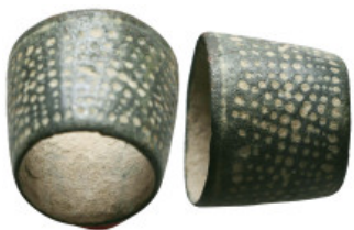
1067 Ancient Objects, Reference: Condition: Very Fine Weight: 11.9 gr Diameter: 18.4 mm 1