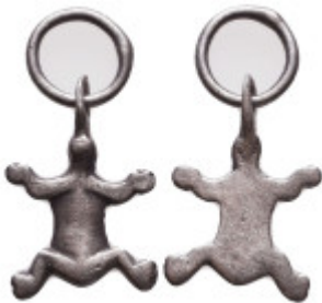
1013 Ancient Objects, Reference: Condition: Very Fine Weight: 2.5 gr Diameter: 28.5 mm 1