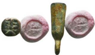
1106 Ancient Objects, Reference: Condition: Very Fine Weight: 8 gr Diameter: 23 mm 1