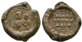
768 Byzantine Lead Seals, 7th - 13th Centuries Reference: Condition: Very Fine Weight: 5.6 gr Diameter: 18 mm 1