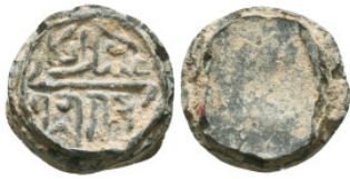
1160 Ancient Objects, Reference: Condition: Very Fine Weight: 7.2 gr Diameter: 16 mm 1