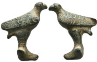
1104 Ancient Objects, Reference: Condition: Very Fine Weight: 19.1 gr Diameter: 31.3 mm 1