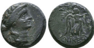
138 Greek Coins. 4th - 3rd century B.C. AE Reference: Condition: Very Fine Weight: 8.8 gr Diameter: 18 mm 1