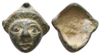
1148 Ancient Objects, Reference: Condition: Very Fine Weight: 5.6 gr Diameter: 19.2 mm 1