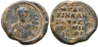
764 Byzantine Lead Seals, 7th - 13th Centuries Reference: Condition: Very Fine Weight: 17.5 gr Diameter: 27 mm 1