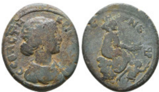
422 Roman Provincial Coins, Ae Reference: Condition: Very Fine Weight: 10.9 gr Diameter: 25.3 mm 1