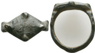
1098 Ancient Objects, Reference: Condition: Very Fine Weight: 7.8 gr Diameter: 26.7 mm 1