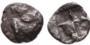
66 Greek Obol, Ca. 350-300 BC. AR. Reference: Condition: Very Fine Weight: 0.3 gr Diameter: 7.3 mm 1