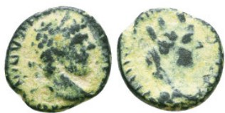
465 Roman Provincial Coins, Ae Reference: Condition: Very Fine Weight: 1.8 gr Diameter: 13.5 mm 1