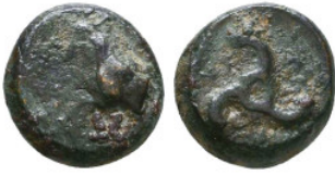
196 Greek Coins. 4th - 3rd century B.C. AE Reference: Condition: Very Fine Weight: 1.8 gr Diameter: 10.7 mm 1