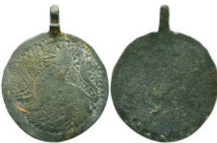
1155 Ancient Objects, Reference: Condition: Very Fine Weight: 14.5 gr Diameter: 52.1 mm 1