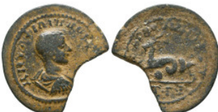
426 Roman Provincial Coins, Ae Reference: Condition: Very Fine Weight: 8.6 gr Diameter: 27.5 mm 1