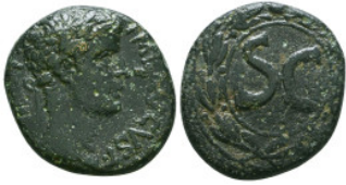
476 Roman Provincial Coins, Ae Reference: Condition: Very Fine Weight: 15 gr Diameter: 27.5 mm 1