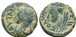
466 Roman Provincial Coins, Ae Reference: Condition: Very Fine Weight: 3.5 gr Diameter: 15.8 mm 1