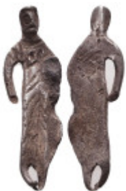
1015 Ancient Objects, Reference: Condition: Very Fine Weight: 2.5 gr Diameter: 32.1 mm 1