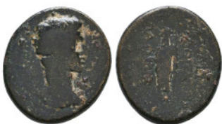
369 Roman Provincial Coins, Ae Reference: Condition: Very Fine Weight: 5.2 gr Diameter: 19.2 mm 1