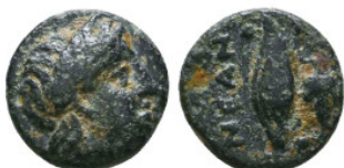
163 Greek Coins. 4th - 3rd century B.C. AE Reference: Condition: Very Fine Weight: 1.3 gr Diameter: 10.5 mm 1