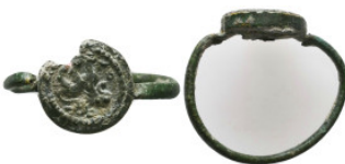
1165 Ancient Objects, Reference: Condition: Very Fine Weight: 4.6 gr Diameter: 24.3 mm 1