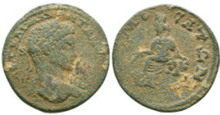
478 Roman Provincial Coins, Ae Reference: Condition: Very Fine Weight: 19.2 gr Diameter: 31.5 mm 1