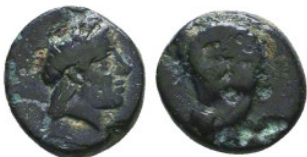
201 Greek Coins. 4th - 3rd century B.C. AE Reference: Condition: Very Fine Weight: 1 gr Diameter: 9.5 mm 1