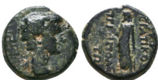
371 Roman Provincial Coins, Ae Reference: Condition: Very Fine Weight: 5.3 gr Diameter: 17.3 mm 1