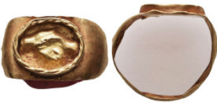
1020 Ancient Objects, Reference: Condition: Very Fine Weight: 1.5 gr Diameter: 17 mm 1