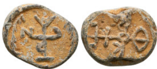
785 Byzantine Lead Seals, 7th - 13th Centuries Reference: Condition: Very Fine Weight: 7.7 gr Diameter: 20 mm 1