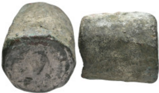
1026 Ancient Objects, Reference: Condition: Very Fine Weight: --- Diameter: 34 gr 1