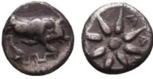
64 Greek Obol, Ca. 350-300 BC. AR. Reference: Condition: Very Fine Weight: 0.3 gr Diameter: 6.5 mm 1