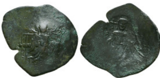
873 Byzantine Coins AE, 7th - 13th Centuries Reference: Condition: Very Fine Weight: 2.8 gr Diameter: 28 mm 1