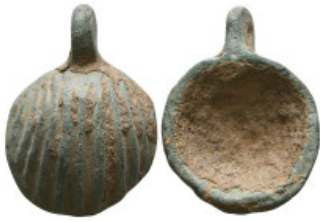
1145 Ancient Objects, Reference: Condition: Very Fine Weight: 20.5 gr Diameter: 36.7 mm 1