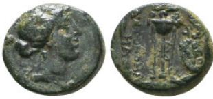
159 Greek Coins. 4th - 3rd century B.C. AE Reference: Condition: Very Fine Weight: 2.6 gr Diameter: 12.6 mm 1