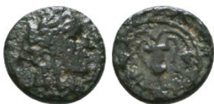
162 Greek Coins. 4th - 3rd century B.C. AE Reference: Condition: Very Fine Weight: 1.3 gr Diameter: 10.9 mm 1