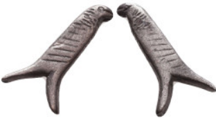
1019 Ancient Objects, Reference: Condition: Very Fine Weight: 2.2 gr Diameter: 19.8 mm 1