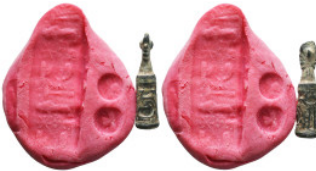
1154 Ancient Objects, Reference: Condition: Very Fine Weight: 7.6 gr Diameter: 33.4 mm 1