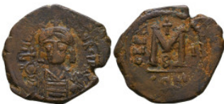
816 Byzantine Coins AE, 7th - 13th Centuries Reference: Condition: Very Fine Weight: 12 gr Diameter: 31.5 mm 1