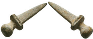
1109 Ancient Objects, Reference: Condition: Very Fine Weight: 5.4 gr Diameter: 30 mm 1