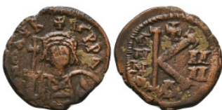
819 Byzantine Coins AE, 7th - 13th Centuries Reference: Condition: Very Fine Weight: 5.4 gr Diameter: 22.7 mm 1