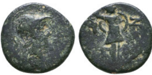
200 Greek Coins. 4th - 3rd century B.C. AE Reference: Condition: Very Fine Weight: 1.7 gr Diameter: 12.9 mm 1