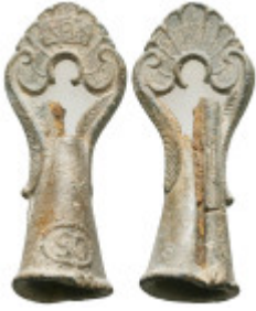
1159 Ancient Objects, Reference: Condition: Very Fine Weight: 9.6 gr Diameter: 40.5 mm 1