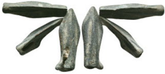
1063 Ancient Objects, Reference: Condition: Very Fine Weight: 9.4 gr Diameter: 31.5 mm 1