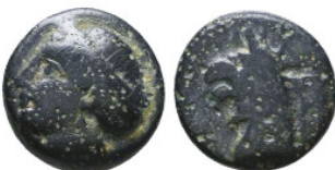
202 Greek Coins. 4th - 3rd century B.C. AE Reference: Condition: Very Fine Weight: 2.1 gr Diameter: 11.7 mm 1