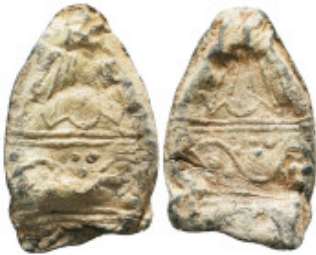
1153 Ancient Objects, Reference: Condition: Very Fine Weight: 10 gr Diameter: 34 mm 1