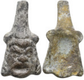
1206 Ancient Objects, Reference: Condition: Very Fine Weight: 41 gr Diameter: 61 m m 1