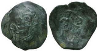
871 Byzantine Coins AE, 7th - 13th Centuries Reference: Condition: Very Fine Weight: 2.9 gr Diameter: 27.3 mm 1