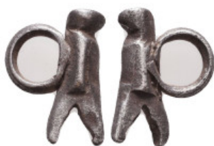
1016 Ancient Objects, Reference: Condition: Very Fine Weight: 1.9 gr Diameter: 15.8 mm 1