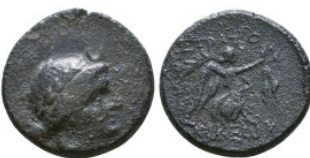
137 Greek Coins. 4th - 3rd century B.C. AE Reference: Condition: Very Fine Weight: 6.9 gr Diameter: 20 mm 1