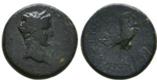
366 Roman Provincial Coins, Ae Reference: Condition: Very Fine Weight: 5.9 gr Diameter: 19.1 mm 1