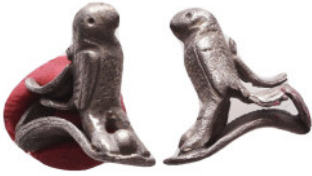
1017 Ancient Objects, Reference: Condition: Very Fine Weight: 2 gr Diameter: 13.5 mm 1