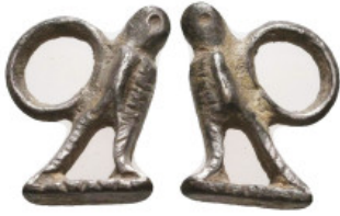
1152 Ancient Objects, Reference: Condition: Very Fine Weight: 1.4 gr Diameter: 12.8 mm 1