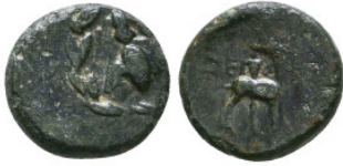
132 Greek Coins. 4th - 3rd century B.C. AE Reference: Condition: Very Fine Weight: 1.6 gr Diameter: 11 mm 1