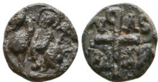
784 Byzantine Lead Seals, 7th - 13th Centuries Reference: Condition: Very Fine Weight: 3.6 gr Diameter: 15.7 mm 1