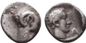
70 Greek Obol, Ca. 350-300 BC. AR. Reference: Condition: Very Fine Weight: 0.5 gr Diameter: 7.3 gr 1