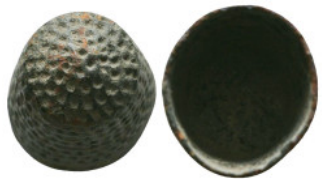
1065 Ancient Objects, Reference: Condition: Very Fine Weight: 2.7 gr Diameter: 16.4 mm 1