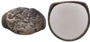
1208 Ancient Objects, Reference: Condition: Very Fine Weight: 3.1 gr Diameter: 18.9 mm 1