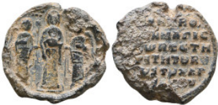
767 Byzantine Lead Seals, 7th - 13th Centuries Reference: Condition: Very Fine Weight: 24.2 gr Diameter: 33.3 mm 1