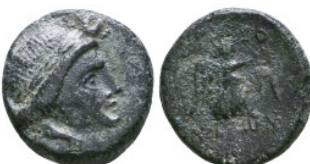
139 Greek Coins. 4th - 3rd century B.C. AE Reference: Condition: Very Fine Weight: 5.6 gr Diameter: 19 mm 1