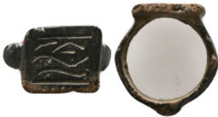
1141 Ancient Objects, Reference: Condition: Very Fine Weight: 4.8 gr Diameter: 20.2 mm 1