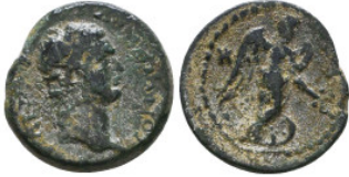
421 Roman Provincial Coins, Ae Reference: Condition: Very Fine Weight: 4.1 gr Diameter: 18.3 mm 1