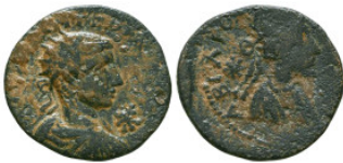
464 Roman Provincial Coins, Ae Reference: Condition: Very Fine Weight: 8.2 gr Diameter: 23.8 mm 1