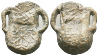
1156 Ancient Objects, Reference: Condition: Very Fine Weight: 11 gr Diameter: 27 mm 1