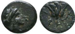
157 Greek Coins. 4th - 3rd century B.C. AE Reference: Condition: Very Fine Weight: 1.1 gr Diameter: 11 mm 1