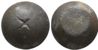
1209 Ancient Objects, Reference: Condition: Very Fine Weight: 89 gr Diameter: 28 m m 1