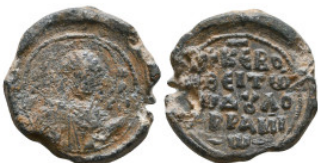
771 Byzantine Lead Seals, 7th - 13th Centuries Reference: Condition: Very Fine Weight: 20.4 gr Diameter: 27.9 mm 1