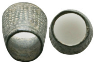
1066 Ancient Objects, Reference: Condition: Very Fine Weight: 12.2 gr Diameter: 20.7 mm 1