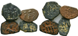
874 Byzantine Coins AE, 7th - 13th Centuries Reference: Condition: Very Fine Weight: 20.6 gr Diameter: 24.5 mm lot 1