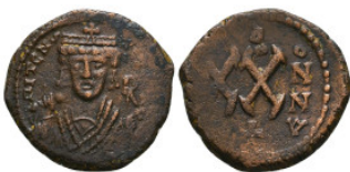
817 Byzantine Coins AE, 7th - 13th Centuries Reference: Condition: Very Fine Weight: 7.8 gr Diameter: 25.8 mm 1