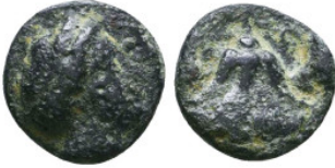
197 Greek Coins. 4th - 3rd century B.C. AE Reference: Condition: Very Fine Weight: 1.3 gr Diameter: 11.3 mm 1