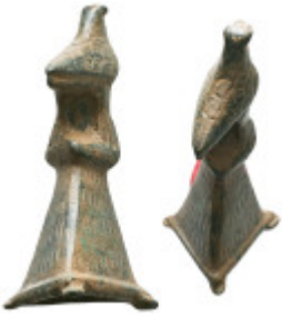
1102 Ancient Objects, Reference: Condition: Very Fine Weight: 45.4 gr Diameter: 58 mm 1