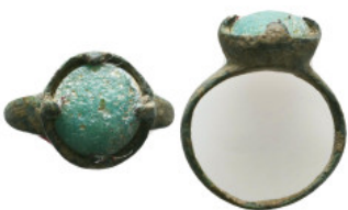
1114 Ancient Objects, Reference: Condition: Very Fine Weight: 3.2 gr Diameter: 22.1 mm 1