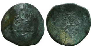
869 Byzantine Coins AE, 7th - 13th Centuries Reference: Condition: Very Fine Weight: 3.4 gr Diameter: 24.5 mm 1