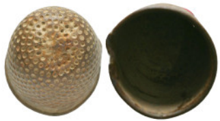
1064 Ancient Objects, Reference: Condition: Very Fine Weight: 3.1 gr Diameter: 20.3 mm 1