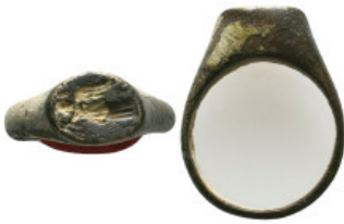
1097 Ancient Objects, Reference: Condition: Very Fine Weight: 6.5 gr Diameter: 26.3 mm 1