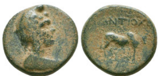
483 Roman Provincial Coins, Ae Reference: Condition: Very Fine Weight: 4.8 gr Diameter: 18 mm 1