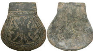
1100 Ancient Objects, Reference: Condition: Very Fine Weight: 21.7 gr Diameter: 54.3 mm 1