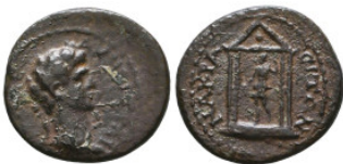
367 Roman Provincial Coins, Ae Reference: Condition: Very Fine Weight: 4.2 gr Diameter: 20.7 mm 1