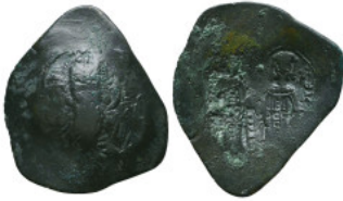
870 Byzantine Coins AE, 7th - 13th Centuries Reference: Condition: Very Fine Weight: 2.8 gr Diameter: 28 mm 1