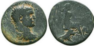
461 Roman Provincial Coins, Ae Reference: Condition: Very Fine Weight: 12.6 gr Diameter: 27 mm 1