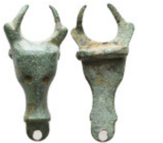
1149 Ancient Objects, Reference: Condition: Very Fine Weight: 5.2 gr Diameter: 29.7 mm 1