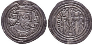
1012 Islamic Coins. Reference: Condition: Very Fine Weight: 2 gr Diameter: 24.3 mm 1