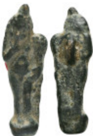
1107 Ancient Objects, Reference: Condition: Very Fine Weight: 7.8 gr Diameter: 34.6 mm 1