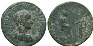
463 Roman Provincial Coins, Ae Reference: Condition: Very Fine Weight: 18 gr Diameter: 31 mm 1