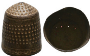
1144 Ancient Objects, Reference: Condition: Very Fine Weight: 3.3 gr Diameter: 20.5 mm 1