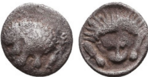
67 Greek Obol, Ca. 350-300 BC. AR. Reference: Condition: Very Fine Weight: 0.5 gr Diameter: 8.5 mm 1