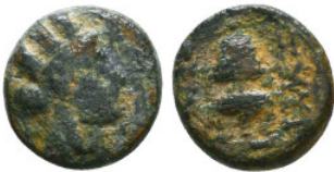
199 Greek Coins. 4th - 3rd century B.C. AE Reference: Condition: Very Fine Weight: 1.5 gr Diameter: 11 mm 1