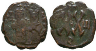
862 Byzantine Coins AE, 7th - 13th Centuries Reference: Condition: Very Fine Weight: 4.3 Diameter: 20 mm 1