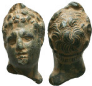
1103 Ancient Objects, Reference: Condition: Very Fine Weight: 12.3 gr Diameter: 23.7 mm 1