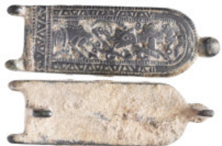
1028 Ancient Objects, Reference: Condition: Very Fine Weight: 18.2 gr Diameter: 53.4 mm 1