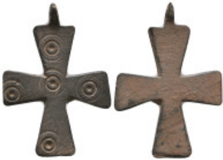
1025 Ancient Objects, Reference: Condition: Very Fine Weight: 2.2 gr Diameter: 33.2 mm 1