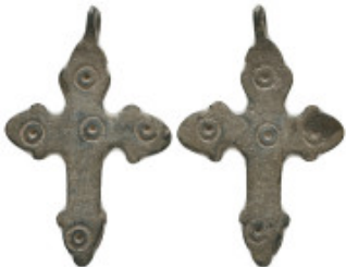
1027 Ancient Objects, Reference: Condition: Very Fine Weight: 6 gr Diameter: 40 mm 1