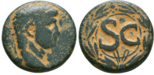
477 Roman Provincial Coins, Ae Reference: Condition: Very Fine Weight: 15.2 gr Diameter: 25.2 mm 1