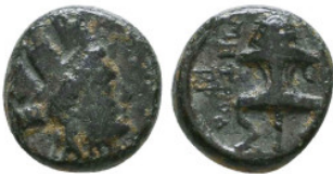
198 Greek Coins. 4th - 3rd century B.C. AE Reference: Condition: Very Fine Weight: 2 gr Diameter: 11.1 mm 1