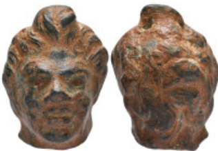
1143 Ancient Objects, Reference: Condition: Very Fine Weight: 108 gr Diameter: 36.8 mm 1