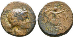
136 Greek Coins. 4th - 3rd century B.C. AE Reference: Condition: Very Fine Weight: 7 gr Diameter: 20 mm 1