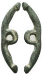
1110 Ancient Objects, Reference: Condition: Very Fine Weight: 3.4 gr Diameter: 34.2 mm 1