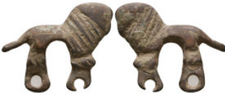
1142 Ancient Objects, Reference: Condition: Very Fine Weight: 12.6 gr Diameter: 38.5 mm 1