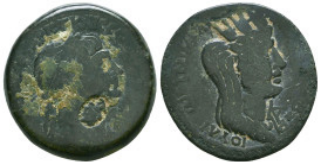
480 Roman Provincial Coins, Ae Reference: Condition: Very Fine Weight: 12 gr Diameter: 25.5 mm 1