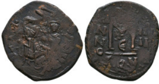
812 Byzantine Coins AE, 7th - 13th Centuries Reference: Condition: Very Fine Weight: 8.5 gr Diameter: 27.8 mm 1