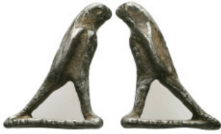
1095 Ancient Objects, Reference: Condition: Very Fine Weight: 4.7 gr Diameter: 21.3 mm 1