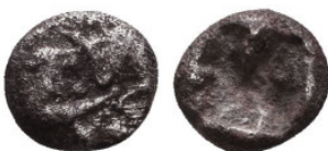
69 Greek Obol, Ca. 350-300 BC. AR. Reference: Condition: Very Fine Weight: 0.3 gr Diameter: 6.3 mm 1