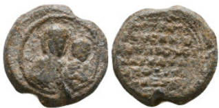
769 Byzantine Lead Seals, 7th - 13th Centuries Reference: Condition: Very Fine Weight: 8 gr Diameter: 19.5 mm 1