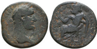
423 Roman Provincial Coins, Ae Reference: Condition: Very Fine Weight: 11 gr Diameter: 27.5 mm 1