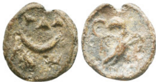
1161 Ancient Objects, Reference: Condition: Very Fine Weight: 2.4 gr Diameter: 16.2 mm 1