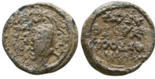
780 Byzantine Lead Seals, 7th - 13th Centuries Reference: Condition: Very Fine Weight: 6.8 gr Diameter: 20.5 mm 1