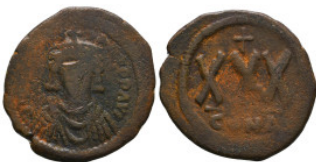
818 Byzantine Coins AE, 7th - 13th Centuries Reference: Condition: Very Fine Weight: 10.8 gr Diameter: 31.2 mm 1