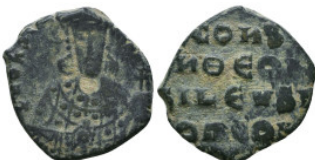
868 Byzantine Coins AE, 7th - 13th Centuries Reference: Condition: Very Fine Weight: 5.6 gr Diameter: 24.3 mm 1