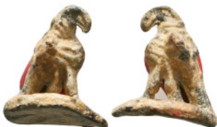
1157 Ancient Objects, Reference: Condition: Very Fine Weight: 9.5 gr Diameter: 21.2 mm 1