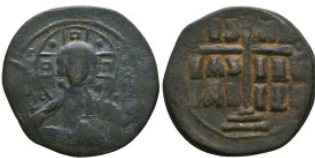
865 Byzantine Coins AE, 7th - 13th Centuries Reference: Condition: Very Fine Weight: 10.7 gr Diameter: 32.8 mm 1