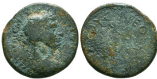
462 Roman Provincial Coins, Ae Reference: Condition: Very Fine Weight: 14.7 gr Diameter: 29 mm 1