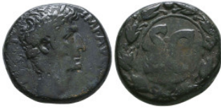
460 Roman Provincial Coins, Ae Reference: Condition: Very Fine Weight: 19.6 gr Diameter: 26 mm 1