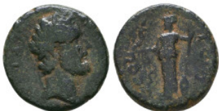
368 Roman Provincial Coins, Ae Reference: Condition: Very Fine Weight: 3.8 gr Diameter: 16.7 mm 1