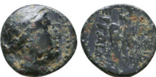
203 Greek Coins. 4th - 3rd century B.C. AE Reference: Condition: Very Fine Weight: 3 gr Diameter: 16 mm 1