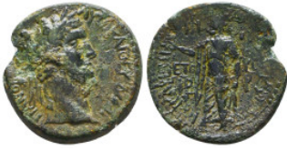
420 Roman Provincial Coins, Ae Reference: Condition: Very Fine Weight: 6 gr Diameter: 21.4 mm 1