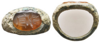
1146 Ancient Objects, Reference: Condition: Very Fine Weight: 9.7 gr Diameter: 22.8 mm 1