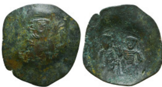
872 Byzantine Coins AE, 7th - 13th Centuries Reference: Condition: Very Fine Weight: 2.4 gr Diameter: 26.7 mm 1