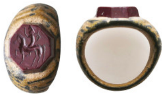
1147 Ancient Objects, Reference: Condition: Very Fine Weight: 13 gr Diameter: 26.7 mm 1