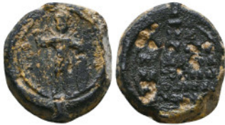
781 Byzantine Lead Seals, 7th - 13th Centuries Reference: Condition: Very Fine Weight: 10.6 gr Diameter: 20 mm 1