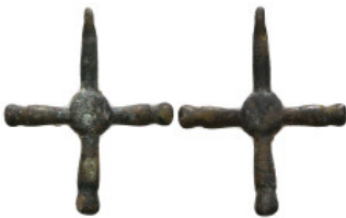
1140 Ancient Objects, Reference: Condition: Very Fine Weight: 2.9 gr Diameter: 29.7 mm 1