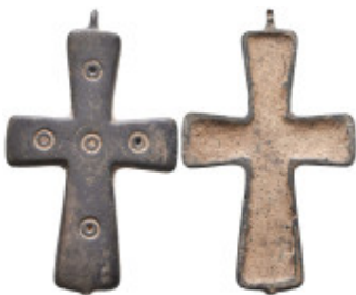
1150 Ancient Objects, Reference: Condition: Very Fine Weight: 23.5 gr Diameter: 69.1 mm 1