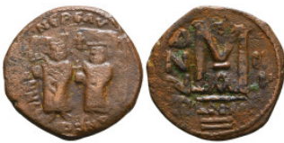
814 Byzantine Coins AE, 7th - 13th Centuries Reference: Condition: Very Fine Weight: 10 gr Diameter: 27.9 mm 1