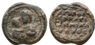
783 Byzantine Lead Seals, 7th - 13th Centuries Reference: Condition: Very Fine Weight: 4.8 gr Diameter: 15.5 mm 1