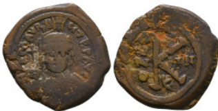
815 Byzantine Coins AE, 7th - 13th Centuries Reference: Condition: Very Fine Weight: 6.7 gr Diameter: 24 mm 1