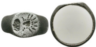
1112 Ancient Objects, Reference: Condition: Very Fine Weight: 3.1 gr Diameter: 17 mm 1