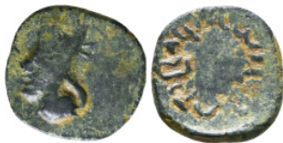
135 Greek Coins. 4th - 3rd century B.C. AE Reference: Condition: Very Fine Weight: 1.2 gr Diameter: 12.3 mm 1