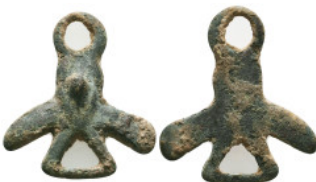
1101 Ancient Objects, Reference: Condition: Very Fine Weight: 8.4 gr Diameter: 34 mm 1