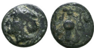
161 Greek Coins. 4th - 3rd century B.C. AE Reference: Condition: Very Fine Weight: 1.4 gr Diameter: 11.2 mm 1