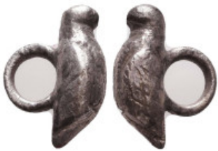
1018 Ancient Objects, Reference: Condition: Very Fine Weight: 2.1 gr Diameter: 14.7 mm 1