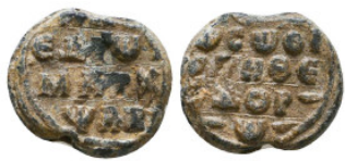
782 Byzantine Lead Seals, 7th - 13th Centuries Reference: Condition: Very Fine Weight: 2 gr Diameter: 13.2 mm 1