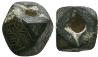
1162 Ancient Objects, Reference: Condition: Very Fine Weight: 8.5 mm Diameter: 10.7 mm 1