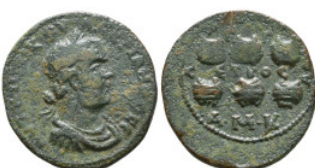
427 Roman Provincial Coins, Ae Reference: Condition: Very Fine Weight: 15.3 gr Diameter: 28.4 mm 1