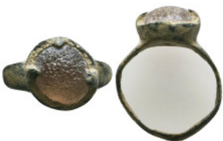
1113 Ancient Objects, Reference: Condition: Very Fine Weight: 3.4 gr Diameter: 23.9 mm 1