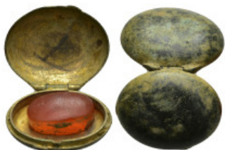
529 Gem stone and lid box (23mm, 5.8 g)