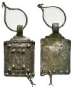
525 Silver earring? (42mm, 6.5 g)