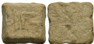
528 Lead weight 29mm, 55.7 g