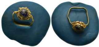
523 Golden ring (7mm, 2.1 g)