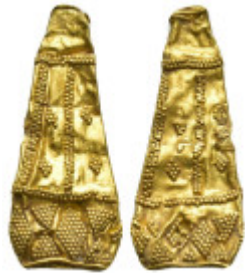
524 Gold pendant (24mm, 1.2 g)