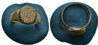
527 Engraved Ring (25mm, 7 g)