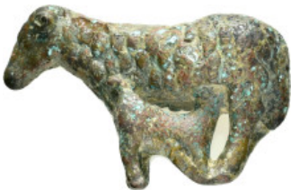
650 ANCIENT ROMAN BRONZE SHEEP STATUETTE.(1st-2nd century).Ae. Weight : 92.3 gr Diameter : 56 mm 10