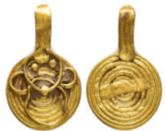
781 ROMAN GOLD PENDANT.(Circa 3th century).Ae. Weight : gr Diameter : mm 10