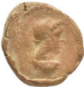
752 ANCIENT ROMAN TERRACOTTA THEATER TICKET. Weight : 2.9 gr Diameter : 22mm 10