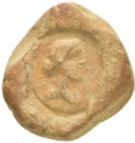
749 ANCIENT ROMAN TERRACOTTA THEATER TICKET. Weight : 2.3 gr Diameter : 19 mm 10