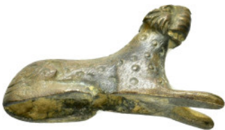
651 ANCIENT ROMAN BRONZE PANTHER STATUETTE.(1st-2nd century).Ae. Weight : 38.9 gr Diameter : 51 mm 10