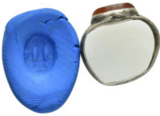
761 ANCIENT ROMAN BRONZE RING with INTAGLIO.(3rd–4th centuries).Ae. Weight : 7.5 gr Diameter : 23 mm 10