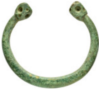
668 ANCIENT GREEK BRONZE BRACELET.(3RD-1ST CENTURY).Ae. Weight : 42.8 gr Diameter : 65 mm 10