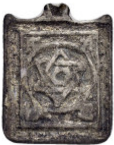
719 JEWISH PENDANT. Weight : 1.8 gr Diameter : 20 mm 10