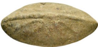
699 ANCIENT GREEK SLING BULLET.(4th–3rd centuries BC).Pb. Weight : 45.8 gr Diameter : 39 mm 10