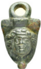
667 ANCIENT ROMAN BRONZE APPLIQUE.(1ST-3RD CENTURY).Ae. Weight : 62.1 gr Diameter : 58 mm 10