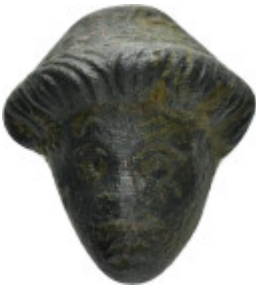
768 ANCIENT ROMAN BRONZE MASK. Weight : 22.03 gr Diameter : 36 mm 10