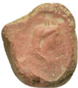
742 ANCIENT ROMAN TERRACOTTA THEATER TICKET. Weight : 1.5gr Diameter : 16 mm 10