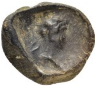
746 ANCIENT ROMAN TERRACOTTA THEATER TICKET. Weight : 1.8 gr Diameter : 21 mm 10