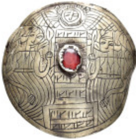
706 ANCIENT ISLAMIC SILVER APLIQUE. Weight : 15.7 gr Diameter : 72 mm 10