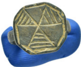
764 ANCIENT BYZANTINE BRONZE RING.(10th-11th century).Ae. Weight : 16.8 gr Diameter : 32 mm 10