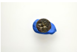
732 ANCIENT ROMAN BRONZE STAMP SEAL.(1st-2nd century).Ae. Weight : 8.5 gr Diameter : 23 mm 10