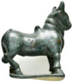
647 ANCIENT ROMAN BRONZE BULL STATUE. (1ST-5TH CENTUR).Ae. Weight : 86.5 gr Diameter : 45 mm 10