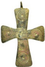
725 BYZANTINE EMPIRE.Cross.(8th-10th century).Ae. Weight : 37.3 gr Diameter : 84 mm 10