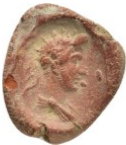
748 ANCIENT ROMAN TERRACOTTA THEATER TICKET. Weight : 1.8 gr Diameter : 16 mm 10