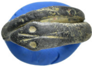
762 ANCIENT ROMAN BRONZE RING.(3rd–4th centuries).Ae. Weight : 6.8 gr Diameter : 23mm 10