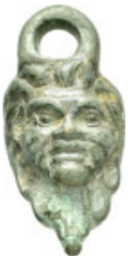
666 ANCIENT ROMAN BRONZE APPLIQUE.(1ST-3RD CENTURY).Ae. Weight : 115.9 gr Diameter : 80 mm 10