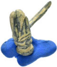
686 ANCIENT ROMAN BRONZE APLIQUE Weight : 4.1 gr Diameter : 21 mm 10