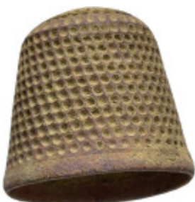
721 ANCIENT ROMAN BRONZE THIMBLE.(Circa 1st - 2nd Century).Ae. Weight : 3.4 gr Diameter : 18 mm 10