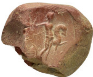
743 ANCIENT ROMAN TERRACOTTA THEATER TICKET. Weight : 1.6 gr Diameter : 17 mm 10