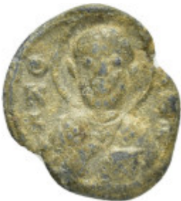
774 BYZANTINE LEAD SEAL.(Circa 11 th Century).Pb. Weight : 5.02 gr Diameter :28 mm 10