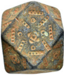
695 BYZANTINE BRONZE WEIGHT.(Circa 6th-9th century).Ae. Weight : 151.9 gr Diameter : 37 mm 10