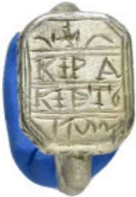
763 ANCIENT BYZANTINE SILVER RING.(10th-11th century).Ae. Weight : 6.08 gr Diameter : 20 mm 10