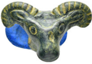
658 ANCIENT ROMAN BRONZE RAM HEAD.(1st-2nd century).Ae. Weight : 14.6 gr Diameter : 28 mm 10