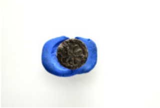
734 ANCIENT ROMAN BRONZE STAMP SEAL.(1st-2nd century).Ae. Weight : 25.5 gr Diameter : 40 mm 10