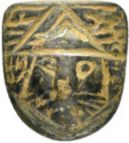
701 Weight : 4.4 gr Diameter : 16 mm