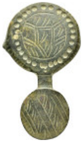
683 ANCIENT ROMAN BRONZE APLIQUE Weight : 12.9 gr Diameter : 51 mm 10