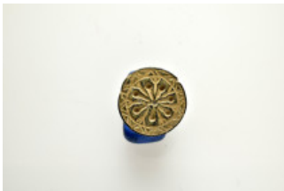
730 ANCIENT ROMAN BRONZE STAMP SEAL.(1st-2nd century).Ae. Weight : 7.5 gr Diameter :23 mm 10