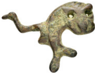
669 ANCIENT ROMAN BRONZE LION.(1st-2nd century).Ae. Weight : 16.3 gr Diameter : 48 mm 10