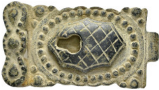
675 ROMAN BRONZE MILITARY BUCKLE.(1st-2nd century).Ae. Weight : 24.6 gr Diameter : 57 mm 10