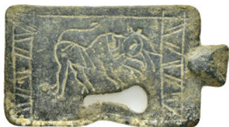
672 ROMAN BRONZE MILITARY BUCKLE.(1st-2nd century).Ae. Weight : 27.2 gr Diameter : 58 mm 10