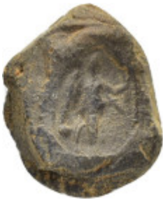
745 ANCIENT ROMAN TERRACOTTA THEATER TICKET. Weight : 2.0 gr Diameter : 15 mm 10