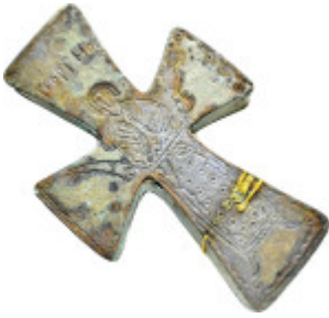
722 BYZANTINE EMPIRE.Cross.(8th-10th century).Ae. Weight : 183.3 gr Diameter : 124 mm 10