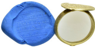
778 ANCIENT ISLAMIC BRONZE RING. Weight : gr Diameter : mm 10