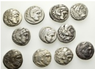
786 ANCIENT BRONZE COINS.SOLD AS SEEN.NO RETURN. 10