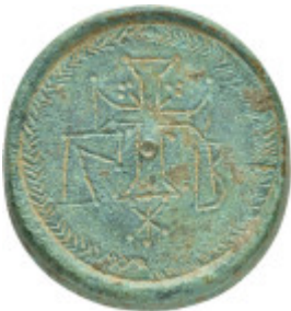
770 ANCIENT BYZANTINE BRONZE WEIGHT.(Circa 6th-9th century).Ae. Weight : 14.7 gr Diameter : 41mm 10