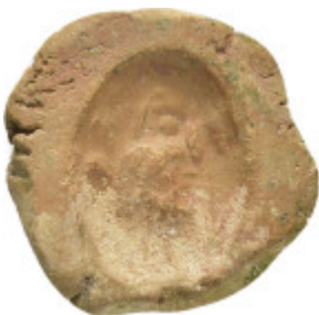
753 ANCIENT ROMAN TERRACOTTA THEATER TICKET. Weight : 1.8 gr Diameter : 20mm 10