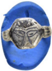
755 ANCIENT ROMAN SILVER RING.(3rd-4th century).Gold. Weight : 5.6 gr Diameter : 20 mm 10