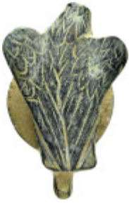
663 ANCIENT ROMAN BRONZE EAGLE STATUETTE.(1st-2nd century).Ae. Weight : 49.3 gr Diameter : 42 mm 10