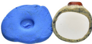
757 ANCIENT ROMAN BRONZE RING with INTAGLIO.(3rd–4th centuries).Ae. Weight : 3.9 gr Diameter : 19 mm 10