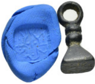
777 ANCIENT ROMAN BRONZE STAMP SEAL.(1st-2nd century).Ae. Weight : 5.5 gr Diameter : 18 mm 10