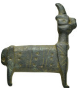
771 ANCIENT ISLAMIC BRONZE LOCK.(11th-12th century).Ae. Weight : 4.6 gr Diameter : 23 mm 10