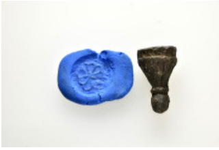
733 ANCIENT ROMAN BRONZE STAMP SEAL.(1st-2nd century).Ae. Weight : 13.2 gr Diameter : 24 mm 10