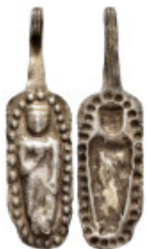
782 ROMAN SILVER PENDANT.(Circa 3th century).Ae. Weight : gr Diameter : mm 10