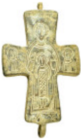
723 BYZANTINE EMPIRE.Cross.(8th-10th century).Ae. Weight : 32.5 gr Diameter : 87 mm 10