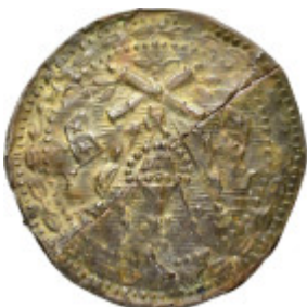
694 ANCIENT ROMAN BRONZE APPLIQUE. Weight : 4.4 gr Diameter : 54 mm 10