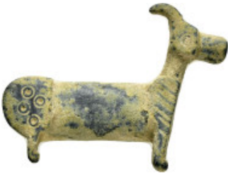
660 ANCIENT ISLAMIC BRONZE LOCK.(11th-12th century).Ae. Weight : 7.9 gr Diameter : 38 mm 10