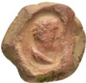
747 ANCIENT ROMAN TERRACOTTA THEATER TICKET. Weight : 1.6 gr Diameter : 20 mm 10