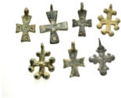
729 BYZANTINE EMPIRE.Cross.(8th-10th century).Ae. Weight : gr Diameter : mm 10