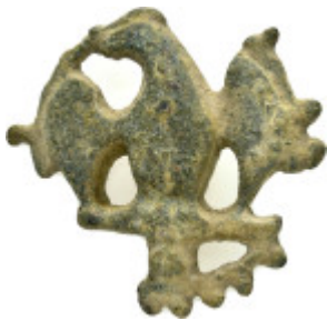
681 BYZANTINE EMPIRE.BREAD STAMP.(8th-10th century).Ae. Weight : 14.9 gr Diameter : 38 mm 10