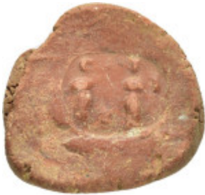
751 ANCIENT ROMAN TERRACOTTA THEATER TICKET. Weight : 1.6 gr Diameter : 17 mm 10