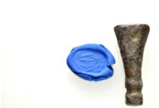
735 ANCIENT ROMAN BRONZE STAMP SEAL.(1st-2nd century).Ae. Weight : 2.8 gr Diameter : 14 mm 10