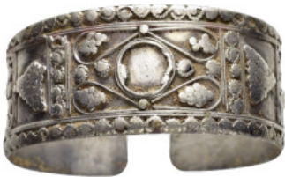
707 ANCIENT SILVER BRACELET. Weight : 37.08 gr Diameter : 52 mm 10