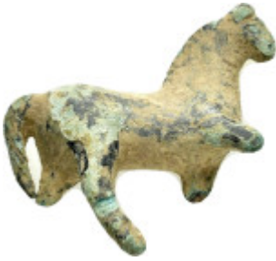
653 ANCIENT ROMAN BRONZE HORSE STATUETTE.(1st-2nd century).Ae. Weight : 24.4 gr Diameter : 39 mm 10