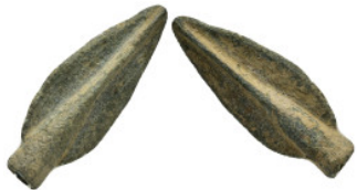
780 ANCIENT ROMAN BRONZE ARROW HEADS.(Circa 2th Century).Ae. Weight : gr Diameter : mm 10