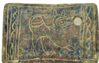
673 ROMAN BRONZE MILITARY BUCKLE.(1st-2nd century).Ae. Weight : 18.3 gr Diameter : 50 mm 10