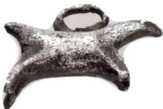
720 ANCIENT ROMAN SILVER HORSE STATUETTE.(1st-2nd century).Ae. Weight : 1.09 gr Diameter : 14 mm 10