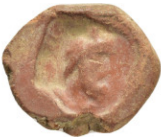
740 ANCIENT ROMAN TERRACOTTA THEATER TICKET. Weight : 2.19 gr Diameter : 22 mm 10