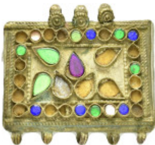
693 ANCIENT ROMAN BRONZE APPLIQUE. Weight : 30.3 gr Diameter : 66 mm 10