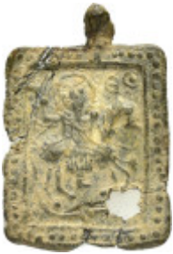
703 ANCIENT BYZANTINE LEAD AMULET.(5th-6th Century).Ae. Weight : 2.8 gr Diameter : 28 mm