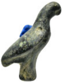
655 ANCIENT ROMAN BRONZE EAGLE STATUETTE.(1st-2nd century).Ae. Weight : 29.2 gr Diameter : 39 mm 10