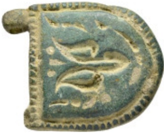
674 ROMAN BRONZE MILITARY BUCKLE.(1st-2nd century).Ae. Weight : 21.2 gr Diameter : 34 mm 10