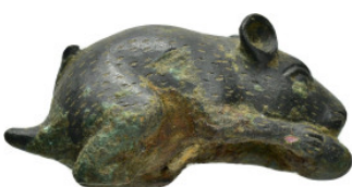
766 ANCIENT BRONZE MOUSE.(1th-3th century).Ae. Weight : 16.7 gr Diameter : 44 mm 10