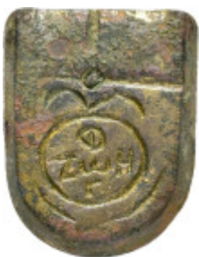
679 ROMAN BRONZE MILITARY BUCKLE.(1st-2nd century).Ae. Weight : 7.05 gr Diameter : 23 mm 10