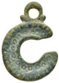
680 ANCIENT ROMAN BRONZE APPLIQUE. Weight : 7.4 gr Diameter : 39 mm 10