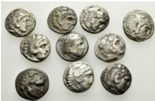
785 ANCIENT BRONZE COINS.SOLD AS SEEN.NO RETURN. 10