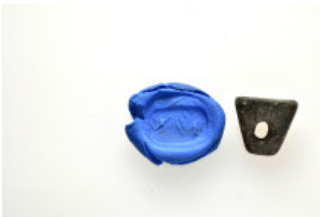
736 STONE SEAL.(2nd millennium-1st millennium BC). Weight : gr Diameter : mm 10