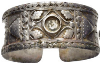
708 ANCIENT SILVER BRACELET. Weight : 40.4 gr Diameter : 54 mm 10