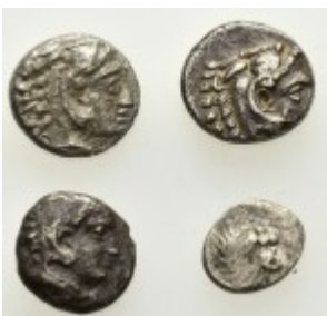
788 ANCIENT BRONZE COINS.SOLD AS SEEN.NO RETURN. 10