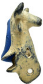
726 ANCIENT ROMAN BRONZE APLIQUE.(1st-2nd century).Ae. Weight : 19.8 gr Diameter : 35 mm 10