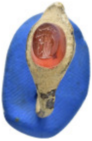
754 ANCIENT ROMAN BRONZE RING with INTAGLIO.(3rd–4th centuries).Ae. Weight : 3.2 gr Diameter : 18mm 10