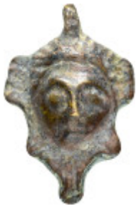
670 ANCIENT ROMAN BRONZE APPLIQUE.(1ST-3RD CENTURY).Ae. Weight : 8.5 gr Diameter : 31 mm 10