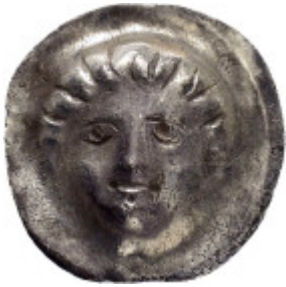
717 ANCIENT GREEK SILVER APPLIQUE.(1st-2nd century).Ae. Weight : 1.2 gr Diameter : 20 mm 10