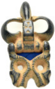
702 ROMAN BRONZE MILITARY BUCKLE.(1st-2nd century).Ae. Weight : 8.1 gr Diameter : 34 mm