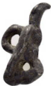
716 ANCIENT ROMAN SILVER EAGLE STATUETTE.(1st-2nd century).Ae. Weight : 4.3 gr Diameter : 23 mm 10