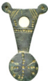
684 ANCIENT ROMAN BRONZE APLIQUE Weight : 5.1 gr Diameter : 36 mm 10