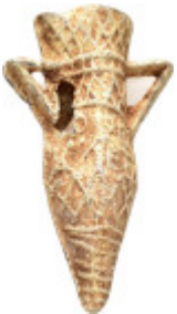
705 ANCIENT ROMAN LEAD AMPULLA. Weight : 29.8 gr Diameter : 54 mm