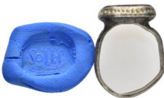
758 ANCIENT ROMAN BRONZE RING with INTAGLIO.(3rd–4th centuries).Ae. Weight : 4.2 gr Diameter : 21 mm 10