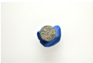
731 ANCIENT ROMAN BRONZE STAMP SEAL.(1st-2nd century).Ae. Weight : 2.8 gr Diameter : 12 mm 10