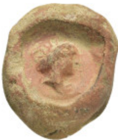
741 ANCIENT ROMAN TERRACOTTA THEATER TICKET. Weight : 2.7 gr Diameter : 22 mm 10