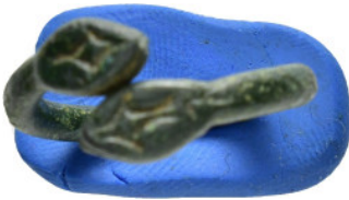
772 ANCIENT GREEK BRONZE RING.(1st-2nd century BC).Ae. Weight : 13.8 gr Diameter : 26 mm 10