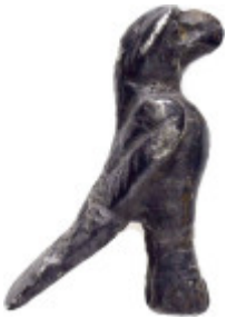
718 ANCIENT ROMAN SILVER EAGLE STATUETTE.(1st-2nd century).Ae. Weight : 4.1 gr Diameter : 18 mm 10