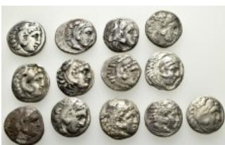
787 ANCIENT BRONZE COINS.SOLD AS SEEN.NO RETURN. 10