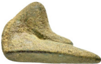
665 ANCIENT ROMAN BRONZE DUCK.(1st-2nd century).Ae. Weight : 21.4 gr Diameter : 33 mm 10