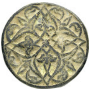
678 ANCIENT ROMAN BRONZE APPLIQUE. Weight : 16.2 gr Diameter : 34 mm 10