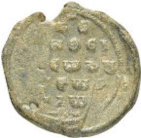
773 BYZANTINE LEAD SEAL.(Circa 11 th Century).Pb. Weight : 4.13 gr Diameter : 16 mm 10