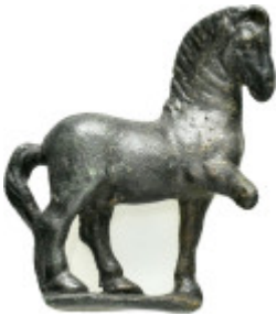
648 ANCIENT ROMAN BRONZE HORSE STATUETTE.(1st-2nd century).Ae. Weight : 68.4 gr Diameter : 50 mm 10