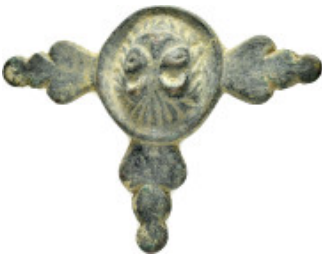
688 ANCIENT ROMAN BRONZE APLIQUE. Weight : 28.6 gr Diameter : 68 mm 10