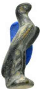
657 ANCIENT ROMAN BRONZE EAGLE STATUETTE.(1st-2nd century).Ae. Weight : 17.04 gr Diameter : 35 mm 10