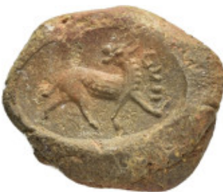
737 ANCIENT ROMAN TERRACOTTA THEATER TICKET. Weight :3.06 gr Diameter : 23 mm 10