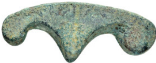
677 GREEK-ROMAN PERIOD WEIGHT. Weight : 15.9 gr Diameter : 43 mm 10