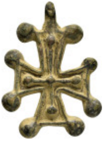
727 BYZANTINE EMPIRE.Cross.(8th-10th century).Ae. Weight : 12.7 gr Diameter : 47 mm 10