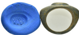
760 ANCIENT ROMAN BRONZE RING.(3rd–4th centuries).Ae. Weight : 2.3 gr Diameter :19 mm 10