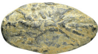
698 ANCIENT GREEK SLING BULLET.(4th–3rd centuries BC).Pb. Weight : 41.5 gr Diameter : 35 mm 10