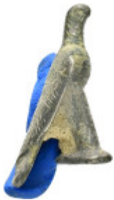
671 ANCIENT ROMAN SILVER EAGLE STATUETTE.(1st-2nd century).Ae. Weight : 8.9 gr Diameter : 30 mm 45