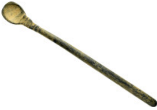
690 ANCIENT ROMAN BRONZE MEDICAL TOOL.(1st-2nd century).Ae. Weight : 11.5 gr Diameter : 102 mm 10