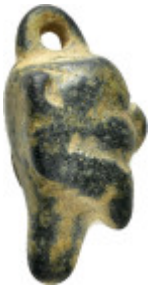
664 ANCIENT ROMAN BRONZE PLUMB.(1st-2nd century).Ae. Weight : 25.2 gr Diameter : 33 mm 10