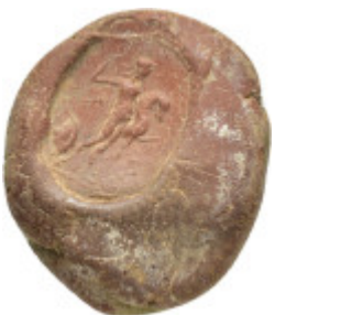
738 ANCIENT ROMAN TERRACOTTA THEATER TICKET. Weight : 3.3 gr Diameter : 20 mm 10