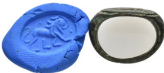
759 ANCIENT ROMAN BRONZE RING.(3rd–4th centuries).Ae. Weight : 7.04 gr Diameter :24 mm 10