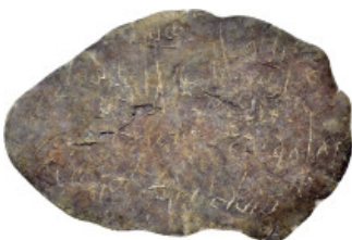
710 ANCIENT BRONZE APLIQUE. Weight : 18.5 gr Diameter : 74 mm 10