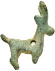
659 ANCIENT ROMAN BRONZE GAZELLE STATUETTE.(1st-2nd century).Ae. Weight : 10.1 gr Diameter : 28 mm 10