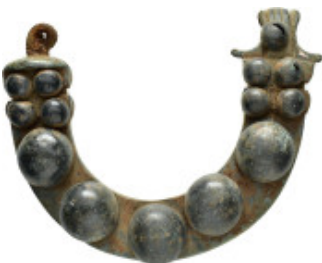
689 GREEK BRONZE FIBULA.(8th-6th Century BC).Ae. Weight : 82.4 gr Diameter : 76 mm 10