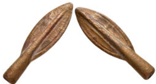
779 ANCIENT ROMAN BRONZE ARROW HEADS.(Circa 2th Century).Ae. Weight : gr Diameter : mm 10