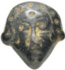
697 ANCIENT ROMAN BRONZE MASK. Weight : 9.5 gr Diameter : 23 mm 10