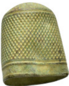
700 ANCIENT ROMAN BRONZE THIMBLE.(Circa 1st - 2nd Century).Ae. Weight : 4.9 gr Diameter : 22 mm 10