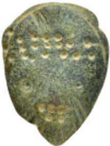
676 ROMAN BRONZE MASK.(1st-2nd century).Ae. Weight : 13.02 gr Diameter : 32 mm 10