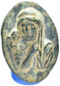
687 ANCIENT ROMAN BRONZE APPLIQUE.(1ST-3RD CENTURY).Ae. Weight : 65.8 gr Diameter : 47 mm 100