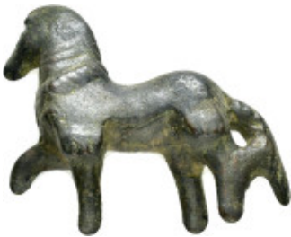
649 ANCIENT ROMAN BRONZE HORSE STATUETTE.(1st-2nd century).Ae. Weight : 41.05 gr Diameter : 47 mm 10