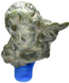
691 ANCIENT ROMAN BRONZE APPLIQUE.(1ST-3RD CENTURY).Ae. Weight : 162.9 gr Diameter : 76 mm 100