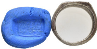
756 ANCIENT BYZANTINE BRONZE RING.(10th-11th century).Ae. Weight : 2.5 gr Diameter : 20 mm 10