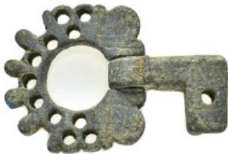
682 ANCIENT ROMAN BRONZE KEY. Weight : 12.1 gr Diameter : 38 mm 10