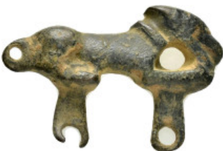
662 ANCIENT ROMAN BRONZE LION STATUETTE.(1st-2nd century).Ae. Weight : 13.09 gr Diameter : 39 mm 10