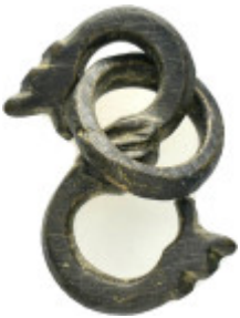
696 ANCIENT ROMAN BRONZE APPLIQUE. Weight : 5.4 gr Diameter : 24 mm 10