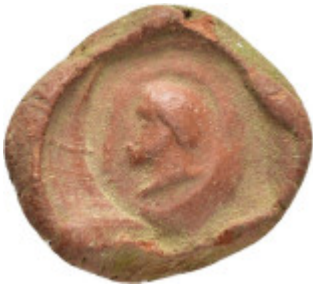
739 ANCIENT ROMAN TERRACOTTA THEATER TICKET. Weight : 1.4 gr Diameter : 19 mm 10