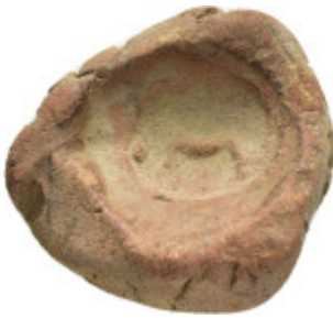
744 ANCIENT ROMAN TERRACOTTA THEATER TICKET. Weight : 1.8 gr Diameter : 20 mm 10