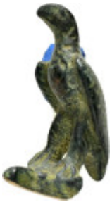
654 ANCIENT ROMAN BRONZE EAGLE STATUETTE.(1st-2nd century).Ae. Weight : 19.5 gr Diameter : 37 mm 10