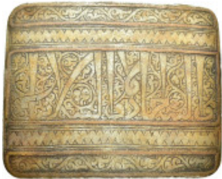
692 ISLAMIC BRONZE MILITARY BUCKLE.(7st-8nd century).Ae. Weight : 142.1 gr Diameter : 87 mm 75