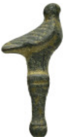
775 ANCIENT BRONZE EAGLE.(1th-3th century).Ae. Weight : 6.3 gr Diameter :25 mm 10