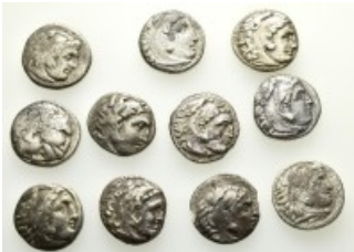
784 ANCIENT BRONZE COINS.SOLD AS SEEN.NO RETURN. 10