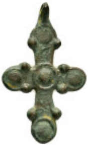
728 BYZANTINE EMPIRE.Cross.(8th-10th century).Ae. Weight : 4.04 gr Diameter : 38 mm 10