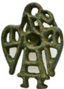
765 ANCIENT BYZANTINE BREAD STAMP.(8th-10th century).Ae. Weight : 41.9 gr Diameter : 43 mm 10