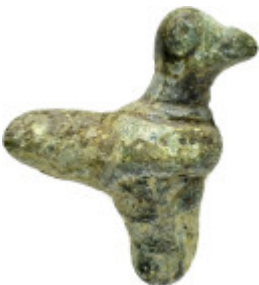
661 ANCIENT ROMAN BRONZE EAGLE STATUETTE.(1st-2nd century).Ae. Weight : 7.9 gr Diameter : 22 mm 10