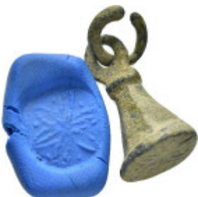
776 ANCIENT ROMAN BRONZE STAMP SEAL.(1st-2nd century).Ae. Weight : 5.04 gr Diameter :21 mm 10