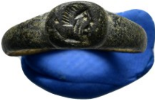
783 ANCIENT GREEK BRONZE RING.(1st-2nd century BC).Ae. Weight : gr Diameter : mm 10