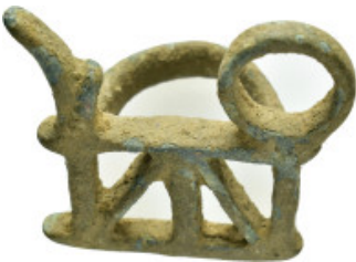
769 ANCIENT BYZANTINE BREAD STAMP.(8th-10th century).Ae. Weight : 52.8 gr Diameter : 32 mm 10