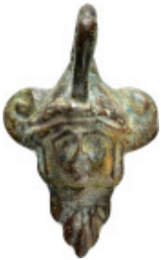
724 ANCIENT ROMAN BRONZE APLIQUE.(1st-2nd century).Ae. Weight : 26.3 gr Diameter : 57 mm 10