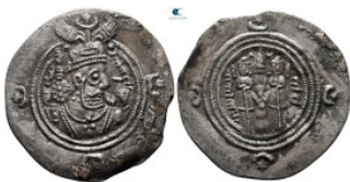
457 Sasanian Kingdom. Khusro II AD 591-628. Drachm AR 31 mm, 3,87 g very fine 10