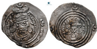
392 Sasanian Kingdom. Khusro II AD 591-628. Drachm AR 29 mm, 2,40 g very fine 10