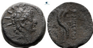
267 Seleukid Kingdom. Antioch on the Orontes. Alexander II Zabinas 128-122 BC. Bronze Æ 21 mm, 6,44 g very fine 10