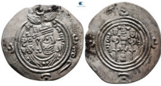
382 Sasanian Kingdom. Khusro II AD 591-628. Drachm AR 33 mm, 3,95 g very fine 10