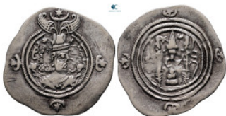
393 Sasanian Kingdom. Khusro II AD 591-628. Drachm AR 33 mm, 3,90 g very fine 10