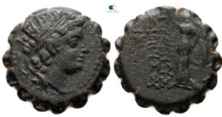
258 Seleukid Kingdom. Antioch on the Orontes. Antiochos VI Dionysos 144-142 BC. Serrate Æ 17 mm, 3,84 g nearly very fine 10