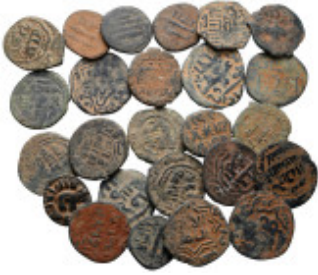
1744 Lot of ca. 25 islamic bronze coins / SOLD AS SEEN, NO RETURN! nearly very fine 10