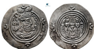
397 Sasanian Kingdom. Khusro II AD 591-628. Drachm AR 32 mm, 4,08 g very fine 10