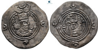
455 Sasanian Kingdom. Khusro II AD 591-628. Drachm AR 32 mm, 3,83 g very fine 10