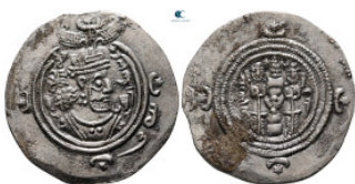
395 Sasanian Kingdom. Khusro II AD 591-628. Drachm AR 31 mm, 3,88 g very fine 10