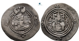
459 Sasanian Kingdom. Khusro II AD 591-628. Drachm AR 29 mm, 4,00 g very fine 10