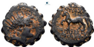
262 Seleukid Kingdom. Antioch on the Orontes. Antiochos VI Dionysos 144-142 BC. Serrate Æ 16 mm, 2,70 g very fine 10