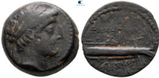
257 Seleukid Kingdom. Tyre. Demetrios II Nikator, 1st reign 146-138 BC. Bronze Æ 20 mm, 5,65 g nearly very fine 10