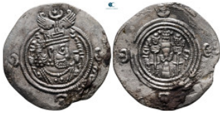
454 Sasanian Kingdom. Khusro II AD 591-628. Drachm AR 32 mm, 3,86 g very fine 10