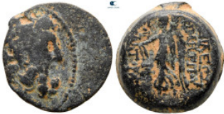
265 Seleukid Kingdom. Antioch on the Orontes. Demetrios II Nikator, 2nd reign 129-125 BC. Bronze Æ 17 mm, 6,04 g very fine 10