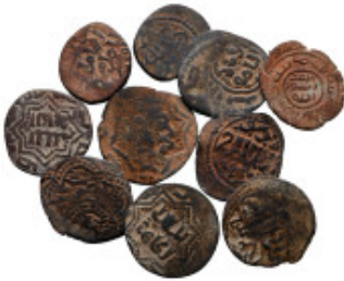
1729 Lot of ca. 10 islamic bronze coins / SOLD AS SEEN, NO RETURN! nearly very fine 10