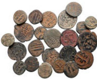
1730 Lot of ca. 25 islamic bronze coins / SOLD AS SEEN, NO RETURN! nearly very fine 10