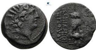
268 Seleukid Kingdom. Antioch on the Orontes. Cleopatra Thea and Antiochos VIII Epiphanes (Grypos) 125-121 BC. Bronze Æ 19 mm, 5,33 g fine 10