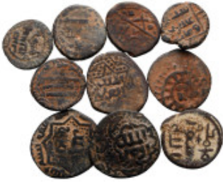
1707 Lot of ca. 10 islamic bronze coins / SOLD AS SEEN, NO RETURN! nearly very fine 10