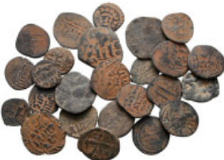
1710 Lot of ca. 25 islamic bronze coins / SOLD AS SEEN, NO RETURN! nearly very fine 10