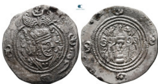
461 Sasanian Kingdom. Khusro II AD 591-628. Drachm AR 31 mm, 4,03 g very fine 10