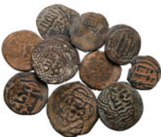
1711 Lot of ca. 10 islamic bronze coins / SOLD AS SEEN, NO RETURN! very fine 10