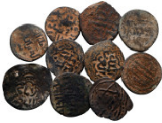
1728 Lot of ca. 10 islamic bronze coins / SOLD AS SEEN, NO RETURN! nearly very fine 10