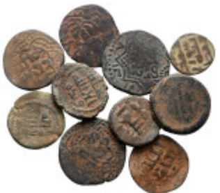
1731 Lot of ca. 10 islamic bronze coins / SOLD AS SEEN, NO RETURN! nearly very fine 10