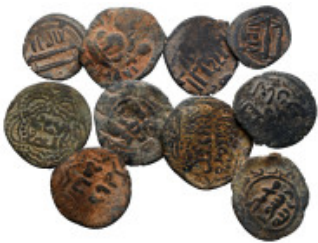
1745 Lot of ca. 10 islamic bronze coins / SOLD AS SEEN, NO RETURN! nearly very fine 10