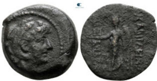
266 Seleukid Kingdom. Antioch on the Orontes. Alexander II Zabinas 128-122 BC. Bronze Æ 21 mm, 6,38 g nearly very fine 10