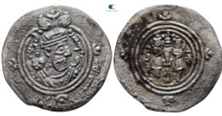
384 Sasanian Kingdom. Khusro II AD 591-628. Drachm AR 33 mm, 4,05 g very fine 10