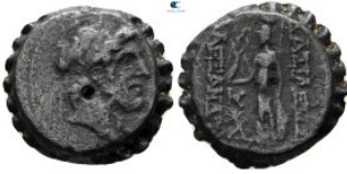
256 Seleukid Kingdom. Antioch on the Orontes. Alexander I Balas 152-145 BC. Serrate Æ 21 mm, 7,27 g very fine 10