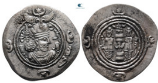
456 Sasanian Kingdom. Khusro II AD 591-628. Drachm AR 31 mm, 4,02 g very fine 10