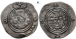
385 Sasanian Kingdom. Khusro II AD 591-628. Drachm AR 31 mm, 4,08 g very fine 10