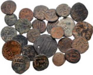
1708 Lot of ca. 25 islamic bronze coins / SOLD AS SEEN, NO RETURN! very fine 10