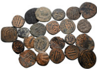
1746 Lot of ca. 23 islamic bronze coins / SOLD AS SEEN, NO RETURN! nearly very fine 10