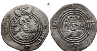
389 Sasanian Kingdom. Khusro II AD 591-628. Drachm AR 31 mm, 3,98 g very fine 10