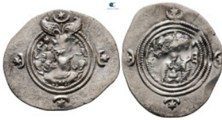
390 Sasanian Kingdom. Khusro II AD 591-628. Drachm AR 34 mm, 4,08 g very fine 10