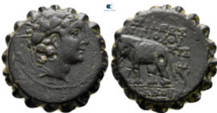
259 Seleukid Kingdom. Antioch on the Orontes. Antiochos VI Dionysos 144-142 BC. Serrate Æ 22 mm, 8,17 g very fine 10