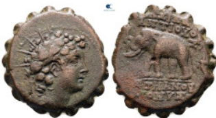
260 Seleukid Kingdom. Antioch on the Orontes. Antiochos VI Dionysos 144-142 BC. Serrate Æ 22 mm, 6,88 g very fine 10