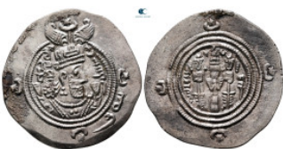
387 Sasanian Kingdom. Khusro II AD 591-628. Drachm AR 31 mm, 4,07 g very fine 10