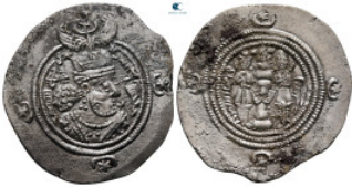
383 Sasanian Kingdom. Khusro II AD 591-628. Drachm AR 31 mm, 3,60 g very fine 10