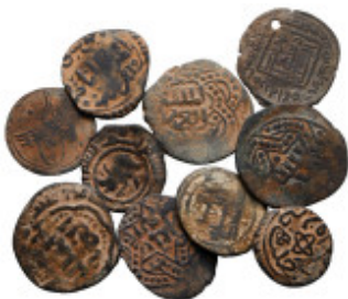
1732 Lot of ca. 10 islamic bronze coins / SOLD AS SEEN, NO RETURN! nearly very fine 10