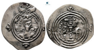
458 Sasanian Kingdom. Khusro II AD 591-628. Drachm AR 31 mm, 3,39 g very fine 10