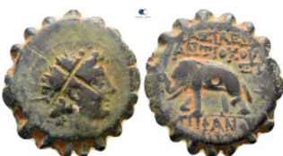
261 Seleukid Kingdom. Antioch on the Orontes. Antiochos VI Dionysos 144-142 BC. Serrate Æ 23 mm, 7,54 g fine 10