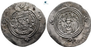
386 Sasanian Kingdom. Khusro II AD 591-628. Drachm AR 31 mm, 3,69 g very fine 10