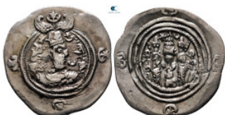
396 Sasanian Kingdom. Khusro II AD 591-628. Drachm AR 29 mm, 4,02 g very fine 10