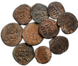
1709 Lot of ca. 10 islamic bronze coins / SOLD AS SEEN, NO RETURN! very fine 10