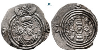
388 Sasanian Kingdom. Khusro II AD 591-628. Drachm AR 26 mm, 2,74 g very fine, edge fault 10