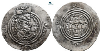
394 Sasanian Kingdom. Khusro II AD 591-628. Drachm AR 33 mm, 3,98 g very fine 10