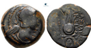
263 Seleukid Kingdom. Antioch on the Orontes. Antiochos VII Euergetes 138-129 BC. Bronze Æ 18 mm, 5,29 g very fine 10