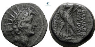
271 Seleukid Kingdom. Antioch on the Orontes. Antiochos VIII Epiphanes Grypos 121-97 BC. Bronze Æ 19 mm, 5,80 g very fine 10