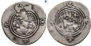
391 Sasanian Kingdom. Khusro II AD 591-628. Drachm AR 32 mm, 3,70 g very fine 10