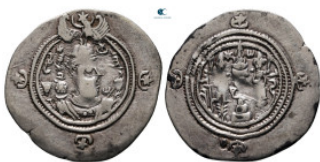
460 Sasanian Kingdom. Khusro II AD 591-628. Drachm AR 30 mm, 3,90 g very fine 10