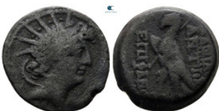
270 Seleukid Kingdom. Antioch on the Orontes. Antiochos VIII Epiphanes Grypos 121-97 BC. Bronze Æ 19 mm, 5,34 g nearly very fine 10