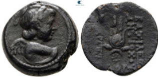
264 Seleukid Kingdom. Antioch on the Orontes. Antiochos VII Euergetes 138-129 BC. Bronze Æ 18 mm, 5,93 g very fine 10