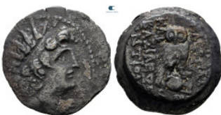
269 Seleukid Kingdom. Antioch on the Orontes. Cleopatra Thea and Antiochos VIII Epiphanes (Grypos) 125-121 BC. Bronze Æ 19 mm, 5,22 g very fine 10