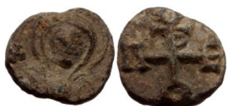
1021 Byzantine Lead seal (Lead 5,53g 16mm)