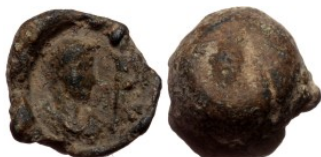
1032 Roman Lead seal (Lead 5,74g 13mm)