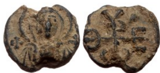
1031 Byzantine Lead seal (Lead 4,49g 15mm)