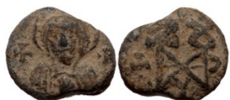
1027 Byzantine Lead seal (Lead 4,18g 15mm)