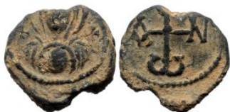
1017 Unresearched Lead seal (Lead, 19mm, 6.16g) Obv: Facing bust of the Virgin Mary, bearing a medallion with a facing bust of the infant Jesus Christ. Cros in left and right field. Rev: Cruciform monogram