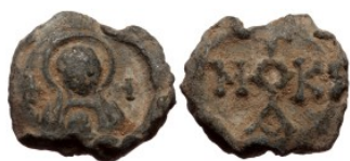
1020 Byzantine Lead seal (Lead 8,92g 19mm)