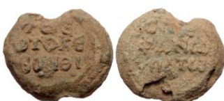
1038 Byzantine seal (Lead, 25,7 mm, 13,82 g) of Stephanos, hypatos (ca. VI/VII cent.) Obv.: Invocation Θεοτόκε βοήθει Rv.: CTE/ΦΑΝΩ/ΥΠΑΤΩ Ref.: Zacos/Veglery 1007/A