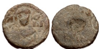
1034 Byzantine Lead seal (Lead 3,95g 15mm)