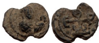
1022 Byzantine Lead seal (Lead 4,87g 20mm)