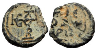
1016 Unresearched Lead seal (Lead, 23mm, 18.21g)