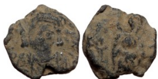
1019 Byzantine Imperial (?) Lead seal (Lead 8,11g 19mm) of emperor Maurice Tiberius (582-602) Obv. Bust of Maurice Tiberius facing, legend illegible Rv. The Mother of God standing, holding Christ before her. A large cross to the left Ref.: DO Seals 6, no. 9.5