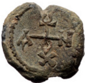
1056 Byzantine Lead Seal (Lead, 10.78g, 24mm) Byzantine Lead Seal (Lead, 10.78g, 24mm) 5