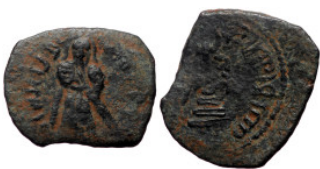
1057 Islamic, Umayyad Caliphate (Arab-Byzantine coinage) 'Abd al-Malik ibn Marwan (AH 65-86 / AD 685-705). Æ Fals (Bronze, 20 Islamic, Umayyad Caliphate (Arab-Byzantine coinage) 'Abd al-Malik ibn Marwan (AH 65-86 / AD 685-705). Æ Fals (Bronze, 20mm, 2.99g) ca 690s. Obv: Caliph standing facing, holding hilt of sword. Rev: Modified cross potent set on steps. Ref: SICA I, 639-47; Album 3532. 5