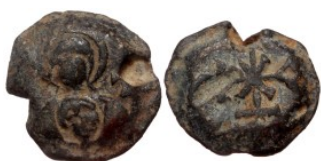
1033 Byzantine Lead seal (Lead 7,90g 19mm)