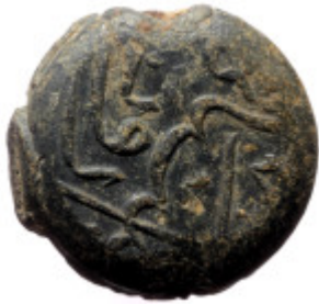
1055 Islamic Lead Seal (Lead, 9.51g, 17mm) Islamic Lead Seal (Lead, 9.51g, 17mm) 5