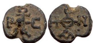
1030 Byzantine Lead seal (Lead 4,10g 16mm)