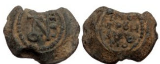
1026 Byzantine Lead seal (Lead 9,07g 26mm)