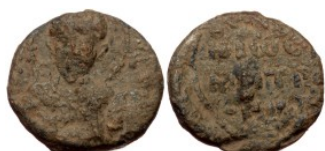
1029 Byzantine Lead seal (Lead 5,63g 18mm) of Metropolitēs (c. X-XI cent.) Obv.: Bust of saint facing Rv.: θ(...)/Η(.).ΩC/MHTP/O(...)