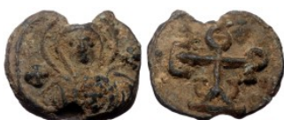
1037 Byzantine seal (Lead, 16,8 mm, 3,35 g), ca. 6th-7th cent. Obv: Nimbate bust of the Virgin Mary facing, between two crosses, holding a medallion of a facing head of Christ on her chest, all within a pellet border. Rev: Cruciform monogram.