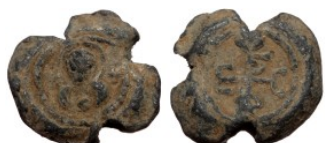
1023 Byzantine Lead seal (Lead 10,62g 23mm)