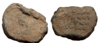
1024 Byzantine Lead seal (Lead 20,67g 30mm)