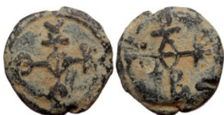
1036 Byzantine seal (Lead, 21,5 mm, 10,76 g), ca. 7th cent. Obv: Cruciform monogram. Rev: Cruciform monogram.