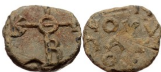
1035 Byzantine seal (Lead, 20,3 mm, 8,74g) of John(?) hypatos Obv.: Cruciform invocative monogram Θεοτόκε βοήθει Rev.: [ΙΟΑ]Ν/ΝΟΒ/ΠΑΤΟΣ