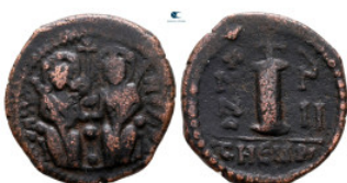
1257 Justin II and Sophia AD 565-578. Theoboupolis (Antioch) Decanummium Æ 20 m m, 3,45 g very fine From the Tareq Hani collection 10