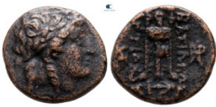
376 Seleukid Kingdom. Sardeis. Antiochos II Theos 261-246 BC. Bronze Æ 18 mm, 24 g very fine From the Tareq Hani collection 10