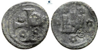
1573 Crusaders. Chios. Maona Society AD 1347-1385. Bronze AE 16 mm, 1,27 g nearly very fine 10