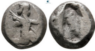
451 Persia. Achaemenid Empire. Sardeis. Time of Darios I to Xerxes II 485-420 BC. Si glos AR 15 mm, 5,39 g very fine 10