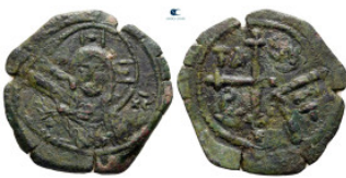
1574 Principality of Antioch. Antioch. Tancred. As regent AD 1104-1112. Follis Æ 23 mm, 3,29 g very fine 10