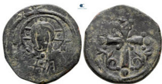
1494 Nicephorus III Botaniates AD 1078-1081. Constantinople Anonymous Follis Æ 2 5 mm, 4,93 g very fine 10