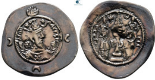
499 Sasanian Kingdom. Khusro I AD 531-579. Drachm AR 30 mm, 4,08 g very fine 10