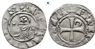
1589 Principality of Antioch. Antioch. Bohemond III AD 1163-1201. Denier AR 17 mm, 0,68 g very fine 10