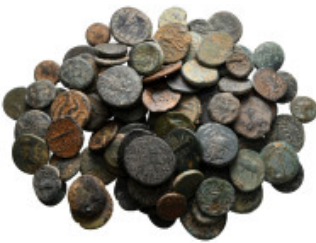
1705 Lot of ca. 100 greek bronze coins / SOLD AS SEEN, NO RETURN! nearly very fine 10