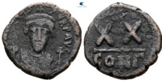
1322 Phocas AD 602-610. Constantinople Half Follis or 20 Nummi Æ 21 mm, 5,61 g n early very fine 10