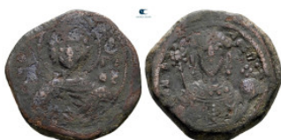
1520 Manuel I Comnenus AD 1143-1180. Thessalonica Tetarteron Æ 21 mm, 4,23 g fine 10