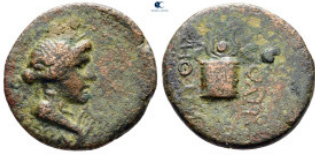
738 Phrygia. Laodikeia ad Lycum. Pseudo-autonomous issue circa AD 14-37. Bronze Æ 17 mm, 2,78 g nearly very fine 10