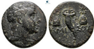
149 Pontos. Amisos. Time of Mithradates VI Eupator 120-63 BC. Bronze Æ 16 mm, 4,00 g very fine 10