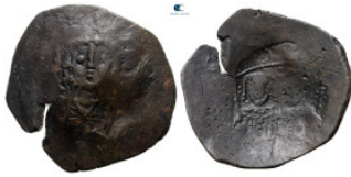
1529 Alexius III Angelus-Comnenus AD 1195-1203. Constantinople Trachy Æ 24 mm, 2,60 g nearly very fine 10