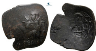
1534 Latin Rulers of Constantinople AD 1204-1261. Constantinople Trachy Æ 25 mm, 2,50 g nearly very fine 10