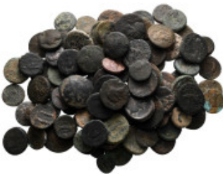
1706 Lot of ca. 106 roman bronze coins / SOLD AS SEEN, NO RETURN! nearly very fine 10