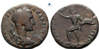
577 Moesia Inferior. Nikopolis ad Istrum. Macrinus AD 217-218. Bronze Æ 27 mm, 12,50 g nearly very fine 10