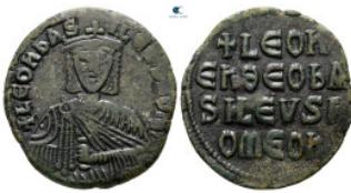
1435 Leo VI the Wise AD 886-912. Constantinople Follis Æ 26 mm, 6,17 g very fine 10