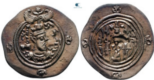
502 Sasanian Kingdom. Khusro II AD 591-628. Drachm AR 30 mm, 4,10 g very fine 10