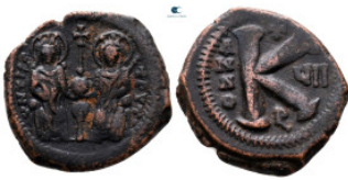
1252 Justin II and Sophia AD 565-578. Theoboupolis (Antioch) Half Follis or 20 Nummi Æ 25 mm, 7,24 g very fine From the Tareq Hani collection 10