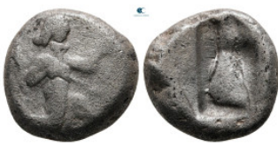
453 Persia. Achaemenid Empire. Sardeis. Time of Darios I to Xerxes II 485-420 BC. Si glos AR 15 mm, 5,39 g very fine 10