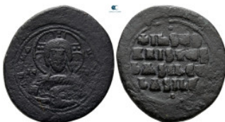
1452 Attributed to Basil II and Constantine VIII AD 976-1028. Constantinople Anonymus Follis Æ 36 mm, 16,49 g nearly very fine 10