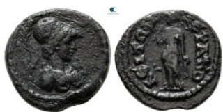
727 Phrygia. Hierapolis. Pseudo-autonomous issue AD 100-300. Bronze Æ 16 mm, 2,97 g very fine 10