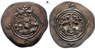
508 Sasanian Kingdom. Khusro II AD 591-628. Drachm AR 30 mm, 4,08 g very fine 10