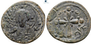
1497 Nicephorus III Botaniates AD 1078-1081. Constantinople Anonymous Follis Æ 2 3 mm, 3,90 g nearly very fine 10