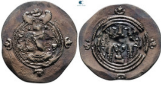
507 Sasanian Kingdom. Khusro II AD 591-628. Drachm AR 32 mm, 4,00 g nearly very fine 10