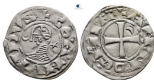
1590 Principality of Antioch. Antioch. Bohemond III AD 1163-1201. Denier AR 18 mm, 0,88 g very fine 10