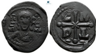
1489 Romanus IV, Diogenes AD 1068-1071. Constantinople Follis Æ 30 mm, 8,40 g v ery fine 10