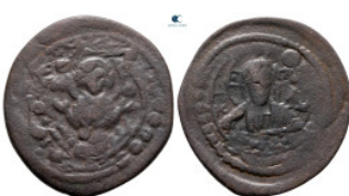
1504 Alexius I Comnenus AD 1081-1118. Constantinople Anonymous Follis Æ 28 mm, 5,85 g fine 10