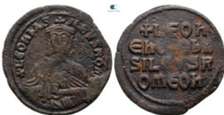
1439 Leo VI the Wise AD 886-912. Constantinople Follis Æ 27 mm, 6,13 g nearly very fine 10