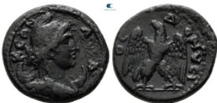
742 Phrygia. Laodikeia ad Lycum. Pseudo-autonomous issue AD 138-161. Bronze Æ 20 mm, 4,50 g very fine 10