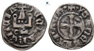
1571 Principality of Achaia. Isabelle de Villehardouin AD 1297-1301. Denier Tournais BI 18 mm, 0,84 g very fine 10