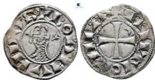
1588 Principality of Antioch. Antioch. Bohemond III AD 1163-1201. Denier AR 18 mm, 0,79 g very fine 10