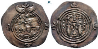
509 Sasanian Kingdom. Khusro II AD 591-628. Drachm AR 31 mm, 3,58 g very fine 10