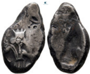
462 Persia. Achaemenid Empire. Sardeis. Time of Artaxerxes III to Darios III 350-333 BC. Siglos AR 21 mm, 5,23 g very fine 10