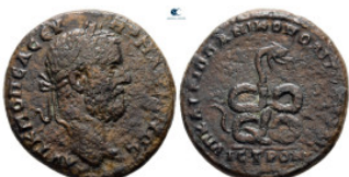
576 Moesia Inferior. Nikopolis ad Istrum. Macrinus AD 217-218. Bronze Æ 27 mm, 12,14 g very fine 10