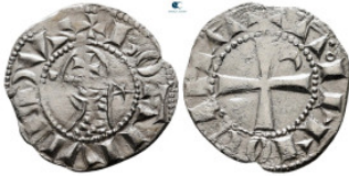
1594 Principality of Antioch. Antioch. Bohemond III AD 1163-1201. Denier AR 18 mm, 1,02 g very fine 10