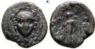
372 Seleukid Kingdom. Smyrna or Sardes. Antiochos I Soter 281-261 BC. Bronze Æ 15 mm, 2,79 g nearly very fine 10