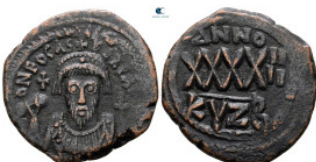
1328 Phocas AD 602-610. Cyzicus Follis or 40 Nummi Æ 30 mm, 11,57 g very fine 10