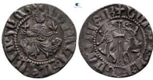
1595 Cilician Armenia. Sis. Levon I AD 1198-1219. Tram AR 22 mm, 2,75 g very fine 10