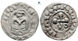
1547 France. Provincial. Valence. Anonymous Bishops AD 1100-1200. Denier AR 18 mm, 0,56 g fine 10