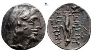
386 Seleukid Kingdom. Contemporary imitation struck in Cappadocia (Galatians?). Demetrios I Soter 162-150 BC. Drachm AR 19 mm, 3,14 g very fine 10