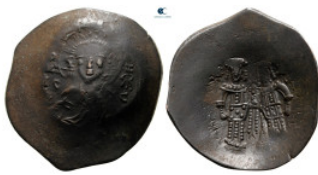
1531 Alexius III Angelus-Comnenus AD 1195-1203. Constantinople Trachy Æ 27 mm, 3,00 g very fine 10