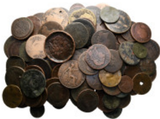
1742 Lot of ca. 140 modern world coins / SOLD AS SEEN, NO RETURN! fine 10