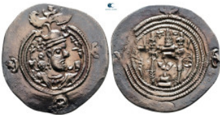
500 Sasanian Kingdom. Khusro II AD 591-628. Drachm AR 32 mm, 3,99 g very fine 10