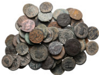
1724 Lot of ca. 70 roman bronze coins / SOLD AS SEEN, NO RETURN! very fine 10