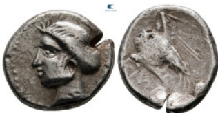
154 Paphlagonia. Sinope circa 350-300 BC. Contemporary barbaric imitation Drachm AR 21 mm, 6,25 g very fine 10