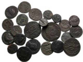
1723 Lot of ca. 23 roman bronze coins / SOLD AS SEEN, NO RETURN! very fine 10