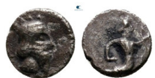
465 Persia. Achaemenid Empire. Uncertain mint. Uncertain king 500-400 BC. Tetartem orion AR 5 mm, 0,15 g very fine 10