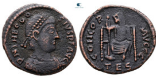
1168 Theodosius I AD 379-395. Thessaloniki Follis Æ 20 mm, 2,88 g nearly very fine From the Tareq Hani collection 10