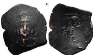
1527 Alexius III Angelus-Comnenus AD 1195-1203. Constantinople Trachy Æ 25 mm, 2,26 g nearly very fine 10