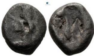
461 Persia. Achaemenid Empire. Sardeis. Time of Darios I to Xerxes II 485-420 BC. Siglos AR 15 mm, 5,35 g fine 10