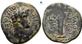
741 Phrygia. Laodikeia ad Lycum. Pseudo-autonomous issue AD 54-68. Bronze Æ 22 mm, 4,63 g nearly very fine 10