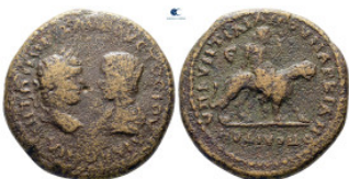
573 Moesia Inferior. Marcianopolis. Caracalla, with Julia Domna AD 198-217. Bronze Æ 27 mm, 12,26 g nearly very fine 10