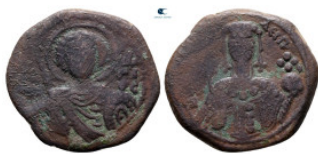
1516 Manuel I Comnenus AD 1143-1180. Constantinople Tetarteron Æ 21 mm, 3,79 g fine 10