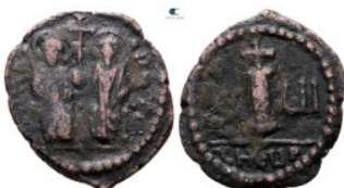
1256 Justin II and Sophia AD 565-578. Theoboupolis (Antioch) Decanummium Æ 21 m m, 3,02 g nearly very fine From the Tareq Hani collection 10