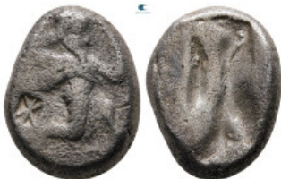
455 Persia. Achaemenid Empire. Sardeis. Time of Darios I to Xerxes II 485-420 BC. Si glos AR 17 mm, 5,35 g very fine 10