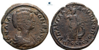
574 Moesia Inferior. Nikopolis ad Istrum. Julia Domna. Augusta AD 193-217. Bronze Æ 27 mm, 11,65 g very fine 10