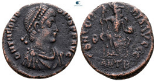
1163 Theodosius I AD 379-395. Antioch Follis Æ 18 mm, 2,22 g very fine From the Tareq Hani collection 10