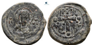
1495 Nicephorus III Botaniates AD 1078-1081. Constantinople Anonymous Follis Æ 2 6 mm, 7,95 g nearly very fine 10