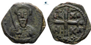
1575 Principality of Antioch. Antioch. Tancred. As regent AD 1104-1112. Follis Æ 19 mm, 2,87 g very fine 10