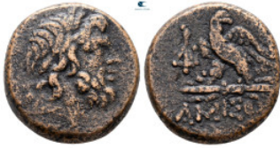
148 Pontos. Amisos. Time of Mithradates VI Eupator 120-63 BC. Bronze Æ 19 mm, 8,05 g nearly very fine 10