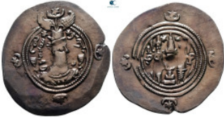
506 Sasanian Kingdom. Khusro II AD 591-628. Drachm AR 32 mm, 3,96 g very fine 10