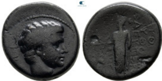
739 Phrygia. Laodikeia ad Lycum. Tiberius AD 14-37. Bronze Æ 19 mm, 5,68 g nearly very fine 10