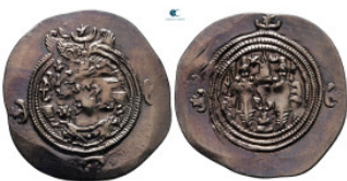
505 Sasanian Kingdom. Khusro II AD 591-628. Drachm AR 31 mm, 4,08 g very fine 10