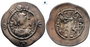
489 Sasanian Kingdom. Khusro I AD 531-579. Drachm AR 29 mm, 3,97 g very fine 10