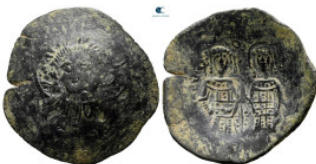
1526 Alexius III Angelus-Comnenus AD 1195-1203. Constantinople Trachy Æ 25 mm, 2,60 g very fine 10