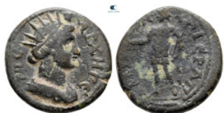
728 Phrygia. Hierapolis. Pseudo-autonomous issue AD 244-249. Bronze Æ 16 mm, 3,00 g nearly very fine 10