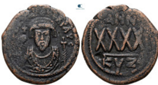
1327 Phocas AD 602-610. Cyzicus Follis or 40 Nummi Æ 30 mm, 11,55 g nearly very f ine 10