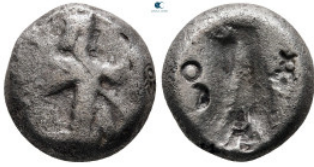
459 Persia. Achaemenid Empire. Sardeis. Time of Darios I to Xerxes II 485-420 BC. Siglos AR 15 mm, 5,16 g nearly very fine 10