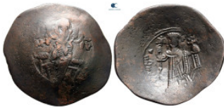
1514 Manuel I Comnenus AD 1143-1180. Constantinople Trachy Æ 31 mm, 3,86 g very fine 10