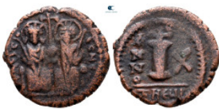
1254 Justin II and Sophia AD 565-578. Theoboupolis (Antioch) Decanummium Æ 20 m m, 3,75 g very fine From the Tareq Hani collection 10