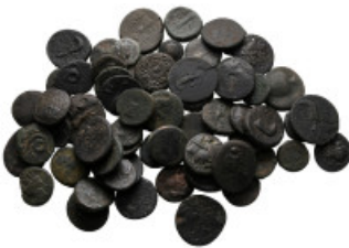
1707 Lot of ca. 63 greek bronze coins / SOLD AS SEEN, NO RETURN! nearly very fine 10