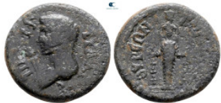
723 Phrygia. Grymenothyrai. Pseudo-autonomous issue AD 98-117. Bronze Æ 18 mm, 3,85 g nearly very fine 10