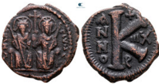
1251 Justin II and Sophia AD 565-578. Theoboupolis (Antioch) Half Follis or 20 Nummi Æ 24 mm, 6,97 g very fine From the Tareq Hani collection 10