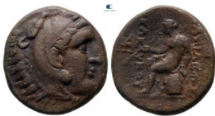
381 Seleukid Kingdom. Sardeis. Seleukos II Kallinikos 246-226 BC. Bronze Æ 17 mm, 4,32 g very fine 10