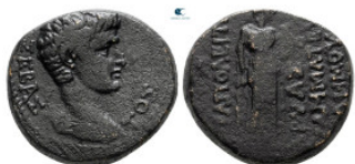
725 Phrygia. Hierapolis. Augustus 27 BC-AD 14. Bronze Æ 18 mm, 4,90 g very fine 10