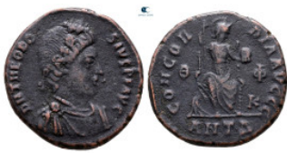
1164 Theodosius I AD 379-395. Antioch Follis Æ 18 mm, 3,04 g very fine From the Tareq Hani collection 10