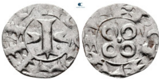
1549 France. Provincial. Melgueil. Uncertain Count or Bishop AD 1300-1400. Denier AR 17 mm, 1,10 g very fine 10