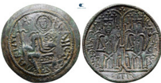
1551 Hungary. Bela III AD 1172-1196. Scyphate Æ 27 mm, 2,90 g very fine 10