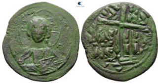
1465 Romanus III Argyrus AD 1028-1034. Constantinople Anonymous Follis Æ 32 m m, 8,58 g very fine 10