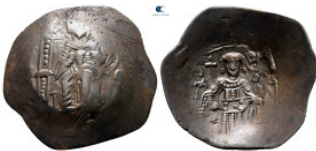
1525 Isaac II Angelos AD 1185-1195. Constantinople Trachy Æ 26 mm, 2,30 g very fine 10