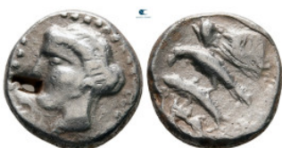
152 Paphlagonia. Sinope circa 350-300 BC. Contemporary barbaric imitation Drachm AR 19 mm, 6,29 g very fine, holed 10