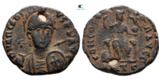
1169 Arcadius AD 383-408. Antioch Follis Æ 17 mm, 2,30 g nearly very fine, holed 10