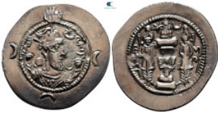
487 Sasanian Kingdom. Khusro I AD 531-579. Drachm AR 31 mm, 4,07 g very fine 10