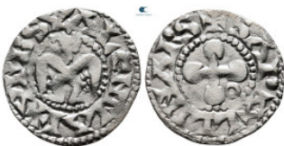
1548 France. Provincial. Valence. Anonymous Bishops AD 1100-1200. Denier AR 18 mm, 1,12 g very fine 10