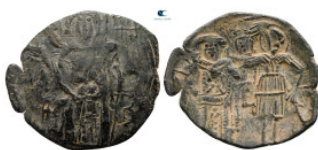
1536 John III Ducas (Vatatzes), emperor of Nicaea AD 1222-1254. Magnesia Trachy Æ 23 mm, 1,69 g very fine 10