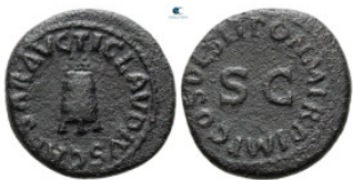
901 Claudius AD 41-54. Rome Quadrans Æ 18 mm, 3,45 g very fine