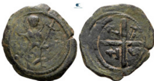
1576 Principality of Antioch. Antioch. Tancred. As regent AD 1104-1112. Follis Æ 24 mm, 3,60 g very fine 10