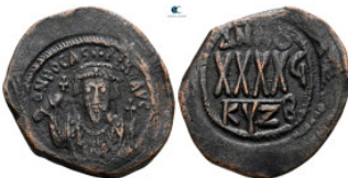
1326 Phocas AD 602-610. Cyzicus Follis or 40 Nummi Æ 32 mm, 11,16 g very fine 10