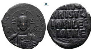
1453 Attributed to Basil II and Constantine VIII AD 976-1028. Constantinople Anonymus Follis Æ 31 mm, 9,40 g very fine 10