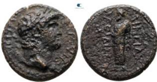
740 Phrygia. Laodikeia ad Lycum. Nero AD 54-68. Bronze Æ 20 mm, 5,73 g nearly very fine 10