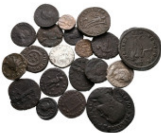
1713 Lot of ca. 20 roman coins / SOLD AS SEEN, NO RETURN! very fine 10