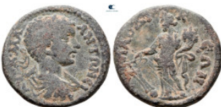
744 Phrygia. Laodikeia ad Lycum. Caracalla AD 198-217. Bronze Æ 25 mm, 9,58 g nearly very fine 10