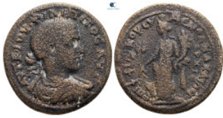
722 Phrygia. Eumeneia - Fulvia. Philip I Arab AD 244-249. Bronze Æ 31 mm, 14,20 g very fine 10