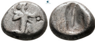
452 Persia. Achaemenid Empire. Sardeis. Time of Darios I to Xerxes II 485-420 BC. Si glos AR 16 mm, 5,32 g very fine 10