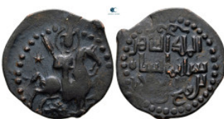
1600 Seljuks. Rum. Rukn al-Din Sulayman II AH 592-600. Fals Æ 28 mm, 7,87 g very fine 10