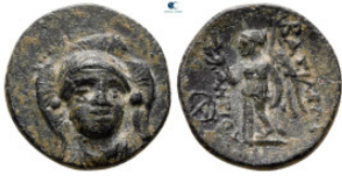
371 Seleukid Kingdom. Smyrna or Sardes. Antiochos I Soter 281-261 BC. Bronze Æ 15 mm, 1,82 g very fine 10