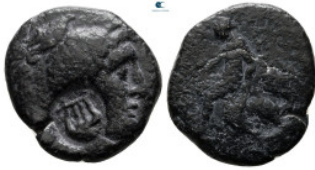
379 Seleukid Kingdom. Sardeis. Seleukos II Kallinikos 246-226 BC. Bronze Æ 17 mm, 3,42 g fine 10