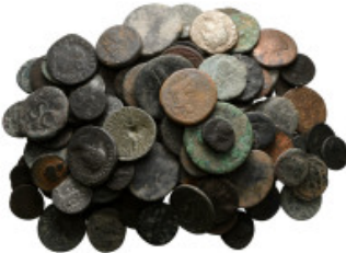
1712 Lot of ca. 117 roman provincial bronze coins / SOLD AS SEEN, NO RETURN! nearly very fine 10