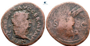
903 Nero AD 54-68. Rome As Æ 29 mm, 11,32 g fine