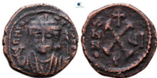
1304 Maurice Tiberius AD 582-602. Theoupolis (Antioch) Decanummium Æ 18 mm, 2,98 g nearly very fine From the Tareq Hani collection 10