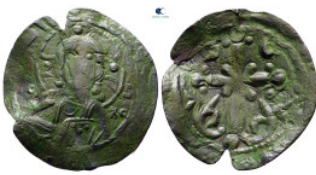
1499 Nicephorus III Botaniates AD 1078-1081. Constantinople Anonymous Follis Æ 2 5 mm, 1,70 g fine 10