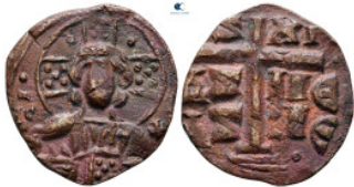
1466 Romanus III Argyrus AD 1028-1034. Constantinople Anonymous Follis Æ 27 m m, 5,93 g very fine 10