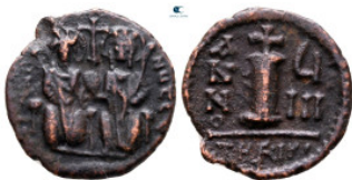
1253 Justin II and Sophia AD 565-578. Theoboupolis (Antioch) Decanummium Æ 18 m m, 2,19 g very fine From the Tareq Hani collection 10