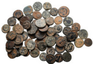
1736 Lot of ca. 66 byzantine bronze coins / SOLD AS SEEN, NO RETURN! very fine 10