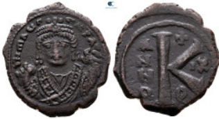
1299 Maurice Tiberius AD 582-602. Theoupolis (Antioch) Half Follis or 20 Nummi Æ 23 mm, 5,40 g very fine From the Tareq Hani collection 10