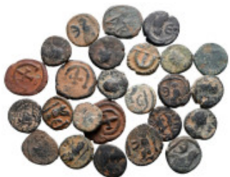
1737 Lot of ca. 25 byzantine bronze coins / SOLD AS SEEN, NO RETURN! very fine 10