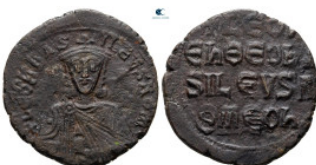
1440 Leo VI the Wise AD 886-912. Constantinople Follis Æ 26 mm, 8,98 g nearly very fine 10