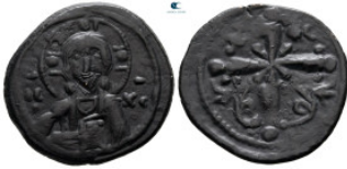
1498 Nicephorus III Botaniates AD 1078-1081. Constantinople Anonymous Follis Æ 2 4 mm, 4,35 g very fine 10