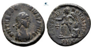
1167 Theodosius I AD 379-395. Cyzicus Follis Æ 14 mm, 1,18 g very fine 10