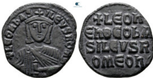
1436 Leo VI the Wise AD 886-912. Constantinople Follis Æ 26 mm, 5,65 g very fine 10