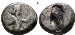
456 Persia. Achaemenid Empire. Sardeis. Time of Darios I to Xerxes II 485-420 BC. Si glos AR 15 mm, 5,30 g nearly very fine 10