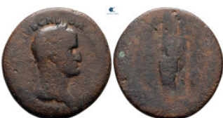
905 Galba AD 68-69. Rome Sestertius Æ 35 mm, 22,02 g fine