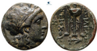
373 Seleukid Kingdom. Sardeis. Antiochos II Theos 261-246 BC. Bronze Æ 16 mm, 3,07 g very fine 10