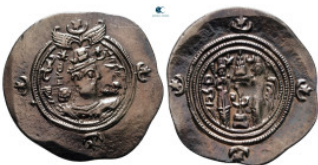
503 Sasanian Kingdom. Khusro II AD 591-628. Drachm AR 30 mm, 4,03 g very fine 10