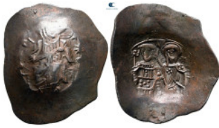
1513 Manuel I Comnenus AD 1143-1180. Constantinople Trachy Æ 30 mm, 2,78 g very fine 10