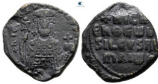
1449 Nicephorus II Phocas AD 963-969. Constantinople Follis Æ 27 mm, 9,08 g very fine 10