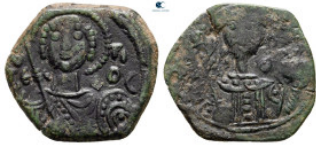
1521 Manuel I Comnenus AD 1143-1180. Thessalonica Tetrarteron Æ 15 mm, 1,09 g very fine 10