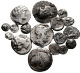
1704 Lot of ca. 17 greek silver coins / SOLD AS SEEN, NO RETURN! nearly very fine 10