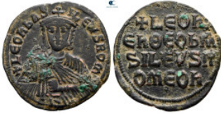
1433 Leo VI the Wise AD 886-912. Constantinople Follis Æ 25 mm, 4,24 g very fine 10