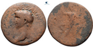
900 Claudius AD 41-54. Rome As Æ 28 mm, 10,92 g fine