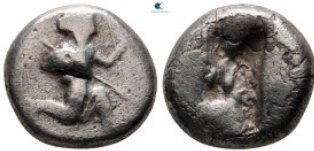
460 Persia. Achaemenid Empire. Sardeis. Time of Darios I to Xerxes II 485-420 BC. Siglos AR 15 mm, 4,48 g nearly very fine 10