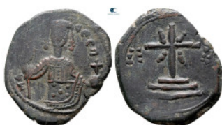
1518 Manuel I Comnenus AD 1143-1180. Thessalonica Tetarteron Æ 21 mm, 2,52 g very fine 10