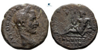
575 Moesia Inferior. Nikopolis ad Istrum. Macrinus AD 217-218. Bronze Æ 25 mm, 10,00 g nearly very fine 10