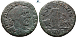
571 Moesia Superior. Viminacium. Philip I Arab AD 244-249. Bronze Æ 29 mm, 17,27 g very fine 10