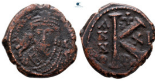
1301 Maurice Tiberius AD 582-602. Theoupolis (Antioch) Half Follis or 20 Nummi Æ 21 mm, 6,12 g nearly very fine From the Tareq Hani collection 10