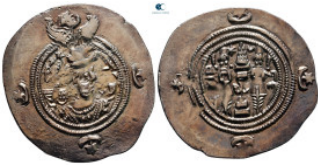
510 Sasanian Kingdom. Khusro II AD 591-628. Drachm AR 33 mm, 4,09 g very fine 10