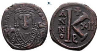
1300 Maurice Tiberius AD 582-602. Theoupolis (Antioch) Half Follis or 20 Nummi Æ 21 mm, 6,08 g very fine From the Tareq Hani collection 10