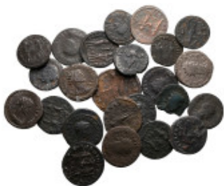
1725 Lot of ca. 24 roman bronze coins / SOLD AS SEEN, NO RETURN! very fine 10