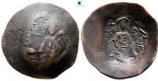
1522 Isaac II Angelos AD 1185-1195. Constantinople Trachy Æ 27 mm, 3,00 g nearly very fine 10