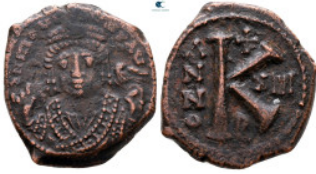
1298 Maurice Tiberius AD 582-602. Theoupolis (Antioch) Half Follis or 20 Nummi Æ 23 mm, 6,45 g very fine From the Tareq Hani collection 10