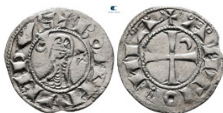
1591 Principality of Antioch. Antioch. Bohemond III AD 1163-1201. Denier AR 19 mm, 0,87 g very fine 10