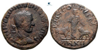
572 Moesia Superior. Viminacium. Trajan Decius AD 249-251. Bronze Æ 26 mm, 12,00 g very fine 10