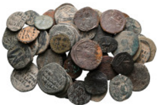
1735 Lot of ca. 64 byzantine bronze coins / SOLD AS SEEN, NO RETURN! nearly very fine 10