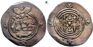
511 Sasanian Kingdom. Khusro II AD 591-628. Drachm AR 31 mm, 4,10 g very fine 10