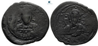
1490 Michael VII Doukas AD 1071-1078. Constantinople Follis Æ 32 mm, 8,26 g fine 10