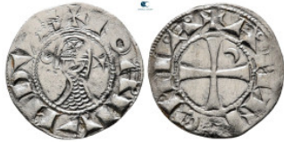
1586 Principality of Antioch. Antioch. Bohemond III AD 1163-1201. Denier AR 17 mm, 0,84 g very fine 10