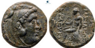
377 Seleukid Kingdom. Sardeis. Seleukos II Kallinikos 246-226 BC. Bronze Æ 16 mm, 4,30 g very fine 10