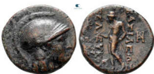
378 Seleukid Kingdom. Sardeis. Seleukos II Kallinikos 246-226 BC. Bronze Æ 18 mm, 3,93 g very fine 10