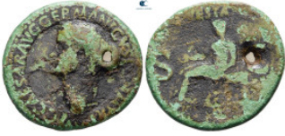
898 Germanicus AD 37-41. Rome As Æ 30 mm, 9,75 g fine