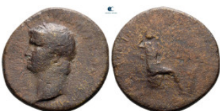
904 Nero AD 54-68. Thracian mint As Æ 28 mm, 10,31 g fine