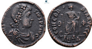
1162 Theodosius I AD 379-395. Antioch Follis Æ 18 mm, 2,36 g very fine From the Tareq Hani collection 10