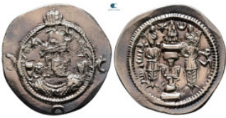
484 Sasanian Kingdom. Khusro I AD 531-579. Drachm AR 28 mm, 3,78 g very fine 10