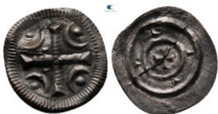
1550 Hungary. AD 1100-1200. Denar AR 13 mm, 0,38 g very fine 10