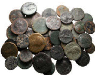
1714 Lot of ca. 51 roman bronze coins / SOLD AS SEEN, NO RETURN! fine 10