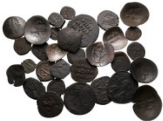
1734 Lot of ca. 31 byzantine bronze coins / SOLD AS SEEN, NO RETURN! very fine 10