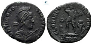
1166 Theodosius I AD 379-395. Cyzicus Follis Æ 23 mm, 3,68 g very fine 10