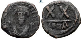
1323 Phocas AD 602-610. Constantinople Half Follis or 20 Nummi Æ 21 mm, 5,62 g n early very fine 10