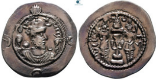
482 Sasanian Kingdom. Khusro I AD 531-579. Drachm AR 30 mm, 4,08 g very fine 10