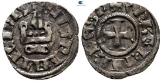
1569 Crusaders, Principality of Achaia. Philippe de Taranto AD 1307-1313. Denier Tournois BI 18 mm, 0,70 g very fine 10