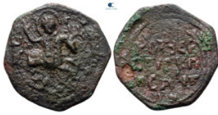
1585 Principality of Antioch. Antioch. Roger of Salerno as regent AD 1112-1119. Follis Æ 24 mm, 4,38 g fine 10