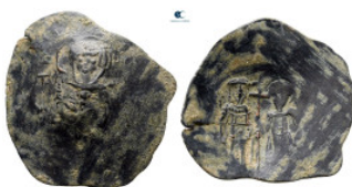
1535 Theodore I Comnenus-Lascaris AD 1208-1222. Nicaea Trachy Æ 26 mm, 2,17 g nearly very fine 10