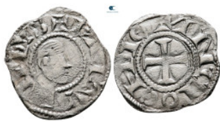
1587 Principality of Antioch. Antioch. Bohemond III AD 1163-1201. Denier AR 18 mm, 0,82 g nearly very fine 10