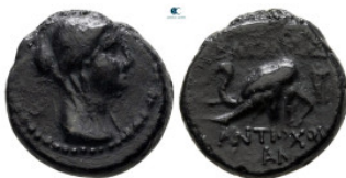
385 Seleukid Kingdom. Antioch. Antiochos IV Epiphanes 175-164 BC. Bronze Æ 16 mm, 4,37 g very fine 10