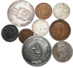
1739 Lot of ca. 9 modern world coins / SOLD AS SEEN, NO RETURN! very fine 10