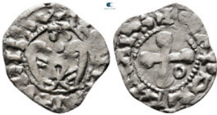
1546 France. Provincial. Valence. Anonymous Bishops AD 1100-1200. Denier AR 17 mm, 0,42 g very fine 10