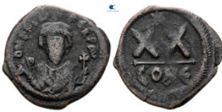
1324 Phocas AD 602-610. Constantinople Half Follis or 20 Nummi Æ 24 mm, 5,60 g n early very fine 10