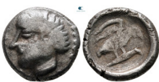
153 Paphlagonia. Sinope circa 350-300 BC. Contemporary barbaric imitation Drachm AR 18 mm, 6,00 g very fine 10