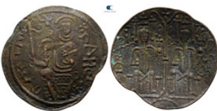
1552 Hungary. Bela III AD 1172-1196. Scyphate Æ 25 mm, 2,03 g very fine 10