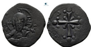
1496 Nicephorus III Botaniates AD 1078-1081. Constantinople Anonymous Follis Æ 2 2 mm, 4,00 g very fine 10