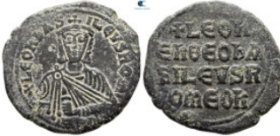
1434 Leo VI the Wise AD 886-912. Constantinople Follis Æ 29 mm, 9,92 g very fine 10