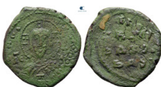
1456 Attributed to Basil II and Constantine VIII AD 976-1028. Constantinople Anonymus Follis Æ 27 mm, 8,96 g fine 10