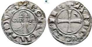
1593 Principality of Antioch. Antioch. Bohemond III AD 1163-1201. Denier AR 17 mm, 0,74 g very fine 10