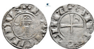
1592 Principality of Antioch. Antioch. Bohemond III AD 1163-1201. Denier AR 18 mm, 0,68 g nearly very fine 10