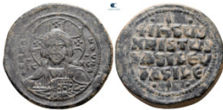
1450 Attributed to Basil II and Constantine VIII AD 976-1028. Constantinople Anonymus Follis Æ 36 mm, 23,64 g very fine 10