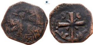
1572 Crusaders. Anonymous AD 1100-1300. Follis Æ 24 mm, 4,12 g nearly very fine 10