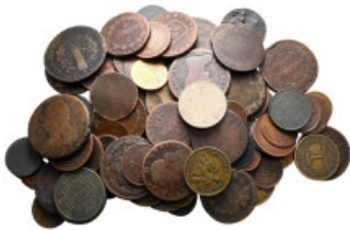
1741 Lot of ca. 90 modern world coins / SOLD AS SEEN, NO RETURN! nearly very fine 10