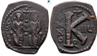
1250 Justin II and Sophia AD 565-578. Theoboupolis (Antioch) Half Follis or 20 Nummi Æ 25 mm, 7,33 g very fine From the Tareq Hani collection 10