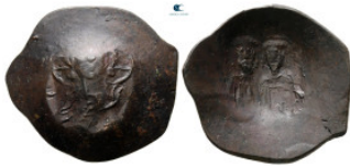
1530 Alexius III Angelus-Comnenus AD 1195-1203. Constantinople Trachy Æ 26 mm, 3,00 g nearly very fine 10