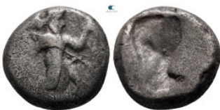
457 Persia. Achaemenid Empire. Sardeis. Time of Darios I to Xerxes II 485-420 BC. Si glos AR 15 mm, 5,33 g very fine 10