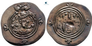
512 Sasanian Kingdom. Khusro II AD 591-628. Drachm AR 31 mm, 4,06 g very fine 10