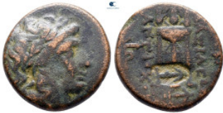
375 Seleukid Kingdom. Sardeis. Antiochos II Theos 261-246 BC. Bronze Æ 17 mm, 4,21 g fine 10