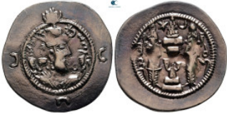
498 Sasanian Kingdom. Khusro I AD 531-579. Drachm AR 30 mm, 4,04 g very fine 10