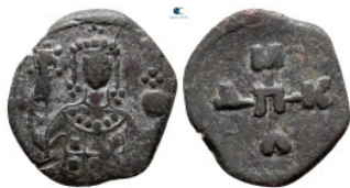
1517 Manuel I Comnenus AD 1143-1180. Constantinople Half Tetarteron Æ 17 mm, 1,40 g very fine 10