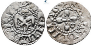
1545 France. Provincial. Valence. Anonymous Bishops AD 1100-1200. Denier AR 17 mm, 0,78 g very fine 10