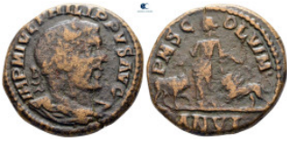
570 Moesia Superior. Viminacium. Philip I Arab AD 244-249. Bronze Æ 30 mm, 16,82 g nearly very fine 10