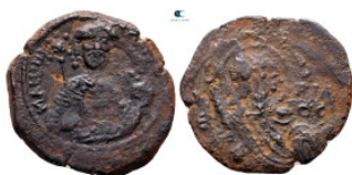
1519 Manuel I Comnenus AD 1143-1180. Thessalonica Tetarteron Æ 22 mm, 3,30 g fine 10