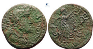
729 Phrygia. Hierapolis (?). Gallienus AD 253-268. Bronze Æ 24 mm, 7,98 g fine 10