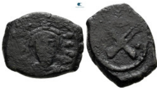
1325 Phocas AD 602-610. Constantinople Decanummium Æ 20 mm, 3,48 g fine 10