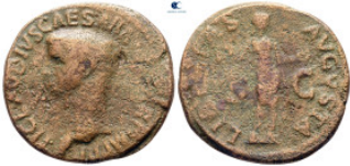
899 Claudius AD 41-54. Rome As Æ 29 mm, 7,30 g fine