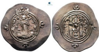
501 Sasanian Kingdom. Khusro II AD 591-628. Drachm AR 31 mm, 4,08 g very fine 10