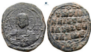
1451 Attributed to Basil II and Constantine VIII AD 976-1028. Constantinople Anonymus Follis Æ 31 mm, 13,46 g very fine 10