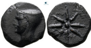
150 Pontos. Uncertain mint. Time of Mithradates VI Eupator 120-63 BC. Bronze Æ 28 mm, 20,48 g very fine 10