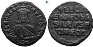
1437 Leo VI the Wise AD 886-912. Constantinople Follis Æ 27 mm, 6,65 g very fine 10