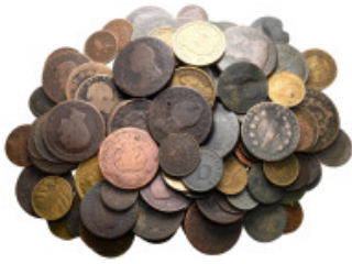
1740 Lot of ca. 100 modern world coins / SOLD AS SEEN, NO RETURN! nearly very fine 10