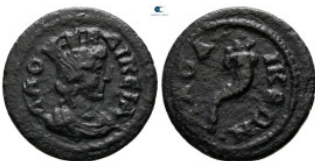
745 Phrygia. Laodikeia ad Lycum. Pseudo-autonomous issue circa AD 200-300. Bronze Æ 21 mm, 4,26 g very fine 10