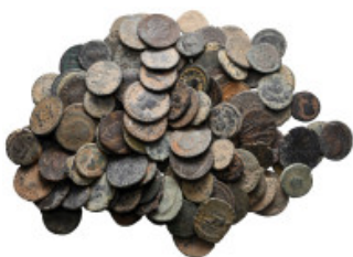
1726 Lot of ca. 125 roman bronze coins / SOLD AS SEEN, NO RETURN! nearly very fine 10