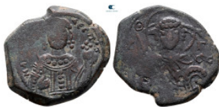
1515 Manuel I Comnenus AD 1143-1180. Constantinople Tetarteron Æ 22 mm, 4,97 g very fine 10