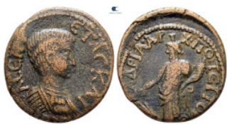
724 Phrygia. Hadrianopolis - Sebaste. Geta AD 198-211. Bronze Æ 22 mm, 6,00 g very fine 10