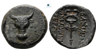
155 Kings of Paphlagonia. Pylaimenes II/III Euergetes circa 133-103 BC. Bronze Æ 18 mm, 3,88 g good very fine 10