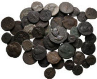
1711 Lot of ca. 50 roman provincial bronze coins / SOLD AS SEEN, NO RETURN! very fine 10