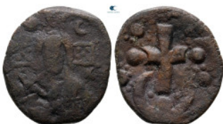
1503 Alexius I Comnenus AD 1081-1118. Constantinople Anonymous Follis Æ 22 mm, 4,54 g fine 10