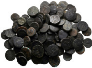
1710 Lot of ca. 100 greek bronze coins / SOLD AS SEEN, NO RETURN! nearly very fine 10