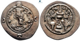
485 Sasanian Kingdom. Khusro I AD 531-579. Drachm AR 30 mm, 3,58 g very fine 10