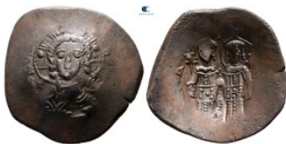
1532 Alexius III Angelus-Comnenus AD 1195-1203. Constantinople Trachy Æ 26 mm, 3,35 g very fine 10