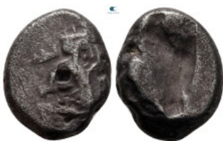
464 Persia. Achaemenid Empire. Sardeis. Time of Artaxerxes III to Darios III 350-333 BC. Siglos AR 16 mm, 5,27 g nearly very fine 10