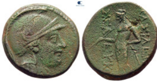
380 Seleukid Kingdom. Sardeis. Seleukos II Kallinikos 246-226 BC. Bronze Æ 19 mm, 6,98 g very fine 10