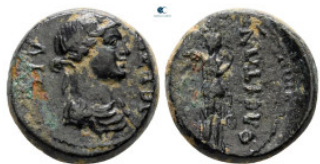
726 Phrygia. Hierapolis. Pseudo-autonomous issue AD 70-100. Bronze Æ 15 mm, 3,85 g very fine 10