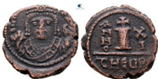
1305 Maurice Tiberius AD 582-602. Theoupolis (Antioch) Decanummium Æ 18 mm, 2,72 g very fine From the Tareq Hani collection 10