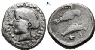
151 Paphlagonia. Sinope circa 350-300 BC. Contemporary barbaric imitation Drachm AR 19 mm, 5,98 g very fine 10