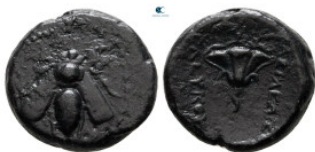
384 Seleukid Kingdom. Uncertain mint. Seleukos IV Philopator 187-175 BC. Bronze Æ 15 mm, 2,68 g very fine 10