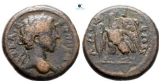
743 Phrygia. Laodikeia ad Lycum. Commodus, as Caesar AD 166-177. Bronze Æ 18 mm, 4,73 g nearly very fine 10