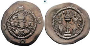
488 Sasanian Kingdom. Khusro I AD 531-579. Drachm AR 30 mm, 3,95 g very fine 10