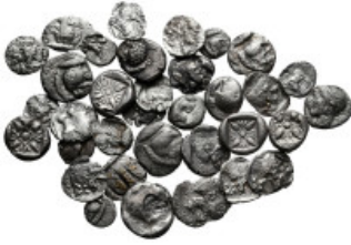
1709 Lot of ca. 34 greek silver fractions / SOLD AS SEEN, NO RETURN! very fine 10