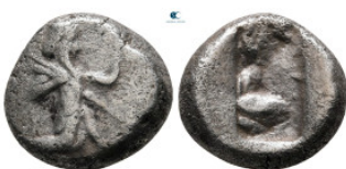
458 Persia. Achaemenid Empire. Sardeis. Time of Darios I to Xerxes II 485-420 BC. Si glos AR 16 mm, 5,45 g very fine 10