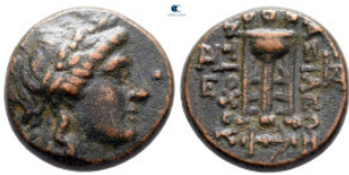
374 Seleukid Kingdom. Sardeis. Antiochos II Theos 261-246 BC. Bronze Æ 16 mm, 5,18 g very fine 10