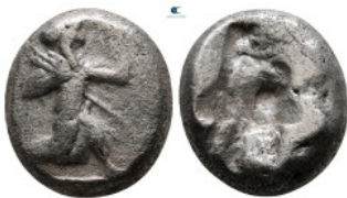
454 Persia. Achaemenid Empire. Sardeis. Time of Darios I to Xerxes II 485-420 BC. Si glos AR 15 mm, 5,38 g very fine 10