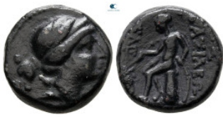
382 Seleukid Kingdom. Antioch. Seleukos III Keraunos 226-223 BC. Bronze Æ 16 mm, 4,73 g very fine 10