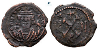
1303 Maurice Tiberius AD 582-602. Theoupolis (Antioch) Decanummium Æ 20 mm, 3,17 g very fine From the Tareq Hani collection 10