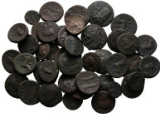
1703 Lot of ca. 43 greek bronze coins / SOLD AS SEEN, NO RETURN! nearly very fine 10