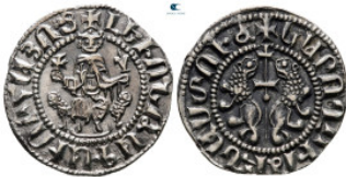
1597 Cilician Armenia. Sis. Levon I AD 1198-1219. Tram AR 22 mm, 2,74 g good very fine 10