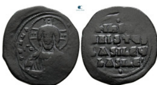
1454 Attributed to Basil II and Constantine VIII AD 976-1028. Constantinople Anonymus Follis Æ 32 mm, 10,20 g very fine 10