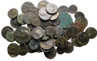
1721 Lot of ca. 54 roman bronze coins / SOLD AS SEEN, NO RETURN! very fine 10