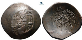
1524 Isaac II Angelos AD 1185-1195. Constantinople Trachy Æ 27 mm, 4,25 g very fine 10