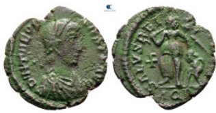
1165 Theodosius I AD 379-395. Aquileia Follis Æ 14 mm, 1,16 g nearly very fine 10