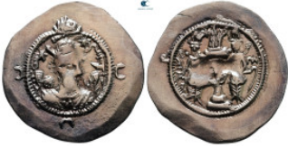
486 Sasanian Kingdom. Khusro I AD 531-579. Drachm AR 29 mm, 4,02 g very fine 10