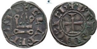
1570 Principality of Achaia. Guillaume I de la Roche AD 1280-1287. Denier Tournais BI 19 mm, 0,88 g very fine 10