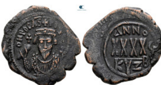
1329 Phocas AD 602-610. Cyzicus Follis or 40 Nummi Æ 31 mm, 10,68 g very fine 10