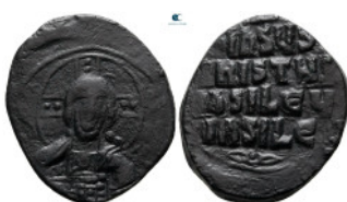
1455 Attributed to Basil II and Constantine VIII AD 976-1028. Constantinople Anonymus Follis Æ 29 mm, 8,70 g nearly very fine 10