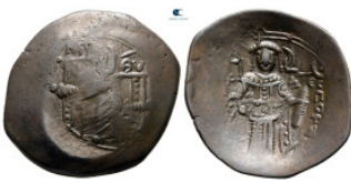
1523 Isaac II Angelos AD 1185-1195. Constantinople Trachy Æ 26 mm, 3,49 g very fine 10