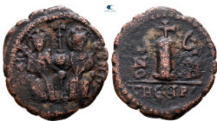
1255 Justin II and Sophia AD 565-578. Theoboupolis (Antioch) Decanummium Æ 21 m m, 3,34 g very fine From the Tareq Hani collection 10