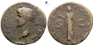
902 Claudius AD 41-54. Thracian mint Sestertius Æ 35 mm, 23,15 g fine