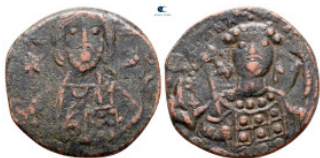
1492 Michael VII Doukas AD 1071-1078. Constantinople Follis Æ 25 mm, 4,44 g nearl y very fine 10