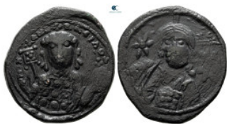
1491 Michael VII Doukas AD 1071-1078. Constantinople Follis Æ 27 mm, 6,47 g very f ine 10