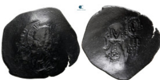
1528 Alexius III Angelus-Comnenus AD 1195-1203. Constantinople Trachy Æ 26 mm, 2,70 g nearly very fine 10