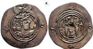
513 Sasanian Kingdom. Khusro II AD 591-628. Drachm AR 31 mm, 3,97 g very fine 10