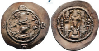
483 Sasanian Kingdom. Khusro I AD 531-579. Drachm AR 32 mm, 4,01 g very fine 10