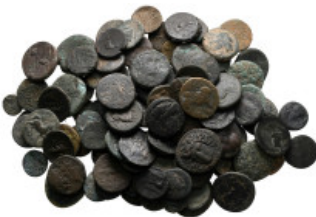
1708 Lot of ca. 106 greek bronze coins / SOLD AS SEEN, NO RETURN! nearly very fine 10