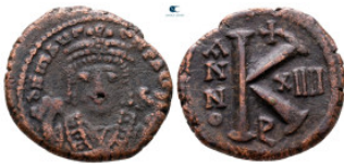
1302 Maurice Tiberius AD 582-602. Theoupolis (Antioch) Half Follis or 20 Nummi Æ 22 mm, 5,87 g nearly very fine From the Tareq Hani collection 10