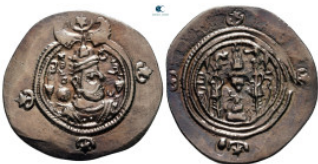
504 Sasanian Kingdom. Khusro II AD 591-628. Drachm AR 30 mm, 4,09 g very fine 10