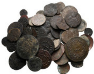
1738 Lot of ca. 85 islamic bronze coins / SOLD AS SEEN, NO RETURN! very fine 10