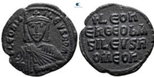
1438 Leo VI the Wise AD 886-912. Constantinople Follis Æ 27 mm, 5,56 g very fine 10