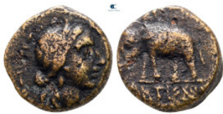
383 Seleukid Kingdom. Antioch. Antiochos III Megas 223-187 BC. Bronze Æ 13 mm, 3,02 g nearly very fine 10