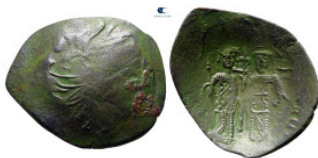
1533 Latin Rulers of Constantinople AD 1204-1261. Constantinople Trachy Æ 23 mm, 1,36 g nearly very fine 10