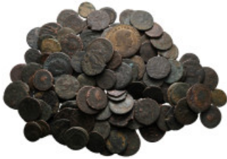
1722 Lot of ca. 130 late roman bronze coins / SOLD AS SEEN, NO RETURN! fine 10