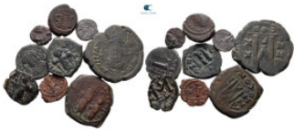
1733 Lot of ca. 9 byzantine bronze coins / SOLD AS SEEN, NO RETURN! very fine 10