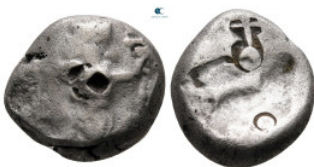
463 Persia. Achaemenid Empire. Sardeis. Time of Artaxerxes III to Darios III 350-333 BC. Siglos AR 16 mm, 5,19 g fine 10