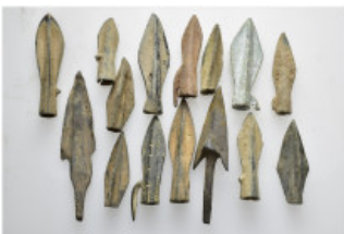
640 Arrowhead lot 15 pieces SOLD AS SEEN NO RETURNS.