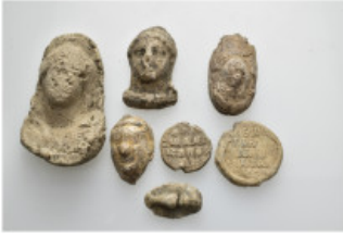
635 Mixed lot 7 pieces SOLD AS SEEN NO RETURNS.