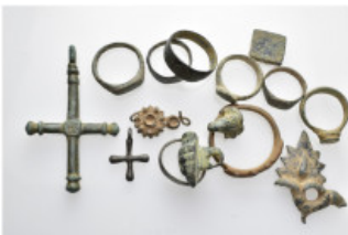
647 Mixed lot pieces SOLD AS SEEN NO RETURNS.