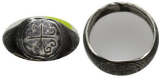
612 Silver ring with round bezel engraved with scrolling coma pattern and equal-armed cross to the centre. 10mm. 2.12 gr. 4