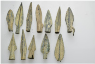
636 Arrowhead lot 12 pieces SOLD AS SEEN NO RETURNS.