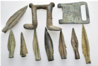
646 Mixed lot 10 pieces SOLD AS SEEN NO RETURNS.