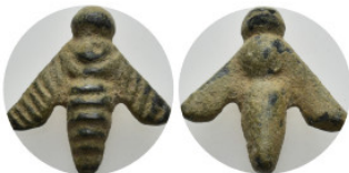
614 Bronze object (eagle?) 23mm, 7.00 gr 4