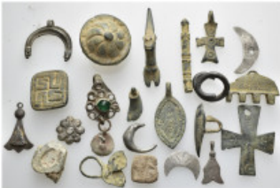
637 Mixed lot SOLD AS SEEN NO RETURNS.