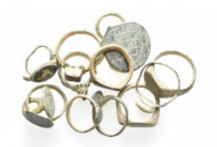
638 Mixed lot SOLD AS SEEN NO RETURNS.