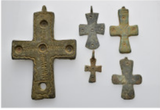
641 Cross lot 5 pieces SOLD AS SEEN NO RETURNS.