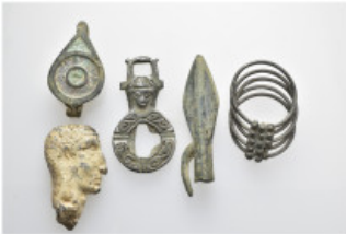
644 Mixed lot 5 pieces SOLD AS SEEN NO RETURNS.