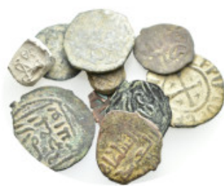
639 Mixed lot SOLD AS SEEN NO RETURNS.