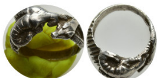
621 Silver ring with ram skull and serpent?. 20mm, 6.20 gr. 4