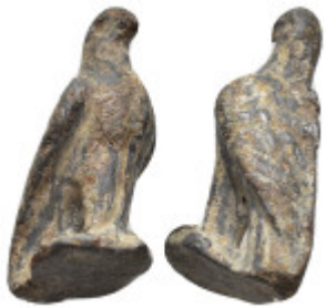
940 Roman Eagle Statuette 1st-2nd century AD. 25mm, 12.76 gr.