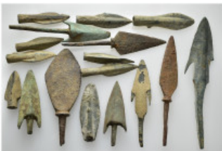
948 Arrowhead lot SOLD AS SEEN NO RETURNS.