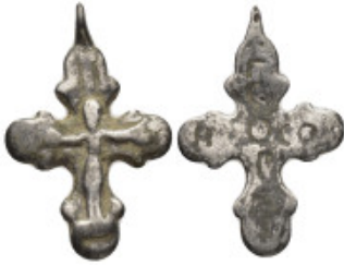
946 Cross Pendant with Corpus Christi. 32mm, 4.13 gr.