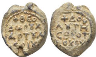
851 Byzantine Lead Seal (22mm, 14.79 g) Obv: Legend four lines. Rev: Legend four lines. 5