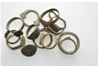
950 Finger ring lot SOLD AS SEEN NO RETURNS.