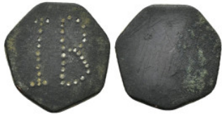
947 Byzantine Commercial Weight - AE 2 Scripula (ca. 5th century AD.) - IB / Blank (16mm, 2.21 g)