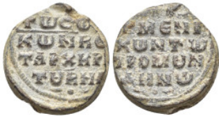
850 Byzantine Lead Seal (21mm, 10.51 g) Obv: Legend four lines. Rev: Legend four lines. 5