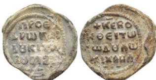
855 Byzantine Lead Seal (22mm, 10.66 g) Obv: Legend four lines. Rev: Legend four lines. 5