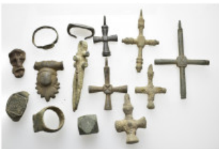
949 Mixed lot SOLD AS SEEN NO RETURNS.