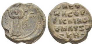
854 BYZANTINE LEAD SEAL. (21mm, 9.14 g) Obv: MP - ΘV. The Theotokos (Virgin Mary) standing facing on dais, orans; nimbate head of christ on breast. Rev: Legend in 5 lines. 5