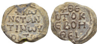
852 Byzantine Lead Seal (19mm, 12.00 g) Obv: Legend four lines. Rev: Legend four lines. 5