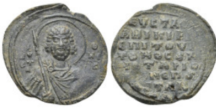
849 Byzantine Lead Seal (29mm, 10.00 g). Nimbate facing bust of Saint, holding spear over his right shoulder and resting shield on his left arm. Rev. Legend in six lines. 5