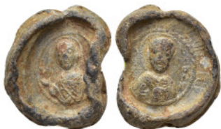
853 Byzantine Lead Seal (16mm, 8.41 g) Obv: Facing bust of the Virgin Mary, orans. Rev: Facing bust of St. Nikolaos, raising hand in benediction and holding Gospels. 5