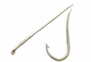
942 Roman Silver Medical Spoon and Fishing Hook. 7.70 gr.