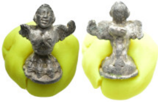
939 Silver sphinx seated. 28mm, 17.50 gr.