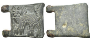
944 Medieval Belt Buckle with Lion. 12th-13th century AD. Bronze buckle plate with a reserved low-relief profile lion in advancing pose. 23mm, 7.15 gr.