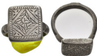
943 A silver finger ring with square bezel, linear border. 20mm, 12.65 gr.