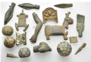
951 Mixed lot SOLD AS SEEN NO RETURNS.