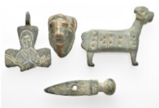
945 Mixed lot 4 piece SOLD AS SEEN NO RETURNS.