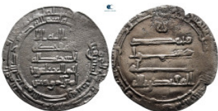
2464 Abbasid Caliphate. . Dirham AR 25 mm, 3,43 g very fine From the Tareq Hani collection 10