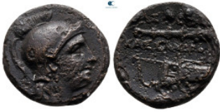
185 Kings of Macedon. Uncertain mint. Kassander 306-297 BC. Bronze Æ 17 mm, 3,13 g very fine 10