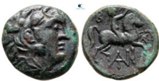
187 Kings of Macedon. Uncertain mint. Antigonos II Gonatas 277-239 BC. Bronze Æ 18 mm, 4,83 g very fine 10