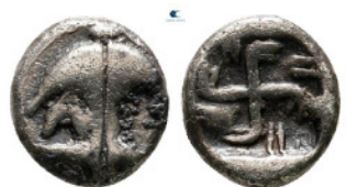
190 Thrace. Apollonia Pontica circa 540-530 BC. Hemiobol AR 7 mm, 0,43 g very fine 10