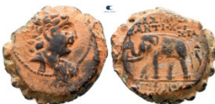
643 Seleukid Kingdom. Antioch on the Orontes. Antiochos VI Dionysos 144-142 BC. Serrate Æ 22 mm, 7,37 g nearly very fine 10