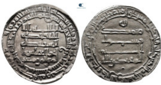
2460 Abbasid Caliphate. . Dirham AR 27 mm, 2,70 g very fine From the Tareq Hani collection 10