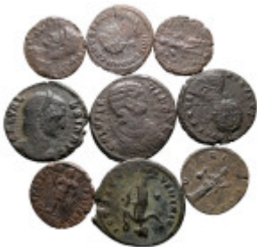
2865 Lot of ca. 9 late roman bronze coins / SOLD AS SEEN, NO RETURN! very fine 10