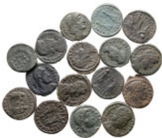
2864 Lot of ca. 16 late roman bronze coins / SOLD AS SEEN, NO RETURN! very fine 10