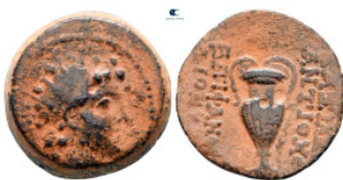
641 Seleukid Kingdom. Antioch on the Orontes. Antiochos VI Dionysos 144-142 BC. Bronze Æ 20 mm, 8,36 g nearly very fine 10