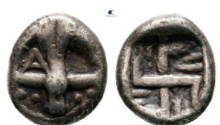
192 Thrace. Apollonia Pontica circa 540-530 BC. Hemiobol AR 7 mm, 0,39 g very fine 10