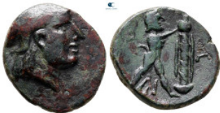
186 Kings of Macedon. Uncertain mint. Antigonos II Gonatas 277-239 BC. Bronze Æ 18 mm, 3,12 g very fine 10