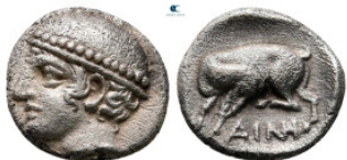
189 Thrace. Ainos circa 421-419 BC. Diobol AR 11 mm, 1,11 g very fine 10