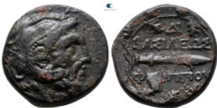
188 Kings of Macedon. Uncertain mint. Philip V 221-179 BC. Bronze Æ 21 mm, 8,34 g very fine 10