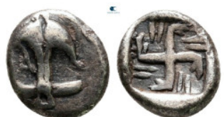
191 Thrace. Apollonia Pontica circa 540-530 BC. Hemiobol AR 8 mm, 0,53 g very fine 10