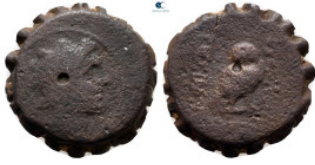
636 Seleukid Kingdom. Antioch on the Orontes. Alexander I Balas 152-145 BC. Serrate Æ 15 mm, 3,57 g fine 10