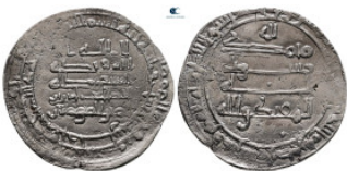
2462 Abbasid Caliphate. . Dirham AR 26 mm, 2,91 g very fine From the Tareq Hani collection 10