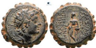
642 Seleukid Kingdom. Antioch on the Orontes. Antiochos VI Dionysos 144-142 BC. Serrate Æ 21 mm, 9,22 g very fine From the Tareq Hani collection 10