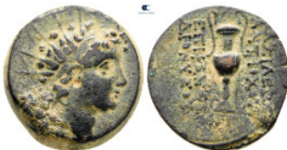
640 Seleukid Kingdom. Antioch on the Orontes. Antiochos VI Dionysos 144-142 BC. Bronze Æ 21 mm, 8,20 g very fine From the Tareq Hani collection 10