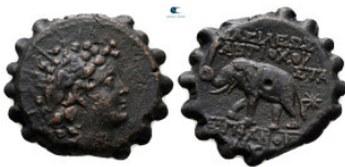
639 Seleukid Kingdom. Antioch. Antiochos VI Dionysos 144-142 BC. Serrate Æ 22 mm, 7,23 g very fine 10