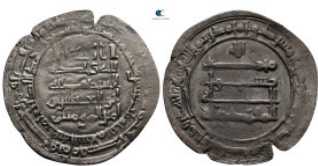
2463 Abbasid Caliphate. . Dirham AR 26 mm, 2,36 g very fine From the Tareq Hani collection 10