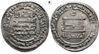
2458 Abbasid Caliphate. . Dirham AR 27 mm, 2,59 g very fine From the Tareq Hani collection 10