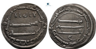
2465 Abbasid Caliphate. . Dirham AR 25 mm, 2,44 g very fine From the Tareq Hani collection 10