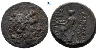
638 Seleukid Kingdom. Antioch on the Orontes. Demetrios II Nikator, 1st reign 146-138 BC. Bronze Æ 23 mm, 11,64 g very fine 10