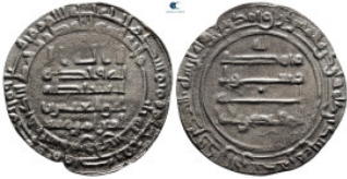
2459 Abbasid Caliphate. . Dirham AR 26 mm, 2,55 g very fine From the Tareq Hani collection 10