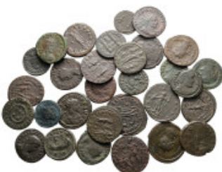
2866 Lot of ca. 30 late roman bronze coins / SOLD AS SEEN, NO RETURN! very fine 10