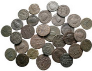
2863 Lot of ca. 30 late roman bronze coins / SOLD AS SEEN, NO RETURN! very fine 10