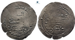
2461 Abbasid Caliphate. . Dirham AR 27 mm, 2,90 g fine From the Tareq Hani collection 10