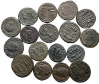
2862 Lot of ca. 17 late roman bronze coins / SOLD AS SEEN, NO RETURN! very fine 10