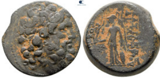
637 Seleukid Kingdom. Antioch on the Orontes. Demetrios II Nikator, 1st reign 146-138 BC. Bronze Æ 23 mm, 13,52 g very fine 10