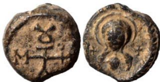
514 Byzantine lead seal. Uncertain, circa 6-7th century (lead, 4.72 g, 15 mm). Facing bust of the Virgin Mary, with Christ medallion on breast. Rev. Cruciform monogram. Good fine. 10