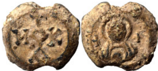
511 Byzantine lead seal. Uncertain, circa 6-7th century (lead, 9.20 g, 20 mm). Facing bust of the Virgin Mary, with Christ medallion on breast. Rev. Cruciform monogram. Good fine. 7