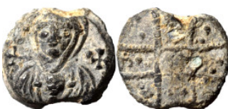
515 Byzantine lead seal (lead, 5.54 g, 16 mm). Facing bust of the Virgin Mary, with Christ medallion on breast. Rev. Cross. Nearly very fine. 10