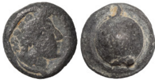
510 Lead seal, uncertain (lead, 12.55 g, 18 mm). Female bust right. Rev. Blank. Nearly very fine. 5