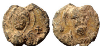
517 Byzantine lead seal (lead, 6.52 g, 19 mm). Fine. 10