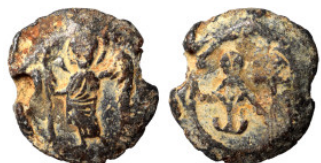
516 Byzantine lead seal (lead, 5.86 g, 19 mm). Saint standing, facing. Rev. Cruciform monogram. Nearly very fine. 10