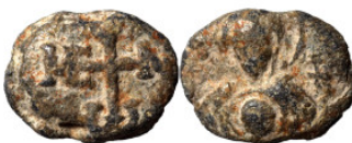
513 Byzantine lead seal. Uncertain, circa 6-7th century (lead, 5.14 g, 18 mm). Facing bust of the Virgin Mary, with Christ medallion on breast. Rev. Cruciform monogram. Good fine. 7