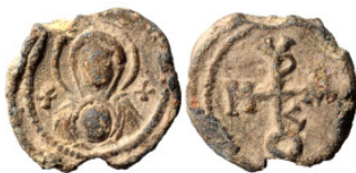
512 Byzantine lead seal. Uncertain, circa 6-7th century (lead, 9.30 g, 21 mm). Facing bust of the Virgin Mary, with Christ medallion on breast. Rev. Cruciform monogram. Nearly very fine. 10