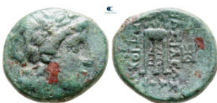
685 Seleukid Kingdom. Sardeis. Antiochos II Theos 261-246 BC. Bronze Æ 17 mm, 4,13 g very fine 10