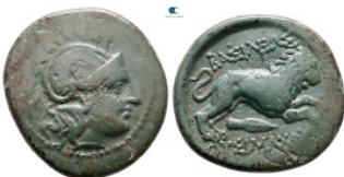
196 Kings of Thrace. Uncertain mint. Macedonian. Lysimachos 305-281 BC. Bronze Æ 21 mm, 4,84 g very fine 10