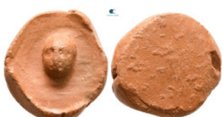
2132 . Clay Tessera 22 mm, 2,32 g very fine