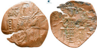
2046 Latin Rulers of Constantinople AD 1204-1261. Constantinople Trachy Æ 22 mm, 1,12 g very fine 10