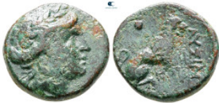
154 The Thracian Chersonese. Lysimacheia circa 309-220 BC. Bronze Æ 19 mm, 5,8 g very fine 10