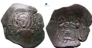
2053 Latin Rulers of Constantinople AD 1204-1261. Constantinople Trachy Æ 28 mm, 3,40 g very fine 10