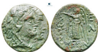
160 The Thracian Chersonese. Lysimacheia circa 309-220 BC. Bronze Æ 17 mm, 2,9 g very fine 10