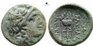
686 Seleukid Kingdom. Sardeis. Antiochos II Theos 261-246 BC. Bronze Æ 17 mm, 4,11 g very fine 10