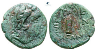
151 The Thracian Chersonese. Lysimacheia circa 309-220 BC. Bronze Æ 17 mm, 3,76 g very fine 10