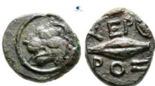
136 The Thracian Chersonese. Chersonesos circa 309-220 BC. Bronze Æ 11 mm, 1,28 g very fine 10