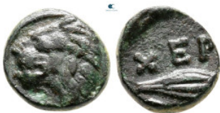
140 The Thracian Chersonese. Chersonesos circa 309-220 BC. Bronze Æ 10 mm, 1,20 g very fine 10