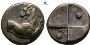
133 The Thracian Chersonese. Chersonesos circa 386-338 BC. Hemidrachm AR 13 mm, 2,47 g very fine 10