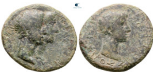
199 Kings of Thrace. Rhoemetalkes I and Pythodoris, with Augustus 11 BC-AD 12. Bronze Æ 23 mm, 6,49 g fine 10