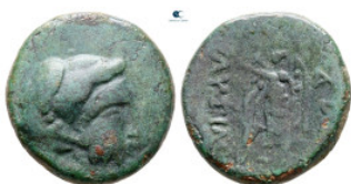
158 The Thracian Chersonese. Lysimacheia circa 309-220 BC. Bronze Æ 16 mm, 3,7 g nearly very fine 10