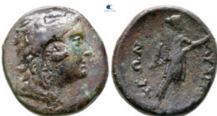
148 The Thracian Chersonese. Lysimacheia circa 309-220 BC. Bronze Æ 24 mm, 9,49 g very fine 10