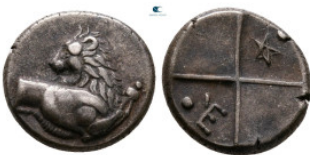
132 The Thracian Chersonese. Chersonesos circa 386-338 BC. Hemidrachm AR 13 mm, 2,35 g very fine 10