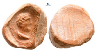
2128 . Clay Tessera 19 mm, 2,08 g very fine