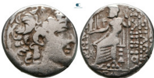
715 Seleukid Kingdom. Antioch on the Orontes. Philip I Philadelphos 95-75 BC. Tetradrachm AR 26 mm, 13,66 g fine 10