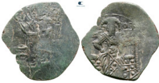
2047 Latin Rulers of Constantinople AD 1204-1261. Constantinople Trachy Æ 24 mm, 1,43 g very fine 10