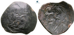
2066 Michael VIII Palaeologus AD 1261-1282. Constantinople Trachy Æ 25 mm, 2,92 g very fine 10