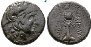
193 Kings of Thrace. Uncertain mint. Macedonian. Lysimachos 305-281 BC. Bronze Æ 19 mm, 6,49 g nearly very fine 10