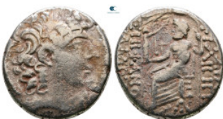
718 Seleukid Kingdom. Antioch on the Orontes. Philip I Philadelphos 95-75 BC. Tetradrachm AR 27 mm, 13,67 g fine 10