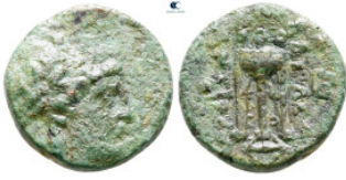
680 Seleukid Kingdom. Sardeis. Antiochos II Theos 261-246 BC. Bronze Æ 17 mm, 3,42 g very fine 10