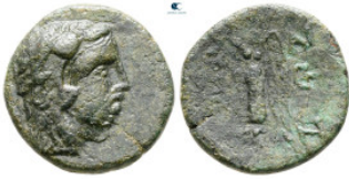
146 The Thracian Chersonese. Lysimacheia circa 309-220 BC. Bronze Æ 18 mm, 4,11 g very fine 10