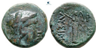
156 The Thracian Chersonese. Lysimacheia circa 309-220 BC. Bronze Æ 16 mm, 4,1 g very fine 10