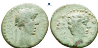
200 Kings of Thrace. Rhoemetalkes I with Augustus 11 BC-AD 12. Bronze Æ 20 mm, 2,99 g nearly very fine 10