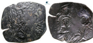
2067 Michael VIII Palaeologus AD 1261-1282. Constantinople Trachy Æ 26 mm, 2,40 g very fine 10