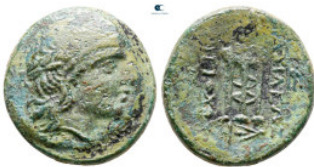
684 Seleukid Kingdom. Sardeis. Antiochos II Theos 261-246 BC. Bronze Æ mm, 3,91 g very fine 10