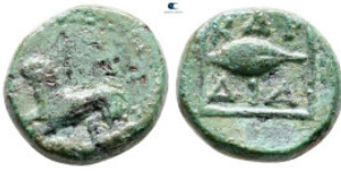
129 The Thracian Chersonese. Cardia circa 309-220 BC. Bronze Æ 12 mm, 2,16 g very fine 10