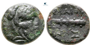
198 Kings of Thrace. Seleukid. Adaios 253-243 BC. Bronze Æ 17 mm, 5,72 g very fine 10