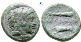
63 Kings of Macedon. Uncertain mint. Alexander III "the Great" 336-323 BC. Bronze Æ 18 mm, 6,17 g fine 10