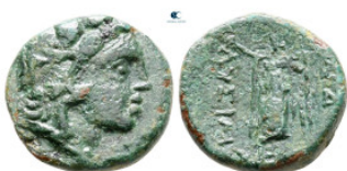
159 The Thracian Chersonese. Lysimacheia circa 309-220 BC. Bronze Æ 16 mm, 4,0 g very fine 10