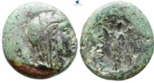
153 The Thracian Chersonese. Lysimacheia circa 309-220 BC. Bronze Æ 21 mm, 7,3 g very fine 10