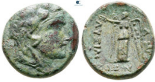
145 The Thracian Chersonese. Lysimacheia circa 309-220 BC. Bronze Æ 17 mm, 4,2 g very fine 10