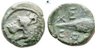
137 The Thracian Chersonese. Chersonesos circa 309-220 BC. Bronze Æ 11 mm, 1,17 g very fine 10