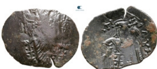
2052 Latin Rulers of Constantinople AD 1204-1261. Constantinople Trachy Æ 25 mm, 1,96 g very fine 10