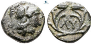
161 The Thracian Chersonese. Lysimacheia circa 309-220 BC. Bronze Æ 11 mm, 1,09 g very fine 10