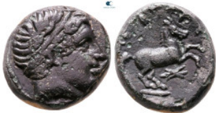
58 Kings of Macedon. Uncertain mint. Alexander III "the Great" 336-323 BC. Bronze Æ 15 mm, 3,90 g very fine 10