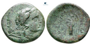
155 The Thracian Chersonese. Lysimacheia circa 309-220 BC. Bronze Æ 21 mm, 4,5 g nearly very fine 10