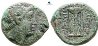
683 Seleukid Kingdom. Sardeis. Antiochos II Theos 261-246 BC. Bronze Æ 20 mm, 7,73 g very fine 10