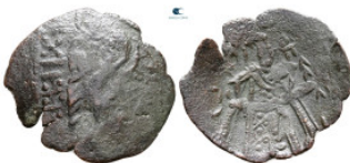
2068 Michael VIII Palaeologus AD 1261-1282. Constantinople Trachy Æ 24 mm, 1,94 g nearly very fine 10