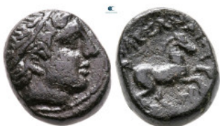
61 Kings of Macedon. Uncertain mint. Alexander III "the Great" 336-323 BC. Bronze Æ 15 mm, 4,87 g very fine 10