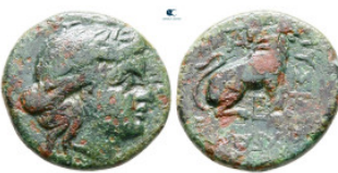
144 The Thracian Chersonese. Lysimacheia circa 309-220 BC. Bronze Æ 18 mm, 4,67 g very fine 10