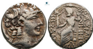
716 Seleukid Kingdom. Antioch on the Orontes. Philip I Philadelphos 95-75 BC. Tetradrachm AR 26 mm, 14,55 g nearly very fine 10