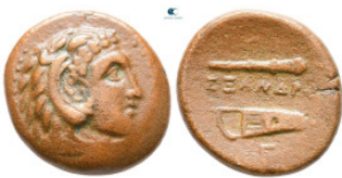
59 Kings of Macedon. Uncertain mint. Alexander III "the Great" 336-323 BC. Bronze Æ 18 mm, 5,67 g very fine 10