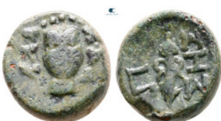
168 The Thracian Chersonese. Sestos circa 300 BC. Bronze Æ 12 mm, 2,79 g very fine 10