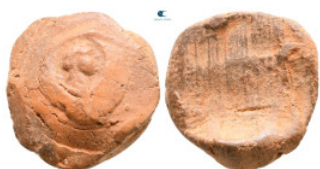
2129 . Clay Tessera 18 mm, 1,62 g very fine