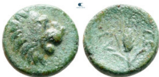
165 The Thracian Chersonese. Lysimacheia circa 309-220 BC. Bronze Æ 10 mm, 0,98 g nearly very fine 10