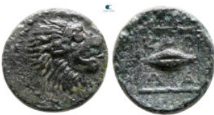
131 The Thracian Chersonese. Cardia circa 309-220 BC. Bronze Æ 13 mm, 2,25 g very fine 10