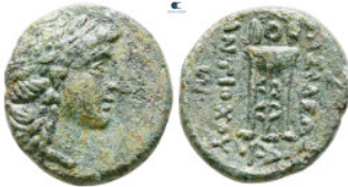
681 Seleukid Kingdom. Sardeis. Antiochos II Theos 261-246 BC. Bronze Æ 17 mm, 4,04 g very fine 10