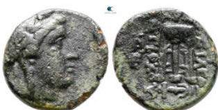
687 Seleukid Kingdom. Sardeis. Antiochos II Theos 261-246 BC. Bronze Æ 16 mm, 3,40 g very fine 10