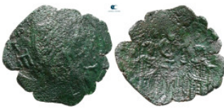
2064 Michael VIII Palaeologus AD 1261-1282. Constantinople Trachy Æ 24 mm, 2,16 g fine 10