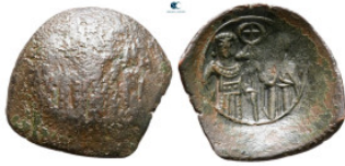
2062 John Comnenus-Ducas AD 1237-1242. Thessalonica Trachy Æ 15 mm, 0,74 g n early very fine 10