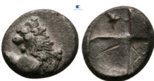
134 The Thracian Chersonese. Chersonesos circa 386-338 BC. Hemidrachm AR 13 mm, 2,10 g very fine 10