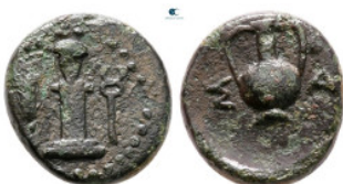
167 The Thracian Chersonese. Sestos circa 300 BC. Bronze Æ 12 mm, 1,78 g very fine 10