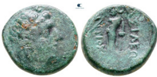
682 Seleukid Kingdom. Sardeis. Antiochos II Theos 261-246 BC. Bronze Æ 16 mm, 3,71 g nearly very fine 10