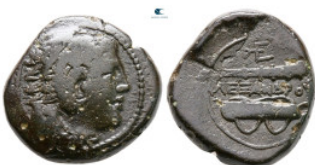
62 Kings of Macedon. Uncertain mint. Alexander III "the Great" 336-323 BC. Bronze Æ 20 mm, 8,25 g very fine 10