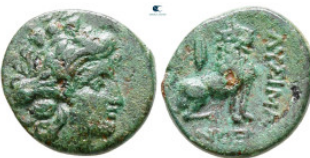
143 The Thracian Chersonese. Lysimacheia circa 309-220 BC. Bronze Æ 19 mm, 4,75 g very fine 10