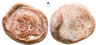
2127 . Clay Tessera 18 mm, 2,14 g very fine