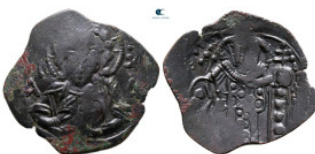
2069 Michael VIII Palaeologus AD 1261-1282. Constantinople Trachy Æ 26 mm, 2,15 g very fine 10