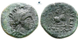
163 The Thracian Chersonese. Lysimacheia circa 309-220 BC. Bronze Æ 13 mm, 1,86 g very fine 10