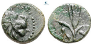
164 The Thracian Chersonese. Lysimacheia circa 309-220 BC. Bronze Æ 10 mm, 1,00 g very fine 10