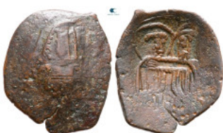
2051 Latin Rulers of Constantinople AD 1204-1261. Constantinople Trachy Æ 20 mm, 1,50 g nearly very fine 10