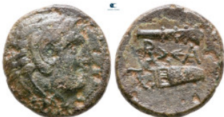
60 Kings of Macedon. Uncertain mint. Alexander III "the Great" 336-323 BC. Bronze Æ 17 mm, 4,07 g very fine 10