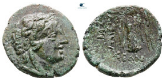
157 The Thracian Chersonese. Lysimacheia circa 309-220 BC. Bronze Æ 20 mm, 3,5 g very fine 10