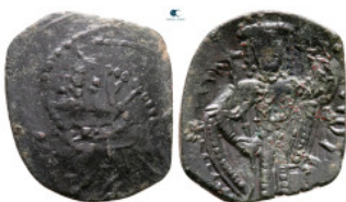
2050 Latin Rulers of Constantinople AD 1204-1261. Constantinople Trachy Æ 21 mm, 1,75 g very fine 10