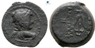
713 Seleukid Kingdom. Antioch on the Orontes. Alexander II Zabinas 128-122 BC. Bronze Æ 15 mm, 3,24 g nearly very fine 10