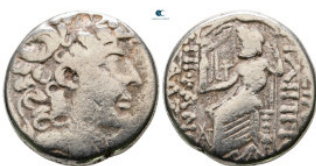
717 Seleukid Kingdom. Antioch on the Orontes. Philip I Philadelphos 95-75 BC. Tetradrachm AR 25 mm, 13,79 g fine 10