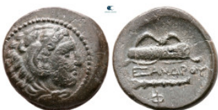
64 Kings of Macedon. Uncertain mint. Alexander III "the Great" 336-323 BC. Bronze Æ 19 mm, 4,83 g very fine 10