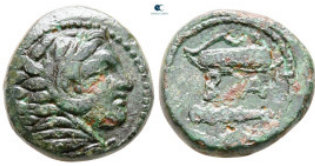
57 Kings of Macedon. Uncertain mint. Alexander III "the Great" 336-323 BC. Bronze Æ 18 mm, 6,21 g very fine 10