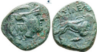
194 Kings of Thrace. Uncertain mint. Macedonian. Lysimachos 305-281 BC. Bronze Æ 19 mm, 4,77 g very fine 10