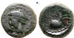
166 The Thracian Chersonese. Sestos circa 300 BC. Bronze Æ 12 mm, 2,78 g nearly very fine 10