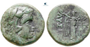
142 The Thracian Chersonese. Lysimacheia circa 309-220 BC. Bronze Æ 16 mm, 3,79 g very fine 10