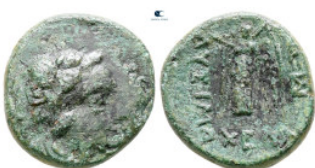
152 The Thracian Chersonese. Lysimacheia circa 309-220 BC. Bronze Æ 18 mm, 4,46 g very fine 10