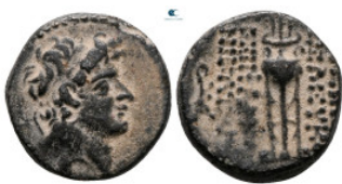
714 Seleukid Kingdom. Antioch on the Orontes. Seleukos VI Epiphanes Nikator 96-94 BC. Bronze Æ 16 mm, 4,25 g very fine 10