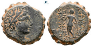
712 Seleukid Kingdom. Antioch on the Orontes. Antiochos VI Dionysos 144-142 BC. Bronze Æ 21 mm, 8,85 g nearly very fine 10