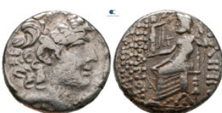
719 Seleukid Kingdom. Antioch on the Orontes. Philip I Philadelphos 95-75 BC. Tetradrachm AR 25 mm, 14,09 g nearly very fine 10