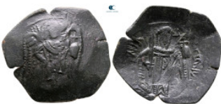
2049 Latin Rulers of Constantinople AD 1204-1261. Constantinople Trachy Æ 29 mm, 3,44 g very fine 10