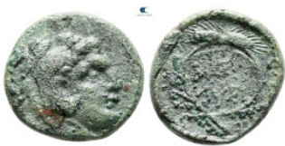
195 Kings of Thrace. Uncertain mint. Macedonian. Lysimachos 305-281 BC. Bronze Æ 15 mm, 2,77 g very fine 10