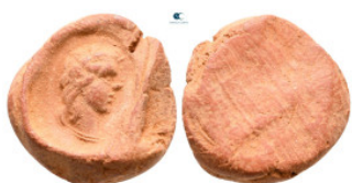
2131 . Clay Tessera 17 mm, 1,17 g very fine