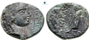
141 The Thracian Chersonese. Lysimacheia circa 309-220 BC. Bronze Æ 17 mm, 2,60 g very fine 10