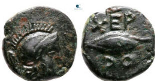
135 The Thracian Chersonese. Chersonesos circa 309-200 BC. Bronze Æ 11 mm, 1,39 g very fine 10