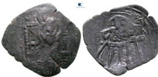
2065 Michael VIII Palaeologus AD 1261-1282. Constantinople Trachy Æ 26 mm, 2,24 g nearly very fine 10