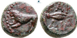
130 The Thracian Chersonese. Cardia circa 309-220 BC. Bronze Æ 11 mm, 1,82 g very fine 10