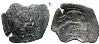
2048 Latin Rulers of Constantinople AD 1204-1261. Constantinople Trachy Æ 21 mm, 1,48 g very fine 10