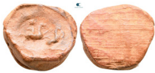
2126 . Clay Tessera 18 mm, 1,70 g very fine