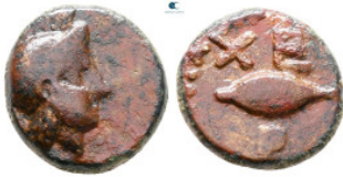
138 The Thracian Chersonese. Chersonesos circa 309-220 BC. Bronze Æ 11 mm, 1,31 g very fine 10