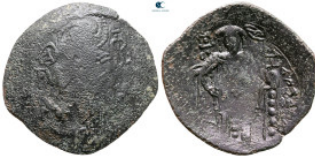
2063 Theodore II Ducas-Lascaris. Emperor of Nicaea AD 1254-1258. Magnesia Trachy Æ 28 mm, 2,66 g fine 10