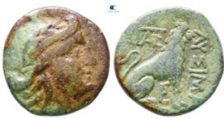
147 The Thracian Chersonese. Lysimacheia circa 309-220 BC. Bronze Æ 17 mm, 3,81 g very fine 10