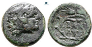
197 Kings of Thrace. Uncertain mint. Macedonian. Lysimachos 305-281 BC. Bronze Æ 13 mm, 1,97 g very fine 10