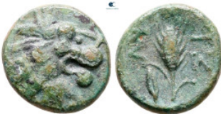
162 The Thracian Chersonese. Lysimacheia circa 309-220 BC. Bronze Æ 14 mm, 2,65 g very fine 10