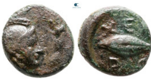
139 The Thracian Chersonese. Chersonesos circa 309-220 BC. Bronze Æ 11 mm, 1,42 g very fine 10