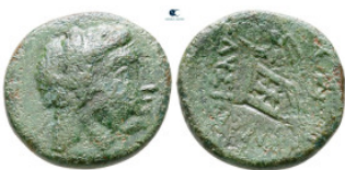
149 The Thracian Chersonese. Lysimacheia circa 309-220 BC. Bronze Æ 18 mm, 4,20 g nearly very fine 10