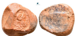
2130 . Clay Tessera 17 mm, 1,50 g very fine