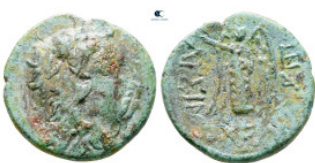
150 The Thracian Chersonese. Lysimacheia circa 309-220 BC. Bronze Æ 18 mm, 3,26 g very fine 10