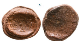
2133 . Clay Tessera 18 mm, 1,46 g very fine