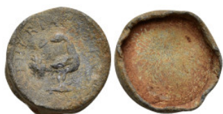
750 Bottle Cap (3.84 Gr. 24mm.)