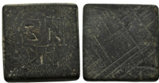
763 Byzantine Empire Unciae Weight. AE. (26.9 Gr.24mm.)