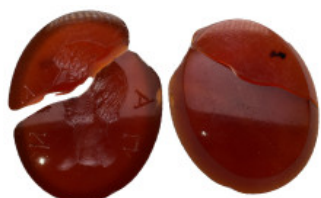
753 Ring stone intaglio. Bust of a male facing left, lightly bearded. 22mm,2.5 g