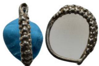
752 Silver earring 17mm, 1.6 gr.