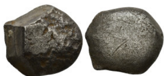
747 Silver Particle (22.23 Gr. 22mm.)