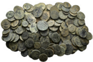
766 Mixed lot 200 pieces SOLD AS SEEN NO RETURNS.