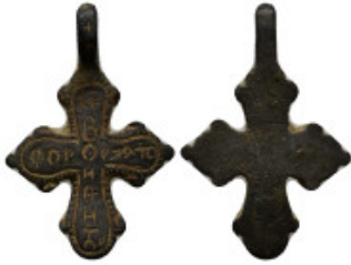
761 Byzantine Cross Pendant. AE (4 Gr. 30mm.)