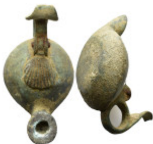
751 ROMAN EMPIRE. Roman bronze oil lamp 268.88 Gr. 101mm.