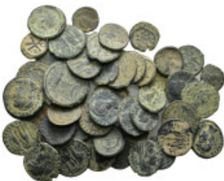
767 Mixed lot 50 pieces SOLD AS SEEN NO RETURNS.