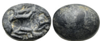
749 Uncertain Antiques. Probably ring stone with horse (10 Gr.25mm.)