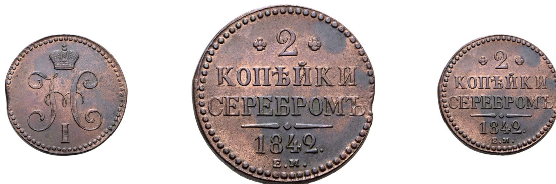
563. Russia, Empire. Nicholas I CU 2 Kopeck. Ekaterinburg mint, 1842. Crowned monogram / Denomination above date; E.M. below. Bitkin 553. 23.18g, 32mm, 12h.

From the GK Collection (France) of Russian Coins.