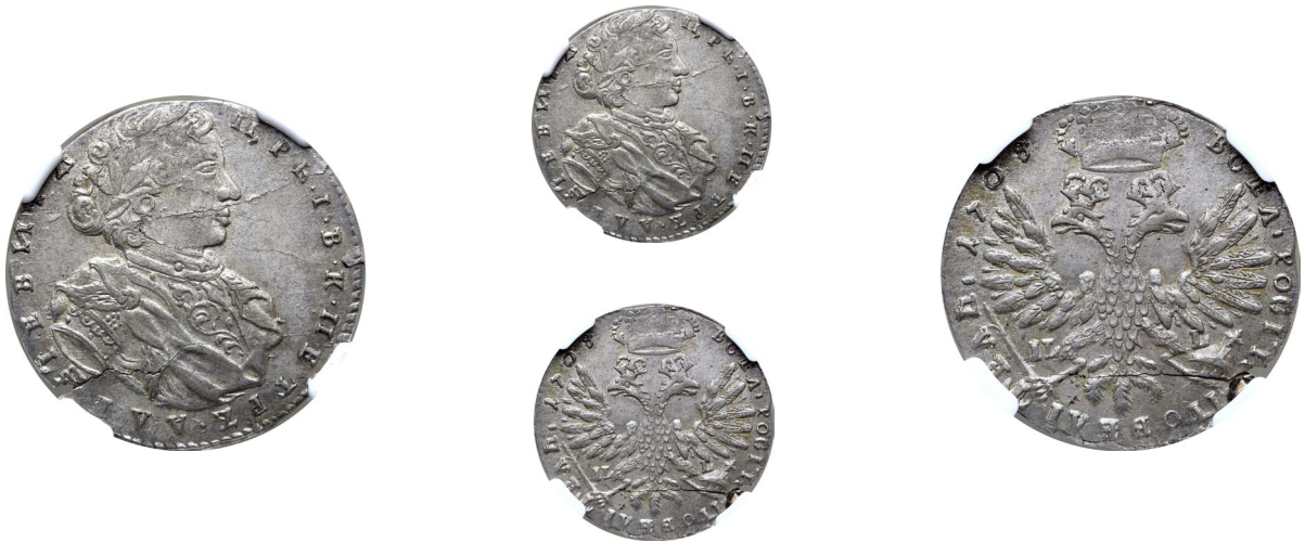
12. Russia, Tsardom. Peter I 'the Great' AR Tynf (12 Kopeck). Kadashevsky mint, 1708. Struck using the Polish-Lithuanian monetary system. ЦРЬ • І • В • К • ПЕТРЪ • АЛЕЪІЕВИЧЪ, laureate and draped bust to right / ВСЕА • РОСІИ • ПОВЕЛІТЕЛЪ • (date), crowned double-headed eagle facing, holding sceptre and orb; crown above, IL-L across lower fields. Bitkin 3822. 6.23g.

From the GK Collection (France) of Russian Coins.