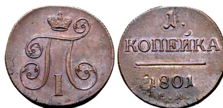
417. Russia, Empire. Paul I CU Kopeck. Ekaterinburg mint, 1801. Crowned monogram / Denomination over date; Е.М. below. Bitkin 125. 10.76g, 27mm, 12h.

From the GK Collection (France) of Russian Coins.