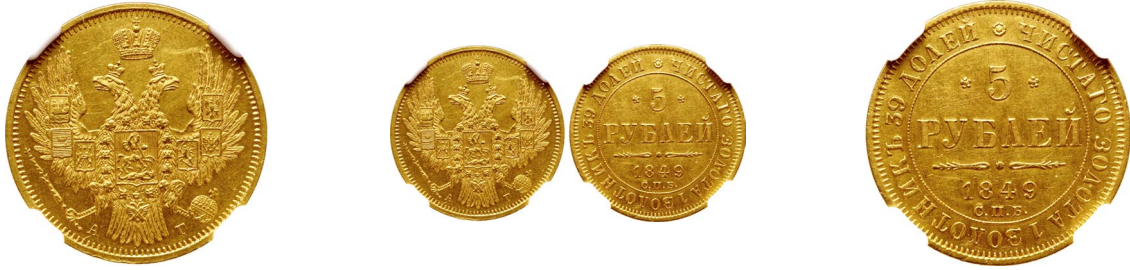
582. Russia, Empire. Nicholas I AV 5 Rouble. St. Petersburg mint, 1849. Alexander Gertov, mintmaster. Crowned double-headed imperial eagle facing, wearing shield on breast depicting St. George slaying the dragon, with shields arranged across wings, and holding sceptre and orb; crown above, А-Г across fields below / * ЧИСТАГО ЗОЛЮТА 1 ЗОЛЮТНИКЪ 39 ДОЛЕЙ, denomination above date, С.П.Б. below, two flowers across upper fields. Bitkin 31. 6.51g, 23mm, 12h.

NGC graded UNC Details, cleaned (6672949-006).