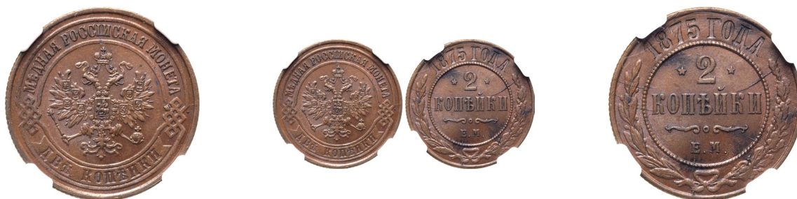
685. Russia, Empire. Alexander II CU 2 Kopeck. Ekaterinburg mint, 1875. Crowned double-headed eagle facing with wings spread, wearing shield on breast depicting St. George slaying the dragon, with shields arranged across wings, and holding sceptre and orb; crown with ribbons above, МѢДНАЯ РОССИЙСКАЯ МОНЕТА and denomination in ornamented banner around / Denomination above Е.М., surrounded by inner circle of pellets; date above and wreath around. Bitkin 420.

From the GK Collection (France) of Russian Coins.