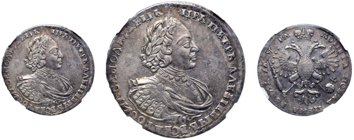
61. Russia, Empire. Peter I 'the Great' AR Rouble. Kadashevsky mint, 1721. ЦРЬ • ПЕТРЪ • АЛЕЖІЕВИЧЪ • ВСЕА • РОСИИ • САМОДЕРЖЕЦЪ, laureate, draped and cuirassed bust to right / МОНЕТА НОВАА ЦЕНА РҮБЛЬ (date), crowned double-headed eagle facing, holding sceptre and orb; crown above. Bitkin 440. 27.27g.

NGC graded AU Details, cleaned (#6322207-012). Beautiful cabinet tone.