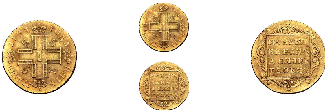
403. Russia, Empire. Paul I AV 5 Rouble. St. Petersburg mint, 1798. Fedor Cetreus, mintmaster. Crowned cruciform monogram; denomination and date around / НЕ НАМЪ НЕ НАМЪ А ИМЯНИ ТВОЕМУ. in four lines above С•М•Ф•Ц within ornated square cartouche. Bitkin 1. 6.10g, 23mm, 12h.