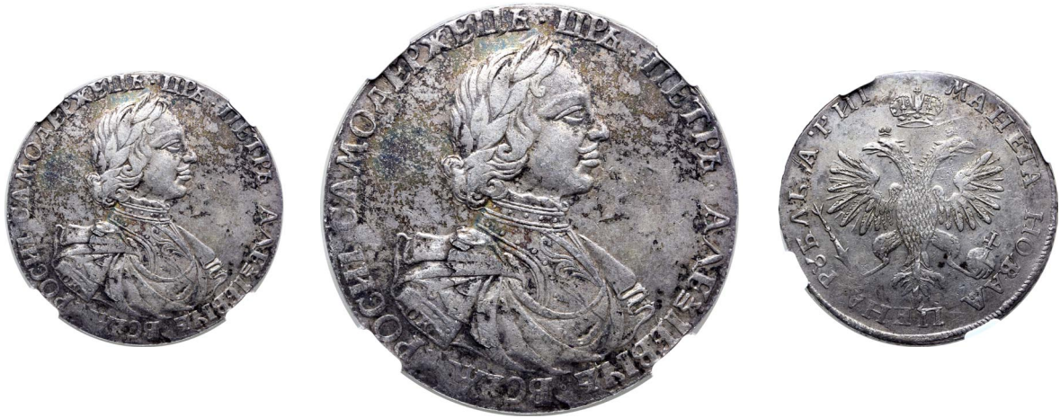
37. Russia, Tsardom. Peter I 'the Great' AR Rouble. Kadashevsky mint, 1718. ЦРЬ • ПЕТРЪ • АЛЕЖЕВИЧЪ • ВСЕА • РОСИИ • САМОДЕРЖЕЦЪ, laureate, draped and cuirassed bust to right; ОК on bust truncation / МАНЕТА НОВАА ЦЕНА РЎБЛЬ (date), crowned double-headed eagle facing, holding sceptre and orb; Bitkin 237. 27.83g.

NGC graded AU Details, cleaned (#6322208-003). Pleasant light cabinet tone. Rare; only a dozen or so other examples on CoinArchives.