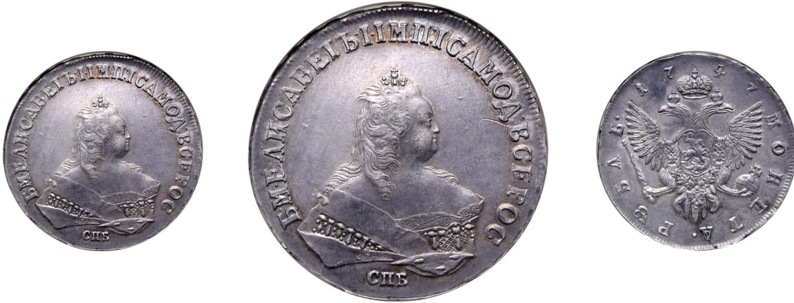
163. Russia, Empire. Elizabeth AR Rouble. St. Petersburg mint, 1747. Б • М • ЕЛИСАВЕТЪ • I • ИМП : I САМОД : ВСЕРОС, crowned and draped bust to right; С ПБ below / Crowned double-headed eagle facing with wings spread, wearing shield on breast depicting St. George slaying the dragon, and holding sceptre and orb; crown above, denomination and date around. Bitkin 262.

From the GK Collection (France) of Russian Coins.