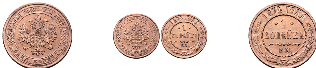
684. Russia, Empire. Alexander II CU Kopeck. Ekaterinburg mint, 1874. Crowned double-headed eagle facing with wings spread, wearing shield on breast depicting St. George slaying the dragon, with shields arranged across wings, and holding sceptre and orb; crown with ribbons above, МѢДНАЯ РОССИЙСКАЯ МОНЕТА and denomination in ornamented banner around / Denomination above Е.М., surrounded by inner circle of pellets; date above and wreath around. Bitkin 429. 3.33g, 21mm, 12h.

From the GK Collection (France) of Russian Coins.