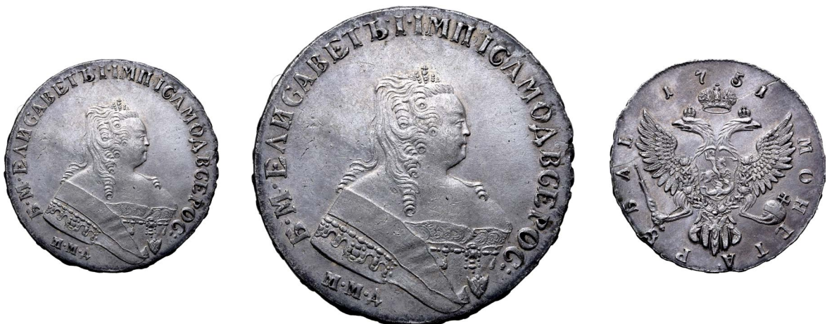
173. Russia, Empire. Elizabeth AR Rouble. Red mint, 1751. Б • М • ЕЛИСАВЕТЪ • І • ІМП : ІСАМОД : ВСЕРОС .; crowned and draped bust to right; М•М•Д below / Crowned double-headed eagle facing with wings spread, wearing shield on breast depicting St. George slaying the dragon, and holding sceptre and orb; crown above, denomination and date around. Edge inscription: МОСКОВСКОГО *** МАНЕТНОГО * ДВОРА ***. Bitkin 123.

From the GK Collection (France) of Russian Coins.