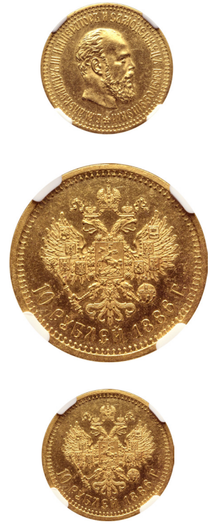
719. Russia, Empire. Alexander III AV 10 Rouble. St. Petersburg mint, 1886. Apollon Gragsof, mintmaster. ✪ Б.М.АЛЕКСАНДРЪ III ИМПЕРАТОРЪ И САМОДЕРЖЕЦЪ ВСЕРОССИЙСКІЙ, bare head to right / Crowned double-headed eagle facing with wings spread, wearing shield on breast depicting St. George slaying the dragon, with shields arranged across wings, and holding sceptre and orb; crown with ribbons above, denomination and date below. Edge inscription: ЧИСТАГО ЗОЛОТА 2 ЗО ЛОТНИКА 69,36 ДОЛЕЙ (А•Г). Bitkin 15.

NGC graded MS 61 (#3825308-002); only seven graded higher. Very Rare, particularly in this condition.