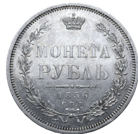
615. Russia, Empire. Alexander II AR Rouble. St. Petersburg mint, 1856. Fedor Blum, mintmaster. * ЧИСТАГО СЕРЕБРА 4 ЗОЛОТНИКА 21 ДОЛЯ, crowned double-headed eagle facing with wings spread, wearing shield on breast depicting St. George slaying the dragon, with shields arranged across wings, and holding sceptre and orb; crown above, Ф-Б across lower fields / Denomination over date, С.П.Б. below; crown above and wreath around. Edge inscription: • СЕР • 83 1/3 ПРОБЫ 4 ЗОЛ • 82 14/25 ДОЛИ. Bitkin 46.

NGC graded UNC Details, cleaned (#6674410-009).