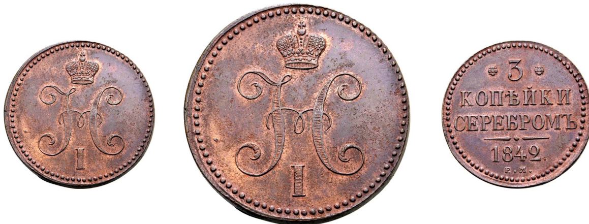
561. Russia, Empire. Nicholas I CU 3 Kopeck. Ekaterinburg mint, 1842. Crowned monogram / Denomination above date; E.M. below. Bitkin 541. 34.45g, 38mm, 12h.