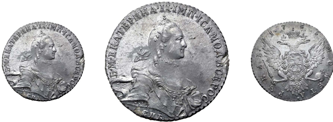
238. Russia, Empire. Catherine II AR Rouble. St. Petersburg mint, 1765. Dies by Timofei Ivanov; Stepan Afanasyev, mintmaster. Б • М • ЕКАТЕРИНА • II • ИМП • IСАМОД • ВСЕРОС, crowned and draped bust to right; ПI on arm truncation, СПБ below / Crowned double-headed eagle facing with wings spread, wearing shield on breast depicting St. George slaying the dragon, and holding sceptre and orb; crown above, C-A across lower fields, denomination and date around. Bitkin 188.

NGC graded UNC Details, obv. rim damage (#6674410-001).