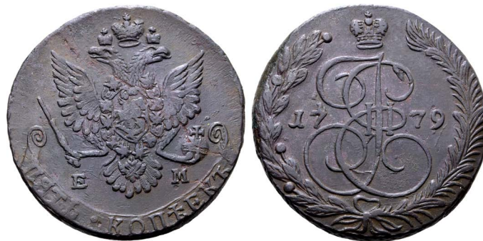
317. Russia, Empire. Catherine II CU 5 Kopeck. Ekaterinburg mint, 1779. Crowned double-headed imperial eagle facing, wearing shield on breast depicting St. George slaying the dragon, and holding sceptre and orb; crown above, E-M across lower fields, denomination in scroll below / Crowned monogram within wreath; date across fields. Bitkin 630. 51.26g, 41mm, 12h.

From the GK Collection (France) of Russian Coins.