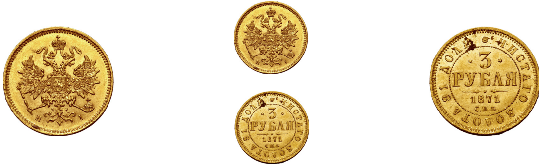
674. Russia, Empire. Alexander II AV 3 Rouble. St. Petersburg mint, 1871. Nikolay Iossa, mintmaster. Crowned double-headed eagle facing with wings spread, wearing shield on breast depicting St. George slaying the dragon, with shields arranged across wings, and holding sceptre and orb; crown with ribbons above, H-I across lower fields / ❁ ЧИСТАГО ЗОЛЮТА 81 ДОЛЯ, denomination over date, С.П.Б. below; two stars across upper fields. Bitkin 33. 3.92g, 20mm, 12h.