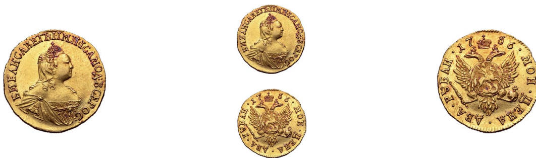
184. Russia, Empire. Elizabeth AV 2 Rouble. St. Petersburg mint, 1756. Б • М • ЕЛИСАВЕТЪ • І • ІМПІ : ІСАМОДІ : ВСЕРОС ., crowned and draped bust to right / • МОИ • ЦЕНА • ДВА • РУБЛИ •, crowned double-headed eagle facing with wings spread, wearing shield on breast depicting St. George slaying the dragon, and holding sceptre and orb; crown dividing date above. Bitkin 51.

From the GK Collection (France) of Russian Coins.