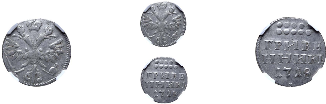
38. Russia, Tsardom. Peter I 'the Great' AR Grivennik (10 Kopeck). Red mint, 1718. Crowned double-headed eagle facing, holding sceptre and orb / Denomination above date; ten pellets in two lines above. Bitkin 1118. 3.05g.

From the GK Collection (France) of Russian Coins.