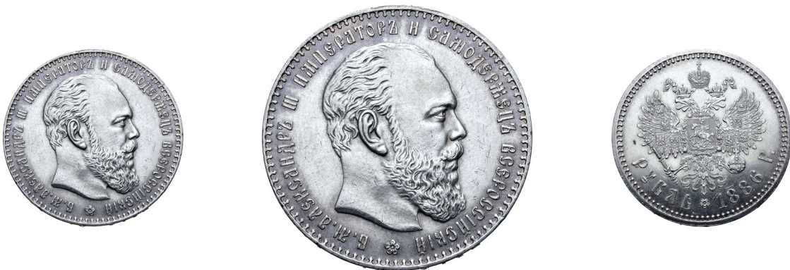
720. Russia, Empire. Alexander III AR Rouble. St. Petersburg mint, 1886. Apollon Grashof, mintmaster. ✪ Б.М. АЛЕКСАНДРЪ III ИМПЕРАТОРЪ И САМОДЕРЖЕЦЪ ВСЕРОССИЙСКІЙ, bare head to right / Crowned double-headed eagle facing with wings spread, wearing shield on breast depicting St. George slaying the dragon, with shields arranged across wings, and holding sceptre and orb; crown with ribbons above, denomination and date below. Edge inscription: ЧИСТАГО СЕРЕБРА 4 ЗО ЛОТНИКА 21 ДОЛА (А•Г). Bitkin 60 or 69.

From the GK Collection (France) of Russian Coins.