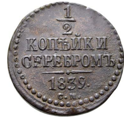
544. Russia, Empire. Nicholas I CU 1/2 Kopeck. Suzun mint, 1839. Crowned monogram / Denomination over date; C.M. below. Bitkin 773. 4.31g, 21mm, 12h.