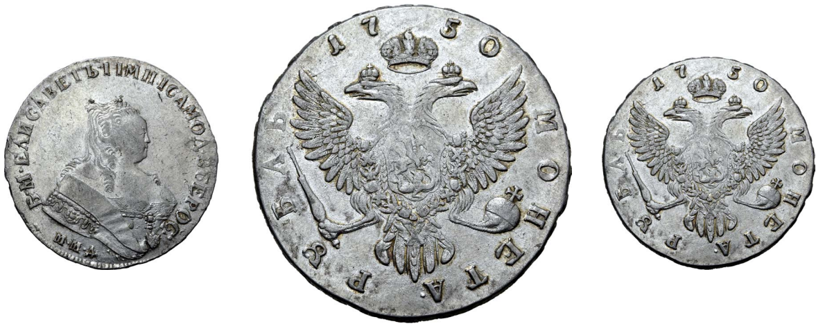
170. Russia, Empire. Elizabeth AR Rouble. Red mint, 1750. Б • М • ЕЛИСАВЕТЪ • І • ІМП : ІСАМОД : ВСЕРОС .; crowned and draped bust to right; М•М•Д below / Crowned double-headed eagle facing with wings spread, wearing shield on breast depicting St. George slaying the dragon, and holding sceptre and orb; crown above, denomination and date around. Edge inscription: МОСКОВСКОГО *** МАНЕТНОГО * ДВОРА ***. Bitkin 122. 25.87g, 41mm, 12h.