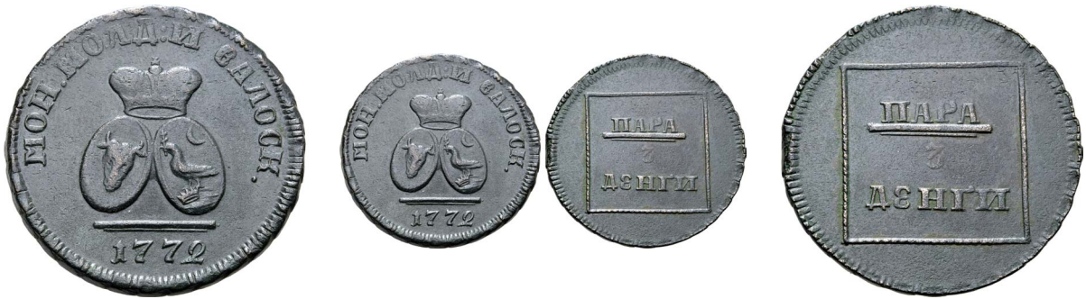
389. Russia, Empire (Occupation of Moldavia and Wallachia). Catherine II CU Para - 3 Denga. Sadogura mint, 1772. МОН • МОЛДІ : [И ВА]ЛОСК •, crowned coats-of-arms of Moldavia and Wallachia; date below / Denomination in three lines within square torque border. Bitkin 1255. 11.53g, 29mm, 12h.