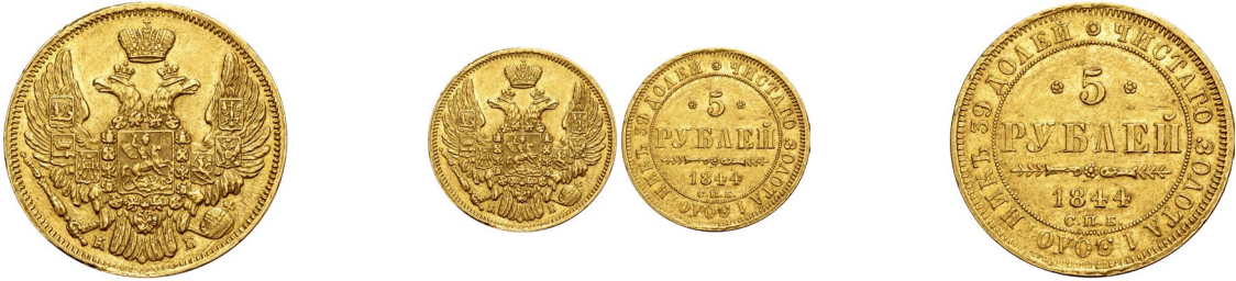
570. Russia, Empire. Nicholas I AV 5 Rouble. St. Petersburg mint, 1844. Constantine Butenev, mintmaster. Crowned double-headed eagle facing with wings spread, wearing shield on breast depicting St. George slaying the dragon, with shields arranged across wings, and holding sceptre and orb; crown above, К-Б across lower fields / ❖ ЧИСТАГО ЗОЛОТА 1 ЗОЛОТНИКЪ 39 ДОЛЕЙ, denomination over date; С.П.Б. below, two flowers across upper fields. Bitkin 25. 6.55g, 23mm, 12mm.