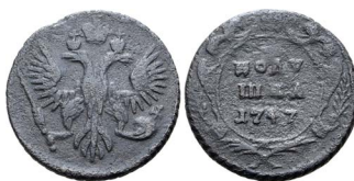
165. Russia, Empire. Elizabeth CU Polushka (1/4 Kopeck). Red mint, 1747. Crowned double-headed eagle facing, holding sceptre and orb; crown above / Elaborately ornamented cartouche inscribed with denomination and date. Bitkin 374. 5.99g, 21mm, 12h.

From the GK Collection (France) of Russian Coins.