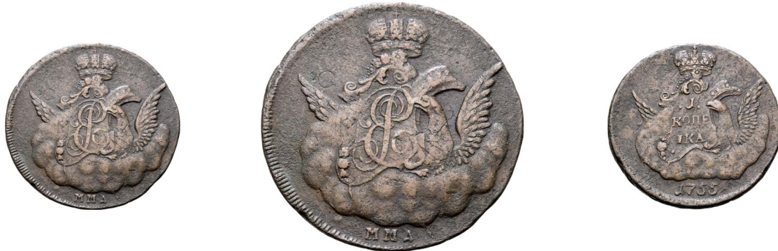
183. Russia, Empire. Elizabeth CU Kopeck. Red mint, 1755. Eagle with wings spread emerging to right from clouds, with head to left, supporting ornate shield inscribed with monogram; crown above, ММД below / Eagle with wings spread emerging to right from clouds, with head to left, supporting ornate shield inscribed with denomination; crown above, date below. Bitkin 381. 17.75g, 32mm, 6h.