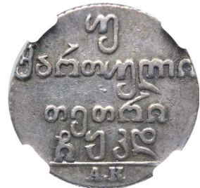
493. Russia, Empire. Georgia Governorate AR 2 Abazi. Tiflis mint, 1824. Aleksey Karpinskiy, mintmaster. ცუღლისი; bricked crown above, crossed olive and palm branches below / უ ქართული თეთრი in three lines; date above A.K below. Bitkin 746.

NGC graded XF 45 (#2639980-002); none graded higher - Top Pop.