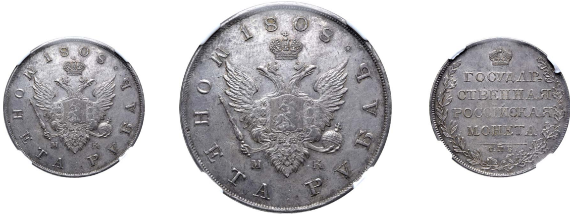
437. Russia, Empire. Alexander I AR Rouble. St. Petersburg mint, 1808. Michael Kleiner, mintmaster. Crowned double-headed eagle facing with wings spread, wearing shield on breast depicting St. George slaying the dragon, and holding sceptre and orb; crown above, M-K across lower fields, denomination and date around / Issuing body and denomination in four lines, С.П.Б. below; crown above and wreath around. Edge inscription: ВОСЕМДЕСЯТЬ ТРЕТЕЙ СЪ ОДНОЮ ТРЕТЬЮ ПРОБЫ. Bitkin 72.