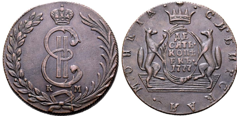
307. Russia, Empire. Catherine II CU 10 Kopeck. Suzun mint, 1777. Crowned monogram, К-М across lower fields; all within wreath / • СИБИРСКАЯ • МОНЕТА •, two sables holding crowned cartouche inscribed with denomination and date; rosette above. Bitkin 1038. 68.50g, 46mm, 12h.

From the GK Collection (France) of Russian Coins.