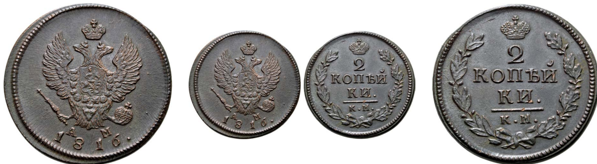
466. Russia, Empire. Alexander I CU 2 Kopeck. Suzun mint, 1816. Crowned double-headed eagle facing with wings spread, wearing shield on breast depicting St. George slaying the dragon, and holding sceptre and orb; crown above, A-M across lower fields, date below / Denomination above K.M.; crown above, wreath around. Bitkin 495. 14.29g, 30mm, 12h.

From the GK Collection (France) of Russian Coins.