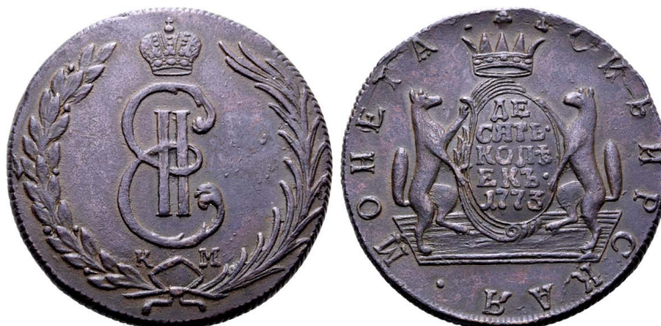
288. Russia, Empire. Catherine II CU 10 Kopeck. Suzun mint, 1773. Crowned monogram, K-M across lower fields; all within wreath / • СИБИРСКАЯ • МОНЕТА •, two sables holding crowned cartouche inscribed with denomination and date; rosette above. Bitkin 1029. 80.95g, 47mm, 12h.

From the GK Collection (France) of Russian Coins.