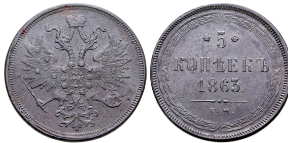
643. Russia, Empire. Alexander II CU 5 Kopeck. Ekaterinburg mint, 1863. Crowned double-headed eagle facing with wings spread, wearing shield on breast depicting St. George slaying the dragon, with shields arranged across wings, and holding sceptre and orb; crown with ribbons above / Denomination over date; E.M. below, wreath around. Bitkin 310. 27.38g, 37mm, 12h.

From the GK Collection (France) of Russian Coins.