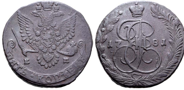
329. Russia, Empire. Catherine II CU 5 Kopeck. Ekaterinburg mint, 1781. Crowned double-headed imperial eagle facing, wearing shield on breast depicting St. George slaying the dragon, and holding sceptre and orb; crown above, E-M across lower fields, denomination in scroll below / Crowned monogram within wreath; date across fields. Bitkin 632. 50.62g, 40mm, 12h.