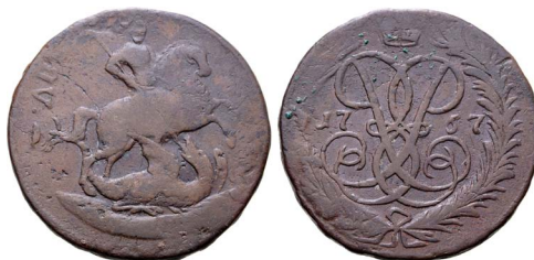
193. Russia, Empire. Elizabeth CU 2 Kopeck. Ekaterinburg mint, 1757. St. George on horseback to right, slaying dragon with spear; denomination above / Crowned monogram, date across fields; all within wreath. Edge inscription: ЕКАТЕРИНБУРСКОГО ❀ ДВОРА ❀. Bitkin 443. 20.53g, 31mm, 12h.

From the GK Collection (France) of Russian Coins.