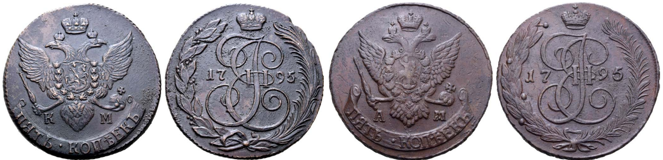
378. Russia, Empire. Catherine II CU 5 Kopeck. Suzun mint, 1795. Crowned double-headed eagle facing with wings spread, wearing shield on breast depicting St. George slaying the dragon, and holding sceptre and orb; crown above, K-M across lower fields, denomination on scroll below / Crowned monogram, date across fields; all within wreath. Bitkin 812. 53.30g, 43mm, 12h.

From the GK Collection (France) of Russian Coins.