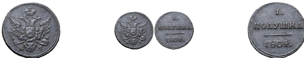
428. Russia, Empire. Alexander I CU Polushka (1/4 Kopeck). Suzun mint, 1804. Crowned double-headed imperial eagle facing, wearing shield on breast depicting St. George slaying the dragon and holding sceptre and orb; crown above, K-M across lower fields / Denomination above date. Bitkin 467. 2.11g, 18mm, 12h.