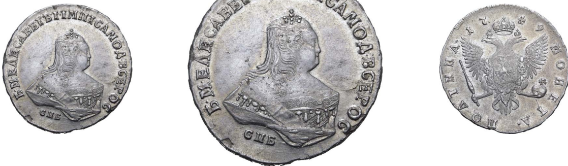
167. Russia, Empire. Elizabeth AR Poltina (50 Kopeck). St. Petersburg mint, 1749. Б • М • ЕЛИСАВЕТЬ • І • ІМП : І САМОД : ВСЕРОС, crowned and draped bust to right; СПБ below / Crowned double-headed eagle facing with wings spread, wearing shield on breast depicting St. George slaying the dragon, and holding sceptre and orb; crown above, denomination and date around. Edge inscription: С.ПЕТЕРБУРХСКАГО ** МОШЕТАГО ** ДВОРА. Bitkin 312. 12.93g, 35mm, 12h.

Extremely Fine; highly lustrous with a light cabinet tone. Very Rare.