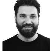
Ellis Meade Auction Photographer