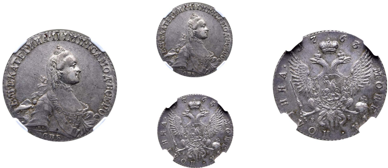
226. Russia, Empire. Catherine II AR Poltina (50 Kopeck). St. Petersburg mint, 1763. Yakov Ivanov, mintmaster. Б • М • ЕКАТЕРИНА • II • ИМП • И САМОД • ВСЕРОСС •, crowned and draped bust to right; СІБ below / Crowned double-headed eagle facing with wings spread, wearing shield on breast depicting St. George slaying the dragon, and holding sceptre and orb; crown above, Я-І across lower fields, denomination and date around. Bitkin 273.

NGC graded AU Details, obv. cleaned (#6672951-019).