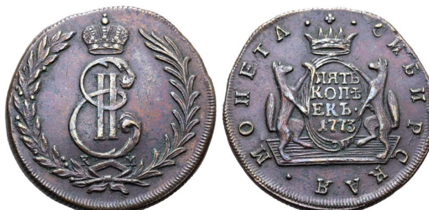
289. Russia, Empire. Catherine II CU 5 Kopeck. Suzun mint, 1773. Crowned monogram, K-M across lower fields; all within wreath / • СИБИРСКАЯ • МОНЕТА •, two sables holding crowned cartouche inscribed with denomination and date; rosette above. Bitkin 1072. 31.94g, 40mm, 1h.

From the GK Collection (France) of Russian Coins.