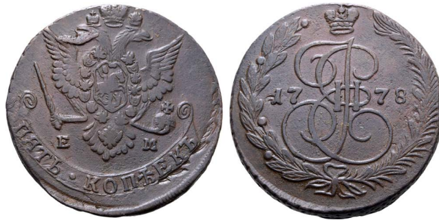
311. Russia, Empire. Catherine II CU 5 Kopeck. Ekaterinburg mint, 1778. Crowned double-headed imperial eagle facing, wearing shield on breast depicting St. George slaying the dragon, and holding sceptre and orb; crown above, E-M across lower fields, denomination in scroll below / Crowned monogram within wreath; date across fields. Bitkin 628. 53.54g, 42mm, 12h.

From the GK Collection (France) of Russian Coins.