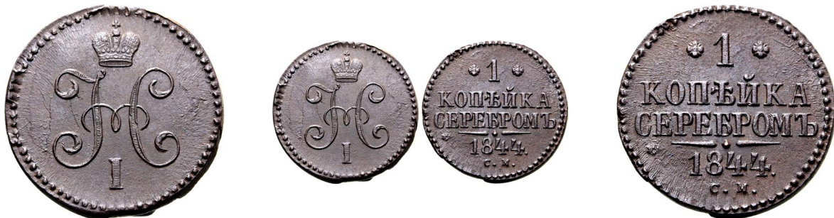
572. Russia, Empire. Nicholas I CU Kopeck. Suzun mint, 1844. Crowned monogram / Denomination over date; C.M. below. Bitkin 765. 11.19g, 27mm, 12h.

From the GK Collection (France) of Russian Coins.