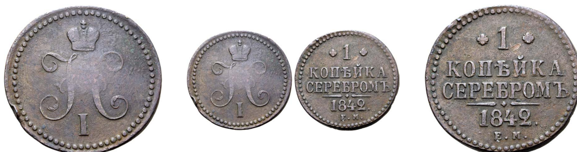
564. Russia, Empire. Nicholas I CU Kopeck. Ekaterinburg mint, 1842. Crowned monogram / Denomination over date; E.M. below. Bitkin 561. 10.21g, 28mm, 12h.

From the GK Collection (France) of Russian Coins.