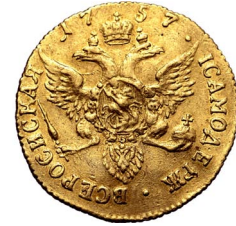
188. Russia, Empire. Elizabeth AV Ducat. St. Petersburg mint, 1757. Б • М • ЕЛИСАВЕТЬ • І • ІМПЕРАТРИЦА •, crowned and draped bust to right; СІБ below / • ІСАМОДЕРЖ • ВСЕРОСИСКАЯ •, crowned double-headed eagle facing with wings spread, wearing shield on breast depicting St. George slaying the dragon, and holding sceptre and orb; crown and date above. Bitkin 93. 3.46g, 20mm, 12h.