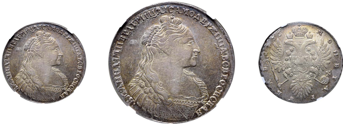
136. Russia, Empire. Anna Ivanovna AR Rouble. Kadashevsky mint, 1736. : Б М • АННА • ИМПЕРАТРИЦА • І САМОДЕРЖИЦА • ВСЕРОССИЙСКАЯ • , crowned and draped bust to right / Crowned double-headed eagle facing with wings spread, wearing shield on breast depicting St. George slaying the dragon, and holding sceptre and orb; crown above, denomination and date around. Bitkin 126.

NGC graded AU Details, cleaned (#6672958-001). Rare.