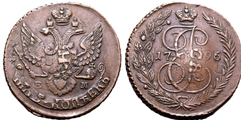
398. Russia, Empire. Paul I CU 5 Kopeck. Uncertain mint, 1797. Crowned double-headed eagle facing with wings spread, wearing shield on breast depicting St. George slaying the dragon, and holding sceptre and orb; crown above, E-M across fields, denomination on scroll below / Crowned monogram within wreath; original strike's date across fields. Bitkin 109. 54.72g, 48mm, 12h.

From the GK Collection (France) of Russian Coins.