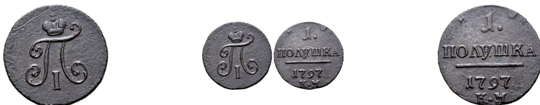
402. Russia, Empire. Paul I CU Polushka (1/4 Kopeck). Suzun mint, 1797. Crowned monogram / Denomination over date; K.M. below. Bitkin 167. 2.56g, 19mm, 12h.

From the GK Collection (France) of Russian Coins.