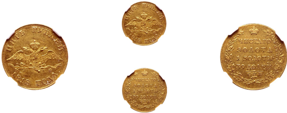
469. Russia, Empire. Alexander I AV 5 Rouble. St. Petersburg mint, 1818. Mikhail Fedorov, mintmaster. Double-headed eagle facing with wings spread, wearing shield on breast depicting St. George slaying the dragon, and holding ribboned wreath and crossed thunderbolt and torches; crown above, М-Ф across lower fields, denomination above and date below / ЧИСТАГО ЗОЛОТА 1 ЗОЛОТН = 39 ДОЛЕЙ in four lines, С.П.Б. below; crown above and wreath around. Bitkin 19.

From the GK Collection (France) of Russian Coins.