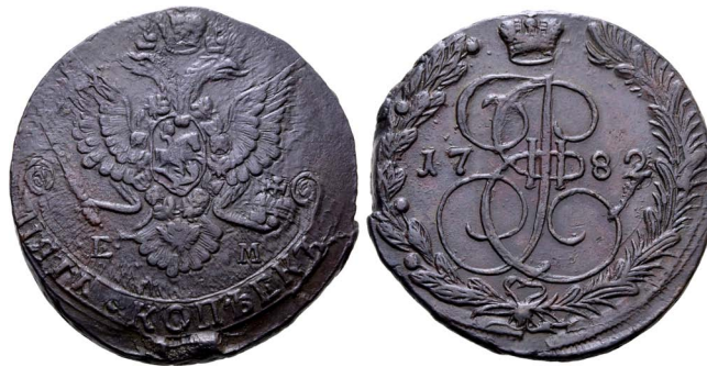
331. Russia, Empire. Catherine II CU 5 Kopeck. Ekaterinburg mint, 1782. Crowned double-headed imperial eagle facing, wearing shield on breast depicting St. George slaying the dragon, and holding sceptre and orb; crown above, E-M across lower fields, denomination in scroll below / Crowned monogram within wreath; date across fields. Bitkin 633. 45.61g, 42mm, 12h.

From the GK Collection (France) of Russian Coins.