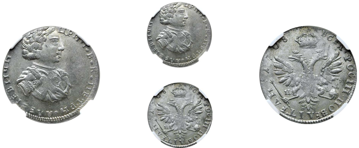
13. Russia, Tsardom. Peter I 'the Great' AR Tynf (12 Kopeck). Kadashevsky mint, 1708. Struck using the Polish-Lithuanian monetary system. ЦРЬ • І • В • К • ПЕТРЪ • АЛЕЪІЕВИЧЪ, laureate and draped bust to right / ВСЕА • РОСІИ • ПОВЕЛІТЕЛЪ • (date), crowned double-headed eagle facing, holding sceptre and orb; crown above, IL-L across lower fields. Bitkin 3838. 5.33g.

From the GK Collection (France) of Russian Coins.