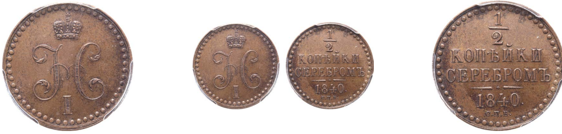
553. Russia, Empire. Nicholas I CU 1/2 Kopeck. St. Petersburg mint, 1840. Crowned monogram / Denomination over date; С.П.Б. below. Bitkin 935.

PCGS graded SP 64 BN (37056925); only one graded higher.