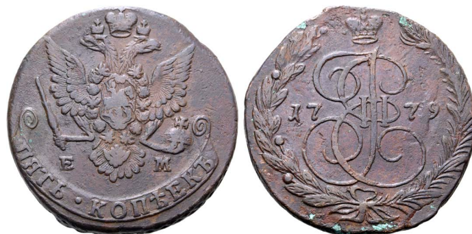
318. Russia, Empire. Catherine II CU 5 Kopeck. Ekaterinburg mint, 1779. Crowned double-headed imperial eagle facing, wearing shield on breast depicting St. George slaying the dragon, and holding sceptre and orb; crown above, E-M across lower fields, denomination in scroll below / Crowned monogram within wreath; date across fields. Bitkin 630. 53.83g, 41mm, 12h.

From the GK Collection (France) of Russian Coins.