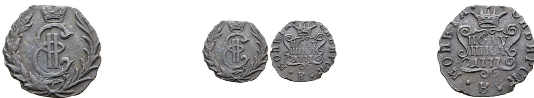
309. Russia, Empire. Catherine II CU Polushka (1/4 Kopeck). Suzun mint, 1777. Crowned monogram, К-М across lower fields; all within wreath / • СИБИРСКАЯ • МОНЕТА •, crowned cartouche inscribed with denomination and date; [rosette] above. Bitkin 1228. 1.31g, 16mm, 12h.

From the GK Collection (France) of Russian Coins.