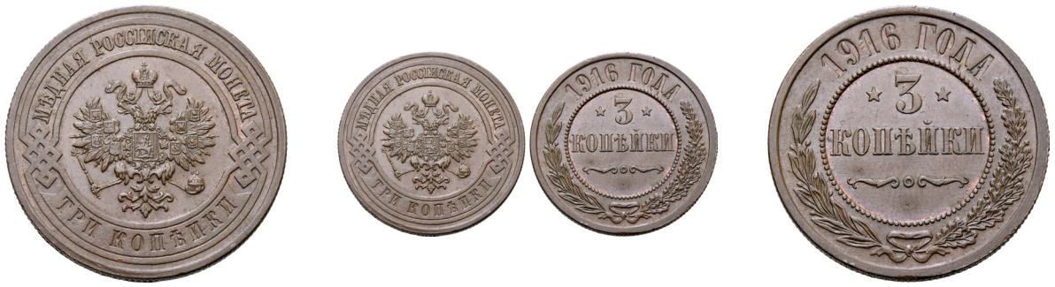
822. Russia, Empire. Nicholas II CU 3 Kopeck. St. Petersburg mint, 1916. Crowned double-headed eagle facing with wings spread, wearing shield on breast depicting St. George slaying the dragon, with shields arranged across wings, and holding sceptre and orb; crown with ribbons above, МБДНАЯ РОССИЙСКАЯ МОНЕТА and denomination in ornamented banner around / Denomination surrounded by inner circle of pellets; date above and wreath around. Bitkin 246. 9.81g, 28mm, 12h.