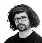
George Kitchen Senior Auction Photographer