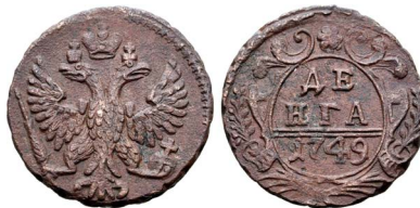
168. Russia, Empire. Elizabeth CU Denga (1/2 Kopeck). Ekaterinburg mint, 1749. Crowned double-headed eagle facing, holding sceptre and orb; crown above / Elaborately ornamented cartouche inscribed with denomination and date. Bitkin -, cf. 408 (same obv. die). 9.40g, 25mm, 11h.

From the GK Collection (France) of Russian Coins.