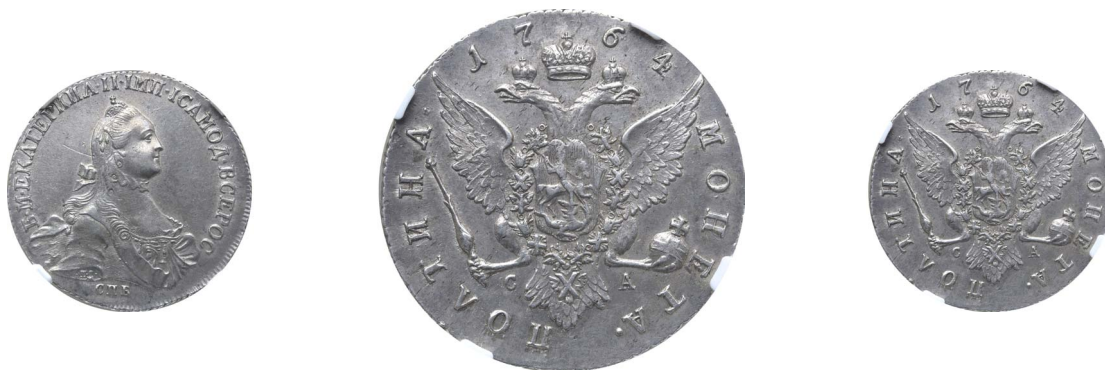
233. Russia, Empire. Catherine II AR Poltina (50 Kopeck). St. Petersburg mint, 1764. Dies by Timofei Ivanov; Stepan Afanasyev, mintmaster. Б•М•ЕКАТЕРИНА•II•ИМП•I САМОД•ВСЕРОС, crowned and draped bust to right; •Т•I• on arm truncation, СІВ below / Crowned double-headed eagle facing with wings spread, wearing shield on breast depicting St. George slaying the dragon, and holding sceptre and orb; crown above, C-A across lower fields, denomination and date around. Bitkin 275.

NGC graded AU 53 (#3645222-005); only five in higher grade.