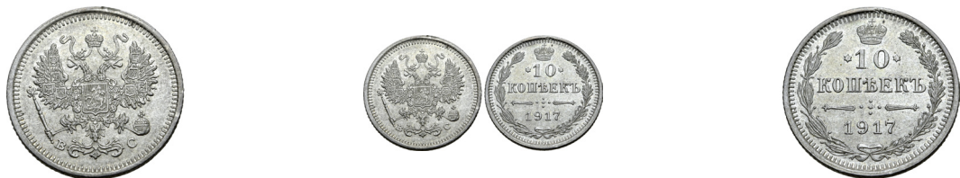
825. Russia, Empire. Nicholas II AR 10 Kopeck. St. Petersburg mint, 1917. Crowned double-headed eagle facing with wings spread, wearing shield on breast depicting St. George slaying the dragon, with shields arranged across wings, and holding sceptre and orb; crown with ribbons above, В-С across lower fields / Denomination over date; crown above and wreath around. Bitkin 170. 1.82g, 17mm, 12h.

From the GK Collection (France) of Russian Coins.