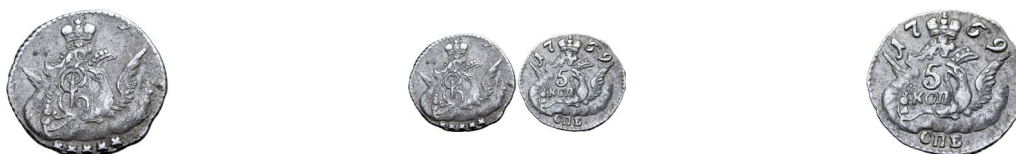
200. Russia, Empire. Elizabeth AR 5 Kopeck. St. Petersburg mint, 1759. Eagle with wings spread emerging to right from clouds, with head to left, supporting ornate shield inscribed with monogram; crown above, five stars below / Eagle with wings spread emerging to right from clouds, with head to left, supporting ornate shield inscribed with denomination; date above and СІБ below. Bitkin 344. 1.01g, 14mm, 6h.

From the GK Collection (France) of Russian Coins.