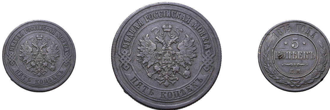
682. Russia, Empire. Alexander II CU 5 Kopeck. Ekaterinburg mint, 1874. Crowned double-headed eagle facing with wings spread, wearing shield on breast depicting St. George slaying the dragon, with shields arranged across wings, and holding sceptre and orb; crown with ribbons above, МѢДНАЯ РОССИЙСКАЯ МОНЕТА and denomination in ornamented banner around / Denomination above Е.М., surrounded by inner circle of pellets; date above and wreath around. Bitkin 399. 16.54g, 32mm, 12h.