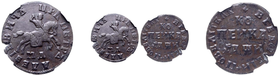
15. Russia, Tsardom. Peter I 'the Great' CU Kopeck. Kadashevsky mint, 1708. ЦРЬ ПЕТРЪ АЛЕЖІЕВИЧЪ, St. George on horseback to right, brandishing spear; МД below / ◇ ВСЕА ◇ РОССІИ ◇ ПОВЕЛІТЕЛЪ around denomination above date. Bitkin -, cf. 3336. 6.65g.

From the GK Collection (France) of Russian Coins.