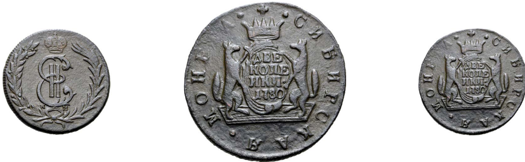
325. Russia, Empire. Catherine II CU 2 Kopeck. Suzun mint, 1780. Crowned monogram within wreath; К-М across lower fields / • СИБИРСКАЯ • МОШЕТА •, two sables holding crowned cartouche inscribed with denomination and date; rosette above. Bitkin 1124. 13.16g, 29mm, 12h.

From the GK Collection (France) of Russian Coins.