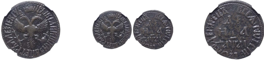
20. Russia, Tsardom. Peter I 'the Great' CU Denga (1/2 Kopeck). Naberezhny mint, 1711. ЦРЬ І ВЕЛИКІИ КНЗЪ ПЕТРЪ АЛЕЪЕВИЧЪ, crowned double-headed eagle facing, holding sceptre and orb; crown above / ВСЕА РОССІИ САМОДЕРЖЕЦЪ around denomination over date. Bitkin 2819. 3.79g.

From the GK Collection (France) of Russian Coins.