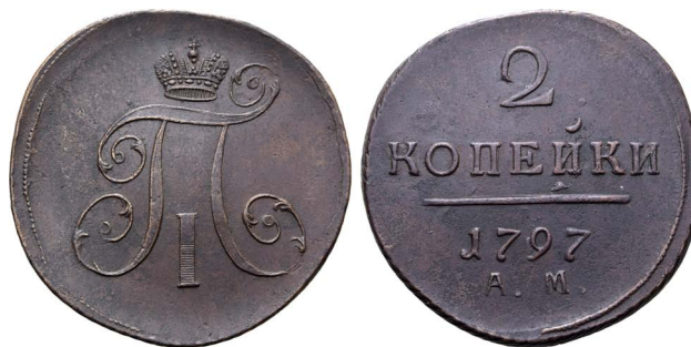
401. Russia, Empire. Paul I CU 2 Kopeck. Anninskoye mint, 1797. Crowned monogram / Denomination over date; A.M. below. Bitkin 183. 24.74g, 40mm, 12h.

From the GK Collection (France) of Russian Coins.