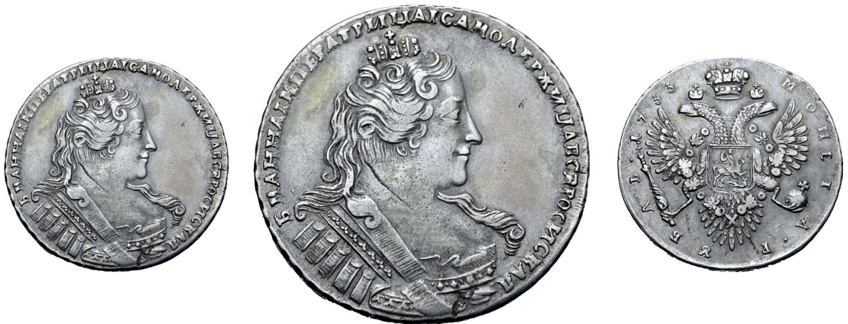
123. Russia, Empire. Anna Ivanovna AR Rouble. Kadashevsky mint, 1733. Б М АННА ИМПЕРАТРИЦА І САМОДЕРЖИЦА ВСЕРОССИСКАЯ, crowned and draped bust to right / Crowned double-headed eagle facing with wings spread, wearing shield on breast depicting St. George slaying the dragon, and holding sceptre and orb; crown above, denomination and date around. Bitkin -, cf. 61-75 for obv., cf. 70 for rev. (same die). 25.19g, 41mm, 12h.

From the GK Collection (France) of Russian Coins.