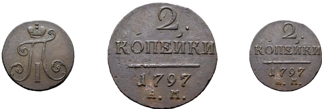
400. Russia, Empire. Paul I CU 2 Kopeck. Anninskoye mint, 1797. Crowned monogram / Denomination over date; A.M. below. Bitkin 181. 20.00g, 33mm, 12h.

Extremely Fine. Very Rare with narrow cipher.