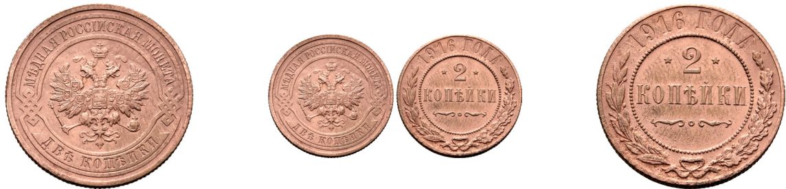
823. Russia, Empire. Nicholas II CU 2 Kopeck. St. Petersburg mint, 1916. Crowned double-headed eagle facing with wings spread, wearing shield on breast depicting St. George slaying the dragon, with shields arranged across wings, and holding sceptre and orb; crown with ribbons above, МБДНАЯ РОССИЙСКАЯ МОНЕТА and denomination in ornamented banner around / Denomination surrounded by inner circle of pellets; date above and wreath around. Bitkin 246. 6.42g, 24mm, 12h.

From the GK Collection (France) of Russian Coins.