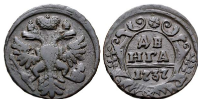
139. Russia, Empire. Anna Ivanovna CU Denga (1/2 Kopeck). Ekaterinburg mint, 1737. Crowned double-headed eagle facing, holding sceptre and orb; crown above / Elaborately ornamented cartouche inscribed with denomination and date. Bitkin 362. 8.46g, 26mm, 12h.

From the GK Collection (France) of Russian Coins.