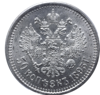
744. Russia, Empire. Nicholas II AR 50 Kopeck. St. Petersburg mint, 1895. Apollon Grashof, mintmaster. Б.М.НИКОЛАЙ II ИМПЕРАТОРЪ И САМОДЕРЖЕЦЪ ВСЕРОСС., bare head to left / Crowned double-headed eagle facing with wings spread, wearing shield on breast depicting St. George slaying the dragon, with shields arranged across wings, and holding sceptre and orb; crown with ribbons above, denomination and date below. Edge inscription: ЧИСТАГО СЕРЕБРА 2 ЗОЛЮТНИКА 10.5 ДОЛЕЙ (А•Г). Bitkin 71.