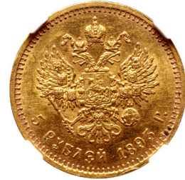
738. Russia, Empire. Alexander III AV 5 Rouble. St. Petersburg mint, 1893. Apollon Grashof, mintmaster. ✪ Б.М.АЛЕКСАНДРЪ III ИМПЕРАТОРЪ И САМОДЕРЖЕЦЪ ВСЕРОССИЙСКІЙ, bare head to right / Crowned double-headed imperial eagle facing, wearing shield on breast depicting St. George slaying the dragon, with shields arranged across wings, and holding sceptre and orb; crown above, denomination and date below. Edge inscription: ЧИСТАГО ЗОЛОТА 1 ЗОЛОТНИКЪ 34,68 ДОЛЕЙ (А·Г). Bitkin 39. 6.48g, 22mm, 12h.