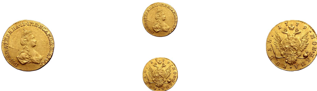
313. Russia, Empire. Catherine II AV Rouble. St. Petersburg mint, 1779. Б • М • ЕКАТЕРИНА • II • ИМП • ИСАМОД • ВСЕРОС •, crowned and draped bust to right / Crowned double-headed eagle facing with wings spread, wearing shield on breast depicting St. George slaying the dragon, and holding sceptre and orb; crown and date above, denomination around. Bitkin 115. 1.21g, 15mm, 12h.