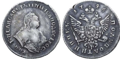
162. Russia, Empire. Elizabeth AR Polupoltinnik (25 Kopeck). Red mint, 1746. Б • М • ЕЛИСАВЕТЪ • I • ИМП : I САМОД : ВСЕРОС ., crowned and draped bust to right; М•М•Д below / Crowned double-headed eagle facing with wings spread, wearing shield on breast depicting St. George slaying the dragon, and holding sceptre and orb; crown above, denomination and date around. Bitkin 157. 6.35g, 26mm, 12h.