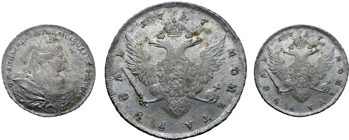
138. Russia, Empire. Anna Ivanovna AR Rouble. Red mint, 1737. Б • М • АННА • ИМПЕРАТРИЦА І САМОДЕРЖИЦА ВСЕРОСС., crowned and draped bust to right / Crowned double-headed eagle facing with wings spread, wearing shield on breast depicting St. George slaying the dragon, and holding sceptre and orb; crown above, denomination and date around. Bitkin -, cf. 196. 25.20g, 42mm, 12h.

From the GK Collection (France) of Russian Coins.