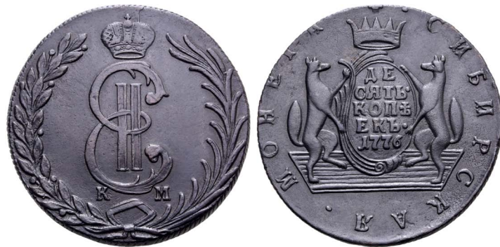
302. Russia, Empire. Catherine II CU 10 Kopeck. Suzun mint, 1776. Crowned monogram, К-М across lower fields; all within wreath / • СИБИРСКАЯ • МОНЕТА •, two sables holding crowned cartouche inscribed with denomination and date; rosette above. Bitkin 1036. 64.87g, 46mm, 12h.

From the GK Collection (France) of Russian Coins.