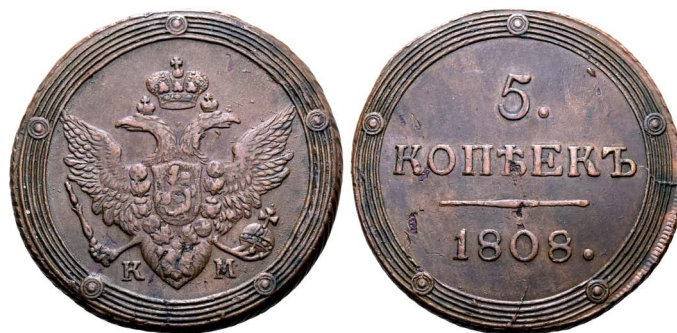
438. Russia, Empire. Alexander I CU 5 Kopeck. Suzun mint, 1808. Crowned double-headed eagle facing with wings spread, wearing shield on breast depicting St. George slaying the dragon, and holding sceptre and orb; crown above, K-M across lower fields, all surrounded by decorated border / Denomination over date; all surrounded by decorated border. Bitkin 423. 51.53g, 44mm, 12h.

From the GK Collection (France) of Russian Coins.