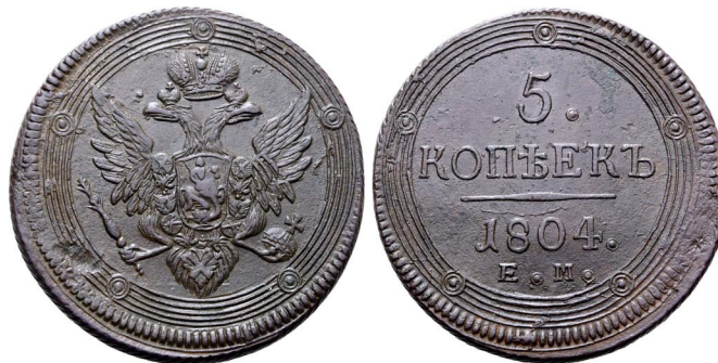
427. Russia, Empire. Alexander I CU 5 Kopeck. Ekaterinburg mint, 1804. Crowned double-headed eagle facing with wings spread, wearing shield on breast depicting St. George slaying the dragon, and holding sceptre and orb; crown above, all surrounded by decorated border / Denomination over date, E.M. below; all surrounded by decorated border. Bitkin 290. 49.34g, 43mm, 12h.

From the GK Collection (France) of Russian Coins.