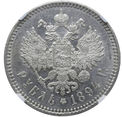
742. Russia, Empire. Alexander III AR Rouble. St. Petersburg mint, 1894. Apollon Grashof, mintmaster. ✪ Б.М. АЛЕКСАНДРЪ III ИМПЕРАТОРЪ И САМОДЕРЖЕЦЪ ВСЕРОССІЙСКІЙ, bare head to right / Crowned double-headed eagle facing with wings spread, wearing shield on breast depicting St. George slaying the dragon, with shields arranged across wings, and holding sceptre and orb; crown with ribbons above, denomination and date below. Edge inscription: ЧИСТАГО СЕРЕБРА 4 ЗО ЛОТНИКА 21 ДОЛА (А•Г). Bitkin 78.

NGC graded UNC Details, cleaned (#6672958-012).