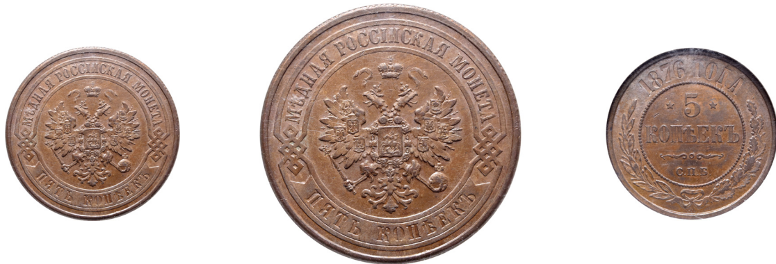
687. Russia, Empire. Alexander II CU 5 Kopeck. St. Petersburg mint, 1876. Crowned double-headed eagle facing with wings spread, wearing shield on breast depicting St. George slaying the dragon, with shields arranged across wings, and holding sceptre and orb; crown with ribbons above, МЪДНАЯ РОССИЙСКАЯ МОНЕТА and denomination in ornamented banner around / Denomination above С.П.Б., surrounded by inner circle of pellets; date above and wreath around. Bitkin 504.

From the GK Collection (France) of Russian Coins.