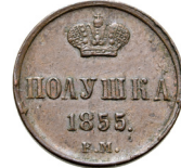
613. Russia, Empire. Alexander II CU Polushka (1/4 Kopeck). Ekaterinburg mint, 1855. Crowned monogram / Denomination over date; crown above, Е.М. below. Bitkin 377. 1.34g, 14mm, 12h.