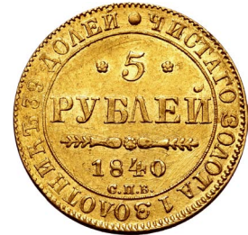
545. Russia, Empire. Nicholas I AV 5 Rouble. St. Petersburg mint, 1840. Alexei Chadov, mintmaster. Crowned double-headed imperial eagle facing, wearing shield on breast depicting St. George slaying the dragon, with shields arranged across wings, and holding sceptre and orb; crown above, А-Ч across fields below / * ЧИСТАГО ЗОЛОТА 1 ЗОЛЮТНИКЪ 39 ДОЛЕЙ, denomination above date, С. П. Б. below, two flowers across upper fields. Bitkin 17. 6.48g, 23mm, 12h.

NGC graded UNC Details, rev. spot removed (#6674411-005).