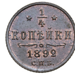
737. Russia, Empire. Alexander III CU 1/4 Kopeck. St. Petersburg mint, 1892. Monogram; crown with ribbons above, wreath around / Denomination over date; С.П.Б. below. Bitkin 215. 0.75g, 13mm, 12h.