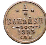
741. Russia, Empire. Alexander III CU Polushka (1/4 Kopeck). St. Petersburg mint, 1893. Monogram; crown with ribbons above, wreath around / Denomination over date; С.П.Б. below. Bitkin 216. 1.04g, 13mm, 12h.