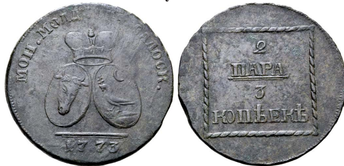
390. Russia, Empire (Occupation of Moldavia and Wallachia). Catherine II CU 2 Para - 3 Kopeck. Sadogura mint, 1773. МОН • МОЛДІ : [И ВА]ЛОСК •, crowned coats-of-arms of Moldavia and Wallachia; date below / Denomination in four lines within square torque border. Bitkin 1249. 18.95g, 45mm, 12h.

Near Extremely Fine; superior to an example sold by Coins.ee OY in April 2023 (Auction 60, lot 722) for EUR 1,171, and comparable to an example sold by Heritage in 2019 (Auction 3071, lot 34337) for USD 5,500. Very Rare.