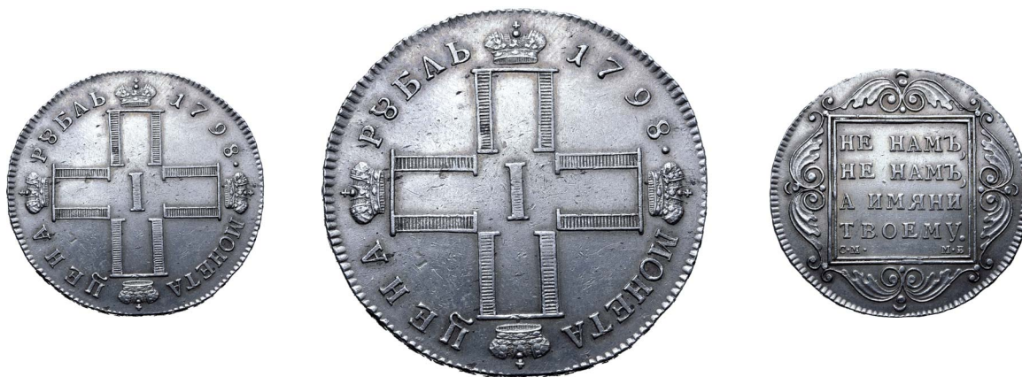
404. Russia, Empire. Paul I AR Rouble. St. Petersburg mint, 1798. Mikhail Bobrovshikov, mintmaster. Crowned cruciform monogram; denomination and date around / НЕ НАМЪ НЕ НАМЪ А ИМЯНИ ТВОЕМУ. in four lines above С•М•М•Б within ornated square cartouche. Edge inscription: * ВОСЕМДЕСЯТЬ ТРЕТЕЙ СЪ ОДНОЮ ТРЕТЬЮ ПРОБЫ. Bitkin 32.

From the GK Collection (France) of Russian Coins.