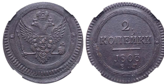
426. Russia, Empire. Alexander I CU 2 Kopeck. Ekaterinburg mint, 1803. Crowned double-headed eagle facing with wings spread, wearing shield on breast depicting St. George slaying the dragon, and holding sceptre and orb; crown above; all surrounded by decorated border / Denomination over date; E.M. below; all surrounded by decorated border. Bitkin 308.

From the GK Collection (France) of Russian Coins.