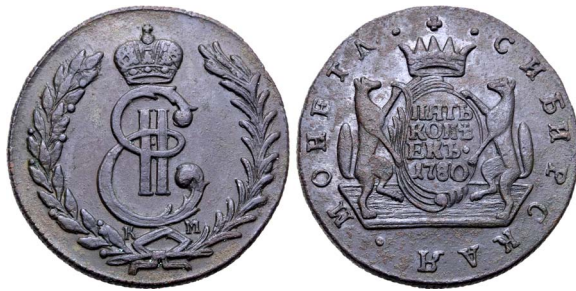
324. Russia, Empire. Catherine II CU 5 Kopeck. Suzun mint, 1780. Crowned monogram, К-М across lower fields; all within wreath / • СИБИРСКАЯ • МОШЕТА •, two sables holding crowned cartouche inscribed with denomination and date; rosette above. Bitkin 1086. 33.80g, 37mm, 12h.