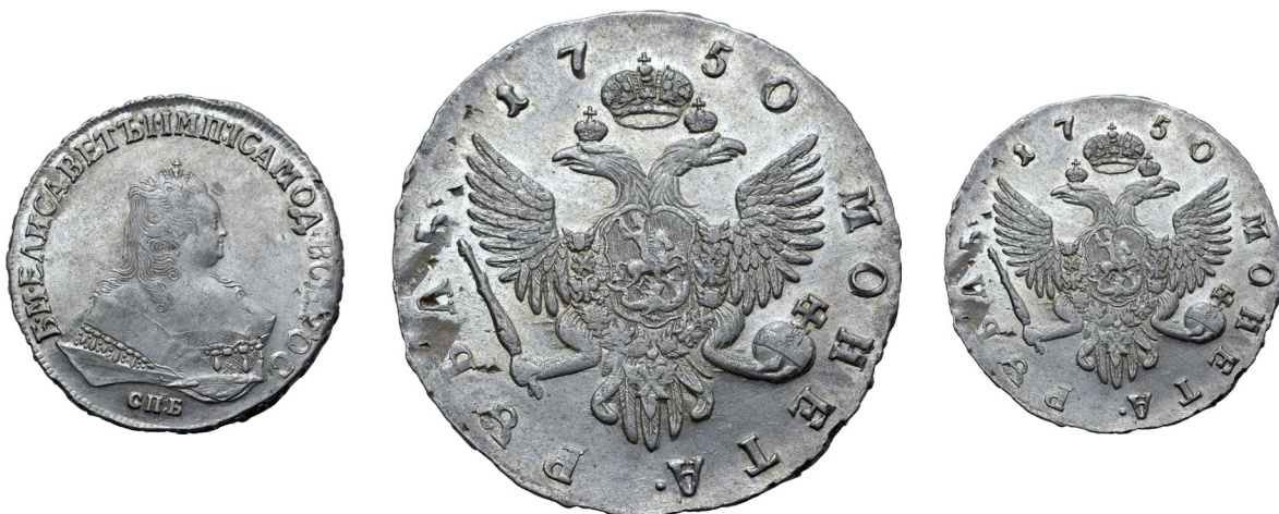
169. Russia, Empire. Elizabeth AR Rouble. St. Petersburg mint, 1750. Б • М • ЕЛИСАВЕТЬ • І • ІМП : І САМОД : ВСЕРОС, crowned and draped bust to right; СПБ below / Crowned double-headed eagle facing with wings spread, wearing shield on breast depicting St. George slaying the dragon, and holding sceptre and orb; crown above, denomination and date around. Edge inscription: С • ПЕТЕРБУРХСКАГО ***** МОШЕТАГО ** ДВОРА *****. Bitkin 265. 25.41g, 41mm, 12h.

From the GK Collection (France) of Russian Coins.