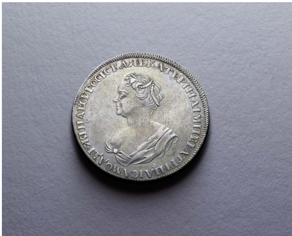
77. Russia, Empire. Catherine I AR Rouble. St Petersburg mint, 1725. ЕКАТЕРІНА • ІМПЕРАТРИЦА • І САМОДЕРЖИЦА • ВСЕРОСІСКАЯ •, bust 'in mourning' to left / МОНЕТА • НОВАЯ • ЦЕНА • РУБЛЬ • (date), crowned double-headed eagle facing, holding sceptre and orb; crown above. Bitkin 71. 28.09g, 44mm, 12h.