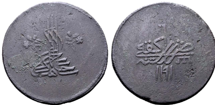
391. Crimean Khanate (Russian Protectorate). Şahin Giray CU Ischal. Struck under Catherine II. Kaffa mint, dated AH 1191, RY 6 = 1782/3. Tughra with calligraphic ornaments across fields / Mint and date formula. Bitkin 70. 77.07g, 52mm, 12h.

From the GK Collection (France) of Russian Coins.