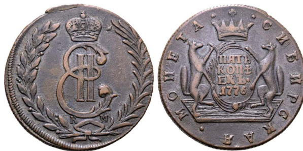
303. Russia, Empire. Catherine II CU 5 Kopeck. Suzun mint, 1776. Crowned monogram, К-М across lower fields; all within wreath / • СИБИРСКАЯ • МОНЕТА •, two sables holding crowned cartouche inscribed with denomination and date; rosette above. Bitkin 1078. 27.36g, 37mm, 12h.

From the GK Collection (France) of Russian Coins.