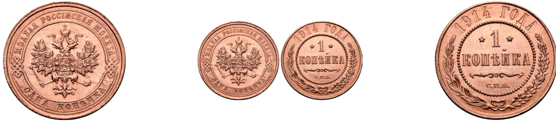
814. Russia, Empire. Nicholas II CU Kopeck. St. Petersburg mint, 1914. Crowned double-headed eagle facing with wings spread, wearing shield on breast depicting St. George slaying the dragon, with shields arranged across wings, and holding sceptre and orb; crown with ribbons above, МЪДНАЯ РОССІЙСКАЯ МОНЕТА and denomination in ornamented banner around / Denomination above С.П.Б., surrounded by inner circle of pellets; date above and wreath around. Bitkin 261. 3.31g, 21mm, 12h.