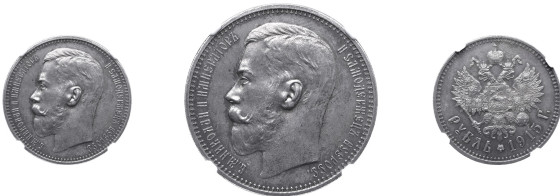
816. Russia, Empire. Nicholas II AR Rouble. St. Petersburg mint, 1915. Victor Smirnov, mintmaster. Б.М.НИКОЛАЙ II ИМПЕРАТОРЪ И САМОДЕРЖЕЦЪ ВСЕРОСС., bare head to left / Crowned double-headed eagle facing with wings spread, wearing shield on breast depicting St. George slaying the dragon, with shields arranged across wings, and holding sceptre and orb; crown with ribbons above, denomination and date below. Edge inscription: ЧИСТАГО СЕРЕБРА 4 ЗО ЛОТНИКА 21 ДОЛА (В•С). Bitkin 70.

From the GK Collection (France) of Russian Coins.