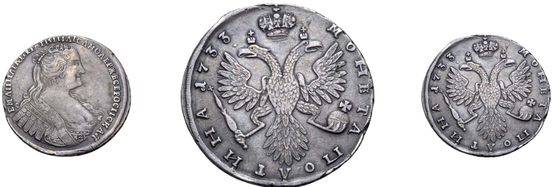
124. Russia, Empire. Anna Ivanovna AR Poltina (50 Kopeck). Kadashevsky mint, 1733. Б М АННА ИМПЕРАТРИЦА І САМОДЕРЖ ВСЕРОССИСКАЯ, crowned and draped bust to right / Crowned double-headed eagle facing, holding sceptre and orb; crown above, denomination and date around. Bitkin 152 (same rev. die). 12.26g, 35mm, 12h.

Near Extremely Fine; deep cabinet tone. Very Rare; this obv. die not listed in Bitkin.