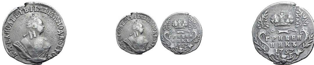
191. Russia, Empire. Elizabeth AR Grivennik (10 Kopeck). Red mint, 1757 МБ. Б • М • ЕЛИСАВЕТЪ • І • ІМП : І САМОД : ВСЕРОС, crowned and draped bust to right / Crowned and wreathed cartouche inscribed with denomination and date above М-Б. Bitkin 232. 2.45g, 20mm, 12h.