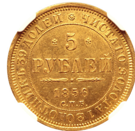
614. Russia, Empire. Alexander II AV 5 Rouble. St. Petersburg mint, 1856. Alexander Gertov, mintmaster. Crowned double-headed eagle facing with wings spread, wearing shield on breast depicting St. George slaying the dragon, with shields arranged across wings, and holding sceptre and orb; crown above, А-Г across lower fields / ЧИСТАГО ЗОЛОТА 1 ЗОЛОТНИКЪ 39 ДОЛЕЙ, denomination over date, С.П.Б. below; two rosettes across upper fields. Bitkin 2.