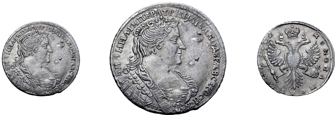
120. Russia, Empire. Anna Ivanovna AR Poltina (50 Kopeck). Kadashevsky mint, 1732. Б М АННА ІМПЕРАТРИЦА І САМОДЕРЖ ВСЕРОСИСКАЯ, crowned and draped bust to right / Crowned double-headed eagle facing, holding cross-tipped sceptre and orb; crown above, denomination and date around. Bitkin -, cf. 139 for obv. die and 140 for rev. die. 12.32g, 34mm, 12h.

Extremely Fine; a few minor planchet flaws. Rare rev. variant showing a cross-tipped sceptre.