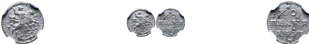
39. Russia, Tsardom. Peter I 'the Great' AR Kopeck. Red mint, 1718. St. George on horseback to right, brandishing spear / Denomination over date; pellet (mark of value) above, inverted L below. Bitkin 1286. 0.45g.

From the GK Collection (France) of Russian Coins.