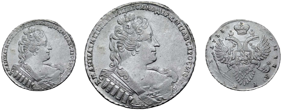
122. Russia, Empire. Anna Ivanovna AR Rouble. Kadashevsky mint, 1733. Б • М • АННА • ИМПЕРАТРИЦА • І САМОДЕРЖИЦА • ВСЕРОССИСКАЯ •, crowned and draped bust to right / Crowned double-headed eagle facing with wings spread, wearing shield on breast depicting St. George slaying the dragon, and holding sceptre and orb; crown above, denomination and date around. Bitkin -, cf. 61f. 25.63g, 40mm, 12h.