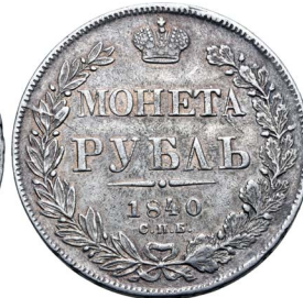
546. Russia, Empire. Nicholas I AR Rouble. St. Petersburg mint, 1840. Nikolay Grachev, mintmaster. * ЧИСТАГО СЕРЕБРА 4 ЗОЛЮТНИКА 21 ДОЛЯ, crowned double-headed eagle facing with wings spread, wearing shield on breast depicting St. George slaying the dragon, with shields arranged across wings, and holding sceptre and orb; crown above, Н-Г across lower fields / Denomination over date, С.П.Б. below; crown above and wreath around. Edge inscription: • СЕР • 83 1/3 ПРОБЫ 4 ЗОЛ • 82 14/25 ДОЛИ. Bitkin 190.