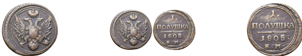
440. Russia, Empire. Alexander I CU Polushka (1/4 Kopeck). Ekaterinburg mint, 1808. Crowned double-headed eagle facing, holding sceptre and orb, with crown above; all within two concentric linear circles / Denomination over date, E.M. below; all within two concentric linear circles. Bitkin 334. 2.79g, 19mm, 12h.