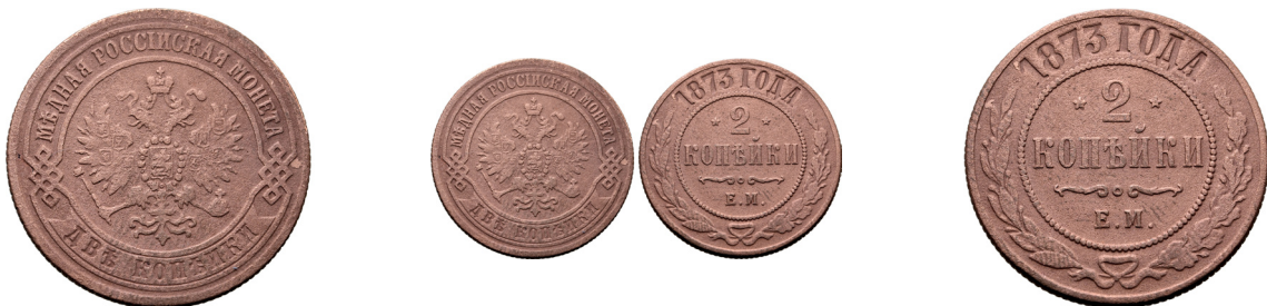
677. Russia, Empire. Alexander II CU 2 Kopeck. Ekaterinburg mint, 1873. Crowned double-headed eagle facing with wings spread, wearing shield on breast depicting St. George slaying the dragon, with shields arranged across wings, and holding sceptre and orb; crown with ribbons above, МБДНАЯ РОССІЙСКАЯ МОНЕТА and denomination in ornamented banner around / Denomination above Е.М., surrounded by inner circle of pellets; date above and wreath around. Bitkin 418. 6.04g, 24mm, 12h.

From the GK Collection (France) of Russian Coins.