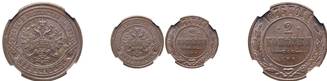
688. Russia, Empire. Alexander II CU 2 Kopeck. St. Petersburg mint, 1876. Crowned double-headed eagle facing with wings spread, wearing shield on breast depicting St. George slaying the dragon, with shields arranged across wings, and holding sceptre and orb; crown with ribbons above, МЪДНАЯ РОССИЙСКАЯ МОНЕТА and denomination in ornamented banner around / Denomination above С.П.Б., surrounded by inner circle of pellets; date above and wreath around. Bitkin 526.

From the GK Collection (France) of Russian Coins.