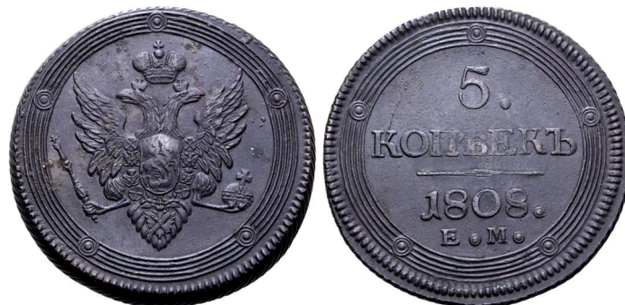
439. Russia, Empire. Alexander I CU 5 Kopeck. Ekaterinburg mint, 1808. Crowned double-headed eagle facing with wings spread, wearing shield on breast depicting St. George slaying the dragon, and holding sceptre and orb; crown above, all surrounded by decorated border / Denomination over date, E.M. below; all surrounded by decorated border. Bitkin 297. 50.88g, 43mm, 12h.

From the GK Collection (France) of Russian Coins.