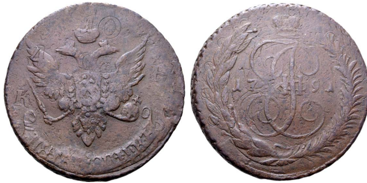
397. Russia, Empire. Paul I CU 5 Kopeck. Uncertain mint, 1797. Crowned double-headed eagle facing with wings spread, wearing shield on breast depicting St. George slaying the dragon, and holding sceptre and orb; crown above, denomination on scroll below / Crowned monogram within wreath; original strike's date across fields. Bitkin 96. 52.82g, 46mm, 12h.

From the GK Collection (France) of Russian Coins.