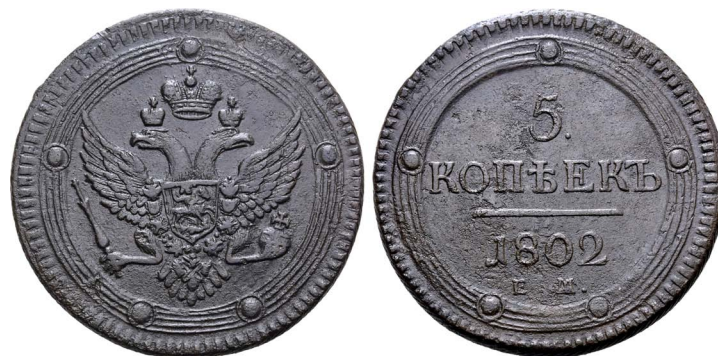
420. Russia, Empire. Alexander I CU 5 Kopeck. Ekaterinburg mint, 1802. Crowned double-headed eagle facing with wings spread, wearing shield on breast depicting St. George slaying the dragon, and holding sceptre and orb; crown above, all surrounded by decorated border / Denomination over date, E.M. below; all surrounded by decorated border. Bitkin 283. 47.37g, 43mm, 12h.

From the GK Collection (France) of Russian Coins.