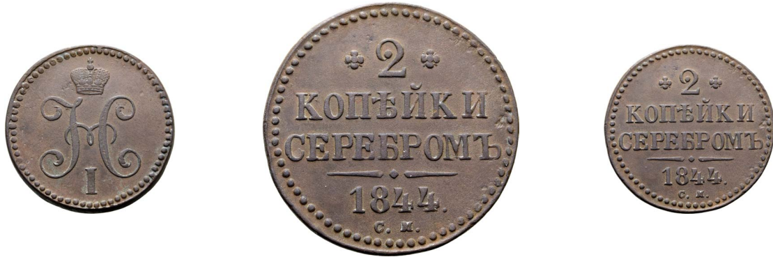
571. Russia, Empire. Nicholas I CU 2 Kopeck. Suzun mint, 1844. Crowned monogram / Denomination over date; C.M. below. Bitkin 747. 18.90g, 32mm, 12h.

From the GK Collection (France) of Russian Coins.