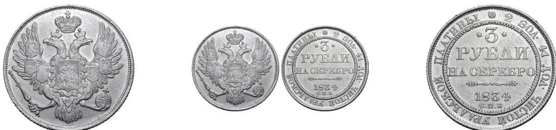
523. Russia, Empire. Nicholas I PT 3 Rouble. St. Petersburg mint, 1834. Crowned double-headed eagle facing with wings spread, wearing shield on breast depicting St. George slaying the dragon, and holding sceptre and orb; crown above / * 2 ЗОЛ• 41 ДОЛ• ЧИСТОЙ УРАЛЬСКОЙ ПЛАТИНЫ, denomination over date, С.П.Б. below; two flowers across upper fields. Bitkin 80. 10.27g, 23mm, 12h.

From the GK Collection (France) of Russian Coins.