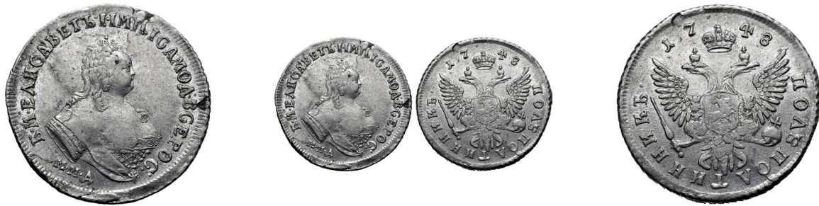
166. Russia, Empire. Elizabeth AR Polupoltinnik (25 Kopeck). Red mint, 1748. Б • М • ЕЛИСАВЕТЬ • І • ІМП : І САМОД : ВСЕРОС ; crowned and draped bust to right; М•М•Д below / Crowned double-headed eagle facing with wings spread, wearing shield on breast depicting St. George slaying the dragon, and holding sceptre and orb; crown above, denomination and date around. Bitkin 161. 6.51g, 25mm, 12h.