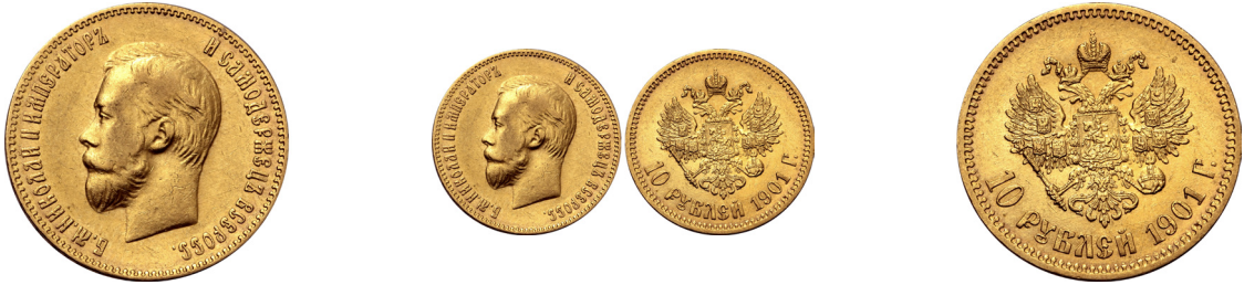
773. Russia, Empire. Nicholas II AV 10 Rouble. St. Petersburg mint, 1901. Felix Zelman, mintmaster. Б.М.НИКОЛАЙ II ИМПЕРАТОРЪ И САМОДЕРЖЕЦЪ ВСЕРОСС., bare head to left / Crowned double-headed imperial eagle facing, wearing shield on breast depicting St. George slaying the dragon, with shields arranged across wings, and holding sceptre and orb; crown above, denomination and date below. Edge inscription: 1 ЗОЛЮТНИК 78.24 ДОЛИ ЧИСТОГО ЗОЛЮТА (Ф•З). Bitkin 8. 8.60g, 22mm, 12h.