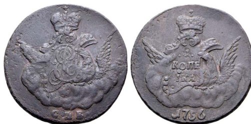
186. Russia, Empire. Elizabeth CU Kopeck. St. Petersburg mint, 1756. Eagle with wings spread emerging to right from clouds, with head to left, supporting ornate shield inscribed with monogram; crown above, СІБ below / Eagle with wings spread emerging to right from clouds, with head to left, supporting ornate shield inscribed with denomination; crown above, date below. Bitkin 534. 18.90g, 32mm, 6h.

From the GK Collection (France) of Russian Coins.