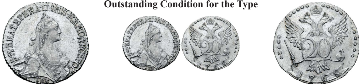
260. Russia, Empire. Catherine II AR 20 Kopeck. St. Petersburg mint, 1768. Б • М • ЕКАТЕРИНА • П • ИМП • ІСАМОД • ВСЕРОС, crowned and draped bust to right; СІБ below, ТІ on bust truncation / Crowned double-headed eagle facing with wings spread, wearing shield inscribed with denomination on breast and holding sceptre and orb; crown above, 20 pellets around and date on scroll below. Bitkin 375. 4.76g, 23mm, 12h.

Near Mint State; hairline on obv., outstanding condition for the type.