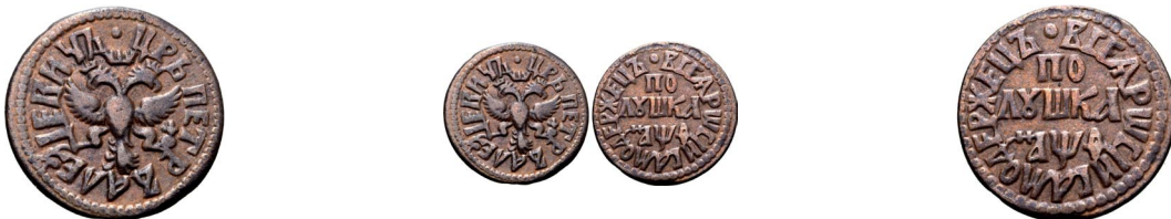
16. Russia, Tsardom. Peter I 'the Great' CU Polushka (1/4 Kopeck). Naberezhny mint, 1709. • ЦРЬ ПЕТРЪ АЛЕЖІЕВИЧЪ, crowned double-headed eagle facing, holding sceptre and orb / • ВСЕА РОССІИ САМОДЕРЖЕЦЪ around denomination above date. Bitkin -, cf. 2950 (same obv. die). 1.88g, 18mm, 12h.

Near Extremely Fine; harshly cleaned, but still favourably comparable to the example of Sincona 7 in 2012 (lot 56), which hammered for CHF 1,900. Extremely Rare. 180