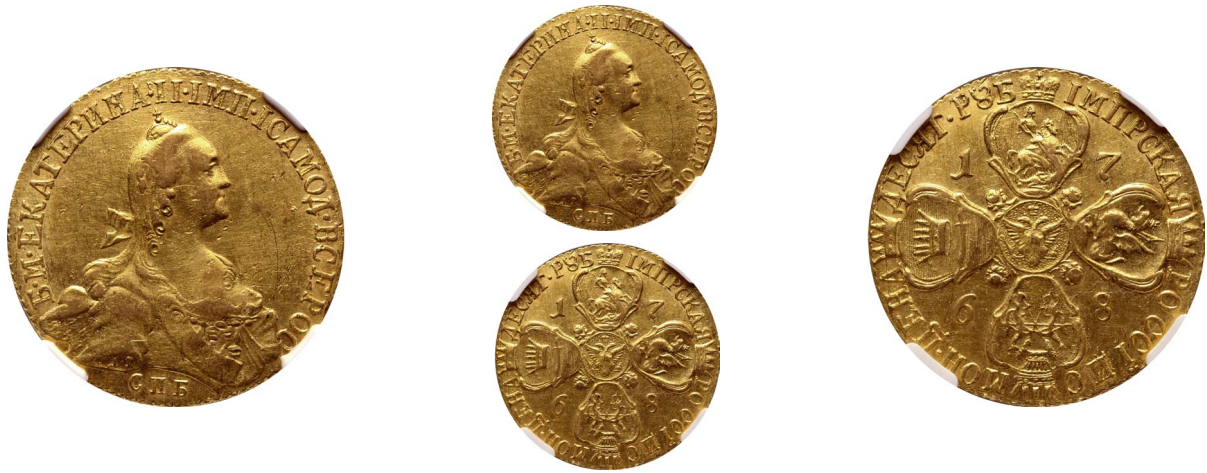
259. Russia, Empire. Catherine II AV 10 Rouble. St. Petersburg mint, 1768. Dies by Timofei Ivanov. Б • М • ЕКАТЕРИНА • П • ИМП • ІСАМОД • ВСЕРОС, crowned and draped bust to right; •Т•І• on arm truncation, СІБ below / ІМПРСКАЯ РОССІС МОН • ЦЕНА ДЕСЯТ • РҮБ, crowned coats-of-arms of four Tsardoms, with central ornamented coat-of-arms of Russian Empire; date in quarters. Bitkin 19.

NGC graded AU Details, harshly cleaned (#6672945-014). Rare.