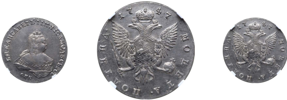
164. Russia, Empire. Elizabeth AR Poltina (50 Kopeck). St. Petersburg mint, 1747. Б • М • ЕЛИСАВЕТЪ • I • ИМП : I САМОД : ВСЕРОС ., crowned and draped bust to right; С ПБ below / Crowned double-headed eagle facing with wings spread, wearing shield on breast depicting St. George slaying the dragon, and holding sceptre and orb; crown above, denomination and date around. Bitkin 307.

NGC graded UNC Details, obv. tooled (#6672951-005). Very Rare.