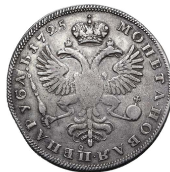
78. Russia, Empire. Catherine I AR Rouble. St Petersburg mint, 1725. ЕКАТЕРІНА • ІМПЕРАТРИЦА • І САМОДЕРЖИЦА • ВСЕРОСІСКАЯ •, bust 'in mourning' to left / МОНЕТА • НОВАЯ • ЦЕНА • РУБЛЬ • (date), crowned double-headed eagle facing, holding sceptre and orb; crown above. Bitkin 69. 27.93g, 44mm, 12h.

Near Extremely Fine; altered surface. Very Rare.