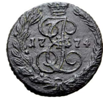
297. Russia, Empire. Catherine II CU Polushka (1/4 Kopeck). Ekaterinburg mint, 1774. St. George on horseback to right, slaying dragon with spear; E-M below horse, denomination on scroll below / Crowned monogram, date across fields; all within wreath. Bitkin 754. 2.79g, 17mm, 12h.

Extremely Fine. Exceedingly Rare; rated R4 by Bitkin, and none in CoinArchives.