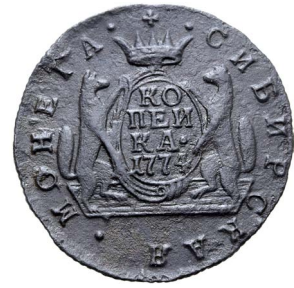
296. Russia, Empire. Catherine II CU Kopeck. Suzun mint, 1774. Crowned monogram within wreath; K-M across lower fields / • СИБИРСКАЯ • МОХЕТА •, two sables holding crowned cartouche inscribed with denomination and date; cross above. Bitkin 1148. 5.95g, 25mm, 12h.