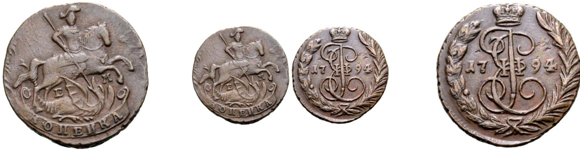
376. Russia, Empire. Catherine II CU Kopeck. Ekaterinburg mint, 1794. St. George on horseback to right, slaying dragon with spear; E-M across fields, denomination on scroll below / Crowned monogram within wreath; date across fields. Bitkin 703. 9.46g, 26mm, 12h.