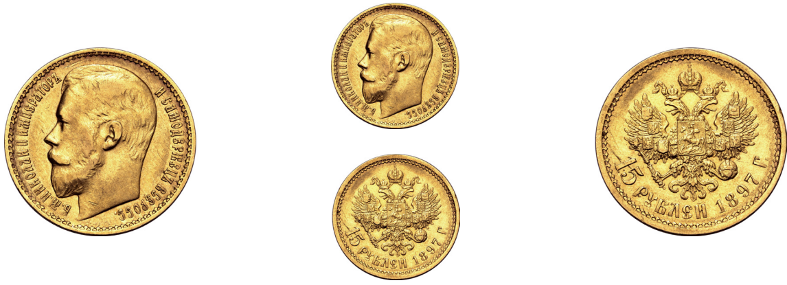
750. Russia, Empire. Nicholas II AV 15 Rouble. St. Petersburg mint, 1897. Apollon Grasgof, mintmaster. Б.М.НИКОЛАЙ II ИМПЕРАТОРЪ И САМОДЕРЖЕЦЪ ВСЕРОСС., bare head to left / Crowned double-headed eagle facing with wings spread, wearing shield on breast depicting St. George slaying the dragon, with shields arranged across wings, and holding sceptre and orb; crown with ribbons above, denomination and date below. Edge inscription: ЧИСТАГО ЗОЛОТА 2 ЗО ЛЮТНИКА 69.36 ДОЛЕЙ (А•І). Bitkin 2. 12.88g, 24mm, 12h.