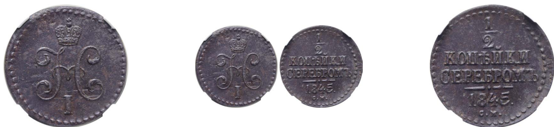
573. Russia, Empire. Nicholas I CU 1/2 Kopeck. Suzun mint, 1845. Crowned monogram / Denomination over date; C.M. below. Bitkin 785.

NGC graded MS 62 BN (#2806364-016); only two graded higher.