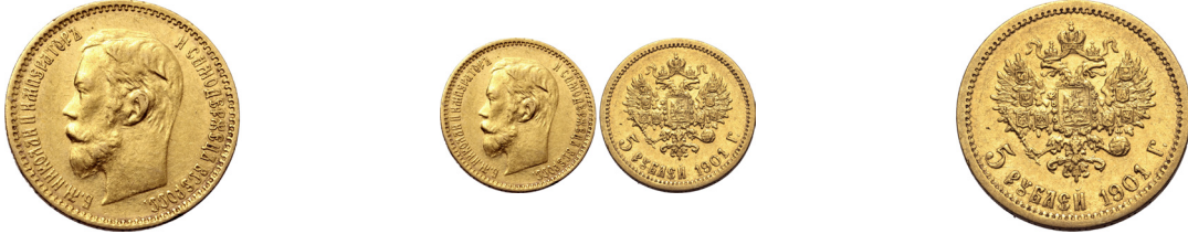
774. Russia, Empire. Nicholas II AV 5 Rouble. St. Petersburg mint, 1901. Alexander Redko, mintmaster. Б.М.НИКОЛАЙ II ИМПЕРАТОРЪ И САМОДЕРЖЕЦЪ ВСЕРОСС., bare head to left / Crowned double-headed imperial eagle facing, wearing shield on breast depicting St. George slaying the dragon, with shields arranged across wings, and holding sceptre and orb; crown above, denomination and date below. A P inscribed on patterned edge. Bitkin 28. 4.28g, 19mm, 12h.

From the GK Collection (France) of Russian Coins.