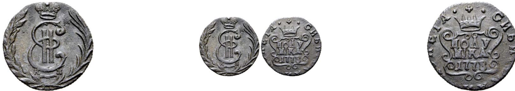
312. Russia, Empire. Catherine II CU Polushka (1/4 Kopeck). Suzun mint, 1778. Crowned monogram, K-M across lower fields; all within wreath / • СИБИРСКАЯ • МОНЕТА •, crowned cartouche inscribed with denomination and date; rosette above. Bitkin 1230. 1.58g, 16mm, 12h.

From the GK Collection (France) of Russian Coins.