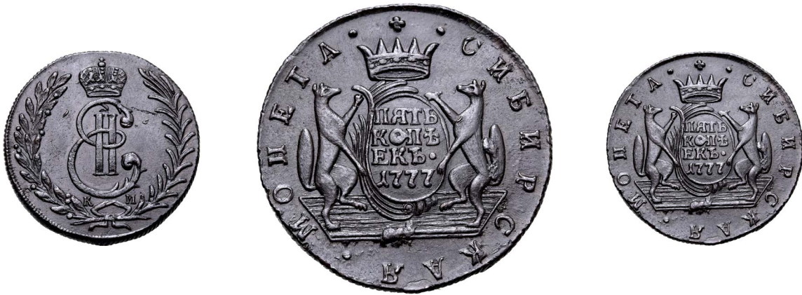
308. Russia, Empire. Catherine II CU 5 Kopeck. Suzun mint, 1777. Crowned monogram, К-М across lower fields; all within wreath / • СИБИРСКАЯ • МОНЕТА •, two sables holding crowned cartouche inscribed with denomination and date; cross above. Bitkin 1080. 33.77g, 37mm, 12h.

From the GK Collection (France) of Russian Coins.