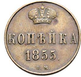
612. Russia, Empire. Alexander II CU Kopeck. Warsaw mint, 1855. Crowned monogram / Denomination over date; crown above, В.М. below. Bitkin 473. 5.07g, 23mm, 12h.