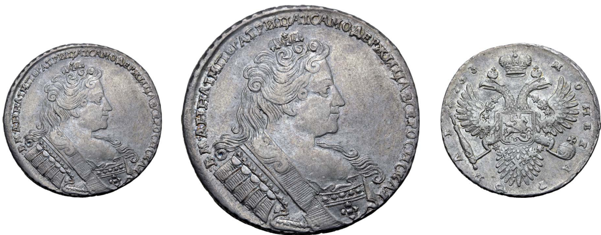
121. Russia, Empire. Anna Ivanovna AR Rouble. Kadashevsky mint, 1733. • Б М • АННА • ІМПЕРАТРИЦА • І САМОДЕРЖИЦА • ВСЕРОСИСКАЯ, crowned and draped bust to right / Crowned double-headed eagle facing with wings spread, wearing shield on breast depicting St. George slaying the dragon, and holding sceptre and orb; crown above, denomination and date around. Bitkin 76 (obv. die), - (rev. die, cf. 76-77). 25.31g, 40mm, 12h.

From the GK Collection (France) of Russian Coins.