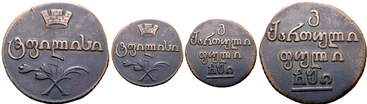
487. Russia, Empire. Georgia Governorate CU Bisti. Tiflis mint, 1810. ტფილისი ; bricked crown above, crossed olive and palm branches below / ქართული ფული in three lines; date below. Bitkin 790. 14.58g, 32mm, 12h.

From the GK Collection (France) of Russian Coins.