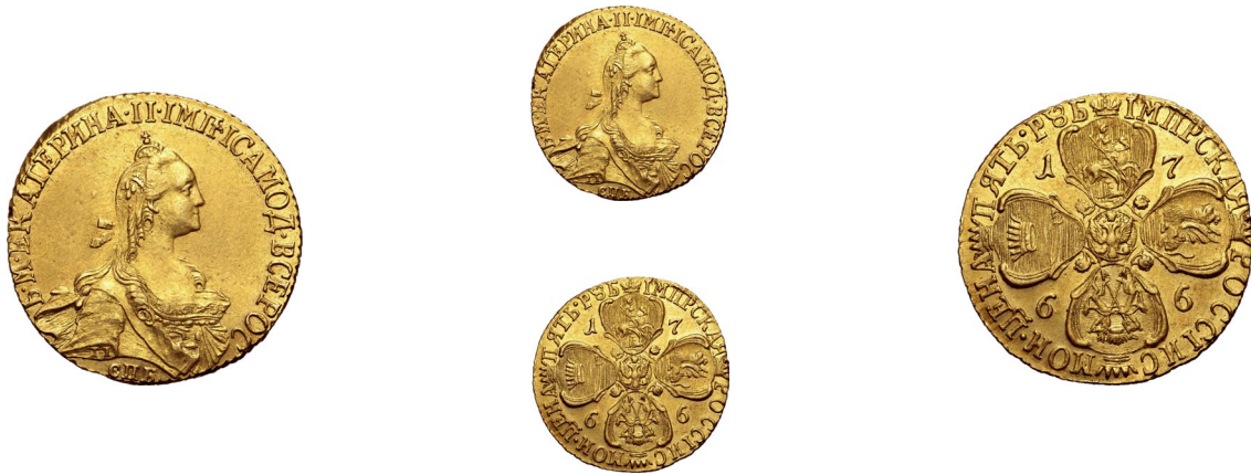
242. Russia, Empire. Catherine II AV 5 Rouble. St. Petersburg mint, 1766. Dies by Timofei Ivanov; Б • М • ЕКАТЕРИНА • П • ИМП • ИСАМОД • ВСЕРОС, crowned and draped bust to right; СПб below / ИМПРСКАЯ РОССІИС МОН • (denomination), crowned coats-of-arms of four Tsardoms, with central ornamented coat-of-arms of Russian Empire; date in quarters. Bitkin 60. 6.33g, 23mm, 12h.

Near Mint State; lightly smoothed on breast. Rare.