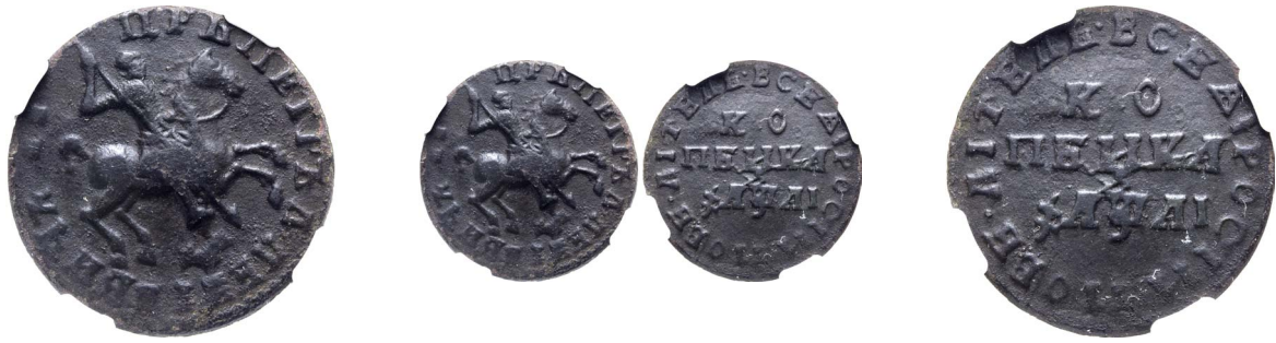
19. Russia, Tsardom. Peter I 'the Great' CU Kopeck. Kadashevsky mint, 1711. ЦРЬ ПЕТРЪ АЛЕЪЕВИЧЪ ХХ, St. George on horseback to right, brandishing spear; МД below / • ВСЕА РОССІИ ПОВЕЛІТЕЛЪ around denomination above date. Bitkin 3419. 8.12g.

NGC graded VF Details, burnished (#6322219-006). No others on CoinArchives.