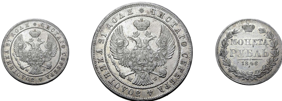
575. Russia, Empire. Nicholas I AR Rouble. Warsaw mint, 1846. * ЧИСТАГО СЕРЕБРА 4 ЗОЛОТНИКА 21 ДОЛЯ, crowned double-headed eagle facing with wings spread, wearing shield on breast depicting St. George slaying the dragon, with shields arranged across wings, and holding sceptre and orb; crown above, М-В across lower fields / Denomination over date; crown above and wreath around. Edge inscription: • СЕР • 83 1/3 ПРОБЫ 4 ЗОЛ • 82 14/25 ДОЛИ. Bitkin 425. 2.64g, 36mm, 12h.

From the GK Collection (France) of Russian Coins.