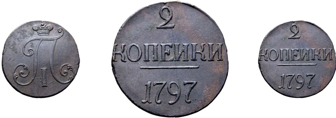
399. Russia, Empire. Paul I CU 2 Kopeck. Uncertain mint, 1797. Crowned monogram / Denomination over date. Bitkin 192. 19.01g, 35mm, 12h.