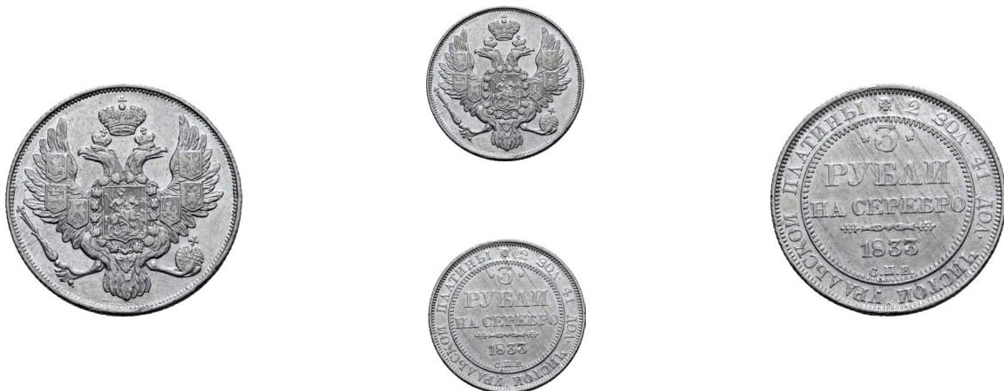
522. Russia, Empire. Nicholas I PT 3 Rouble. St. Petersburg mint, 1833. Crowned double-headed eagle facing with wings spread, wearing shield on breast depicting St. George slaying the dragon, and holding sceptre and orb; crown above / * 2 ЗОЛ• 41 ДОЛ• ЧИСТОЙ УРАЛЬСКОЙ ПЛАТИНЫ, denomination over date, С.П.Б. below; two flowers across upper fields. Bitkin 79. 10.34g, 23mm, 12h.

From the GK Collection (France) of Russian Coins.