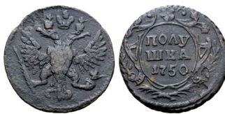
172. Russia, Empire. Elizabeth CU Polushka (1/4 Kopeck). Ekaterinburg mint, 1750. Crowned double-headed eagle facing, holding sceptre and orb; crown above / Elaborately ornamented cartouche inscribed with denomination and date. Bitkin 417. 4.26g, 21mm, 1h.

From the GK Collection (France) of Russian Coins.