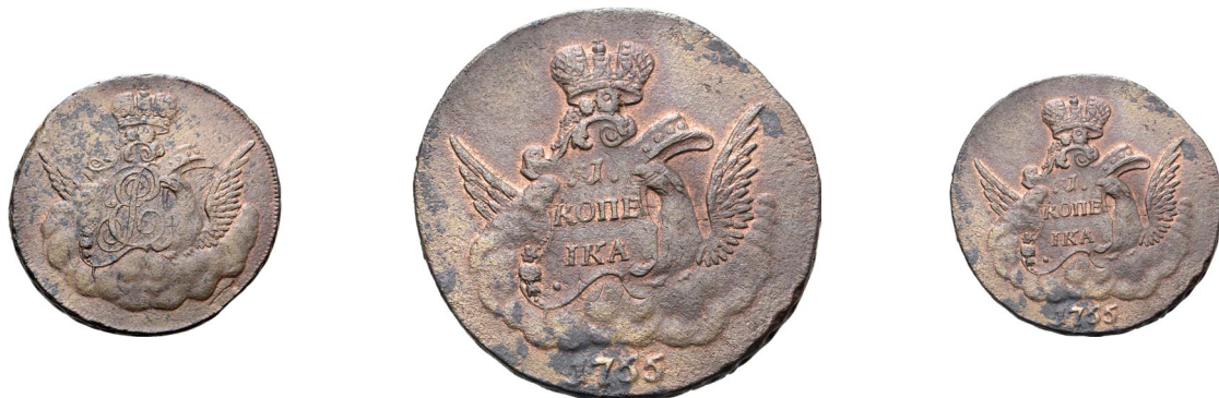
182. Russia, Empire. Elizabeth CU Kopeck. Red mint, 1755. Eagle with wings spread emerging to right from clouds, with head to left, supporting ornate shield inscribed with monogram; crown above / Eagle with wings spread emerging to right from clouds, with head to left, supporting ornate shield inscribed with denomination; crown above, date below. Bitkin 382. 19.67g, 32mm, 6h.

From the GK Collection (France) of Russian Coins.