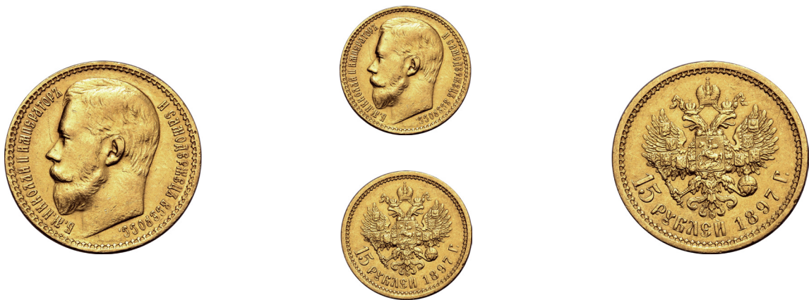
751. Russia, Empire. Nicholas II AV 15 Rouble. St. Petersburg mint, 1897. Apollon Grasgof, mintmaster. Б.М.НИКОЛАЙ II ИМПЕРАТОРЪ И САМОДЕРЖЕЦЪ ВСЕРОСС., bare head to left / Crowned double-headed imperial eagle facing, wearing shield on breast depicting St. George slaying the dragon, with shields arranged across wings, and holding sceptre and orb; crown above, denomination and date below. Edge inscription: ЧИСТАГО ЗОЛОТА 2 ЗО ЛЮТНИКА 69.36 ДОЛЕЙ (А•Г). Bitkin 2. 12.89g, 24mm, 12h.

The edge of this coin has a minor engraving error, reading А•І instead of А•Г (the mark of Apollon Grasgof, mintmaster).