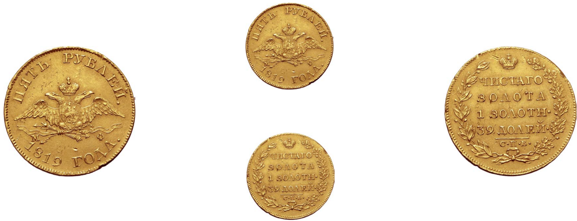
472. Russia, Empire. Alexander I AV 5 Rouble. St. Petersburg mint, 1819. Mikhail Fedorov, mintmaster. Double-headed eagle facing with wings spread, wearing crowned shield on breast depicting St. George slaying the dragon, and holding ribboned wreath and crossed thunderbolt and torches; denomination above, М-Ф across lower fields, date below / ЧИСТАГО ЗОЛОТА 1 ЗОЛОТН 39 ДОЛЕЙ in four lines above С•П•Б.; all surrounded by wreath; crown above. Bitkin 20. 6.60g, 23mm, 12h.

NGC graded UNC Details, damaged, cleaned (#6674411-002).