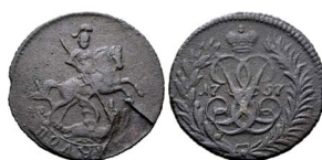
195. Russia, Empire. Elizabeth CU Polushka (1/4 Kopeck). Ekaterinburg mint, 1757. St. George on horseback to right, slaying dragon with spear; denomination on scroll below / Crowned monogram, date across fields; all within wreath. Bitkin 511. 2.47g, 19mm, 12h.

From the GK Collection (France) of Russian Coins.