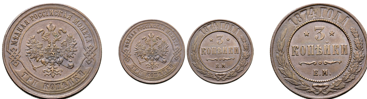
683. Russia, Empire. Alexander II CU 3 Kopeck. Ekaterinburg mint, 1874. Crowned double-headed eagle facing with wings spread, wearing shield on breast depicting St. George slaying the dragon, with shields arranged across wings, and holding sceptre and orb; crown with ribbons above, МѢДНАЯ РОССИЙСКАЯ МОНЕТА and denomination in ornamented banner around / Denomination above Е.М., surrounded by inner circle of pellets; date above and wreath around. Bitkin 409. 9.72g, 28mm, 12h.

From the GK Collection (France) of Russian Coins.