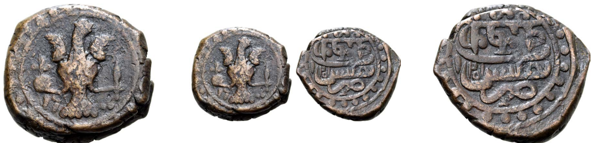
392. Georgia, Kingdom of Kartli-Kakheti (Russian Protectorate). Heraclius II CU Bisti. Tiflis mint, AH 1210 = 1796. Eagle facing, with wings spread, and holding sceptre and orb; all within two concentric linear circles encasing a pelleted circle / Ruler's name in Georgian above mint name in Persian; all within two concentric linear circles encasing a pelleted circle. Bitkin 13. 20.53g, 27mm, 11h.

From the GK Collection (France) of Russian Coins.