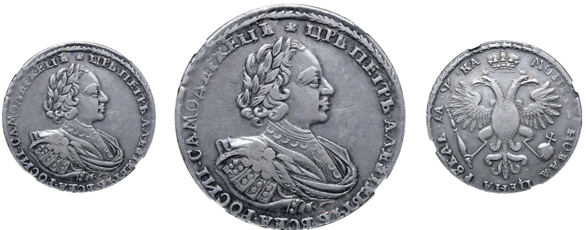
63. Russia, Empire. Peter I 'the Great' AR Rouble. Kadashevsky mint, 1721. ЦРЬ • ПЕТРЪ • АЛЕЖІЕВИЧЪ • ВСЕА • РОСИИ • САМОДЕРЖЕЦЪ, laureate, draped and cuirassed bust to right / МОНЕТА • НОВАА • ЦЕНА • РҮБЛЬ • (date), crowned double-headed eagle facing, holding sceptre and orb; crown above. Bitkin 448. 28.92g.

From the GK Collection (France) of Russian Coins.