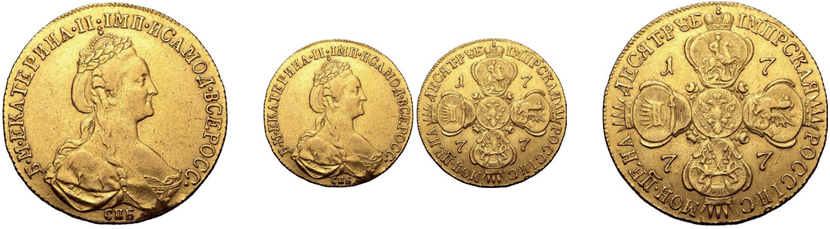
306. Russia, Empire. Catherine II AV 10 Rouble. St. Petersburg mint, 1777. Б • М • ЕКАТЕРИНА • II • ИМП • ИСАМОД • ВСЕРОСС •, crowned and draped bust to right; СПБ below / ИМПРСКАЯ РОССІИ С МОН • (denomination), crowned coats-of-arms of four Tsardoms, with central ornamented coat-of-arms of Russian Empire; date in quarters. Bitkin 34. 13.04g, 28mm, 12h.