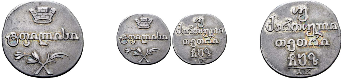
485. Russia, Empire. Georgia Governorate AR 2 Abazi. Tiflis mint, 1807. ტფილისი ; bricked crown above, crossed olive and palm branches below / ქართული თეთრი in three lines; date above A.K below. Bitkin 727. 6.18g, 25mm, 12h.

From the GK Collection (France) of Russian Coins.