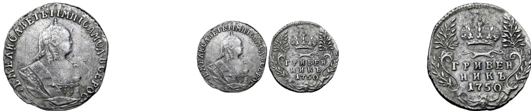
171. Russia, Empire. Elizabeth AR Grivennik (10 Kopeck). Red mint, 1750. Б • М • ЕЛИСАВЕТЪ • І • ІМП : ІСАМОД : ВСЕРОС, crowned and draped bust to right / Crowned and wreathed cartouche inscribed with denomination and date. Bitkin 211. 2.08g, 20mm, 11h.

From the GK Collection (France) of Russian Coins.