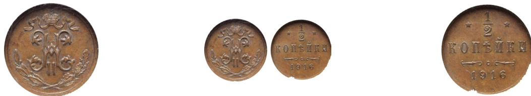
824. Russia, Empire. Nicholas II CU 1/2 Kopeck. St. Petersburg mint, 1916. Monogram; crown with ribbons above, wreath around / Denomination over date. Bitkin 276.

From the GK Collection (France) of Russian Coins.