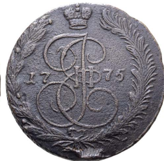
298. Russia, Empire. Catherine II CU 5 Kopeck. Ekaterinburg mint, 1775. Crowned double-headed imperial eagle facing, wearing shield on breast depicting St. George slaying the dragon, and holding sceptre and orb; crown above, E-M across lower fields, denomination in scroll below / Crowned monogram within wreath; date across fields. Bitkin 624. 47.22g, 42mm, 12h.