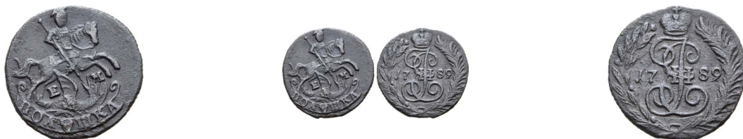
355. Russia, Empire. Catherine II CU Polushka (1/4 Kopeck). Ekaterinburg mint, 1789. St. George on horseback to right, slaying dragon with spear; E-M across fields, denomination on scroll below / Crowned monogram, date across fields; all within wreath. Bitkin 759. 2.65g, 17mm, 12h.

From the GK Collection (France) of Russian Coins.