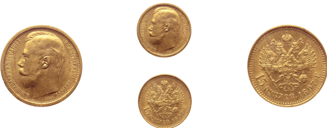
752. Russia, Empire. Nicholas II AV 15 Rouble. St. Petersburg mint, 1897. Apollon Grasgof, mintmaster. Б.М.НИКОЛАЙ II ИМПЕРАТОРЪ И САМОДЕРЖЕЦЪ ВСЕРОСС., bare head to left / Crowned double-headed eagle facing with wings spread, wearing shield on breast depicting St. George slaying the dragon, with shields arranged across wings, and holding sceptre and orb; crown with ribbons above, denomination and date below. Edge inscription: ЧИСТАГО ЗОЛОТА 2 ЗО ЛЮТНИКА 69.36 ДОЛЕЙ (А•Г). Bitkin 1.

From the GK Collection (France) of Russian Coins.