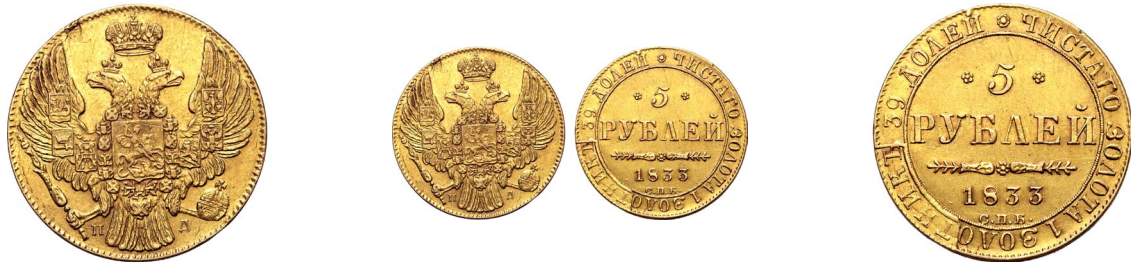
521. Russia, Empire. Nicholas I AV 5 Rouble. St. Petersburg mint, 1833. Pavel Danilov, mintmaster. Crowned double-headed eagle facing with wings spread, wearing shield on breast depicting St. George slaying the dragon, with shields arranged across wings, and holding sceptre and orb; crown above, П-Д across lower fields / * ЧИСТАГО ЗОЛОТА І ЗОЛЮТНИКЪ 39 ДОЛЕЙ, denomination over date; С.П.Б. below, two flowers across upper fields. Bitkin 8. 6.60g, 23mm, 12h.

From the GK Collection (France) of Russian Coins.