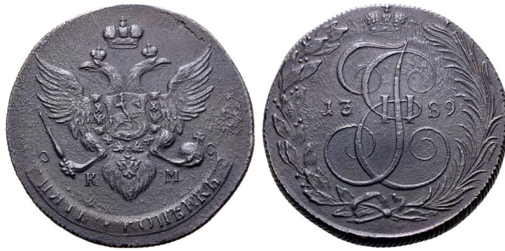
351. Russia, Empire. Catherine II CU 5 Kopeck. Suzun mint, 1789. Crowned double-headed imperial eagle facing, wearing shield on breast depicting St. George slaying the dragon, and holding sceptre and orb; crown above, K-M across lower fields, denomination in scroll below / Crowned monogram within wreath; date across fields. Bitkin 799. 51.36g, 43mm, 12h.