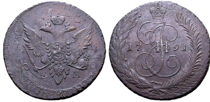
396. Russia, Empire. Paul I CU 5 Kopeck. Uncertain mint, 1797. Crowned double-headed eagle facing with wings spread, wearing shield on breast depicting St. George slaying the dragon, and holding sceptre and orb; crown above, E-M: across fields, denomination on scroll below / Crowned monogram within wreath; original strike's date across fields. Bitkin 98. 50.88g, 45mm, 12h.

Very Fine; overstruck as part of Paul I's recoinage of old issues in 1797. Very Rare.