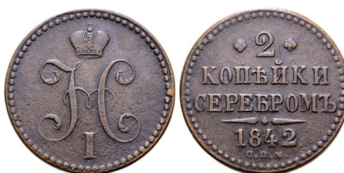
562. Russia, Empire. Nicholas I CU 2 Kopeck. Izhora mint, 1842. Crowned monogram / Denomination above date; С.П.М. below. Bitkin 821. 19.41g, 32mm, 1h.

From the GK Collection (France) of Russian Coins.