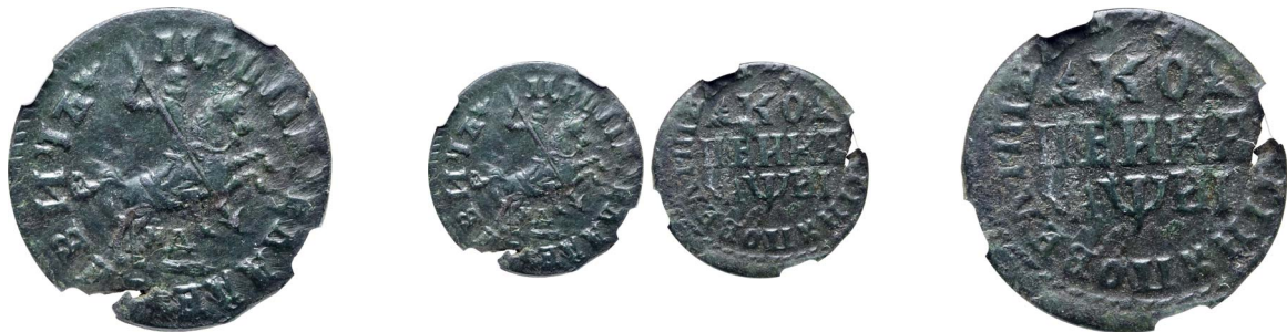
40. Russia, Tsardom. Peter I 'the Great' CU Kopeck. Kadashevsky mint, 1718. ЦРЬ ПЕТРЪ АЛЕЖЕВИЧЪ, St. George on horseback to right, brandishing spear; МД below / ВСЕА РОССИИ Х ПОВЕЛИИТЕЛЬ around denomination above date; acanthus leaves in upper left and right fields. Bitkin 3559. 7.75g.

From the GK Collection (France) of Russian Coins.