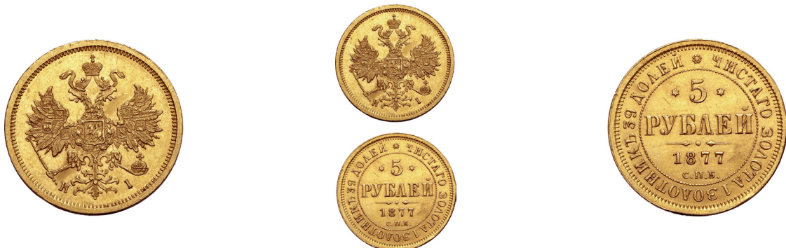
689. Russia, Empire. Alexander II AV 5 Rouble. St. Petersburg mint, 1877. Nikolay Iossa, mintmaster. Crowned double-headed eagle facing with wings spread, wearing shield on breast depicting St. George slaying the dragon, with shields arranged across wings, and holding sceptre and orb; crown with ribbons above, Н-I across lower fields / ❖ ЧИСТАГО ЗОЛОТА 1 ЗОЛОТНИКЪ 39 ДОЛЕЙ, denomination over date; С.П.Б. below, two stars across upper fields. Bitkin 25. 6.55g, 22mm, 12h.

From the GK Collection (France) of Russian Coins.