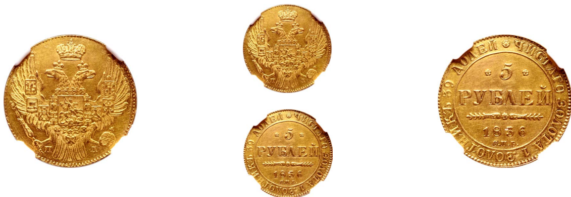
531. Russia, Empire. Nicholas I AV 5 Rouble. St. Petersburg mint, 1836. Pavel Danilov, mintmaster. Crowned double-headed imperial eagle facing, wearing shield on breast depicting St. George slaying the dragon, with shields arranged across wings, and holding sceptre and orb; crown above, П-Д across fields below / ЧИСТАГО ЗОЛЮТА І ЗОЛЮТНИКЪ 39 ДОЛЕЙ, denomination above date, С.П.Б. below, two flowers across upper fields. Bitkin 13. 6.44g, 23mm, 12h.

From the GK Collection (France) of Russian Coins.