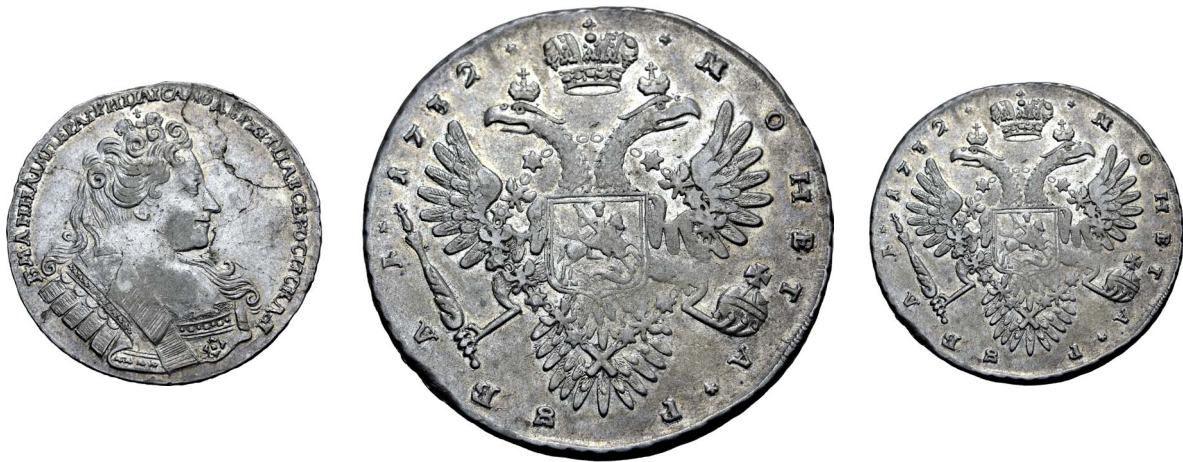
119. Russia, Empire. Anna Ivanovna AR Rouble. Kadashevsky mint, 1732. Б М АННА ІМПЕРАТРИЦА І САМОДЕРЖИЦА ВСЕРОСИСКАЯ, crowned and draped bust to right / Crowned double-headed eagle facing with wings spread, wearing shield on breast depicting St. George slaying the dragon, and holding sceptre and orb; crown above, denomination and date divided by stars around. Bitkin 58 (same rev. die). 25.36g, 41mm, 12h.

Near Extremely Fine; planchet flaw to obv., light cabinet tone. Rare.