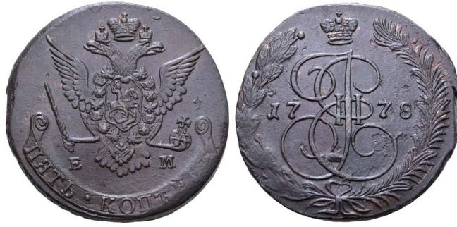
310. Russia, Empire. Catherine II CU 5 Kopeck. Ekaterinburg mint, 1778. Crowned double-headed imperial eagle facing, wearing shield on breast depicting St. George slaying the dragon, and holding sceptre and orb; crown above, E-M across lower fields, denomination in scroll below / Crowned monogram within wreath; date across fields. Bitkin 627. 53.88g, 42mm, 12h.