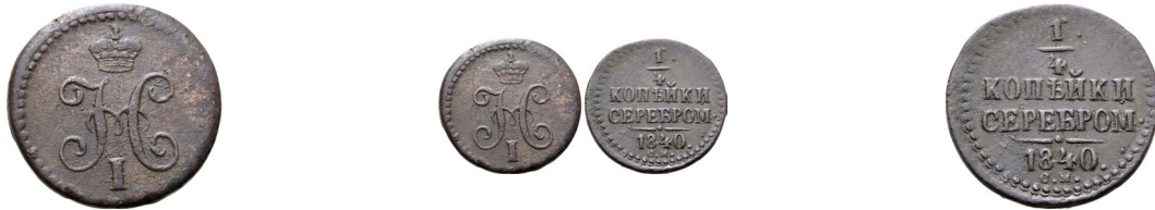
554. Russia, Empire. Nicholas I CU Polushka (1/4 Kopeck). Suzun mint, 1840. Crowned monogram / Denomination over date; С.М. below. Bitkin 793. 2.83g, 17mm, 12h.

From the GK Collection (France) of Russian Coins; Ex Sincona AG, Auction 58, 21 October 2019, lot 388.