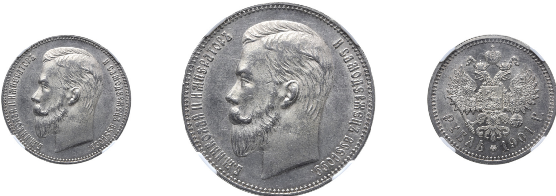
776. Russia, Empire. Nicholas II AR Rouble. St. Petersburg mint, 1901. Felix Zelman, mintmaster. Б.М.НИКОЛАЙ II ИМПЕРАТОРЪ И САМОДЕРЖЕЦЪ ВСЕРОСС., bare head to left / Crowned double-headed eagle facing with wings spread, wearing shield on breast depicting St. George slaying the dragon, with shields arranged across wings, and holding sceptre and orb; crown with ribbons above, denomination and date below. Edge inscription: ЧИСТАГО СЕРЕБРА 4 ЗО ЛЮТНИКА 21 ДОЛА (Ф•З). Bitkin 53.

From the GK Collection (France) of Russian Coins.