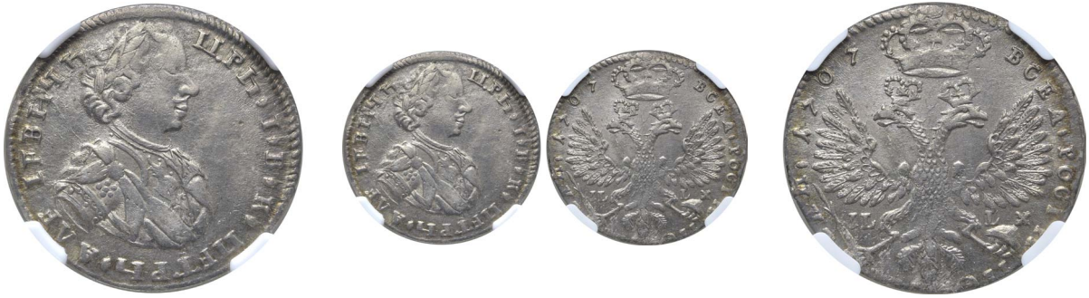
11. Russia, Tsardom. Peter I 'the Great' AR Tynf (12 Kopeck). Kadashevsky mint, 1708. Struck using the Polish-Lithuanian monetary system. ЦРЬ • І • В • К • ПЕТРЪ • АЛЕІЕВИЧЪ, laureate and draped bust to right / ВСЕА • РОСІИ • ПОВЕЛІТЕЛЪ • (date), crowned double-headed eagle facing, holding sceptre and orb; crown above, IL-L across lower fields. Bitkin 3821. 5.42g.

NGC graded MS 62 (#6322209-018). Rare; only one other (inferior) example on CoinArchives; none since 2015.