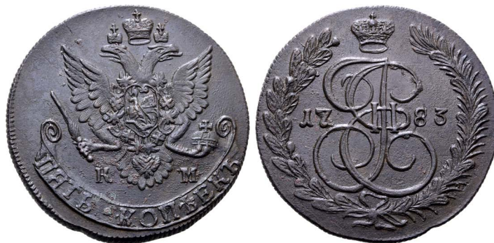
332. Russia, Empire. Catherine II CU 5 Kopeck. Suzun mint, 1783. Crowned double-headed imperial eagle facing, wearing shield on breast depicting St. George slaying the dragon, and holding sceptre and orb; crown above, K-M across lower fields, denomination in scroll below / Crowned monogram within wreath; date across fields. Bitkin 785. 48.56g, 43mm, 12h.

From the GK Collection (France) of Russian Coins.