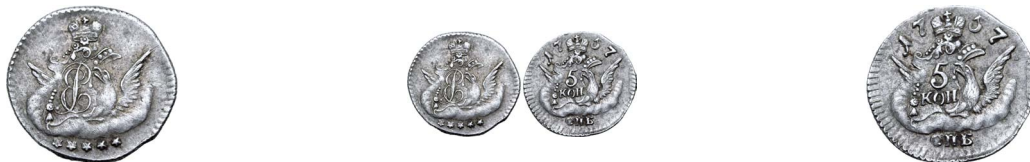
192. Russia, Empire. Elizabeth AR 5 Kopeck. St. Petersburg mint, 1757. Eagle with wings spread emerging to right from clouds, with head to left, supporting ornate shield inscribed with monogram; crown above, five stars below / Eagle with wings spread emerging to right from clouds, with head to left, supporting ornate shield inscribed with denomination; date above and СПб below. Bitkin 342. 1.24g, 15mm, 6h.

From the GK Collection (France) of Russian Coins.