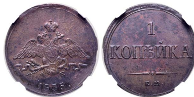
530. Russia, Empire. Nicholas I CU Kopeck. Ekaterinburg mint, 1835. Fedor Hvoshinskiy, mintmaster. Crowned double-headed eagle facing with wings spread, wearing shield on breast depicting St. George slaying the dragon, and holding ribboned wreath and crossed thunderbolt and torches; crown above, Ф-X across lower fields, date below / Denomination above E.M. Bitkin 524.

From the GK Collection (France) of Russian Coins.