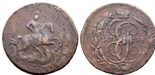
380. Russia, Empire. Catherine II CU 2 Kopeck. Uncertain (Red?) mint, 1795. St. George on horseback to right, slaying dragon with spear; [?]-M across fields, denomination on scroll below / Crowned monogram, date across fields; all within wreath. Bitkin -, cf. 540 (Red mint) & 873 (Anninskoye mint). 18.37g, 33mm, 1h.

From the GK Collection (France) of Russian Coins.