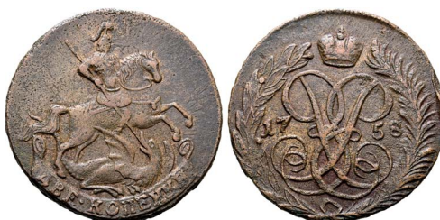
199. Russia, Empire. Elizabeth CU 2 Kopeck. Red mint, 1758. St. George on horseback to right, slaying dragon with spear; denomination on scroll below / Crowned monogram within wreath; date across fields. Bitkin 392. 20.08g, 32mm, 12h.

From the GK Collection (France) of Russian Coins.