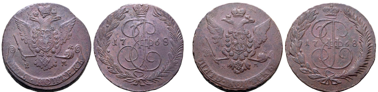
262. Russia, Empire. Catherine II CU 5 Kopeck. Ekaterinburg mint, 1768. Crowned double-headed imperial eagle facing, wearing shield on breast depicting St. George slaying the dragon, and holding sceptre and orb; crown above, E-M across lower fields, denomination in scroll below / Crowned monogram within wreath; date across fields. Bitkin 615. 52.02g, 41mm, 12h.

From the GK Collection (France) of Russian Coins.