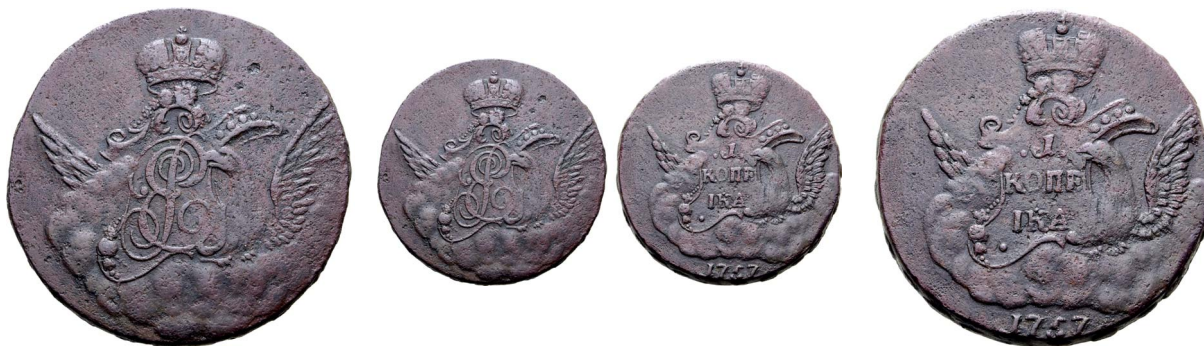
194. Russia, Empire. Elizabeth CU Kopeck. Ekaterinburg mint, 1757. Eagle with wings spread emerging to right from clouds, with head to left, supporting ornate shield inscribed with monogram; crown above / Eagle with wings spread emerging to right from clouds, with head to left, supporting ornate shield inscribed with denomination; crown above, date below. Edge inscription: ЕКАТЕРИНБУРСКОГО ❀ ДВОРА ❀. Bitkin 423. 20.68g, 30mm, 6h.

From the GK Collection (France) of Russian Coins.