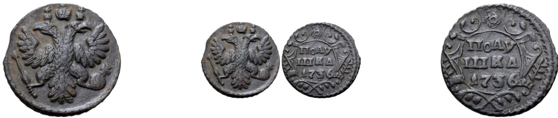
137. Russia, Empire. Anna Ivanovna CU Polushka (1/4 Kopeck). Flating Mill on the Yauza River mint, 1736. Crowned double-headed eagle facing, holding sceptre and orb; crown above / Elaborately ornamented cartouche inscribed with denomination and date. Bitkin 356 (same rev. die). 3.67g, 20mm, 12h.

From the GK Collection (France) of Russian Coins.