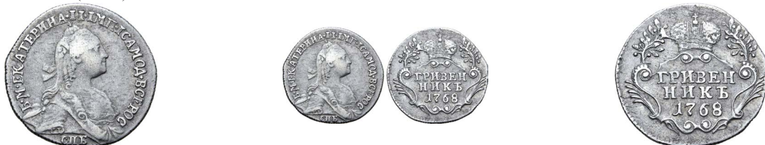
261. Russia, Empire. Catherine II AR Grivennik (10 Kopeck). St. Petersburg mint, 1768. Б • М • ЕКАТЕРИНА • П • ИМП • ІСАМОД • ВСЕРОС, crowned and draped bust to right; СІБ below / Crowned and wreathed cartouche inscribed with denomination and date. Bitkin 472. 2.54g, 19mm, 12h.

From the GK Collection (France) of Russian Coins.