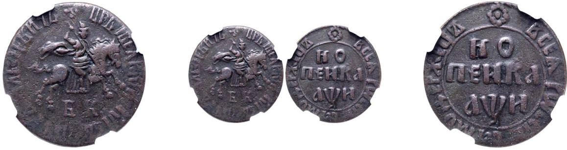
14. Russia, Tsardom. Peter I 'the Great' CU Kopeck. Naberezhny mint, 1708. ✠ ЦРЬ І ВЕЛИКІИ КНЗЬ ПЕТРЪ АЛЕЖІЕВИЧЪ, St. George on horseback to right, brandishing spear; БК below / ✠ ВСЕА РОССІИ САМОДЕРЖЕЦЪ around denomination above date. Bitkin 1971. 7.00g.

NGC graded VF Details, burnished (#6322218-014). Rare; no others on CoinArchives.