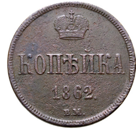
642. Russia, Empire. Alexander II CU Kopeck. Warsaw mint, 1862. Crowned monogram / Denomination over date; crown above, В.М. below. Bitkin 481. 4.85g, 23mm, 12h.