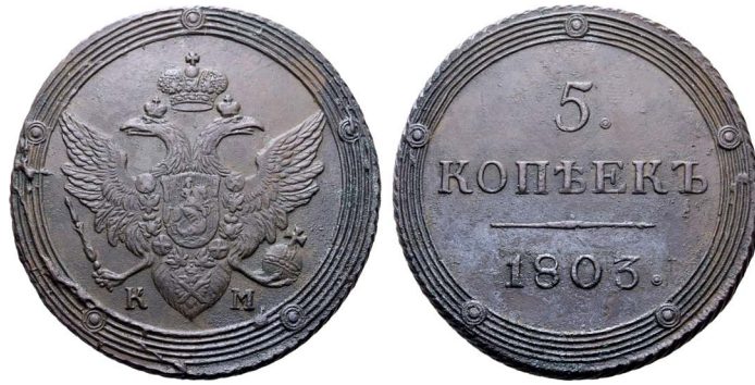
425. Russia, Empire. Alexander I CU 5 Kopeck. Suzun mint, 1803. Crowned double-headed eagle facing with wings spread, wearing shield on breast depicting St. George slaying the dragon, and holding sceptre and orb; crown above, K-M across lower fields, all surrounded by decorated border / Denomination over date; all surrounded by decorated border. Bitkin 413. 53.33g, 45mm, 12h.