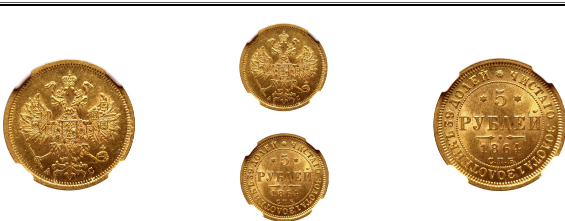
644. Russia, Empire. Alexander II AV 5 Rouble. St. Petersburg mint, 1864. Aggey Svechin, mintmaster. Crowned double-headed imperial eagle facing, wearing shield on breast depicting St. George slaying the dragon, with shields arranged across wings, and holding sceptre and orb; crown above, A-C across fields below / ЧИСТАГО ЗОЛЮТА 1 ЗОЛЮТНИКЪ 39 ДОЛЕЙ, denomination above date, С.П.Б. below, two stars across upper fields. Bitkin 10. 6.56g, 23mm, 12h.

From the GK Collection (France) of Russian Coins.