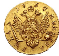
187. Russia, Empire. Elizabeth AV Rouble. Red mint, 1757. Б • М • ЕЛИСАВЕТЬ • І • ІМП • ІСАМОД • ВСЕРОС, crowned and draped bust to right / Crowned double-headed eagle facing with wings spread, wearing shield on breast depicting St. George slaying the dragon, and holding sceptre and orb; crown and date above, denomination around. Bitkin 66. 1.59g, 15mm, 12h.