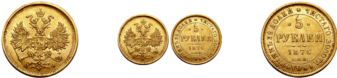
686. Russia, Empire. Alexander II AV 5 Rouble. St. Petersburg mint, 1876. Nikolay Iossa, mintmaster. Crowned double-headed eagle facing with wings spread, wearing shield on breast depicting St. George slaying the dragon, with shields arranged across wings, and holding sceptre and orb; crown with ribbons above, Н-I across lower fields / ❖ ЧИСТАГО ЗОЛОТА 1 ЗОЛОТНИКЪ 39 ДОЛЕЙ, denomination over date; С.П.Б. below, two stars across upper fields. Bitkin 24.

NGC graded UNC Details, rev. damage (#6674411-013).