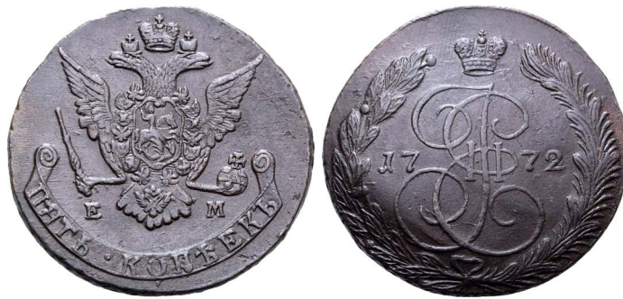
287. Russia, Empire. Catherine II CU 5 Kopeck. Ekaterinburg mint, 1772. Crowned double-headed imperial eagle facing, wearing shield on breast depicting St. George slaying the dragon, and holding sceptre and orb; crown above, E-M across lower fields, denomination in scroll below / Crowned monogram within wreath; date across fields. Bitkin 621. 55.06g, 42mm, 12h.