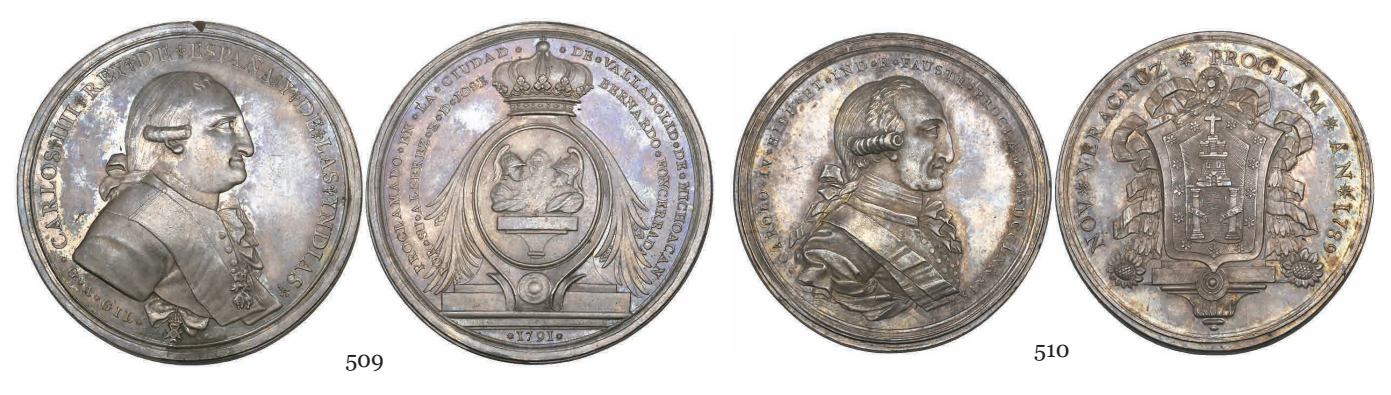
Mexico, Carlos IV, Proclamation in Valladolid, 1791, silver medal, by Gil, King's bust right wearing sash and Order of Carlos III, rev. , crowned arms of Valladolid garnished with descending palms, 45mm (Grove C-241a), with an old 'V'-shaped file mark on obverse rim at 12 o'clock, otherwise virtually mint state and well toned £400-600