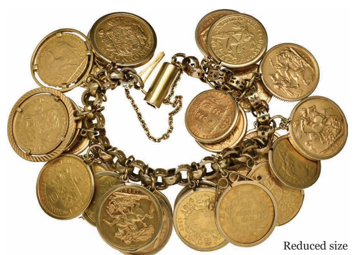
All lots are subject to a Buyer's Premium of 20% on the hammer price plus VAT as appropriate. See our Conditions of Business for further details.