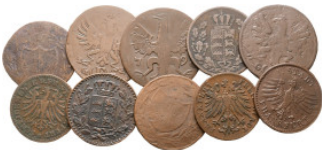
2370 Germany, Aachen, Frankfurt and Württemberg, lot of 10 coins (copper), XVIII-XIX Century / SOLD AS SEEN, NO RETURN! very fine 10