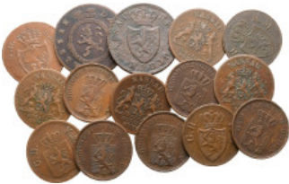
2369 Germany, Hessen-Darmstadt and Nassau, lot of 15 coins (copper), XVIII-XIX Century / SOLD AS SEEN, NO RETURN! very fine 10