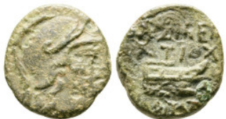
828 Seleukid Kingdom. Uncertain mint. Antiochos IX Philopator (Kyzikenos) 114-95 B C. Bronze Æ 14 mm, 1,65 g nearly very fine 10