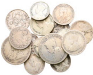
2418 Australia, New Zealand, India, Canada, South Africa, George V, lot of 14 silver coins (35 grams), XX Century / SOLD AS SEEN, NO RETURN! nearly very fine 10