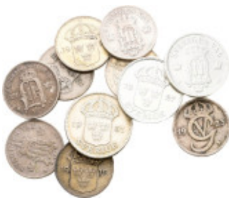
2432 Sweden, lot of 12 silver coins (22 grams), XX Century / SOLD AS SEEN, NO RETURN! very fine 10