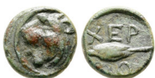
121 The Thracian Chersonese. Chersonesos circa 309-220 BC. Bronze Æ 10 mm, 1,13 g very fine 10