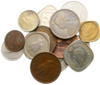
2456 Great Britain, Commonwealth, British India, lot of 14 coins / SOLD AS SEEN, NO RETURN! very fine 10