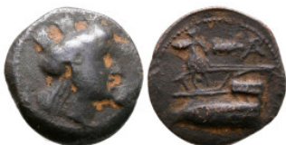
847 Phoenicia. Arados circa 241-167 BC. Bronze Æ 17 mm, 3,31 g nearly very fine 10