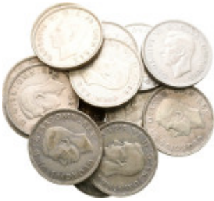
2414 Great Britain, George VI, lot of 15 silver coins (85 grams), XX Century / SOLD AS SEEN, NO RETURN! very fine 10