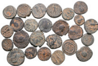
2313 Lot of ca. 25 late roman bronze coins / SOLD AS SEEN, NO RETURN! very fine 10