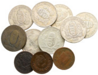
2387 Hungary, lot of 12 coins (silver and copper), XIX-XX Century / SOLD AS SEEN, NO RETURN! very fine 10