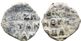
1969 Byzantine. Seal Pb 22 mm, 3,73 g very fine