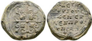
1963 Byzantine. Seal Pb 24 mm, 8,08 g very fine