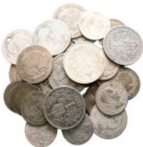
2389 Austria, lot of 33 silver coins (75 grams), XVIII-XIX Century / SOLD AS SEEN, NO RETURN! nearly very fine 10