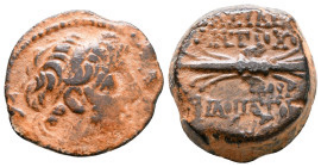
827 Seleukid Kingdom. Antiochos IX Philopator (Kyzikenos) 114-95 BC. Bronze Æ 19 mm, 6,06 g nearly very fine 10