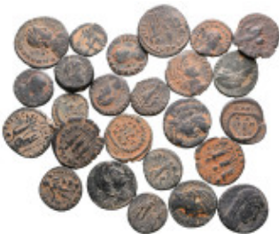
2315 Lot of ca. 25 late roman bronze coins / SOLD AS SEEN, NO RETURN! very fine 10