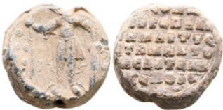
1966 Byzantine. Seal Pb 26 mm, 24,34 g very fine