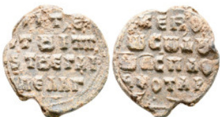
1968 Byzantine. Seal Pb 21 mm, 6,08 g very fine