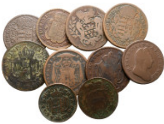
2388 Holy Roman Empire, lot of 10 coins (copper), XVIII Century / SOLD AS SEEN, NO RETURN! nearly very fine 10