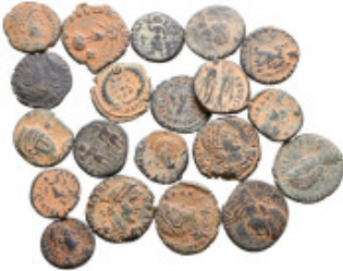
2312 Lot of ca. 20 late roman bronze coins / SOLD AS SEEN, NO RETURN! very fine 10