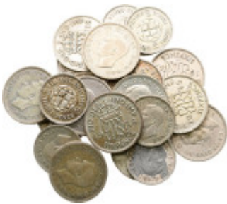
2415 Great Britain, George VI, lot of 25 silver coins (56 grams), XX Century / SOLD AS SEEN, NO RETURN! very fine 10