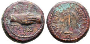
842 Kings of Commagene. Antiochos IV Epiphanes of Commagene AD 38-72. Bronze Æ 16 mm, 3,91 g nearly very fine 10