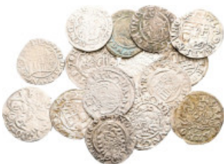
2390 Hungary, lot of 15 silver coins including Matthias Corvinus and Wladislaw II, XV-XVI Century / SOLD AS SEEN, NO RETURN! very fine 10