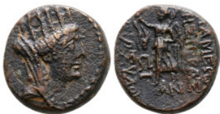
845 Seleucia and Pieria. Apameia circa 100-0 BC. Bronze Æ 18 mm, 6,07 g very fine 10