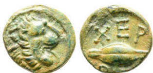
119 The Thracian Chersonese. Chersonesos circa 309-220 BC. Bronze Æ 11 mm, 1,03 g very fine 10