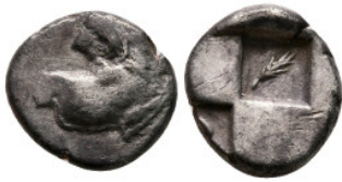
114 The Thracian Chersonese. Chersonesos circa 386-338 BC. Hemidrachm AR 13 m m, 2,24 g very fine 10