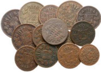
2366 Germany, Bayern, lot of 14 coins (copper), XVIII-XIX Century / SOLD AS SEEN, NO RETURN! very fine 10