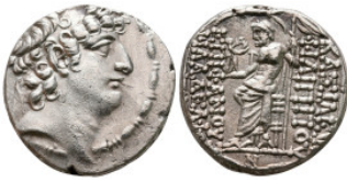
841 Seleukid Kingdom. Antioch on the Orontes. Philip I Philadelphos 95-75 BC. Tetradrachm AR 25 mm, 15,57 g very fine 10