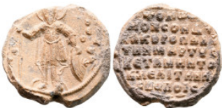
1967 Byzantine. Seal Pb 28 mm, 18,53 g very fine