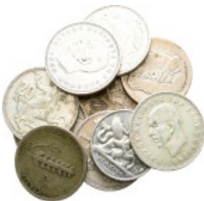
2433 Greece, lot of 10 silver coins (70 grams), XX Century / SOLD AS SEEN, NO RETURN! very fine 10