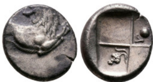
118 The Thracian Chersonese. Chersonesos circa 386-338 BC. Hemidrachm AR 14 m m, 2,20 g very fine 10