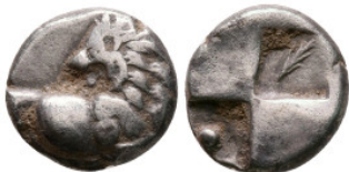
117 The Thracian Chersonese. Chersonesos circa 386-338 BC. Hemidrachm AR 12 m m, 2,33 g very fine 10