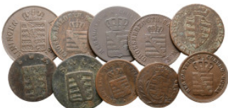
2371 Germany, Sachsen-Meiningen, Weimar-Eisenach and Coburg-Gotha, lot of 10 coins (copper), XVIII-XIX Century / SOLD AS SEEN, NO RETURN! very fine 10