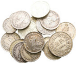
2434 Switzerland, lot of 19 silver coins (87 grams), XX Century / SOLD AS SEEN, NO RETURN! very fine 10