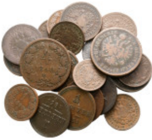
2386 Austria, lot of 23 coins (copper), XIX Century / SOLD AS SEEN, NO RETURN! nearly very fine 10