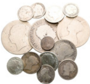
2417 Great Britain, lot of 14 silver coins (58 grams), XIX-XX Century / SOLD AS SEEN, NO RETURN! fine 10