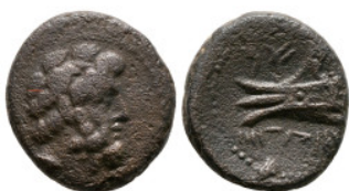
848 Phoenicia. Arados circa 137-51 BC. Bronze Æ 16 mm, 3,89 g very fine 10