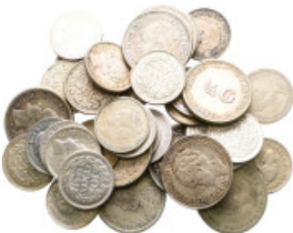
2438 Netherlands, lot of 36 silver coins (75grams), XX Century / SOLD AS SEEN, NO RETURN! good very fine 10