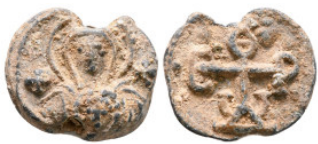
1964 Byzantine. Seal Pb 16 mm, 3,34 g very fine