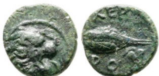
120 The Thracian Chersonese. Chersonesos circa 309-220 BC. Bronze Æ 11 mm, 1,14 g very fine 10