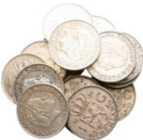
2437 Netherlands, lot of 15 silver coins (98grams), XX Century / SOLD AS SEEN, NO RETURN! good very fine 10