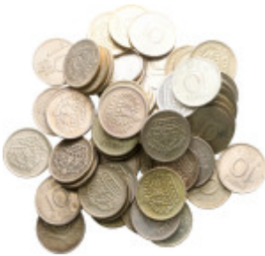
2431 Sweden, lot of 58 silver coins (85 grams), XX Century / SOLD AS SEEN, NO RETURN! extremely fine 10