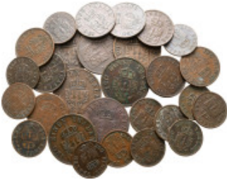
2368 Germany, Braunschweig and Hannover, lot of 28 coins (copper), XIX Century / SOLD AS SEEN, NO RETURN! very fine 10