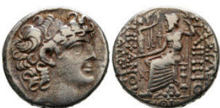
832 Seleukid Kingdom. Antioch on the Orontes. Philip I Philadelphos 95-75 BC. Tetradrachm AR 27 mm, 14,14 g nearly very fine 10