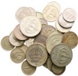
2436 Sweden, lot of 32 silver coins (73 grams), XX Century / SOLD AS SEEN, NO RETURN! good very fine 10