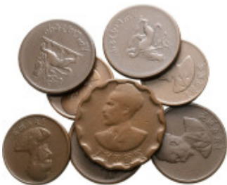
2459 Ethiopia,, lot of 8 coins / SOLD AS SEEN, NO RETURN! very fine 10