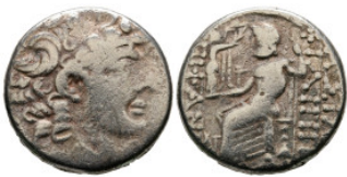
829 Seleukid Kingdom. Antioch on the Orontes. Philip I Philadelphos 95-75 BC. Tetradrachm AR 24 mm, 13,81 g fine 10