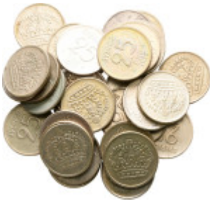
2430 Sweden, lot of 34 silver coins (81 grams), XX Century / SOLD AS SEEN, NO RETURN! extremely fine 10