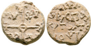
1962 Byzantine. Seal Pb 22 mm, 10,80 g very fine