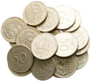
2429 Sweden, lot of 22 silver coins (105 grams), XX Century / SOLD AS SEEN, NO RETURN! very fine 10