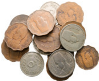
2458 Egypt, lot of 17 coins / SOLD AS SEEN, NO RETURN! very fine 10