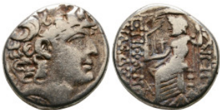
831 Seleukid Kingdom. Antioch on the Orontes. Philip I Philadelphos 95-75 BC. Tetradrachm AR 25 mm, 13,96 g fine 10