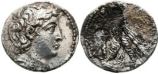
825 Seleukid Kingdom. Tyre. Demetrios II Nikator, 2nd reign 129-125 BC. Tetradrachm AR 29 mm, 13,37 g very fine 10