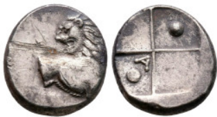
116 The Thracian Chersonese. Chersonesos circa 386-338 BC. Hemidrachm AR 14 m m, 2,26 g very fine 10