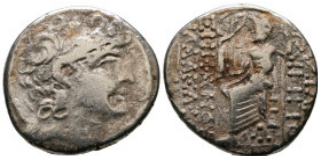
830 Seleukid Kingdom. Antioch on the Orontes. Philip I Philadelphos 95-75 BC. Tetradrachm AR 28 mm, 13,47 g fine 10