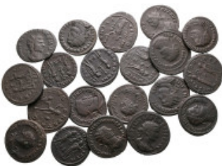
2316 Lot of ca. 20 late roman bronze coins / SOLD AS SEEN, NO RETURN! very fine 10