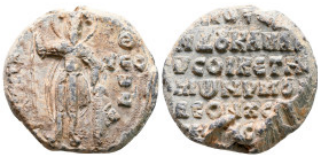
1965 Byzantine. Seal Pb 26 mm, 13,64 g very fine