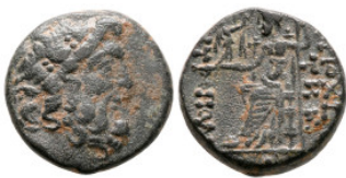
843 Seleucia and Pieria. Antioch circa 100-0 BC. Bronze Æ 19 mm, 6,67 g very fine 10