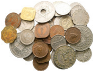
2455 Great Britain, George VI, Commonwealth, lot of 41 coins / SOLD AS SEEN, NO RETURN! good very fine 10