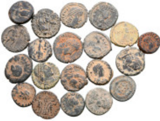
2311 Lot of ca. 20 late roman bronze coins / SOLD AS SEEN, NO RETURN! very fine 10