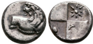
115 The Thracian Chersonese. Chersonesos circa 386-338 BC. Hemidrachm AR 13 m m, 2,33 g very fine 10