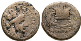
844 Seleucia and Pieria. Antioch circa AD 50-100. Bronze Æ 18 mm, 4,63 g nearly very fine 10