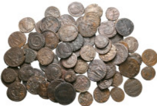
2314 Lot of ca. 76 late roman bronze coins / SOLD AS SEEN, NO RETURN! very fine 10