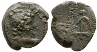
826 Seleukid Kingdom. Antioch on the Orontes. Alexander II Zabinas 128-122 BC. Bronze Æ 16 mm, 2,59 g nearly very fine 10