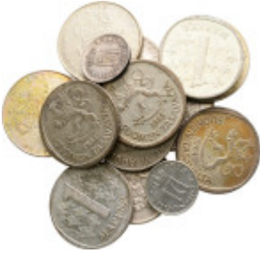
2435 Sweden, Finland and Norway, lot of 15 silver coins (85 grams), XX Century / SOLD AS SEEN, NO RETURN! very fine 10