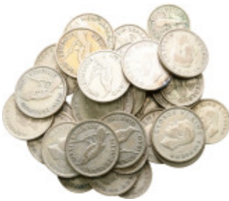
2416 New Zealand, George VI, lot of 34 silver coins (81 grams), XX Century / SOLD AS SEEN, NO RETURN! very fine 10