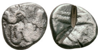
846 Phoenicia. Arados circa 400-375 BC. Tetrobol AR 15 mm, 3,13 g fine 10