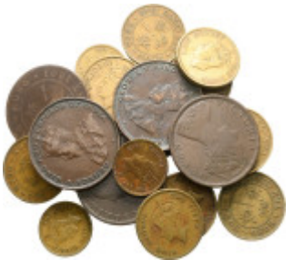
2457 Great Britain, Commonwealth, Hong Kong, lot of 22 coins / SOLD AS SEEN, NO RETURN! good very fine 10