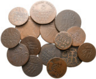
2367 Germany, Brandenburg-Preussen, lot of 15 coins (copper), XVII-XIX Century / SOLD AS SEEN, NO RETURN! very fine 10