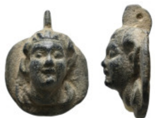
2295 ANCIENT ROMAN BRONZE APPLIQUE (1ST-5TH CENTURY AD). 49.3 Gr. 43 mm. 5