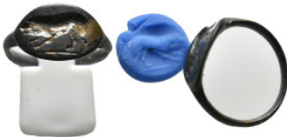
2204 ANCIENT ROMAN BRONZE RING (1ST-5TH CENTURY AD.). 2.73 Gr. 5