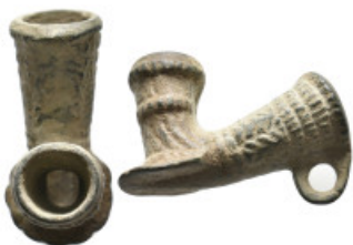
2347 ANCIENT ROMAN BRONZE OBJECT. 12.46 Gr. 33 mm. 5