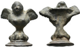
2318 ANCIENT ROMAN BRONZE FIGURINE. 54.89 Gr. 45 mm. 5