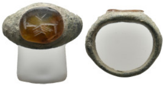
2232 ANCIENT ROMAN BRONZE RING. 5.76 Gr.