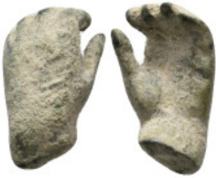
2316 ANCIENT ROMAN BRONZE HAND (1ST-3RD CENTURY AD.) 8.43 Gr. 21.7 mm. 5