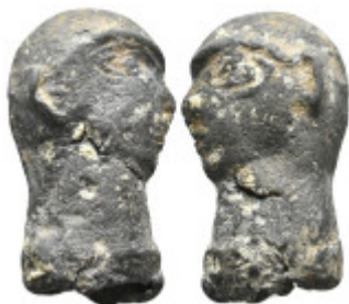
2300 ANCIENT ROMAN BRONZE APPLIQUE (1ST-5TH CENTURY AD) 17.04 Gr. 36 mm. 5