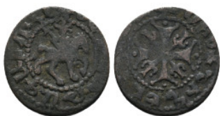
1856 ARMENIA. Hetoum I (1226-1270). Ae Kardez. 2.01 Gr. 19 mm. 5