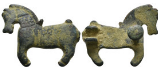
2328 ANCIENT ROMAN BRONZE OBJECT. 10.94 Gr. 38 mm.