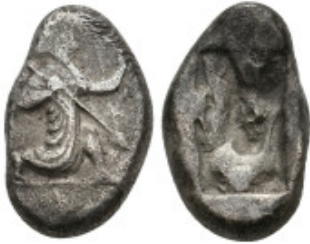
485 ACHAEMENID EMPIRE. Time of Darios I to Xerxes II (485-420 BC). Siglos. 5.35 Gr. 20.2 mm. 5