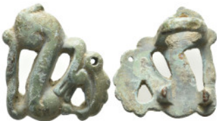
2364 ANCIENT ROMAN BRONZE OBJECT. 21.72 Gr. 37 mm. 5