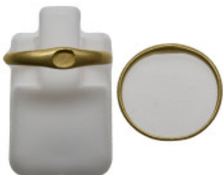
2200 ANCIENT BYZANTINE GOLD RING (CIRCA 11TH-14TH AD). 1.02 Gr. 16.8 mm. 5