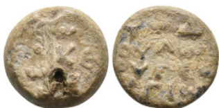
2042 BYZANTINE LEAD SEAL. 10.25 Gr. 19 mm.