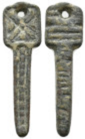
2357 ANCIENT ROMAN BRONZE OBJECT. 3.68 Gr. 32 mm. 5