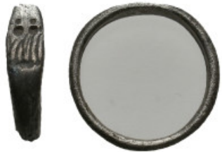
2203 ANCIENT ROMAN BRONZE RING (1ST-5TH CENTURY AD.). 1.82 Gr. 5