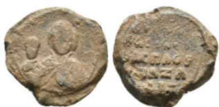
2012 BYZANTINE LEAD SEAL. 3.61 Gr. 16.2 mm.