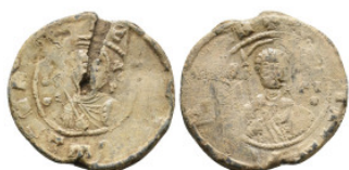
1994 BYZANTINE LEAD SEAL. 8.62 Gr. 27 mm.