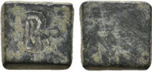
2112 BYZANTINE WEIGHT. 2.11 Gr. 13.5 mm.