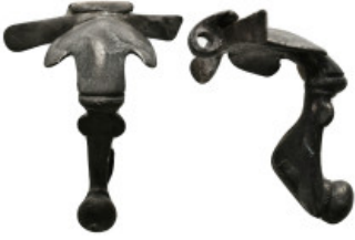
2355 ANCIENT GREEK BRONZE FIBULA (4TH-1ST CENTURY BC.) 31.47 Gr. 55 m m. 5