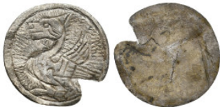
2314 ANCIENT SILVER FIGURINE. 0.69 Gr. 17.2 mm.