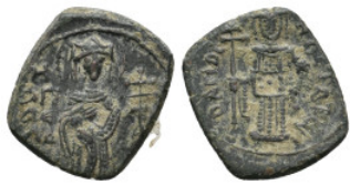
1851 LATIN EMPIRE (1204-1261). Half Tetarteron. Thessalonica. 1.55 Gr. 16.9 mm. 5