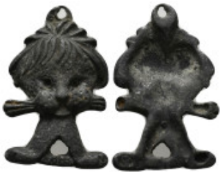
2342 ANCIENT ROMAN BRONZE OBJECT. 10.58 Gr. 37 mm. 5