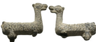
2329 ANCIENT ROMAN BRONZE OBJECT. 9.22 Gr. 40 mm.