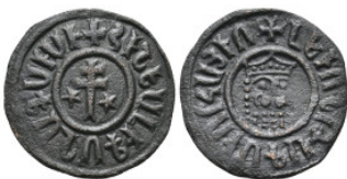
1855 ARMENIA. Levon I (1198-1219). Ae Tank. Sis. 6.8 Gr. 29 mm. 5