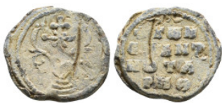
2041 BYZANTINE LEAD SEAL. 6.61 Gr. 20.5 mm.