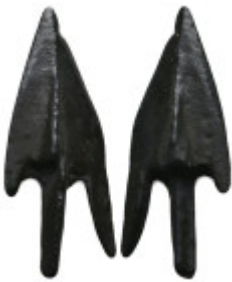
2156 GREEK BRONZE ARROWHEAD.(CIRCA 3RD-1ST BC). 7.94 Gr. 41.6 mm. 5