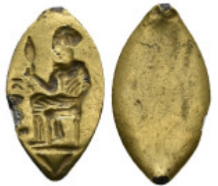
2198 ANCIENT BYZANTINE GOLD RING (CIRCA 11TH-14TH AD). 1.22 Gr. 17.2 mm. 5