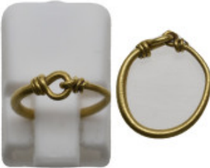
2159 ANCIENT GOLD EARRING. 1.24 Gr. 16.1 mm.