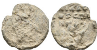
2013 BYZANTINE LEAD SEAL. 12.2 Gr. 23.6 mm.