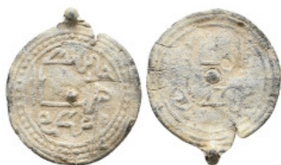
2057 ISLAMIC LEAD SEAL. 2.48 Gr. 25 mm.