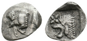
171 MYSIA. Kyzikos. Hemiobol (Circa 450-400 BC). 0.35 Gr. 9.7 mm.