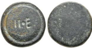
2115 BYZANTINE WEIGHT. 20.41 Gr. 27 mm.