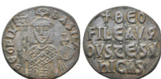
1808 THEOPHILUS (829-842). Follis. Constantinople. 5.86 Gr. 25.8 mm. 5