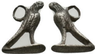
2281 ANCIENT ROMAN SILVER EAGLE FIGURINE (1ST-5TH CENTURY AD) 1.22 G r. 16.4 mm. 5