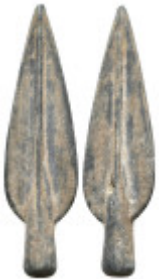
2150 GREEK BRONZE ARROWHEAD.(CIRCA 3RD-1ST BC). 4.08 Gr. 43.6 mm. 5