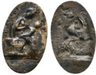
2209 BRONZE OBJECT. 0.19 Gr. 16.6 mm.