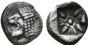
324 IONIA. Miletos. Obol (6th-5th century BC). 1.21 Gr. 9.7 mm.