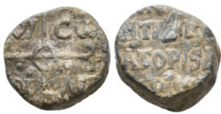
2048 BYZANTINE LEAD SEAL. 15.29 Gr. 19.5 mm.