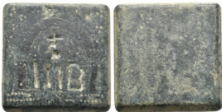
2371 BYZANTINE WEIGHT. 50.12 Gr. 40.7 mm. 5