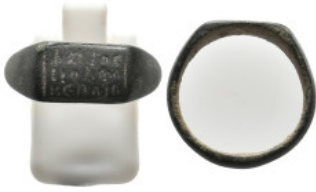
2216 ANCIENT ROMAN BRONZE RING (1ST-5TH CENTURY AD.) 4.14 Gr. 5