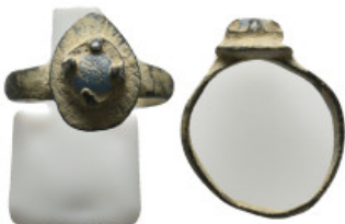
2242 ANCIENT BRONZE RING. 2 Gr.,