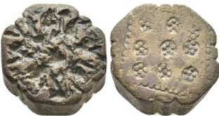
2116 BYZANTINE WEIGHT. 44.11 Gr. 24.2 mm.,