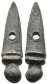
2171 ANCIENT ROMAN BRONZE GLADIUS SWORD PENDANT (1ST- 3RD CENTURY AD). 4.89 Gr. 5