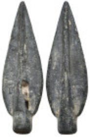
2148 GREEK BRONZE ARROWHEAD.(CIRCA 3RD-1ST BC). 4.9 Gr. 41.4 mm. 5