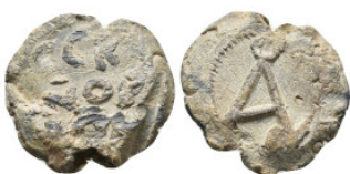
2053 BYZANTINE LEAD SEAL. 8.36 Gr. 22.3 mm.