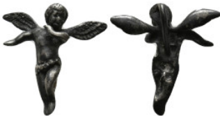
2304 ANCIENT ROMAN SILVER EROS STATUETTE.(1st-2nd century). 3.95 Gr. 27.1 mm. 5