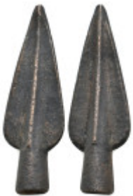
2149 GREEK BRONZE ARROWHEAD.(CIRCA 3RD-1ST BC). 4.09 Gr. 38 mm. 5