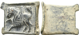
2374 ANCIENT BYZANTINE/SELJUK BRONZE BELT BUCKLE. (11TH – 14TH century A.D) . 20.9 Gr. 47 mm. 5