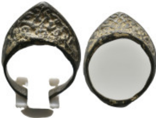
2252 ISLAMIC BRONZE RING. 7.58 Gr.