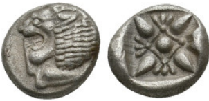
321 IONIA. Miletos. Obol (6th-5th century BC). 1.16 Gr. 9.6 mm.