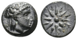
170 MYSIA. Gambrion. Ae (4th century BC). 1.06 Gr. 9.8 mm.