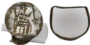
2206 ANCIENT ROMAN SILVER RING (1ST-5TH CENTURY AD.). 2.99 Gr. 5