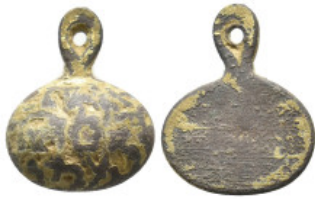
2323 ANCIENT ROMAN BRONZE OBJECT. 5.04 Gr. 20 mm.