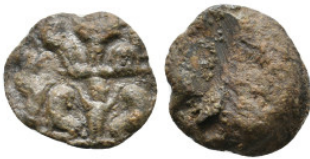
2065 UNCERTAIN. LEAD SEAL. 3.82 Gr. 16 mm.