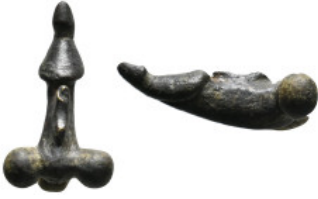
2340 ANCIENT ROMAN PHALLUS PENDANT (1ST-4TH CENTURY AD). 16.93 Gr. 39 mm. 5