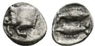
172 MYSIA. Kyzikos. Tetartemorion (Circa 450-400 BC). 0.28 Gr. 7.1 mm.