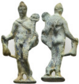
2287 ANCIENT ROMAN BRONZE FIGURINE. 12.16 Gr. 45 mm.