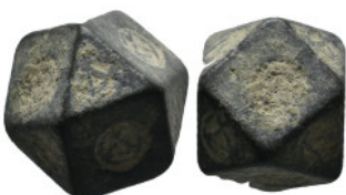
2119 BYZANTINE WEIGHT. 14.9 Gr. 17 mm.