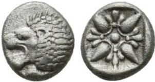
320 IONIA. Miletos. Obol (6th-5th century BC). 1.12 Gr. 9.3 mm