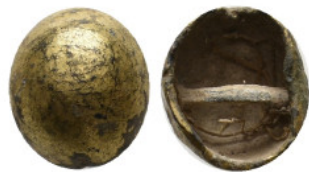
2166 ANCIENT GOLD EARRING. 0.63 Gr. 10.4 mm.