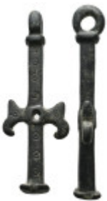
2346 ANCIENT ROMAN BRONZE OBJECT. 13.73 Gr. 62 mm. 5