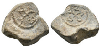
2051 BYZANTINE LEAD SEAL. 13.23 Gr. 21.4 mm.