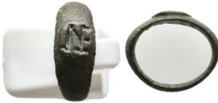
2210 ANCIENT ROMAN BRONZE RING (1ST-5TH CENTURY AD.) 3.28 Gr.