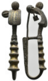
2350 ANCIENT GREEK BRONZE FIBULA (4TH-1ST CENTURY BC.) 28.78 Gr. 75 m m. 5