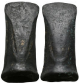
2359 ANCIENT ROMAN BRONZE OBJECT. 76.72 Gr. 69 mm. 5