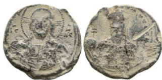
1991 BYZANTINE LEAD SEAL. 19.53 Gr. 32.6 mm.