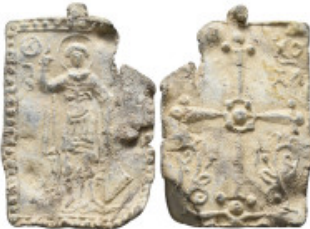
2064 BYZANTINE LEAD SEAL. 10.88 Gr. 45.8 mm.