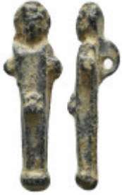
2291 ANCIENT ROMAN BRONZE FIGURINE. 3.18 Gr. 27.5 mm. 5