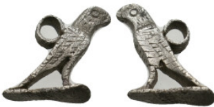
2282 ANCIENT ROMAN SILVER EAGLE FIGURINE (1ST-5TH CENTURY AD) 1.92 G r. 20.3 mm. 5