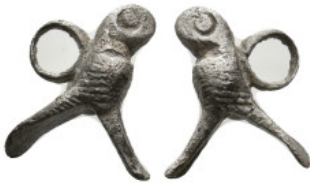
2280 ANCIENT ROMAN SILVER EAGLE FIGURINE (1ST-5TH CENTURY AD). 1.8 G r. 17 mm. 5