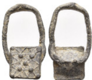
2248 ANCIENT BRONZE RING. 2.77 Gr. 25.4 mm.