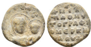
2052 BYZANTINE LEAD SEAL. 5.71 Gr. 18.4 mm.