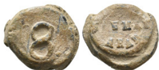
2055 BYZANTINE LEAD SEAL. Uncertain. 7.56 Gr. 17.6 mm.