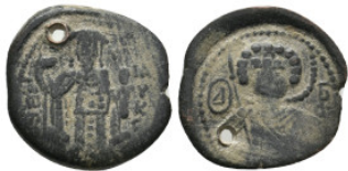
1852 EMPIRE OF NICAEA. John III Ducas-Vatazes (1222-1254). Tetarteron. Magnesia. 2.29 Gr. 19.6 mm. 5