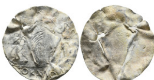
2061 BYZANTINE AMULET. 11.66 Gr.