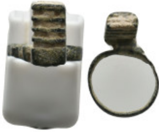
2249 ANCIENT BRONZE RING. 2.27 Gr.