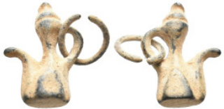
2356 ANCIENT ROMAN BRONZE OBJECT. 2.90 Gr. 18.6 mm. 5