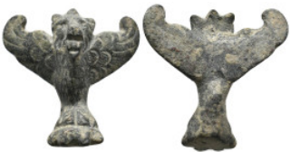
2358 ANCIENT ROMAN BRONZE OBJECT. 22.62 Gr. 39 mm. 5