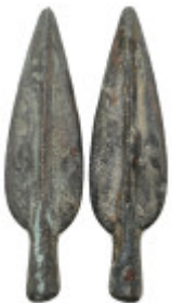
2151 GREEK BRONZE ARROWHEAD.(CIRCA 3RD-1ST BC). 4.1 Gr. 42.5 mm. 5