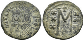
1802 MICHAEL I RHANGABE with THEOPHYLACTUS (811-813). Follis. Constantinople. 8.4 Gr. 21 mm. 5