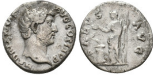
1347 HADRIAN (117-138). Denarius. Rome. 3.31 Gr. 17.3 mm.