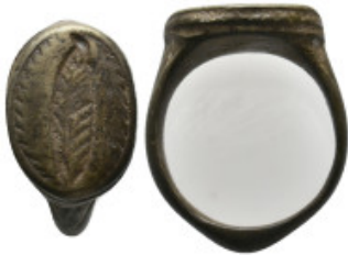
2256 ISLAMIC BRONZE RING. 10.56 Gr.