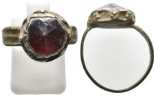
2237 ANCIENT ROMAN RING. 3.51 Gr.