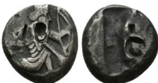
490 ACHAEMENID EMPIRE. Time of Darios I to Xerxes II (Circa 485-420 BC). Siglos. Sardes. 5.53 Gr. 16.3 mm. 5