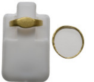
2199 ANCIENT BYZANTINE GOLD RING (CIRCA 11TH-14TH AD). 0.57 Gr. 11 mm. 5