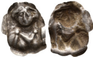
2313 ANCIENT SILVER FIGURINE. 1.1 Gr. 26.2 mm.