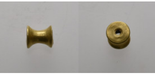
2370 ANCIENT ROMAN GOLD BEAD OBJECT. 0.33 Gr. 7.6 mm. 5