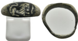
2208 ANCIENT ROMAN BRONZE RING (1ST-5TH CENTURY AD.). 5.22 Gr. 5