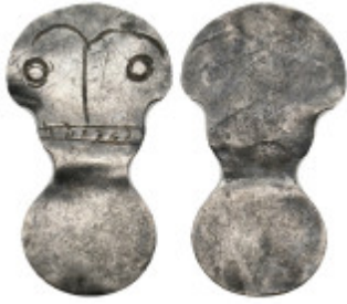
2310 ANCIENT SILVER FIGURINE. 0.81 Gr. 25.4 mm.