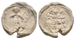
2011 BYZANTINE LEAD SEAL. 4.83 Gr. 19.5 mm.