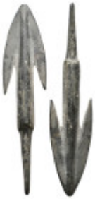
2155 GREEK BRONZE ARROWHEAD.(CIRCA 3RD-1ST BC). 13.37 Gr. 73.4 mm. 5