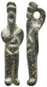
2286 ANCIENT ROMAN BRONZE FIGURINE. 2.91 Gr. 27 mm.