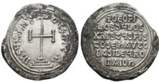
1803 THEOPHILUS (829-842). Miliaresion. Constantinople. 3.13 Gr. 27.7 mm. 5