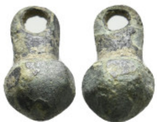
2320 ANCIENT ROMAN BRONZE OBJECT. 2.88 Gr. 15.4 mm. 5