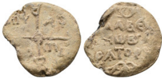
2039 BYZANTINE LEAD SEAL. 15.3 Gr. 28 mm.