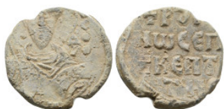
1996 BYZANTINE LEAD SEAL. 9.89 Gr. 25.5 mm.