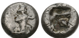
491 ACHAEMENID EMPIRE. Time of Darios I to Xerxes II (485-420 BC). Siglos. Sardes. 4.57 Gr. 14.6 mm. 5