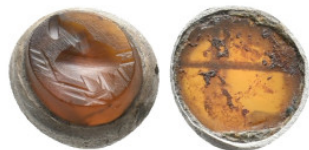
2168 ANCIENT RING STONE. 0.55 Gr. 10 mm.