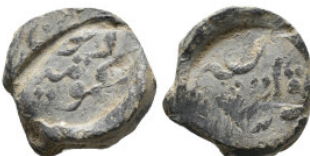
2068 ISLAMIC LEAD SEAL. 9.92 Gr. 18.6 mm.