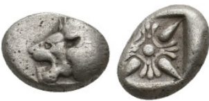
323 IONIA. Miletos. Obol (6th-5th century BC). 1.07 Gr. 10.1 mm.