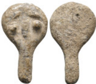
2315 ANCIENT FIGURINE. 11.33 Gr. 33.7 mm.