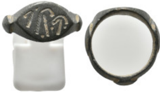
2218 ANCIENT ROMAN BRONZE RING (1ST-5TH CENTURY AD.) 4.75 Gr. 5