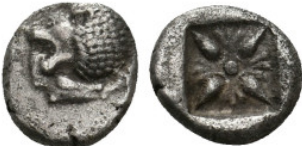
322 IONIA. Miletos. Obol (6th-5th century BC). 1.05 Gr. 9.5 mm.