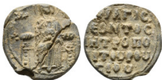
2043 BYZANTINE LEAD SEAL. 5.09 Gr. 21 mm.