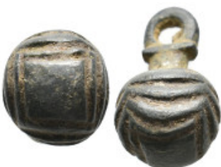
2321 ANCIENT ROMAN BRONZE OBJECT. 15.1 Gr. 25.4 mm. 5