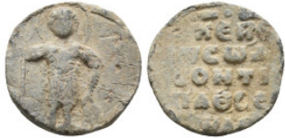
2007 BYZANTINE LEAD SEAL. 4.18 Gr. 17 mm.