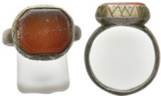
2233 ANCIENT ROMAN BRONZE RING. 6.66 Gr.