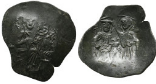
1849 LATIN RULERS OF CONSTANTINOPLE. Small module trachy. Thessalonica. 1. 74 Gr. 25.2 mm. 5