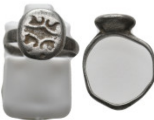
2215 ANCIENT ROMAN SILVER RING (1ST-5TH CENTURY AD.) 3.37 Gr.