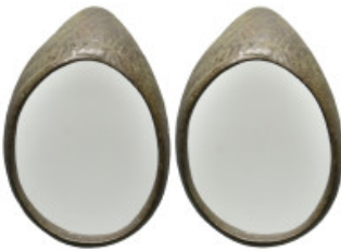
2251 ISLAMIC BRONZE RING. 5.92 Gr.