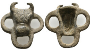
2365 ANCIENT ROMAN BRONZE BULL OBJECT. 48.14 Gr. 49.5 mm. 5