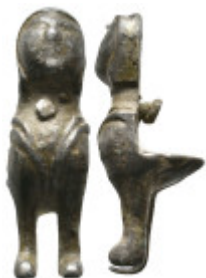
2296 ANCIENT ROMAN BRONZE APPLIQUE (1ST-5TH CENTURY AD). 14.19 Gr. 36 mm. 5