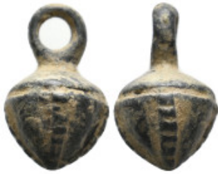
2322 ANCIENT ROMAN BRONZE OBJECT. 15.25 Gr. 26 mm.