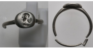
2205 ANCIENT ROMAN SILVER RING (1ST-5TH CENTURY AD.). 2.94 Gr. 5