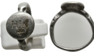
2212 ANCIENT BYZANTINE SILVER RING (1ST-5TH CENTURY AD.) 9 Gr.