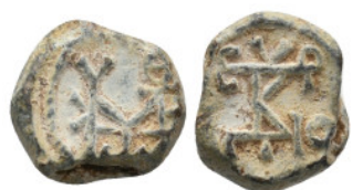
2059 BYZANTINE LEAD SEAL. 4.23 Gr. 14.2 mm.