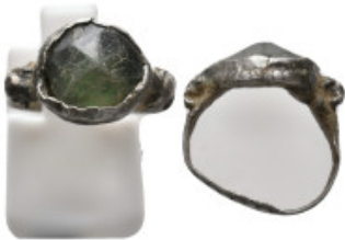
2239 ANCIENT ROMAN SILVER RING. 2.43 Gr.