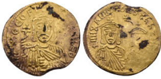
1801 THEOPHILUS with CONSTANTINE and MICHAEL II (829-842). Fourrée Solidus. Constantinople. 2.77 Gr. 21.7 mm. 5