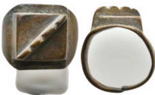
2254 ISLAMIC BRONZE RING. 8.78 Gr.