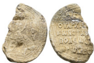
1993 BYZANTINE LEAD SEAL. 17.34 Gr. 35.7 mm.