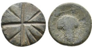
2117 GREEK WEIGHT. 2.87 Gr. 15 mm.