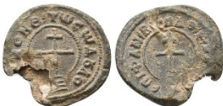
2035 BYZANTINE LEAD SEAL. 6.34 Gr. 21 mm.