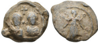
2047 BYZANTINE LEAD SEAL. 14.45 Gr. 26.4 mm.