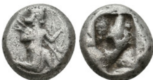
489 ACHAEMENID EMPIRE. Time of Darios I to Xerxes II (485-420 BC). Siglos. Sardes. 5.29 Gr. 15 mm. 5