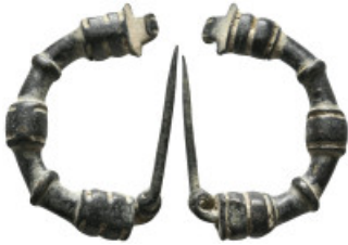
2349 ANCIENT GREEK BRONZE FIBULA (4TH-1ST CENTURY BC.) 22.45 Gr. 48 m m. 5