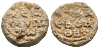
2033 BYZANTINE LEAD SEAL. 11.91 Gr. 21 mm.