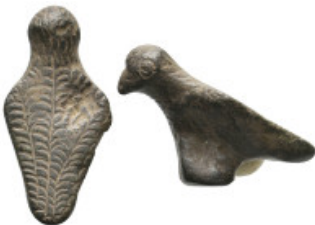
2278 ANCIENT ROMAN BRONZE EAGLE FIGURINE (1ST-5TH CENTURY AD) 13.29 Gr. 29 mm. 5