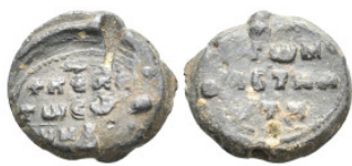
2054 BYZANTINE LEAD SEAL. 7.74 Gr. 21 mm.