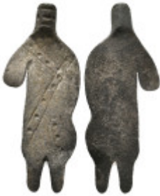
2312 ANCIENT SILVER FIGURINE. 1.68 Gr. 34.6 mm.