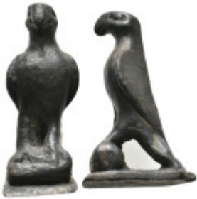
2276 ANCIENT ROMAN BRONZE EAGLE FIGURINE (1ST-5TH CENTURY AD) 29.2 Gr. 42 mm. 5