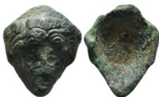
2298 ANCIENT ROMAN BRONZE APPLIQUE (1ST-5TH CENTURY AD). 19.26 Gr. 30 mm. 5