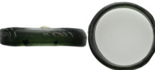
2213 ANCIENT BYZANTINE GLASS BRACELET (11TH-13TH CENTURY AD.) 16.25 Gr. 57.3 mm.