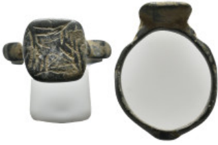
2230 ISLAMIC BRONZE RING. 7.68 Gr.