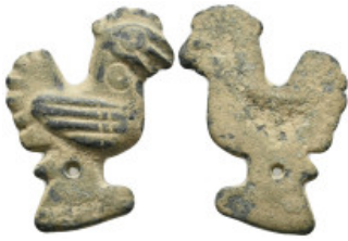
2348 ANCIENT ROMAN BRONZE COCK OBJECT. 13.28 Gr. 44 mm. 5