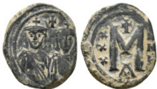
1805 MICHAEL II THE AMORIAN with THEOPHILUS (820-829). Follis. Constantinople. 7.65 Gr. 25.2 mm. 5