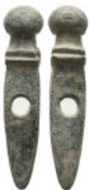
2169 ANCIENT ROMAN BRONZE GLADIUS SWORD PENDANT (1ST- 3RD CENTURY AD). 2.63 Gr. 28 mm.