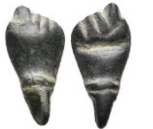
2305 ANCIENT ROMAN BRONZE HAND (1ST-3RD CENTURY AD.) 1.38 Gr. 16 mm. 5