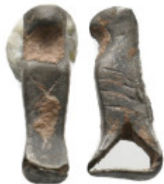
2283 ANCIENT ROMAN BRONZE EAGLE FIGURINE (1ST-5TH CENTURY AD) 1.19 Gr. 13.3 mm. 5