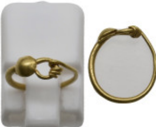
2160 ANCIENT GOLD EARRING. 0.87 Gr. 15 mm.