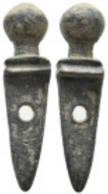
2172 ANCIENT ROMAN BRONZE GLADIUS SWORD PENDANT (1ST- 3RD CENTURY AD). 4.64 Gr. 31.6 mm. 5