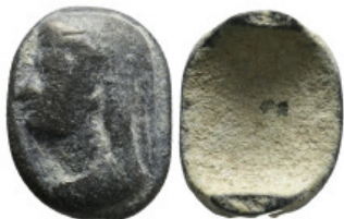
2221 ANCIENT ROMAN BRONZE RING (1ST-5TH CENTURY AD.) 9.71 Gr. 21.5 mm. 5