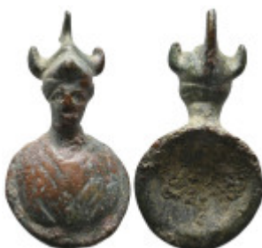
2297 ANCIENT ROMAN BRONZE APPLIQUE (1ST-5TH CENTURY AD). 25.11 Gr. 47.12 mm. 5