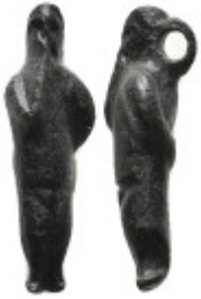
2285 ANCIENT ROMAN BRONZE FIGURINE. 3.24 Gr. 26 mm.