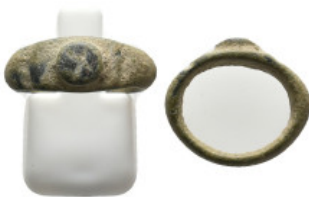
2214 ANCIENT ROMAN BRONZE RING (1ST-5TH CENTURY AD.) 3.74 Gr.