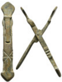
2184 ANCIENT ROMAN OBJECT. (Circa 1st-3rd century AD). 16.38 Gr. 70 mm. 5