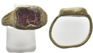
2235 ANCIENT ROMAN BRONZE RING. 4.8 Gr.,