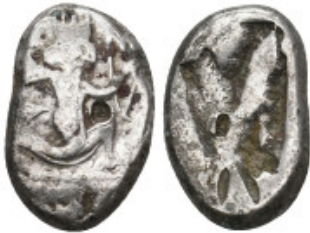
486 ACHAEMENID EMPIRE. Time of Darios I to Xerxes I (Circa 505-480 BC). Siglos. 5.37 Gr. 19.5 mm. 5