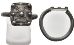
2222 ANCIENT GREEK SILVER RING (1ST-5TH CENTURY AD.) 4.14 Gr. 5