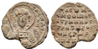
2010 BYZANTINE LEAD SEAL. 4.75 Gr. 22.5 mm.