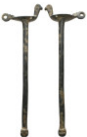
2360 ANCIENT ROMAN BRONZE OBJECT. 28 Gr. 12.2 mm. 5