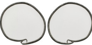
2161 ANCIENT SILVER EARRING. 1.79 Gr. 37.7 mm.