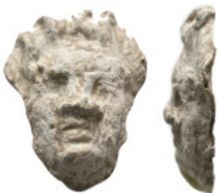
2294 ANCIENT ROMAN BRONZE APPLIQUE (1ST-5TH CENTURY AD). 54.01 Gr. 43.5 mm. 5