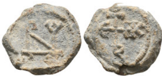
2050 BYZANTINE LEAD SEAL. 12.21 Gr. 25 mm.