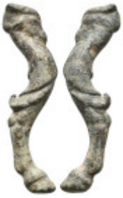
2361 ANCIENT ROMAN BRONZE HORSE LEG OBJECT. 27.24 Gr. 70 mm. 5