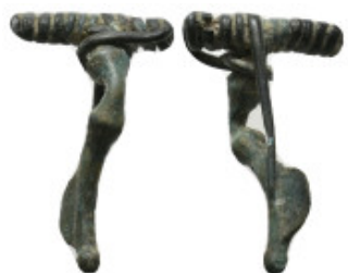
2354 ANCIENT GREEK BRONZE FIBULA (4TH-1ST CENTURY BC.) 2.22 Gr. 27 mm. 5