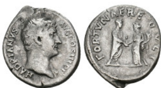
1351 HADRIAN (117-138). Denarius. Rome. 3.2 Gr. 19.5 mm.