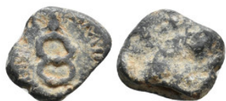
2058 BYZANTINE LEAD SEAL. 4.3 Gr. 16.2 mm.