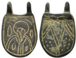
2372 ANCIENT BYZANTINE BRONZE OBJECT. 3.81 Gr. 23.4 mm. 5