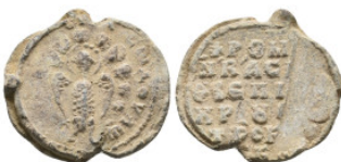
2036 BYZANTINE LEAD SEAL. 8.53 Gr. 24 mm.