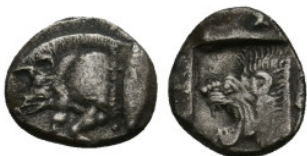
173 MYSIA. Kyzikos. Obol (Circa 450-400 BC). 0.97 Gr. 10.4 mm.