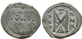
1806 MICHAEL II THE AMORIAN with THEOPHILUS (820-829). Follis. Constantinople. 6.06 Gr. 25.1 mm. 5