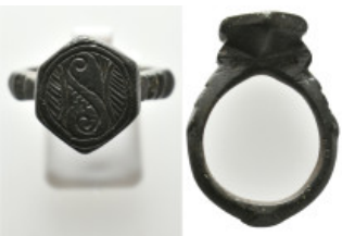
2247 ANCIENT BRONZE RING. 12.73 Gr.