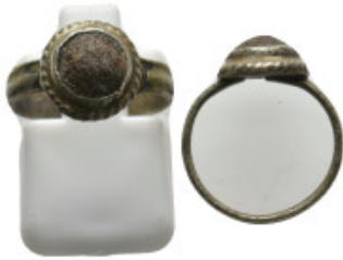
2243 ANCIENT BRONZE RING. 1.78 Gr.,