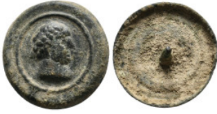
2290 ANCIENT ROMAN BRONZE APPLIQUE (1ST-5TH CENTURY AD). 1.44 Gr. 21.3 mm. 5