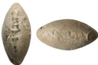
2263 ANCIENT GREEK PB SLING BULLET. (CIRCA 4TH-1ST CENTURY BC). 34.53 Gr. 33 mm.