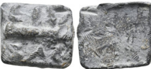
2066 GREEK. LEAD SEAL. 39.24 Gr. 41 mm.