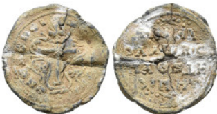
2034 BYZANTINE LEAD SEAL. 5.68 Gr. 27 mm.