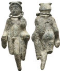
2289 ANCIENT ROMAN BRONZE FIGURINE. 30.09 Gr. 55.5 mm.