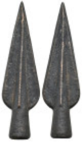
2153 GREEK BRONZE ARROWHEAD.(CIRCA 3RD-1ST BC). 5.29 Gr. 47 mm. 5