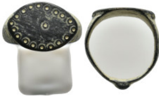
2246 ANCIENT BRONZE RING. 5.16 Gr.