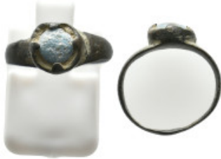
2244 ANCIENT BRONZE RING. 1.64 Gr.