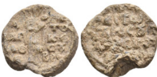
2037 BYZANTINE LEAD SEAL. 17.81 Gr. 26 mm.