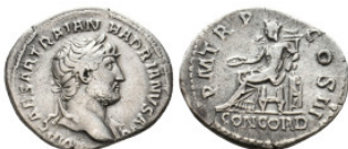
1352 HADRIAN (117-138). Denarius. Rome. 3.03 Gr. 20.2 mm.