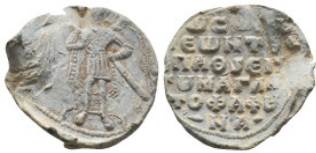
2009 BYZANTINE LEAD SEAL. 5.6 Gr. 21.4 mm.