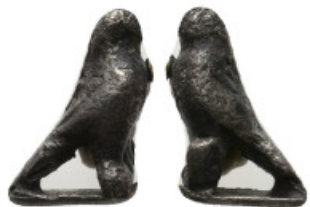
2284 ANCIENT ROMAN BRONZE EAGLE FIGURINE (1ST-5TH CENTURY AD) 1.34 Gr. 13.2 mm. 5