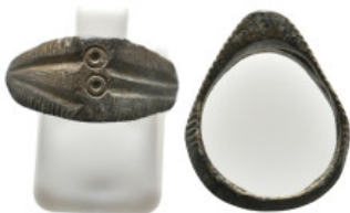
2220 ANCIENT ROMAN BRONZE RING (1ST-5TH CENTURY AD.) 5.18 Gr. 5