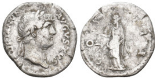
1349 HADRIAN (117-138). Denarius. Rome. 2.99 Gr. 19.7 mm.