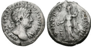
1346 HADRIAN (117-138). Denarius. Rome. 3.06 Gr. 18.6 mm.