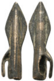
2157 GREEK BRONZE ARROWHEAD.(CIRCA 3RD-1ST BC). 5.93 Gr. 41.6 mm. 5