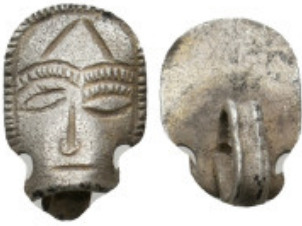
2311 ANCIENT SILVER FIGURINE. 0.46 Gr. 12 mm.