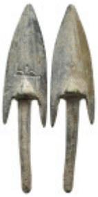
2154 GREEK BRONZE ARROWHEAD.(CIRCA 3RD-1ST BC). 12.42 Gr. 67.2 mm. 5