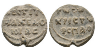
2045 BYZANTINE LEAD SEAL. 6.69 Gr. 19.3 mm.