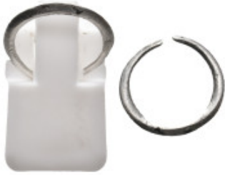
2196 ANCIENT GREEK SILVER PENDANT (CIRCA 3RD-1ST CENTURY BC). 0.48 Gr. 5