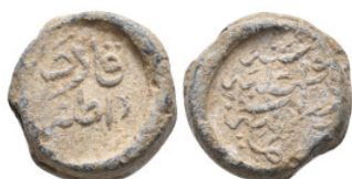
2060 ISLAMIC LEAD SEAL. 18.86 Gr. 20.75 mm.