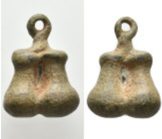
2191 ANCIENT GREEK BRONZE PENDANT (CIRCA 3RD-1ST CENTURY BC). 7.71 Gr. 72 mm. 5