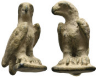
2274 ANCIENT ROMAN BRONZE EAGLE FIGURINE (1ST-5TH CENTURY AD). 59.3 9 Gr. 45.6 mm. 5