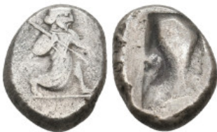
487 ACHAEMENID EMPIRE. Time of Darios I to Xerxes II (485-420 BC). Siglos. Sardes. 5.43 Gr. 17.4 mm. 5