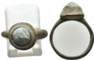
2241 ANCIENT BRONZE RING. 3.78 Gr.