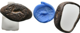
2211 ANCIENT ROMAN BRONZE RING (1ST-5TH CENTURY AD.) 5.56 Gr.