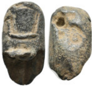
2362 ANCIENT ROMAN BRONZE OBJECT. 20.17 Gr. 30 mm. 5