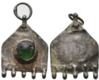
2373 ANCIENT ROMAN SILVER OBJECT. 3.4 Gr. 37 mm. 5