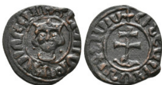
1854 ARMENIA. Hetoum II (1289-1305). Ae Kardez. 3.51 Gr. 22.4 mm. 5