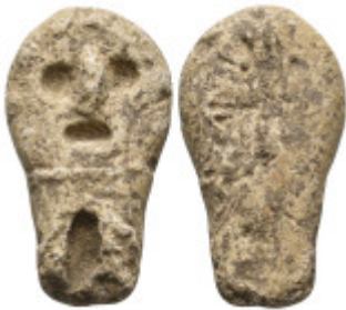
2363 ANCIENT ROMAN OBJECT. 28.25 Gr. 36 mm 5