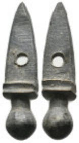
2170 ANCIENT ROMAN BRONZE GLADIUS SWORD PENDANT (1ST- 3RD CENTURY AD). 5.15 Gr. 35.1 mm. 5