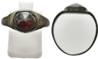
2238 ANCIENT ROMAN BRONZE RING. 2.15 Gr.