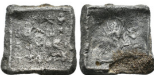
2067 BYZANTINE LEAD SEAL. 8.31 Gr. 30 mm.