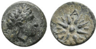
168 MYSIA. Gambrion. Ae (4th century BC). 0.83 Gr. 10.3 mm.