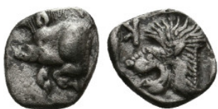
175 MYSIA. Kyzikos. Obol (Circa 450-400 BC). 0.85 Gr. 10.1 mm.