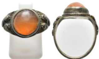
2234 ISLAMIC BRONZE RING. 3.68 Gr.,