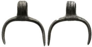
2197 ANCIENT GREEK SILVER PENDANT (CIRCA 3RD-1ST CENTURY BC). 0.39 Gr. 14.1 mm. 5