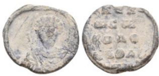
2008 BYZANTINE LEAD SEAL. 5.41 Gr. 20 mm.