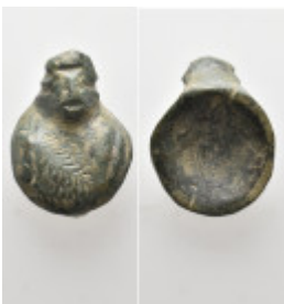
2299 ANCIENT ROMAN BRONZE APPLIQUE (1ST-5TH CENTURY AD). 13.72 Gr. 29.3 mm. 5