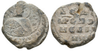
2046 BYZANTINE LEAD SEAL. 9.93 Gr. 23 mm.