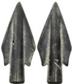
2152 GREEK BRONZE ARROWHEAD.(CIRCA 3RD-1ST BC). 4.95 Gr. 38.4 mm. 5