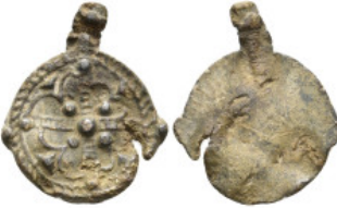
2063 BYZANTINE LEAD SEAL. 6.87 Gr. 31 mm.