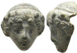
2293 ANCIENT ROMAN BRONZE APPLIQUE (1ST-5TH CENTURY AD). 28.22 Gr. 30.3 mm. 5