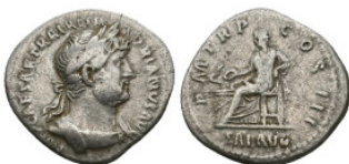
1353 HADRIAN (117-138). Denarius. Rome. 3.09 Gr. 20 mm.