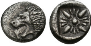
318 IONIA. Miletos. Obol (6th-5th century BC). 1 Gr. 9.3 mm.