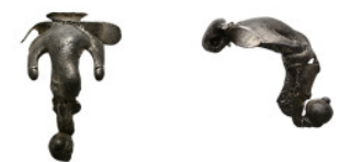
2353 ANCIENT GREEK BRONZE FIBULA (4TH-1ST CENTURY BC.) 24.08 Gr. 42 m m. 5