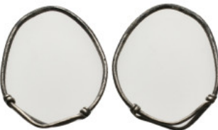
2162 ANCIENT SILVER EARRING. 2.5 Gr. 36.7 mm.