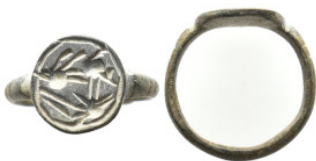
2207 ANCIENT ROMAN BRONZE RING (1ST-5TH CENTURY AD.). 3.24 Gr. 5