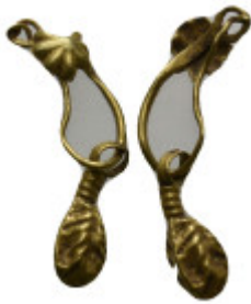
2165 ANCIENT GOLD EARRING. 0.66 Gr. 26.3 mm.