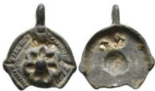
2192 ANCIENT GREEK GOLD PENDANT (CIRCA 3RD-1ST CENTURY BC). 8.11 Gr. 33.6 mm. 5