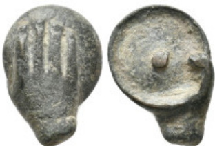
2319 ANCIENT ROMAN BRONZE HAND (1ST-3RD CENTURY AD.) 4.84 Gr. 20 mm. 5