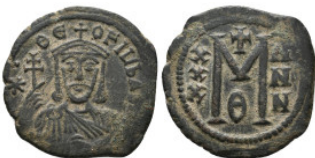
1804 THEOPHILUS (829-842). Follis. Constantinople. 8.11 Gr. 18.8 mm. 5