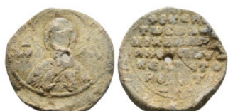
1997 BYZANTINE LEAD SEAL. 9.44 Gr. 25 mm.