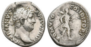
1350 HADRIAN (117-138). Denarius. Rome. 3.22 Gr. 18.7 mm.