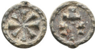
2062 BYZANTINE LEAD SEAL. 1.28 Gr. 14.4 mm.