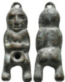
2288 ANCIENT GREEK BRONZE FIGURINE. 16 Gr. 37 mm.