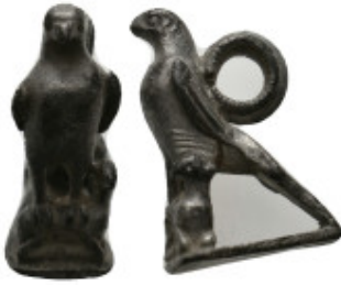
2279 ANCIENT ROMAN BRONZE EAGLE FIGURINE (1ST-5TH CENTURY AD) 5.74 Gr. 23 mm. 5