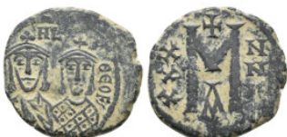
1807 MICHAEL II THE AMORIAN with THEOPHILUS (820-829). Follis. Constantinople. 4.8 Gr. 22 mm. 5