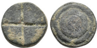
2118 BYZANTINE WEIGHT. 4.1 Gr. 14.8 mm.