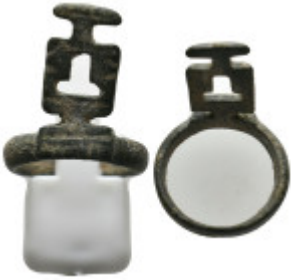
2250 ANCIENT BRONZE RING. 4.16 Gr.