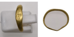
2201 ANCIENT BYZANTINE GOLD RING (CIRCA 11TH-14TH AD). 2.9 Gr. 5