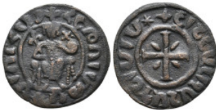
1853 ARMENIA. Hetoum I (1226-1270). Ae Tank. 7.07 Gr. 29.7 mm. 5