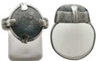
2236 ANCIENT ROMAN SILVER RING. 5.74 Gr.