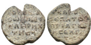
2044 BYZANTINE LEAD SEAL. 7 Gr. 22.7 mm.