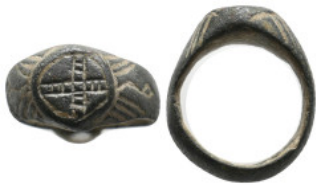
2219 ANCIENT ROMAN BRONZE RING (1ST-5TH CENTURY AD.) 4.99 Gr. 5