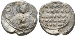
2006 BYZANTINE LEAD SEAL. 9.01 Gr. 26 mm.