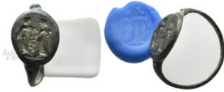
2202 ANCIENT ROMAN BRONZE RING (1ST-5TH CENTURY AD.). 1.97 Gr. 5