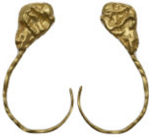
2164 ANCIENT GOLD EARRING. 0.59 Gr. 24.8 mm.