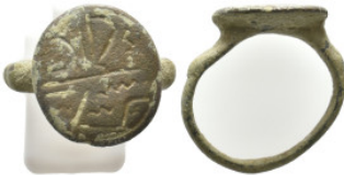
2253 ISLAMIC BRONZE RING. 8.11 Gr.