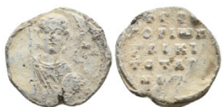
1995 BYZANTINE LEAD SEAL. 6.92 Gr. 23 mm.