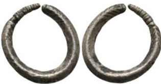
2167 ANCIENT SILVER EARRING. 7.45 Gr. 30 mm.