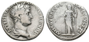
1348 PONTOS. Amisos. Hadrian (117-138). Drachm. Rare. 3 Gr. 18.6 mm.