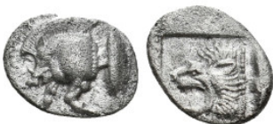
174 MYSIA. Kyzikos. Obol (Circa 450-400 BC). 1.2 Gr. 11.6 mm.