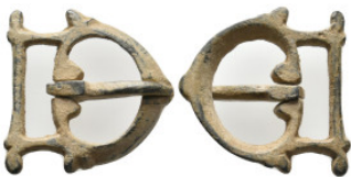
2382 ANCIENT BYZANTINE/SELJUK BRONZE BELT BUCKLE. (11TH – 14TH century A.D.) . 8.87 Gr. 32.6 mm. 5