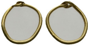
2158 ANCIENT GOLD EARRING. 0.37 Gr. 10.2 mm.