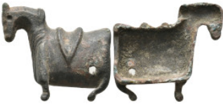
2341 ANCIENT ROMAN BRONZE HORSE OBJECT. 16.25 Gr. 49 mm. 5