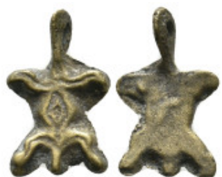
2195 ANCIENT ROMAN BRONZE PENDANT (CIRCA 3RD-1ST CENTURY BC). 1.83 Gr. 22.1 mm. 5