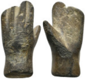
2317 ANCIENT ROMAN BRONZE HAND (1ST-3RD CENTURY AD.) 10.98 Gr. 27.4 mm. 5