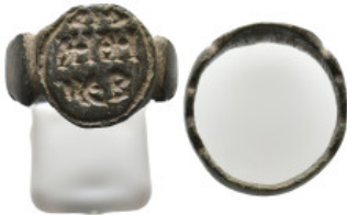
2217 ANCIENT ROMAN BRONZE RING (1ST-5TH CENTURY AD.) 4.88 Gr. 5