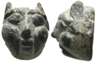
2301 ANCIENT ROMAN BRONZE APPLIQUE (1ST-5TH CENTURY AD). 25.5 Gr. 23 mm. 5