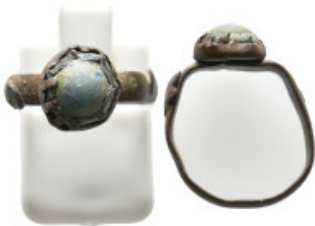
2240 ANCIENT BRONZE RING. 1.93 Gr.