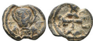
2056 BYZANTINE LEAD SEAL. 5.45 Gr. 20.3 mm.