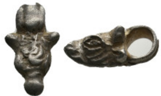
2193 ANCIENT GREEK SILVER PENDANT (CIRCA 3RD-1ST CENTURY BC). 3.27 G r. 16.6 mm. 5