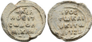
2031 BYZANTINE LEAD SEAL. 8.78 Gr. 25 mm.