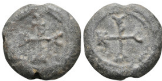
2049 BYZANTINE LEAD SEAL. 15.09 Gr. 25.7 mm.