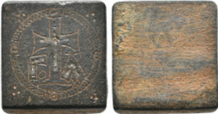
2113 BYZANTINE WEIGHT. 26.46 Gr. 31 mm.