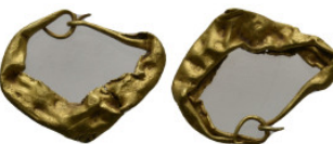
2163 ANCIENT GOLD EARRING. 1.65 Gr. 22.4 mm.