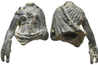
2292 ANCIENT ROMAN BRONZE FIGURINE. 26.07 Gr. 43 mm. 5