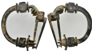
2351 ANCIENT GREEK BRONZE FIBULA (4TH-1ST CENTURY BC.) 28.23 Gr. 50 m m. 5