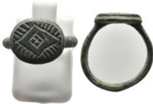
2245 ANCIENT BRONZE RING. 3.25 Gr.