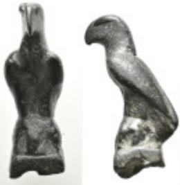
2277 ANCIENT ROMAN BRONZE EAGLE FIGURINE (1ST-5TH CENTURY AD) 42.78 Gr. 44.6 mm. 5