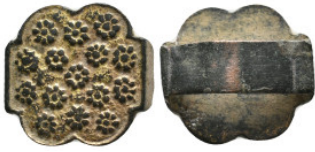
2368 ANCIENT ROMAN BRONZE DRESS ORNAMENT OBJECT. 2.8 Gr. 20.6 mm. 5