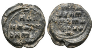
2040 BYZANTINE LEAD SEAL. 6.88 Gr. 21.5 mm.