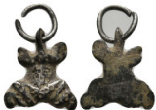
2194 ANCIENT GREEK SILVER PENDANT (CIRCA 3RD-1ST CENTURY BC). 2.64 G r. 24.8 mm. 5