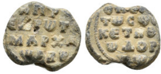
2030 BYZANTINE LEAD SEAL. 2.14 Gr. 13.7 mm.