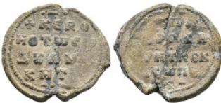
2032 BYZANTINE LEAD SEAL. 10.26 Gr. 30 mm.