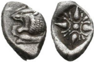
319 IONIA. Miletos. Obol (6th-5th century BC). 1.07 Gr. 11.6 mm.