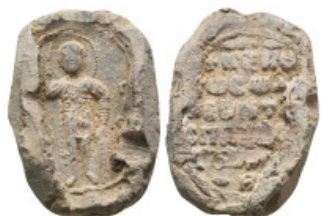
1992 BYZANTINE LEAD SEAL. 15.32 Gr. 26 mm.