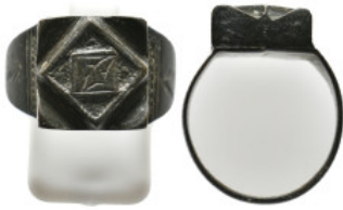
2255 ISLAMIC BRONZE RING. 9.76 Gr.