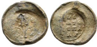
2038 BYZANTINE LEAD SEAL. 6.41 Gr. 23 mm.