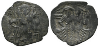
1850 LATIN RULERS OF CONSTANTINOPLE. Small module trachy. Thessalonica. 1. 72 Gr. 24 mm. 5