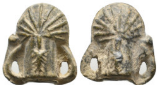
2381 ANCIENT ROMAN OBJECT. 9.68 Gr. 21 mm. 5