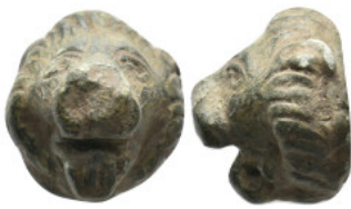
2303 ANCIENT ROMAN BRONZE APPLIQUE (1ST-5TH CENTURY AD). 29.13 Gr. 21 mm. 5