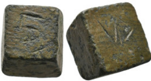
2114 ISLAMIC GAME STONE. 29.26 Gr. 23.9 mm.,