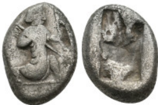
488 ACHAEMENID EMPIRE. Time of Darios I to Xerxes II (485-420 BC). Siglos. Sardes. 5.31 Gr. 17.5 mm. 5