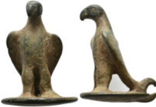
2275 ANCIENT ROMAN BRONZE EAGLE FIGURINE (1ST-5TH CENTURY AD) 44.83 Gr. 40.5 mm. 5