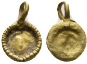
2190 ANCIENT GREEK GOLD PENDANT (CIRCA 3RD-1ST CENTURY BC). 0.3 Gr. 10 mm. 5