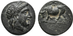
169 MYSIA. Gambrion. Ae (4th century BC). 0.94 Gr. 10.5 mm.