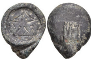
987 Seal (3.79g 20.1mm diameter)