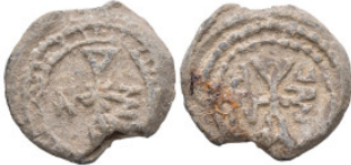
991 Byzantine Lead Seal (11.49g 23.04mm diameter)