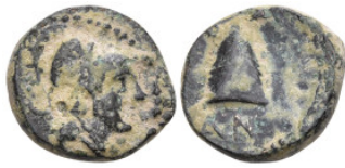
520 Greek AE Bronze (14.4mm 1.37g)