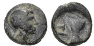
524 Greek AE Bronze (7.57mm 0.55g)