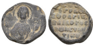
1000 Byzantine Lead Seal (5.8g 17.7mm diameter)