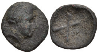
532 AE Bronze (18mm 1.33g)