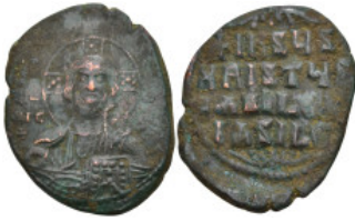
896 Byzantine Anonymous Follis. Time of Basil II with Constantine VIII (976-1025.AD) AE Follis (29mm 7.16g) 5