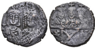
842 Byzantine Constantine VI with Irene (780-797 AD). Constantinople AE Follis (21.18mm 4.06g) 5