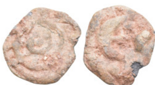
527 Greek AE Bronze (13.4mm 1g)