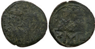
840 Byzantine Leo IV the Khazar, with Constantine VI (775-780 AD). Constantinople A E Follis (24.2mm 5.09g) 5