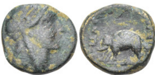
61 Greek SELEUKID KINGS OF SYRIA. Antiochos III 'the Great' (222-187 BC). Sardes AE Bronze (12mm 1.93g) 5