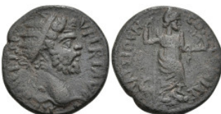
143 Roman Provincial PISIDIA. Antioch. Septimius Severus (193-211 AD). AE Bronze (19.3mm 6g) 5