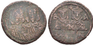
841 Byzantine Leo IV the Khazar, with Constantine VI, (775-780 AD). Constantinople A E Follis (24.6mm 5.78g) 5