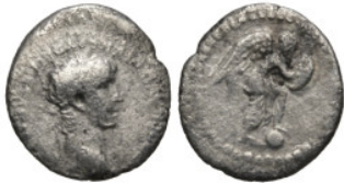
193 Roman Provincial CAPPADOCIA. Caesarea. Nero (54-68 AD). AR Hemidrachm (14.7mm 1.53g) 5