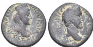
197 Roman Provincial CAPPADOCIA. Caesarea. Antoninus Pius (138-161 AD) AE Bronze (19.3mm 4.75g) 5