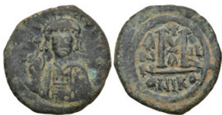
939 Byzantine AE Follis (31.2mm 12.64g) 5