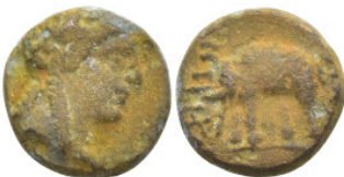
62 Greek SELEUKID KINGS OF SYRIA. Antiochos III 'the Great' (222-187 BC). Sardes AE Bronze (11mm 1.93g) 5