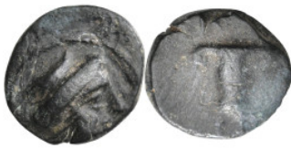
528 Greek AE Bronze (10.5mm 1.29g)