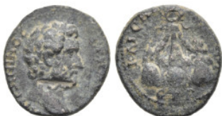
198 Roman Provincial CAPPADOCIA. Caesarea. Antoninus Pius (138-161 AD) AE Bronze (15.7mm 3g) 5