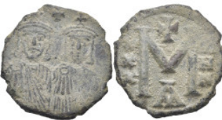
843 Byzantine Nicephorus I, with Stauracius (802-811 AD). Constantinople AE Follis (22.01mm 4.77g) 5