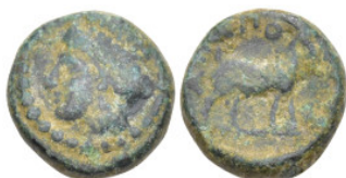
526 Greek AE Bronze (10.2mm 1.59g)