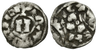
982 World AR Silver (15.1mm 0.79g)