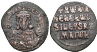
875 Byzantine Constantine VII Porphyrogenitus, with Romanus I (913-959 AD). Constantinople AE Follis (26.8mm 7.6g) 5