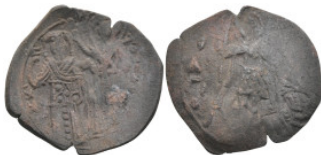
943 Byzantine AE Trachy (24.3mm 2.42g)