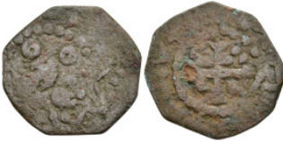
983 Medieval CRUSADERS. County of Tripoli. Raymond I / Raymond II, (1st half of 12th cent) AE Bronze (15.3mm 1.27g)