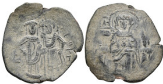
936 Byzantine AE Trachy (34.9mm 3.31g) 5