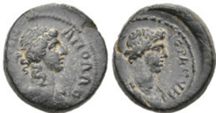
171 Roman Provincial LYDIA. Apollonis. Pseudo-autonomous (3rd century). AE Bronze (15.6mm 3.65g) 5