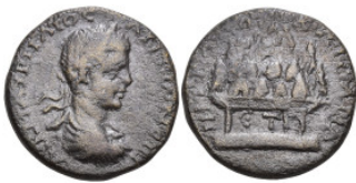
218 Roman Provincial CAPPADOCIA, Caesarea, Gordian III. (238-244 AD) AE Bronze (25.5mm 11.3g) 5