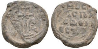
999 Byzantine Lead Seal (4.95g 20.2mm diameter)