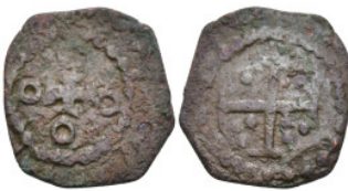
984 Medieval CRUSADERS. County of Tripoli. Raymond I / Raymond II, (1st half of 12th cent) AE Bronze (16.1mm 0.82g)