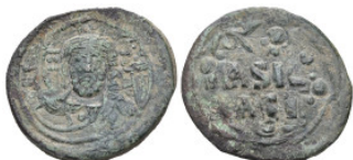
941 Byzantine AE Follis (27.5mm 5.91g) 5