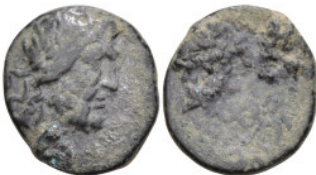
531 Greek AE Bronze (16mm 2.52g)