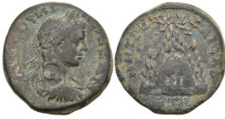
216 Roman Provincial CAPPADOCIA, Caesarea, Severus Alexander (222-235 AD) AE Bronze (27mm 11.96g) 5