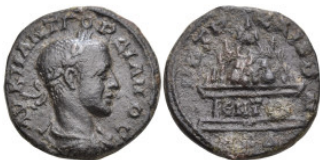
219 Roman Provincial CAPPADOCIA, Caesarea, Gordian III. (238-244 AD) AE Bronze (24.2mm 10.65g) 5