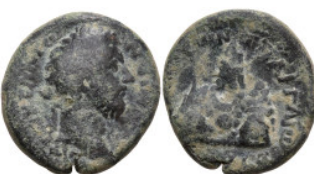
199 Roman Provincial CAPPADOCIA. Caesarea. Marcus Aurelius (161-180 AD) AE Bronze (28mm 7.54g) 5