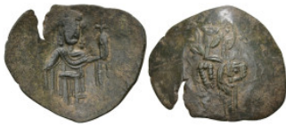
942 Byzantine AE Trachy (23.5mm 1.61g)