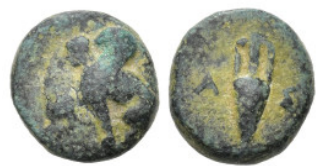
522 Greek AE Bronze (10.15mm 1.57g)