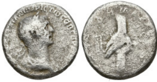
192 Roman Provincial CAPPADOCIA. Caesarea. Trajan (98-117 AD) AR Didrachm (20.3mm 6.1g) 5