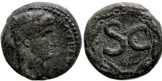
140 Roman Provincial SYRIA. Seleucis and Pieria. Antioch. Tiberius (14-37 AD) AE Bronze (18.8mm 7.09g) 5