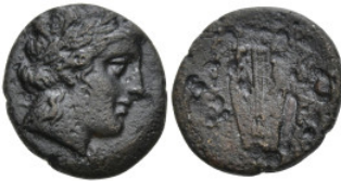
57 Greek KINGS OF BITHYNIA. Prusias I. (Circa 238-183 BC) AE Bronze (13.3mm 2.01g) 5