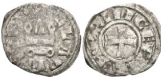
986 World CRUSADERS. BI Denier Tournais (19mm 0.81g)