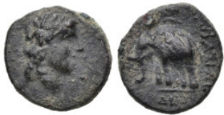
60 Greek SELEUKID KINGDOM. Antiochos III 'the Great' (222-187 BC) AE Bronze (12.55mm 1.36g) 5