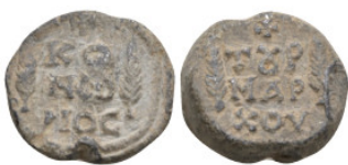
995 Byzantine Lead Seal (16.87g 22.9mm diameter)