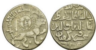
949 ISLAMIC Seljuks. Rum. Ghiyath al-Din Kay Khusraw II bin Kay Qubadh (634-644 AH / 1237-1246 AD) (21.2mm 2.08g)