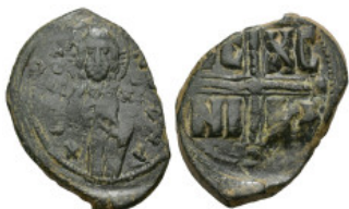
901 Byzantine Anonymous follis attributed to Michael IV (1034-1041 AD). Constantino ple AE Follis (27.5mm 8.03g) 5