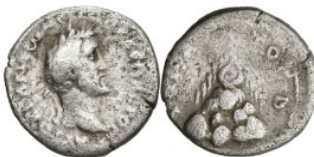
196 Roman Provincial CAPPADOCIA. Caesarea. Antoninus Pius (138-161 AD) AR Drachm (17.7mm 2.57g) 5