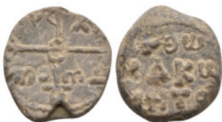
994 Byzantine Lead Seal (13.37g 23.3mm diameter)