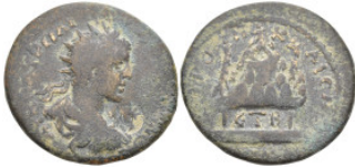
217 Roman Provincial CAPPADOCIA, Caesarea. Severus Alexander (222-235 AD). AE Bronze (29mm 11.49g) 5