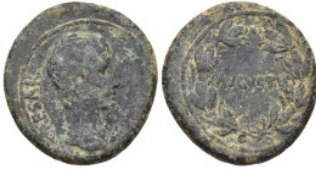
136 Roman Provincial SYRIA. Seleucis and Pieria. Antioch. Augustus (27 BC-14 AD). AE Bronze (26.2mm 9.65g) 5