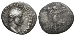
194 Roman Provincial CAPPADOCIA. Caesarea. Hadrian (117-138 AD) AR Hemidrachm (13.6mm 1.62g) 5