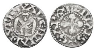
945 World FRANCE. Valence. Anonymous Bishops (1157-1276 AD) AR Denier (15.3mm 1g)