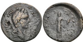
535 Roman Provincial Antoninus Pius (138-161 AD) AE Bronze (19mm 4.43g)