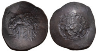
935 Byzantine Michael VIII Palaeologus (1261-1282 AD). Constantinople AE Trachy (28mm 4.09g) 5