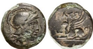
175 Greek TROAS. Assos. (4th-mid 3rd century BC). AE Bronze (12.5mm 1.71g) 5