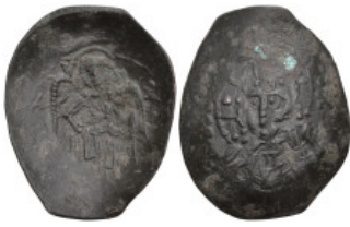
934 Byzantine Latin Rulers of Constantinople (1204-1261 AD). Constantinople AE Trachy (27.1mm 3.37g) 5