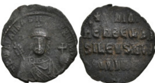
879 Byzantine Constantine VII Porphyrogenitus, with Romanus I (913-959 AD). Constantinople AE Follis (24.5mm 3.89g) 5