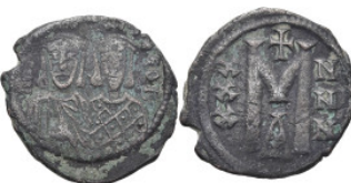
847 Byzantine Michael II with Theophilus (820-829 AD). Constantinople AE Follis (22.82mm 4.07g) 5