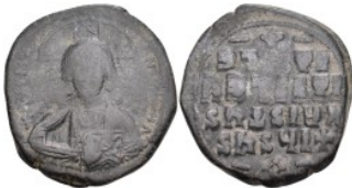
898 Byzantine Anonymous Follis. Time of Basil II with Constantine VIII (976-1025.AD). Constantinople AE Follis (37.3mm 12.16g) 5