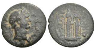
173 Roman Provincial PAMPHYLIA. Aspendos. Trajan (98-117 AD). AE Bronze (20.39mm 5.07g) 5