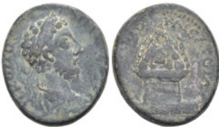
203 Roman Provincial CAPPADOCIA. Caesarea. Commodus (177-192 AD) AE Bronze (16.8mm 14.88g) 5