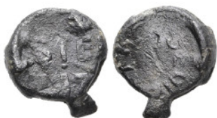
1005 Byzantine Lead Seal (3.61g 12.9mm diameter)