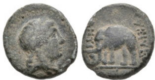
58 Greek SELEUKID KINGS OF SYRIA. Antiochos III 'the Great' (223-187 BC). AE Bronze (12.97mm 2.24g) 5