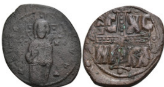
902 Byzantine Anonymous, attributed to Michael IV (1034-1041 AD). Constantinople A E Follis (31.2mm 7.62g) 5