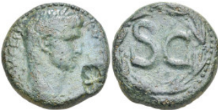
139 Roman Provincial SYRIA. Seleucis and Pieria. Antioch. Tiberius (14-37 AD) AE Bronze (25.5mm 17.13g) 5