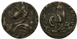
220 Roman Provincial MESOPOTAMIA. Carrhae. Severus Alexander (222-235 AD) AE Bronze (23.1mm 9.56g) 5