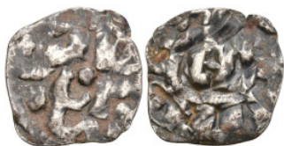
944 Medieval ITALY. Lucca. Heinrich III-V (1039-1125AD). Denier Silver (17.1mm 0.88g)