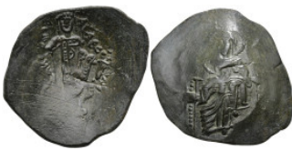
937 Byzantine AE Trachy (38mm 3.14g) 5