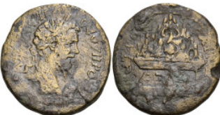
206 Roman Provincial CAPPADOCIA, Caesarea-Eusebia. Septimius Severus. (193-211 AD) AE Bronze (29mm 12.6g) 5