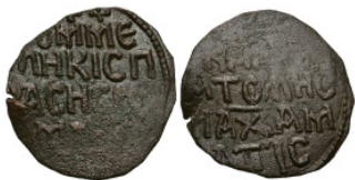
940 ISLAMIC, Anatolia & al-Jazira (Post-Seljuk). Danismendids (Sivas). Malik Muhammad, AH 528-536 / AD 1134-1142. AE Fals (27.6mm 2.59g) 5