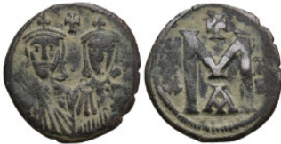
844 Byzantine Nicephorus I, with Stauracius (802-811 AD). Constantinople AE Follis (24.54mm 3.95g) 5