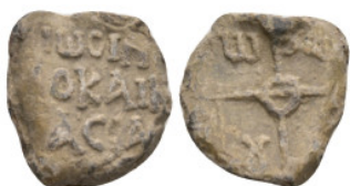
997 Byzantine Lead Seal (7.38g 19.5mm diameter)