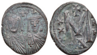
846 Byzantine Nicephorus I, with Stauracius (802-811 AD). Constantinople AE Follis (23.44mm 4.2g) 5