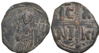
900 Byzantine Anonymous, attributed to Michael IV (1034-1041 AD). Constantinople A E Follis (34.7mm 5.13g) 5