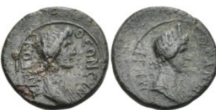
63 Roman Provincial MYSIA. Pergamon. Pseudo-autonomous. Time of Trajan-Hadrian (98-138 AD) AE Bronze (18.3mm 2.93g) 5