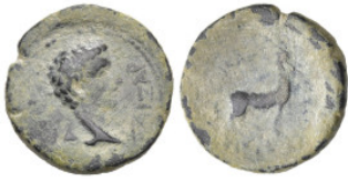
168 Roman Provincial PHRYGIA. Apamea. Germanicus, Caesar (15 BC-19 AD) AE Bronze (16.45mm 2.75g) 5