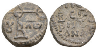
996 Byzantine Lead Seal (11.16g 23.2mm diameter)