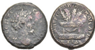
205 Roman Provincial CAPPADOCIA. Caesarea. Septimius Severus (193-211 AD) AE Bronze (23.6mm 11.43g) 5