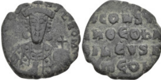
873 Byzantine Constantine VII and Romanus I (913-959 AD). Constantinople AE Follis (22mm 6.38g) 5