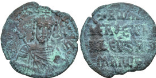
877 Byzantine Constantine VII Porphyrogenitus, with Romanus I. (913-959 AD) Constantinople AE Follis (27mm 5.91g) 5