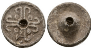
990 Byzantine Stamp Seal (11.36g 24.37mm diameter)