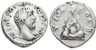
200 Roman Provincial CAPPADOCIA. Caesarea. Lucius Verus (161-169 AD). AR Didrachm (21.7mm 6.51g) 5