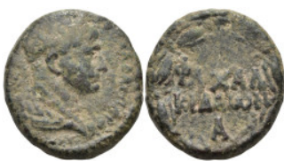
221 Roman Provincial SELEUCIS and PIERIA. Chalcidice, Chalcis ad Belum. Trajan (98-117 AD). AE Bronze (23.4mm 11.53g) 5