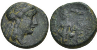
59 Greek SELEUKID KINGDOM. Antiochos III Megas. Sardes (Circa 223-187 BC) AE Bronze (16mm 4.28g) 5