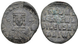
874 Byzantine Constantine VII Porphyrogenitus, with Romanus I (913 - 959 AD). Constantinople AE Follis (23.1mm 5.38g) 5