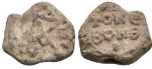
998 Byzantine Lead Seal (7.38g 18.6mm diameter)