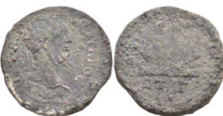
207 Roman Provincial CAPPADOCIA, Caesarea-Eusebia. Septimius Severus. (193-211 AD) AE Bronze (29mm 15.41g) 5