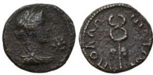
170 Roman Provincial MYSIA. Apollonia ad Rhyndacum. Antoninus Pius (138-161 AD) AE Bronze (16.33mm 1.93g) 5