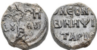
1003 Byzantine Lead Seal (17.25g 21.8mm diameter)