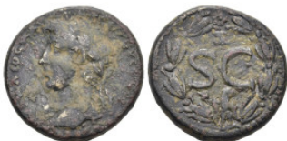
142 Roman Provincial SYRIA, Seleucis and Pieria. Antioch. Marcus Aurelius, as Caesar (139-161 AD) AE Bronze (23.9mm 9.09g) 5