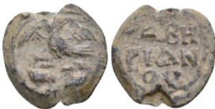
1002 Byzantine Lead Seal (8.84g 23.9mm diameter)