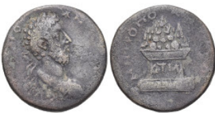
204 Roman Provincial CAPPADOCIA. Caesarea. Commodus (177-192 AD) AE Bronze (29.12mm 12.8g) 5