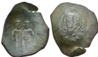
938 Byzantine AE Trachy (32.1mm 2.8g) 5