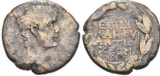
137 Roman Provincial SELEUCIS and PIERIA. Antioch. Tiberius (14-37 AD) AE Bronze (28mm 12.98g) 5