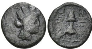
530 Greek AE Bronze (14mm 1.3g)