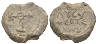
992 Byzantine Lead Seal (17.87g 28mm diameter)