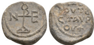
993 Byzantine Lead Seal (11.33g 22.5mm diameter)