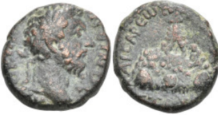
201 Roman Provincial CAPPADOCIA. Caesarea-Eusebia. Marcus Aurelius (161-180 AD) AE Bronze (19mm 7.7g) 5