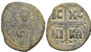
899 Byzantine Anonymous, attributed to Michael IV (1034-1041 AD). Constantinople A E Follis (36.5mm 8.58g) 5