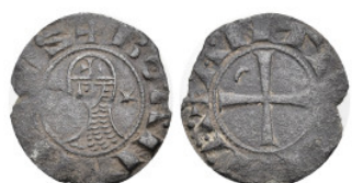
947 World CRUSADERS. Antioch. Bohemund IV or V (1201-1251 AD). BI Denier (17.21mm 0,89g)