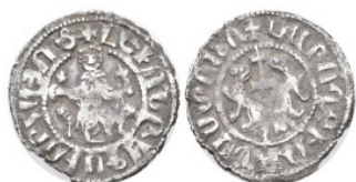
946 World Cilician Armenia. Levon I (1199-1219 AD). Sis mint AR Tram (22.65mm 2.35g)