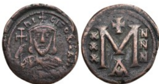
845 Byzantine Theophilus (829-842 AD). Constantinople AE Follis (23.75mm 5.45g) 5