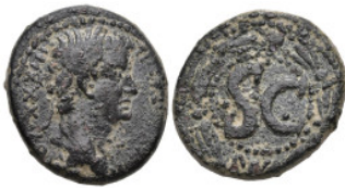
138 Roman Provincial SYRIA, Seleucis and Pieria. Antioch. Tiberius (14-37 AD) AE Bronze (27.9mm 15.12g) 5