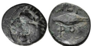
223 Greek THRACE. Chersonesos. (Circa 386-309 BC). AE Bronze (14.7mm 1.1g) 5