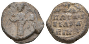
1001 Byzantine Lead Seal (9.15g 22.2mm diameter)