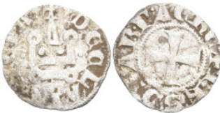
985 World CRUSADERS. BI Denier Tournais (16.8mm 0.61g)