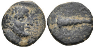
521 Greek AE Bronze (20mm 2.18g)