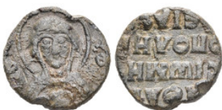
1004 Byzantine Lead Seal (4.43g 16.1mm diameter)