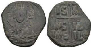
897 Byzantine Anonymous attributed to Romanus III (1028-1034 AD). Constantinople AE Bronze (26mm 10.64g) 5