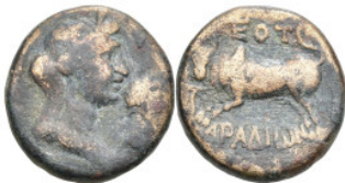
172 Roman Provincial PHOENICIA. Aradus. Trajan. (98-117 AD) AE Bronze (22mm 10.13g) 5