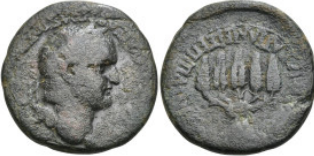
169 Roman Provincial PHRYGIA. Apamea. Vespasian (69-79 AD). Plancius Varus, pro consul of Bithynia and Pontus. AE Bronze (24mm 8.1g) 5