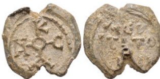
988 Byzantine Lead Seal (10.85g 10.5mm diameter)