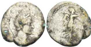
195 Roman Provincial CAPPADOCIA. Caesarea. Hadrian (117-138 AD). AR Hemidrachm (16.9mm 2.85g) 5