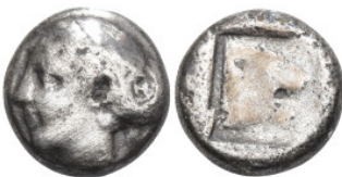
174 Greek TROAS. Assos (?). (Mid-late 5th century BC). AR Triobol or Hemidrachm (10.5mm 1.87g) 5