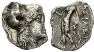
56 Greek SELEUKID EMPIRE. Seleukos II Kallinikos (246-225 BC). Uncertain mint AR Drachm (13.5mm 3.17g) 5