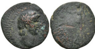
533 Roman Provincial Nero (54-68 AD) AE Bronze (19mm 3.25g)