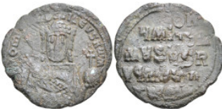
878 Byzantine Constantine VII Porphyrogenitus, with Romanus I (913-959 AD). Constantinople AE Follis (25.5mm 5.56g) 5