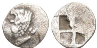
222 Greek THRACIAN CHERSONESOS. 'Kardia' (Circa 500) AR Hemiobol (7.2mm 0.29g) 5