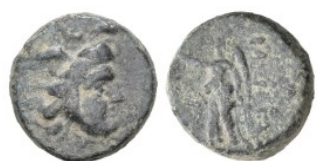
525 Greek AE Bronze (11.6mm 2.06g)