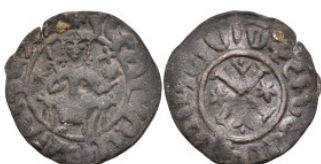
948 World Cilician Armenia. Hetoum I (1226-1270 AD). AE Tank (39.7mm 6.44g)