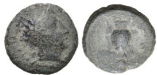
523 Greek AE Bronze (12.92mm 1.66g)