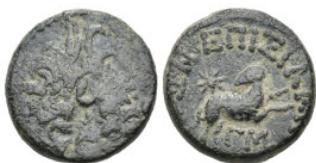
141 Roman Provincial SYRIA, Seleucis and Pieria. Antioch. Pseudo-autonomous issue (1st century AD) AE Bronze (18.5mm 5.9g) 5