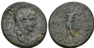
534 Roman Provincial Trajan (98-117 AD) AE Bronze (30.3mm 6g)