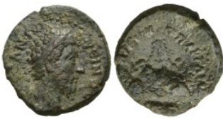
202 Roman Provincial CAPPADOCIA. Caesarea. Commodus (177-192 AD) AE Bronze (22.5mm 8.12g) 5