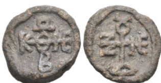
989 Byzantine Lead Seal (10.28g 22.1mm diameter)