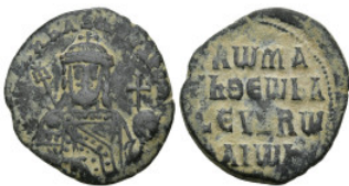
876 Byzantine Constantine VII Porphyrogenitus, with Romanus I (913-959 AD). Constantinople AE Follis (24.9mm 5.93g) 5