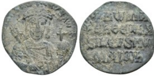
872 Byzantine Constantine VII Porphyrogenitus, with Romanus I. (913-959 AD). Constantinople AE Follis (25.2mm 6.51g) 5