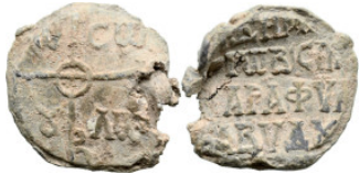
843 Byzantine Lead Seal (10.88g 28.5mm diameter)