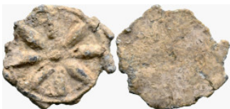
855 Roman Seal (3.59g 16.7mm diameter)