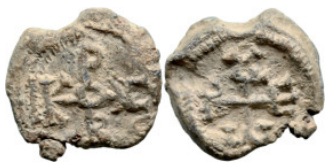
840 Byzantine Lead Seal (8.51g 22.2mm diameter)