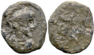
858 Roman Seal (3.72g 9.5mm diameter)