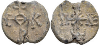
864 Byzantine Lead Seal (8.15g 30.2mm diameter)