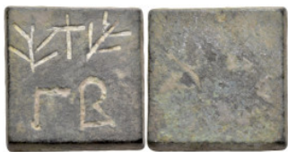
868 Weight (50.43g 36,7mm diameter)