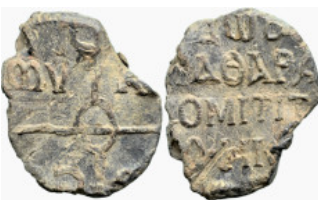
833 Byzantine Lead Seal (7.4g 26mm diameter)