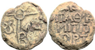
832 Byzantine Lead Seal (14.23g 25.5mm diameter)