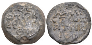
862 Byzantine Lead Seal (15.54g 29.2mm diameter)