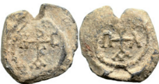
834 Byzantine Lead Seal (7.84g 22.2mm diameter)