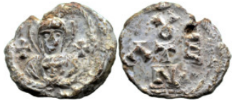
836 Byzantine Lead Seal Seal of Leontis (6th-7th centuries AD) Obv: Bust of the Virgin with the medallion of Christ before her. Crosses on either side Rev: Λεοντίου. Cruciform monogram (8.45g 24.9mm diameter)