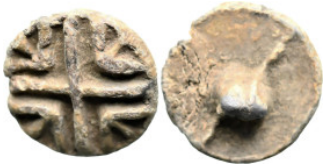
851 Stamp Seal (5.15g 17.1mm diameter)