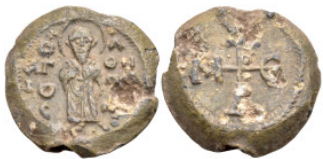
861 Byzantine Lead Seal (12.15g 30.7mm diameter)