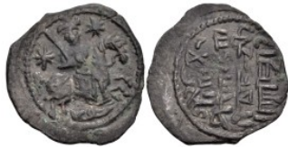
831 Islamic AE Bronze (33.5mm 2.63g)