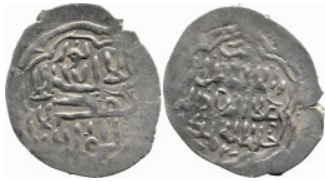
823 Islamic AR Silver (21.9mm 1.56g)