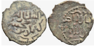
822 Islamic AE Bronze (22.8mm 2.77g)