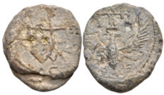
859 Byzantine Lead Seal (20.03g 34.3mm diameter)