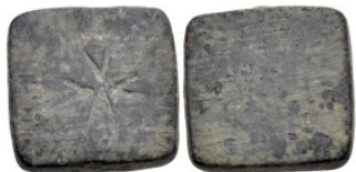
869 Weight (4.46g 18.1mm diameter)