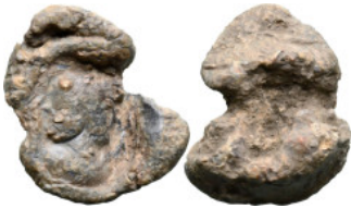
852 Roman Seal (7.42g 14.5mm diameter)