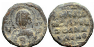
841 Byzantine Lead Seal (4.09g 15.3mm diameter)