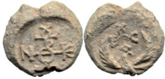
835 Byzantine Lead Seal (12.67g 24.6mm diameter)