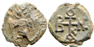
849 Byzantine Lead Seal (5.75g 19.4mm diameter)