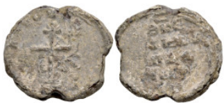
863 Byzantine Lead Seal (6.24g 27.2mm diameter)