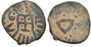
828 World AE Bronze (20.1mm 2.34g)