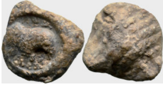
857 Roman Seal (7.61g 12.9mm diameter)