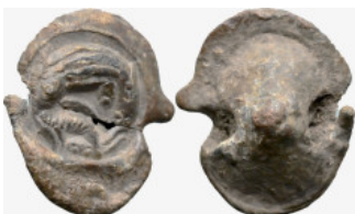
856 Roman Seal (4.18g 12.2mm diameter)