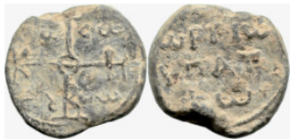
837 Byzantine Lead Seal (10.27g 22.1mm diameter)