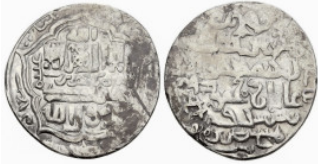
829 Islamic AR Silver (mm g)