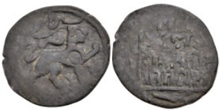
830 Islamic AE Bronze (25.9mm 1.6g)