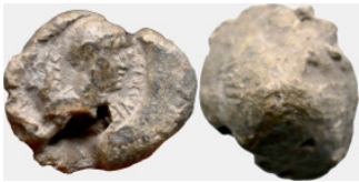
854 Roman Seal (18.84g 17mm diameter)