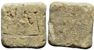
866 Greek (42.96g 23.9mm diameter)