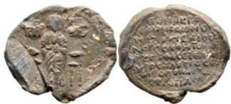
845 Byzantine Lead Seal (28.15g 35.9mm diameter)