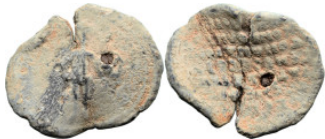
846 Byzantine Lead Seal (26.33g 40.1mm diameter)