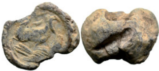
853 Roman Seal (7.64g 13.4mm diameter)