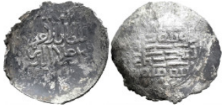
821 ISLAMIC AR Silver (22.2mm 1.54g)