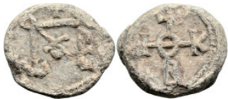
838 Byzantine Lead Seal (14.99g 23.5mm diameter)