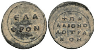
867 Weight AE Byzantine coin weight (11th century AD) (20.2mm 4.32g) Obv: Inscription of two lines: ΕΛΛΑΦΡΟΝ. Rev: Inscription of four lines beginning with a cross: +ΠΑΛΑΙΟΝ Ο ΛΟΤΡΑΧΟΝ. Bendall's translation: The old, un mutilated light-weight (coin). Bendall 19; Hendy, Studies, p. 508, note 295. The Greek legend is more problematic, since the meaning of olotracon is otherwise unattested.