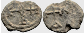
850 Byzantine Lead Seal (7.26g 21.3mm diameter)