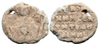
847 Byzantine Lead Seal (9.43g 26.4mm diameter)