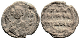
844 Byzantine Lead Seal (6.39g 20.4mm diameter)