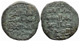
824 Islamic AE Bronze (22.9mm 6.57g)