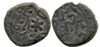
825 Islamic AE Bronze (14.4mm 2.94g)