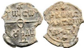
839 Byzantine Lead Seal (7.47g 28.7mm diameter)