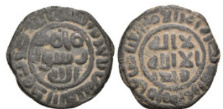
827 Islamic AE Bronze (22.7mm 2.74g)