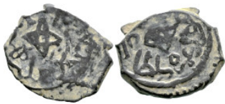
826 Islamic AE Bronze (16.7mm 2.34g)