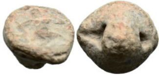
842 Roman Lead Seal Obv: Male (?) running right (4.65g 14.3mm diameter)