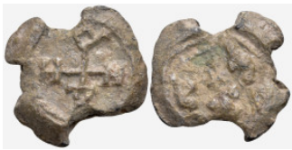
860 Byzantine Lead Seal (7g 28.4mm diameter)