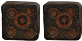
891 Islamic Weight. Bronze. (25mm, 41,29g)