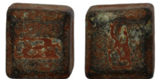
893 Islamic Weight. Bronze. (20mm, 17,41g)