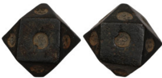
887 Islamic Weight. Bronze. (22mm, 30,05g)