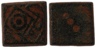
898 Islamic Weight. Bronze. (14mm, 14,48g)