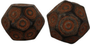
896 Islamic Weight. Bronze. (11mm, 5,70g)