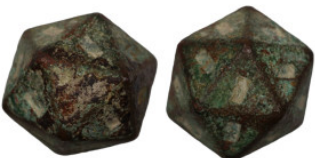
895 Islamic Weight. Bronze. (14mm, 14,62g)