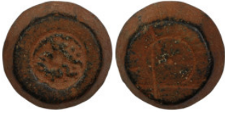
882 Islamic Weight. Bronze. (20mm, 29,86g)