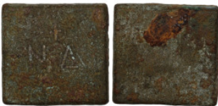
894 Islamic Weight. Bronze. (21mm, 28,83g)