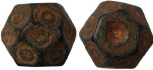
890 Islamic Weight. Bronze. (12mm, 14,60g)