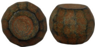
901 Islamic Weight. Bronze. (13mm, 5,71g)