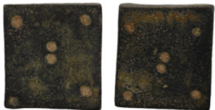
888 Islamic Weight. Bronze. (12mm, 5,79g)