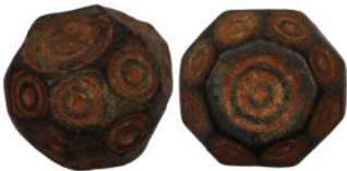
900 Islamic Weight. Bronze. (14mm, 14,51g)