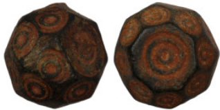
899 Islamic Weight. Bronze. (18mm, 29,30g)