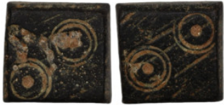
897 Islamic Weight. Bronze. (8mm, 1,44g)