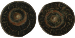
884 Islamic Weight. Bronze. (12mm, 4,17g)