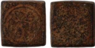
883 Islamic Weight. Bronze. (11mm, 5,11g)