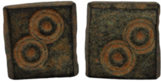
889 Islamic Weight. Bronze. (16mm, 14,46g)