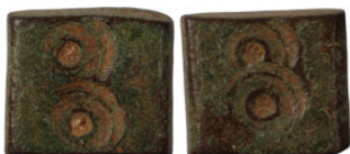
902 Islamic Weight. Bronze. (19mm, 30,16g)