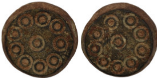
892 Islamic Weight. Bronze. (12mm, 14,73g)