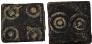
886 Islamic Weight. Bronze. (12mm, 13,77g)