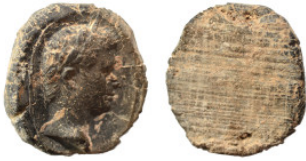
756 Greek-Roman. Circa 1st-3rd centuries AD. Terracotta token. 3.54 g, 24 mm