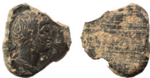
745 Greek-Roman. Circa 1st-3rd centuries AD. Terracotta token. 3.48 g, 21 mm