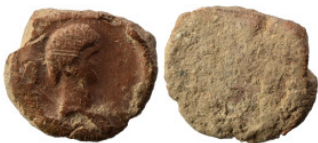
746 Greek-Roman. Circa 1st-3rd centuries AD. Terracotta token. 3.58 g, 25 mm