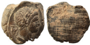
743 Greek-Roman. Circa 1st-3rd centuries AD. Terracotta token. 2.50 g, 21 mm