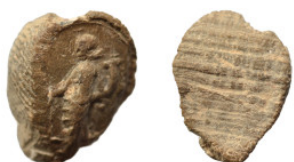
788 Greek-Roman. Circa 1st-3rd centuries AD. Terracotta token. 0.36 g, 12 mm