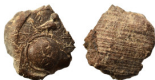
786 Greek-Roman. Circa 1st-3rd centuries AD. Terracotta token. 3.11 g, 22 mm