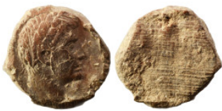
744 Greek-Roman. Circa 1st-3rd centuries AD. Terracotta token. 2.56 g, 21 mm