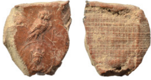
777 Greek-Roman. Circa 1st-3rd centuries AD. Terracotta token. 2.78 g, 22 mm