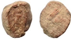
778 Greek-Roman. Circa 1st-3rd centuries AD. Terracotta token. 1.01 g, 15 mm