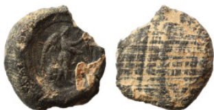
789 Greek-Roman. Circa 1st-3rd centuries AD. Terracotta token. 0.92 g, 15 mm