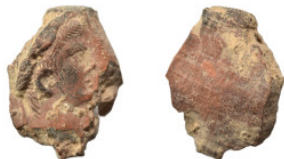
760 Greek-Roman. Circa 1st-3rd centuries AD. Terracotta token. 2.01 g, 21 mm