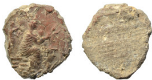
747 Greek-Roman. Circa 1st-3rd centuries AD. Terracotta token. 3.42 g, 24 mm