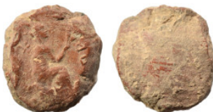
748 Greek-Roman. Circa 1st-3rd centuries AD. Terracotta token. 3.02 g, 19 mm