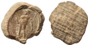
780 Greek-Roman. Circa 1st-3rd centuries AD. Terracotta token. 0.70 g, 14 mm