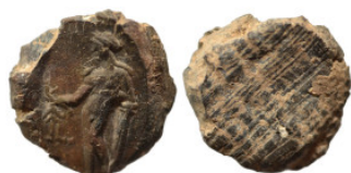
785 Greek-Roman. Circa 1st-3rd centuries AD. Terracotta token. 0.71 g, 13 mm