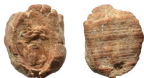
784 Greek-Roman. Circa 1st-3rd centuries AD. Terracotta token. 0.60 g, 13 mm