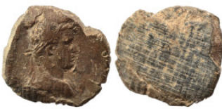
758 Greek-Roman. Circa 1st-3rd centuries AD. Terracotta token. 2.88 g, 22 mm