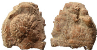
759 Greek-Roman. Circa 1st-3rd centuries AD. Terracotta token. 1.38 g, 22 mm