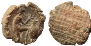
779 Greek-Roman. Circa 1st-3rd centuries AD. Terracotta token. 0.73 g, 14 mm