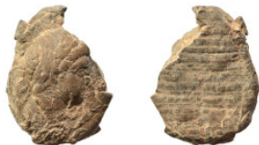
761 Greek-Roman. Circa 1st-3rd centuries AD. Terracotta token. 1.69 g, 25 mm