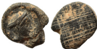
783 Greek-Roman. Circa 1st-3rd centuries AD. Terracotta token. 0.52 g, 12 mm