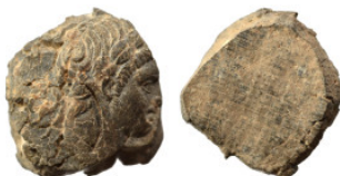
762 Greek-Roman. Circa 1st-3rd centuries AD. Terracotta token. 1.39 g, 17 mm