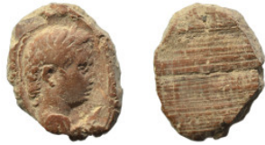
742 Greek-Roman. Circa 1st-3rd centuries AD. Terracotta token. 3.48 g, 24 mm