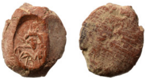
782 Greek-Roman. Circa 1st-3rd centuries AD. Terracotta token. 0.90 g, 13 mm