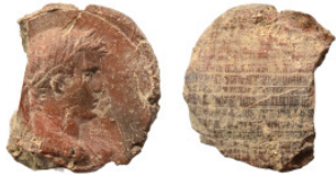
757 Greek-Roman. Circa 1st-3rd centuries AD. Terracotta token. 3.00 g, 22 mm