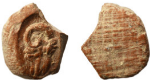
781 Greek-Roman. Circa 1st-3rd centuries AD. Terracotta token. 0.65 g, 12 mm