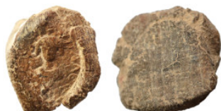
787 Greek-Roman. Circa 1st-3rd centuries AD. Terracotta token. 0.83 g, 13 mm