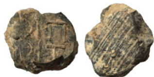
790 Greek-Roman. Circa 1st-3rd centuries AD. Terracotta token. 0.47 g, 10 mm