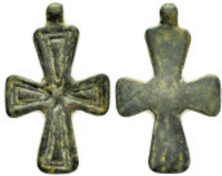
889 BYZANTINE EMPIRE. Bronze Cross. (8th-10th century). Ae. Condition : Good very fine. Weight : 7.08 gr Diameter : 41 mm