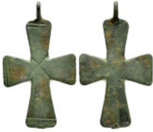
888 BYZANTINE EMPIRE. Bronze Cross. (8th-10th century). Ae. Condition : Good very fine. Weight : 10.87 gr Diameter : 54 mm