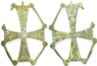
880 BYZANTINE EMPIRE. Bronze Cross. (8th-10th century). Ae. Condition : Good very fine. Weight : 79.90 gr Diameter : 129 mm