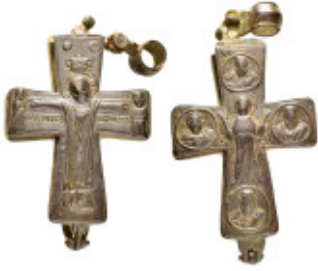
878 BYZANTINE EMPIRE. Bronze Cross. (8th-10th century). Ae. Condition : Good very fine. Weight : 82.56 gr Diameter : 110 mm