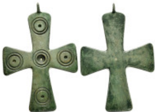
882 BYZANTINE EMPIRE. Bronze Cross. (8th-10th century). Ae. Condition : Good very fine. Weight : 48.20 gr Diameter : 84 mm