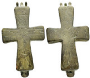
881 BYZANTINE EMPIRE. Bronze Cross. (8th-10th century). Ae. Condition : Good very fine. Weight : 54.57 gr Diameter : 83 mm