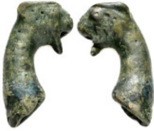
911 ANCIENT ROMAN BRONZE FIGURINE.(1st- 3rd century).Ae. Condition : Good very fine. Weight : 20.98 gr Diameter : 43 mm