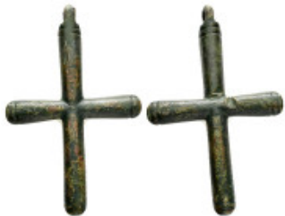
886 BYZANTINE EMPIRE. Bronze Cross. (8th-10th century). Ae. Condition : Good very fine. Weight : 37.75 gr Diameter : 71 mm