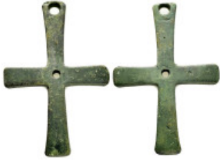
883 BYZANTINE EMPIRE. Bronze Cross. (8th-10th century). Ae. Condition : Good very fine. Weight : 91.01 gr Diameter : 88 mm