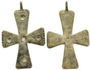
885 BYZANTINE EMPIRE. Bronze Cross. (8th-10th century). Ae. Condition : Good very fine. Weight : 25.41 gr Diameter : 76 mm