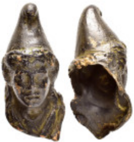
913 ANCIENT GREEK BRONZE FIGURINE.(1st- 3rd BC).Ae. Condition : Good very fine. Weight : 31.02 gr Diameter : 65 mm