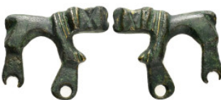
916 ANCIENT ROMAN BRONZE LION FIGURINE.(1st - 2nd Century).Ae. Condition : Good very fine. Weight : 6.63 gr Diameter : 26 mm