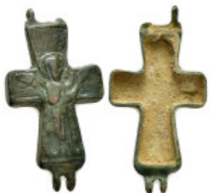
887 BYZANTINE EMPIRE. Bronze Cross. (8th-10th century). Ae. Condition : Good very fine. Weight : 13.25 gr Diameter : 52 mm