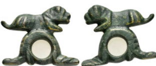
917 ANCIENT ROMAN BRONZE LION FIGURINE.(1st - 2nd Century).Ae. Condition : Good very fine. Weight : 14.09 gr Diameter : 31 mm