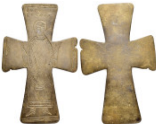
890 BYZANTINE EMPIRE. Bronze Cross. (8th-10th century). Ae. Condition : Good very fine. Weight : 46.28 gr Diameter : 105 mm