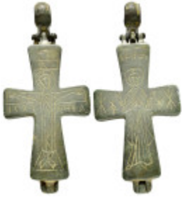
879 BYZANTINE EMPIRE. Bronze Cross. (8th-10th century). Ae. Condition : Good very fine. Weight : 57.50 gr Diameter : 104 mm