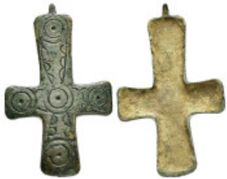
884 BYZANTINE EMPIRE. Bronze Cross. (8th-10th century). Ae. Condition : Good very fine. Weight : 19.48 gr Diameter : 71 mm