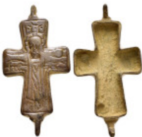
892 BYZANTINE EMPIRE. Bronze Cross. (8th-10th century). Ae. Condition : Good very fine. Weight : 7.90 gr Diameter : 51 mm