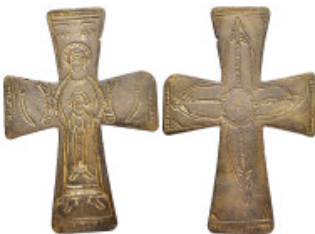
891 BYZANTINE EMPIRE. Bronze Cross. (8th-10th century). Ae. Condition : Good very fine. Weight : 44.51 gr Diameter : 101 mm