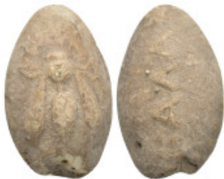
841 PB Greek sling bullet. Thrace. (c. 4th-1st centuries BC) Sling bullet is with an image of a bee on one side and with an inscription ΚΑΛΑ (Κάλα, Kala) on the other, which may be a name. (28mm, 27.33 g) 8