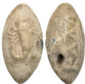
842 PB Greek sling bullet. Thrace. (c. 4th-1st centuries BC) Sling bullet is with an image of a scorpion on one side and with an inscription ΚΑΛΑ (Κάλα, Kala) on the other, which may be a name. (31mm, 25.86 g) 8