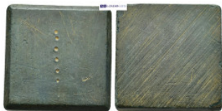
858 Bronze eight nomismata coin weight. (24mm, 35.15 g)