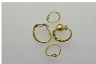
830 Gold earrings lot 4 pieces. 3.34 gr.