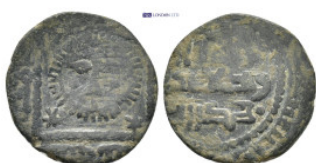
775 Uncertain Islamic AE Coins 3.27 Gr. 20mm.