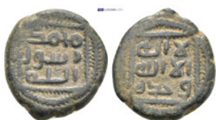
776 Uncertain Islamic AE Coins 5.44 Gr. 17mm.