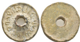
856 Uncertain button (32.18 gr. 32mm)