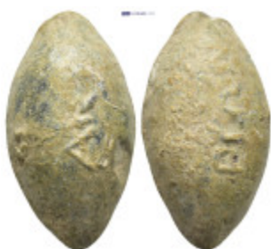
844 Lead sling bullet with legends (30mm, 30.30 g) 8