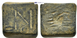
859 Bronze three nomismata coin weight. (15mm, 13.38 g)