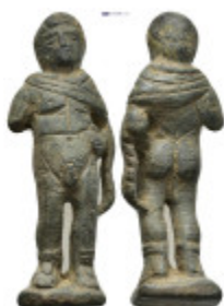
832 A bronze figurine of a standing nude male. (45mm, 20.1 g)