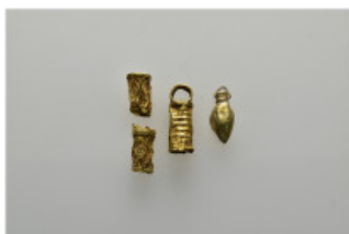
831 Gold earring pendant lot 4 pieces. 1.71 gr.