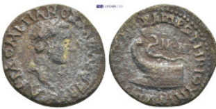
373 BITHYNIA. Nicomedia. Domitian (81-96).Ae. (21mm, 4.96 g) ΑΥΤ ΔΟΜΙΤΙΑΝΟΣ ΚΑΙΣΑΡ ΣΕΒ Γ(ΕΡ); laureate head of Domitian, r. / Η ΜΗΤΡΟΠΟΛΙΣ ΚΑΙ ΠΡΟΤΗ Β(Ε)ΙΘΥΝ(Ι)ΑΣ), ΝΙΚΟ ΜΗ (above); serpent on prow, l.