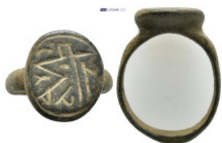
854 Bronze ring with shapes.(14mm, 6.17 g)