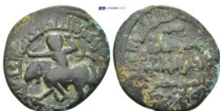
774 Uncertain Islamic AE Coins 9.64 Gr. 29mm.