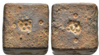
857 Bronze cubical weight. (20mm, 59.55 g)