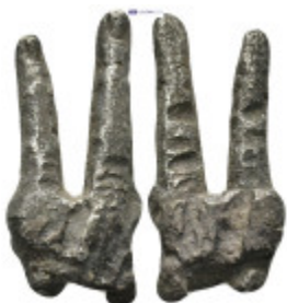
863 A silver parts of two fingers? (26mm, 14.8 g)