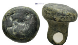
860 Bronze stamp seal with lion. (15mm, 6.87 g)