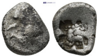
371 Uncertain Greek Silver Coins Ar. 2.57 Gr. 13mm.