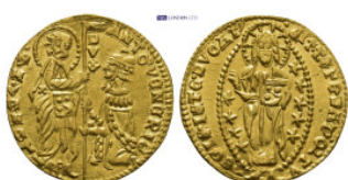
778 ITALY. Venice. Antonio Venier. 1382-1400. AV ducat. (3.53g. 20 mm). Saint Mark standing right, presenting banner to Doge kneeling left; ANTO VENERIO / Christ standing facing within mandorla, holding gospels, surrounded by nine stars.