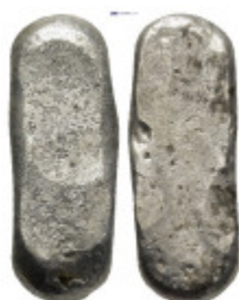
861 Silver Particle (6.53 Gr. 22mm.)