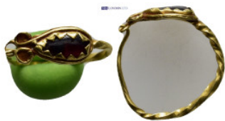
829 Gold Earring mounted with small garnet. (6mm, 1.03 g)