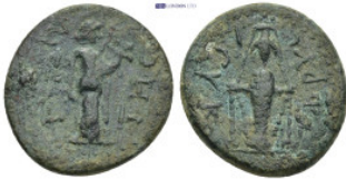
370 Uncertain Greek Coins AE 3.7 Gr. 18mm.