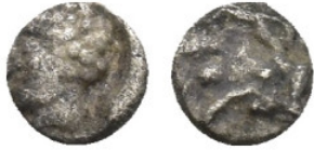
369 Uncertain Greek Silver Coins (0.18 Gr. 4mm.)