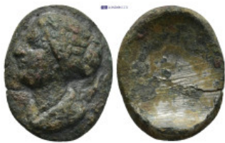
840 Bronze ring fragment? Head of woman Left. (23mm, 8.14 g) 8