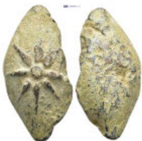
843 Lead sling bullet with eight rays star (33mm, 26.66 g) 8