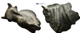
833 Bronze bull head. (110mm, 727 gr.)