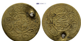
777 Ottoman empire. Penez (18mm, 1.25 g)