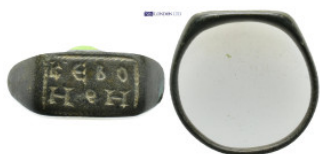
855 Bronze ring with legend, KEBOH?H (19mm, 3.98 g)