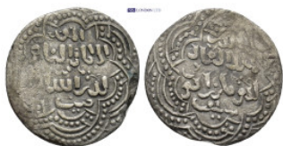
773 Uncertain Islamic Silver Coins (1.92Gr. 23mm.)