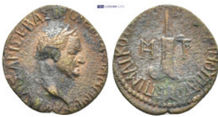
372 Bithynia, Uncertain Mint. Vespasian. A.D. 69-79. AE (18mm, 2.6 g). Marcus Plancius Varus, proconsul. ΑΥΤΟΚΡΑΤΩΡ ΚΑΙΣΑΡ ΣΕΒΑΣΤΟΣ ΟΥΕΣΠΑΣΙΑΝΟΣ, laureate head of Vespasian right / ΕΠΙ ΜΑΡΚΟΥ ΠΛΑΝΚΙΟΥ ΟΥΑΡΟΥ ΑΝΘΥΠΑΤΟΥ prow.