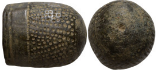
889 Antiquities Ancient thimble (22.52g 27.5mm diameter)