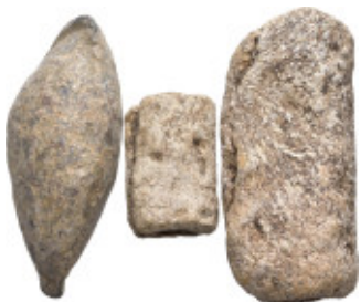
918 Antiquities three Antiquities