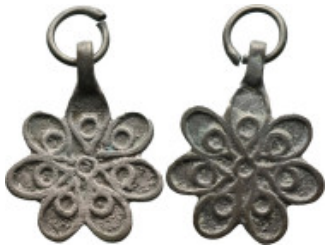
853 Antiquities Ancient amulet (4.57g 35.3mm diameter)