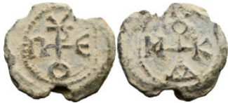
753 Byzantine Lead Seal (25mm 11.35g diameter)