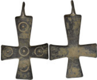
895 Antiquities Ancient Byzantine Pendant Cross (2.87g 38mm diameter)