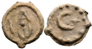
728 Seal ASIA MINOR. Uncertain. Circa 2nd-4th centuries. Gnostic Tessera Lead (2.4g 16.5mm) Obv: IA□ Rev: Star-in-crescent.