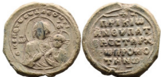
761 Byzantine Lead Seal (13.92g 28mm diameter) Roman Ring seal