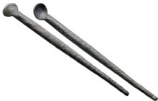
865 Antiquities (5.17g 70mm diameter) Medical instrument