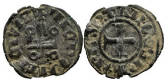
701 World CRUSADERS. Neapolitan Princes of Epirus and Corfu. Philippe de Taranto (1294-1313 AD). Lepanto (modern Nafpaktos). BI Denier Tournois (8mm 0.59g) Obv: +(fleur-de-lis)PhS• P• TAR• DESP• around cross pattée. Rev: +(nail)NEPANTI CIVIS• Châtel tournois. CCS 111b; Metcalf, Crusades 1082-90; Tzamalís Φ 97