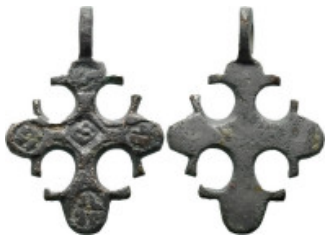
860 Antiquities Byzantine bronze cross (5g 31.1mm diameter)