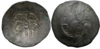
697 Byzantine AE Trachy (30.3mm 5.11g)