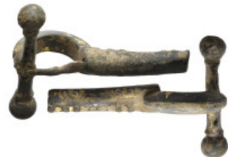
930 Antiquities Ancient fibula (39.9g 63mm diameter)