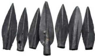
863 Antiquities Six arrow heads