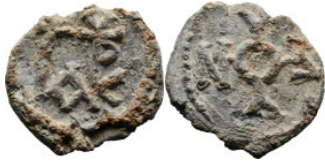
743 Byzantine Lead Seal (9.58g 23mm diameter)