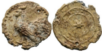
778 Tessera (3.66g 23.2mm diameter)