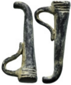
852 Antiquities (8.43g 35.4mm diameter)