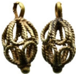
855 Antiquities Ancient gold earring (1.12g 16.4mm diameter)