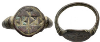
940 Antiquities Ancient bronze ring (4g 20mm diameter)