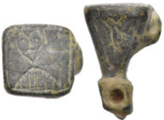
898 Antiquities (9.28g 29mm diameter )