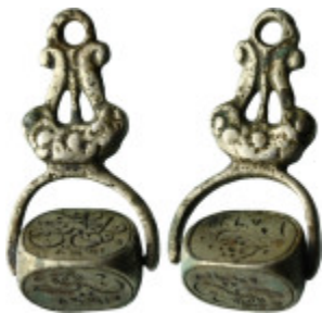
737 Islamic Seal (8.6g 46mm diameter)