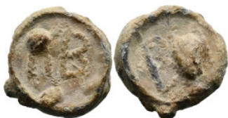
731 Lead Seal PB Tessera (3.62g 13mm diameter)