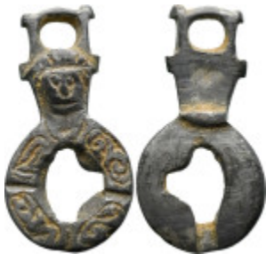
859 Antiquities Ancient belt buckle (?) (8.75g 40mm diameter)