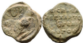
755 Byzantine Lead Seal (4.24g 17mm diameter)