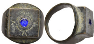
905 Antiquities (14.45g 22.8mm diameter) Ancient ring with gem stone