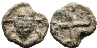
777 Tessaera (4.1g 14.8mm diameter)