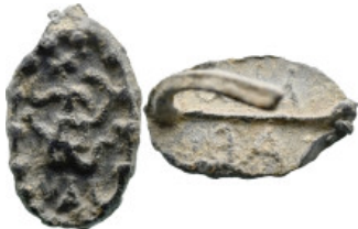
729 Seal (3.97g 22.5mm diameter) PB Asia Minor. Lead gnostic ring bezel ( AD 2nd-4th centuries)