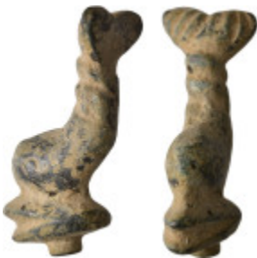
892 Antiquities (38.2g 48mm diameter)