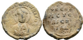
768 Byzantine Lead Seal (5.45g 20.8mm diameter)