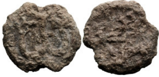
750 Byzantine Lead Seal (8.3g 21mm diameter)