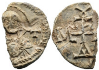
746 Byzantine Lead Seal (5.88g 23mm diameter)