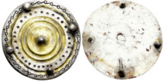
941 Antiquities (8.33g 21.8mm diameter)