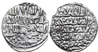
724 Islamic AR Silver (23.4mm 2.72g)