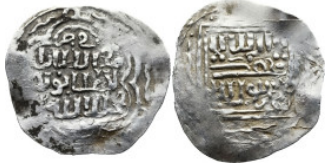
718 Islamic AR Silver (21mm 0.9g)