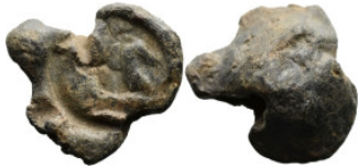
726 Roman Seal (10.62g 19mm diameter)