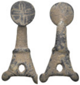
901 Antiquities Ancient belt buckle (2.44g 27.4mm diameter)