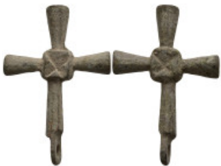
893 Antiquities Ancient Byzantine cross (5.83g 35.2mm diameter)