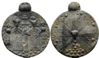
854 Antiquities Pilgrim's pendant amulet. Byzantine Obv: Two male standing facing, holding globus cruciger each other, patriarchal cross between Rev: Male face in the middle of the seven rays, cross below, decorated around (19.92g 45.7mm diameter)