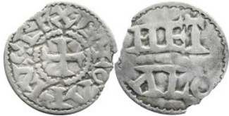
698 World FRANCE. FEUDAL. Melle, Charles the Simple (898-923 AD) Denier (21.3mm 0.73g) Obv: +CARLVS REX R - Central cross Rev: MET ALO in two lines. Poey D'Avant 2457