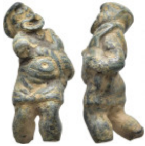
928 Antiquities Ancient bronze figurine (28.1g 39.4mm diameter)