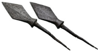
864 Antiquities Spear Head (8.49g 79.2mm diameter)