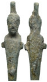
848 Antiquities Ancient Roman bronze statuette.(1st-2nd century). (18.7g 62.3mm diameter)