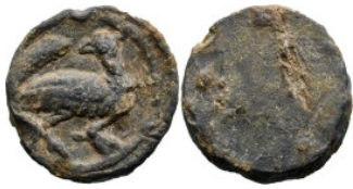
774 Tessaera Greek Western Asia Minor PB tessaera Circa 4th-3rd centuries Obv: Eagle (?) standing right, head reverted. Rev: Blank (1.4g 12mm diameter)