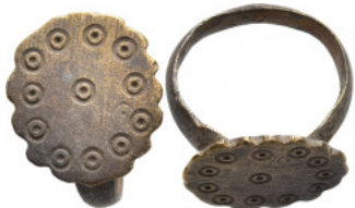
936 Antiquities Ancient bronze ring (6.69g 23mm diameter)