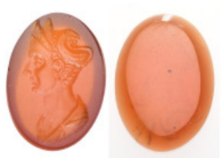
910 Antiquities Ancient Roman ring gem stone. (1st-2nd centuries). (1g 16.4mm diameter)