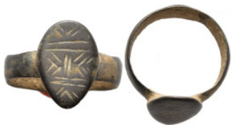
939 Antiquities Ancient bronze ring (3.96g 23mm diameter)