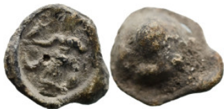
735 Roman Seal (3.91g 15.8mm diameter)