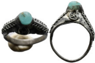
858 Antiquities Ancient ring with gem stone (2.84g 26.4mm diameter)