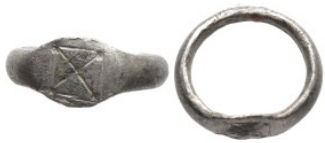
934 Antiquities Ancient ring (3.25g 18.4mm diameter)