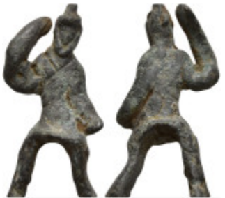
891 Antiquities Ancient figurine (26.2g 52mm diameter)