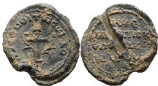
749 Byzantine Lead Seal (8.82g 25mm diameter)