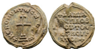
769 Byzantine Lead Seal (7.2g 23.6mm diameter)