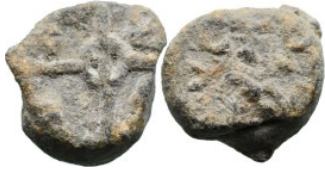
772 Byzantine Lead Seal (6.88g 16.3mm diameter)