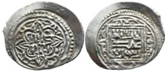
719 Islamic AR Silver (19mm 0.9g)