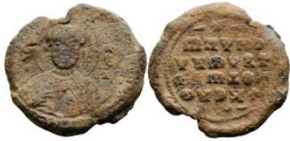
744 Byzantine Lead Seal (9.41g 24.5mm diameter)