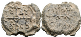
747 Byzantine Lead Seal (14.1g 25.6mm diameter)