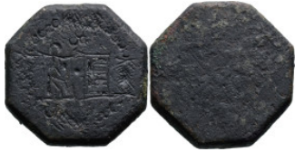
779 Weight (22.19g 25mm diameter)