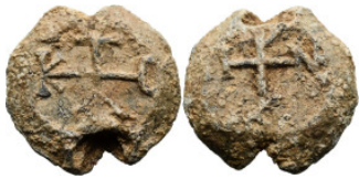
745 Byzantine Lead Seal (10.5g 20.4mm diameter)