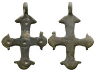
849 Antiquities Byzantine bronze cross (4.93g 40.5mm diameter)