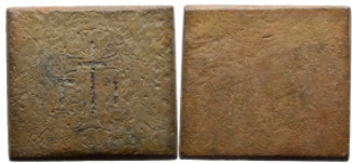
780 Byzantine Commercial Weight (4th-6th centuries) Obv: Long cross between Γ- B; all within decorated circular border. Rev: Blank. (52.92g 34mm diameter )