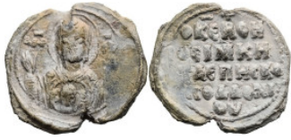
759 Byzantine Lead Seal (7.06g 24mm diameter)