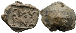
733 Roman Seal (4.79g 18.3mm diameter)