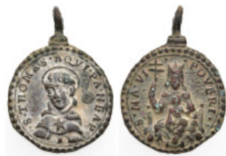
903 Antiquities Pendant S.THOMAS. AQVI.PA. NEAP Saint Thomas slightly left POVERI S MA VI. Male seated with child on his lap, holding patriarchal cross (2.19g 16.2mm diameter)