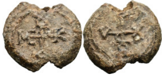
765 Byzantine Lead Seal (14.34g 25mm diameter)