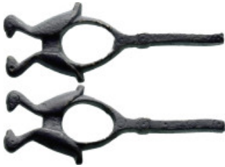
862 Antiquities Confronted animals (17.38g 64.5mm diameter)