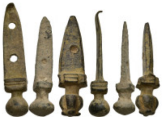
897 Antiquities 3 sword pendant (military amulet)