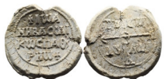
763 Byzantine Lead Seal (14.61g 29mm diameter)