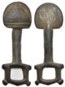
902 Antiquities Ancient belt buckle (7.8g 41.8mm diameter)