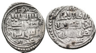
723 Islamic AR Silver (15mm 1.15g)