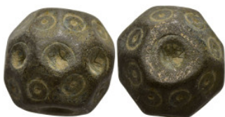
886 Antiquities (28.8g 18mm diameter)