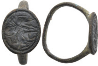
907 Antiquities (4.7g 24mm diameter) Ancient bronze ring