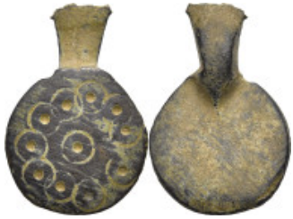
914 Antiquities (3.41g 25.3mm diameter)