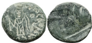
776 Byzantine Tessaera Obv: Angel standing left, holding cross Rev: Blank (2.02g 16mm diameter)