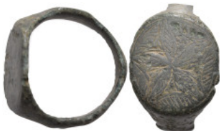
885 Antiquities Ancient ring with leaf (?) (6.17g 22mm diameter)