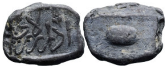
752 Islamic Seal (5.5g 18mm diameter)