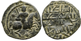
725 Islamic AE Fals (21mm 2.75g)