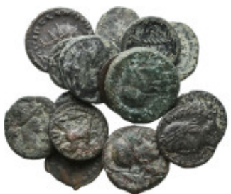
784 16 pieces mixed coins / SOLD AS SEEN, NO RETURN!