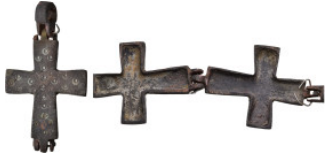
913 Antiquities AE Byzantine pendant cross reliquary (17.86g 53mm diameter)