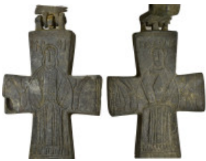
896 Antiquities AE Byzantine pendant cross reliquary (82.5g 111mm diameter)