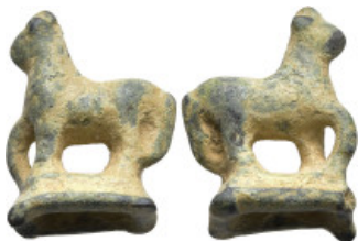
932 Antiquities (8.38g 22.5mm diameter)