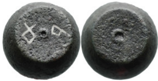
781 Weight (27.4g)