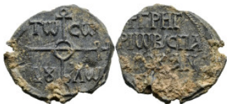
767 Byzantine Lead Seal (10.15g 27.4mm diameter)