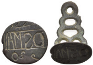
915 Byzantine bronze seal (3.67g 22mm diameter)