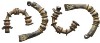
933 Antiquities two Antiquities