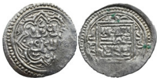
721 Islamic AR Silver (28mm 1g)