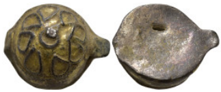
890 Antiquities (3.59g 13.2mm diameter)