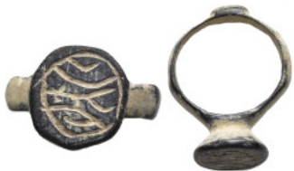
937 Antiquities Ancient bronze ring (5.93g 25.8mm diameter)