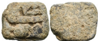
783 Weights (10.03g 16x20mm diameter)