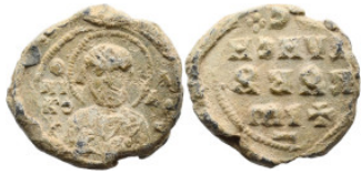
760 Byzantine Lead Seal (4.84g 18.2mm diameter)