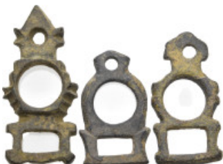
899 Antiquities Ancient three belt buckles