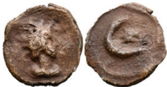
775 Tessaera Obv: Radiate head of Helios right Rev: Star and crescent (0.59g 9mm diameter)