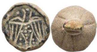
904 Antiquities (5.27g 13mm diameter)