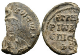
770 Byzantine Lead Seal (4.62g 23mm diameter)