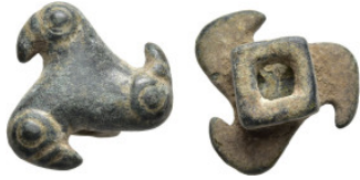
927 Antiquities (21.43g 25.2mm diameter)