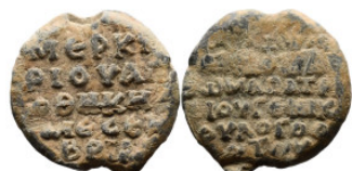
762 Byzantine Lead Seal (19.88g 31mm diameter)