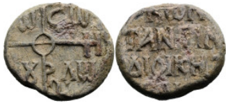
751 Byzantine Lead Seal (11.89mm 21g diameter)