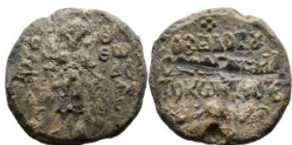
756 Byzantine Lead Seal (24.1g 30mm diameter)