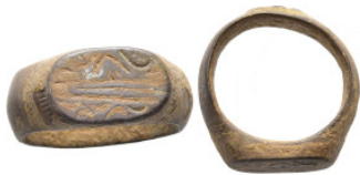
935 Antiquities Ancient bronze ring (9.6g 25mm diameter)