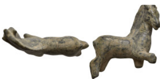
887 Antiquities Ancient bronze horse figurine (41.48g 43mm diameter)