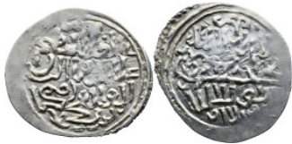
720 Islamic AR Silver (22mm 1.16g)