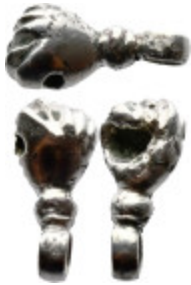
857 Antiquities Ancient hand probably holding (?) Silver (3.75g 20.3mm diameter)