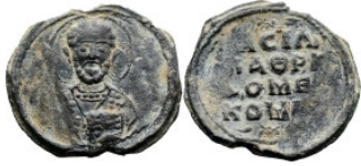
764 Byzantine Lead Seal (21mm 5.86g diameter)