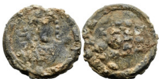
748 Byzantine Lead Seal (4.1g 18.4mm diameter)