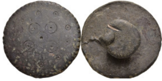
906 Antiquities (76.4g 48.7mm diameter)