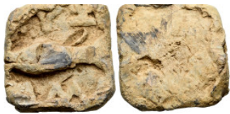
782 Weights (253.15g 56x53mm diameter) Kyzikos