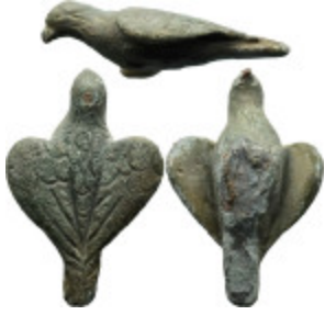
851 Antiquities Ancient Roman bronze figurine (27.48g 44.3mm diameter)