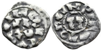
699 World ITALY. Lucca. Heinrich III-V (1039-1125AD). AR Denier (16mm 0.98g) Obv: + IHPERATOR. Large H. Rev: + ENRICVS / LVCA. Biaggi 1056; Metcalf Crusades 10-15.