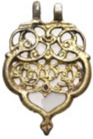
881 Antiquities (8.05g 40mm diameter)