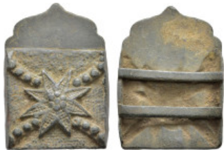
929 Antiquities Ancient belt buckle (18.17g 48mm diameter)