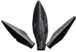
861 Antiquities Three arrow heads