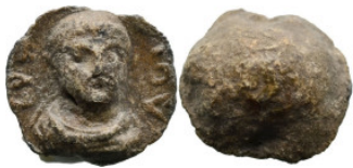
734 Roman Seal (3.27g 13mm diameter)