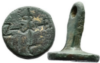
754 Byzantine stamp seal (2.08g 13mm diameter)