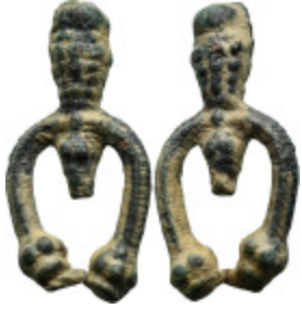
846 Antiquities (2.24g 24mm diameter)