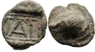
732 Roman Seal (2.87g 14mm diameter)