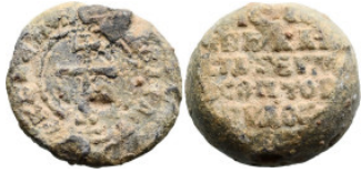
757 Byzantine Lead Seal (11.36g 17.2mm diameter)