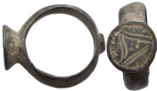
883 Antiquities Ancient ring (9g 28.6mm diameter)