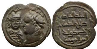
700 World ISLAMIC. Anatolia & al-Jazira (Post-Seljuk). Artuqids (Mardin). Husam al-Din Yuluq Arslan (580-597 AH/ 1184-1200 AD). AE Dirham (33.5mm 13.92g) Obv: Small draped facing bust, wearing Sasanian-style crown; to right, large diademed, Roman-style male head left; legend above. Rev: Legend. Whelan Type II; S&S Type 34.