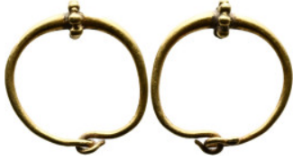
856 Antiquities Ancient gold earring (1.96g 19.5mm diameter)