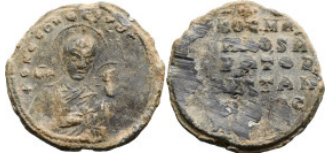
758 Byzantine Lead Seal (11.2g 25.5mm diameter)