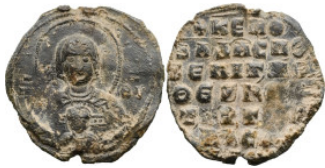
766 Byzantine Lead Seal (8.75g 27.2mm diameter)