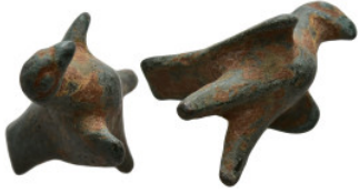
894 Antiquities Ancient bronze eagle figurine (13.52g 30.8mm diameter)