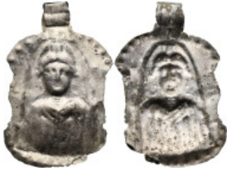
847 Antiquities Silver Pendant (1.98g 49.6mm diameter)