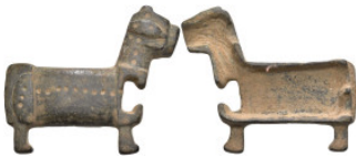
884 Antiquities (27.12g 50mm diameter)