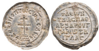
773 Byzantine Lead Seal (8.5g 31.8mm diameter)