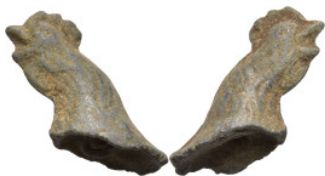
911 Antiquities Ancient bronze cock's head figurine (5.7g 28mm diameter)