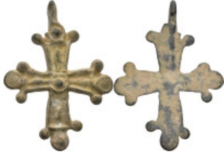
900 Antiquities Ancient Byzantine Pendant Cross (5.28g 42.8mm diameter)