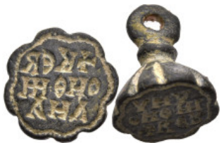
917 Antiquities (10g 20.07mm diameter)