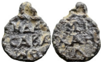
727 Seal ASIA MINOR. Uncertain. Circa 2nd-4th centuries. Gnostic Tessera Lead (3.15g 17.5mm)