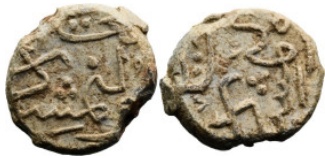
736 Islamic Seal (3.66g 13.5mm diameter)