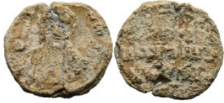
771 Byzantine Lead Seal (6.58g 23.1mm diameter)