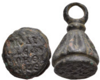
916 Byzantine bronze seal (22.64g 30.5mm diameter)