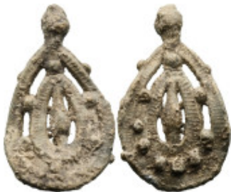
850 Antiquities lead amulet (8.34g 36mm diameter)