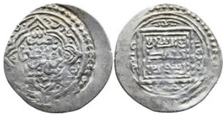
722 Islamic AR Silver (18mm 0.98g)