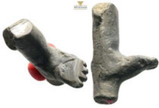
878 ANCIENT ROMAN BRONZE APPLIQUE.(1st- 3rd Century).Ae. Condition : Good very fine. 15,5g 31mm