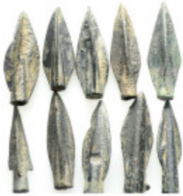
880 ANCIENT ROMAN BRONZE ARROW HEADS.(Circa 2th Century).Ae. Condition : Gold very fine.