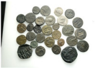
943 As you can see