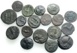
930 As you can see