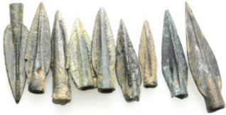
879 ANCIENT ROMAN BRONZE ARROW HEADS.(Circa 2th Century).Ae. Condition : Good very fine.