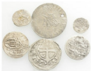
945 As you can see