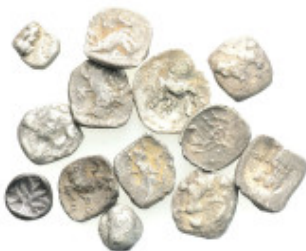
932 As you can see