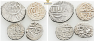
941 As you can see