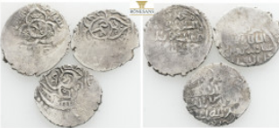
942 As you can see