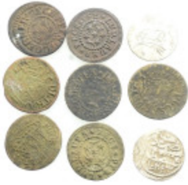
928 As you can see