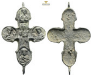
881 BYZANTINE EMPIRE.Bronze Cross.(8th-10th century).Ae. Condition : Gold very fine. 30,4g 74mm