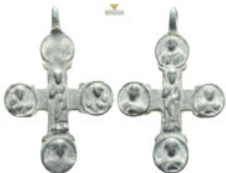
882 BYZANTINE EMPIRE.Bronze Cross.(8th-10th century).Ae. Condition : Gold very fine. 16,4g 61mm