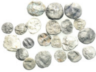
940 As you can see