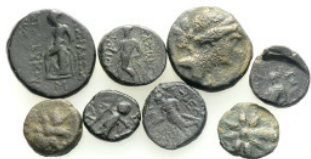
944 As you can see