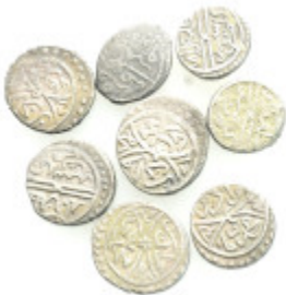
931 As you can see