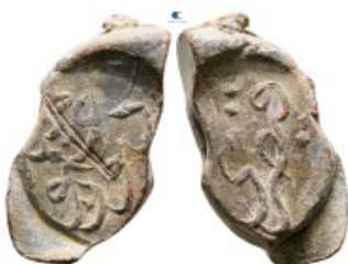
953 Islamic. Seal Pb 26 mm, 8,74 g Very Fine