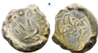
952 Islamic. Seal Pb 19 mm, 10,13 g Very Fine