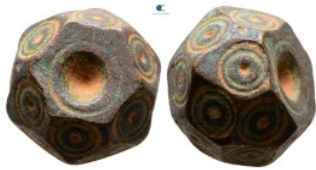
948 Islamic. Weight Æ 14 mm, 14,52 g Good Fine