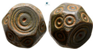
949 Islamic. Weight Æ 14 mm, 14,78 g Very Fine