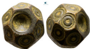
950 Islamic. Weight Æ 16 mm, 14,69 g Very Fine