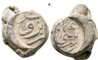
951 Islamic. Seal Pb 23 mm, 16,20 g Very Fine