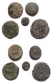
656 Lot of 5 Greek