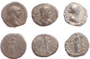
652 Lot of 3 Roman Denarii