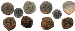
626 Lot of 5 Byzantine