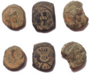
618 Lot of 3 Greek