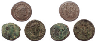
615 Lot of three 3rd century Roman