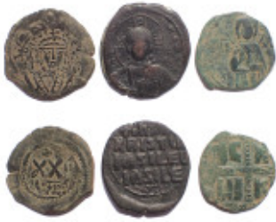
665 Lot of 3 Byzantine