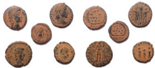
617 Lot of 5 Roman