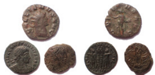
602 Lot of 3 Roman