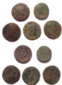
605 Lot of 5 Greek