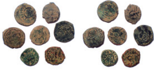
632 Lot of 7 Islamic