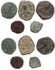
655 Lot of 5 Byzantine