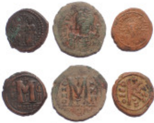
661 Lot of 3 Byzantine