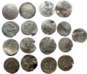
641 Lot of 17 Islamic