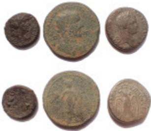
614 Lot of 4 Provincial