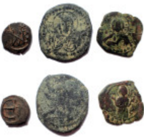
650 Lot of 3 Byzantine