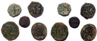
629 Lot of 5 Byzantine