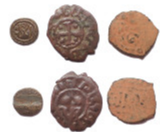
611 Lot of 3 medieval