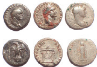
670 Lot of 3 Roman denarii, fouree of Domitian