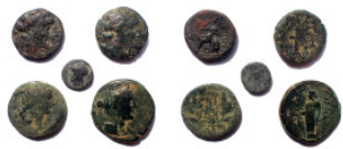
635 Lot of 5 Greek