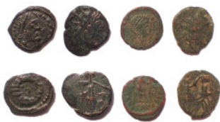
622 Lot of 4 Roman