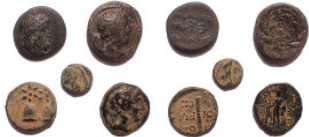
648 Lot of 5 Greek