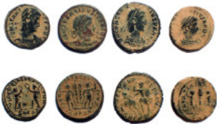
642 Lot of 4 Roman