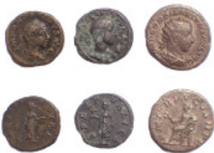
669 Lot of 3 Roman silver coins, Elagabalus, Severus Alexander and Gordian III