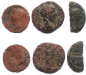
654 Lot of 2-1/2 Roman