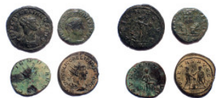
645 Lot of 4 Roman