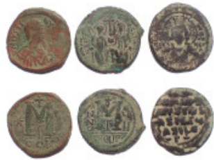
662 Lot of 3 Byzantine