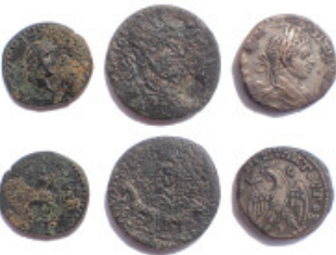
668 Lot of 3 Roman Provincial