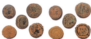
604 Lot of 4 late Roman