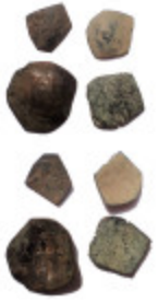
612 Lot of 4 scyphates