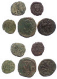
660 Lot of 5 Byzantine