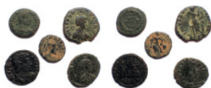
646 Lot of 5 Roman