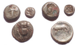
657 Lot of 4 Greek silver