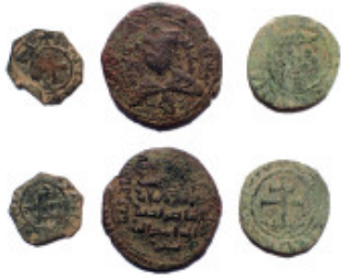
647 Lot of 3 medieval