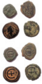
608 Lot of 4 Pentanummi