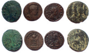
633 Lot of 4 Roman