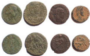
643 Lot of 4 Roman