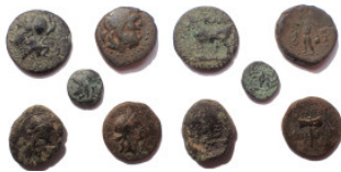
621 Lot of 5 Greek