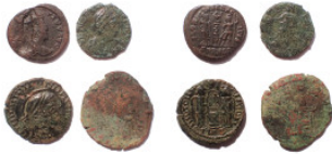
613 Lot of 4 late Roman