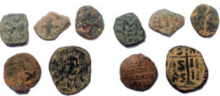
651 Lot of 5 Byzantine