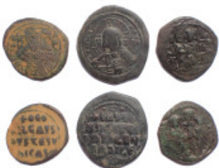
664 Lot of 3 Byzantine