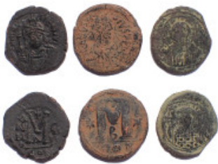
663 Lot of 3 Byzantine