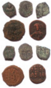
607 Lot of 5 Byzantine