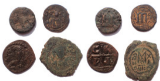
603 Lot of 4 Byzantine