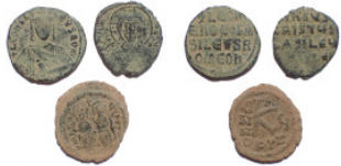
666 Lot of 3 Byzantine