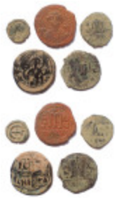
609 Lot of 5 Byzantine