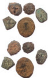
606 Lot of 5 Byzantine