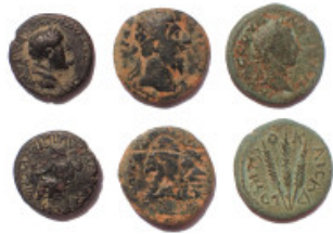
625 Lot of 3 Roman Provincial