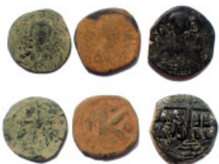
631 Lot of 3 Byzantine