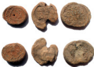
636 Lot of 3 Pb seals