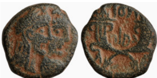
739 Nabatea. Bronze Æ. 17mm 3,17g