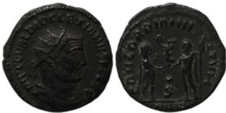
682 Roman Imperial. Bronze Æ. 20mm2.73g