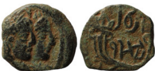
738 Nabatea. Bronze Æ. 14mm 2,53g