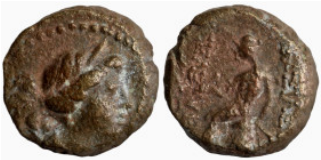
477 Greek. Bronze Aë. 15mm 4.75g