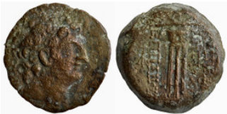
490 Greek. Bronze Æ. 19mm 5.89g