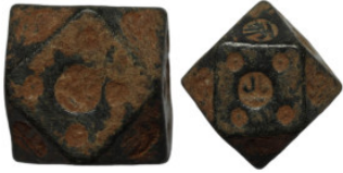
565 Islamic weight. Bronze. 19mm 14.83g