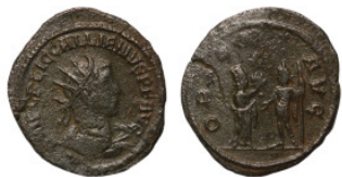
625 Roman Imperial. Billon. 23mm 3,20g