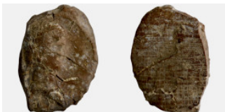
702 ancient seal impression. sealing wax. 27mm 3,04g