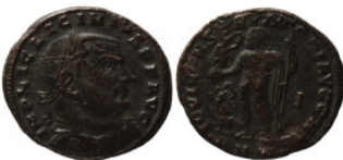
1067 Roman Imperial. Bronze Æ. 20mm 3,21g