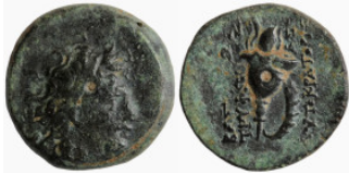
482 Greek. Bronze Æ. 18mm 5.39g