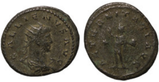
623 Roman Imperial. Billon. 20mm 3,07g