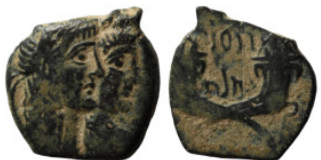
746 Nabatea. Bronze Æ. 16mm 3,37g