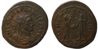
734 Roman Imperial. Billon. 23mm 3,82g