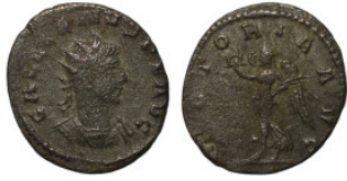
621 Roman Imperial. Billon. 21mm 2,78g