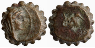
474 Greek. Bronze Aë. 15mm 3.70g