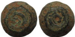
548 Islamic weight. Bronze. 20mm 29.00g