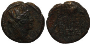
526 Greek. Bronze Æ.