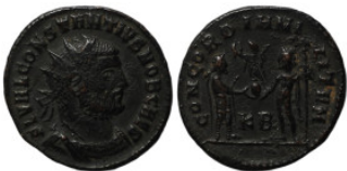
683 Roman Imperial. Bronze Æ. 20mm2.53g