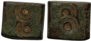
581 Islamic weight. Bronze. 13mm 5.70g