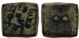
591 Islamic weight. Bronze. 11mm 1.34g