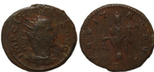
627 Roman Imperial. Billon. 18mm 3,05g