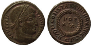
1028 Roman Imperial. Bronze Æ. 18mm 2,85g