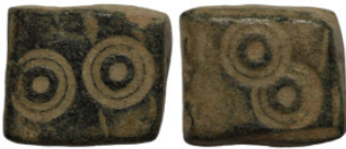
575 Islamic weight. Bronze. 13mm 5.77g