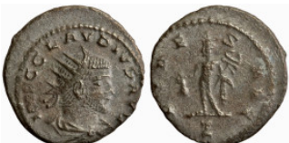
725 Roman Imperial. Billon. 20mm 2,62g