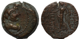
527 Greek. Bronze Æ.