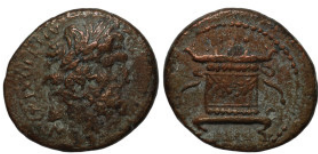
529 Greek. Bronze Æ.