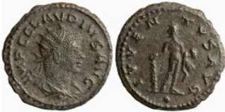
720 Roman Imperial. Billon. 20mm 3,69g