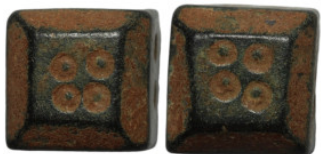
564 Islamic weight. Bronze. 12mm 14.91g