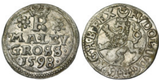
265 Bohemia. Rudolf II. (1598). Maley Groschen.