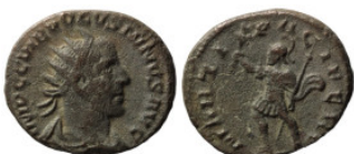
724 Roman Imperial. Billon. 18mm 3,68g