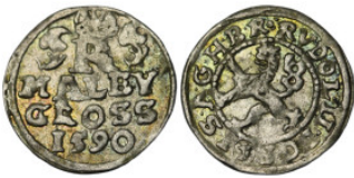
263 Bohemia. Rudolf II. (1590). Maley Groschen.