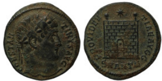
672 Roman Imperial. Bronze Æ. 20mm3.10g