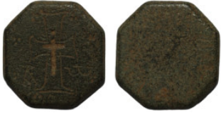
572 Islamic weight. Bronze. 18mm 4.31g