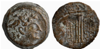
487 Greek. Bronze Æ. 19mm 5.53g