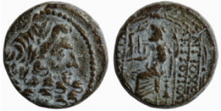
489 Greek. Bronze Æ. 19mm 8.12g