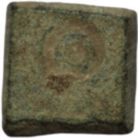
580 Islamic weight. Bronze. 10mm 2.81g