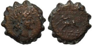
523 Greek. Bronze Æ.