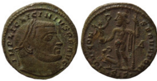
1064 Roman Imperial. Bronze Æ. 20mm 3,68g