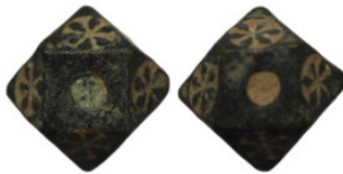
567 Islamic weight. Bronze. 14mm 5.94g