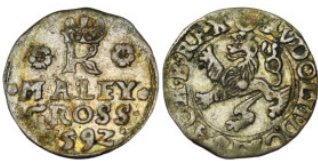
264 Bohemia. Rudolf II. (1592). Maley Groschen.