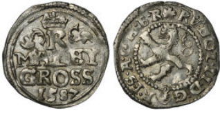
260 Bohemia. Rudolf II. (1587). Maley Groschen.