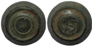
546 Islamic weight. Bronze. 20mm 29.90g