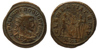
1029 Roman Imperial. Bronze Æ. 22mm 3,18g