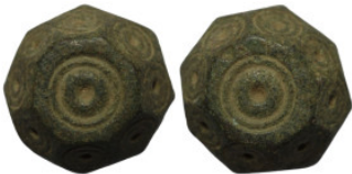
547 Islamic weight. Bronze. 20mm 29.07g