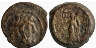
480 Greek. Bronze Aë. 18mm 5.55g