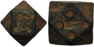
552 Islamic weight. Bronze. 19mm 14.62g