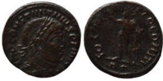
1118 Roman Imperial. Bronze Æ. 18mm 3,33g