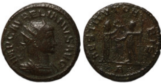
626 Roman Imperial. Billon. 21mm 3,90g