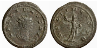
722 Roman Imperial. Billon. 22mm 4,06g