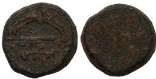
588 Islamic weight. Bronze. 10mm 1.43g