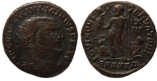
1027 Roman Imperial. Bronze Æ. 18mm 3,14g