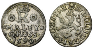
271 Bohemia. Rudolf II. (1590). Maley Groschen.