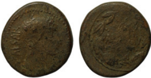
659 Roman Imperial. Bronze Æ. 26mm11.66g