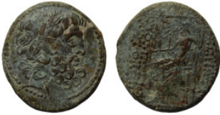
657 Greek. Bronze Æ. 27mm15.89g