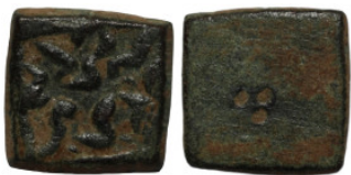
590 Islamic weight. Bronze. 8mm 1.41g