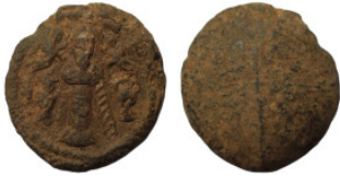
698 ancient seal impression. sealing wax. 23mm 3,67g