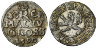
274 Bohemia. Rudolf II. (1590). Maley Groschen.