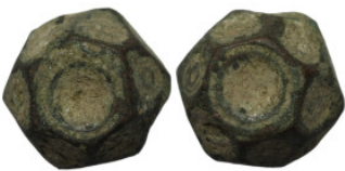
557 Islamic weight. Bronze. 17mm 14.74g