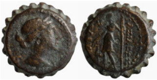
476 Greek. Bronze Aë. 17mm 5.03g