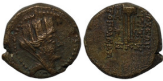
525 Greek. Bronze Æ.