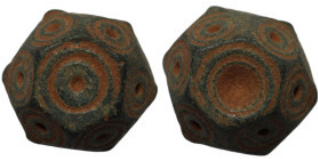
556 Islamic weight. Bronze. 17mm 14.63g