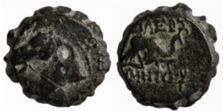
504 Greek. Bronze Æ. 15mm 3.91g