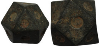
544 Islamic weight. Bronze. 17mm 30.05g