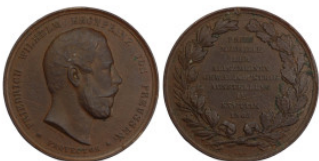
286 Wilhelm I. of Prussia. (1865) Bronze Medal for Trade and Industrial Exhibition in Stettin.