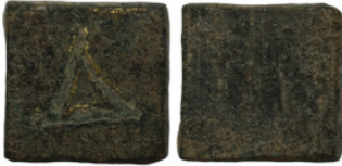
573 Islamic weight. Bronze. 13mm 4.61g