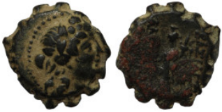
524 Greek. Bronze Æ.