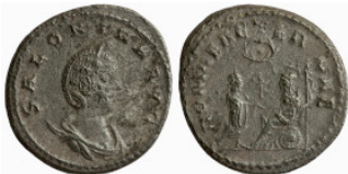
721 Roman Imperial. Billon. 21mm 3,85g