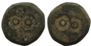
584 Islamic weight. Bronze. 12mm 4.16g