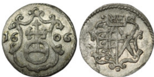
278 Uncertain. (1606) Dreier.