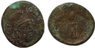
538 Greek. Bronze Æ.