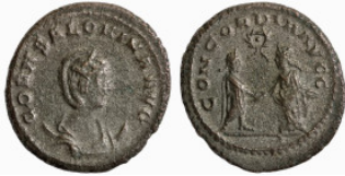
622 Roman Imperial. Billon. 21mm 4,22g