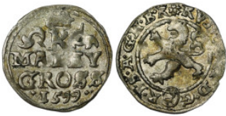
262 Bohemia. Rudolf II. (1599). Maley Groschen.