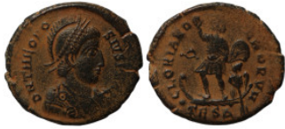
670 Roman Imperial. Bronze Æ. 23mm5.21g