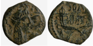
741 Nabatea. Bronze Æ. 18mm 2,96g