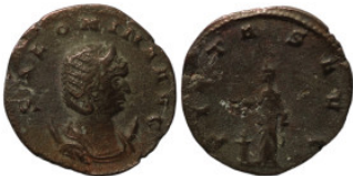
735 Roman Imperial. Billon. 20mm 2,31g