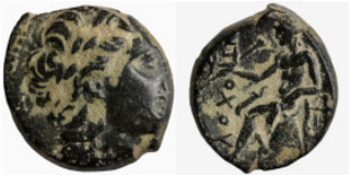
680 Greek. Bronze Æ. 18mm5.18g