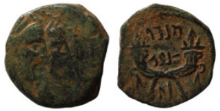
742 Nabatea. Bronze Æ. 14mm 1,85g