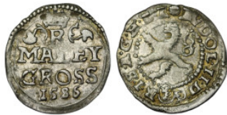
261 Bohemia. Rudolf II. (1586). Maley Groschen.