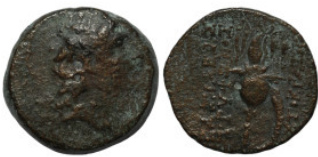
528 Greek. Bronze Æ.