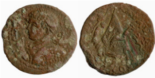
660 Roman Imperial. Bronze Æ. 26mm11.95g