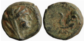
505 Greek. Bronze Æ. 13mm 3.34g