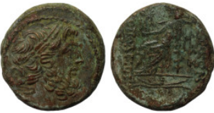
658 Greek. Bronze Æ. 27mm15.89g