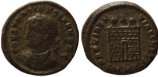
1063 Roman Imperial. Bronze Æ. 18mm 3,03g