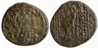
503 Greek. Bronze Æ. 24mm 12.51g