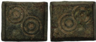
576 Islamic weight. Bronze. 13mm 5.93g