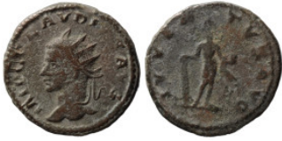
733 Roman Imperial. Billon. 19mm 3,81g