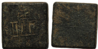
570 Islamic weight. Bronze. 18mm 13.37g