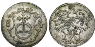
280 Uncertain. (1584) Dreier.