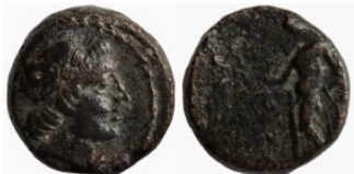
506 Greek. Bronze Æ. 12mm 1.92g