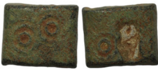
574 Islamic weight. Bronze. 13mm 5.53g