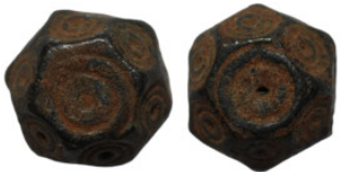
568 Islamic weight. Bronze. 13mm 5.57g