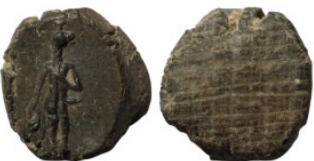
416 ancient seal impression. sealing wax. 12mm 0.61g