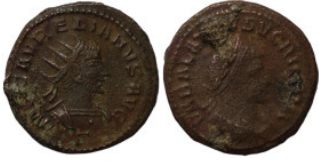
677 Roman Imperial. Bronze Æ. 20mm4.00g