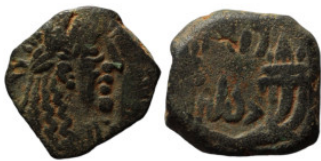
745 Nabatea. Bronze Æ. 15mm 2,67g