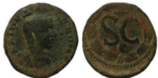
675 Roman Imperial. Bronze Æ. 19mm4.32g