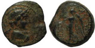
531 Greek. Bronze Æ.