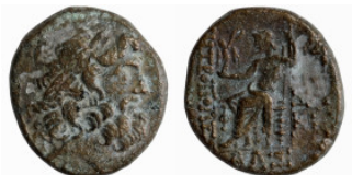
494 Greek. Bronze Æ. 21mm 6.85g