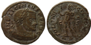
1030 Roman Imperial. Bronze Æ. 19mm 3,00g