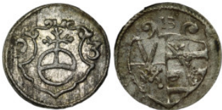
284 Saxony. Dresden. Christian I. (1593) Dreier.