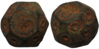
554 Islamic weight. Bronze. 17mm 14.50g