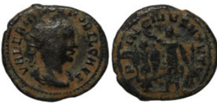
624 Roman Imperial. Billon. 20mm 3,44g