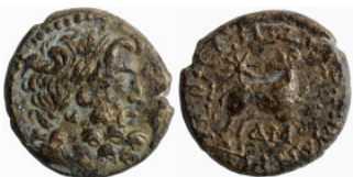
492 Greek. Bronze Æ. 20mm 7.24g