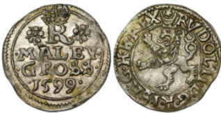
276 Bohemia. Rudolf II. (1599). Maley Groschen.