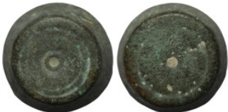
543 Islamic weight. Bronze. 25mm 58.05g