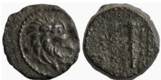
507 Greek. Bronze Æ. 13mm 2.77g