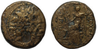
541 Greek. Bronze Æ.