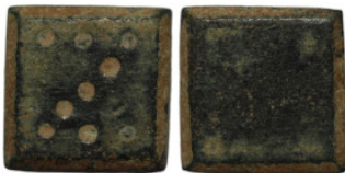
578 Islamic weight. Bronze. 13mm 4.33g