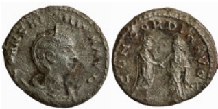
723 Roman Imperial. Billon. 18mm 3,34g