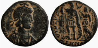
678 Roman Imperial. Bronze Æ. 16mm2.55g