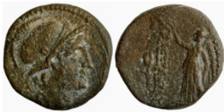
483 Greek. Bronze Æ. 18mm 5.15g