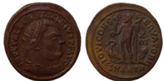
674 Roman Imperial. Bronze Æ. 20mm3.00g