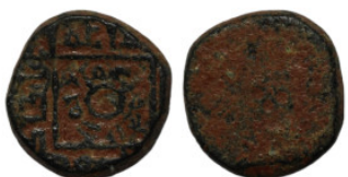
592 Islamic weight. Bronze. 20mm 29.00g