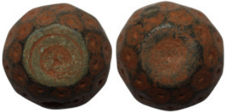
545 Islamic weight. Bronze. 25mm 55.89g