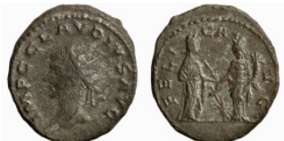
736 Roman Imperial. Billon. 20mm 3,40g