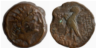
484 Greek. Bronze Æ. 19mm 6.08g