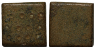
569 Islamic weight. Bronze. 18mm 13.80g