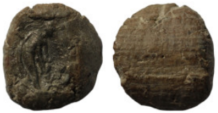
413 ancient seal impression. sealing wax. 13mm 0.92g