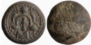
699 ancient seal impression. sealing wax. 21mm 4,26g