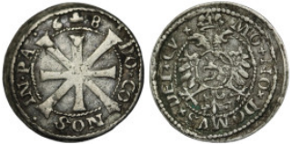
282 Habsburg. Ferdinand II. (1568) Kreuzer.