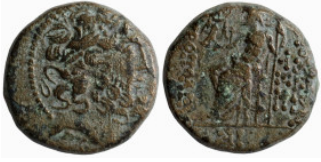
488 Greek. Bronze Æ. 19mm 7.63g