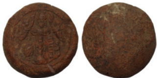
701 ancient seal impression. sealing wax. 22mm 4,57g