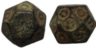
566 Islamic weight. Bronze. 16mm 13.88g