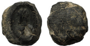
415 ancient seal impression. sealing wax. 15mm 1.45g