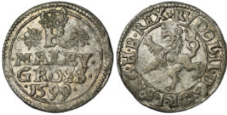
268 Bohemia. Rudolf II. (1599). Maley Groschen.