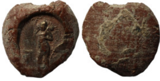
411 ancient seal impression. sealing wax. 12mm 0.75g