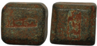
549 Islamic weight. Bronze. 10mm 14.72g