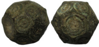
558 Islamic weight. Bronze. 17mm 14.68g