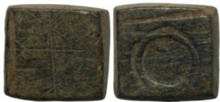
563 Islamic weight. Bronze. 16mm 14.86g