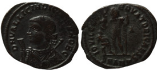
1065 Roman Imperial. Bronze Æ. 18mm 1,61g