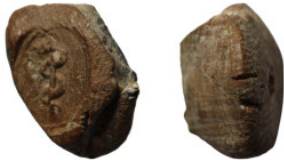
414 ancient seal impression. sealing wax. 12mm 0.71g