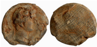
704 ancient seal impression. sealing wax. 24mm 3,58g