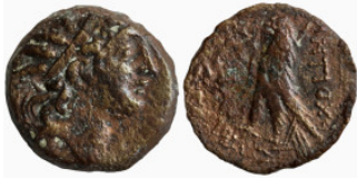
481 Greek. Bronze Æ. 17mm 3.61g