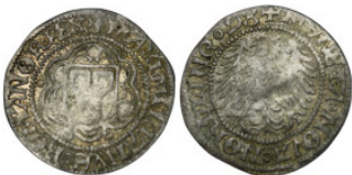
285 Uncertain. (1598)