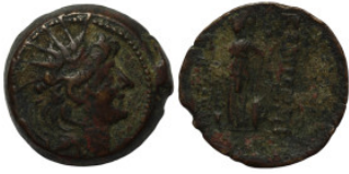
537 Greek. Bronze Æ.