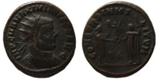
1062 Roman Imperial. Bronze Æ. 20mm 3,08g