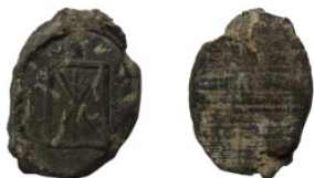
703 ancient seal impression. sealing wax. 23mm 2,91g