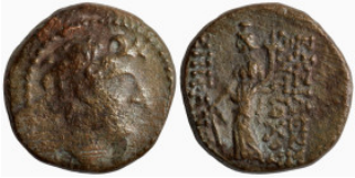
475 Greek. Bronze Aë. 17mm 4.24g