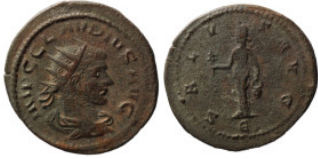
719 Roman Imperial. Billon. 21mm 3,03g