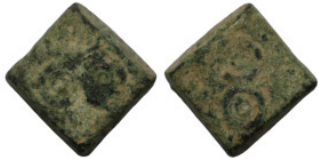
586 Islamic weight. Bronze. 12mm 5.51g