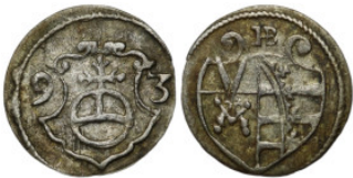
283 Saxony. Dresden. Christian I. (1593) Dreier.