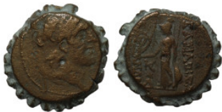
534 Greek. Bronze Æ.