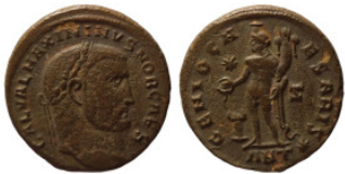
1120 Roman Imperial. Bronze Æ. 24mm 6,15g