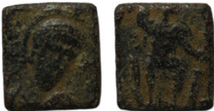
681 Roman Imperial. Bronze Æ. 11mm1.10g