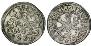
269 Bohemia. Rudolf II. (1583). Maley Groschen.