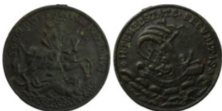
287 Medal. Georgstaler. Obv: S. GEORGIUS EQUITUM PATRONUS. Georg of Mansfeld on horse spearing spearing dragon. Rev: IN TEMPESTATE SECURITAS. ship with Jesus in storm.