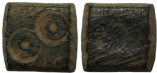
582 Islamic weight. Bronze. 13mm 5.92g