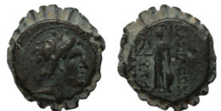
536 Greek. Bronze Æ.