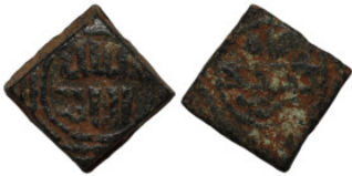
587 Islamic weight. Bronze. 12mm 2.13g