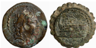
485 Greek. Bronze Æ. 19mm 7.66g