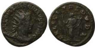
661 Roman Imperial. Billon. 22mm3.12g