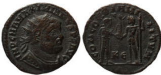
1032 Roman Imperial. Bronze Æ. 19mm 2,23g