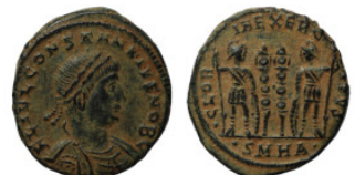
676 Roman Imperial. Bronze Æ. 18mm2.49g