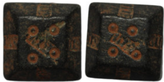
560 Islamic weight. Bronze. 13mm 14.83g