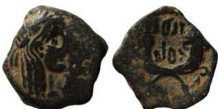
737 Nabatea. Bronze Æ. 17mm 3,44g