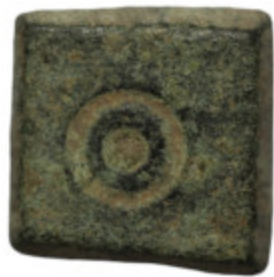
589 Islamic weight. Bronze. 12mm 2.07g