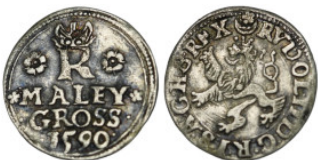
273 Bohemia. Rudolf II. (1590). Maley Groschen.