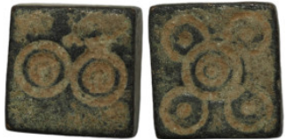
559 Islamic weight. Bronze. 12mm 14.72g