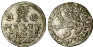
270 Bohemia. Rudolf II. (1597). Maley Groschen.