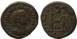
1066 Roman Imperial. Bronze Æ. 20mm 3,30g