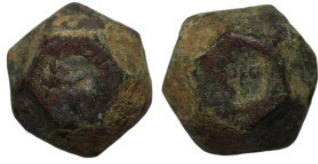
551 Islamic weight. Bronze. 16mm 14.38g