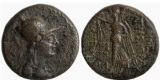
493 Greek. Bronze Æ. 20mm 6.79g