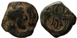
744 Nabatea. Bronze Æ. 15mm 3,19g