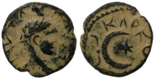
679 Roman Imperial. Bronze Æ. 16mm2.86g