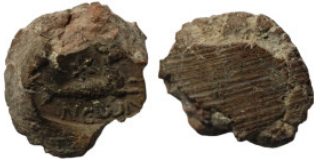
412 ancient seal impression. sealing wax. 15mm 1.14g