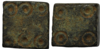
561 Islamic weight. Bronze. 12mm 13.72g