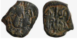
740 Nabatea. Bronze Æ. 15mm 3,27g