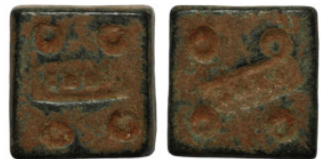
562 Islamic weight. Bronze. 15mm 14.65g