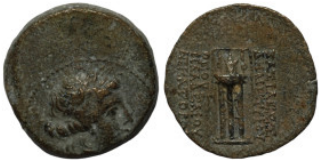
540 Greek. Bronze Æ.