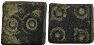
550 Islamic weight. Bronze. 10mm 13.75g