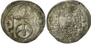
281 Uncertain. (1582) Dreier.