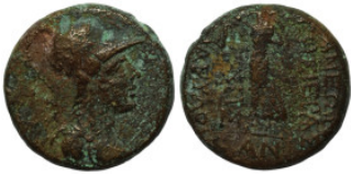
533 Greek. Bronze Æ.