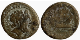
478 Greek. Bronze Aë. 17mm 3.00g