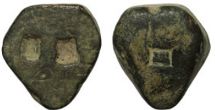
542 Islamic weight. Bronze. 32mm52.20g