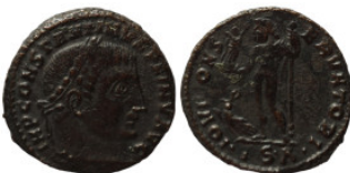
1068 Roman Imperial. Bronze Æ. 20mm 2,95g