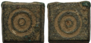
583 Islamic weight. Bronze. 9mm 2.79g