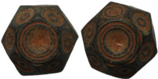
555 Islamic weight. Bronze. 17mm 14.65g