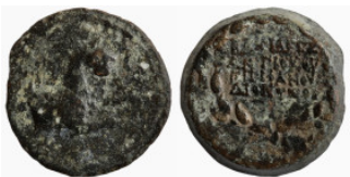
479 Greek. Bronze Aë. 17mm 3.50g