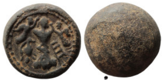
700 ancient seal impression. sealing wax. 23mm 4,87g