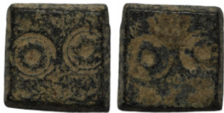
577 Islamic weight. Bronze. 14mm 5.81g