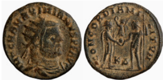
673 Roman Imperial. Bronze Æ. 20mm2.47g