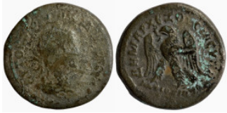
502 Greek. Bronze Æ. 27mm 12.78g