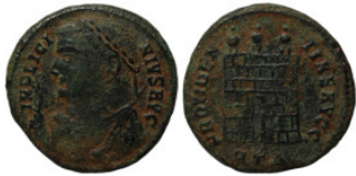
671 Roman Imperial. Bronze Æ. 19mm2.53g