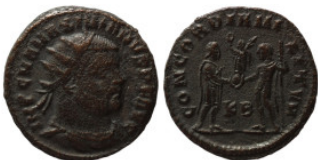
1033 Roman Imperial. Bronze Æ. 21mm 3,54g