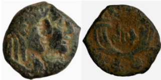
743 Nabatea. Bronze Æ. 15mm 2,78g