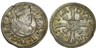
279 Habsburg. Ferdinand II. (1564-1595) Kreuzer.