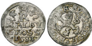
272 Bohemia. Rudolf II. (1583). Maley Groschen.