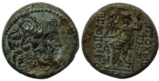
532 Greek. Bronze Æ.