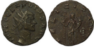
656 Roman Imperial. Billon. 18mm 2,74g