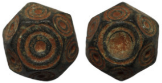
553 Islamic weight. Bronze. 17mm 14.67g