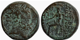
491 Greek. Bronze Æ. 20mm 7.87g