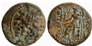
486 Greek. Bronze Æ. 20mm 6.44g