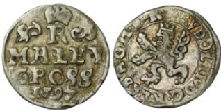
266 Bohemia. Rudolf II. (1597). Maley Groschen.