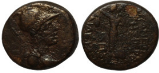
530 Greek. Bronze Æ.