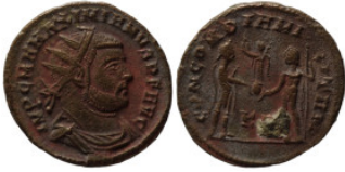
1119 Roman Imperial. Bronze Æ. 20mm 2,68g