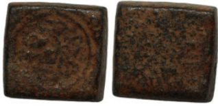
579 Islamic weight. Bronze. 12mm 5.12g