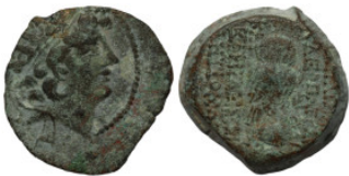
535 Greek. Bronze Æ.