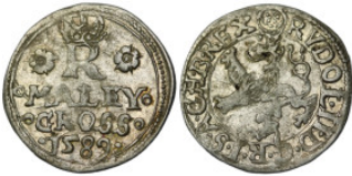
275 Bohemia. Rudolf II. (1589). Maley Groschen.