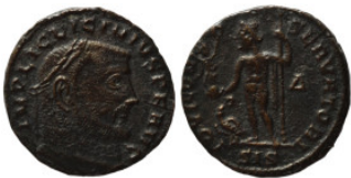
1031 Roman Imperial. Bronze Æ. 20mm 2,64g