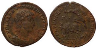
662 Roman Imperial. Bronze Æ. 22mm5.36g