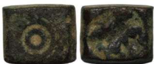
585 Islamic weight. Bronze. 10mm 2.77g