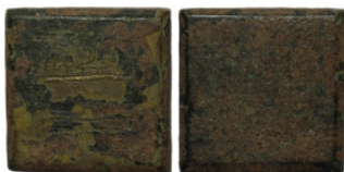
571 Islamic weight. Bronze. 19mm 13.13g