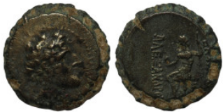
539 Greek. Bronze Æ.