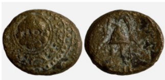
508 Greek. Bronze Æ. 15mm 3.62g