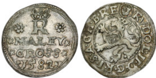
277 Bohemia. Rudolf II. (1582). Maley Groschen.