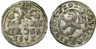
267 Bohemia. Rudolf II. (1592). Maley Groschen.