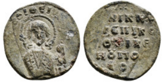
770 Byzantine Lead Seal 4,28 g - 18,29 mm