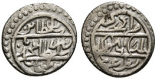
737 ISLAMIC COIN. AR SILVER 1,16 g - 12,41 mm