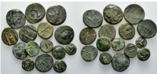
772 Greek coins, Group Lot 58,46 g - 15 pcs.