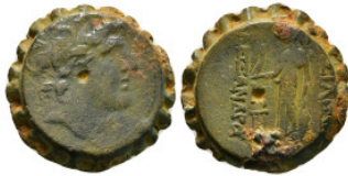
220 SELEUKID KINGS of SYRIA. Alexander I Balas, 152-145 BC. Ae Serrate, Antioch on the Orontes. Diademed head of Alexander I right. Rev. Athena standing left, holding Nike and grounded shield, spear leaning against arm; monograms to inner left and in exergue 9,37 g - 21,36 mm