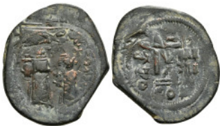
703 ANONYMOUS FOLLIS. AE Follis. 15,06 g - 34,16 mm 5