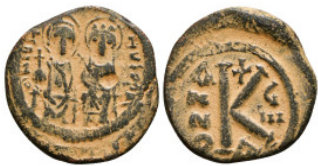
701 PHOCAS with LEONTIA (602-610). Follis 6,63 g - 23,38 mm 5