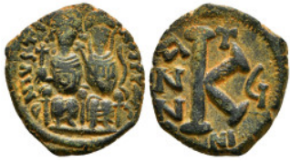
699 JUSTIN II, with SOPHIA (565-578). Follis. 5,10 g - 20,37 mm 5