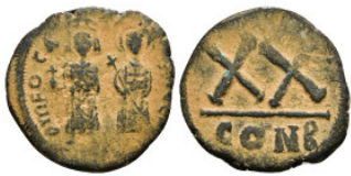
702 PHOCAS with LEONTIA (602-610). Follis 4,04 g - 22,19 mm 5