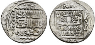
734 ISLAMIC COIN. AR SILVER 0,92 g - 13,40 mm