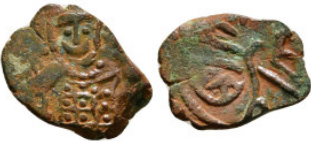
738 ISLAMIC COIN. AE 2,01 g - 17,40 mm