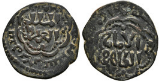
728 ISLAMIC COIN. AE 3,51 g - 21,83 mm