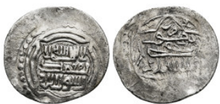
732 ISLAMIC COIN. AR SILVER 1,68 g - 19,94 mm