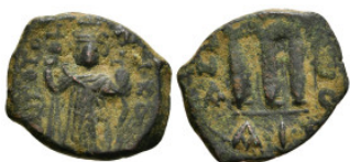
704 ANONYMOUS FOLLIS. AE Follis. 5,97 g - 23,13 mm 5