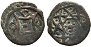
736 ISLAMIC COIN. AE 1,44 g - 14,12 mm