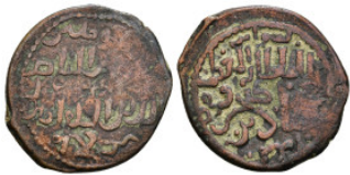
730 ISLAMIC COIN. AE 4,27 g - 24,10 mm