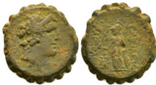
221 SELEUKID KINGS of SYRIA. Alexander I Balas, 152-145 BC. Ae Serrate, Antioch on the Orontes. Diademed head of Alexander I right. Rev. Athena standing left, holding Nike and grounded shield, spear leaning against arm; monograms to inner left and in exergue 7,67 g - 21,67 mm