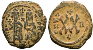
700 PHOCAS with LEONTIA (602-610). Follis 5,55 g - 22,49 mm 5