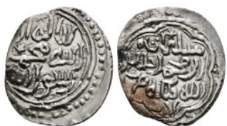
733 ISLAMIC COIN. AR SILVER 0,78 g - 17,07 mm