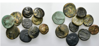
776 Greek coins, Group Lot 60,17 g - 10 pcs.