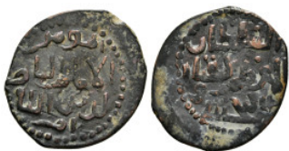
729 ISLAMIC COIN. AE 3,42 g - 23,85 mm