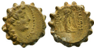
219 Greek Coin AE 5,72 g - 19,03 mm