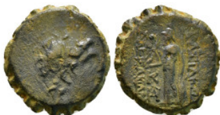
223 SELEUKID KINGS of SYRIA. Alexander I Balas, 152-145 BC. Ae Serrate, Antioch on the Orontes. Diademed head of Alexander I right. Rev. Athena standing left, holding Nike and grounded shield, spear leaning against arm; monograms to inner left and in exergue 7,50 g - 19,85 mm