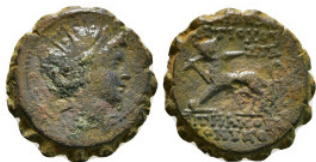
222 SELEUKID KINGDOM. Antiochos VI Dionysos (144-142 BC). Serrate Ae. Antioch on the Orontes. Obv: Radiate and diademed head right. Rev: ΒΑΣΙΛΕΩΣ ΑΝΤΙΟΧΟΥ / ΕΠΙΦΑΝΟΥΣ ΔΙΟΝΥΣΟΥ. Panther left, holding broken spear in jaws; to right, ΣΤΑ above star. 3.90 g - 17,23 mm