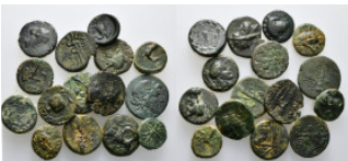
774 Greek coins, Group Lot 46,00 g - 15 pcs.