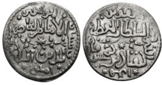
727 ISLAMIC COIN. AR SILVER 2,99 g - 23,38 mm