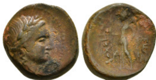
224 Greek Coin AE 7,50 g - 19,10 mm