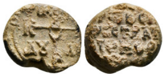
771 Byzantine Lead Seal 11,31 g - 21,22 mm