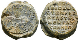
769 Byzantine Lead Seal 22,19 g - 26,39 mm