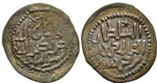
731 ISLAMIC COIN. AE 4,35 g - 29,69 mm