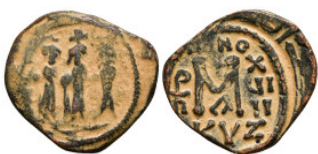
705 ANONYMOUS FOLLIS. AE Follis. 5,45 g - 24,68 mm 5