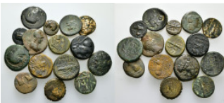
773 Greek coins, Group Lot 71,39 g - 15 pcs.