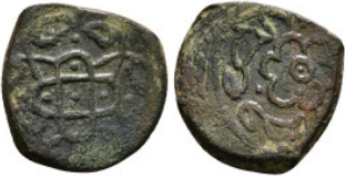
735 ISLAMIC COIN. AE 2,91 g - 16,72 mm