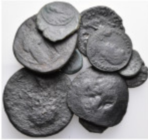
873 12 Roman&Byzantine coins