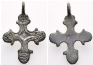
780 Byzantine Pendant Cross 3,57g. 23,1mm