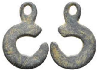
813 Byzantine Bronze obje 8,0g. 32mm