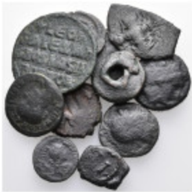
874 13 Roman&Byzantine coins