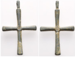
761 Byzantine Pendant Cross 8,68g. 32,1mm