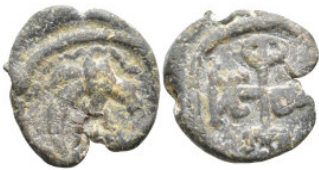
697 Byzantine lead Seals 6,62g. 20,3