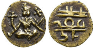
291 Islamic Coins Æ 0,35g. 6,4mm