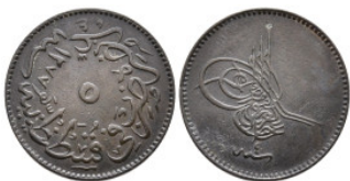
868 Ottomon coins 2,67g. 23,4mm