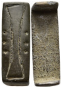
808 Byzantine Bronze obje 5,66g. 11,5mm