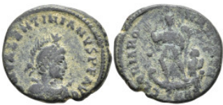
562 Roman Coins Æ 5,58g. 21,5mm