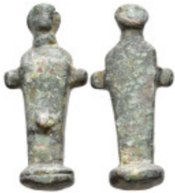
709 Greek obje 25,2g. 49,5mm