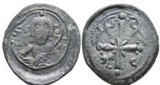
670 Byzantine Coins Æ 6,41g. 26,9mm