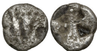
366 Greek coins, Ar 0,47g. 8,1mm