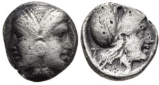
355 Greek coins, Ar 1,18g. 10,9mm