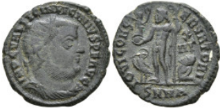
574 Roman Coins Æ 2,32g. 18,5mm