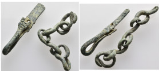
850 Ancient Bronze obje Lots