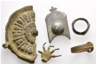
836 Ancient Bronze obje Lots