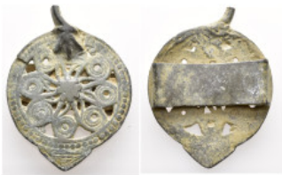
820 Byzantine Bronze obje 7,98g. 42mm