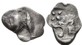
360 Greek coins, Ar 0,41g. 8,2mm