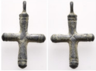
777 Byzantine Pendant Cross 4,72g. 21,5mm