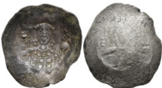
678 Byzantine Coins Æ 3,48g. 27,2mm