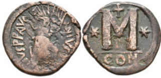
623 Byzantine Coins Æ 16,25g. 21mm