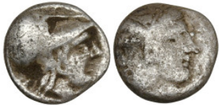
356 Greek coins, Ar 1,02g. 10,2mm