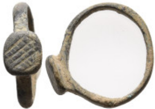
752 Byzantine Bronze ring 1,75g. 18,7mm