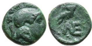
386 Greek coins Æ 0,82g. 8,1mm