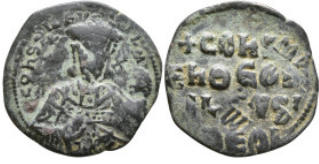
616 Byzantine Coins Æ 4,74g. 25,5mm