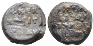
695 Byzantine lead Seals 9,11g. 17,1mm