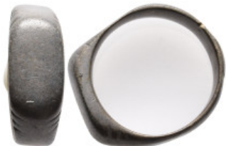
757 Byzantine Bronze ring 8,15g. 22,9mm