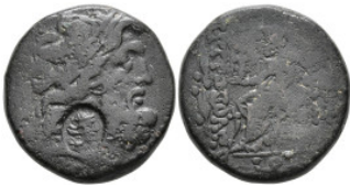
465 Greek coins Æ 12,29g. 22,9mm