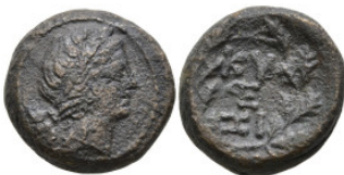
389 Greek coins Æ 7,77g. 17,8mm