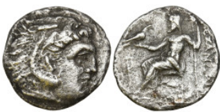
339 Greek coins, Ar 3,35g. 16,7mm