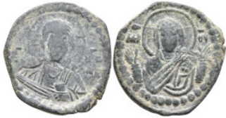
638 Byzantine Coins Æ 7,83g. 25,3mm