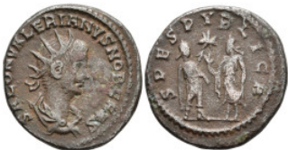
564 Roman Coins Æ 3,54g. 20,7mm