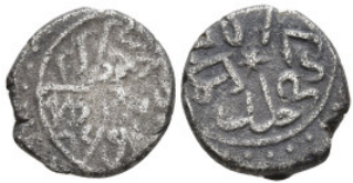
288 Islamic Coins AR. 0,92g. 10mm