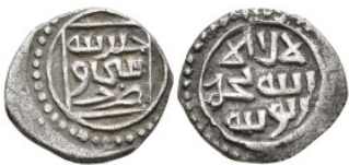
287 Islamic Coins AR. 1,08g. 13,4mm