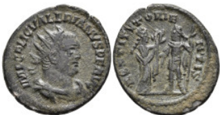
565 Roman Coins Æ 3,65g. 20,4mm