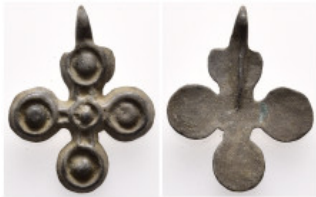
778 Byzantine Pendant Cross 3,82g. 22,2mm