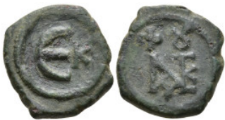
676 Byzantine Coins Æ 1,65g. 13,5mm