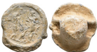
692 Byzantine lead Seals 5,05g. 16,3mm