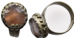
747 Byzantine Bronze ring 5,55g. 19,1mm