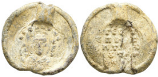
299 Byzantine lead seal 4,92g. 20,78mm