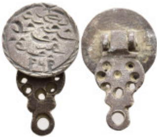
856 Ottomon bronze seal 4,98g. 17mm