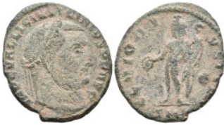
575 Roman Coins Æ 2,64g. 19,4mm