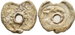
797 Byzantine obje 8,07g. 19,5mm