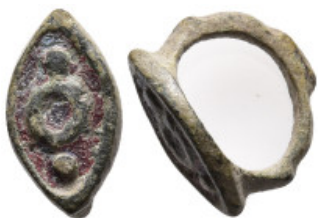
759 Byzantine Bronze ring 3,79g. 19,1mm