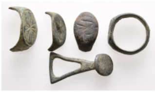
841 Ancient Bronze obje Lots