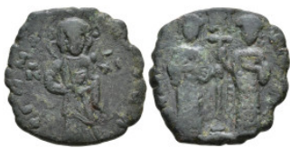
642 Byzantine Coins Æ 5,67g. 23,5mm