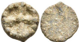
698 Byzantine lead Seals 2,78g. 14,7mm