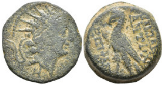
462 Greek coins Æ 5,91g. 18,2mm