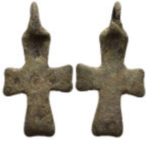
782 Byzantine Pendant Cross 1,85g. 27mm