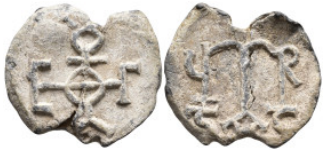
307 Byzantine lead seal 6,29g. 18,9mm