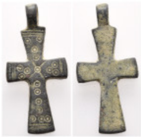
763 Byzantine Pendant Cross 5,95g. 18,0mm