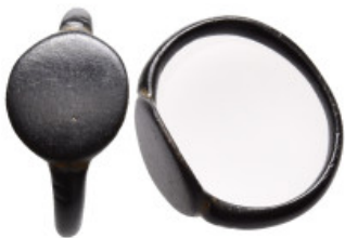
753 Byzantine Bronze ring 2,49g. 21,6mm