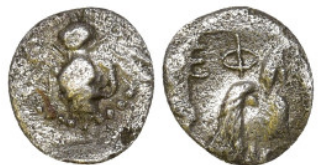
346 Greek coins, Ar 0,21g. 5,8mm