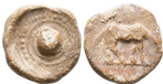
296 Roman lead seal 2,03g. 12,3mm