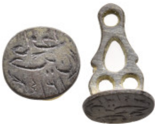
858 Ottomon bronze seal 3,58g. 25mm