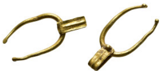
312 Roman gold pendant in the form of crescent 3,71g. 9,1mm.