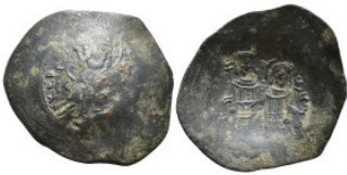
681 Byzantine Coins Æ 3,76g. 24,3mm