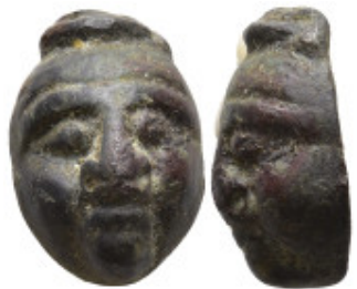
326 Roman bronze applique 10,2g. 21mm