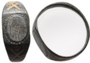
745 Byzantine Bronze ring 1,63g. 18,1mm