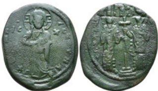
677 Byzantine Coins Æ 9,06g. 22,0mm