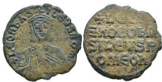
650 Byzantine Coins Æ 5,23g. 24,3mm