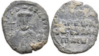
644 Byzantine Coins Æ 6,62g. 23,9mm