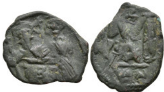
643 Byzantine Coins Æ 3,68g. 18,7mm