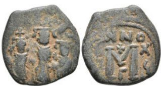
622 Byzantine Coins Æ 4,62g. 19,7mm