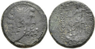
546 Provincial Coins Æ 7,8g. 20,9mm