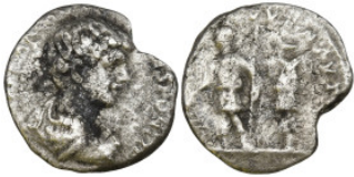
554 Roman Coins AR 1,7g. 16,7mm