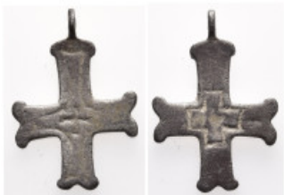
765 Byzantine Pendant Cross 2,11g. 19,2mm