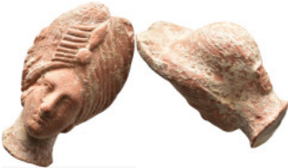
330 Terracotta Head. Hellenistic Period. 53,93g. 49,5mm