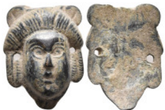
328 Roman bronze applique 16,32g. 23,3mm