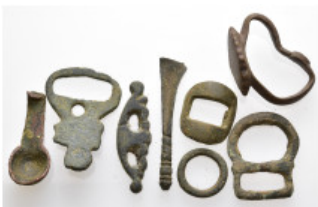
853 Ancient Bronze obje Lots