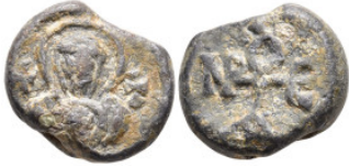
687 Byzantine lead Seals 4,29g. 13,7mm