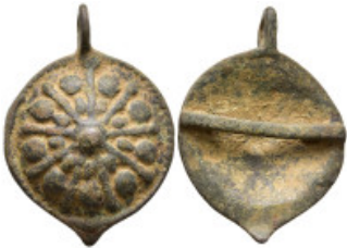
799 Byzantine Bronze obje 11,5g. 31mm