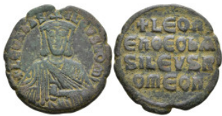
646 Byzantine Coins Æ 7,30g. 25,7mm