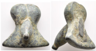
332 Roman bronz phallic applique 50,84g. 34,9mm