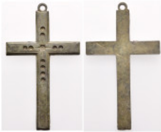
762 Byzantine Pendant Cross 4,42g.32,2mm