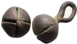
867 Ottomon bronze 5,71g. 14,1mm