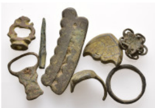
852 Ancient Bronze obje Lots