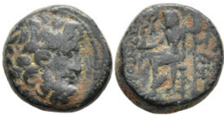
463 Greek coins Æ 7,77g. 18,1mm