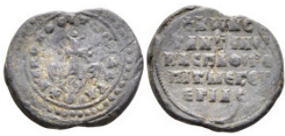
301 Byzantine lead seal 7,56g. 21,1mm