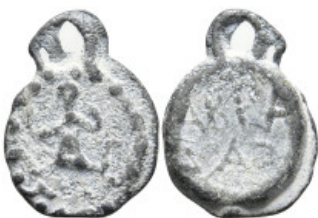
297 Egypt, Uncertain, Gnostic Amulet, Lead 3,04g. 15,9mm