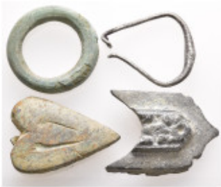
834 Ancient Bronze obje Lots