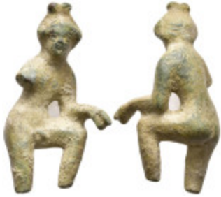
708 Roman obje 33,5g. 53mm