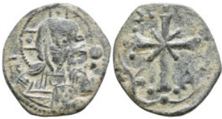
674 Byzantine Coins Æ 3,73g. 21,5mm