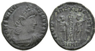
590 Roman Coins Æ 1,89g. 15,8mm