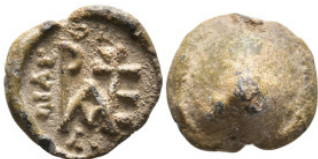
691 Byzantine lead Seals 3,95g. 13,4mm