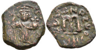
624 Byzantine Coins Æ 5,66g. 23,9mm