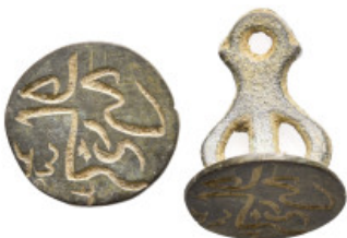
859 Ottomon bronze seal 4,19g. 22mm