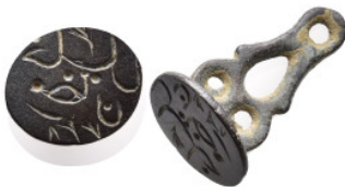
862 Ottomon bronze seal 4,71g. 16,0mm