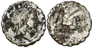
548 Roman Coins AR 2,79g. 19,3mm