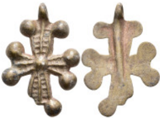
784 Byzantine Pendant Cross 6,0g. 27,8mm