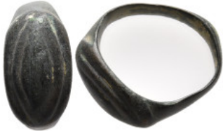
756 Byzantine Bronze ring 7,39g. 21,0mm