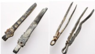
837 Ancient Bronze obje Lots