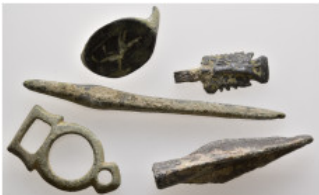
829 Ancient Bronze obje Lots