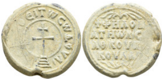
300 Byzantine lead seal 13,31g. 25,2mm