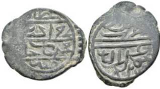
292 Islamic Coins Æ 2,63g. 19,8mm