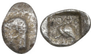
350 Greek coins, Ar 0,14g. 4,4mm