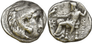
342 Greek coins, Ar 15,47g. 24,6mm