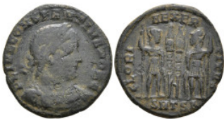
591 Roman Coins Æ 2,07g. 17,7mm