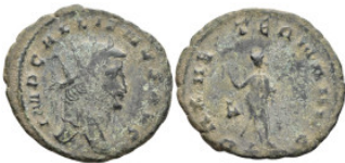
577 Roman Coins Æ 3g. 20,5mm