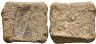
704 seal weight 24,28g. 28mm