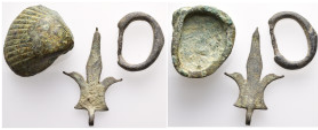
842 Ancient Bronze obje Lots