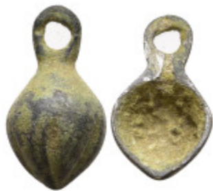
809 Byzantine Bronze obje 1,89g. 21,5mm