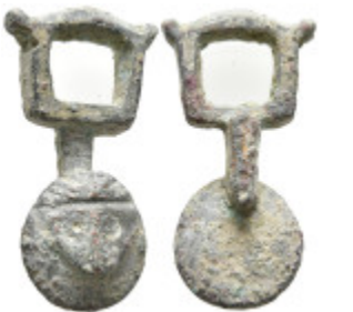
824 Byzantine Bronze obje 6,81g. 16,2mm