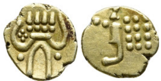
289 Islamic Coins Æ 0,37g. 6,7mm