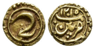
290 Islamic Coins Æ 0,40g. 5,4mm