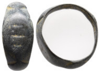
758 Byzantine Bronze ring 1,59g. 16,2mm