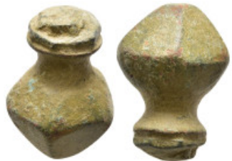
814 Byzantine Bronze obje 35,5g. 28mm