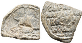
689 Byzantine lead Seals 13,64g. 29,2mm