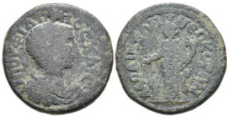
547 Provincial Coins Æ 9,5g. 24mm