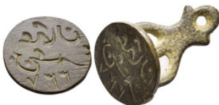
863 Ottomon bronze seal 4,41g. 15,0mm