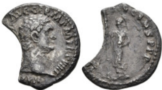
552 Roman Coins AR 2,33g. 17,6mm