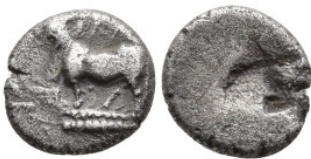
351 Greek coins, Ar 2,26g. 7,6mm