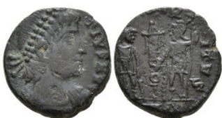
593 Roman Coins Æ 1,62g. 13,5mm