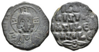
667 Byzantine Coins Æ 8,03g. 25mm