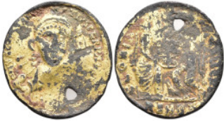
560 Roman Coins Fourrée 2,66g. 20,4mm