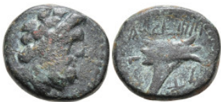
467 Greek coins Æ 3,72g. 14mm