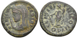
588 Roman Coins Æ 1,98g. 14,4mm