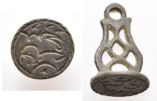
857 Ottomon bronze seal 4,44g. 24,5mm