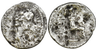
551 Roman Coins AR 3,6g. 19,4mm