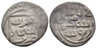
286 Islamic Coins AR. 1,2g. 13,4mm