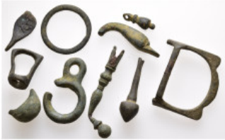
855 Ancient Bronze obje Lots