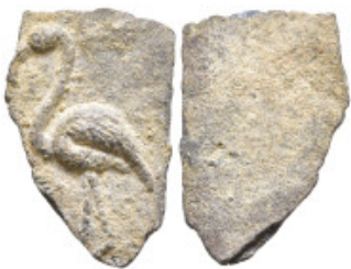
706 Roman obje 1,74g. 15,1mm