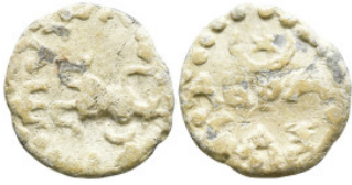
693 Gnostic Amulet, Lead 2,47g. 17,1mm