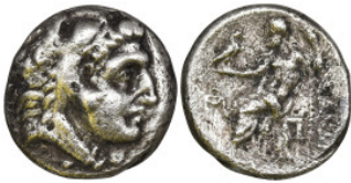
343 Greek coins, Ar 3,9g. 16,8mm