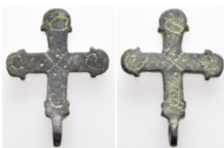
774 Byzantine Pendant Cross 5,42g. 27,7mm