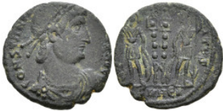
589 Roman Coins Æ 2,02g. 17,4mm