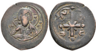
675 Byzantine Coins Æ 4,67g. 26,4mm