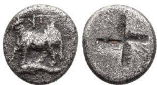
352 Greek coins, Ar 1,07g. 5,6mm