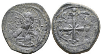
671 Byzantine Coins Æ 6,82g. 26,0mm