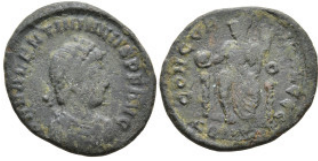
567 Roman Coins Æ 2,39g. 17,6mm