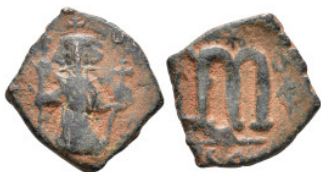
628 Byzantine Coins Æ 4,12g. 20,4mm