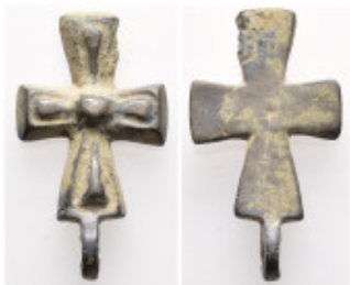
764 Byzantine Pendant Cross 6,16g. 19,6mm