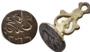
865 Ottomon bronze seal 4,89g. 15,8mm