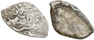
284 Islamic Coins AR. 1,2g. 16,3mm.