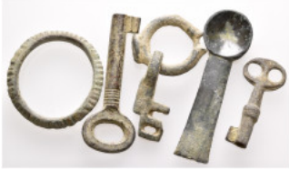
833 Ancient Bronze obje Lots