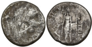
549 Roman Coins AR 2,51g. 18,1mm