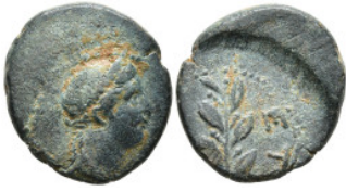
461 Greek coins Æ 3,45g. 16,1mm