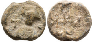
686 Byzantine lead Seals 3,44g. 13,2mm