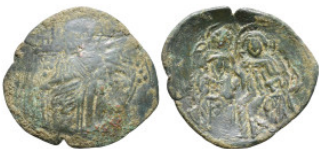
683 Byzantine Coins Æ 2,33g. 21,6mm