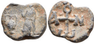
688 Byzantine lead Seals 4,38g. 15,9mm