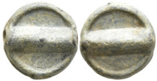
309 Byzantine lead seal 4,08g. 15,5mm