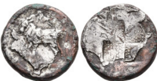
354 Greek coins, Ar 9,30g. 13,1mm