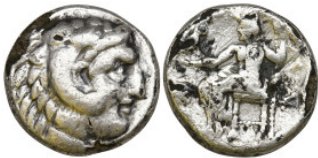
344 Greek coins, Ar 3,08g. 15,9mm