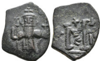
627 Byzantine Coins Æ 4,98g. 21mm