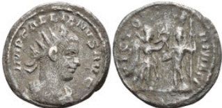
559 Roman Coins BI Antoninianus 2,94g. 21,2mm