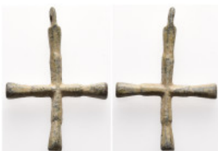
775 Byzantine Pendant Cross 4,76g. 29,0mm