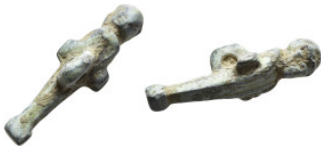
710 Greek obje 6,65g. 10,8mm