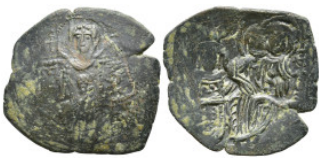
684 Byzantine Coins Æ 2,64g. 20,0mm