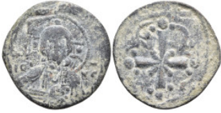
673 Byzantine Coins Æ 2,67g. 23,7mm