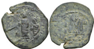
641 Byzantine Coins Æ 9,16g. 34,3mm