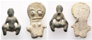
840 Ancient Bronze obje Lots