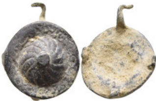
822 Byzantine Bronze obje 8,0g. 25,4mm