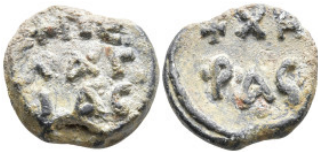
690 Byzantine lead Seals 6,57g. 17,1mm