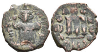
629 Byzantine Coins Æ 5,1g. 21,8mm