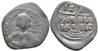
668 Byzantine Coins Æ 10,29g. 30,8mm