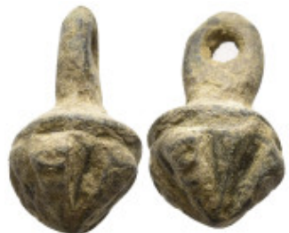
815 Byzantine Bronze obje 11,2g. 25mm