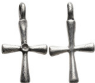
760 Byzantine silver Pendant Cross 4,59g. 19,8mm