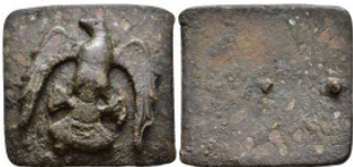
828 Bronze eagle obje 41,6g. 48,5mm