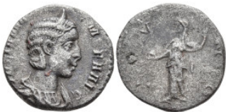
557 Roman Coins AR 2,55g. 17,8mm