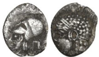
347 Greek coins, Ar 0,15g. 5,4mm