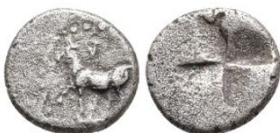
353 Greek coins, Ar 1,12g. 6,3mm