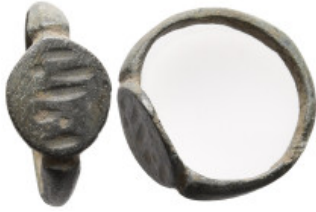
743 Byzantine Bronze ring 2,49g. 20,2mm