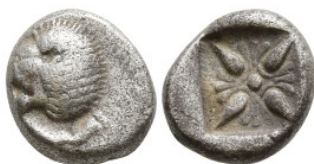
368 Greek coins, Ar 1,09g. 8,8mm