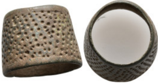
826 Byzantine Bronze ring 10,43g. 21,4mm