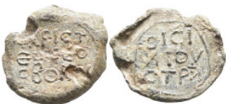
304 Byzantine lead seal 8,51g. 21,4mm