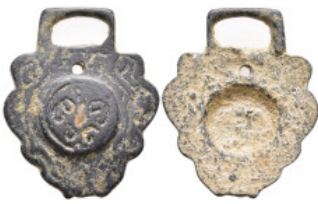
821 Byzantine Bronze obje 5,75g. 33mm