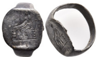
742 Roman silver ring 4,67g. 22,2mm