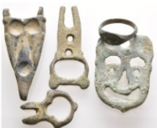
831 Ancient Bronze obje Lots