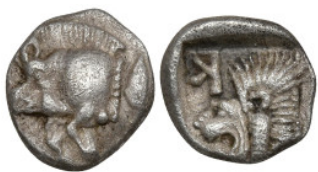
361 Greek coins, Ar 0,77g. 8,7mm