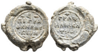
302 Byzantine lead seal 9,76g. 20,7mm