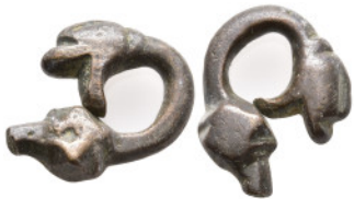
793 Byzantine Bronze obje 12,64g. 21,3mm