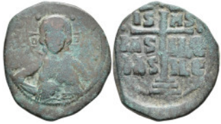
666 Byzantine Coins Æ 9,84g. 26,0mm