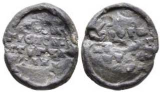
702 Byzantine lead Seals 4,62g. 17,0mm