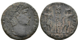
592 Roman Coins Æ 1,53g. 14,4mm