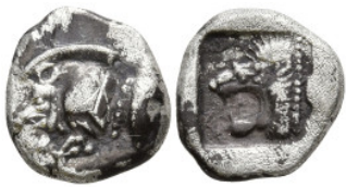
358 Greek coins, Ar 1,18g. 10,2mm