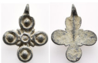
773 Byzantine Pendant Cross 4,75g. 23,1mm