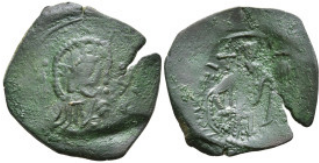
680 Byzantine Coins Æ 3,71g. 20,8mm