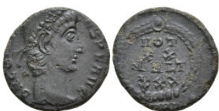
594 Roman Coins Æ 1,51g. 14,0mm