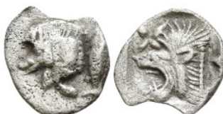
363 Greek coins, Ar 0,38g. 9mm