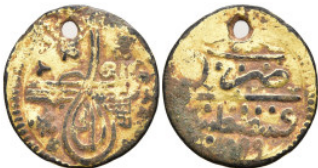
295 Islamic Coins Æ 1,68g. 19,3mm