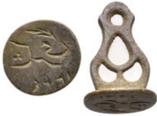
860 Ottomon bronze seal 3,9g. 22,4mm