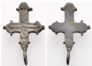
779 Byzantine Pendant Cross 4,41g. 21,8mm