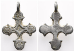
771 Byzantine Pendant Cross 4,70g. 22,5mm