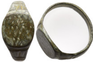
744 Byzantine Bronze ring 2,99g. 20,5mm