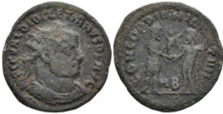
568 Roman Coins Æ 2,59g. 21,3mm