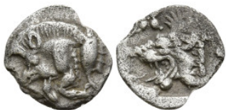
359 Greek coins, Ar 0,42g. 9,2mm