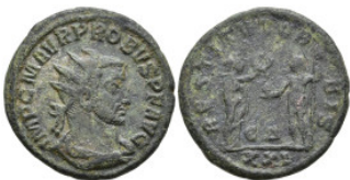
566 Roman Coins Æ 3,73g. 20,8mm