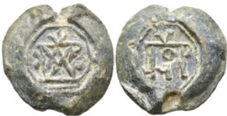
303 Byzantine lead seal 12,69g. 22,4mm