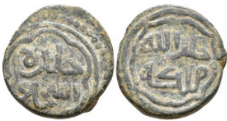
293 Islamic Coins Æ 4,47g. 20,0mm