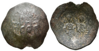
682 Byzantine Coins Æ 3,24g. 23,6mm