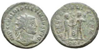
576 Roman Coins Æ 4,17g. 21,8mm