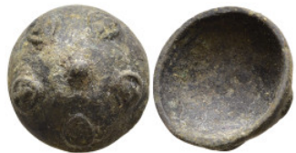
816 Byzantine Bronze obje 9,6g. 24mm