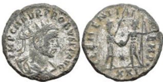
579 Roman Coins Æ 2,57g. 20,6mm