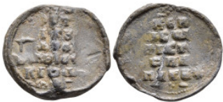
696 Byzantine lead Seals 10,44g. 24,3mm