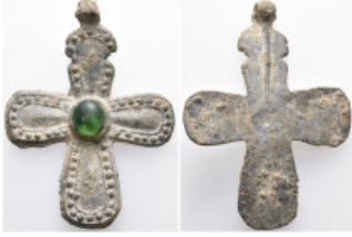
335 Byzantine Pendant Cross. 15,48g. 41,5mm