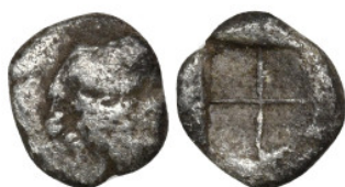
367 Greek coins, Ar 0,28g. 7,5mm