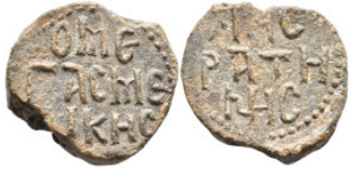
305 Byzantine lead seal 12,56g. 21,9mm