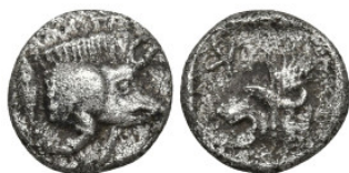
362 Greek coins, Ar 0,29g. 6,8mm