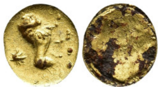
313 Roman gold lion 0,29g. 7,1