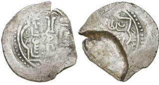
285 Islamic Coins AR. 4,8g. 27,5mm