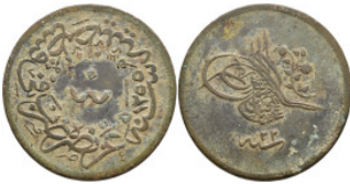
294 Islamic Coins Æ 21,0g. 37,6mm