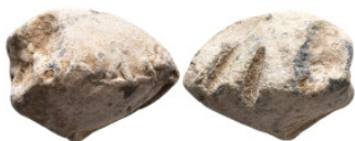
713 Greek sling bullet 33,57g. 12,5mm