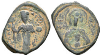
640 Byzantine Coins Æ 7,4g. 25,1mm