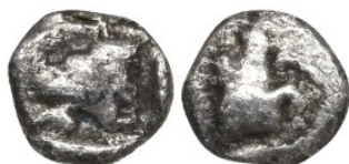
365 Greek coins, Ar 0,19g. 4,3mm