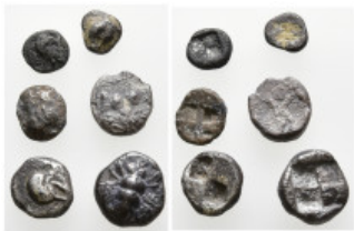
869 6 Greek coins.