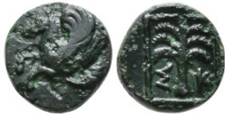
385 Greek coins Æ 1,13g. 8,3mm