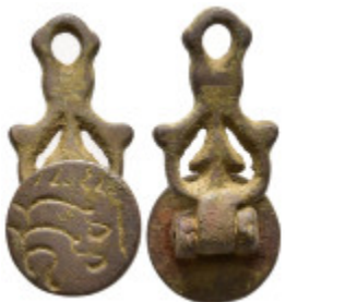
864 Ottomon bronze seal 5,5g. 29mm