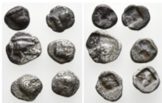
870 6 Greek coins.