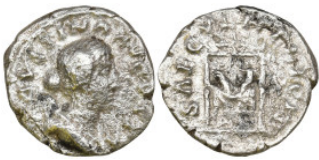
555 Roman Coins AR 2,2g. 17,3mm