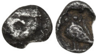
349 Greek coins, Ar 0,12g. 4,3mm