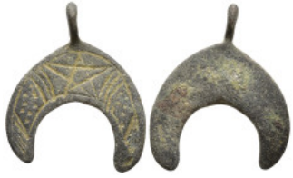
789 Byzantine Bronze obje 2,7g. 23mm