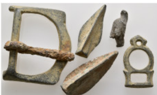
830 Ancient Bronze obje Lots