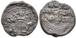
701 Byzantine lead Seals 7,91g. 21,2mm