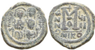
618 Byzantine Coins Æ 15,54g. 30,1mm