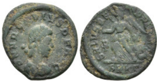
569 Roman Coins Æ 0,80g. 14,0mm