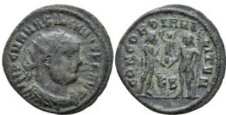
572 Roman Coins Æ 2,44g. 22,1mm