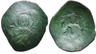
679 Byzantine Coins Æ 4,57g. 18,1mm