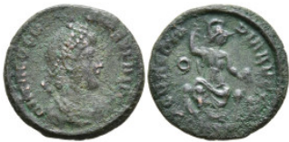
571 Roman Coins Æ 2,75g. 15,8mm