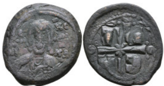
669 Byzantine Coins Æ 5,52g. 25,9mm