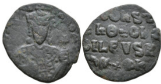
648 Byzantine Coins Æ 3,76g. 23,9mm