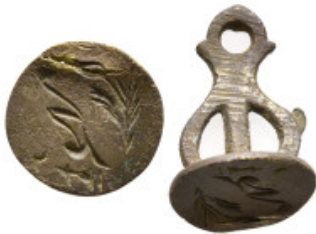
861 Ottomon bronze seal 3,9g. 22,5mm