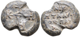
700 Byzantine lead Seals 18,40g. 15,6mm