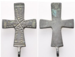
770 Byzantine Pendant Cross 6,08g. 27,9mm