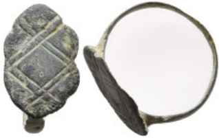
755 Byzantine Bronze ring 1,86g. 19,1mm