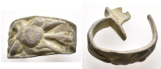
787 Byzantine Bronze obje 19,4g. 30,3mm