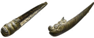
827 Bronze obje 52,11g. 34,2mm