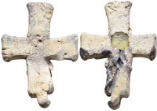
767 Byzantine Pendant Cross 75,67g. 26,5mm