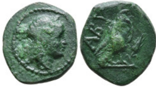
384 Greek coins Æ 1,34g. 10,2mm