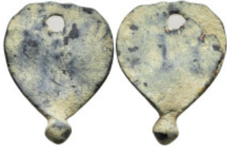
806 Byzantine Bronze obje 2,38g. 20,2mm