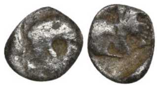
357 Greek coins, Ar 0,14g. 4,9mm