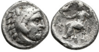
341 Greek coins, Ar 3,50g. 17,4mm