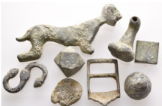
835 Ancient Bronze obje Lots