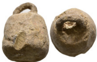
817 Byzantine obje 10,6g. 24,4mm