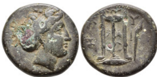
388 Greek coins Æ 5,15g. 17,4mm