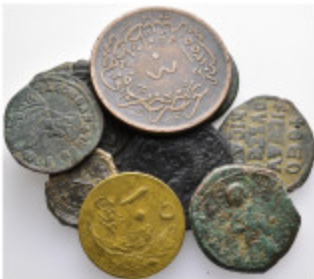
875 11 Byzantine&Ottomon coins