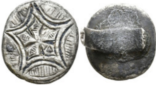
825 Byzantine Bronze ring 9,28g. 24,1mm