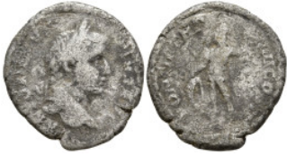
553 Roman Coins AR 2,91g. 19mm