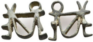
324 Byzantine Empire. Bread stamp 13,45g. 27,9mm