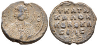
298 Byzantine lead seal 7,02g. 20,1mm