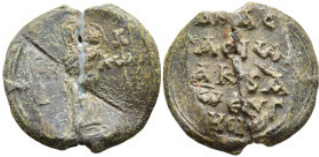
694 Byzantine lead Seals 8,76g. 24,8mm