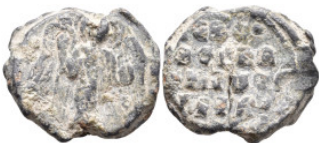
685 Byzantine lead Seals 12,06g. 21,9mm