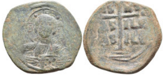
665 Byzantine Coins Æ 8,51g. 26,7mm