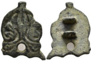
800 Byzantine Bronze obje 8,83g. 25,5mm