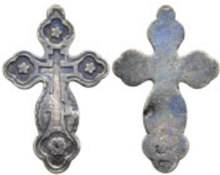
786 silver Pendant Cross 1,09g. 16,1mm