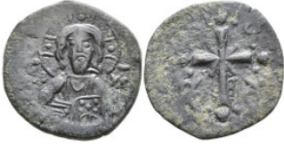
672 Byzantine Coins Æ 3,73g. 23,6mm