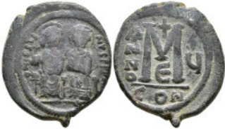
617 Byzantine Coins Æ 12,84g. 28,3mm