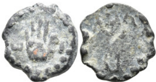
705 Roman obje 2,92g. 15,6mm