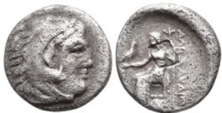
338 Greek coins, Ar 3,83g. 10,1mm.