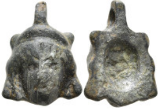
329 Roman bronze applique 7,33g. 16,7mm