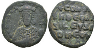
645 Byzantine Coins Æ 7,02g. 24,7mm