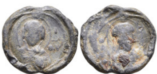
699 Byzantine lead Seals 7,62g. 13,3mm