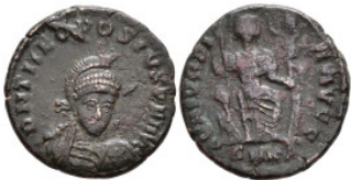
563 Roman Coins Æ 2,81g. 17,5mm