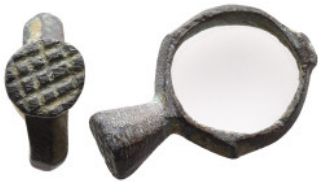
751 Byzantine Bronze ring 7,82g. 19,9mm