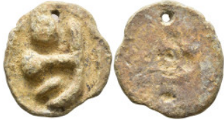
707 Roman obje 70,5g. 42mm