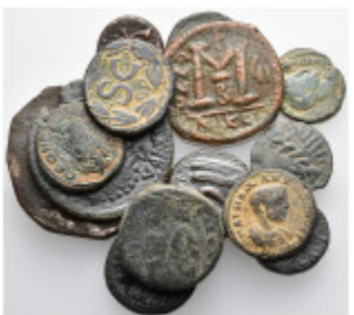
871 14 Roman coins