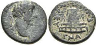
545 Provincial Coins Æ 6,54g. 20mm