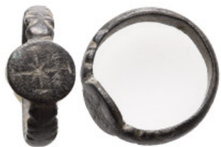
754 Byzantine Bronze ring 1,53g. 15,3mm