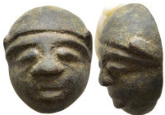
327 Roman bronze applique 25,7g. 29,5mm