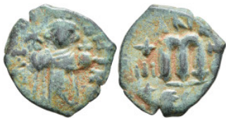
626 Byzantine Coins Æ 3,86g. 21,3mm