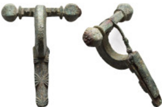
333 Roman bronz Fibula 47,54g. 53,0mm