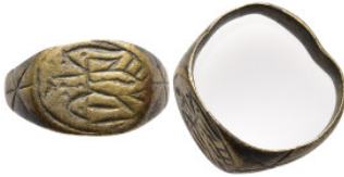
746 Byzantine Bronze ring 5,09g. 21,8mm