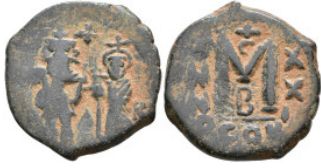
637 Byzantine Coins Æ 6,48g. 25mm