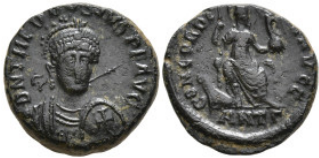
561 Roman Coins Æ 2,8g. 16,1mm