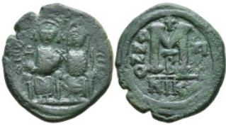
619 Byzantine Coins Æ 12,70g. 24,3mm