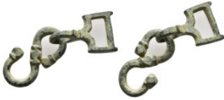
807 Byzantine Bronze obje 11,22g. 16,8mm