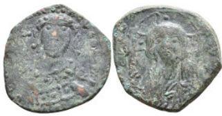
639 Byzantine Coins Æ 4,87g. 23,7mm