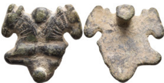
803 Byzantine Bronze obje 68,99g. 51,5mm