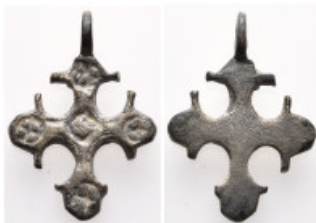
781 Byzantine Pendant Cross 4,01g. 20,9mm