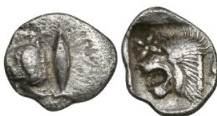
364 Greek coins, Ar 0,39g. 8,2mm