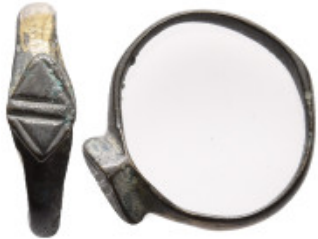
750 Byzantine Bronze ring 1,81g. 19,0mm