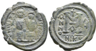
620 Byzantine Coins Æ 14,79g. 26,4mm