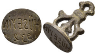
866 Ottomon bronze seal 4,39g. 15,3mm