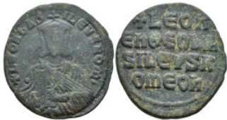
647 Byzantine Coins Æ 6,26g. 26,2mm