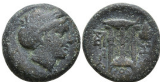
390 Greek coins Æ 5,59g. 18,1mm