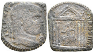
580 Roman Coins Æ 3,71g. 19,6mm