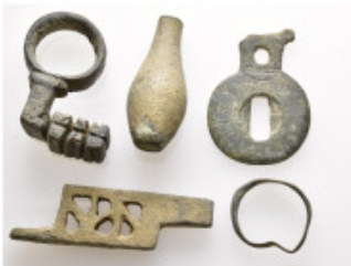
851 Ancient Bronze obje Lots