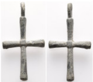
337 Byzantine Pendant Cross. 11,51g. 28,7mm