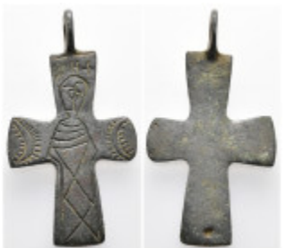
334 Byzantine Pendant Cross. 5,77g. 25,6mm