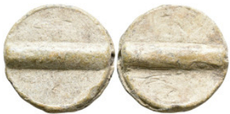
308 Byzantine lead seal 10,09g. 23,5mm