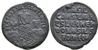
649 Byzantine Coins Æ 7,60g. 26,9mm