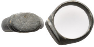
749 Byzantine Bronze ring 5,85g. 19,9mm