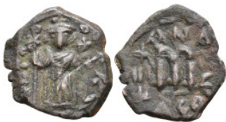
625 Byzantine Coins Æ 4,4g. 22,9mm