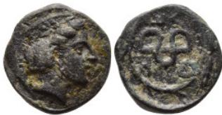
387 Greek coins Æ 1,34g. 10,9mm