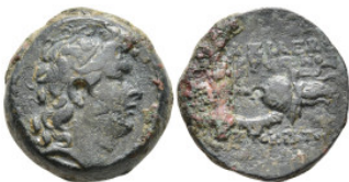
466 Greek coins Æ 5,66g. 17,4mm