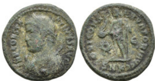
578 Roman Coins Æ 3,33g. 17,8