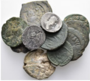
872 12 Roman&Byzantine coins