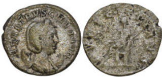
558 Roman Coins BI Antoninianus 4,3g. 21,0mm