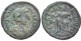
570 Roman Coins Æ 2,01g. 18,9mm