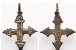
772 Byzantine Pendant Cross 3,64g. 24,0mm