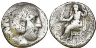
340 Greek coins, Ar 4,0g. 17,7mm