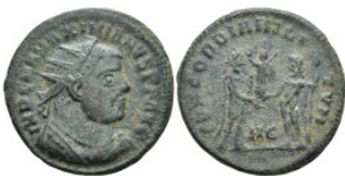
573 Roman Coins Æ 3,14g. 21,4mm