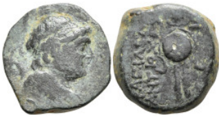
464 Greek coins Æ 6,36g. 17,7mm