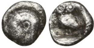
348 Greek coins, Ar 0,16g. 5,2mm