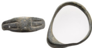
748 Byzantine Bronze ring 2,05g. 17,2mm