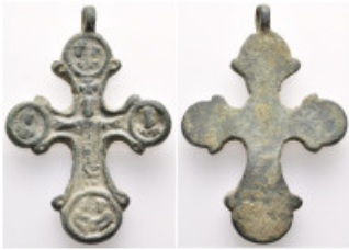
336 Byzantine Pendant Cross. 23,79g. 40,8mm