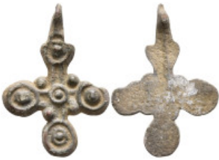
785 Byzantine Pendant Cross 3,95g. 27,6mm