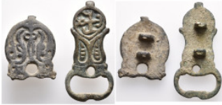
839 Ancient Bronze obje Lots