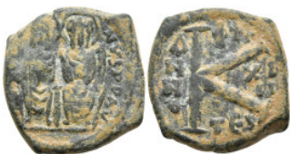
621 Byzantine Coins Æ 5,65g. 19,3mm