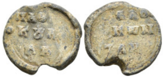
306 Byzantine lead seal 3,92g. 17,8mm