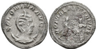
556 Roman Coins BI Antoninianus 4,1g. 21,2mm