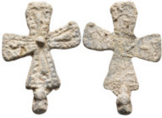
766 Byzantine Pendant Cross 8,90g. 16,8mm