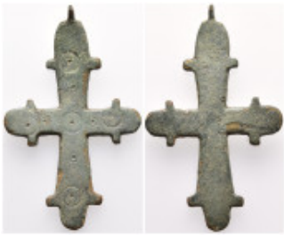
768 Byzantine Pendant Cross 7,99g. 20,1mm