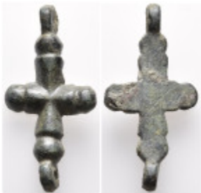
769 Byzantine Pendant Cross 14,80g. 25,2mm