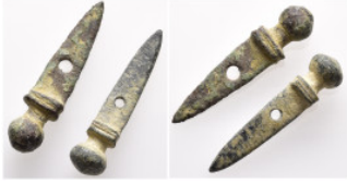
838 Ancient Bronze obje Lots