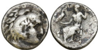
345 Greek coins, Ar 3,96g. 17mm