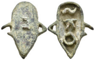
325 Byzantine Empire. Bread stamp 15,99g. 35,0mm