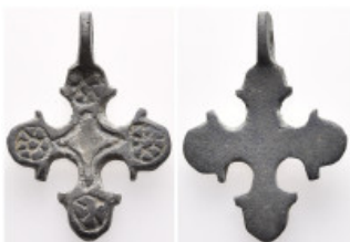
776 Byzantine Pendant Cross 5,32g. 24,1mm