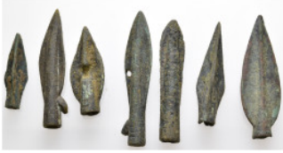
854 Ancient Bronze obje Lots