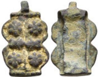
798 Byzantine Bronze obje 5,48g. 19,4mm