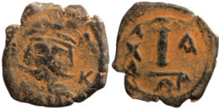
1268 Byzantine Empire coin 18mm 1,95g