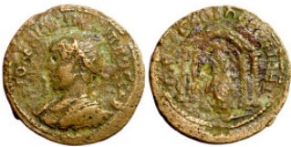
423 Roman Imperial Bronze 25mm 8,53g