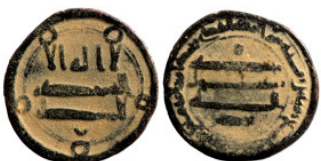
1331 Islamic coin 19mm 2,49g