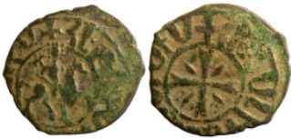
1272 Medieval coin 25mm 5,61g