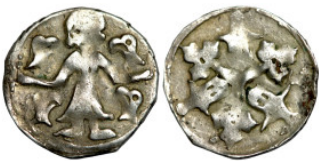
19 Denar Brandenburg Medieval German coin 13mm 0,58g