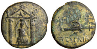
682 Greek coins Bronze 1-4 Century BC 18mm 3,37g