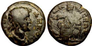
403 Roman Imperial Bronze 20mm 4,56g