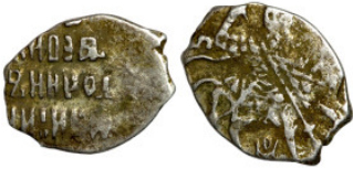
72 Ptropfkopeke Russian coin