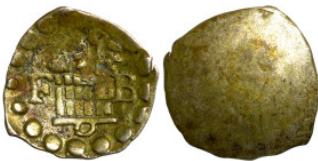
41 Schüsselpfennig arround 1500