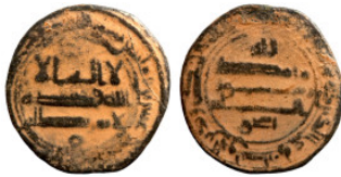
1339 Islamic coin 21mm 2,19g