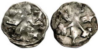
26 Denar Brandenburg Medieval German coin 14mm 0,45g