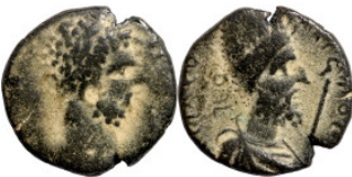
76 Roman Provincial Coins. 1st - 4th Century AD. Ae 18mm 4,48g