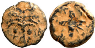
1086 Roman coin Bronze 1-4 Century AC 18mm 2,96g