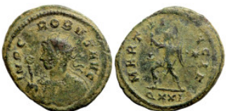
441 Roman Imperial Bronze 21mm 2,93g