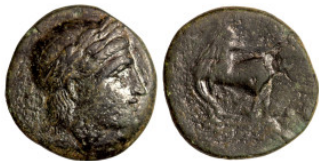
684 Greek coins Bronze 1-4 Century BC 17mm 3,31g