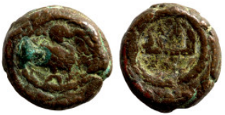
1346 Islamic coin 13mm 3,52g