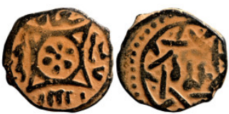
1335 Islamic coin 18mm 2,46g