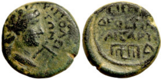
412 Roman Imperial Bronze 15mm 2,83g