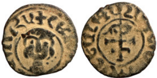
1273 Medieval coin 22mm 3,30g