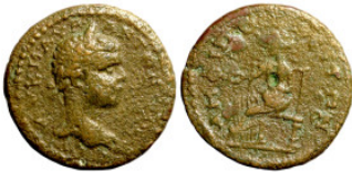
417 Roman Imperial Bronze 22mm 5,48g