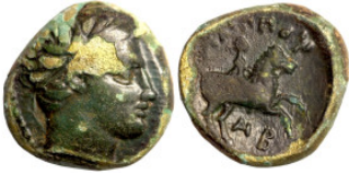
681 Greek coins Bronze 1-4 Century BC 17mm 6,12g