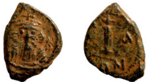
1313 Byzantine Empire coin 19mm 2,84g