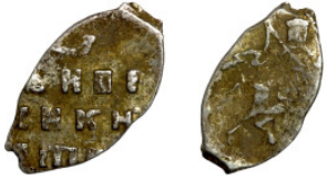
71 Ptropfkopeke Russian coin