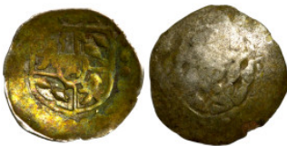
48 Schüsselpfennig around 1500