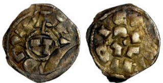
69 Medieval coin 16mm 0,66g