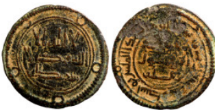
1341 Islamic coin 21mm 1,73g