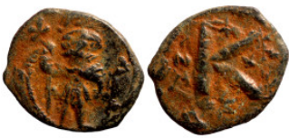
1066 Byzantine Empire 17mm 2,35g