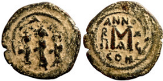
1044 Byzantine Empire 25mm 5,71g