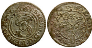
3 Solidus Sigismund III Wasa 16mm 0,69g