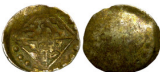
46 Schüsselpfennig around 1500