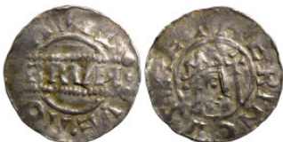
28 Medieval German coin Braunschweig 17mm 0,71g