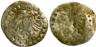
53 Schüsselpfennig around 1500