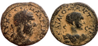
77 Macrinus with Diadumenian. 217-218. Laureate head of Macrinus to right. Rev. Bare-headed, draped and cuirassed bust of Diadumenian to right; S-C across fields 18mm 3,44g