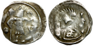
22 Denar Brandenburg Medieval German coin 14mm 0,56g