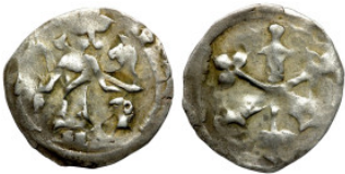
18 Denar Brandenburg Medieval German coin 14mm 0,61g