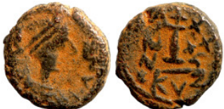
1319 Byzantine Empire coin 14mm 3,69g