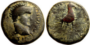
406 Roman Imperial Bronze 18mm 5,65g