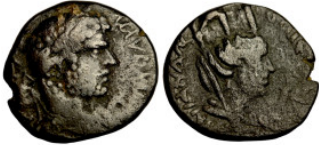
401 Roman Imperial Bronze 18mm 4,16g