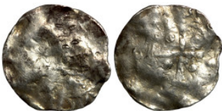
33 Medieval coin 19mm 1,44g