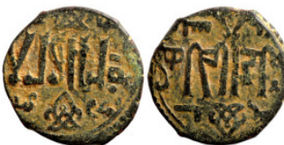
1343 Islamic coin 19mm 3,66g