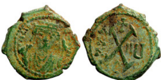
1301 Byzantine Empire coin 19mm 3,12g