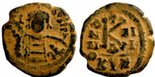
1285 Byzantine Empire coin 21mm 5,30g