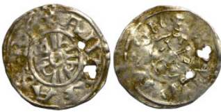
38 Medieval coin 15mm 0,37g