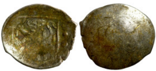
59 Schüsselpfennig arround 1500