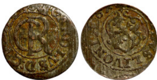
6 Solidus Polen Unter Schweden 15mm 0,57g