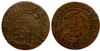
10 Solidus Polen Unter Schweden 16mm 0,52g