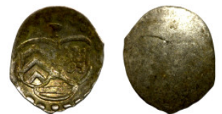
45 Schüsselpfennig around 1500