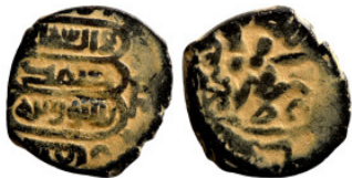
1348 Islamic coin 15mm 1,59g