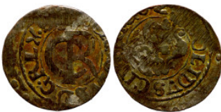
7 Solidus Polen Unter Schweden 15mm 0,46g