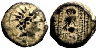
1119 Roman coin Bronze 1-4 Century AC 18mm 6,28g