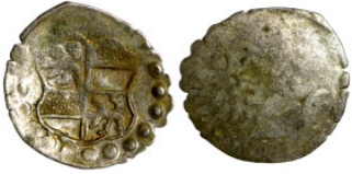
57 Schüsselpfennig arround 1500