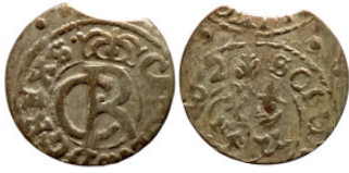
8 Solidus Polen Unter Schweden 16mm 0,54g