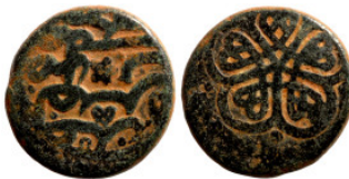
1342 Islamic coin 18mm 4,64g