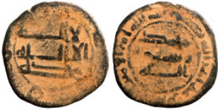
1344 Islamic coin 21mm 2,70g