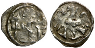
31 Denar Brandenburg Medieval German coin 14mm 0,47g