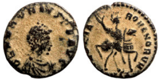
1094 Roman coin Bronze 1-4 Century AC 15mm 1,51g