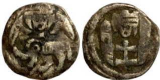
32 Medieval coin 11mm 0,48g