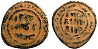
1347 Islamic coin 19mm 2,87g