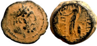
1428 Greek coins Bronze 1-4 Century BC 18mm 6,35g