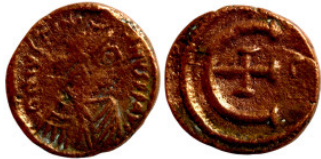
1303 Byzantine Empire coin 16mm 2,42g