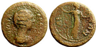
425 Roman Imperial Bronze 25mm 10,52g