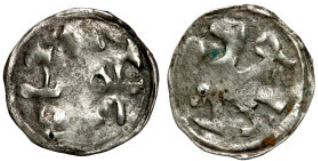
24 Denar Brandenburg Medieval German coin 14mm 0,42g