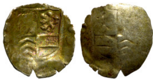
43 Schüsselpfennig around 1500