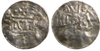
29 German Medieval coin 18mm 1,04g