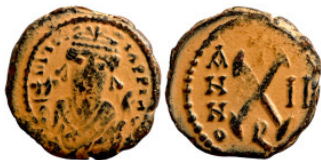
1305 Byzantine Empire coin 18mm 2,63g