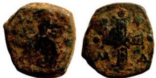
1298 Byzantine Empire coin 17mm 3,92g