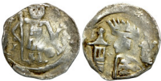
21 Denar Brandenburg Medieval German coin 14mm 0,57g