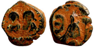
1324 Byzantine Empire coin 13mm 1,88g