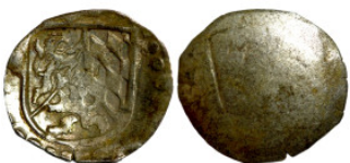
63 Schüsselpfennig arround 1500