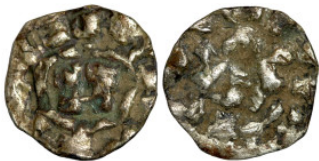
68 Medieval coin 15mm 0,82g