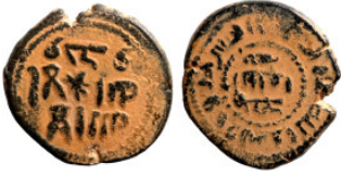
1337 Islamic coin 20mm 5,20g