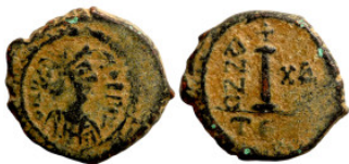
1306 Byzantine Empire coin 16mm 3,76g