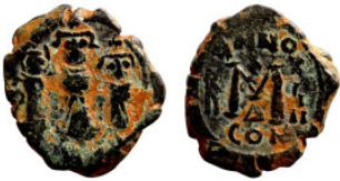
1045 Byzantine Empire 24mm 7,62g