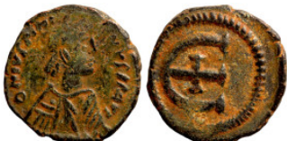
1320 Byzantine Empire coin 15mm 1,55g