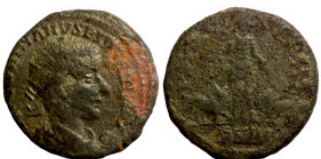
439 Roman Imperial Bronze 22mm 6,80g