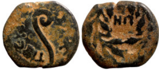
1093 Roman coin Bronze 1-4 Century AC 14mm 1,72g