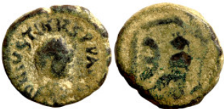
1318 Byzantine Empire coin 13mm 2,39g