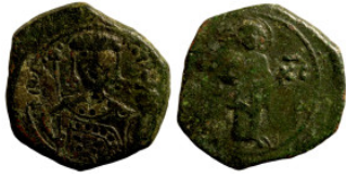
1309 Byzantine Empire coin 17mm 2,23g