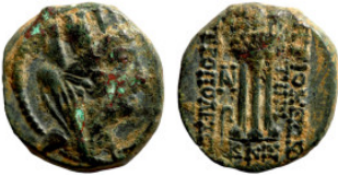
1429 Greek coins Bronze 1-4 Century BC 17mm 4,00g