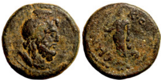
395 Roman Imperial Bronze 20mm 5,18g