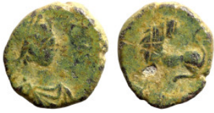
1113 Roman coin Bronze 1-4 Century AC 10mm 1,18g