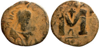
1043 Byzantine Empire 21mm 2,90g