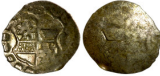
51 Schüsselpfennig around 1500