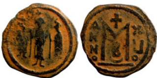
1047 Byzantine Empire 24mm 4,35g