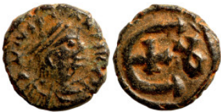
1326 Byzantine Empire coin 14mm 1,95g