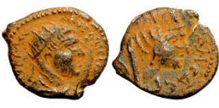
413 Roman Imperial Bronze 16mm 3,00g