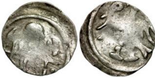
23 Denar Brandenburg Medieval German coin 14mm 0,61g