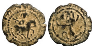
1279 Medieval coin 18mm 1,16g