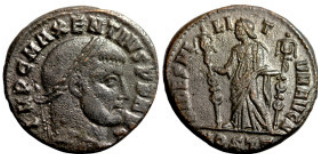
420 Roman Imperial Bronze 23mm 6,24g