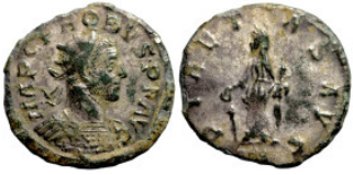
435 Roman Imperial Bronze 21mm 2,91g