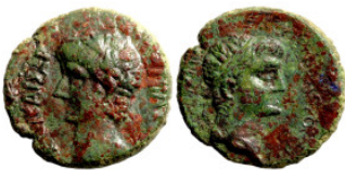
419 Roman Imperial Bronze 22mm 9,07g