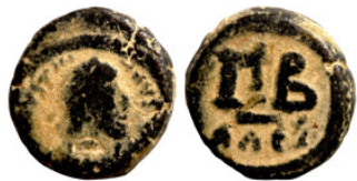
1304 Byzantine Empire coin 16mm 5,40g