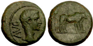
405 Roman Imperial Bronze 18mm 5,40g