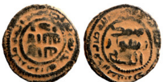
1332 Islamic coin 20mm 3,21g