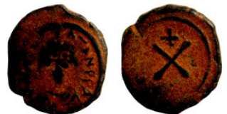
1287 Byzantine Empire coin 20mm 2,94g