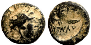
1434 Greek coins Bronze 1-4 Century BC 15mm 3,41g