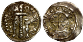
39 Viking Medieval coin 13mm 0,50g