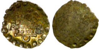
50 Schüsselpfennig around 1500