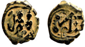
1064 Byzantine Empire 20mm 3,75g