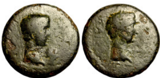
399 Roman Imperial Bronze 20mm 5,19g