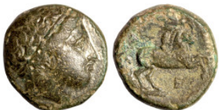
686 Greek coins Bronze 1-4 Century BC 16mm 5,26g