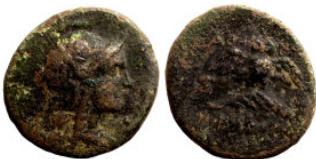
1118 Roman coin Bronze 1-4 Century AC 19mm 3,32g