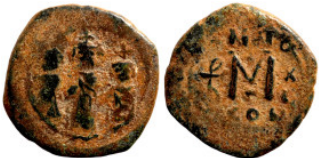
1046 Byzantine Empire 23mm 5,29g