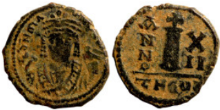
1312 Byzantine Empire coin 17mm 2,47g