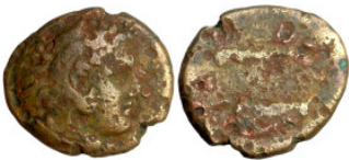
683 Greek coins Bronze 1-4 Century BC 17mm 5,44g