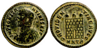
243 Constantinus I. (307-337 AD). Follis. 19mm 3,00g