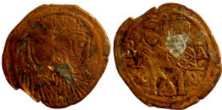
1284 Byzantine Empire coin 25mm 3,14g