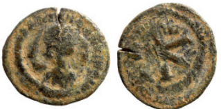
1070 Byzantine Empire 15mm 1,55g