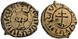
1271 Medieval coin 21mm 3,33g