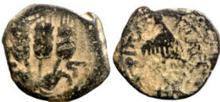
1088 Roman coin Bronze 1-4 Century AC 17mm 3,00g