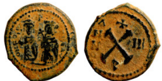
1299 Byzantine Empire coin 18mm 2,91g