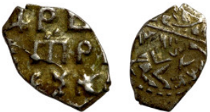
75 Ptropfkopeke Russian coin