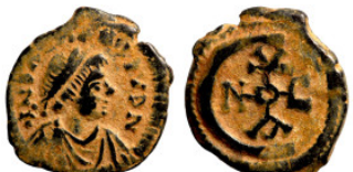
1322 Byzantine Empire coin 15mm 1,31g