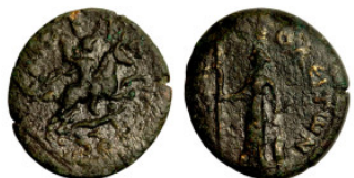
398 Roman Imperial Bronze 20mm 5,58g