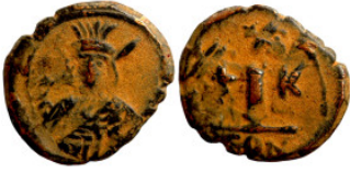
1295 Byzantine Empire coin 25mm 4,51g