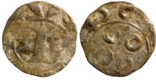
1281 Medieval coin 16mm 0,96g