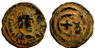
1300 Byzantine Empire coin 18mm 2,25g