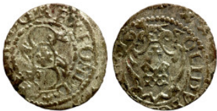
4 Solidus Sigismund III Wasa 16mm 0,65g