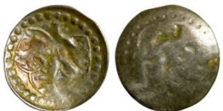
61 Schüsselpfennig arround 1500