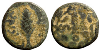
1090 Roman coin Bronze 1-4 Century AC 16mm 2,16g