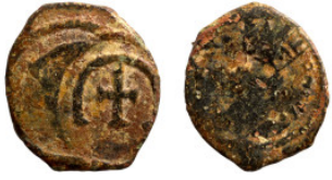
1267 Byzantine Empire coin 18mm 2,12g