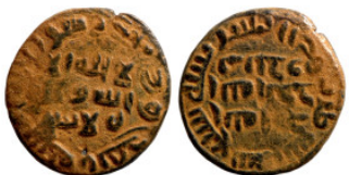
1334 Islamic coin 21mm 4,24g