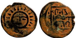
1336 Islamic coin 18mm 1,93g