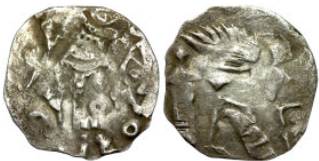
20 Denar Brandenburg Medieval German coin 14mm 0,60g