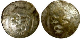
65 Schüsselpfennig arround 1500