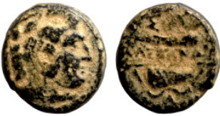
1430 Greek coins Bronze 1-4 Century BC 16mm 4,93g