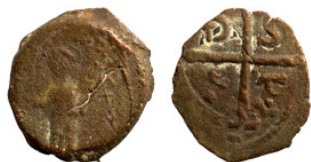
1274 Byzantine Empire coin 22mm 4,25g