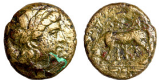
685 Greek coins Bronze 1-4 Century BC 17mm 4,42g