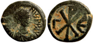
1316 Byzantine Empire coin 13mm 2,00g