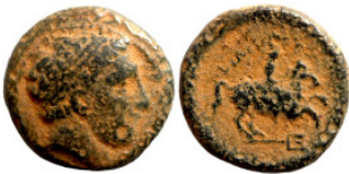
1432 Greek coins Bronze 1-4 Century BC 17mm 5,36g