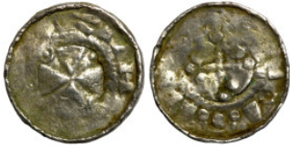
36 Medieval coin 15mm 1,02g