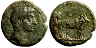
407 Roman Imperial Bronze 19mm 5,03g