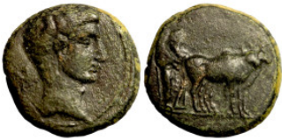
409 Roman Imperial Bronze 18mm 4,67g