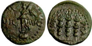
411 Roman Imperial Bronze 18mm 4,04g