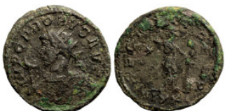
440 Roman Imperial Bronze 22mm 3,43g