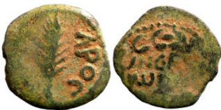
1089 Roman coin Bronze 1-4 Century AC 16mm 1,91g