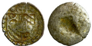
62 Schüsselpfennig arround 1500