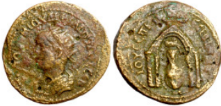
415 Roman Imperial Bronze 24mm 10,23g