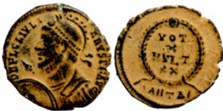
242 Julianus II Nummus 360-363 A.D Follis 19mm 2,87g