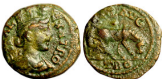
397 Roman Imperial Bronze 21mm 5,67g