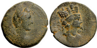
424 Roman Imperial Bronze 24mm 8,82g