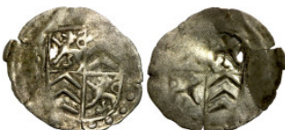
49 Schüsselpfennig around 1500