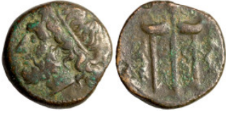
680 Greek coins Bronze 1-4 Century BC 18mm 6,21g