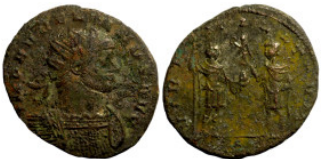
437 Roman Imperial Bronze 20mm 3,32g