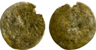
55 Schüsselpfennig around 1500