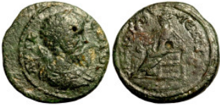
393 Roman Imperial Bronze 23mm 7,84g