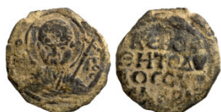
1276 Byzantine Empire coin 22mm 3,00g