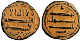
1338 Islamic coin 19mm 2,42g