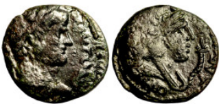
396 Roman Imperial Bronze 18mm 3,36g