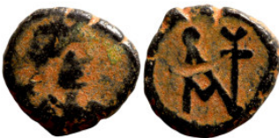
1116 Roman coin Bronze 1-4 Century AC 9mm 0,81g