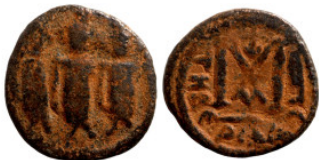
1067 Byzantine Empire 17mm 2,75g