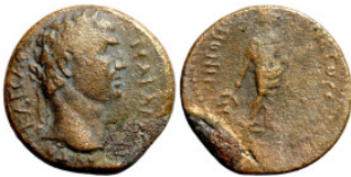
416 Roman Imperial Bronze 22mm 5,41g