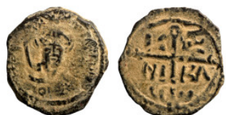
1277 Byzantine Empire coin 21mm 2,58g