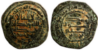
1345 Islamic coin 25mm 8,18g