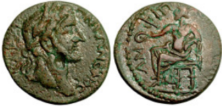
421 Roman Imperial Bronze 21mm 6,65g