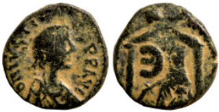
1325 Byzantine Empire coin 13mm 1,91g