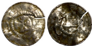
35 Medieval coin 17mm 1,00g