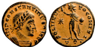
244 Constantinus I. (307-337 AD). Follis. 19mm 3,18g