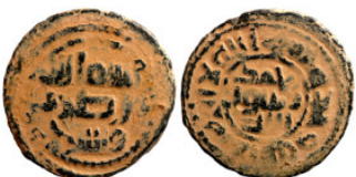
1333 Islamic coin 22mm 3,26g