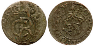
9 Solidus Polen Unter Schweden 15mm 0,55g