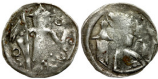
25 Denar Brandenburg Medieval German coin 14mm 0,50g