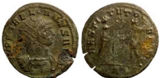
438 Roman Imperial Bronze 23mm 3,53g