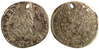
1282 Österreich Leopold I 25mm 2,62g