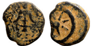
1096 Roman coin Bronze 1-4 Century AC 14mm 1,81g