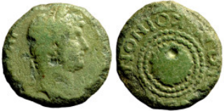
410 Roman Imperial Bronze 18mm 2,84g