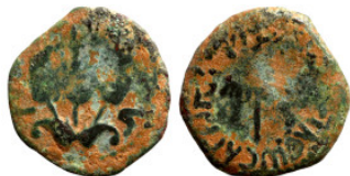
1091 JUDAEA. Herodians. Agrippa I, 37-43. Prutah Jerusalem. Umbrella-like canopy with fringes. Rev. Three grain ears; L \varsigma (date) flanking. Meshorer 120; Hendin 6274 17mm 1,93g