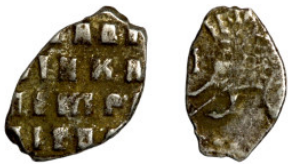
73 Ptropfkopeke Russian coin