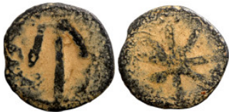
1095 Roman coin Bronze 1-4 Century AC 12mm 0,69g