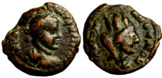
402 Roman Imperial Bronze 17mm 2,93g