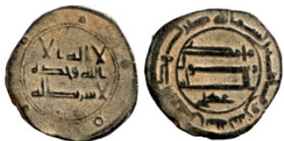
1330 Islamic coin 21mm 2,46g