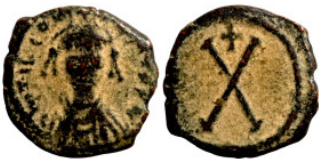
1297 Byzantine Empire coin 18mm 3,62g