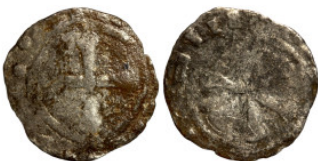
34 Medieval coin 18mm 0,69g