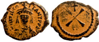
1296 Byzantine Empire coin 19mm 3,00g