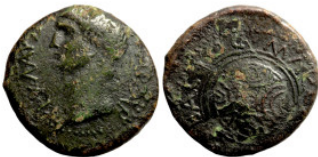
418 Roman Imperial Bronze 23mm 8,78g