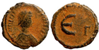
1327 Byzantine Empire coin 12mm 2,00g