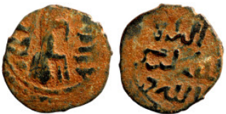
1349 Islamic coin 17mm 1,42g