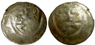
60 Schüsselpfennig arround 1500