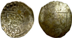
56 Schüsselpfennig around 1500