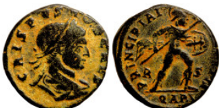
245 Crispus, 316-326 AD Bronze Follis 19mm 2,68g