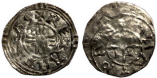
37 Medieval coin 15mm 0,49g