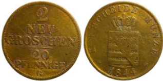
30 2 Neue Groschen 20 Pfennige 1844 21mm 3,11g