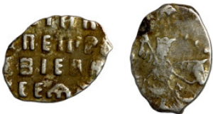
74 Ptropfkopeke Russian coin