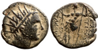
1087 Roman coin Bronze 1-4 Century AC 16mm 4,52g