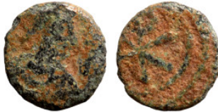
1114 Roman coin Bronze 1-4 Century AC 9mm 0,50g