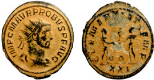
240 Probus, 276-282. B-Antoninian 22mm 2,88g