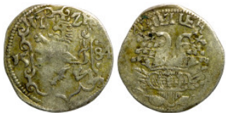
13 1 Kreuzer 1750 17mm 0,65g