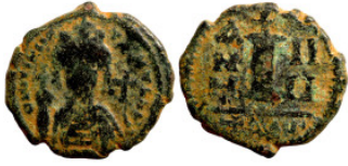
1302 Byzantine Empire coin 18mm 3,29g