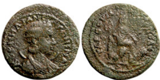
426 Roman Imperial Bronze 27mm 12,51g