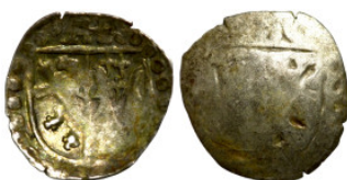
47 Schüsselpfennig around 1500