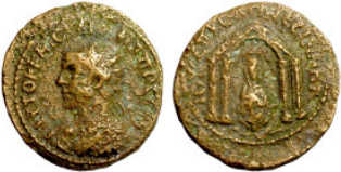
422 Roman Imperial Bronze 25mm 10,31g