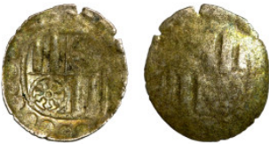
52 Schüsselpfennig around 1500