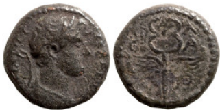
1097 Roman coin Bronze 1-4 Century AC 13mm 2,83g