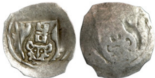
67 Austria Medieval coin 16mm 0,45g