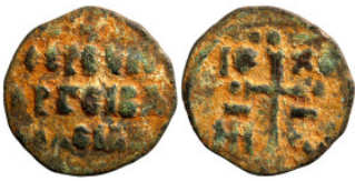
1269 Byzantine Empire coin 22mm 3,54g