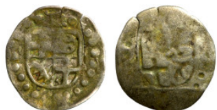
44 Schüsselpfennig around 1500