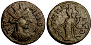
404 Roman Imperial Bronze 17mm 3,54g