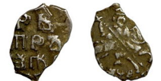
70 Ptropfkopeke Russian coin