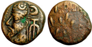
414 Roman Imperial Bronze 15mm 2,87g