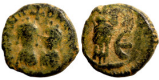
1328 Byzantine Empire coin 11mm 1,95g