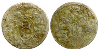
14 4 Heller 1594 Hessen-Kassel 17mm 1,21g