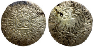
1 Groschen Medieval coin 26mm 2,61g