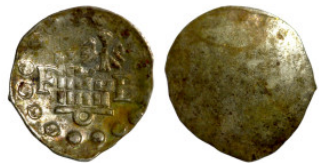
66 Schüsselpfennig arround 1500