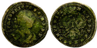
12 4 Pfennige 1700 15mm 0,58g