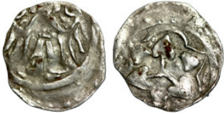
16 Dreier 1602 Hildesheim 14mm 0,56g