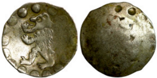
58 Schüsselpfennig arround 1500