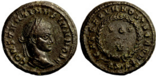
408 Roman Imperial Bronze 19mm 3,31g