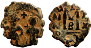
1048 Byzantine Empire 26mm 8,70g