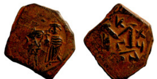
1286 Byzantine Empire coin 22mm 3,09g