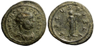
436 Roman Imperial Bronze 23mm 4,14g