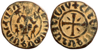
1270 Medieval coin 29mm 6,62g