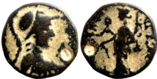
1433 Greek coins Bronze 1-4 Century BC 19mm 4,00g