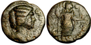
400 Roman Imperial Bronze 20mm 4,69g