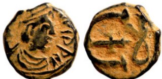
1321 Byzantine Empire coin 14mm 1,86g