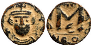
1068 Byzantine Empire 16mm 1,49g