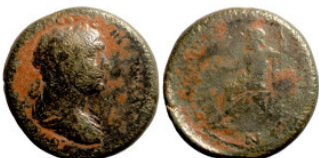
427 Roman Imperial Bronze 25mm 12,50g