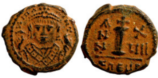
1311 Byzantine Empire coin 15mm 2,41g