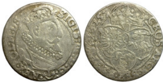
2 6 Gröschler Sigismund III Wasa 1625 25mm 3,68g