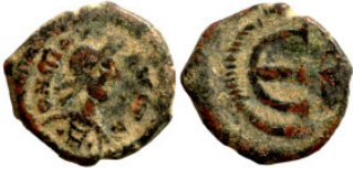
1317 Byzantine Empire coin 12mm 2,01g