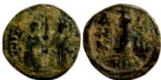
1307 Byzantine Empire coin 16mm 2,90g