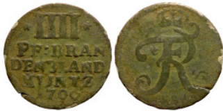
11 Solidus Uncertain 17mm 0,66g