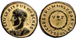
241 Crispus, 316-326 AD Bronze Follis 18mm 3,20g