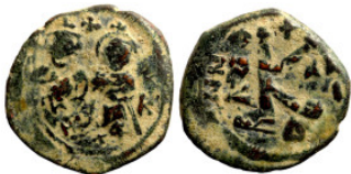
1049 Byzantine Empire 24mm 5,53g