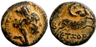
1431 Greek coins Bronze 1-4 Century BC 16mm 4,81g