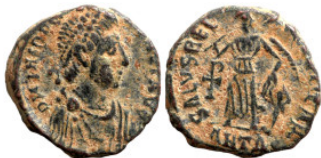
1098 Roman coin Bronze 1-4 Century AC 12mm 1,25g