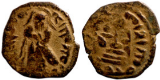
1065 Byzantine Empire 18mm 2,08g