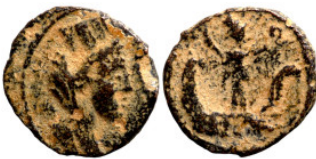
1115 Roman coin Bronze 1-4 Century AC 10mm 0,50g