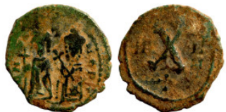
1308 Byzantine Empire coin 15mm 1,97g