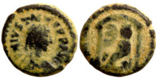
1315 Byzantine Empire coin 13mm 2,87g