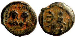
1329 Byzantine Empire coin 11mm 2,14g