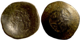
1283 Byzantine Empire coin 28mm 4,40g