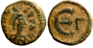
1323 Byzantine Empire coin 12mm 1,77g