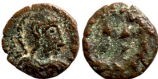
1117 Roman coin Bronze 1-4 Century AC 8mm 0,39g