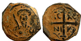
1275 Byzantine Empire coin 21mm 3,42g