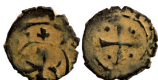
1280 Medieval coin 12mm 0,47g