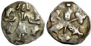
17 Denar Brandenburg Medieval German coin 13mm 0,54g