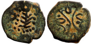
1092 Roman coin Bronze 1-4 Century AC 15mm 1,69g