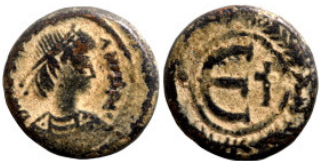
1069 Byzantine Empire 14mm 3,17g