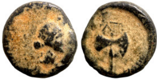
1085 Roman coin Bronze 1-4 Century AC 15mm 3,38g