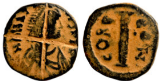
1314 Byzantine Empire coin 15mm 2,17g