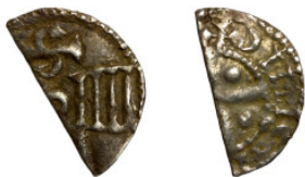
40 Medieval half coin