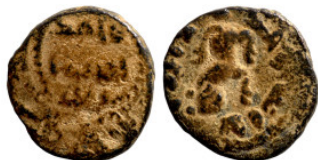
1350 Islamic coin 16mm 2,25g