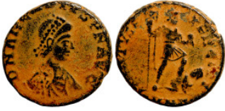
239 Roman Coin 20mm 4,84g