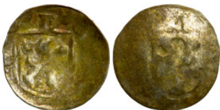
42 Schüsselpfennig arround 1500