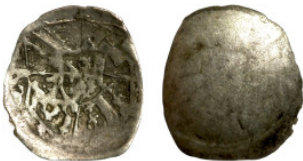
54 Schüsselpfennig around 1500