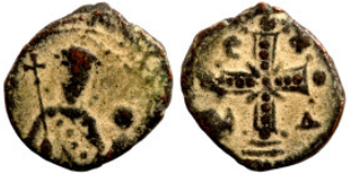
1310 Byzantine Empire coin 19mm 3,23g