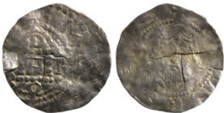
27 Medieval German coin Braunschweig 19mm 0,95g