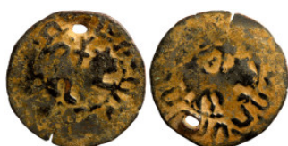
1278 Medieval German coin Braunschweig 20mm 1,58g