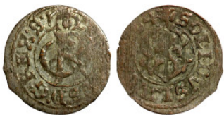
5 Solidus Polen Unter Schweden 16mm 0,45g