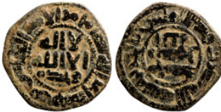
1340 Islamic coin 21mm 2,72g