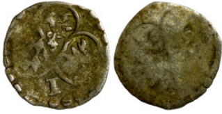
64 Schüsselpfennig arround 1500