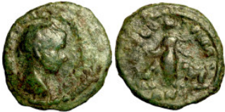
394 Roman Imperial Bronze 21mm 3,43g