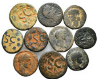
633 Roman Provincial Coins Group Lot