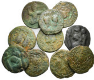
673 Islamic. Artuqids of Mardin Coins Group Lot