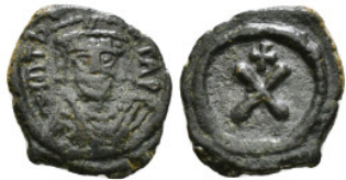
1522 Byzantine Coin AE Follis 3,28 g - 21,29 mm