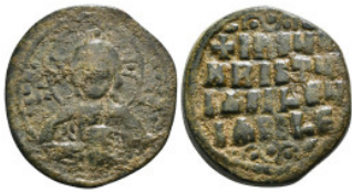
470 Byzantine Coin AE Follis. 17,01 g - 31,61 mm