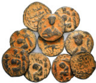
670 Islamic. Artuqids of Mardin Coins Group Lot