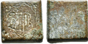
623 Byzantine Weight AE 8,64 g - 14,77 mm