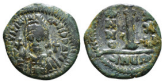
1521 Byzantine Coin AE Follis 4,62 g - 19,70 mm