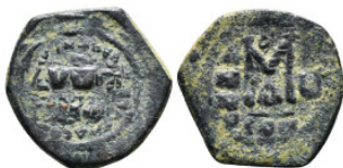
1117 Byzantine Coin Follis AE 11,75 g - 28,60 mm