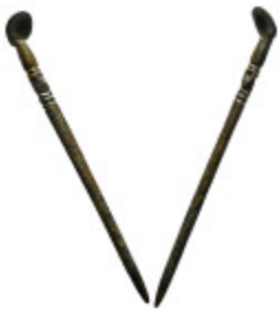
612 Collectible Item Ancient Roman Medical Spoon 3,04 g