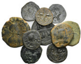
657 Byzantine Coins Group Lot