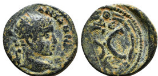
1239 Roman Provincial Coin AE 4,01 g - 18,84 mm