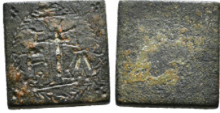
616 Byzantine Weight AE 25,69 g - 23,92 mm