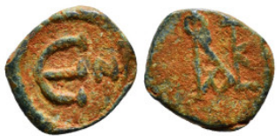
1529 Byzantine Coin AE Follis 1,94 g - 12,85 mm