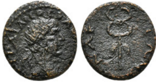
147 Roman Provincial Coin AE 2,53 g - 15,79 mm