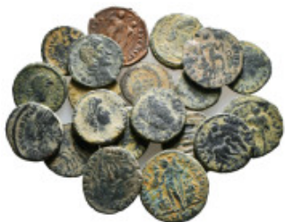
650 ROMAN IMPERIAL COINS Coins Group Lot