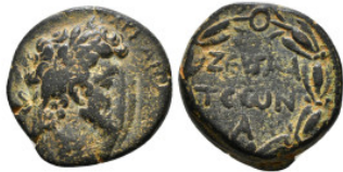
176 Roman Provincial Coin AE 8,68 g - 19,61 mm