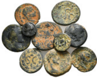
634 Roman Provincial Coins Group Lot