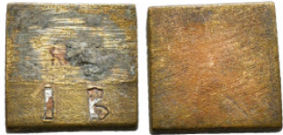
617 Byzantine Weight AE 11,55 g - 18,59 mm