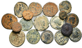
1630 Roman Imperial Coins Group Lot