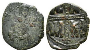
1558 Byzantine Coin AE Follis 5,93 g - 25,36 mm