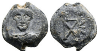
562 Byzantine Lead Seal 10,38 g - 21,17 mm