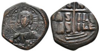
462 Byzantine Coin AE Follis. 12,19 g - 25,94 mm