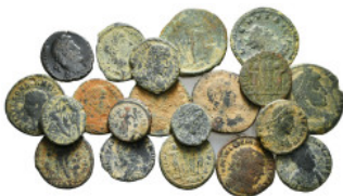
636 ROMAN IMPERIAL COINS Coins Group Lot