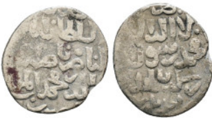
1189 Islamic Coin AR Silver 2,86 g - 17,54 mm