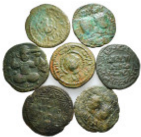
1639 Artuqid Coins Group Lot