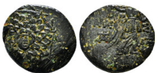
688 PONTOS. Amisos. Ae (Circa 85-65 BC). Time of Mithradates VI Eupator. Obv: Aegis facing. Rev: AMIΣOY. Nike advancing right with shouldered palm branch; star and crescent to upper right, monogram to lower right. 7,54 g - 19,79 mm