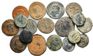
1632 Roman Imperial Coins Group Lot