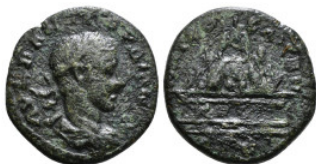
1248 Roman Provincial Coin AE 8,78 g - 24,61 mm