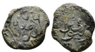
575 Islamic Lead Seal 8,91 g - 21,71 mm