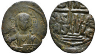
1539 Byzantine Coin AE Follis 5,49 g - 23,25 mm