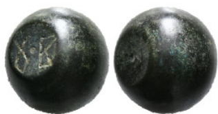
614 Byzantine Weight AE 53,79 g - 19,26 mm