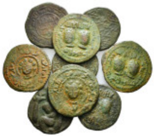
1638 Artuqids Coins Group Lot