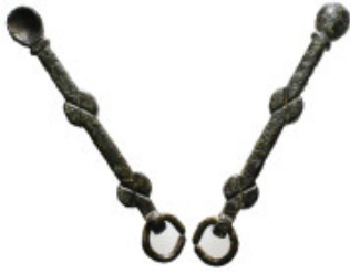
610 Collectible Item Ancient Roman Medical Spoon 4,59 g