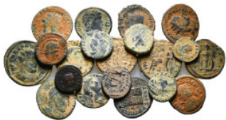
1627 Roman Imperial Coins Group Lot