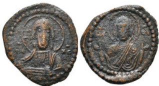
479 Byzantine Coin AE Follis. 8,90 g - 27,80 mm