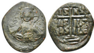
1123 Byzantine Coin Follis AE 10,19 g - 27,27 mm