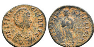
1467 ROMAN IMPERIAL COINS Coin AE Follis 4,52 g - 21,72 mm 1