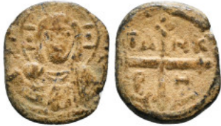
1180 Byzantine Coin Follis AE 3,36 g - 19,68 mm