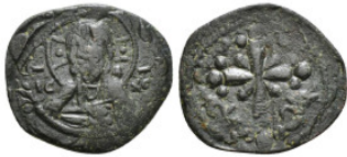
1549 Byzantine Coin AE Follis 3,03 g - 23,17 mm