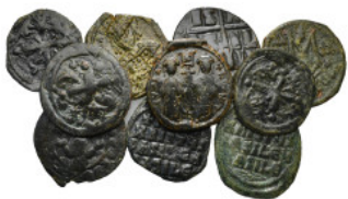
656 Byzantine Coins Group Lot