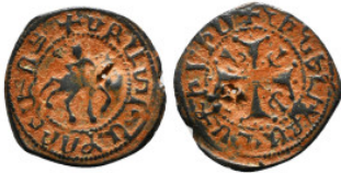
1183 Medieval Coin AE 2,48 g - 19,59 mm