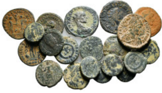
646 ROMAN IMPERIAL COINS Coins Group Lot