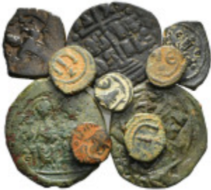
659 Byzantine Coins Group Lot