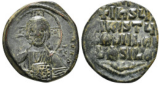
460 Byzantine Coin AE Follis. 10,53 g - 27,10 mm