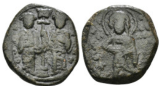
455 Byzantine Coin AE Follis. 11,67 g - 25,99 mm