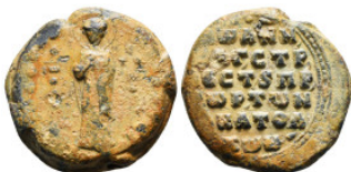
555 Byzantine Lead Seal 31,44 g - 28,27 mm