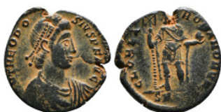
1464 ROMAN IMPERIAL COINS Coin AE Follis 4,10 g - 21,52 mm 1