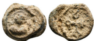
571 Byzantine Lead Seal 5,83 g - 17,27 mm