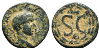
1241 Roman Provincial Coin AE 4,69 g - 17,95 mm