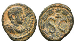
187 Roman Provincial Coin AE 6,01 g - 18,42 mm