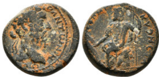
165 Roman Provincial Coin AE 10,86 g - 20,50 mm