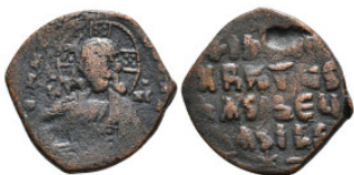
477 Byzantine Coin AE Follis. 9,53 g - 25,71 mm