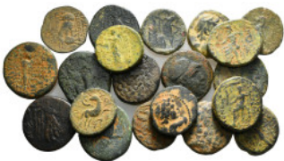
628 GREEK COINS Coins Group Lot