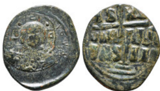
1127 Byzantine Coin Follis AE 12,68 g - 28,66 mm