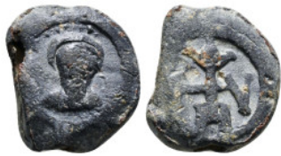
565 Byzantine Lead Seal 9,93 g - 19,20 mm