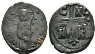
485 Byzantine Coin AE Follis. 7,87 g - 27,40 mm