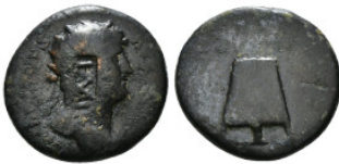
150 Roman Provincial Coin AE 4,51 g - 17,35 mm