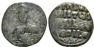
466 Byzantine Coin AE Follis. 9,03 g - 25,70 mm