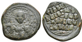
1548 Byzantine Coin AE Follis 11,46 g - 26,58 mm