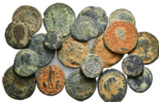
638 ROMAN IMPERIAL COINS Coins Group Lot