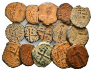
676 Medieval Crusaders. Principality of Antioch Coins Group Lot