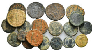
639 ROMAN IMPERIAL COINS Coins Group Lot