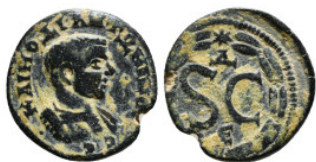
1247 Roman Provincial Coin AE 4,42 g - 18,95 mm