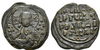
465 Byzantine Coin AE Follis. 8,09 g - 26,17 mm