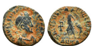
1466 ROMAN IMPERIAL COINS Coin AE Follis 1,09 g - 12,84 mm 1