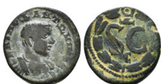
184 Roman Provincial Coin AE 5,87 g - 19,75 mm