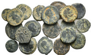
645 ROMAN IMPERIAL COINS Coins Group Lot