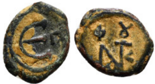
1526 Byzantine Coin AE Follis 1,93 g - 13,25 mm