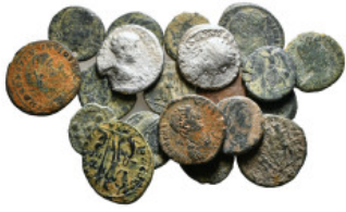
652 ROMAN IMPERIAL COINS Coins Group Lot