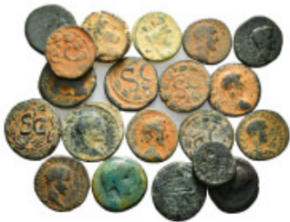
632 Roman Provincial Coins Group Lot