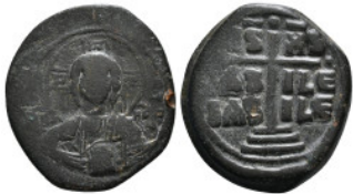
461 Byzantine Coin AE Follis. 12,19 g - 26,44 mm