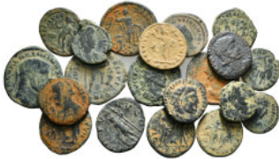
635 ROMAN IMPERIAL COINS Coins Group Lot