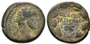
163 Roman Provincial Coin AE 10,57 g - 20,96 mm