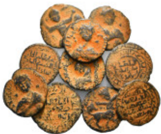
666 Islamic. Artuqids of Mardin Coins Group Lot