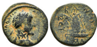
180 Roman Provincial Coin AE 8,28 g - 20,63 mm