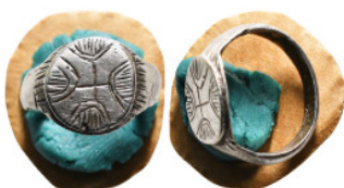
578 ANCIENT BYZANTINE SILVER RING (5TH-8 TH). 5,64 g - 19,90 mm