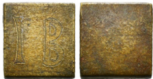
619 Byzantine Weight AE 13,78 g - 18,66 mm