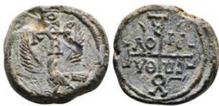
556 Byzantine Lead Seal 18,11 g - 23,91 mm