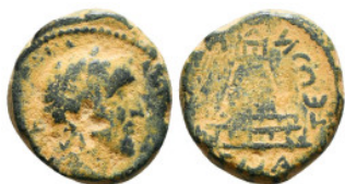
916 Roman Provincial Coin AE 10,17 g - 19,14 mm