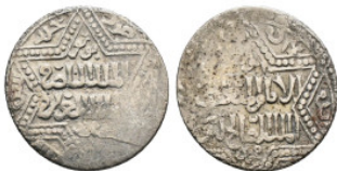
1185 Islamic Coin AR Silver 2,87 g - 20,01 mm