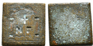
621 Byzantine Weight AE 12,14 g - 19,46 mm