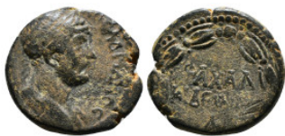
914 Roman Provincial Coin AE 8,43 g - 23,09 mm