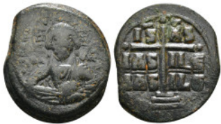
475 Byzantine Coin AE Follis. 11,35 g - 25,24 mm