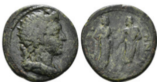
167 Roman Provincial Coin AE 7,45 g - 22,62 mm