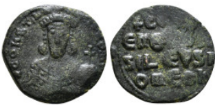
1531 Byzantine Coin AE Follis 6,12 g - 24,84 mm