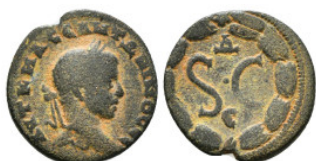
185 Roman Provincial Coin AE 3,07 g - 18,75 mm