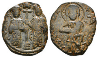
483 Byzantine Coin AE Follis. 7,10 g - 22,00 mm