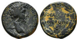
179 Roman Provincial Coin AE 9,26 g - 21,32 mm