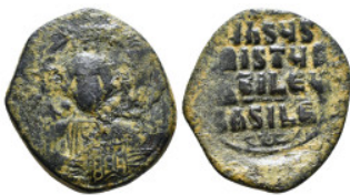
1541 Byzantine Coin AE Follis 10,63 g - 26,52 mm