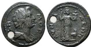
166 Roman Provincial Coin AE 8,91 g - 27,18 mm