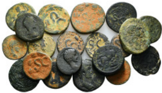
631 Roman Provincial Coins Group Lot