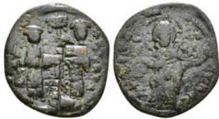
1553 Byzantine Coin AE Follis 6,36 g - 26,30 mm