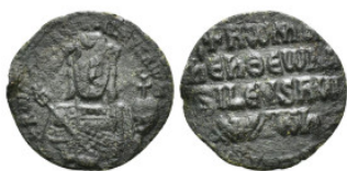
1118 Byzantine Coin Follis AE 3,76 g - 24,13 mm