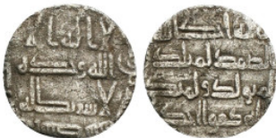
1191 Islamic Coin AR Silver 0,72 g - 16,84 mm