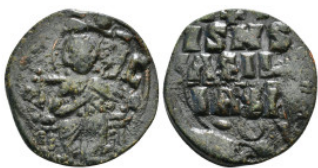
486 Byzantine Coin AE Follis. 7,87 g - 27,00 mm