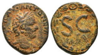
182 Roman Provincial Coin AE 7,43 g - 21,42 mm