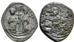
1551 Byzantine Coin AE Follis 8,03 g - 29,41 mm