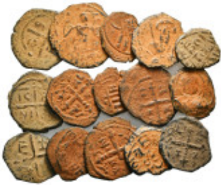
679 Medieval Crusaders. Principality of Antioch Coins Group Lot 1