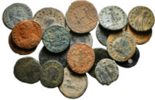
647 ROMAN IMPERIAL COINS Coins Group Lot