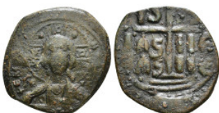
1545 Byzantine Coin AE Follis 13,39 g - 28,21 mm