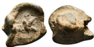
573 Lead Ticket 6,95 g - 19,50 mm