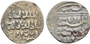
1190 Islamic Coin AR Silver 2,99 g - 17,83 mm