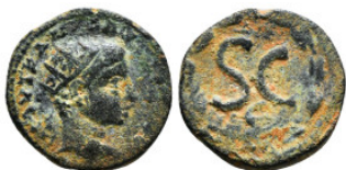
1240 Roman Provincial Coin AE 6,12 g - 18,36 mm