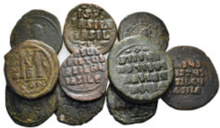
655 Byzantine Coins Group Lot