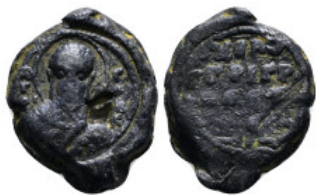
566 Byzantine Lead Seal 10,23 g - 18,88 mm