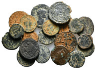
654 ROMAN IMPERIAL COINS Coins Group Lot