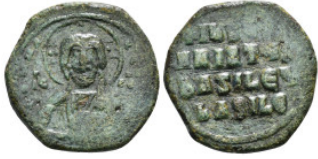
467 Byzantine Coin AE Follis. 11,44 g - 28,05 mm