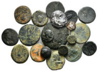
630 GREEK COINS Coins Group Lot