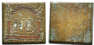
618 Byzantine Weight AE 8,80 g - 17,21 mm