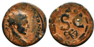
1243 Roman Provincial Coin AE 4,13 g - 18,36 mm