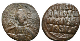
1126 Byzantine Coin Follis AE 9,80 g - 25,50 mm