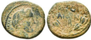
162 Roman Provincial Coin AE 8,07 g - 23,00 mm