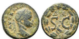
186 Roman Provincial Coin AE 5,38 g - 18,90 mm