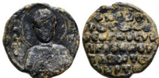
557 Byzantine Lead Seal 10,66 g - 23,24 mm