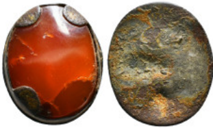
580 Red Gemstone (Ring stone) 10,40 g - 25,22 mm