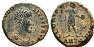
1462 ROMAN IMPERIAL COINS Coin AE Follis 5,80 g - 19,50 mm 1