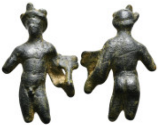
582 Roman bronze figure of Hermes (1st century BC - AD 1st century) Bronze figure of Hermes 61,23 g - 62x39 mm