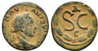
1237 Roman Provincial Coin AE 4,12 g - 18,45 mm