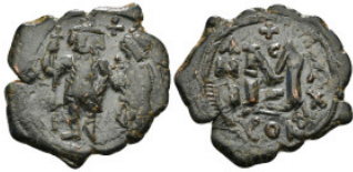
454 Byzantine Coin AE Follis. 10,80 g - 27,29 mm