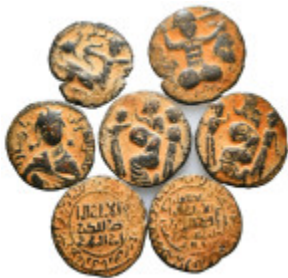
1640 Artuqid Coins Group Lot