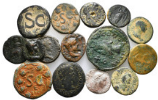
1626 Roman Provincial Coins Group Lot