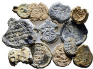
1643 Byzantine lead seals Group Lot