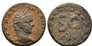
183 Roman Provincial Coin AE 8,02 g - 22,03 mm