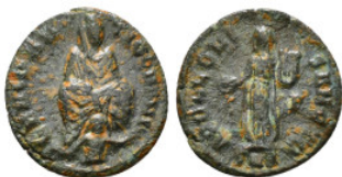
153 Roman Provincial Coin AE 1,32 g - 15,64 mm