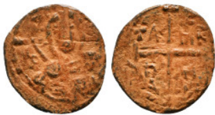
1181 Byzantine Coin Follis AE 1,62 g - 18,61 mm