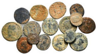
1633 Roman Imperial Coins Group Lot