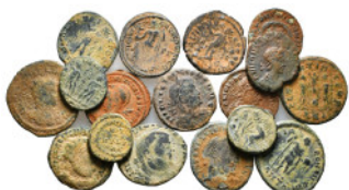
1629 Roman Imperial Coins Group Lot