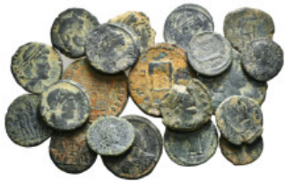
642 ROMAN IMPERIAL COINS Coins Group Lot