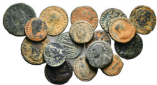
1628 Roman Imperial Coins Group Lot