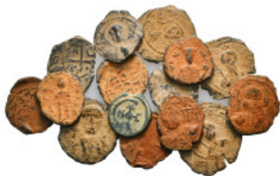
675 Medieval Crusaders. Principality of Antioch Coins Group Lot