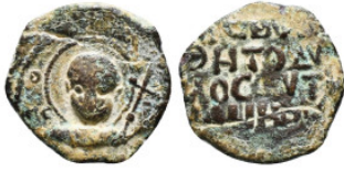
1179 Byzantine Coin Follis AE 2,60 g - 18,82 mm