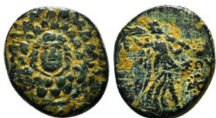
687 PONTOS. Amisos. Ae (Circa 85-65 BC). Time of Mithradates VI Eupator. Obv: Aegis facing. Rev: AMIΣOY. Nike advancing right with shouldered palm branch; star and crescent to upper right, monogram to lower right. 6,65 g - 20,71 mm