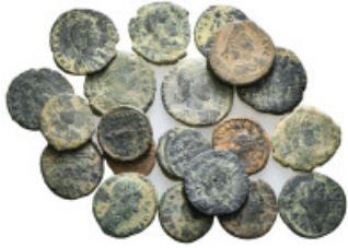
640 ROMAN IMPERIAL COINS Coins Group Lot