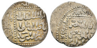
551 Islamic Coin AR Silver. 2,94 g - 20,80 mm