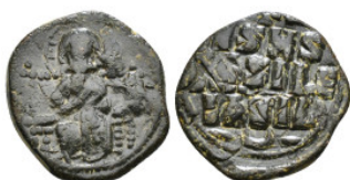
1557 Byzantine Coin AE Follis 8,48 g - 25,65 mm