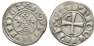
552 Medieval Coin AR Silver 0,88 g - 17,10 mm