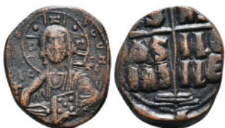
476 Byzantine Coin AE Follis. 12,56 g - 27,10 mm