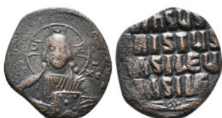
1121 Byzantine Coin Follis AE 9,65 g - 25,75 mm