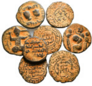
1641 Artuqid Coins Group Lot