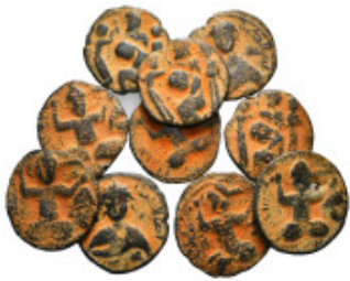
664 Islamic. Artuqids of Mardin Coins Group Lot