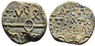
558 Byzantine Lead Seal 12,58 g - 21,50 mm