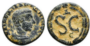
1245 Roman Provincial Coin AE 3,40 g - 17,06 mm