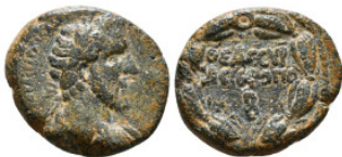
164 Roman Provincial Coin AE 10,57 g - 20,49 mm