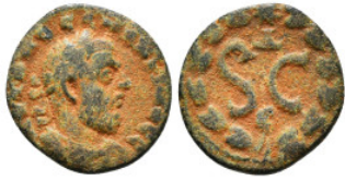
168 Roman Provincial Coin AE 2,79 g - 17,99 mm