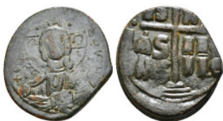
1555 Byzantine Coin AE Follis 10,67 g - 26,75 mm