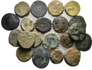
629 GREEK COINS Coins Group Lot