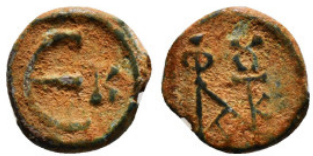
1528 Byzantine Coin AE Follis 2,12 g - 12,91 mm