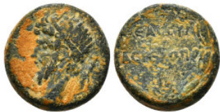
178 Roman Provincial Coin AE 10,27 g - 20,30 mm