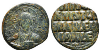
1124 Byzantine Coin Follis AE 9,65 g - 27,65 mm