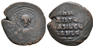
478 Byzantine Coin AE Follis. 13,09 g - 34,33 mm