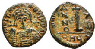
1520 Byzantine Coin AE Follis 4,98 g - 19,78 mm