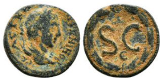
1246 Roman Provincial Coin AE 4,76 g - 19,52 mm