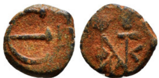
1527 Byzantine Coin AE Follis 1,82 g - 12,88 mm