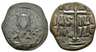
472 Byzantine Coin AE Follis. 10,37 g - 29,03 mm