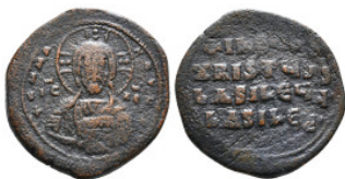
1128 Byzantine Coin Follis AE 14,03 g - 29,52 mm