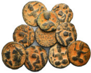
663 Islamic. Artuqids of Mardin Coins Group Lot