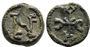
563 Byzantine Lead Seal 14,20 g - 20,64 mm