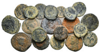
643 ROMAN IMPERIAL COINS Coins Group Lot