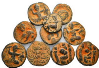
662 Islamic. Artuqids of Mardin Coins Group Lot