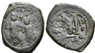
1552 Byzantine Coin AE Follis 11,33 g - 30,15 mm