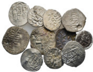
685 ISLAMIC COINS GROUP LOT