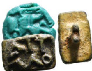
576 Seal and Weight AE Early Byzantine bread-stamp (AD 5th-7th centuries) Bronze almond shaped bread-stamp 15,16 g - 27,70 mm