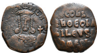
1530 Byzantine Coin AE Follis 13,33 g - 25,39 mm