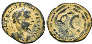
170 Roman Provincial Coin AE 4,49 g - 20,23 mm