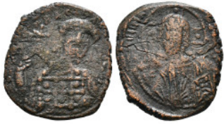
481 Byzantine Coin AE Follis. 9,28 g - 24,35 mm