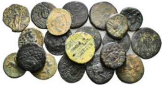
1624 GREEK COINS Coins Group Lot