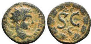
1238 Roman Provincial Coin AE 5,52 g - 18,47 mm