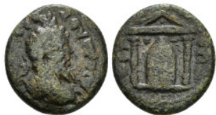
181 Roman Provincial Coin AE 5,04 g - 18,07 mm