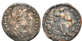
1465 ROMAN IMPERIAL COINS Coin AE Follis 2,44 g - 17,78 mm 1