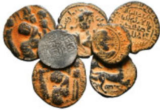
1642 Artuqid Coins Group Lot