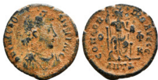
1463 ROMAN IMPERIAL COINS Coin AE Follis 2,30 g - 18,62 mm 1