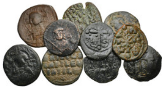
658 Byzantine Coins Group Lot