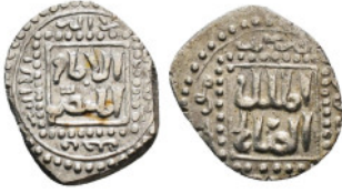
1186 Islamic Coin AR Silver 1,48 g - 15,50 mm