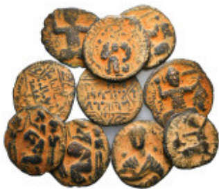
671 Islamic. Artuqids of Mardin Coins Group Lot