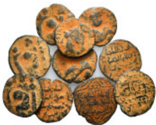
667 Islamic. Artuqids of Mardin Coins Group Lot