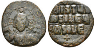
1546 Byzantine Coin AE Follis 7,21 g - 25,75 mm