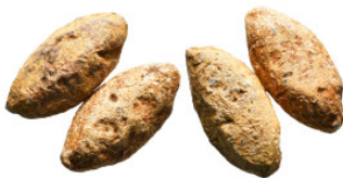
613 Collectible Item PB GREEK COINS sling bullets 61,50 g