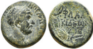
148 Roman Provincial Coin AE 13,19 g - 21,26 mm