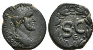
915 Roman Provincial Coin AE 17,28 g - 23,31 mm