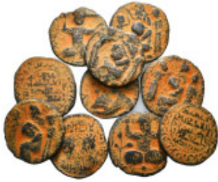
668 Islamic. Artuqids of Mardin Coins Group Lot