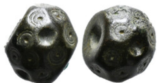
615 Byzantine Weight AE 28,60 g - 15,17 mm