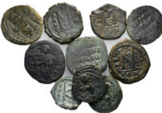
661 Byzantine Coins Group Lot