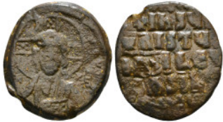
468 Byzantine Coin AE Follis. 10,95 g - 26,53 mm