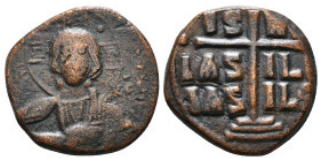
463 Byzantine Coin AE Follis. 10,07 g - 24,36 mm