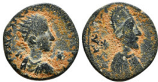
1242 Roman Provincial Coin AE 9,04 g - 20,21 mm