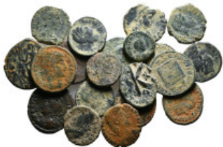
649 ROMAN IMPERIAL COINS Coins Group Lot