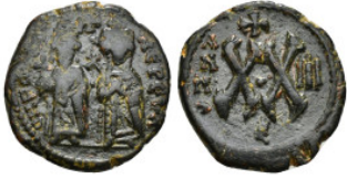
1525 Byzantine Coin AE Follis 4,62 g - 19,67 mm