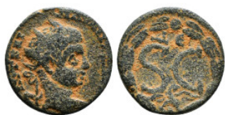
1244 Roman Provincial Coin AE 4,69 g - 18,54 mm