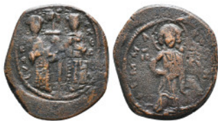
1116 Byzantine Coin Follis AE 9,53 g - 28,66 mm