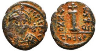
1519 Byzantine Coin AE Follis 3,53 g - 17,35 mm