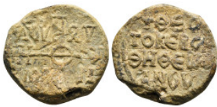
560 Byzantine Lead Seal 16,44 g - 26,24 mm