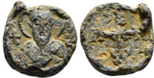
559 Byzantine Lead Seal 12,14 g - 21,67 mm