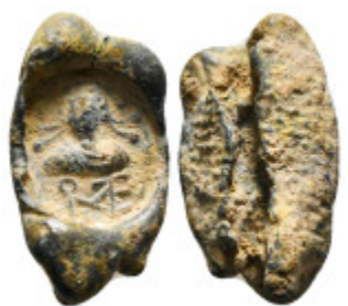
570 Byzantine Lead Seal 4,74 g - 22,95 mm