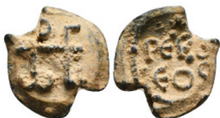
569 Byzantine Lead Seal 4,92 g - 19,65 mm