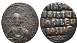
1125 Byzantine Coin Follis AE 11,37 g - 30,20 mm