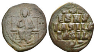
1556 Byzantine Coin AE Follis 9,50 g - 28,69 mm