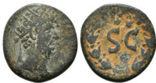
177 Roman Provincial Coin AE 8,28 g - 21,90 mm