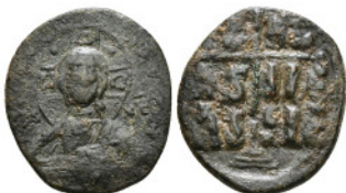
1544 Byzantine Coin AE Follis 10,08 g - 28,45 mm