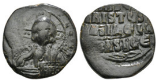
469 Byzantine Coin AE Follis. 8,88 g - 26,32 mm