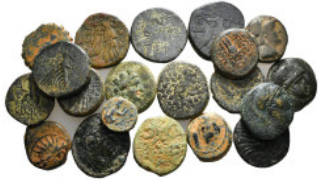
1623 GREEK COINS Coins Group Lot