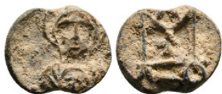
567 Byzantine Lead Seal 4,13 g - 14,20 mm