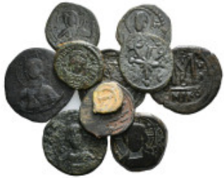
1637 Byzantine Coins Group Lot