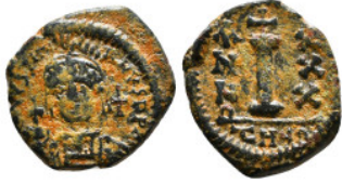
1518 Byzantine Coin AE Follis 5,13 g - 19,50 mm