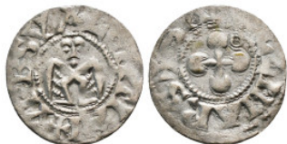
554 Medieval Coin AR Silver 1,09 g - 17,91 mm