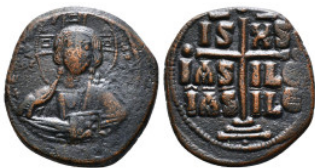
1542 Byzantine Coin AE Follis 11,66 g - 28,00 mm