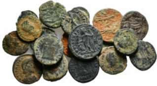
653 ROMAN IMPERIAL COINS Coins Group Lot