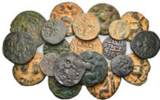
674 Islamic. Artuqids of Mardin Coins Group Lot