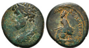
174 Roman Provincial Coin AE 9,27 g - 21,36 mm