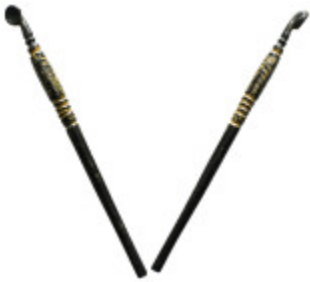
611 Collectible Item Ancient Roman Medical Spoon 4,40 g