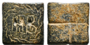
622 Byzantine Weight AE 7,99 g - 15,59 mm