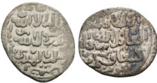
1188 Islamic Coin AR Silver 2,39 g - 20,85 mm