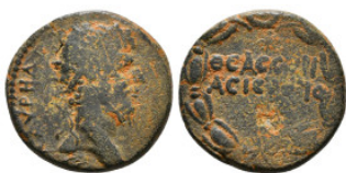
173 Roman Provincial Coin AE 8,28 g - 21,00 mm