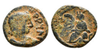
1468 ROMAN IMPERIAL COINS Coin AE Follis 2,34 g - 12,92 mm 1