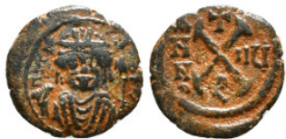
1523 Byzantine Coin AE Follis 2,71 g - 17,97 mm