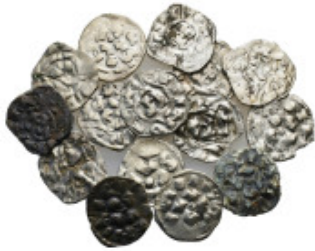
684 MEDIEVAL COINS GROUP LOT