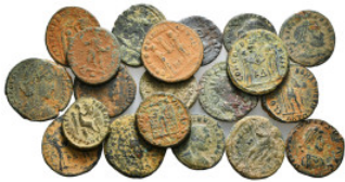
644 ROMAN IMPERIAL COINS Coins Group Lot