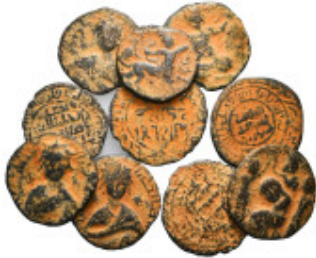
669 Islamic. Artuqids of Mardin Coins Group Lot