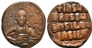
464 Byzantine Coin AE Follis. 10,97 g - 29,06 mm