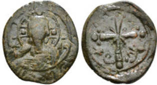
1547 Byzantine Coin AE Follis 7,43 g - 25,65 mm