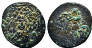
686 PONTOS. Amisos. Ae (Circa 85-65 BC). Time of Mithradates VI Eupator. Obv: Aegis facing. Rev: AMIΣOY. Nike advancing right with shouldered palm branch; star and crescent to upper right, monogram to lower right. 7,23 g - 23,20 mm