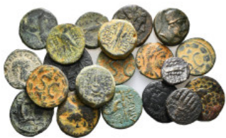
1625 GREEK COINS Coins Group Lot