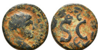
188 Roman Provincial Coin AE 5,34 g - 18,03 mm