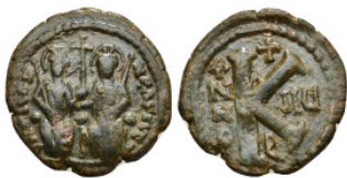
1524 Byzantine Coin AE Follis 7,15 g - 23,22 mm