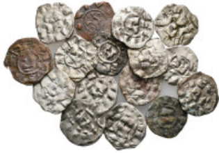
683 MEDIEVAL COINS GROUP LOT