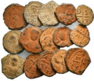
678 Medieval Crusaders. Principality of Antioch Coins Group Lot 1