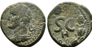
1192 SELEUCIS & PIERIA. Antioch. Antoninus Pius (138-161). Ae. 13,74 g - 24,98 mm