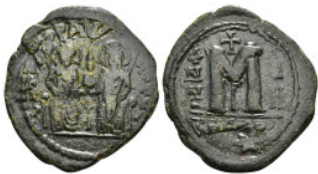
457 Byzantine Coin AE Follis. 12,37 g - 31,72 mm