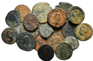
651 ROMAN IMPERIAL COINS Coins Group Lot