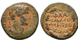
152 Roman Provincial Coin AE 4,42 g - 18,54 mm