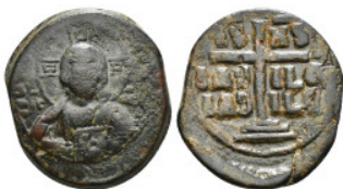
1543 Byzantine Coin AE Follis 11,19 g - 28,74 mm