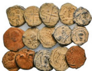
677 Medieval Crusaders. Principality of Antioch Coins Group Lot