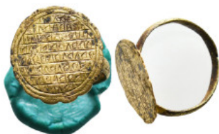
577 Bronze ring 1,94 g - 19,60 mm