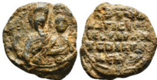
561 Byzantine Lead Seal 15,41 g - 24,74 mm