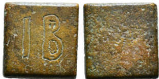
620 Byzantine Weight AE 13,78 g - 19,81 mm