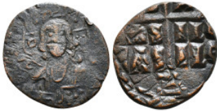
1540 Byzantine Coin AE Follis 7,17 g - 29,48 mm