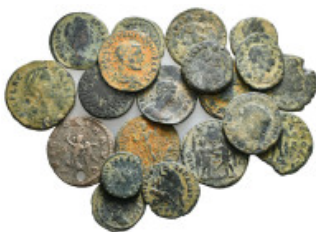
637 ROMAN IMPERIAL COINS Coins Group Lot