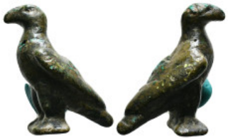
583 Collectible Item Ancient Roman Legion Eagle Statue ! 30,97 g - 35x25 mm