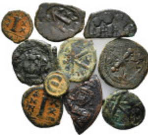
660 Byzantine Coins Group Lot