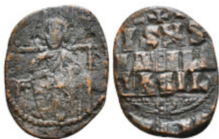
1554 Byzantine Coin AE Follis 7,21 g - 30,31 mm