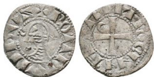
553 Medieval Coin AR Silver 0,72 g - 17,29 mm