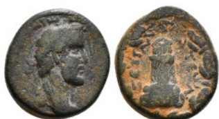
917 Roman Provincial Coin AE 9,50 g - 19,48 mm