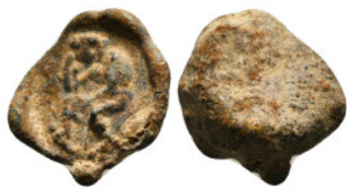
572 Lead Ticket 4,81 g - 16,75 mm