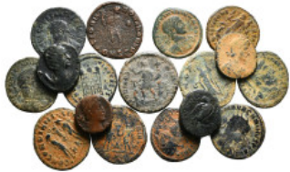
1631 Roman Imperial Coins Group Lot