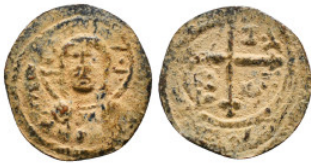
1182 Byzantine Coin Follis AE 1,91 g - 19,81 mm