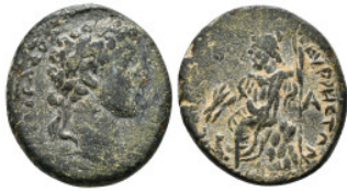
175 Roman Provincial Coin AE 9,13 g - 23,60 mm