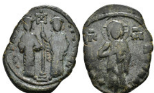
487 Byzantine Coin AE Follis. 6,67 g - 22,22 mm