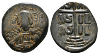
473 Byzantine Coin AE Follis. 9,70 g - 23,50 mm