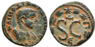
1236 Roman Provincial Coin AE 4,47 g - 18,45 mm