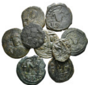
1635 Byzantine Coins Group Lot