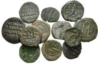
1636 Byzantine Coins Group Lot