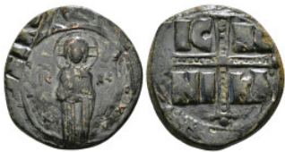
484 Byzantine Coin AE Follis. 10,70 g - 28,90 mm