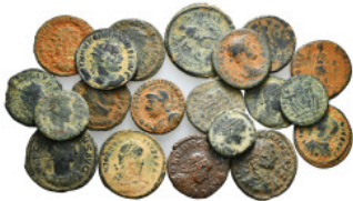
641 ROMAN IMPERIAL COINS Coins Group Lot