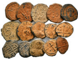
681 Medieval Crusaders. Principality of Antioch Coins Group Lot 1