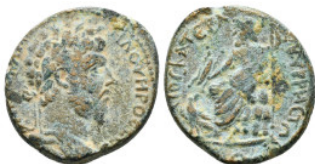
172 Roman Provincial Coin AE 10,25 g - 23,20 mm