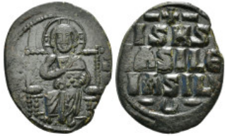
482 Byzantine Coin AE Follis. 8,31 g - 24,95 mm