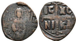
480 Byzantine Coin AE Follis. 6,69 g - 25,71 mm