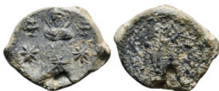
564 Byzantine Lead Seal 12,57 g - 21,40 mm