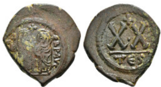
458 Byzantine Coin AE Follis. 6,15 g - 21,14 mm