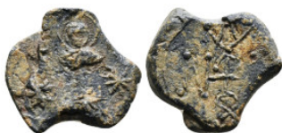
568 Byzantine Lead Seal 7,68 g - 19,20 mm