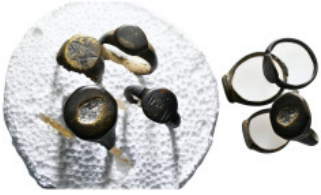
579 Bronze Rings Lot 19,87 g