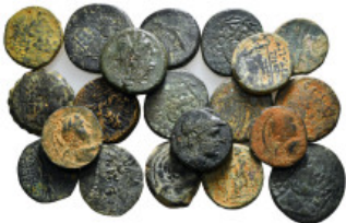
625 GREEK COINS Coins Group Lot