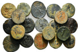
626 GREEK COINS Coins Group Lot