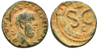
169 Roman Provincial Coin AE 3,55 g - 18,45 mm