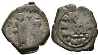
456 Byzantine Coin AE Follis. 10,31 g - 25,56 mm