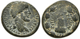
161 Roman Provincial Coin AE 11,35 g - 23,15 mm