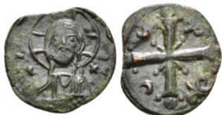
1550 Byzantine Coin AE Follis 3,42 g - 20,25 mm