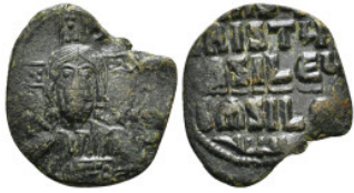
474 Byzantine Coin AE Follis. 5,55 g - 24,22 mm