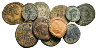
1634 Roman Imperial Coins Group Lot