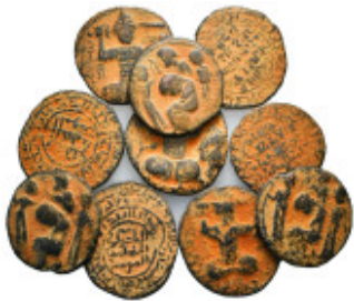
665 Islamic. Artuqids of Mardin Coins Group Lot