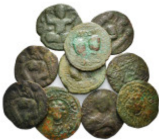
672 Islamic. Artuqids of Mardin Coins Group Lot