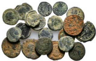
648 ROMAN IMPERIAL COINS Coins Group Lot