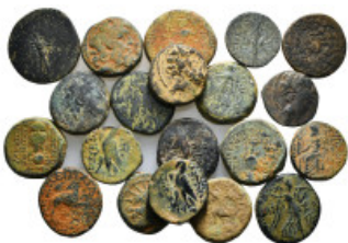
627 GREEK COINS Coins Group Lot