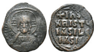
1120 Byzantine Coin Follis AE 7,72 g - 25,45 mm