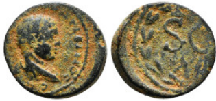
1235 Roman Provincial Coin AE 6,43 g - 18,56 mm