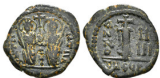
459 Byzantine Coin AE Follis. 2,79 g - 17,80 mm