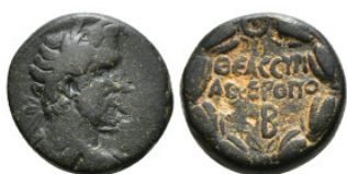
918 Roman Provincial Coin AE 10,67 g - 20,69 mm