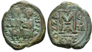
453 Byzantine Coin AE Follis. 14,12 g - 26,58 mm