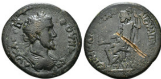
171 Roman Provincial Coin AE 21,76 g - 32,85 mm