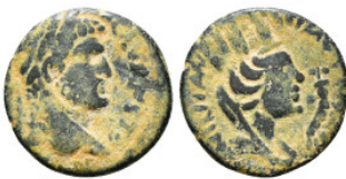
149 Roman Provincial Coin AE 3,49 g - 17,75 mm