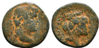
913 Roman Provincial Coin AE 4,69 g - 19,03 mm