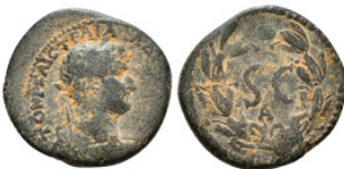
151 Roman Provincial Coin AE 4,72 g - 20,80 mm