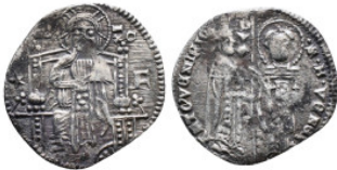
1184 Venetia Coin AR Silver 1,82 g - 20,10 mm