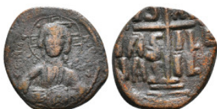
1122 Byzantine Coin Follis AE 8,84 g - 26,56 mm