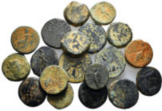
624 GREEK COINS Coins Group Lot