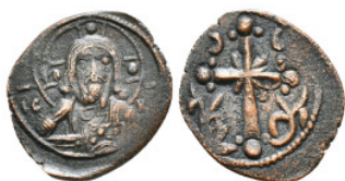
1119 Byzantine Coin Follis AE 3,34 g - 21,44 mm