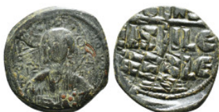
1129 Byzantine Coin Follis AE 11,38 g - 27,52 mm