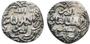
1187 Islamic Coin AR Silver 1,45 g - 12,65 mm