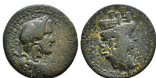
919 Roman Provincial Coin AE 6,64 g - 24,00 mm