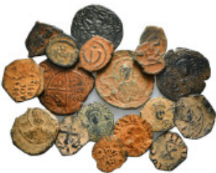
682 Medieval Crusaders. Principality of Antioch Coins Group Lot 1