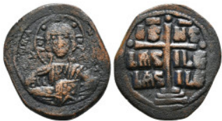
471 Byzantine Coin AE Follis. 8,22 g - 23,26 mm