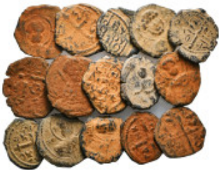
680 Medieval Crusaders. Principality of Antioch Coins Group Lot 1