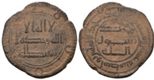
937 Islamic AE 20mm, 2,51g