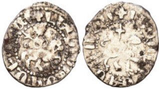
1026 Cilician Armenia uncertain AR 20mm, 2,05g