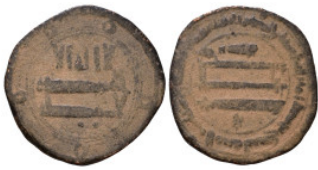
936 Islamic AE 19mm, 1,96g