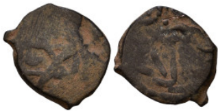
950 Islamic AE 14mm, 1,46g