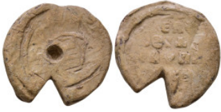
1113 Byzantine lead seal. 20mm, 7,82g