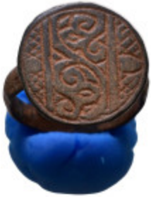
1135 Ancient Ring 17mm, 4,10g