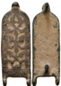
1140 Ancient Object 50mm, 15,31g