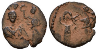
985 Uncertain coin AE 12mm, 0,95g