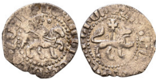
1027 Cilician Armenia uncertain AR 19mm, 2,30g