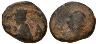
983 Uncertain coin AE 11mm, 1,56g