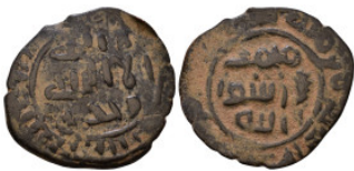
939 Islamic AE 22mm, 2,75g