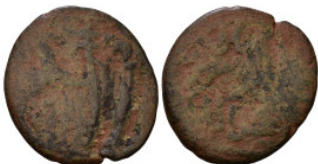
952 Islamic AE 20mm, 3,38g