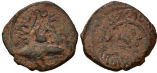
949 Islamic AE 17mm, 2,39g