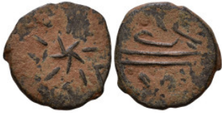
948 Islamic AE 17mm, 2,68g