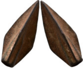
1146 Ancient Arrowhead 31mm, 3,88g