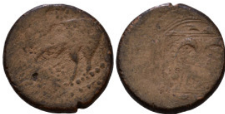
988 Uncertain coin AE 19mm, 5,35g