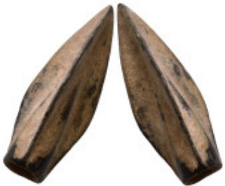
1144 Ancient Arrowhead 27mm, 3,25g