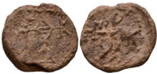
1115 Byzantine lead seal. 23mm, 12,50g