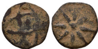
989 Uncertain coin AE 11mm, 0,80g