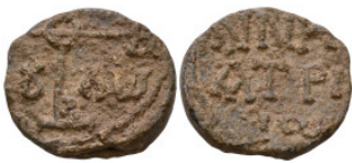
1110 Byzantine lead seal. 22mm, 11,00g