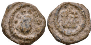
1124 Byzantine lead seal. 17mm, 5,33g