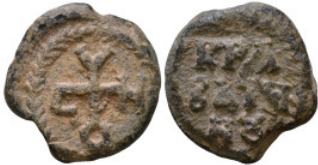
1107 Byzantine lead seal. 18mm, 7,39g