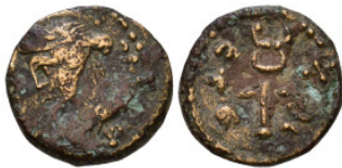
987 Uncertain coin AE 13mm, 1,87g