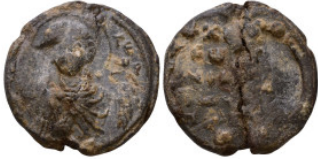
1121 Byzantine lead seal. 20mm, 5,93g