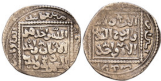
1028 Crusaders. Christian Arabic Dirhams. Dirham AR 21mm, 2,80g, Akka (Acre), 1251. Within a square, 'Allāh wāḥid huwa / al-īmān wāḥid / al-ma'mūdiyya wāḥida' ('God is one, the faith is one, the baptism is one' in Arabic; cf. Ephesians 4:5); in the margin, '[ḍuriba bi 'Akkā sana / alf wa mi'atayn] / aḥad wa khamsīn / [li-tajassud al-masīḥ]' ('Struck in 'Akka in the year 1251 of the incarnation of the Messiah' in Arabic); and two fleurs-de-lys. Rev. Within a square, 'al-ab wa al-ibn / wa al-rūḥ al-qudus / ilāh wāḥid' ('The Father, the Son and the Holy Spirit: One Divinity' in Arabic); in the margin, 'lahū al-majd / [ilā abad / al-abadīn / āmīn āmīn]' ('His is the glory forever and ever, amen, amen' in Arabic) and one fleurs-de-lys. Extremely rare with fleurs-de-lys. The appearance of the fleurs-de-lys on this extremely rare issue is very likely connected to the presence of Louis IX of France in Acre, where he resided in 1250-1251 after his release from Mamluk captivity. Louis was the leader of the Seventh Crusade, during the course of which a large Christian force invaded Egypt in 1249, but he was utterly defeated and captured by the Mamluks in early 1250, who set him and his entourage free after 31 days for a colossal ransom of 200,000 gold bezants.