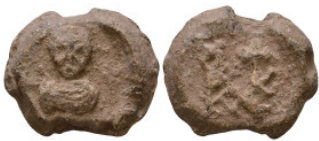
1117 Byzantine lead seal. 19mm, 7,66g