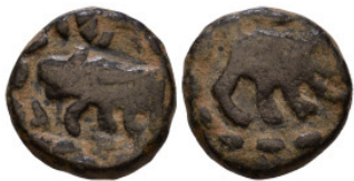
951 Islamic AE 13mm, 3,00g