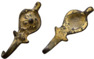
1138 Ancient Object 33mm, 2,44g