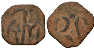
986 Uncertain coin AE 13mm, 0,65g