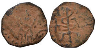
953 Islamic AE 18mm, 1,45g