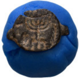
1136 Ancient Ring 12mm, 0,58g