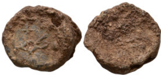
1109 Byzantine lead seal. 21mm, 12,21g