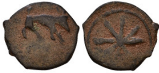
984 Uncertain coin AE 11mm, 0,70g