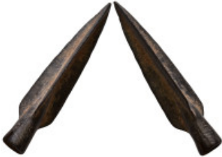
1147 Ancient Arrowhead 34mm, 1,57g