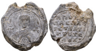
1127 Byzantine lead seal. 29mm, 19,33g