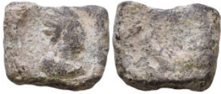
1122 Roman Seal, Circa 2nd-3rd century AD. Radiate and draped bust of Sol r. 16mm 6,00g