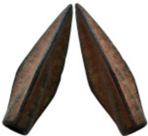
1145 Ancient Arrowhead 28mm, 3,13g