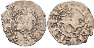
1025 Cilician Armenia uncertain AR 20mm, 2,14g