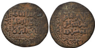
940 Islamic AE 22mm, 2,32g