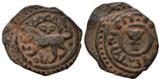
954 Umayyad Caliphate. Anonymous. 7th century Æ Fals. Lion advancing left / Chalice. Cf. Album 162. 19mm, 1,67g