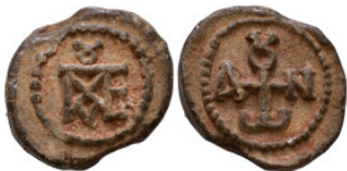
1125 Byzantine lead seal. 17mm, 5,60g