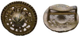
1137 Ancient Object 25mm, 6,65g