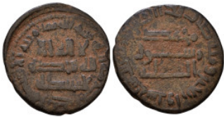
938 Islamic AE 21mm, 2,94g