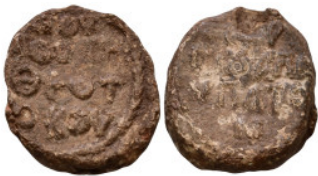
1111 Byzantine lead seal. 20mm, 8,53g