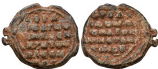
1126 Byzantine lead seal. 23mm, 11,63g