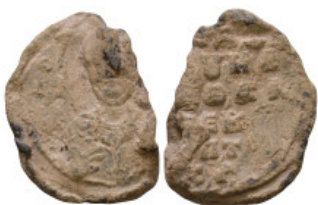
1112 Byzantine lead seal. 18mm, 2,62g