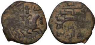
935 Islamic AE 18mm, 2,21g