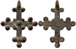
1142 Ancient Object (Cross) 45mm, 7,61g