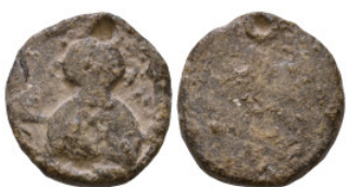
1120 Byzantine lead seal. 14mm 3,91g