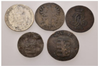
1150 Lot of 5 Coins / Lot as seen no return