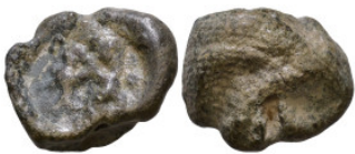
1118 Byzantine lead seal. 18mm, 7,05g