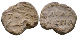
1108 Byzantine lead seal. 20mm, 7,75g