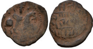
934 Islamic AE 20mm, 1,79g