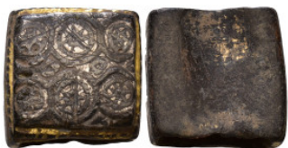
1139 Ancient Object 18mm, 10,47g