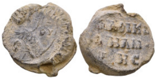
1116 Byzantine lead seal. 18mm, 6,28g