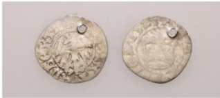
1149 Lot of 2 Coins / Lot as seen no return