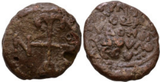
1114 Byzantine lead seal. 25mm, 26,30g