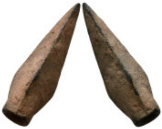
1143 Ancient Arrowhead 30mm, 4,82g