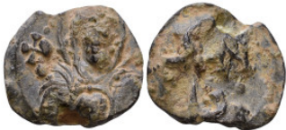
1123 Byzantine lead seal. 18mm 4,03g