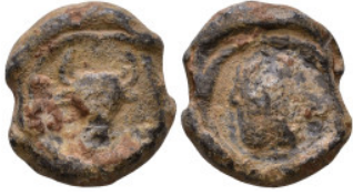
1106 Roman Seal, Circa 2nd-3rd century AD 15mm, 6,71g