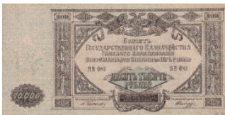
794 Russia 10.000 Rubles (South Russia) Banknote 1919 P-S425 AU