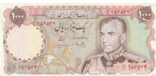
757 Iran 1000 Reals 1974-79 P-105c AU