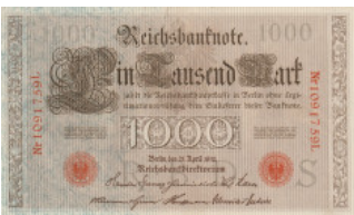
706 Germany 1000 Mark 1910 P-44b.5 R-45g UNC