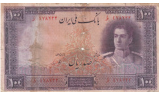
755 Iran 100 Reals 1944 P-44 VG