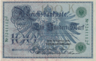
703 Germany 100 Mark 1908 P-34 R-34 UNC