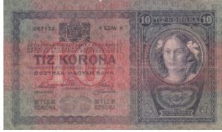
467 Austria 10 Kronen 1904 P-9 VF