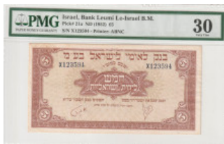
762 Israel Bank Leumi 5 Liro 1952 PMG 30 P-21a VF