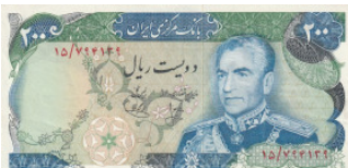
758 Iran 200 Reals 1974-79 P-103a UNC