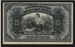
789 Russia 25 Rubles 1918 P-39A; # БЛ273923; VF+