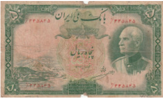
754 Iran 50 Reals 1938 P-35Aa VG