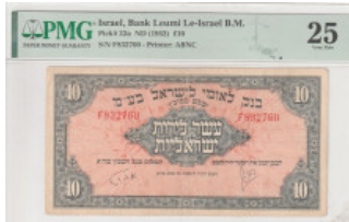
761 Israel Bank Leumi 10 Liro 1952 PMG 25 P-22a VF