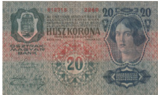
468 Austria 20 Kronen 1913 P-13 VF