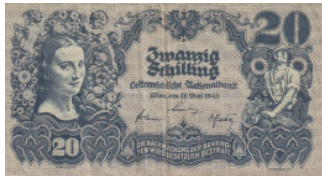
472 Austria 20 Schilling 1945 P-116 VF