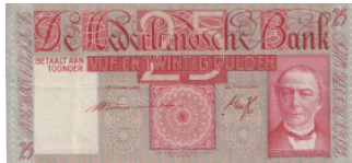
481 Netherlands 25 Gulden 1941 P-49 VF