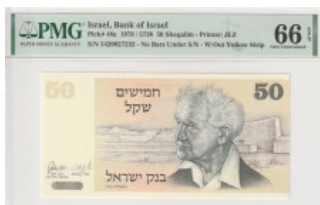
763 Israel 50 Sheqalim 1978 PMG 66 EPQ P-46a UNC