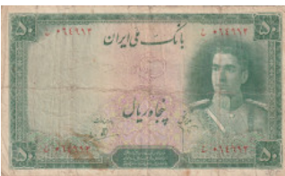
756 Iran 50 Reals 1944 P-42 VG