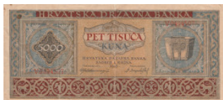
473 Croatia 5000 Kuna 1943 P-13a VF