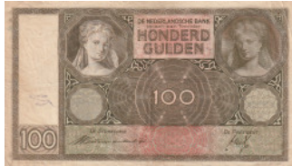
480 Netherlands 100 Gulden 1940 P-51 VF