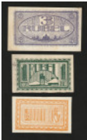
792 Russia, Irkutsk WWI Prisoner of War Camp Offizierslager 1/2 Ruble+1 Ruble+3 Ruble 1918 Kardakov Catalog K13.19.1; K13.19.2; K13.19.3