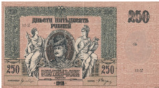
791 Russia Rostov-on-Don 250 Rubles 1918 P-S414 VF\XF