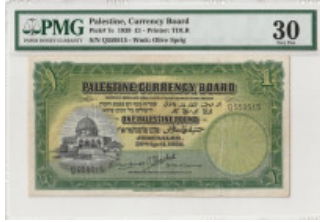
760 Palestine 1 Pound 1939 PMG 30 P-7c Very Fine