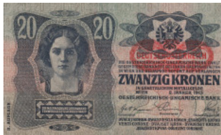
470 Austria 20 Kronen 1919 W/O Stamp P-53a XF\AU