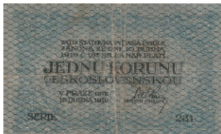
474 Czechoslovakia 1 Koruna 1919 P-6a VF