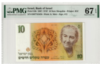
764 Israel 10 New Sheqalim 1987 / 5747 PMG 67 EPQ P-53b; # 0367743456; Superb Gem UNC