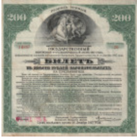
786 Russia Siberia and Ural 200 Rubles 1917 4,5% Loan Bond First Category VF