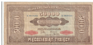
483 Poland 50000 Marek Polskich 1922 P-33 VF