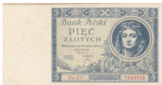
484 Poland 5 Zlotych 1930 P-72 XF