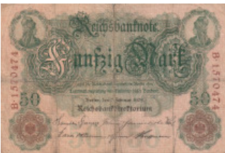
707 Germany 50 Mark 1910 P-32 R-32 VG/F