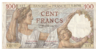
476 France 100 Francs 1941 P-94 VF