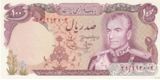
753 Iran 100 Reals 1974-79 P-102a UNC