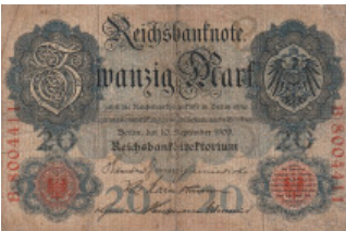
705 Germany 20 Mark 1909 P-37 F