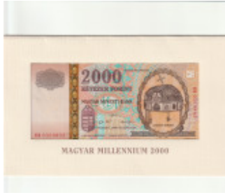
479 Hungary 2000 Forint 2000 P-186 UNC