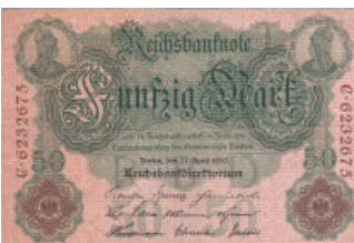
708 Germany 50 Mark 1910 P-41 R-42 VF