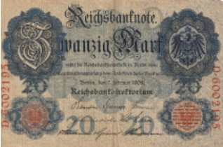
704 Germany 20 Mark 1908 P-31 F/VF