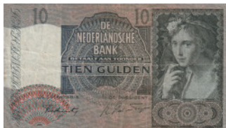
482 Netherlands 10 Gulden 1942 P-56b VF