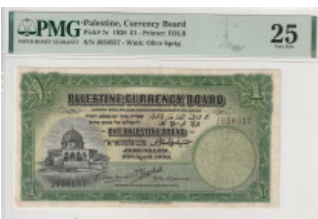
759 Palestine 1 Pound 1939 PMG 25 P-7c Very Fine