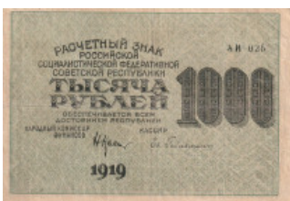
795 Russia 1000 Rubles 1919 P-104 VF