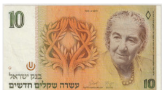
765 Israel 10 New Sheqalim 1992 P-53c VF