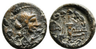
171 Greek Coin AE 3,66 g - 16,47 mm