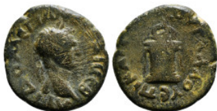
319 Roman Provincial Coin Ae 7,33 g - 23,10 mm