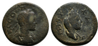
318 Roman Provincial Coin Ae 4,28 g - 16,85 mm