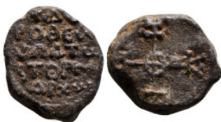
964 Byzantine Lead Seal. 21,85 g - 27,00 mm