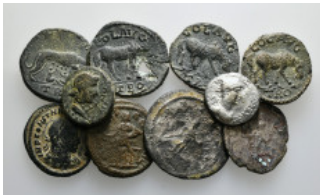
984 Group Lots Roman Provincial Coins