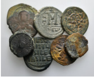
985 Group Lots Byzantine Coins