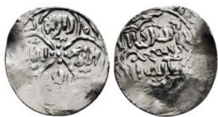
903 Islamic Coin Silver AR 0,78 g - 17,35 mm