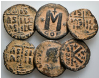
987 Group Lots Byzantine Coins Artificially patinated