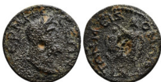
345 Roman Provincial Coin AE 9,10 g - 26,00 mm