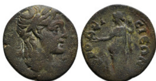
344 Roman Provincial Coin AE 7,81 g - 24,07 mm