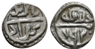
912 Islamic Coin Silver AR 1,09 g - 12,76 mm