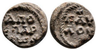
954 Byzantine Lead Seal. 10,62 g - 18,18 mm