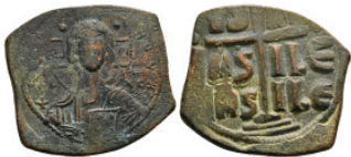
857 Byzantine Coin, ANONYMOUS FOLLIS 12,94 g - 30,68 mm