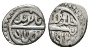
916 Islamic Coin Silver AR 1,24 g - 12,14 mm