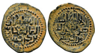
894 Islamic Coin AE 4,67 g - 29,42 mm