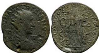
321 Roman Provincial Coin Ae 16,69 g - 33,52 mm