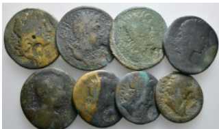
983 Group Lots Roman Provincial Coins