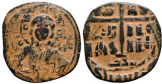
856 Byzantine Coin, ANONYMOUS FOLLIS 10,72 g - 31,21 mm Artificially patinated