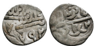
909 Islamic Coin Silver AR 1,11 g - 14,30 mm