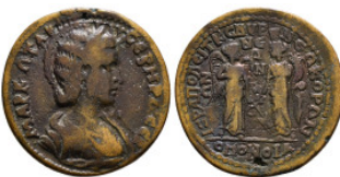
368 PHRYGIA. Hierapolis. Otacilia Severa (Augusta, 244-249). Ae Obv : MAPK ΩΤΑΚΙΑ ΣΕΒΗΡΑ ΣΕΒ; diademed and draped bust of Otacilia Severa, Rev : ΙΕΡΑΠΟΛΕΙΤΩΝ Κ ΣΜΥΡΝ ΝΕΩΚΟΡΩΝ ΟΜΟΝΟΙΑ; Nike standing r., holding palm, facing Tyche of Smyrna standing l., holding rudder and cornucopia. 11,29 g - 28,83 mm