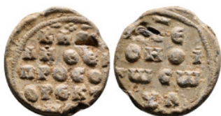
960 Byzantine Lead Seal. 6,95 g - 20,78 mm