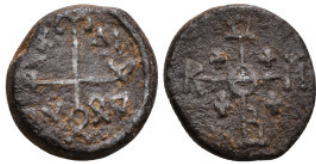
967 Byzantine Lead Seal. 11,53 g - 20,90 mm