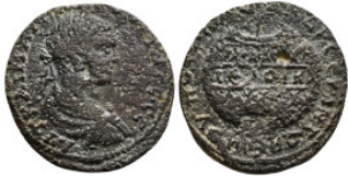
394 Roman Provincial Coin Ae 11,04 g - 29,32 mm