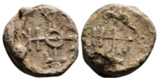
951 Byzantine Lead Seal. 15,88 g - 22,56 mm