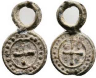
1007 Collectible Item 1,37 g - 20,43 mm