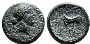
179 Greek Coin AE 3,79 g - 14,63 mm