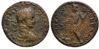
393 Roman Provincial Coin Ae 7,41 g - 24,94 mm