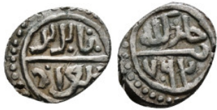
913 Islamic Coin Silver AR 1,01 g - 13,40 mm