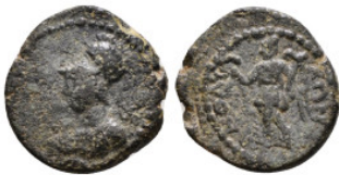
364 Roman Provincial Coin Ae 2,52 g - 15,11 mm