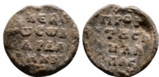
959 Byzantine Lead Seal. 4,63 g - 18,18 mm