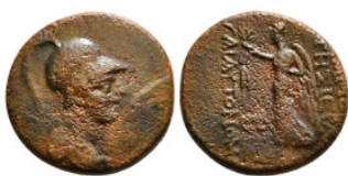
177 Greek Coin AE 7,70 g - 21,22 mm