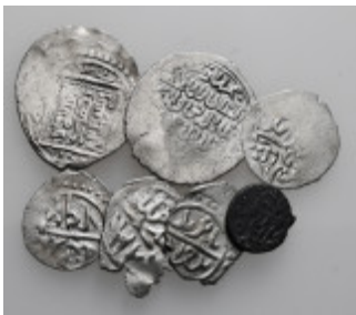
993 Group Lots Silver Coins