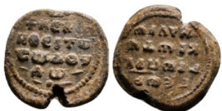
944 Byzantine Lead Seal. 6,20 g - 19,81 mm