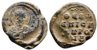
940 Byzantine Lead Seal. 5,00 g - 19,67 mm