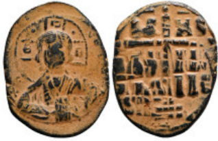
854 Byzantine Coin, ANONYMOUS FOLLIS 13,27 g - 34,24 mm Artificially patinated