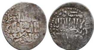
900 Islamic Coin Silver AR 2,92 g - 23,80 mm