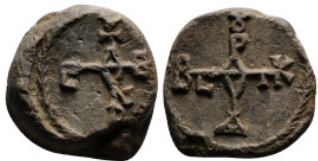
950 Byzantine Lead Seal. 17,88 g - 22,10 mm