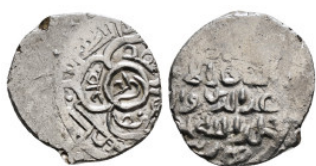
905 Islamic Coin Silver AR 1,96 g - 17,55 mm