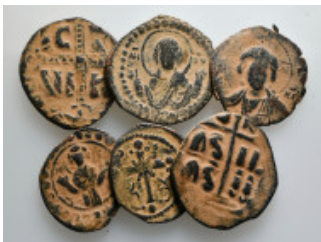
989 Group Lots Byzantine Coins Artificially patinated