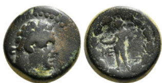
173 Greek Coin AE 6,23 g - 16,59 mm