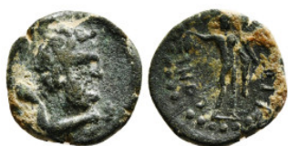
193 Greek Coin AE 2,53 g - 14,62 mm