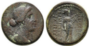
184 Greek Coin AE 6,17 g - 17,82 mm