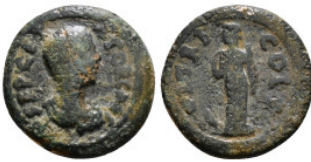
366 Roman Provincial Coin Ae 5,18 g - 20,37 mm