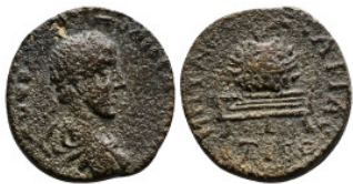
395 Roman Provincial Coin Ae 13,24 g - 24,46 mm