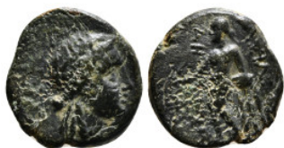
168 Greek Coin AE 3,32 g - 15,68 mm