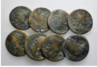
979 Group Lots Roman Provincial Coins