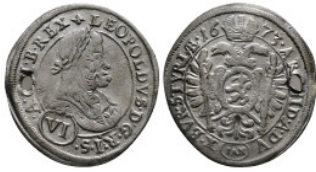
931 World Coin AR Silver 2,63 g - 25,93 mm