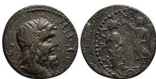
346 Roman Provincial Coin AE 15,04 g - 29,80 mm