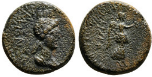
183 Greek Coin AE 2,82 g - 14,56 mm