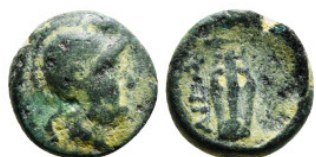
169 Greek Coin AE 1,62 g - 11,21 mm