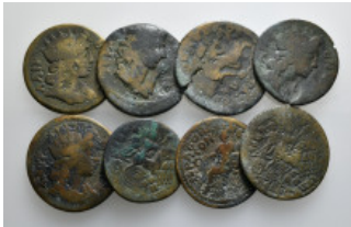
980 Group Lots Roman Provincial Coins