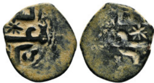
896 Islamic Coin AE 3,99 g - 20,11 mm