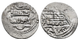
904 Islamic Coin Silver AR 1,75 g - 19,20 mm