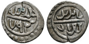
911 Islamic Coin Silver AR 0,81 g - 13,43 mm