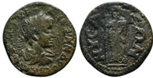
316 Roman Provincial Coin Ae 4,41 g - 21,74 mm