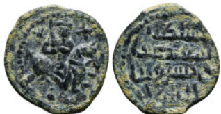
893 Islamic Coin AE 3,01 g - 20,44 mm