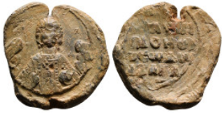
945 Byzantine Lead Seal. 12,34 g - 26,93 mm