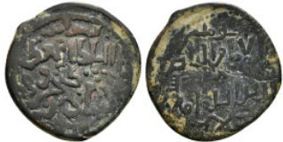
892 Islamic Coin AE 3,88 g - 22,75 mm