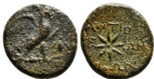
175 Greek Coin AE 4,48 g - 15,89 mm