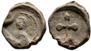
953 Byzantine Lead Seal. 14,72 g - 22,73 mm