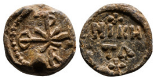
943 Byzantine Lead Seal. 7,46 g - 16,93 mm