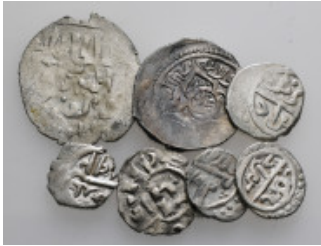
991 Group Lots Silver Coins