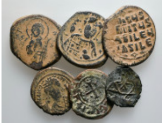
990 Group Lots Byzantine Coins Artificially patinated