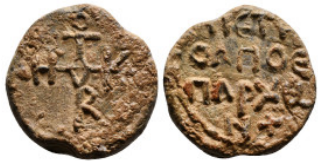
948 Byzantine Lead Seal. 11,80 g - 21,97 mm