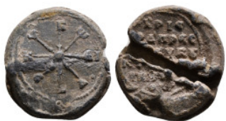
958 Byzantine Lead Seal. 6,95 g - 19,62 mm