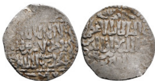
901 Islamic Coin Silver AR 2,91 g - 23,88 mm