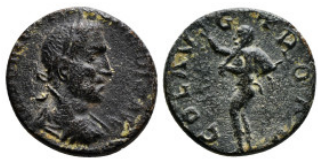
397 Roman Provincial Coin Ae 5,57 g - 20,75 mm