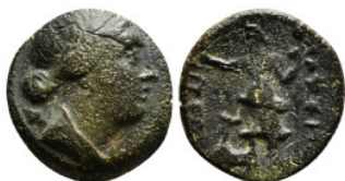
176 Greek Coin AE 4,53 g - 17,36 mm