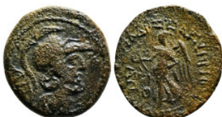
190 Greek Coin AE 6,37 g - 22,71 mm