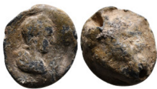
968 Theatre Ticket. Lead 11,09 g - 21,21 mm