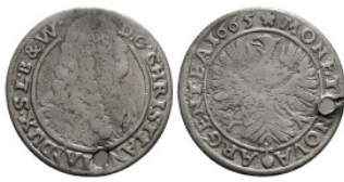
933 World Coin AR Silver 2,71 g - 24,98 mm