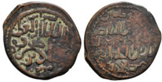
891 Islamic Coin AE 4,30 g - 23,76 mm