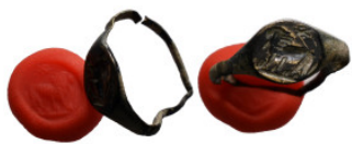
994 Collectible Item 1,60 g - 18,30 mm