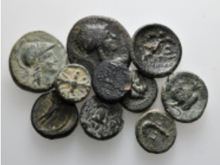
975 Group Lots Greek Coins