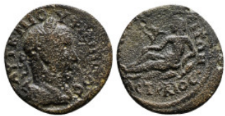
396 Roman Provincial Coin Ae 3,89 g - 20,43 mm