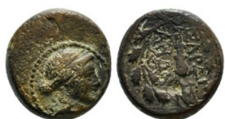
170 Greek Coin AE 4,47 g - 14,32 mm