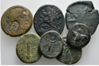
974 Group Lots Greek Coins