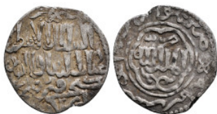
899 Islamic Coin Silver AR 2,77 g - 22,24 mm