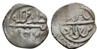
906 Islamic Coin Silver AR 1,11 g - 14,80 mm