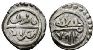
915 Islamic Coin Silver AR 1,13 g - 13,83 mm