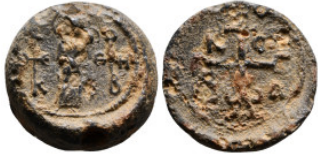
952 Byzantine Lead Seal. 18,57 g - 26,10 mm