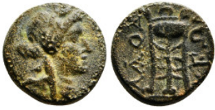
188 Greek Coin AE 2,63 g - 13,85 mm