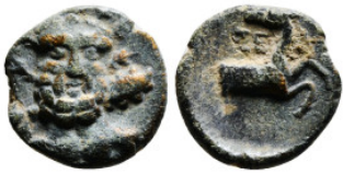
187 Greek Coin AE 2,35 g - 13,71 mm