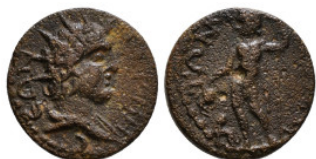
347 Roman Provincial Coin AE 5,36 g - 18,66 mm