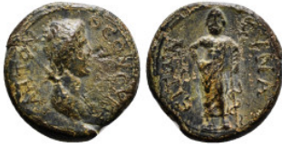
363 Roman Provincial Coin Ae 2,76 g - 16,66 mm