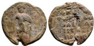
956 Byzantine Lead Seal. 8,45 g - 25,70 mm