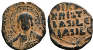
859 Byzantine Coin, ANONYMOUS FOLLIS 10,77 g - 28,28 mm Artificially patinated