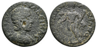
399 Roman Provincial Coin Ae 4,91 g - 21,91 mm