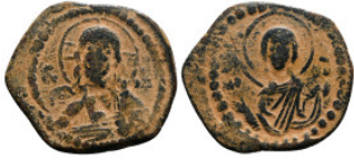
889 Byzantine Coin, ANONYMOUS FOLLIS 7,38 g - 28,80 mm Artificially patinated