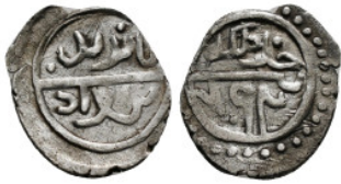
910 Islamic Coin Silver AR 0,68 g - 14,96 mm