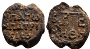
965 Byzantine Lead Seal. 11,29 g - 23,76 mm