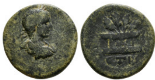
317 Roman Provincial Coin Ae 7,82 g - 21,94 mm