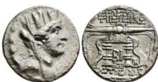
194 SELEUKIS & PIERIA. Seleukeia Pieria. Tetradrachm (105/4-83/2 BC). Dated CY 13 (97/96 BC). Obv: Veiled and turreted bust of Tyche right. Rev: ΣΕΛΕΥΚΕΩΝ ΤΗΣ ΙΕΡΑΣ / ΚΑΙ ΑΥΤΝΟΜΟΝ. Filleted thunderbolt set upon throne; ΠΙ (date) below, monogram to right; all within wreath. Callataÿ, Production, pp. 73-4; HGC 9, 1382; DCA 697. Condition: Good very fine. 14,14 g - 27,27 mm