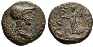
365 Roman Provincial Coin Ae 2,66 g - 13,30 mm