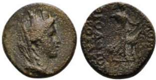
185 Greek Coin AE 3,83 g - 16,40 mm