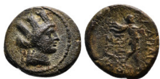
180 Greek Coin AE 2,81 g - 15,66 mm