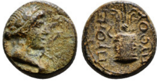
362 Roman Provincial Coin Ae 3,02 g - 14,21 mm