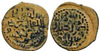
895 Islamic Coin AE 4,26 g - 28,10 mm