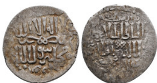
898 Islamic Coin Silver AR 2,69 g - 23,40 mm