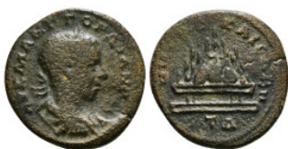
320 Roman Provincial Coin Ae 8,94 g - 24,46 mm