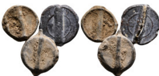
971 Group Lots Byzantine Lead Seals