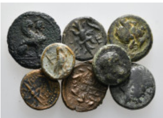
977 Group Lots Greek Coins