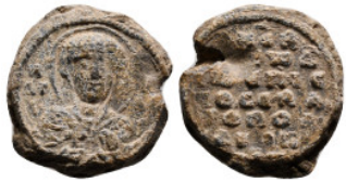
946 Byzantine Lead Seal. 6,89 g - 20,25 mm