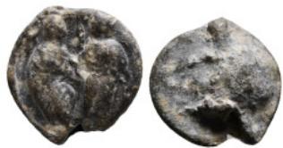
969 Theatre Ticket. Lead 2,42 g - 14,18 mm