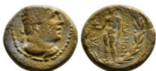
172 Greek Coin AE 5,07 g - 15,00 mm