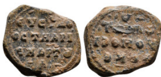
961 Byzantine Lead Seal. 11,60 g - 22,58 mm