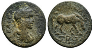
315 Roman Provincial Coin Ae 7,62 g - 25,09 mm