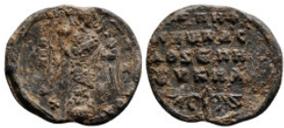
955 Byzantine Lead Seal. 5,77 g - 24,03 mm