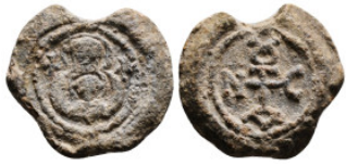
939 Byzantine Lead Seal. 8,18 g - 20,94 mm