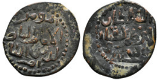
890 Islamic Coin AE 3,43 g - 23,99 mm