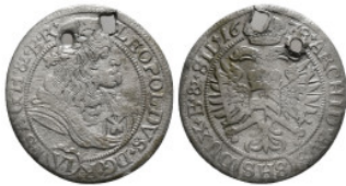
932 World Coin AR Silver 2,52 g - 25,58 mm