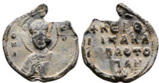
941 Byzantine Lead Seal. 6,59 g - 24,51 mm