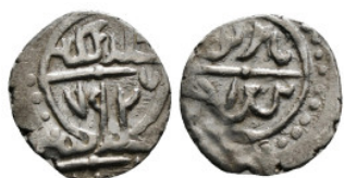
907 Islamic Coin Silver AR 1,17 g - 14,54 mm