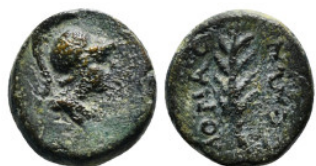
178 Greek Coin AE 2,97 g - 14,23 mm