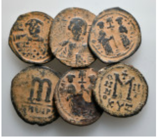
986 Group Lots Byzantine Coins Artificially patinated