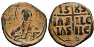
860 Byzantine Coin, ANONYMOUS FOLLIS 10,19 g - 32,72 mm Artificially patinated