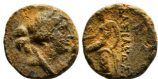
174 Greek Coin AE 4,06 g - 14,36 mm