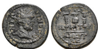
343 Roman Provincial Coin AE 3,90 g - 18,57 mm