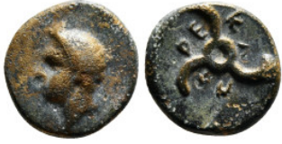
182 Greek Coin AE 2,29 g - 13,22 mm