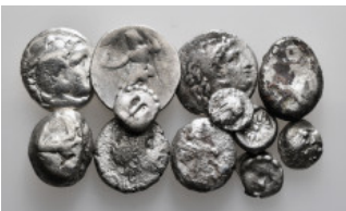
978 Group Lots Greek Coins