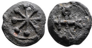
966 Byzantine Lead Seal. 11,53 g - 21,07 mm