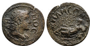
341 Roman Provincial Coin AE 2,79 g - 18,24 mm