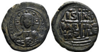
858 Byzantine Coin, ANONYMOUS FOLLIS 14,40 g - 29,11 mm