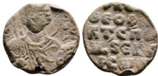
935 Byzantine Lead Seal. 5,91 g - 21,16 mm