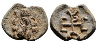
963 Byzantine Lead Seal. 10,75 g - 24,78 mm