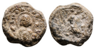
947 Byzantine Lead Seal. 6,18 g - 17,50 mm