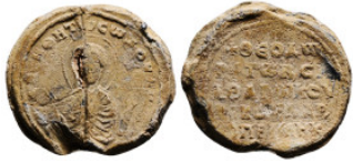
938 Byzantine Lead Seal. 8,87 g - 23,75 mm