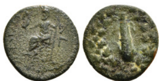
192 Greek Coin AE 2,45 g - 15,49 mm