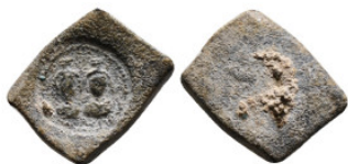
970 Theatre Ticket. Lead 3,04 g - 15,80 mm