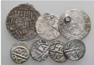
992 Group Lots Silver Coins