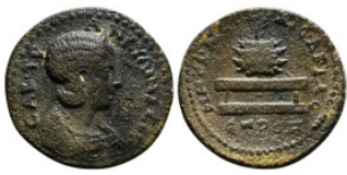
398 Roman Provincial Coin Ae 11,15 g - 29,09 mm