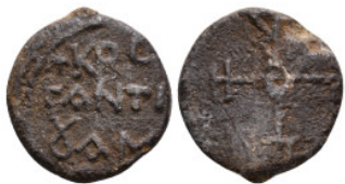
957 Byzantine Lead Seal. 8,03 g - 20,30 mm