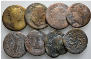
981 Group Lots Roman Provincial Coins