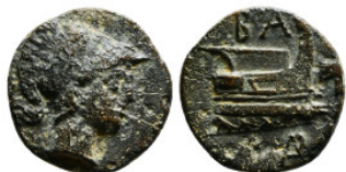
181 Greek Coin AE 2,36 g - 14,54 mm