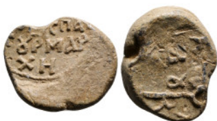
962 Byzantine Lead Seal. 12,95 g - 23,93 mm