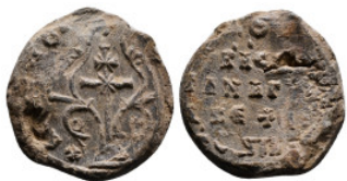
942 Byzantine Lead Seal. 6,59 g - 22,04 mm