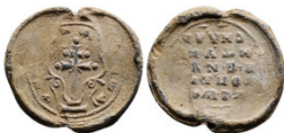
937 Byzantine Lead Seal. 7,06 g - 25,15 mm