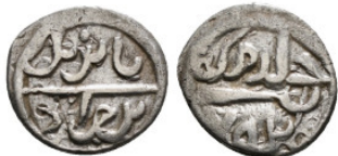
914 Islamic Coin Silver AR 1,02 g - 12,60 mm