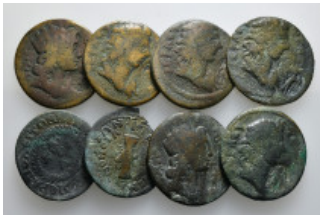
982 Group Lots Roman Provincial Coins