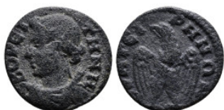
342 Roman Provincial Coin AE 3,87 g - 18,89 mm