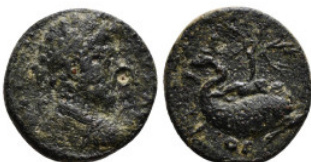
367 Roman Provincial Coin Ae 4,54 g - 17,90 mm