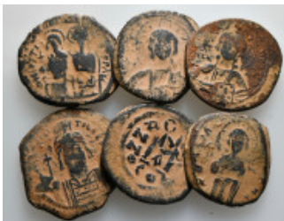
988 Group Lots Byzantine Coins Artificially patinated