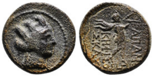
186 Greek Coin AE 3,94 g - 15,34 mm