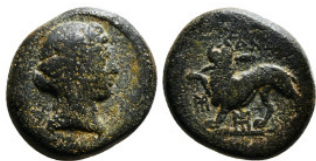
189 Greek Coin AE 5,29 g - 17,55 mm