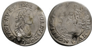
934 World Coin AR Silver 2,96 g - 25,97 mm