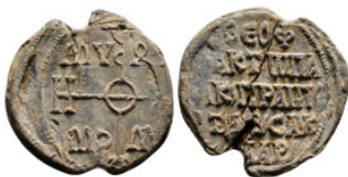
936 Byzantine Lead Seal. 9,57 g - 26,51 mm