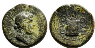
191 Greek Coin AE 4,23 g - 15,47 mm