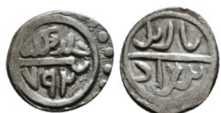
908 Islamic Coin Silver AR 1,13 g - 12,30 mm