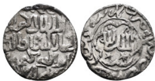
902 Islamic Coin Silver AR 2,62 g - 20,70 mm