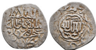
897 Islamic Coin Silver AR 2,82 g - 24,84 mm