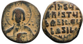
855 Byzantine Coin, ANONYMOUS FOLLIS 10,72 g - 27,25 mm Artificially patinated