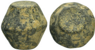
874 ANCIENT ISLAMIC BRONZE COMMERCIAL WEIGHTS (15TH-19TH).Ae. Condition : Good very fine. Weight : gr Diameter : mm 5