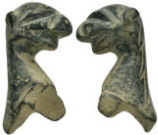
976 ANCIENT ROMAN BRONZE LION FIGURINE.(1st - 2nd Century).Ae. Condition : Good very fine. Weight : 19.91 gr Diameter : 32 mm