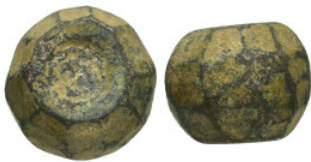
877 ANCIENT ISLAMIC BRONZE COMMERCIAL WEIGHTS (15TH-19TH).Ae. Condition : Good very fine. Weight : gr Diameter : mm 5