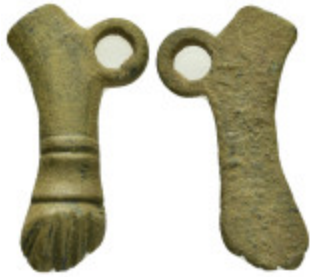
940 ANCIENT ROMAN BRONZE ARM FIGURINE.(1st - 2nd Century).Ae. Condition : Good very fine. Weight : 11.34 gr Diameter : 40 mm