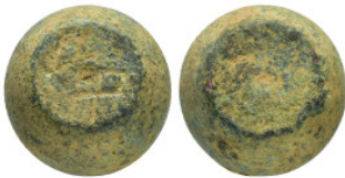
875 ANCIENT ISLAMIC BRONZE COMMERCIAL WEIGHTS (15TH-19TH).Ae. Condition : Good very fine. Weight : gr Diameter : mm 5