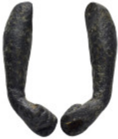
941 ANCIENT ROMAN BRONZE ARM FIGURINE.(1st - 2nd Century).Ae. Condition : Good very fine. Weight : 29.33 gr Diameter : 52 mm