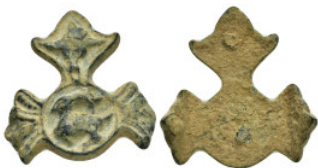
923 ANCIENT ROMAN BRONZE APLIQUE.(1st-2nd century).Ae. Condition : Good very fine. Weight : 11.51 gr Diameter : 32 mm