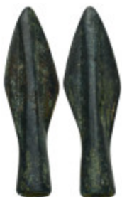
944 ANCIENT ROMAN BRONZE ARROW HEADS.(Circa 2 th Century). Ae. Condition : Good very fine. Weight : 5.13 gr Diameter : 39 mm