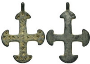
824 ANCIENT BYZANTINE EMPIRE. Bronze Cross. (8th-10th century). Ae. Condition : Good very fine. Weight : 8.51 gr Diameter : 43 mm