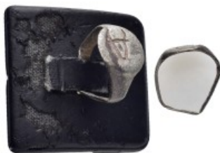
852 ANCIENT BYZANTINE SILVER RING.(7rd-8th centuries).Ar. Condition : Good very fine. Weight : 3.08 gr Diameter : 19 mm