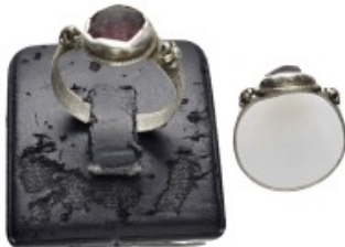
851 ANCIENT BYZANTINE SILVER RING.(7rd-8th centuries).Ar. Condition : Good very fine. Weight : 3.06 gr Diameter : 21 mm