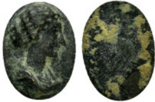
919 ANCIENT ROMAN BRONZE APLIQUE.(1st-2nd century).Ae. Condition : Good very fine. Weight : 0.88 gr Diameter : 9 mm