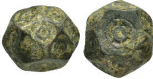
872 ANCIENT ISLAMIC BRONZE COMMERCIAL WEIGHTS (15TH-19TH).Ae. Condition : Good very fine. Weight : gr Diameter : mm 5