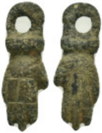
920 ANCIENT ROMAN BRONZE APLIQUE.(1st-2nd century).Ae. Condition : Good very fine. Weight : 1.89 gr Diameter : 20 mm