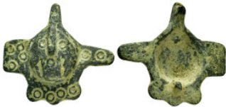
921 ANCIENT ROMAN BRONZE APLIQUE.(1st-2nd century).Ae. Condition : Good very fine. Weight : 10.25 gr Diameter : 31 mm