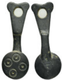
829 ANCIENT BYZANTINE BRONZE BUCKLE. (8th - 11th century AD).Ae. Condition : Good very fine. Weight : 4.67 gr Diameter : 38 mm