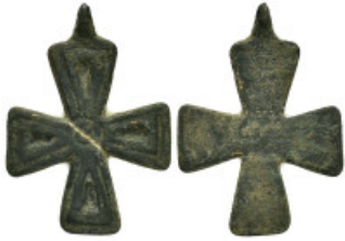
826 ANCIENT BYZANTINE EMPIRE.Cross.(8th-10th century).Ae. Condition : Good very fine. Weight : 3.97 gr Diameter : 33 mm