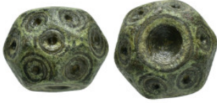
871 ANCIENT ISLAMIC BRONZE COMMERCIAL WEIGHTS (15TH-19TH).Ae. Condition : Good very fine. Weight : gr Diameter : mm 5