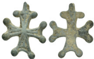
825 ANCIENT BYZANTINE EMPIRE. Cross. (8th-10th century). Ae. Condition : Good very fine. Weight : 2.67 gr Diameter : 28 mm