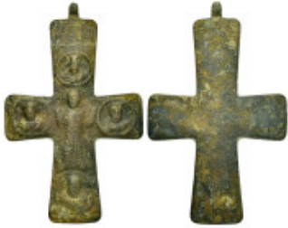
822 ANCIENT BYZANTINE EMPIRE. Bronze Cross. (8th-10th century). Ae. Condition : Good very fine. Weight : 75.61 gr Diameter : 91 mm