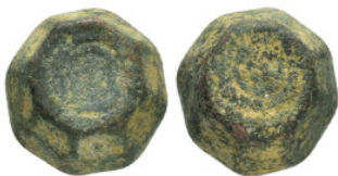
876 ANCIENT ISLAMIC BRONZE COMMERCIAL WEIGHTS (15TH-19TH).Ae. Condition : Good very fine. Weight : gr Diameter : mm 5