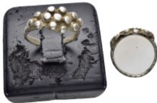
850 ANCIENT BYZANTINE SILVER RING.(7rd-8th centuries).Ar. Condition : Good very fine. Weight : 3.06 gr Diameter : 19 mm