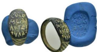
830 ANCIENT BYZANTINE BRONZE RING.(10th-11th century).Ae. Condition : Good very fine. Weight : 4.71 gr Diameter : 20 mm