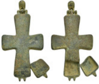
821 ANCIENT BYZANTINE EMPIRE. Bronze Cross. (8th-10th century). Ae. Condition : Good very fine. Weight : 60.20 gr Diameter : 90 mm