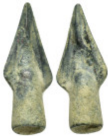
942 ANCIENT ROMAN BRONZE ARROW HEADS.(Circa 2 th Century). Ae. Condition : Good very fine. Weight : 3.61 gr Diameter : 30 mm