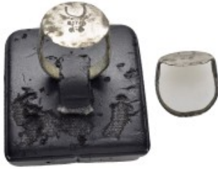
848 ANCIENT BYZANTINE SILVER RING.(7rd-8th centuries).Ar. Condition : Good very fine. Weight : 2.81 gr Diameter : 18 mm