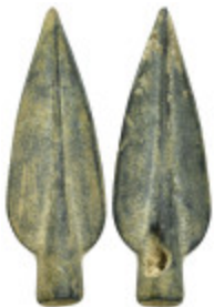
943 ANCIENT ROMAN BRONZE ARROW HEADS.(Circa 2 th Century). Ae. Condition : Good very fine. Weight : 4.83 gr Diameter : 40 mm