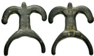
922 ANCIENT ROMAN BRONZE APLIQUE.(1st-2nd century).Ae. Condition : Good very fine. Weight : 10.27 gr Diameter : 35 mm