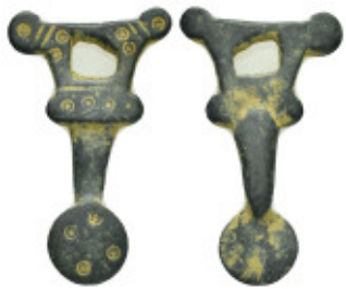
828 ANCIENT BYZANTINE BRONZE BUCKLE. (8th - 11th century AD).Ae. Condition : Good very fine. Weight : 6.05 gr Diameter : 36 mm