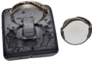
849 ANCIENT BYZANTINE SILVER RING.(7rd-8th centuries).Ar. Condition : Good very fine. Weight : 2.82 gr Diameter : 24 mm