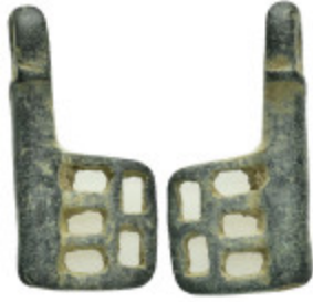
972 ANCIENT ROMAN BRONZE KEY.(Circa 1st - 2nd Century).Ae. Condition : Good very fine. Weight : 7.90 gr Diameter : 32 mm