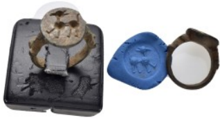
918 ANCIENT ROMAN BRONZE RING.(3rd-4th centuries).Ae. Condition : Good very fine. Weight : 9.53 gr Diameter : 24 mm