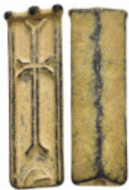
823 ANCIENT BYZANTINE EMPIRE. Bronze Cross. (8th-10th century). Ae. Condition : Good very fine. Weight : 8.39 gr Diameter : 36 mm