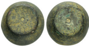
873 ANCIENT ISLAMIC BRONZE COMMERCIAL WEIGHTS (15TH-19TH).Ae. Condition : Good very fine. Weight : gr Diameter : mm 5