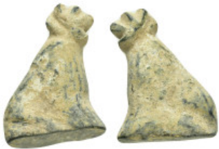
975 ANCIENT ROMAN BRONZE LION FIGURINE.(1st - 2nd Century).Ae. Condition : Good very fine. Weight : 18.23 gr Diameter : 27 mm