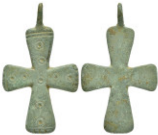
827 ANCIENT ANCIENT BYZANTINE EMPIRE.Cross.(8th-10th century).Ae. Condition : Good very fine. Weight : 7.19 gr Diameter : 48 mm