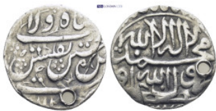
964 Islamic Silver Coins (2.58 Gr. 19mm.)