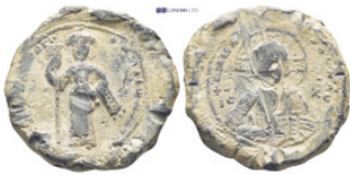
942 Byzantine Lead Seal (30.2 Gr. 35mm.).