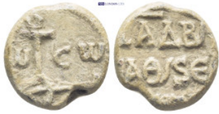
947 Byzantine Lead Seal (7.5 Gr. 17mm.).