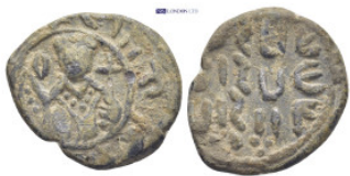
957 Byzantine Lead Seal (8.13 Gr. 24mm.)