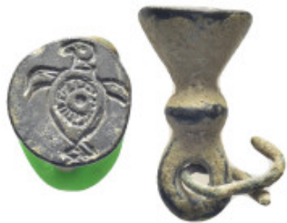
1027 Bronze stamp seal (6.1 Gr. 21mm.) SOLD AS SEEN, NO RETURN!