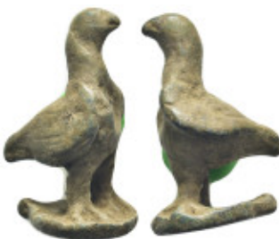
1013 Bronze eagle figurine 41mm, 41.22 gr.