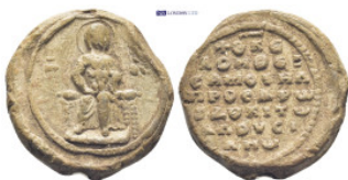
935 Byzantine Lead Seal (15.65 Gr. 24mm.).