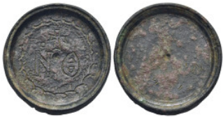
1018 Bronze Nine Nomismata Coin Weight. Circa 5th-7th Century AD. N° Ø; cross above; all within circular border / Blank. (31mm, 40.48 gr.)