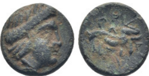
373 Greek Uncertain Bronze Coins AE (1.77 Gr. 13mm.)