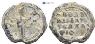
953 Byzantine Lead Seal (8.2 Gr. 20mm.)