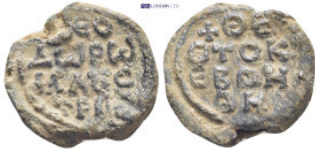
948 Byzantine Lead Seal (8.56 Gr. 22mm.).