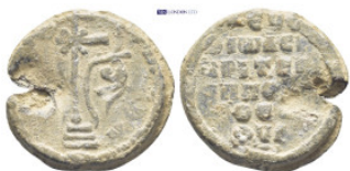
946 Byzantine Lead Seal (8.15 Gr. 22mm.).