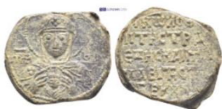
932 Byzantine Lead Seal (6.46 Gr. 19mm.).