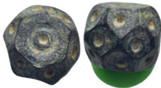
1009 Bronze dice (15mm, 14.9 g)