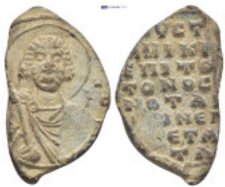
958 Byzantine Lead Seal (6.8 Gr. 29mm.)