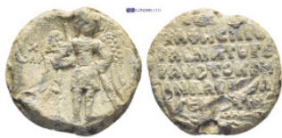
930 Byzantine Lead Seal (7.5 Gr. 19mm.).