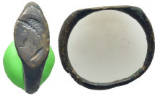
1022 Bronze ring with bust left. (13mm, 2.57 g)