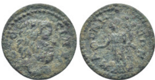
375 IONIA. Smyrna. Pseudo-autonomous (Mid 2nd century). Ae. (19mm, 4.62 g) Obv: ZEVC AKPAIOC. Laureate head of Zeus Akraios right. Rev: CMVPNAIQN. Amazon Smyrna standing left, holding patera and bipennis