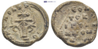
961 Byzantine Lead Seal (3.38 Gr. 18mm.)