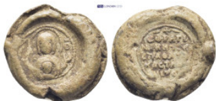
950 Byzantine Lead Seal (5.58 Gr. 16mm.).