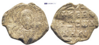
945 Byzantine Lead Seal (6.6 Gr. 23mm.).