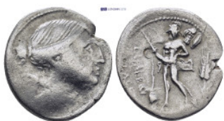
513 L. Valerius Flaccus AR Denarius. Italian mint, 108-107 BC. (3.68 Gr. 21mm.) Draped bust of Victory right. Rev. Mars walking left, carrying trophy; L•VALERI FLACCI and flamen's cap before; grain-ear behind.