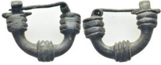
1014 Bronze fibula 35mm, 19.0 gr.