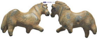
1016 Bronze horse figurine 62mm, 102.7 gr.