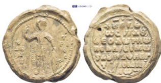
936 Byzantine Lead Seal (22.97 Gr. 29mm.).