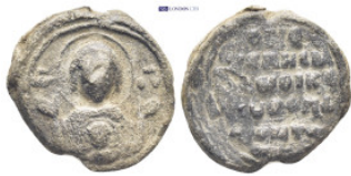
933 Byzantine Lead Seal (7.8 Gr. 21mm.).