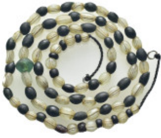
995 A Beads Necklace. 13.3 gr.. roman glass pendant