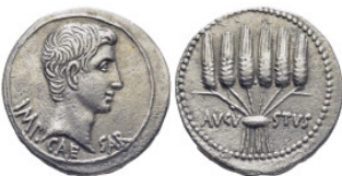
374 Augustus. (27 BC-AD 14). AR Cistophorus (11.80 Gr. 25mm.). Ephesus, ca. 25 BC. Bare head of Augustus right, Rev. AVGVSTVS, bunch of six ears of grain, tied together.