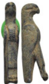
1012 Bronze eagle figurine (44mm, 18 gr).