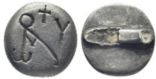
1060 Monogrammed silver ring piece(2.55 Gr. 13mm.) SOLD AS SEEN, NO RETURN!