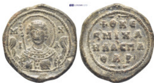
929 Byzantine Lead Seal (10.13 Gr. 25mm.).