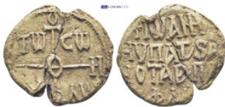
934 Byzantine Lead Seal (10.3 Gr. 27mm.).