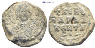
926 Byzantine Lead Seal (8.5 Gr. 22mm.).