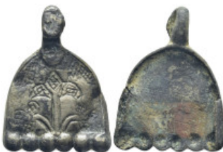
1064 Pendant (20.72 Gr. 49mm.)SOLD AS SEEN, NO RETURN!