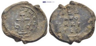
954 Byzantine Lead Seal (7.5 Gr. 27mm.)