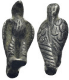
1078 Silver eagle figurine (23mm, 3.0 gr).