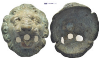
1062 Oil lamp cover in the shape of a lion's head (26 Gr. 38mm.)