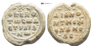
931 Byzantine Lead Seal (7.52 Gr. 19mm.).