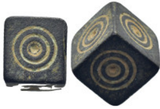
1008 Bronze dice (12mm, 14.5 g)