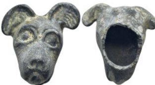
1011 Bronze dog head (40mm, 33.42 g)