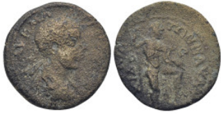
508 Roman Provincial coin (26mm, 8.8 g)