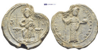
937 Byzantine Lead Seal (20.55 Gr. 32mm.).