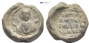
951 Byzantine lead seal (14mm, 4.0 g) Facing bust of the Virgin Mary, orans, wearing chiton and maphorion, bearing a medallion with a facing bust of the infant Jesus Christ. Rev. Legends four lines