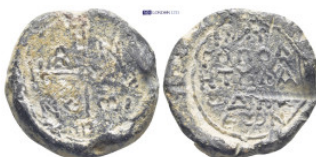
939 Byzantine Lead Seal (26.38 Gr. 27mm.).