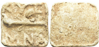
1050 Greek Weights 492 Gr. 89mm.SOLD AS SEEN, NO RETURN!