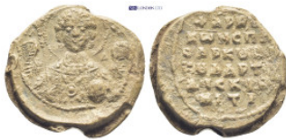
927 Byzantine Lead Seal (9.12 Gr. 23mm.).