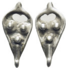
1080 Silver object (0.98 Gr. 20mm.) SOLD AS SEEN, NO RETURN!