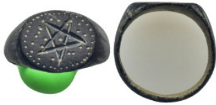
1023 Bronze ring with pentagram (15mm, 4.7 g)