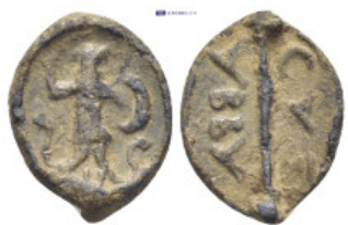
960 Byzantine Lead Seal (2.77 Gr. 18mm.)