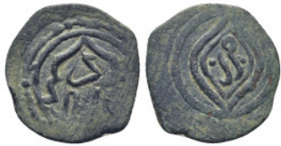
962 Islamic Coin AE (1.3 Gr. 17mm.)