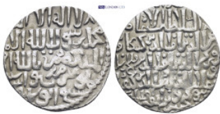
963 Islamic Silver Coins (2.53 Gr. 21mm.)