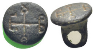
1024 Bronze Stamp (3 Gr. 12mm.) SOLD AS SEEN, NO RETURN!