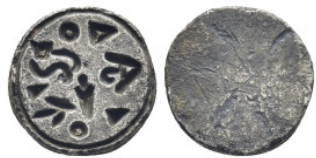
1026 Bronze stamp seal (2.1 Gr. 13mm.) SOLD AS SEEN, NO RETURN!