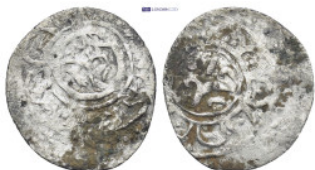
965 Islamic coin (16mm, 0.73 g)