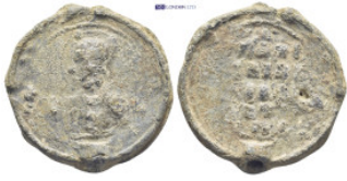
940 Byzantine Lead Seal (17 Gr. 30mm.).