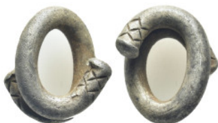
1077 Silver arc-shaped object (11.9 Gr 22mm.) SOLD AS SEEN, NO RETURN!