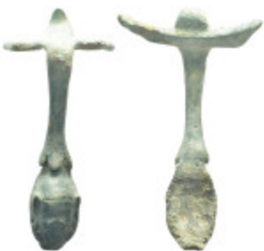
1083 Uncertain Antiques (11.4 Gr. 111 mm.) SOLD AS SEEN, NO RETURN!