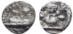
372 Greek Silver Coin (0.25 Gr. 6mm.)