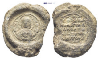
944 Byzantine Lead Seal (4.6 Gr. 17mm.).