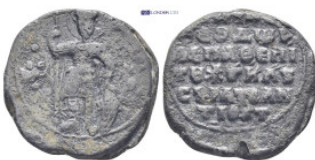
952 Byzantine Lead Seal (20.4 Gr. 29mm.).