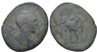
510 Roman Provincial coin (34mm, 13.6 g)