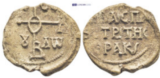
928 Byzantine Lead Seal (8.5 Gr. 28mm.).