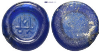
1059 Monogrammed blue glass seal (3.43 Gr. 23mm.)