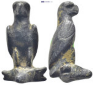
1072 Roman eagle on bull's head mount (24 Gr. 35mm.)