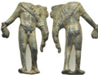
1010 Bronze Dionysos figurine 56mm, 45.5 gr.