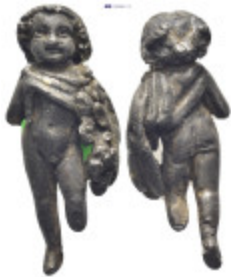
1075 Roman Silver Statuette of Eros. (10.4 Gr. 34mm.)