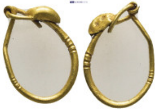
1045 Gold ear ring 17mm 0.85 gr.