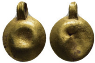
1046 Gold pendant (1.02 Gr. 12mm.)SOLD AS SEEN, NO RETURN!