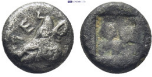
369 Greek coin (8mm, 0,88 g)