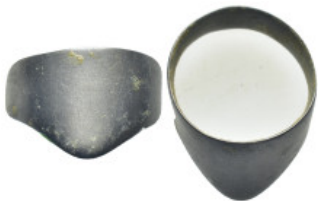
1000 Archer ring. (5.88 Gr. 25mm.) SOLD AS SEEN, NO RETURN!