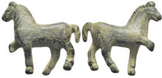
1015 Bronze horse figurine 42mm, 28.94 gr.