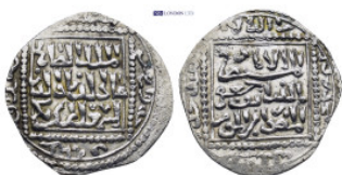
966 Islamic Silver Coins (2.9 Gr. 20mm.)