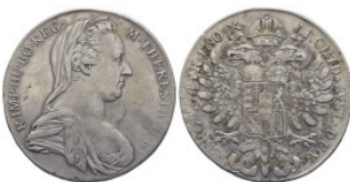
967 Austria. re-strike. Maria Theresia AD 1740-1780. Thaler AR 1780 X (40mm, 27.84 g)