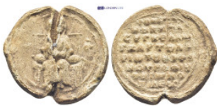
938 Byzantine Lead Seal (13.94 Gr. 27mm.).