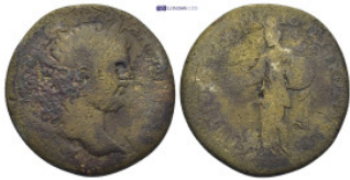
509 Roman Provincial coin (29mm, 10.0 g)