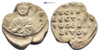
943 Byzantine Lead Seal (5.21 Gr. 19mm.).