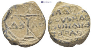
955 Byzantine Lead Seal (12.2 Gr. 22mm.)