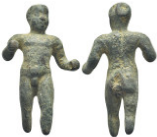
1019 Bronze nude male figurine 50mm, 32.0 gr.