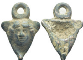
1065 Pendant with Gorgoneion. 1st century BC-1st century AD. (103 Gr. 74mm.)