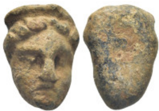
1082 Terracota head (20mm, 16.0 g)