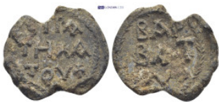
959 Byzantine Lead Seal (10.4 Gr. 25mm.)