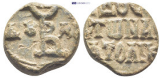
941 Byzantine Lead Seal (6.98 Gr. 18mm.).