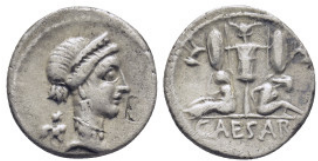
511 C. Iulius Caesar. Denarius, Spain 46-45, AR (17mm, 3.77 g). Diademed head of Venus r.; behind, Cupid. Rev. Two captives seated at sides of trophy with oval shield and carnyx in each hand; in exergue, CAESAR.