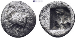
370 Greek coin (9mm, 0,63 g)