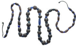
996 A Beads Necklace. 17.48 gr. roman glass pendant