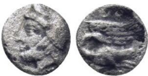
371 Greek coin (9mm, 0,85 g)