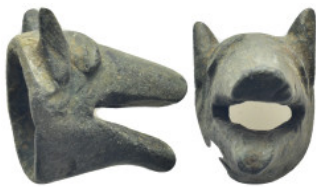
1061 Object shaped like a wolf or dog head (17.12 Gr. 23mm.) SOLD AS SEEN, NO RETURN!