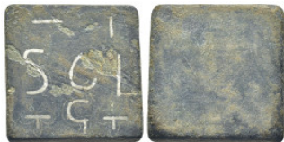
1076 Roman Weight (25.36 Gr. 24mm.) SOLD AS SEEN, NO RETURN!