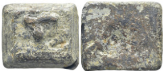
1049 Greek Weights 163.6 Gr. 39mm. SOLD AS SEEN, NO RETURN!