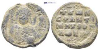
949 Byzantine Lead Seal (7.1 Gr. 22mm.).