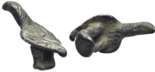
1079 Silver eagle figurine (26mm, 4.7 gr).