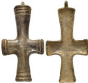
1167 BYZANTINE EMPIRE. Bronze Cross. (8th-10th century). Ae. Condition : Good very fine. Weight : 18.58 gr Diameter : 67 mm