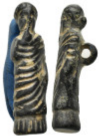
1323 ANCIENT GREEK BRONZE NECKLACE.(1st - 2nd BC).Ae. Condition : Good very fine. Weight : 7.03 gr Diameter : 29 mm