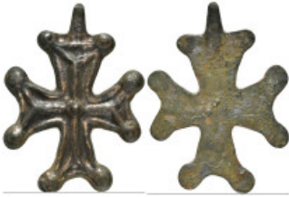
1186 BYZANTINE EMPIRE.Bronze Cross.(8th-10th century).Ae. Condition : Good very fine. Weight : 12.42 gr Diameter : 50 mm