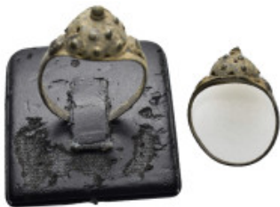
1381 ANCIENT BYZANTINE SILVER RING.(7rd-8th centuries).Ar. Condition : Good very fine. Weight : 2.90 gr Diameter : 21 mm