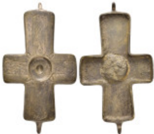
1168 BYZANTINE EMPIRE. Bronze Cross. (8th-10th century). Ae. Condition : Good very fine. Weight : 29.03 gr Diameter : 84 mm