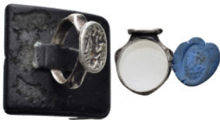
1380 ANCIENT BYZANTINE SILVER RING.(7rd-8th centuries).Ar. Condition : Good very fine. Weight : 6.96 gr Diameter : 22 mm