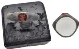
1363 ANCIENT ROMAN SILVER RING.(3rd-4th century).Ar. Condition : Good very fine. Weight : 4.35 gr Diameter : 23 mm