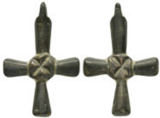
1187 BYZANTINE EMPIRE.Bronze Cross.(8th-10th century).Ae. Condition : Good very fine. Weight : 5.91 gr Diameter : 31 mm