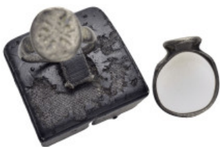
1370 ANCIENT ROMAN BRONZE RING.(3rd-4th centuries).Ae. Condition : Good very fine. Weight : 7.61 gr Diameter : 23 mm