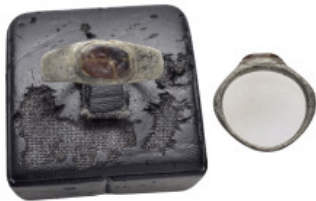
1362 ANCIENT ROMAN SILVER RING.(3rd-4th century).Ar. Condition : Good very fine. Weight : 3.52 gr Diameter : 20 mm