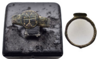
1388 ANCIENT BYZANTINE BRONZE RING.(10th-11th century).Ae. Condition : Good very fine. Weight : 4.47 gr Diameter : 21 mm