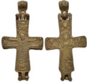
1166 BYZANTINE EMPIRE. Bronze Cross. (8th-10th century). Ae. Condition : Good very fine. Weight : 70.21 gr Diameter : 88 mm