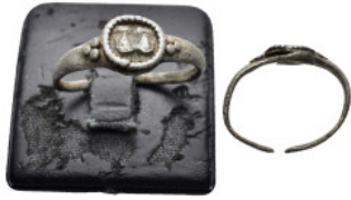
1378 ANCIENT BYZANTINE SILVER RING.(7rd-8th centuries).Ar. Condition : Good very fine. Weight : 3.22 gr Diameter : 25 mm