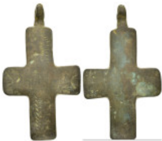
1178 BYZANTINE EMPIRE. Bronze Cross. (8th-10th century). Ae. Condition : Good very fine. Weight : 27.35 gr Diameter : 63 mm