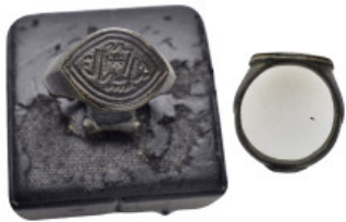
1368 ANCIENT ISLAMIC BRONZE RING.(11th-14th centuries).Ae. Condition : Good very fine. Weight : 5.45 gr Diameter : 20 mm