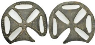
1176 BYZANTINE EMPIRE. Bronze Cross. (8th-10th century). Ae. Condition : Good very fine. Weight : 51.56 gr Diameter : 68 mm