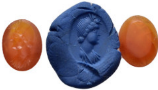
1160 ANCIENT GREEK CARNELIAN INTAGLIO..(3rd-4th centuriesBC). Condition : Good very fine. Weight : gr Diameter : mm