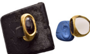
1164 ANCIENT ROMAN GOLD RING.(3rd-4th century).Au. Condition : Good very fine. Weight : 2.05 gr Diameter : 19 mm