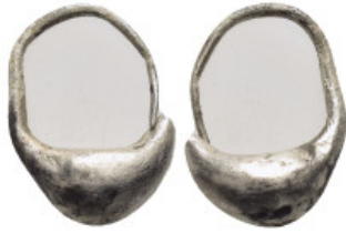
1315 ANCIENT ROMAN SILVER EARRING.(3rd-4th century).Ar. Condition : Good very fine. Weight : 3.06 gr Diameter : 19 mm