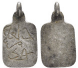
1318 ANCIENT ISLAMIC SILVER NECKLACE.(15st - 17th Century).Ae. Condition : Good very fine. Weight : 0.79 gr Diameter : 18 mm