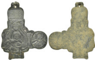
1173 BYZANTINE EMPIRE. Bronze Cross. (8th-10th century). Ae. Condition : Good very fine. Weight : 20.13 gr Diameter : 63 mm