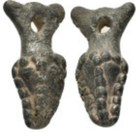
1320 ANCIENT ROMAN BRONZE NECKLACE.(1st - 2nd Century).Ae. Condition : Good very fine. Weight : 13.83 gr Diameter : 32 mm