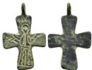
1389 ANCIENT ROMAN BRONZE.(1st-2nd century).Ae.