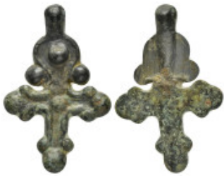
1182 BYZANTINE EMPIRE.Bronze Cross.(8th-10th century).Ae. Condition : Good very fine. Weight : 12.71 gr Diameter : 47 mm