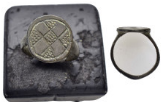
1371 ANCIENT ROMAN BRONZE RING.(3rd-4th centuries).Ae. Condition : Good very fine. Weight : 3.90 gr Diameter : 19 mm