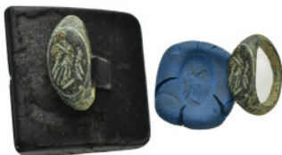
1365 ANCIENT ROMAN BRONZE RING.(3rd-4th centuries).Ae. Condition : Good very fine. Weight : 5.46 gr Diameter : 22 mm