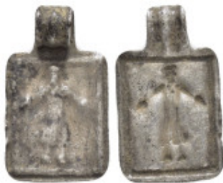
1317 ANCIENT ROMAN SILVER NECKLACE.(1st - 2nd Century).Ae. Condition : Good very fine. Weight : 1.80 gr Diameter : 25 mm