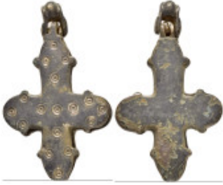
1170 BYZANTINE EMPIRE. Bronze Cross. (8th-10th century). Ae. Condition : Good very fine. Weight : 54.17 gr Diameter : 85 mm