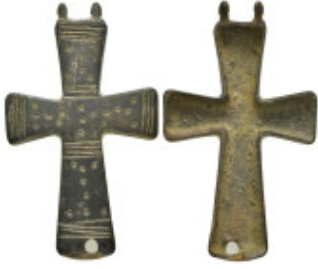
1180 BYZANTINE EMPIRE.Bronze Cross.(8th-10th century).Ae. Condition : Good very fine. Weight : 13.29 gr Diameter : 57 mm