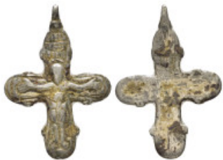
1189 BYZANTINE EMPIRE.Silver Cross.(8th-10th century).Ae. Condition : Good very fine. Weight : 3.28 gr Diameter : 34 mm