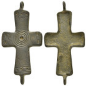
1183 BYZANTINE EMPIRE.Bronze Cross.(8th-10th century).Ae. Condition : Good very fine. Weight : 11.,66 gr Diameter : 56 mm