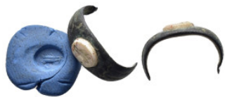
1387 ANCIENT ROMAN BRONZE RING.(3rd-4th centuries).Ae. Condition : Good very fine. Weight : 2.17 gr Diameter : 19 mm