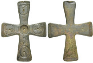
1175 BYZANTINE EMPIRE. Bronze Cross. (8th-10th century). Ae. Condition : Good very fine. Weight : 32.20 gr Diameter : 71 mm