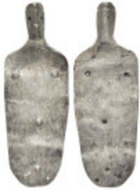
1321 ANCIENT ROMAN SILVER NECKLACE.(1st - 2nd Century).Ar. Condition : Good very fine. Weight : 1.85 gr Diameter : 36 mm