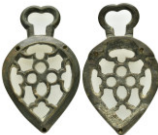
1319 ANCIENT ROMAN BRONZE NECKLACE.(1st - 2nd Century).Ae. Condition : Good very fine. Weight : 18.68 gr Diameter : 54 mm