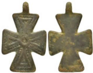
1184 BYZANTINE EMPIRE.Bronze Cross.(8th-10th century).Ae. Condition : Good very fine. Weight : 8.51 gr Diameter : 41 mm