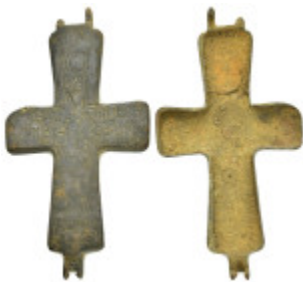
1177 BYZANTINE EMPIRE. Bronze Cross. (8th-10th century). Ae. Condition : Good very fine. Weight : 22.62 gr Diameter : 76 mm