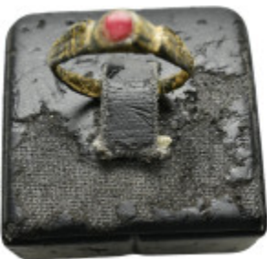
1383 ANCIENT BYZANTINE BRONZE RING.(6st-7th century).Ae. Condition : Good very fine. Weight : 1.67 gr Diameter : 18 mm