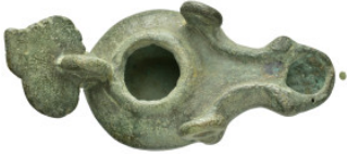
1158 ANCIENT ANCIENT ROMAN OIL LAMP.(3rd-4th century).Ae. Condition : Good very fine. Weight : 185.54 gr Diameter : 96 mm