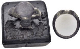
1361 ANCIENT ROMAN SILVER RING.(3rd-4th century).Ar. Condition : Good very fine. Weight : 7.92 gr Diameter : 23 mm