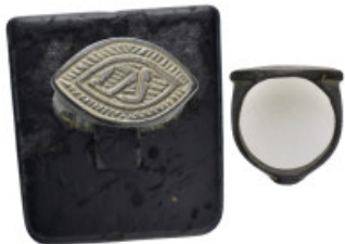
1369 ANCIENT ISLAMIC BRONZE RING.(11th-14th centuries).Ae. Condition : Good very fine. Weight : 6.26 gr Diameter : 21 mm