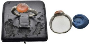
1379 ANCIENT BYZANTINE SILVER RING.(7rd-8th centuries).Ar. Condition : Good very fine. Weight : 2.25 gr Diameter : 20 mm