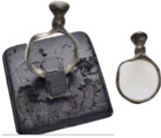
1360 ANCIENT ROMAN SILVER RING.(3rd-4th century).Ar. Condition : Good very fine. Weight : 4.59 gr Diameter : 19 mm