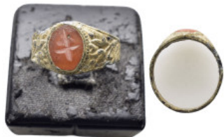
1386 ANCIENT BYZANTINE BRONZE RING.(10th-11th century).Ae. Condition : Good very fine. Weight : 3.18 gr Diameter : 21 mm