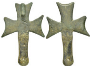
1174 BYZANTINE EMPIRE. Bronze Cross. (8th-10th century). Ae. Condition : Good very fine. Weight : 42.42 gr Diameter : 74 mm