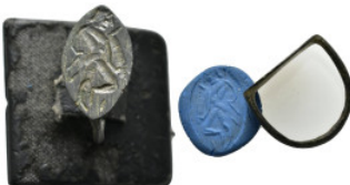
1382 ANCIENT GREEK BRONZE RING.(3rd-4th centuries BC).Ae. Condition : Good very fine. Weight : 3.01 gr Diameter : 24 mm