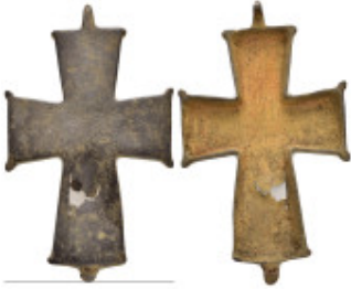
1171 BYZANTINE EMPIRE. Bronze Cross. (8th-10th century). Ae. Condition : Good very fine. Weight : 20.43 gr Diameter : 77 mm