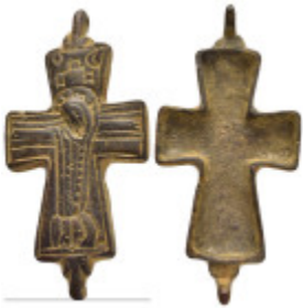
1172 BYZANTINE EMPIRE. Bronze Cross. (8th-10th century). Ae. Condition : Good very fine. Weight : 9.39 gr Diameter : 50 mm