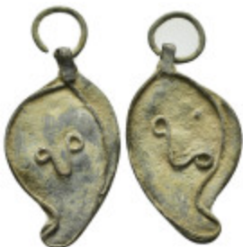
1324 ANCIENT ROMAN BRONZE NECKLACE.(1st - 2nd Century).Ae. Condition : Good very fine. Weight : 1.61 gr Diameter : 38 mm