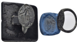
1364 ANCIENT ROMAN BRONZE RING.(3rd-4th centuries).Ae. Condition : Good very fine. Weight : 5.48 gr Diameter : 25 mm