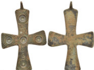
1169 BYZANTINE EMPIRE. Bronze Cross. (8th-10th century). Ae. Condition : Good very fine. Weight : 22.65 gr Diameter : 79 mm