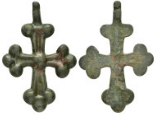
1181 BYZANTINE EMPIRE.Bronze Cross.(8th-10th century).Ae. Condition : Good very fine. Weight : 12.33 gr Diameter : 52 mm