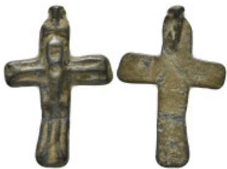
1188 BYZANTINE EMPIRE.Bronze Cross.(8th-10th century).Ae. Condition : Good very fine. Weight : 4.99 gr Diameter : 34 mm