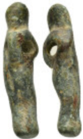
1316 ANCIENT GREEK BRONZE NECKLACE.(1st - 2nd BC).Ae. Condition : Good very fine. Weight : 5.61 gr Diameter : 29 mm