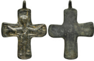
1165 BYZANTINE EMPIRE. Bronze Cross. (8th-10th century). Ae. Condition : Good very fine. Weight : 13.11 gr Diameter : 49 mm