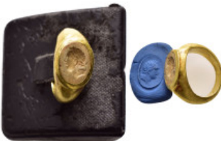
1163 ANCIENT ROMAN GOLD RING.(3rd-4th century).Au. Condition : Good very fine. Weight : 3.45 gr Diameter : 19 mm