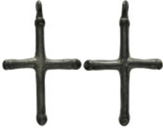
1185 BYZANTINE EMPIRE.Bronze Cross.(8th-10th century).Ae. Condition : Good very fine. Weight : 5.84 gr Diameter : 46 mm