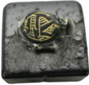
1384 ANCIENT BYZANTINE BRONZE RING.(6st-7th century).Ae. Condition : Good very fine. Weight : 4.42 gr Diameter : 21 mm