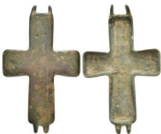
1179 BYZANTINE EMPIRE. Bronze Cross. (8th-10th century). Ae. Condition : Good very fine. Weight : 11.63 gr Diameter : 62 mm