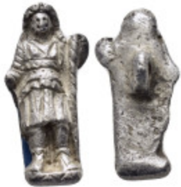
1322 ANCIENT ROMAN SILVER NECKLACE.(1st - 2nd Century).Ar. Condition : Good very fine. Weight : 3.59 gr Diameter : 25 mm