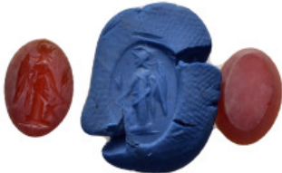
1161 ANCIENT GREEK CARNELIAN INTAGLIO..(3rd-4th centuriesBC). Condition : Good very fine. Weight : gr Diameter : mm