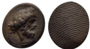
1162 ANCIENT GREEK CARNELIAN INTAGLIO..(3rd-4th centuriesBC). Condition : Good very fine. Weight : gr Diameter : mm