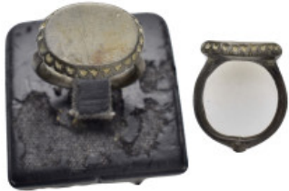
1367 ANCIENT ROMAN BRONZE RING.(3rd-4th centuries).Ae. Condition : Good very fine. Weight : 8.83 gr Diameter : 21 mm