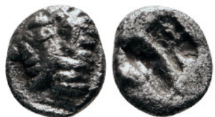
184 IONIA. Kolophon. Tetartemorion (6th century BC). Obv: Archaic head of Apollo left. Rev: Quadripartite incuse square. 0,20 g - 5,10 mm