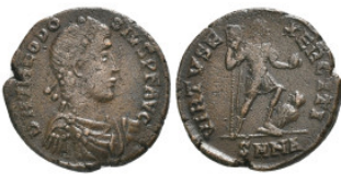
859 THEODOSIUS I (379-395). Ae 4,82 g