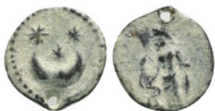
862 Collection pieces 0,74 g - 11,35 mm