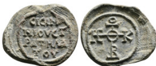
976 BYZANTINE LEAD SEAL 13,45 g - 27,70 mm