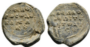
971 BYZANTINE LEAD SEAL 4,72 g - 21,81 mm