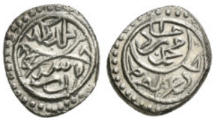
954 Islamic coin AR Silver. 0,90 g