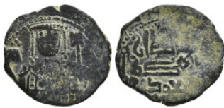
950 Arab byzantine AE Follis 3,97 g