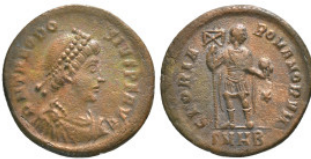
860 THEODOSIUS I (379-395). Ae 4,51 g