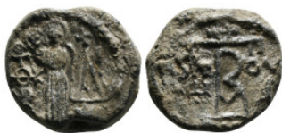
973 BYZANTINE LEAD SEAL 9,78 g - 21,17 mm