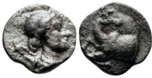
182 IONIA. Ephesos. Obol (Circa 245-202 BC). Obv: Draped bust of Artemis right, with quiver over shoulder. Rev: Forepart of stag kneeling right, head left; all within incuse circle 0,49 g - 8,17 mm