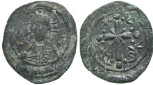
946 Byzantine Coin AE 5,81 g