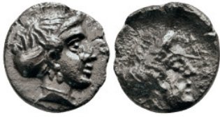
178 Greek Coin Obol 0,70g - 9,40mm