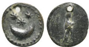
863 Collection pieces 0,72 g - 12,56 mm