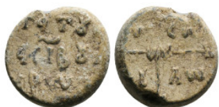
977 BYZANTINE LEAD SEAL 8,15 g - 16,42 mm