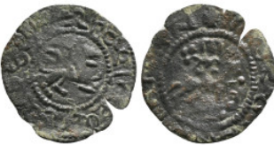
956 Medieval Coin AE Bronze 2,10 g