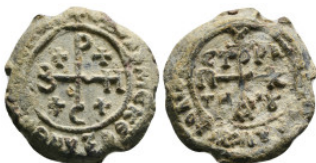
975 BYZANTINE LEAD SEAL 16,70 g - 27,47 mm