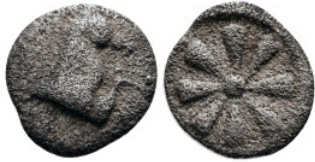
179 Aeolis. Kyme circa 400-300 BC. Hemiobol AR 0,26 g - 7,37 mm Forepart of horse to right / Floral pattern with eight leaves.