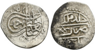
955 Islamic coin AR Silver. 1,05 g