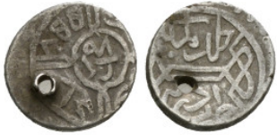
953 Islamic coin AR Silver. 1,12 g