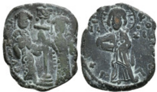
927 Byzantine Coin AE 7,67 g