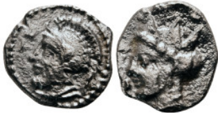
181 Greek Coin obol 0,63g - 8,80mm