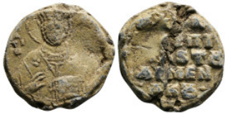
979 BYZANTINE LEAD SEAL 15,80 g - 24,14 mm