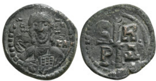
930 Byzantine Coin AE 9,51 g