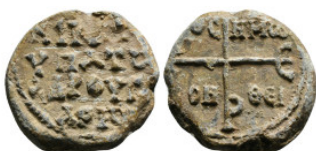
974 BYZANTINE LEAD SEAL 14,60 g - 25,42 mm