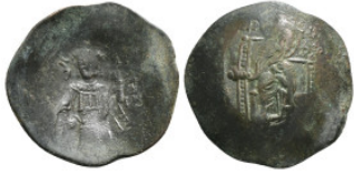
924 Byzantine Coin AE 2,59 g