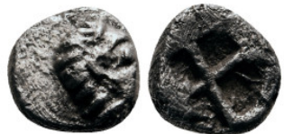
183 IONIA. Kolophon. Tetartemorion (6th century BC). Obv: Archaic head of Apollo right. Rev: Quadripartite incuse square. 0,12 g - 4,41 mm