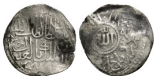
951 Islamic coin AR Silver. 3,97 g