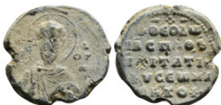
972 BYZANTINE LEAD SEAL 1,85 g - 23,00 mm