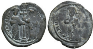
926 Byzantine Coin AE 8,79 g