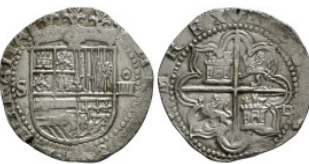
957 SPAIN. Philip II. 1556-1598. AR 4 Reales Seville mint. Crowned royal coat-of-arms; S and IIII with annulet above across field / Coat-of-arms of Spain within polylobe; quadrate D outside fourth quarter 13,64 g - 31,87 mm