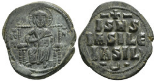
925 ANONYMOUS FOLLES. Class D. Time of Constantine IX (Circa 1042-1055). Follis. Constantinople. Obv: IC - XC. Christ, nimbate, seated facing on throne, holding Gospels. Rev: IS XS / BASILE / BASIL. Legend in three lines; +- above, -crescent-below. Very Fine Condition 10,13 g