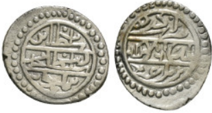
952 Islamic coin AR Silver. 1,13 g - 17,00 mm