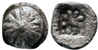
180 IONIA. Erythrai (?). Tetartemorion (Circa 480-450 BC). Obv: Rosette. Rev: Flower in circle within incuse square. 0,31 g - 6,64 mm