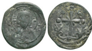
947 Byzantine Coin AE 5,06 g