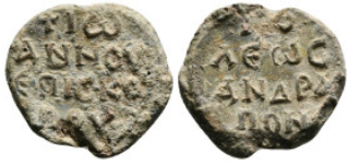
978 BYZANTINE LEAD SEAL 9,79 g - 25,24 mm