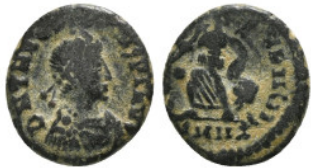
858 THEODOSIUS I (379-395). Ae 1,45 g