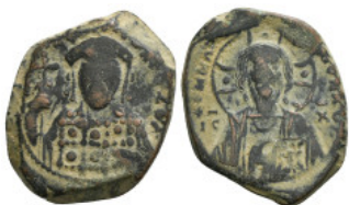
928 Byzantine Coin AE 12,60 g