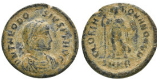
861 THEODOSIUS I (379-395). Ae 4,25 g