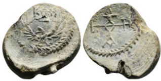
980 BYZANTINE LEAD SEAL 16,39 g - 28,95 mm