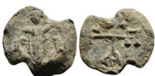
985 BYZANTINE LEAD SEAL 11,60 g - 24,80 mm