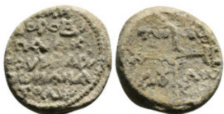
984 BYZANTINE LEAD SEAL 14,62 g - 23,63 mm