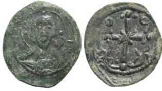
945 Byzantine Coin AE 3,42 g