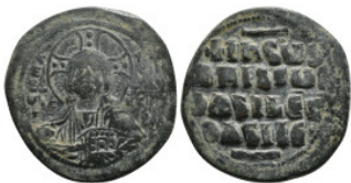
929 ANONYMOUS FOLLES. (976-1025). Follis. Constantinople. Obv: + EMMANOVHA / IC - XC. Facing bust of Christ Pantokrator. 18,32 g