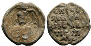
981 BYZANTINE LEAD SEAL 12,30 g - 24,99 mm