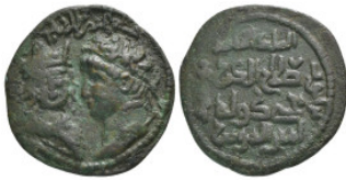
948 ISLAMIC. Anatolia & al-Jazira (Post-Seljuk). Artuqids (Mardin). Husam al-Din Yuluq Arslan (AH 580-597 / 1184-1200 AD). Ae Dirham. Obv: Small draped facing bust, wearing Sasanian-style crown; to right, large diademed, Roman-style male head left; legend above. Rev: Legend. 11,96 g - 30,90 mm