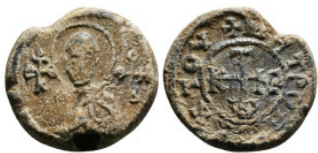
982 BYZANTINE LEAD SEAL 17,40 g - 24,93 mm