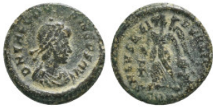
857 Roman Imperial Coin. Ae 1,50 g