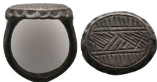
1046 Collectable Items - Ring 12.49 gr 25.10 mm