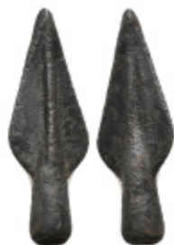
1050 ANTIQUES Bronze Arrowhead 3.03 GR 35.36 MM