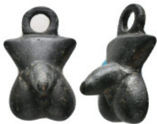
977 Collectable Items - Phallus pendant 15.02 GR 33.75 MM