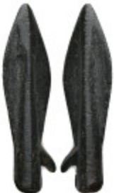
1062 ANTIQUES Bronze Arrowhead 5.76 GR 42.93 MM