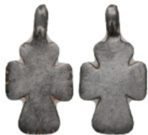
1094 Collectable Items - Cross pendant 1.30 gr 23.80 mm