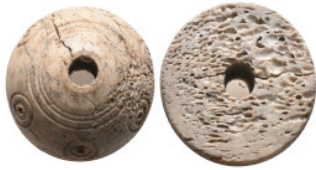
1006 Collectable Items - 16.70 GR 32.76 MM