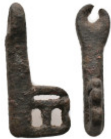
1010 Collectable Items - Key 7.09 GR 33.97 MM