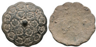
1005 Collectable Items - 27.45 gr 45.01 mm