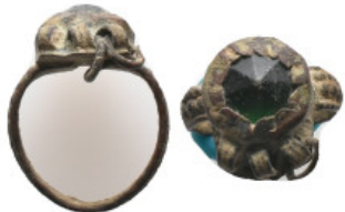
1030 Collectable Items - Ring 2.64 GR 21.15 MM