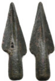
1057 ANTIQUES Bronze Arrowhead 4.80 GR 39.99 MM