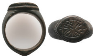
1045 Collectable Items - Ring 13.73 GR 28.25 MM