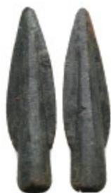
1052 ANTIQUES Bronze Arrowhead 4.12 GR 34.86 MM