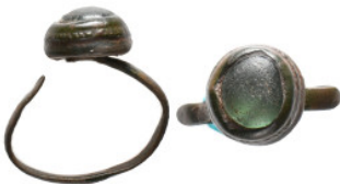
1032 Collectable Items - Ring 3.35 GR 23.45 MM