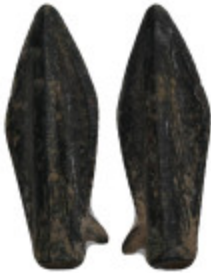
1060 ANTIQUES Bronze Arrowhead 5.25 gr 34.36 gr