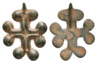
1095 Collectable Items - Cross pendant 3.35 GR 23.06 MM