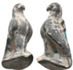
981 Collectable Items - Eagle Statue 10.92 gr 25.66 mm