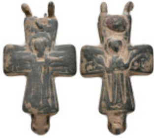
1091 Collectable Items - Cross pendant 19.87 GR 49.59 MM