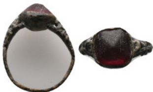
1031 Collectable Items - Ring 2.66 gr 25.13 mm