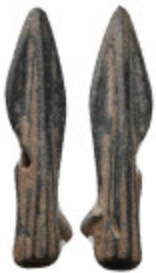
1056 ANTIQUES Bronze Arrowhead 4.77 gr 39.43 mm