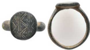
1044 Collectable Items - Ring 4.68 GR 22.34 MM