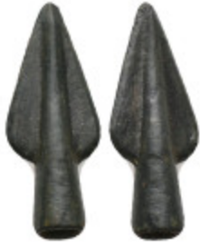
1053 ANTIQUES Bronze Arrowhead 4.20 GR 32.54 GR