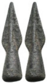
1055 ANTIQUES Bronze Arrowhead 4.54 GR 39.65 MM