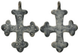
1092 Collectable Items - Cross pendant 9.13 GR 54.74 MM