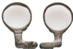
1049 Collectable Items - Key Ring 5.97 GR 29.34 MM