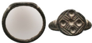
1029 Collectable Items - Ring 2.62 GR 18.96 MM