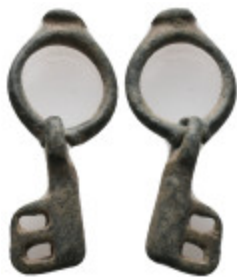
1048 Collectable Items - Key Ring 6.83 gr 40.65 mm