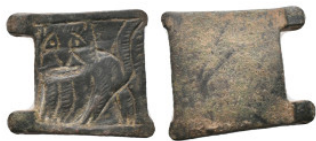
1009 Collectable Items - Belt Buckle 6.70 GR 22.95 MM