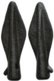
1061 ANTIQUES Bronze Arrowhead 5.55 GR 41.98 MM