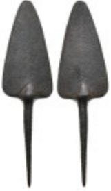
1059 ANTIQUES Bronze Arrowhead 5.14 GR 55.52 MM