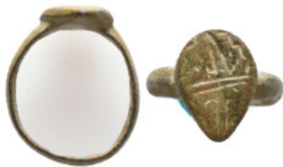
1043 Collectable Items - Ring 5.11 GR 24.33 MM