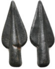
1058 ANTIQUES Bronze Arrowhead 5.10 GR 36.74 MM