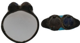
1033 Collectable Items - Ring 3.35 gr 24.25 mm