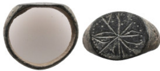
1042 Collectable Items - Ring 6.04 gr 21.58 mm