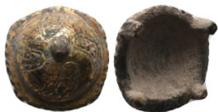
1011 Collectable Items - 14.62 gr 25.11 mm