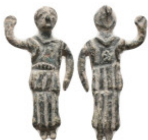
980 Collectable Items - Bronze Statue 11.82 gr 42.01 mm