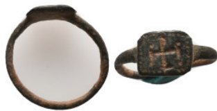
1093 Collectable Items - Cross engraved ring 3.09 GR 21.81 MM