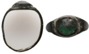
1027 Collectable Items - Ring 2.49 GR 22.67 MM