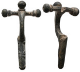
1000 Collectable Items - Fibula 14.80 gr 54.59 mm