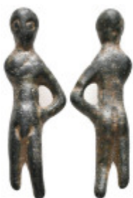
979 Collectable Items - Bronze Statue 20.00 gr 53.65 mm