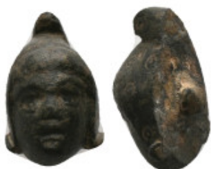
978 Collectable Items - Bronze applique 12.05 GR 21.89 MM