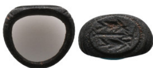
1047 Collectable Items - Ring 11.08 gr 22.22 mm