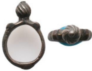
1041 Collectable Items - Ring 9.03 GR 35.46 MM