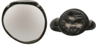
1028 Collectable Items - Ring 2.50 GR 19.53 MM