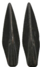
1051 ANTIQUES Bronze Arrowhead 3.54 GR 36.87 MM