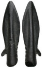
1054 ANTIQUES Bronze Arrowhead 4.31 GR 37.84 MM