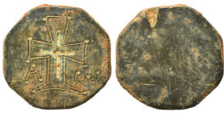
1031 Byzantine weight (bronze, 4.32 g, 19 mm). Repatinated, nearly very fine.