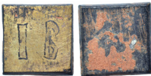
1032 Byzantine weight (bronze, 13.84 g, 18x18 mm). Very fine.