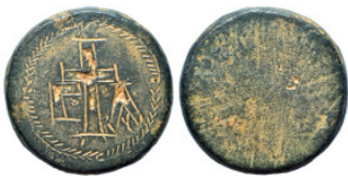
1030 Byzantine weight (bronze, 26.28 g, 25 mm). Repatinated, nearly very fine.