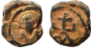
1026 Byzantine seal (lead, 3.18 g, 13 mm).