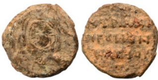
1028 Byzantine seal (lead, 5.51 g, 19 mm).