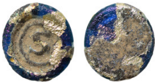
1029 Byzantine weight (glass, 0.88 g, 15 mm).