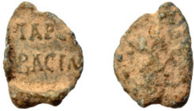
1027 Byzantine seal (lead, 1.96 g, 15 mm).