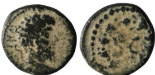
375 Marcus Aurelius. (161-180 AD). Æ Bronze. Syria. Antioch. Obv: laureate bust of Marcus Aurelius right. Rev: SC in laurel-wreath. artificial sandpatina. 17mm, 4,38g