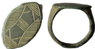
374 ancient bronze ring. 19mm, 2,79g