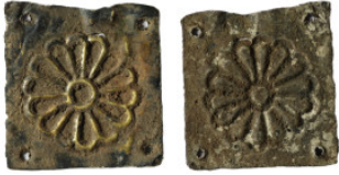
369 ornament. 16mm, 0,21g