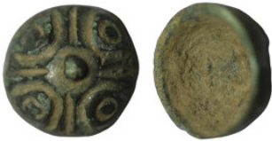
370 ancient bronze object. 21mm, 9,48g